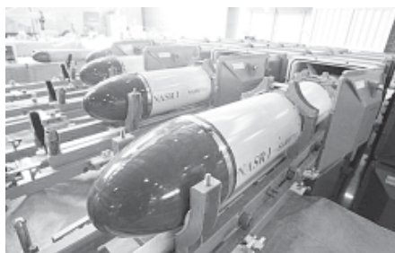
Nasr 1 (Victory) missiles are displayed during the inauguration ceremony of the 'Nasr 1 cruise missile' production facility at an undisclosed location in Iran 2010.