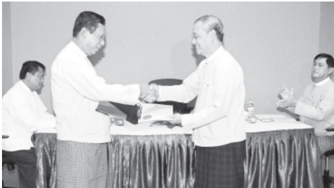
Governor of Central Bank of Myanmar U Than Nyein hands over money changer licenses to private banks.—MNA

YANGON, 29 Sept— For the convenience of tourists who visit Myanmar and Myanmar nationals who go abroad and with a view to conducting joint-venture of foreign currency market in Myanmar, elimination of illegal foreign currencies trading, and stabilization of currency exchange rate, Central