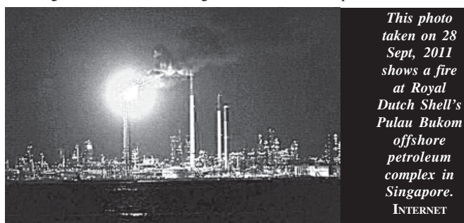
This photo taken on 28 Sept, 2011 shows a fire at Royal Dutch Shell's Pulau Bukom offshore petroleum complex in Singapore.

The plant, Shell's biggest in the world in terms of crude distillation capacity, produces fuels, lubricants and specialty chemicals, mostly for export.