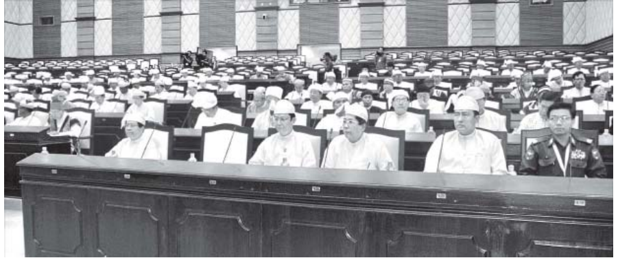
Amyotha Hluttaw representatives at the second regular session of first Amyotha Hluttaw.

The Union Minister added that the lessons of the past are to be taken while looking forward to the future; a wide range of private periodicals and newspapers were published when the country was adopting parliamentary