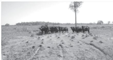
Up to seven million grass-cutting ants can live and farm fungus in one giant nest.—INTERNET