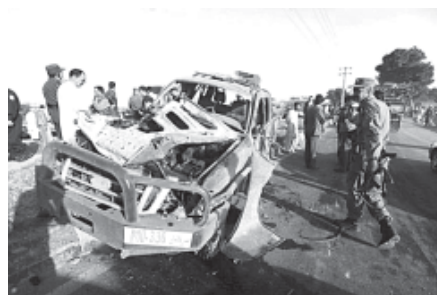
Members of the Afghanistan National police examine a damaged police car after a blast near the airport in Herat on 29 Sept, 2011.

ISAF, which is leading efforts to reverse the Taliban militancy, disputes the figures, calling them "inconsistent with the data that we have collected". Moham-