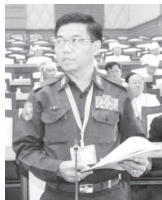
Deputy Minister for Home Affairs Brig-Gen Kyaw Zan Myint answers questions. MNA

natural gas power plants is less than that of hydropower plants, the latter type has to use gas as fuel for power generation and thus its production cost is much larger than hydropower plants; so hydropower plants are generally built in regions of feasible hydroelectricity generation.