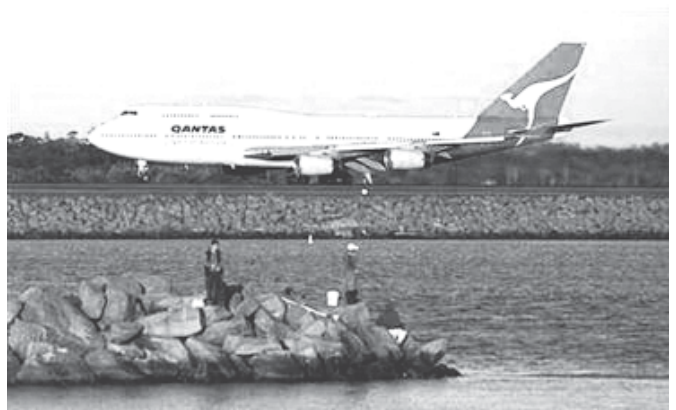
A Qantas plane takes off at Sydney's airport as people fish near the runway in Sydney on 24 August, 2011.