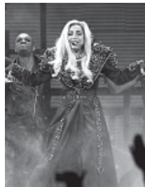
In this 24 Sept, 2011, file photo, Lady Gaga performs during the iHeartRadio music festival, in Las Vegas. On 27 Sept, 2011, MTV will announce the O Music Awards 2 , to take place 31 Oct. Lady Gaga is among the leading nominees, with two nominations.

Excite Worldwide LLC Chicago and Henderson, Nevada.