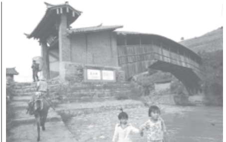
Photo taken on 26 Sept, 2011 shows the Tongjin Bridge in Yunlong County of Dali Bai Autonomous Prefecture, southwest China's Yunnan Province. The Tongjin Bridge, a wooden arch bridge of more than 200 years, is still used for transportation and tourism. Across the rivers of Dali Bai Autonomous Prefecture stand many bridges with antique flavour, attracting a lot of tourists.