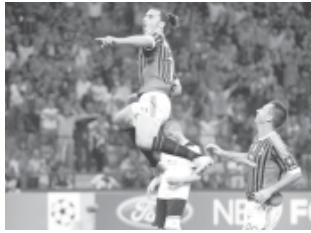
AC Milan's Swedish forward Zlatan Ibrahimovic celebrates after scoring a penalty shot against Viktoria Plzen at San Siro Stadium in Milan.

"Ibra had a good comeback, he played well and helped the team. He gives us a physical presence; he's technical, has important qualities and he's a point of reference," said Allegri. "I'm happy with how he played, given he hadn't played for a while." "Winning is never easy. Tonight we did it our way. They were organized and did well on the counter-attack, attacking with five men.—Internet