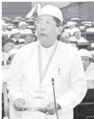
Union Minister for Education Dr Mya Aye answers questions.

Dr Aye Maung of Rakhine State Constituency No. 1 raised a question that expert group conducted survey of Laymyo hydropower project and Saiding hydropower project and whether there is a plan to publicize the survey if there is, when the project will start and complete and electricity consume if the project is on the run. If Laymyo and Saiding