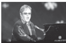
British singer Elton John performs at the Rock in Rio music festival in Rio de Janeiro, Brazil, on 23 Sept, 2011.

LAS VEGAS, 29 Sept—Elton John is returning to