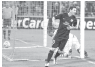
Argentine Lionel Messi of FC Barcelona celebrates a goal during the UEFA Champions League Group H football match against Bate Borisov in Minsk.

MADRID, 29 Sept—Lionel Messi moved into a tie for second place on Barcelona's career scoring list, getting