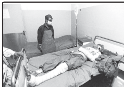
A wounded man receives treatment at a hospital after a landmine explosion in Shindand District of Herat Province, Afghanistan, on 27 Sept, 2011.