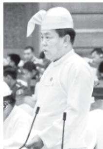
Pyithu Hluttaw Representative U Kin Sein of Thayetchaung Constituency raises questions.

U Tun Aung Kyaw of Ponnagyun Constituency said that as sandbanks form at the entrance of creek leading to Ponnagyun and vessels of the government cannot dock at Ponnagyun at ebb-tide, the local people face loss in trading. He asked whether there is a plan to dredge silts the mouth of creek at Kaladan River to Ponnagyun for better water way transport.