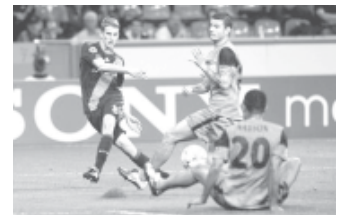
Leverkusen's midfielder Lars Bender scores during the UEFA Europe League Group E football match against KRC Genk in Leverkusen, Germany.