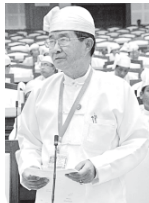
Union Rail Transportation Minister U Aung Min responding to queries.

As regard the proposal to adopt firm monetary policies for stability and development of national economy of the Republic of the Union of Myanmar to ensure foreign exchange rate under the law in conformity with the market submitted on 23 September by Daw Tin Nwe Oo of Dagon Myothit (North) Constituency, four Hluttaw representatives participated in the discussions. Of them, U Win Myint of Myingyan Constituency and U Maung Maung Soe of Thakayta Constituency said that officials concerned are still making efforts for monetary affairs at home and abroad, so the proposal should not be submitted, and it should be put on record. U Soe Win of Sangyoung Constituency and U Sai Kyaw Myint of Mongnai Constituency said that instability of exchange rate is not in line with the law, new era and market. Thus, a foreign exchange rate in conformity with the market and era should be fixed