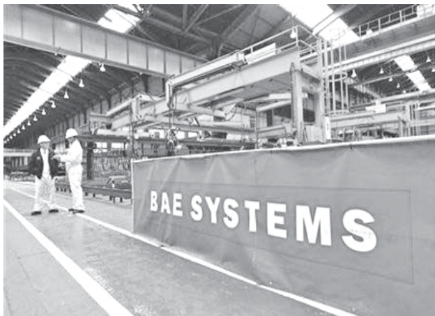
Workmen stand in the BAE Systems' Govan shipyard in Glasgow, Scotland on 26 May, 2011.

The Sunday Telegraph and Sky News said up to 3,000 workers could lose their jobs, all of them in Britain, as BAE prepares for a slowdown in orders to core markets — including the joint Eurofighter project.