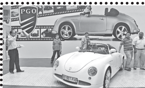
Visitors look at a PGO car during the 16 th AUTOMECH AKHBAR EL YOM, International African Arabian Exhibition for Vehicles, Buses, Motorcar Workshops, Service Station Equipment, Automobile Spare Parts, Accessories and Feeding Industries, at Cairo International Convention & Exhibition Centre in Cairo, capital of Egypt, on 24 Sept, 2011.

Authorities said the blackout affected 9 million of Chile's 16 million people.