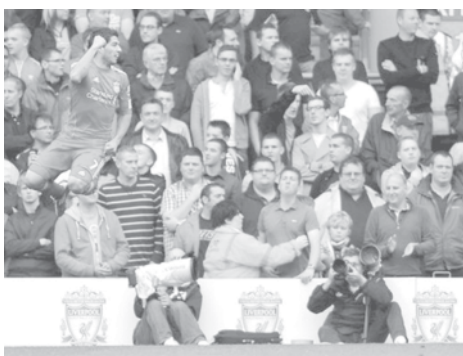
Liverpool's Uruguayan striker Luis Suarez (L) celebrates after scoring the second goal of the English Premier League football match against Wolverhampton Wanderers at Anfield in Liverpool.

"I have very fond memories of Shanghai so I will miss this amazing tournament and all my loyal Chinese fans, but I look forward to returning to China next fall," said Federer.