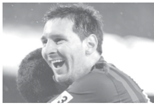
FC Barcelona's Lionel Messi, from Argentina

Messi scored on brilliant individual moves in the 26th and 78th minutes, and added a goal in second-half stoppage time, leading Barcelona over visiting Atletico Madrid 5-0. Messi also forced an own-goal by Miranda in the 15th, six minutes after David Villa had put Barcelona ahead. Messi has 12 goals in nine