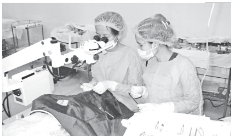
An eye patient undergoing surgery at Sitagu Shwe Pyi Hein Sakkudhana Hospital.