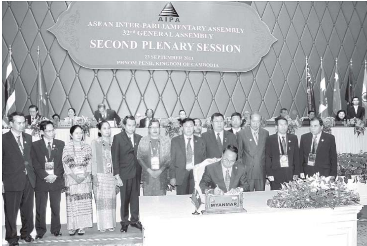
Speaker of Pyidaungsu Hluttaw U Khin Aung Myint signs cooperation report at second plenary session of 32 nd ASEAN Inter-Parliamentary Assembly.