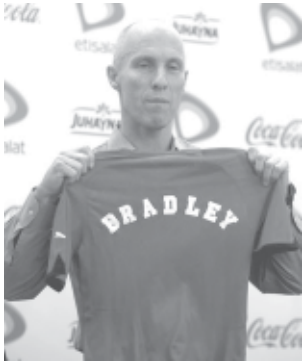
Former United States coach Bob Bradley

CAIRO, 25 Sept — Former United States coach Bob Bradley signed a contract to take over the Egypt national team on Saturday, charged with reviving the fortunes of a team that recently failed to qualify for the African Cup of Nations. The 53-year-old Bradley agreed a deal worth $37,000 a month until after the 2014 World Cup in Brazil. "I'm proud to take over as coach of Egypt," Bradley said at a news conference. "I'm looking forward to deal-