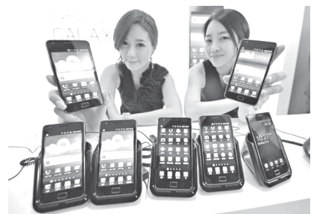
South Korea's Samsung Electronics, the world's second-largest mobile phone maker after Nokia, said it had sold 10 million Galaxy S II smartphones worldwide since the device debuted in April.

The new device was released locally on April 29 and in some European countries in May. It also went on sale in China in July before hitting the US market in September.