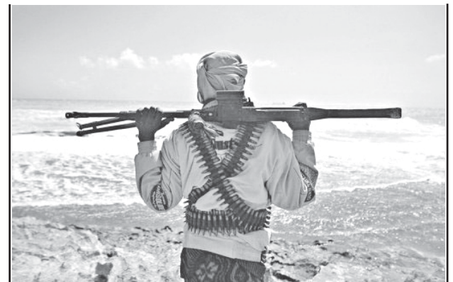
An armed pirate keeping vigil in Somalia. Pirates have released a Cyprus-flagged tanker seized off the West African country of Benin 10 days ago with a 23-strong crew, including five Spaniards, according to Spain's foreign ministry.—INTERNET

In such attacks pirates generally steal fuel or oil being hauled by tankers with the aim of selling it on the region's lucrative black market.—Internet