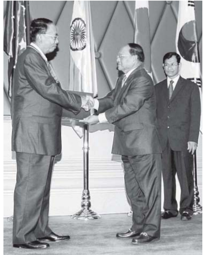
President of AIPA and President of Cambodia National Assembly Mr Samdech Akka Moha Ponhea Chakrei Heng Samrin presents commemorative medal to Speaker of Pyidaungsu Hluttaw U Khin Aung Myint.