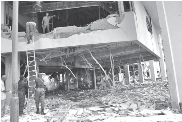
Police and rescue workers stand in the debris of the UN building after last month’s blast in Abuja. Nigerian customs officials have seized an illegal shipment of explosives —with the country already buckling under a wave of bomb attacks blamed on militants.