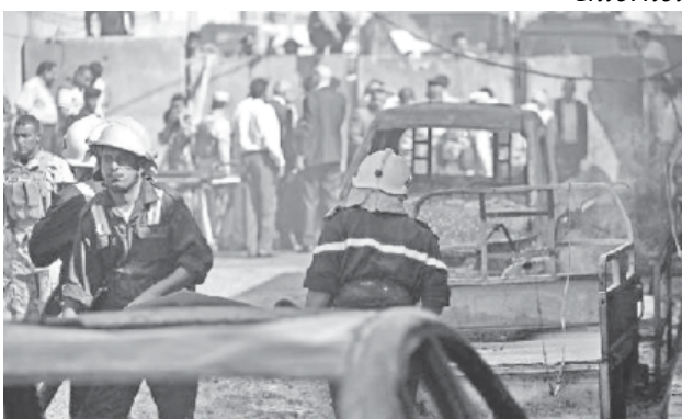
Firefighters inspected the explosion site in Iraqi City Karbala on 25 Sept, 2011.—XINHUA

Many Iraqi soldiers and policemen were among the victims, the source said, adding that some of the wounded people left the hospitals after they received treatment. Iraqi security forces sealed off the scene and blocked all the roads leading to the heavily populated area in central the City which also includes Karbala’s provincial council and the provincial police headquarters, the source said.— Xinhua