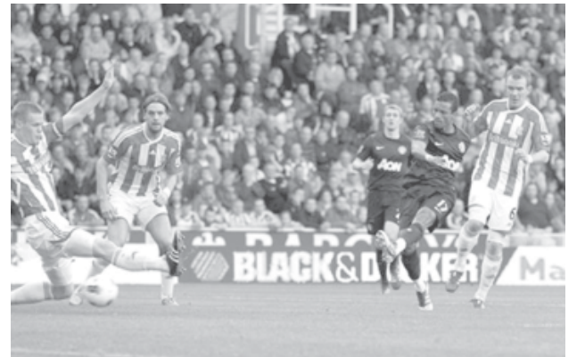
Manchester United's Nani, second right, scores against Stoke City during their English Premier League soccer match at the Britannia Stadium, Stoke, England.

City defeated visiting Everton 2-0, getting second-half goals from substitutes Mario Balotelli and James Milner against American goalkeeper Tim Howard. Chelsea (4-1-1) is three points back after beating visiting Swansea 4-1. Demba Ba had a hat trick for fourth-place Newcastle (3-0-3) in a 3-1 home win over Blackburn, while Liverpool (3-2-1)