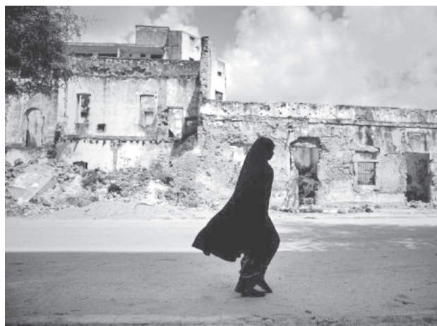
A Somali woman walks past ruined buildings in Mogadishu. At least one person was killed by a powerful explosion at the offices of the United Nations Mine Action Service in Somalia’s capital Mogadishu.