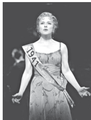
Bernadette Peters is shown in a scene from the Broadway production "Follies," in New York.