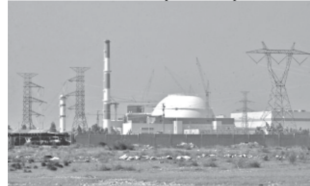
In this 27 Feb, 2005 file photo, the reactor building of Iran's nuclear power plant is seen, at Bushehr, Iran, 750 miles (1,245 kilometers) south of the capital Teheran.

to Iran's nuclear programmes. The Stuxnet computer worm that infected computers worldwide zeroed in on a single target in Iran, devices that can make weaponsusable uranium.