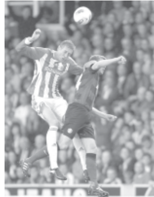
Stoke City's striker Peter Crouch (L) vies with Manchester United's Scottish midfielder Darren Fletcher (R)

LONDON, 25 Sept — Peter Crouch scored on a header in the 57th minute, giving Stoke a 1-1 tie with visiting Manchester United on Saturday and ending the Red Devils' perfect start to the Premier League season. Nani scored in the 27th minute for Man U, which was