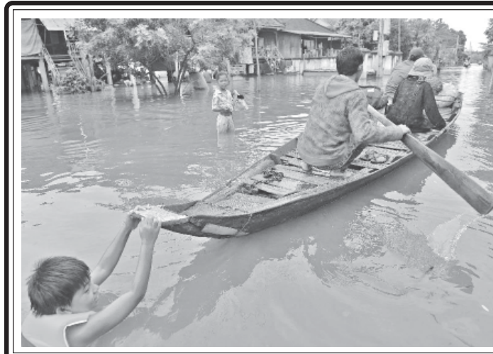
Cambodians travel on a boat over floodwaters at Kian Svay district in Kandal province, 20 kilometers east of Phnom Penh on 24 September, 2011.