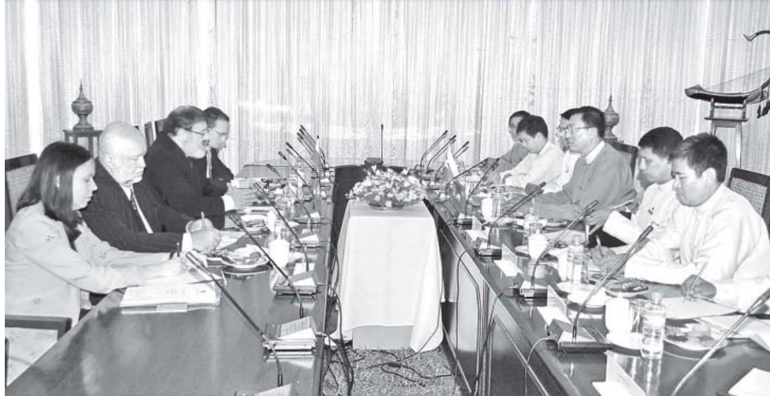
Myanmar-Poland meeting in progress.