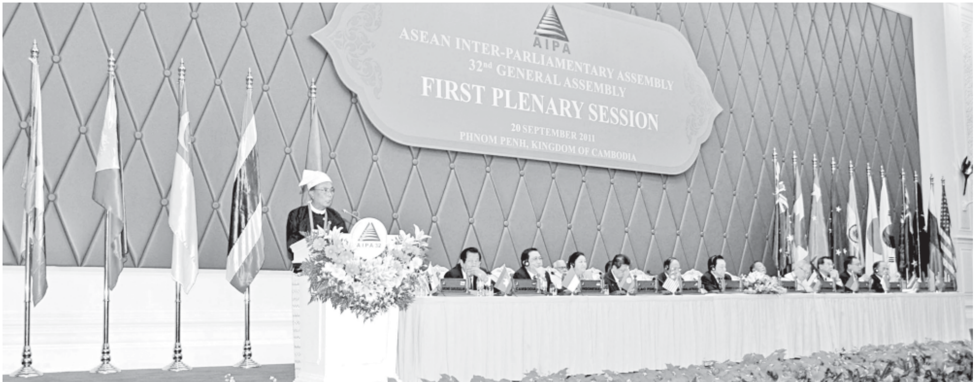
Pyidaungsu Hluttaw Speaker U Khin Aung Myint delivers an address at 32 nd ASEAN Inter-Parliamentary Assembly.—MNA

NAY PYI TAW, 25 Sept — Pyidaungsu Hluttaw Speaker of the Republic of the Union of Myanmar U Khin Aung Myint attended the 32 nd ASEAN Inter-Parliamentary Assembly (AIPA) and delivered an address at the ceremony to accept the Republic of the Union of Myanmar as a full-fledged member of AIPA at Nuon Srei meeting hall on the third floor of Peace Palace in Phnom Penh of Cambodia at 9.30 am on 20 September.