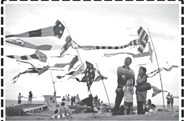
People view kites flying in the sky during a kite festival with the theme of "Dance of Wind" held at Baisha Bay of Xinbei City, southeast China's Taiwan, on 24 Sept, 2011.

The newspaper published another article that read like an obituary, with vignettes about matadors who made their names in Catalonia and others who died in the ring, including four in Barcelona's La Monumental.— Internet