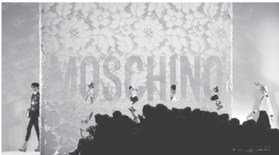
Models present creations of the Italian fashion house Moschino during the Milan Fashion Week Women's Wear Spring/Summer 2012 in Milan, northern Italy, on 23 Sept, 2011.