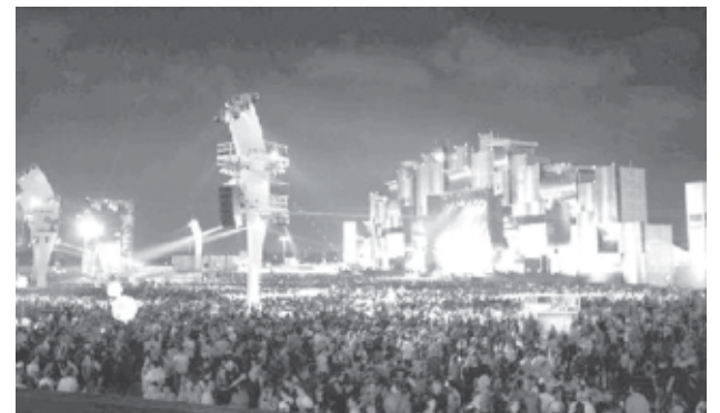
People attend the Rock in Rio music festival in Rio de Janeiro, Brazil, on 23 Sept, 2011. Rock in Rio, initiated in 1985, is one of the world's biggest music festivals. This year's event will be held from 23 Sept to 2 Oct.