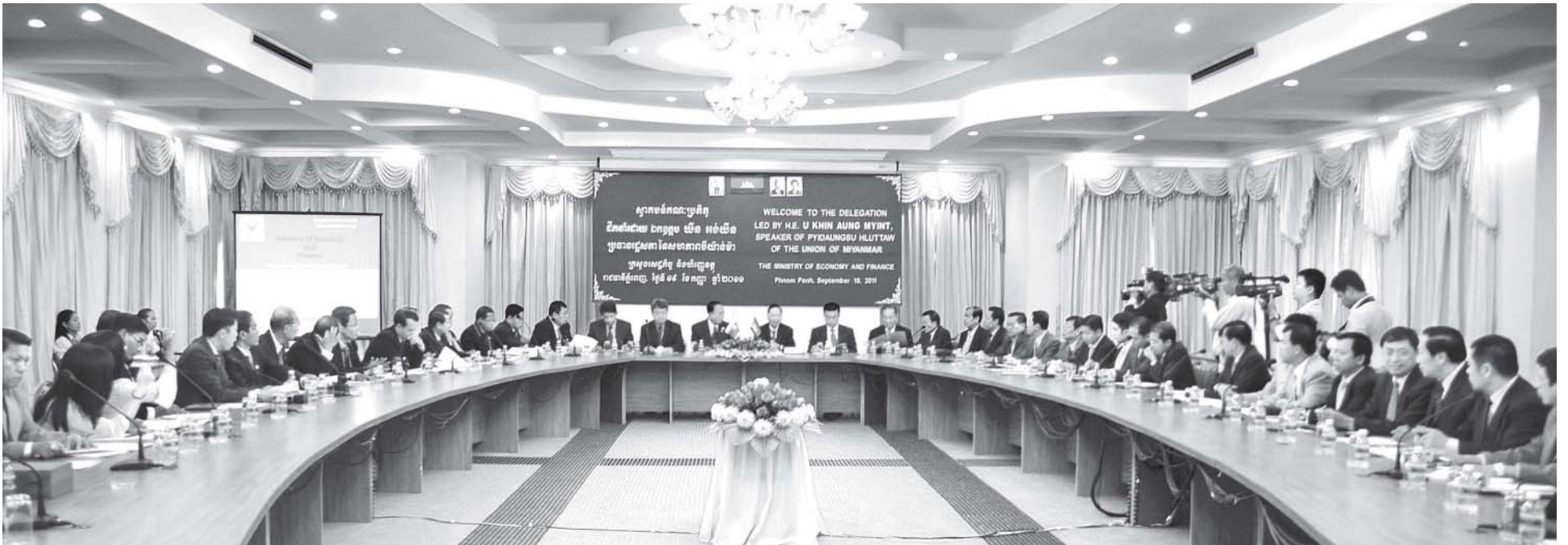
Pyidaungsu Hluttaw Speaker U Khin Aung Myint meets with Cambodian Deputy Prime Minister and Minister of Economy and Finance Mr Keat Chhon.

NAY PYI TAW, 25 Sept—During his visit to Cambodia, Speaker of Pyidaungsu Hluttaw of the Republic of the Union of Myanmar U Khin Aung Myint — accompanied by Hluttaw representatives, Myanmar Ambassador to Cambodia U Cho Tun Aung and officials of Hluttaw Office — met Vice Governor of National Bank of Cambodia Ms Neav Chan Thana, Deputy Prime Minister and Minister of Economy and Finance of Cambodia Mr Keat Chhon, Minister of Commerce of Cambodia Mr. Chom Prasith on 19 September, and Minister of Culture and Fine Arts of Cambodia Mr Him Chhem on 21 September evening.