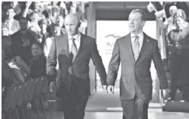
Russia's President Dmitry Medvedev (R front) and Prime Minister Vladimir Putin (L front) attend the United Russia congress in Moscow on 24 September, 2011.

He hoped Russian citizens could trust the strategy and efficiency of the administration model set by him and Putin.—Xinhua