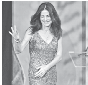
Actress Kim Delaney.