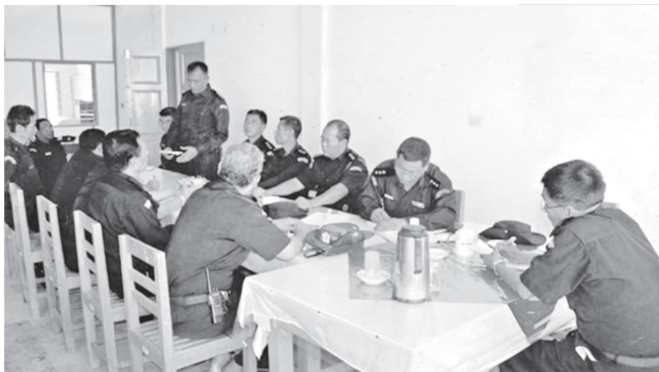
A meeting between Mandalay Region Fire Services Department and Mandalay Zone Auxiliary Fire Brigade Supervisory Committee on fire preventive measures and conditions of fire fighters in progress at Region FSD on 12 September.—NLM