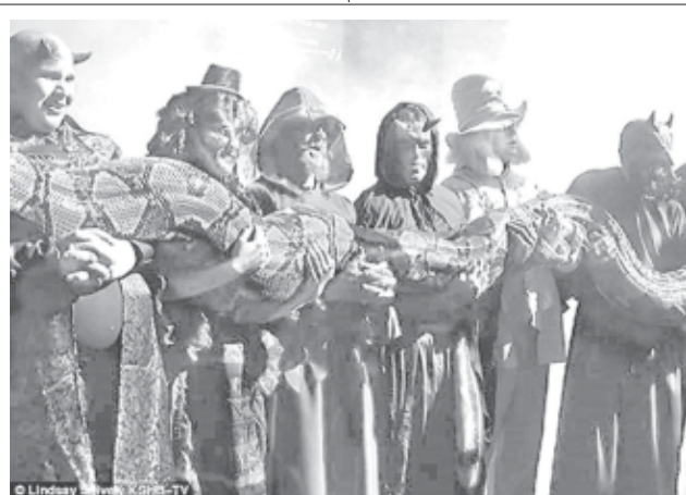
Medusa, seen here cosying up to her new colleagues, will be on display at the Edge of Hell, a haunted house attraction in Kansas City.

the time of the crash. Magistrates and victims' relatives have long suspected that the DC-9 was caught in a dogfight between NATO planes and a Libyan jet, the wreckage of which was found months after the Ustica crash.—Internet