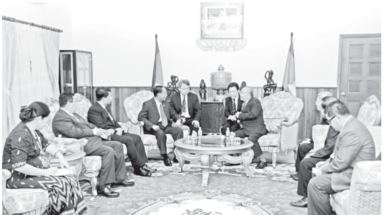
Pyidaungsu Hluttaw Speaker U Khin Aung Myint meets with Cambodian Minister of Culture and Fine Arts Mr Him Chhem.—MNA