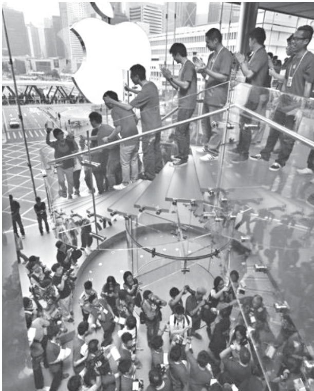
Customers cheer with staff members of Apple Inc at the new store in Hong Kong's upscale International Financial Centre Mall on 24 Sept, 2011.