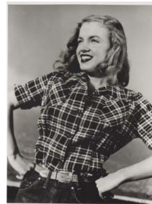
A photo of Norma Jean Dougherty, who eventually changed her name to Marilyn Monroe, is shown.