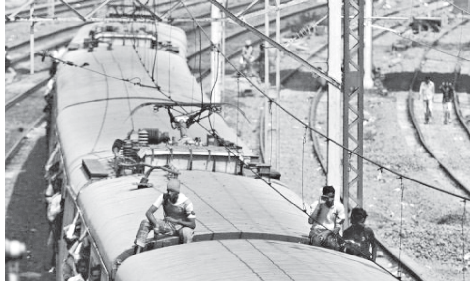
Indian commuters travel on the roof of a train in Mumbai. Five young men travelling on top of a train in western India were killed on Sunday when they slammed into a bridge.