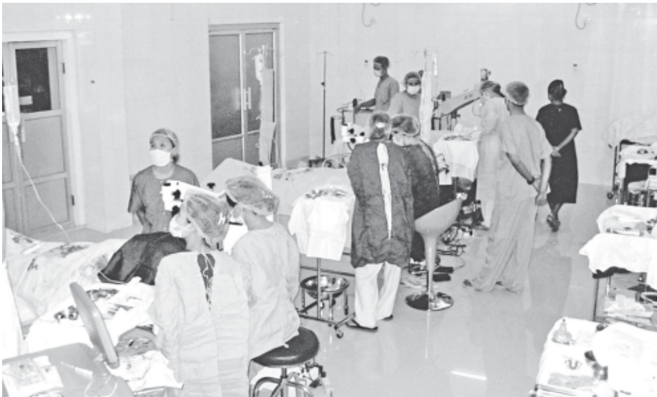
Three eye patients having surgery at Sitagu Shwe Pyi Hein Sakkudhana Hospital.