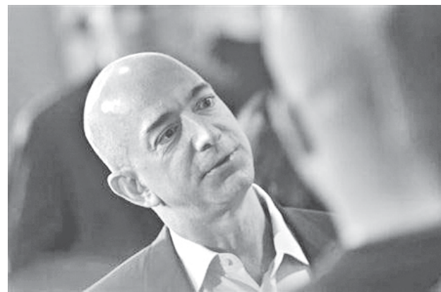
Amazon.com President, Chief Executive and Chairman Jeffrey Bezos speaks with employers and attendees at the Consumer Reports headquarters in Yonkers, New York, on 11 May, 2011.

In much the same way Amazon’s Kindle e-reader was priced low to quickly get traction among readers the company is likely to keep the price of its