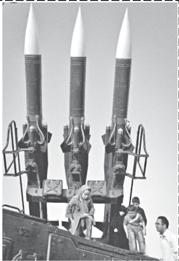
Iranian children play on surface-to-air missiles during a war exhibition to mark the Week of Defence, which is held to commemorate Iranian sacrifices during the eight-year Iraq-Iran war in the 1980s, in Teheran, Iran, on 24 Sept, 2011.