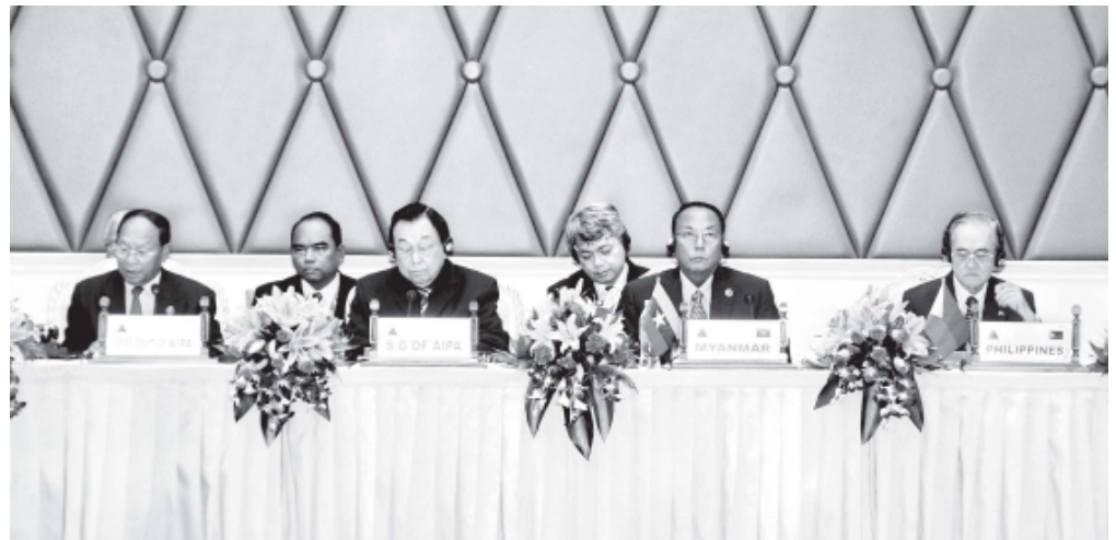
Speaker of Pyidaungsu Hluttaw U Khin Aung Myint attends second plenary session of 32 nd ASEAN Inter-Parliamentary Assembly.

functions to Speaker of the Parliament of the Republic of Indonesia Mr Dr Marzuki Alie who will host the 33 rd AIPA. Next, the date and venue for the 33 rd AIPA was de-