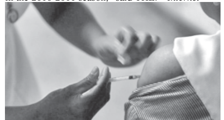
A nurse injects a patient with a vaccine against the H1N1 or swine flu influenza. Researchers in Finland have confirmed a link between the swine flu vaccine and the onset of the sleep disorder narcolepsy in children.—INTERNET

THL said that it agrees with the position of the European Medicines Agency that despite the "extremely unfortunate" cases of narcolepsy, the vaccine did more good than harm. "Based on the data, we estimate that the swine flu vaccine prevented 40,000 infections in the 2009-2010 season and a further 40,000 infections in the 2010-2011 season," said THL.—Internet