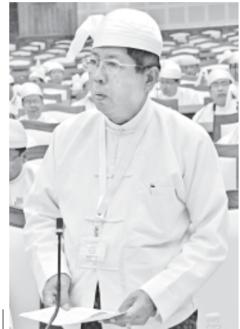
Union Minister for Education Dr Mya Aye answers question.