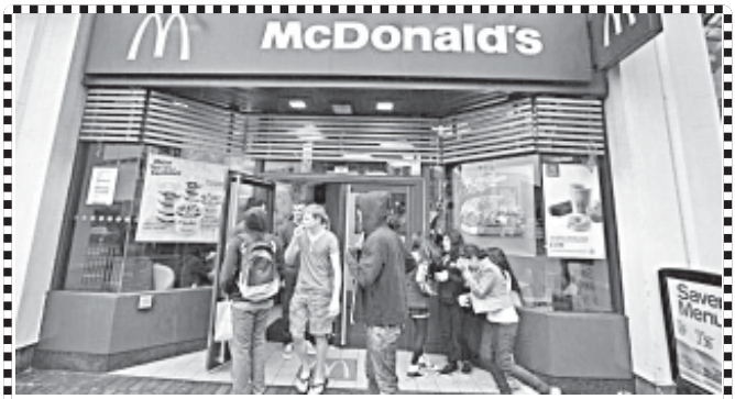
Youths gather outside a McDonald's restaurant in London, on 4 Sept, 2011. About 1,200 McDonald's restaurants in Britain will begin displaying the calorie count of each food and drink item on their wall-mounted menu boards this week, as part of a government-led programme to fight obesity and promote healthier eating, the chain said Sunday.