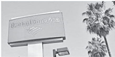
A sign for a Bank of America office is pictured in Burbank, California on 19 August, 2011.