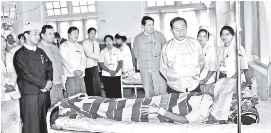
Vice-President Thiha Thura U Tin Aung Myint Oo comforts patients at Hopong Township People's Hospital.

The Vice-President and party viewed research works on the greening of the 20-mile parameter of the Inlay Lake, theses and research papers exhibited at the research booth of the Taunggyi University.