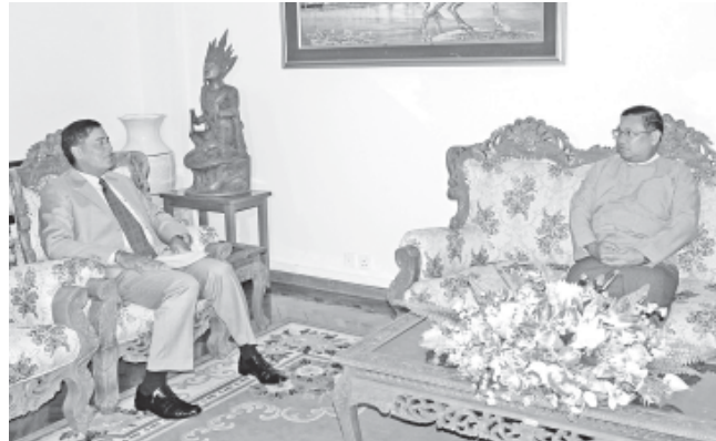
NAY PYI TAW, 6 Sept—U Wunna Maung Lwin, Union Minister for Foreign Affairs of the Republic of the Union of Myanmar received Mr Bhairaja Panday, Representative of the

Union Minister for Foreign Affairs U Wunna Maung Lwin receives Representative of the United Nations High Commissioner for Refugees (UNHCR) to Myanmar Mr Bhairaja Panday. MNA