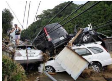
Vehicles are piled on top of one another on muddy ground after Typhoon Talas caused flash flooding in the town of Nachikatsuura, Wakayama prefecture, in western Japan on 5 Sept.

TOKYO, 6 Sept—Thousands of people remained stranded in western Japan on Tuesday as the death toll from a fierce typhoon rose to 42, heaping more misery on a nation recovering from the March earthquake and tsunami.