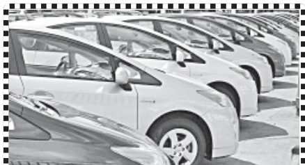
Toyota Prius hybrid model cars are seen at a dealer in Hollywood, California. Toyota Motor will manufacture the Prius hybrid and its key parts in China in a bid to boost sales in the world's largest car market, a company spokeswoman has said.