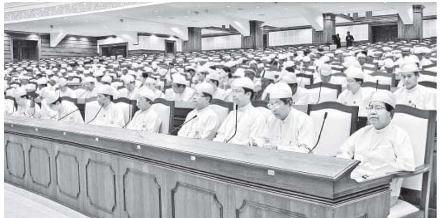
Hluttaw representatives at 12 th -day second regular session of first Pyithu Hluttaw.