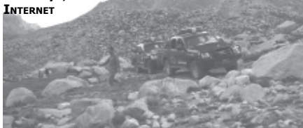
Afghan police vehicles are seen parked near to the area where the bodies of two Germans were found in Salang, north of Kabul, Afghanistan on Monday, on 5 Sept, 2011.

According to the media outlet, the two German nationals, who had disappeared on 19 August in the Salang District, about 100 kilometres (62 miles) north of Kabul, were kidnapped by a group of unidentified men, and locals near the mountains of the Gararai Qaichi area of Salang District later discovered the bodies.— Internet