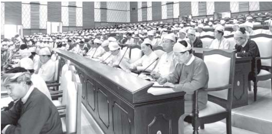
Hluttaw representatives at 12 th day second regular session of first Amyotha Hluttaw.

NAY PYI TAW, 6 Sept — The second regular session of the first Amyotha Hluttaw continued for the 12 th day at Amyotha Hluttaw Hall of the Hluttaw Building here this morning, attended by Speaker of Amyotha Hluttaw U Khin Aung Myint and 210 Amyotha Hluttaw representatives.