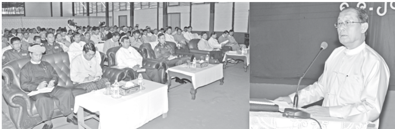
Vice-President of the Republic of the Union of Myanmar Thiha Thura U Tin Aung Myint Oo speaking to leading body of Pa-O self-administered zone, departmental personnel, members of social organizations, townsenders, ward/village administrators at Hopong Town Hall.

Vice-President Thiha Thura U Tin Aung Myint Oo meets Leading Body of Pa-O Self-Administered Zone, officials, local people in Hopong