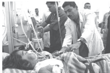
Doctor treats a girl who was wounded in a suicide car bomb attack in Baghdad recently.—INTERNET

Five civilians were killed on Monday when their vehicle ran over a roadside bomb in Qaisar district of northern Faryab Province.— Internet