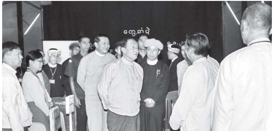
Vice-President Thiha Thura U Tin Aung Myint Oo greets members of leading body of Pa-O Self-administered Zone and departmental personnel.

After the meeting, the Vice-President and his entourage visited Hopong Township People's Hospital and gave instructions on construction of