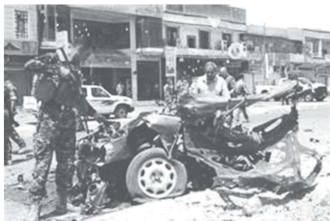
Iraqi security forces inspect the scene of a car bomb in Baghdad recently.