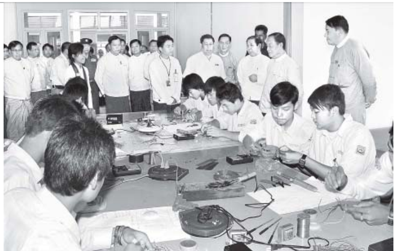
Vice-President Thiha Thura U Tin Aung Myint Oo views students doing practical lessons at Government Technical Training School (Pinpat).

At the meeting with faculty members from universities in Taunggyi, the Vice-President expressed his delight for the number of students at the Taunggyi University and at other universities in Taunggyi has increased year after year, promising