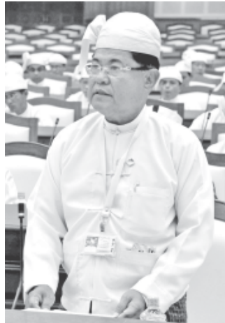
Union Minister for Industry-1 U Soe Thein answers question.

If not only the State but also Hluttaw representatives and people will participate in restoring peace, the peace all the people aspire can be