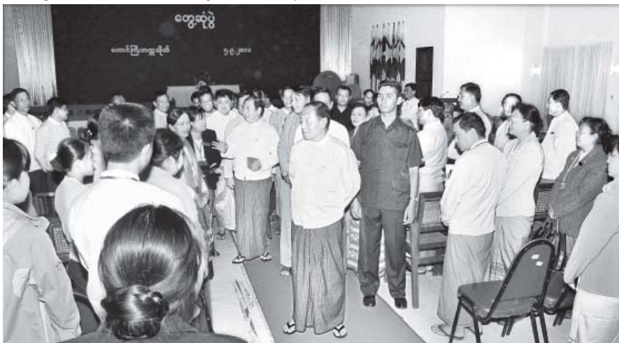
Vice-President Thiha Thura U Tin Aung Myint Oo greets lecturers of universities at Taunggyi University.