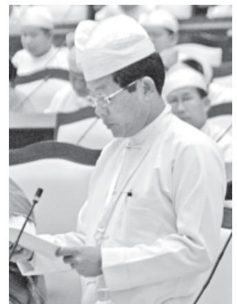
Amyotha Hluttaw representative U Paw Hlyan of Chin State Constituency No. 9 holds discussion.

the road section from Kalewa to Yagyi village for convenience of running of small and large cars in rainy season. Although Myittha bridge (Kalewa) on Kalay-Kalewa-Yagyi-Monywaroad built by the State can be used at any time in summer and winter season, a road section from Kalewa to Yagyi village cannot be used in rainy season as it is a latrite one. The 115-mile and five-furlong Monywa-Yagyi-Kalewa road located in Sagaing Region links Kani, Minkin and Kalewa Townships. Up to 31 May 2011, 73 miles and two furlongs is tarred road, 16 mile and four furlong is gravel road, 22 miles and three furlongs is hard road and three miles and four furlongs is earth road, the Union Minister said.