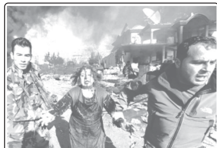
A victim is taken away from the site of a suicide car bomb attack in Kabul on 5 Sept, 2011.

HERAT, 6 Sept — A suicide attack hits Herat Province, 640 km west of capital City Kabul on Tuesday, leaving the attacker dead and injured two civilians, an official said.