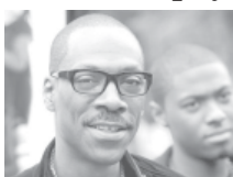
Cast member Eddie Murphy attends the premiere of the film "Imagine That" in Los Angeles on 6 June, 2009.

BEIJING, 6 Sept — Renowned US Actor Eddie Murphy is now the front-runner to host the 84th Academy Awards in 2012, according to media reports on Tuesday. Eddie Murphy is said to be favored by Brett Ratner, a producer of the awards broadcast who just finished directing Murphy in the soon-to-be-released thriller "Tower Heist," according to Hollywood Reporter. Brett Ratner is expected to meet with Academy president Tom Sherak after the Labour Day holiday to discuss potential hosts, the magazine said. Murphy has never acted as Oscars host before. Watchers say his onstage reputation for unpredictability, as well as high-profile public scandal has most likely made Oscars organizers reluctant in the past.—Internet