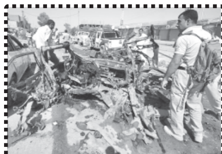
Iraqi security forces inspect the site of a suicide car bomber plowed his vehicle into a checkpoint outside a police building just outside the holy city of Najaf, Iraq, on 15 Aug, 2011.—INTERNET

my years in Parliament, as a Cabinet minister and in offer a useful perspective. I aim to forge a constructive the prime minister and his ministers during my term of the Government of Singapore Investment Corporation (GIC) and chairman of Singapore Press Holdings.—MNA/Xinhua