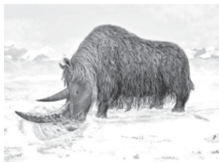
This artist’s rendering shows a woolly rhino using its flattened horn to sweep snow away in order to find vegetation for food. A 3.6-million-year-old woolly rhinoceros fossil discovered in Tibet indicates that some giant mammoths, sloths and saber-tooth cats may have evolved in highlands before the Ice Age, experts say.

began 54 years ago, area just above Earth’s boosters and other parts ches, as well as old