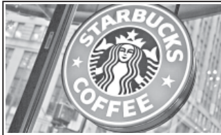
In this 20 Dec, 2010 photo, a sign in a Starbucks is displayed in New York's Times Square. Starbucks Corp. said Tuesday, on 30 Aug, 2011, that it will have packages of its Keurig coffeepods available at US grocery stores and specialty retailers beginning in November.

The vegetarian diet is a healthy lifestyle followed by more than 4 million Americans. Compared to the general population, the typical vegetarian diet is lower in cholesterol and total and saturated fats, which helps reduce the risk of type 2 diabetes and coronary artery disease. Sound promising? Let WebMD point you toward some of the most nutritious and satisfying vegetarian foods.