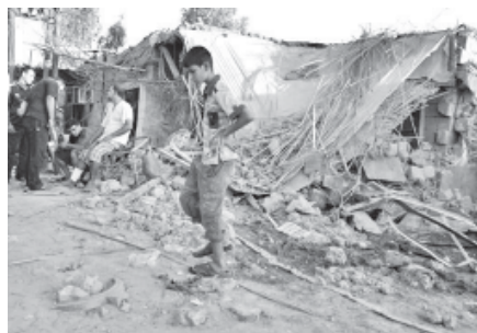
People inspect the scene of a suicide bomber in Basra, Iraq's second-largest city, 340 miles (550 kilometres) southeast of Baghdad, Iraq, on 26 Aug, 2011. A suicide bomber blew up his vehicle near a Shiite mosque late Thursday night, killing and wounding scores of people, officials said.

ISLAMABAD, 2 Sept—Fourty Pakistani children, who accidentally entered Afghanistan while celebrating Eid, were kidnapped by militants, a media report said Friday. Afghan militants kidnapped the 40 children who crossed the border into Afghanistan's Kunar Province from Bajaur Agency, Geo News reported. Sources said these children were celebrating Eid when they crossed the border by mistake. The media report said that the children have been moved to an unknown location.—Internet