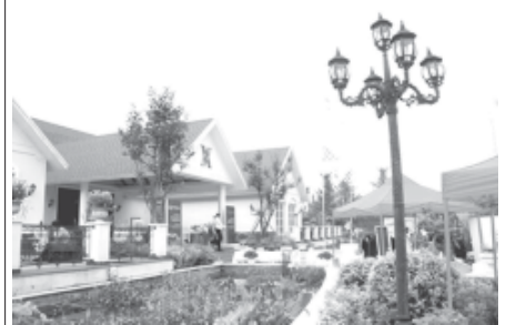
The first German Fresh Beer Garden Festival was held at Villa Castanea, a holiday resort at the foot of Fragrant Hills in Beijing.—INTERNET