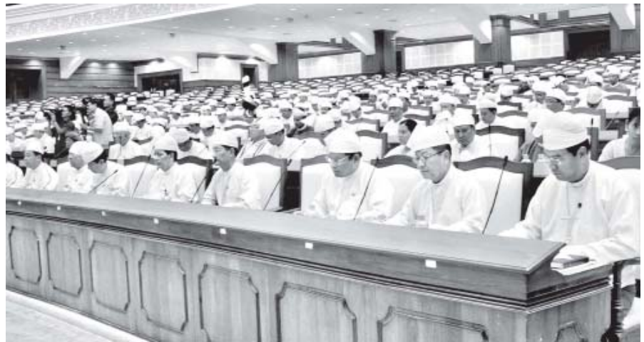
Pyithu Hluttaw representatives attending 10 th day second regular session of first Pyithu Hluttaw.

the Home Affairs Department amended the age of retirement at 60 instead of 55 beginning 11 March 1969 according to the letter No. 314/6/A(1) dated 22 March 1969. Up to now, all are abiding by the rules. In studying the age of superannuation pension for the (See page 6)