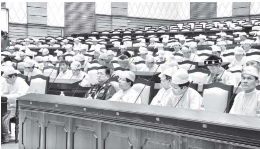
Amyotha Hluttaw representatives attending 10 th day second regular session of first Amyotha Hluttaw.

NAY PYI TAW, 2 Sept—The second regular session of the first Amyotha Hluttaw continued for tenth day at Amyotha Hluttaw Hall of Hluttaw Building here at 10 am this morning.