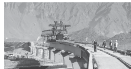
Photo taken on 1 Sept, 2011 shows a construction site of the Lhasa-Xigaze Railway in southwest China's Tibet Autonomous Region. The 253-kilometre Lhasa-Xigaze Railway, to come on line in 2014, is expected to improve transportation situation for the southwestern part of Tibet.

If the system develops into a storm, it would be named Lee.—Reuters