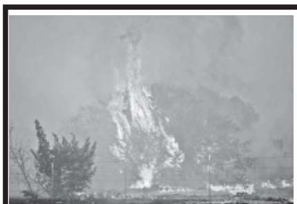
A wildfire roars through dry trees near Graford, Texas, on 1 Sept, 2011.