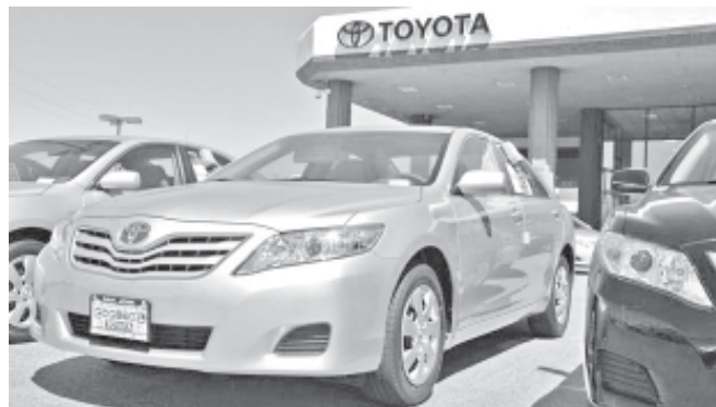
In this 30 Aug, 2011 photo, Toyota Camry's are parked at a car dealership in San Jose, Calif. Toyota Division passenger cars recorded sales of 63,250 units, a decrease of 15.8 percent from last August. The Camry and Camry Hybrid led passenger cars with combined monthly sales of 30,185 units.

Toyota says its supply situation continues to improve and North American production is expected to return to 100 percent this month.— Internet