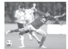
Mikel Arteta is looking forward to testing himself in the Champions League with Arsenal following his £10million deadline day move from Everton.

"I haven't got much time left to take a chance like this one." Arteta, who spent six-and-a-half years at Goodison Park, added: "I always try hard, I have been as professional as I could.— Internet