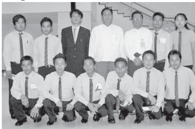
Eleven trainees of Myanmar Rice and Paddy Producers Group seen at Yangon International Airport before departure for Israel.

YANGON, 2 Sept—With the supervision of Myanmar Rice and