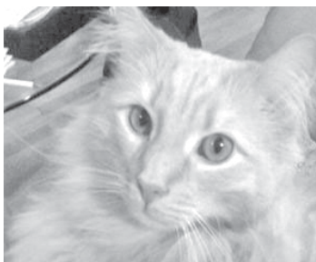
Jack the cat

American Airlines said it is searching for a cat lost at a New York Airport while employees were scrambling to prepare for Hurricane Irene.