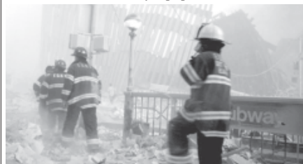
Firemen arrive on the scene after the collapse of the first World Trade Center Tower in New York on 11 September, 2001.—INTERNET

One study showed that New York City firefighters who rushed to the doomed Twin Towers a decade ago are 19 percent more likely to have cancer than their non-exposed colleagues and a comparable section of the city's population.— Internet