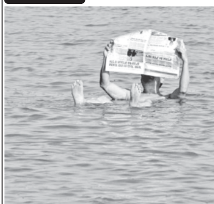
A Singaporean tourist floats in the Dead Sea in 2008. Floating in the Dead Sea for just 20 minutes may help diabetics lower blood sugar levels, according to a study by Israeli researchers highlighted in the Haaretz newspaper.