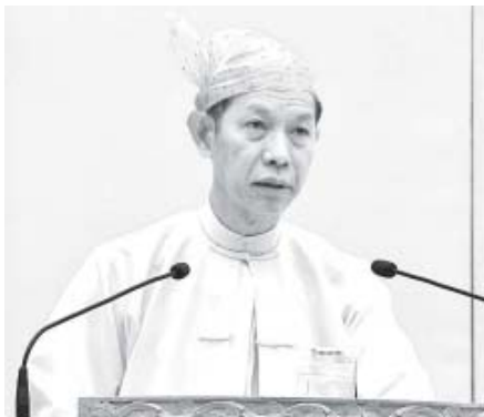
Deputy Speaker U Nanda Kyaw Swa of Pyithu Hluttaw makes clarification.—MNA