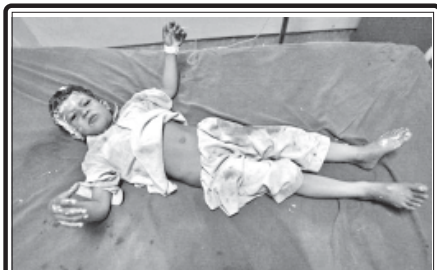
A boy injured by a suicide bomb attack at a mosque awaits treatment at Khyber Teaching Hospital in Peshawar on 19 Aug, 2011. A suspected suicide bomber killed at least 34 people in a mosque during Friday prayers in Pakistan's northwestern tribal region of Khyber on the Afghan border, a top government official said.

president-elect Tony Tan Keng Yam was sworn in for a term of six years as the seventh president of the republic on Thursday.