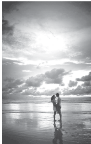
Photo taken by Brazilian Photographer Isac Goulart shows the breathtaking sunset view on beach.—XINHUA