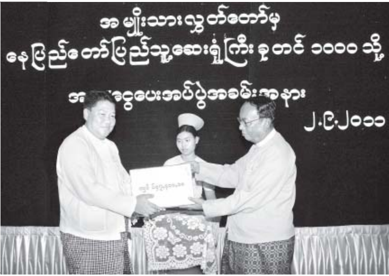
Speaker of Amyohta Hluttaw U Khin Aung Myint presents cash donated for Nay Pyi Taw People's Hospital to Union Minister for Health Dr Pe Thet Khin.