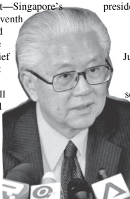
Tony Tan Keng Yam