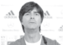
Germany coach Joachim Loew

"Toni (Kroos) has really impressed me with his enthusiasm and his commitment in recent Bundesliga games."— Internet