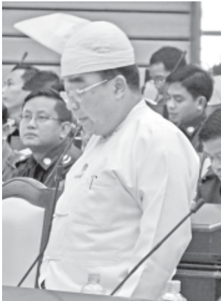
Amyotha Hluttaw Representative U San Tun of Kachin State Constituency (1) raising question.

and corruption; offence and penalties for obtaining any gratification whatever, other than legal remuneration, to do an official act are prescribed in Section 161 of 1861 Penal Code, those for obtaining any gratification for inducing any public servant to do any official act in Section 162, those for obtaining any gratification, by the exercise of personnel influence, for inducing any public servant to do an official act in Section 163, those for public servants who abets the offences in Sections 162 and 163 in Section 164, and those for public servant for obtaining any valuable things without consideration from any person who is transacted by public servant in Section 165; on 8 November, 1948, Act No 67 1948 Corruption Deterrence Act was prescribed for effective prevention against obtaining gratification and corruption; Section 4-A (1) of the act suggests that any public servant who is suspected to have committed or be committing offences shall be arrested