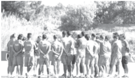
Portugal's coach, Paulo Bento (4th L), is talking to players during their training session at Praia del Rey.

Carvalho, 33, had stormed out of training camp and announced he was quitting international football on the eve of the game.