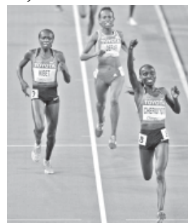
Kenya's Vivian Jepkemoi Cheruiyot, right, celebrates as she crosses the finish line to win the Women's 5000m final ahead of Kenya's Sylvia Jebiwott Kibet, left, and Ethiopia's Meseret Defar, centre, at the World Athletics Championships in Daegu, South Korea, Friday, 2 Sept, 2011.

Kenyan teammate Sylvia Jebiwott took the silver in 14:56.21, while Meseret Defar of Ethiopia won bronze in 14:56.94.