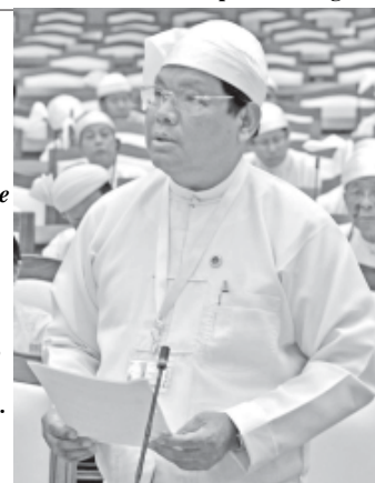
Union Minister for Commerce U Win Myint replies to questions.—MNA

pledge pointing out that such measures of the government would benefit not only farmers but also traders.