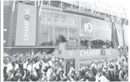
English champions Manchester United posted record operating profits of £110.9million for the past financial year.