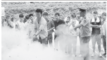
Firefighter teaches students of the Central Academy of Drama to use fire extinguishers during a fire drill in Beijing, capital of China, on 1 Sept, 2011. New students in the Central Academy of Drama participated in a fire drill on the first day of their college life.