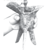
A staff member shows a recently discovered bronze wine vessel in Luoyang of central China's Henan Province, on 29 Aug, 2011. An ancient tomb has been discovered in a construction area of a local hospital. Evidence shows the owner of the tomb lived in the Zhou Dynasty (1046 BC-771 BC), which means it enjoys some 3,000 years of history. The tomb was remain unrobbed, and some bronze wares have been found in the tomb.