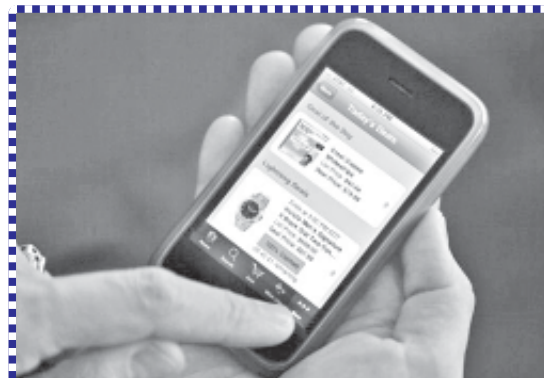
In this on 13 July, 2011 file photo, one of the pages of “Today’s Deals,” appears on the screen of an iPhone, in New York. As the number of people who use iPhones and other smartphones grows, companies selling everything from hardware to high fashion are touting all the new applications they’re rolling out that enable shoppers to do anything from check a store’s inventory while in the dressing room to order prescriptions.