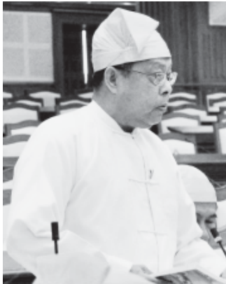
Pyithu Hluttaw Representative U Ko Gyi of Aungmyethazan Constituency raising question.