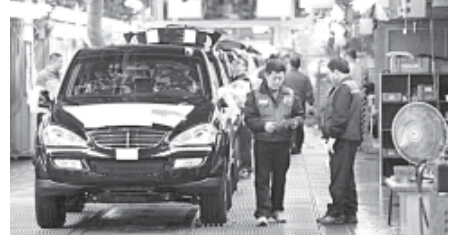
South Korean auto industry workers are seen on a Ssangyong factory line in Pyeongtaek.