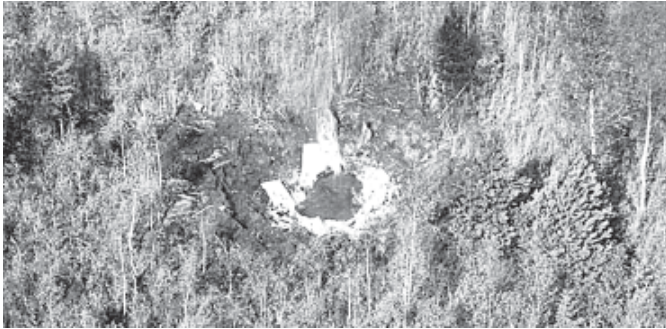
Photo shows the site of the wreckage after the jets' collision.