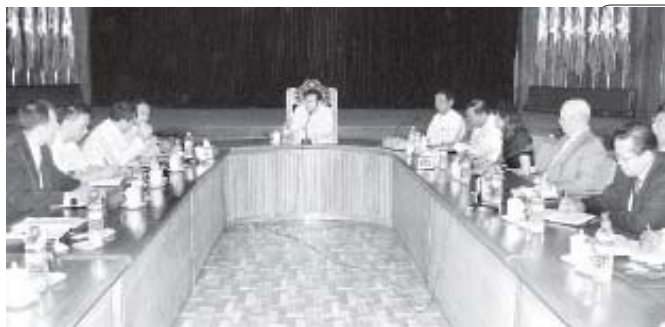
Work coordination meeting of the companies making joint venture with Myanmar Oil and Gas Enterprise of the Ministry of Energy through PSC to explore and produce oil and gas at inland oilfields in progress.