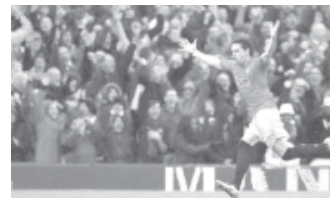
Manchester City duo Joleon Lescott and Joe Hart believe Owen Hargreaves, pictured in 2008, will fit right in should he join Roberto Mancini's already formidable squad.

Eventually, United lost patience and released Hargreaves, who took to posting a video on the YouTube site to demonstrate his fitness, having travelled the world to receive treatment on his knee. Lescott and Hart are both currently with the England squad as they prepare for Friday's Euro 2012 qualifier