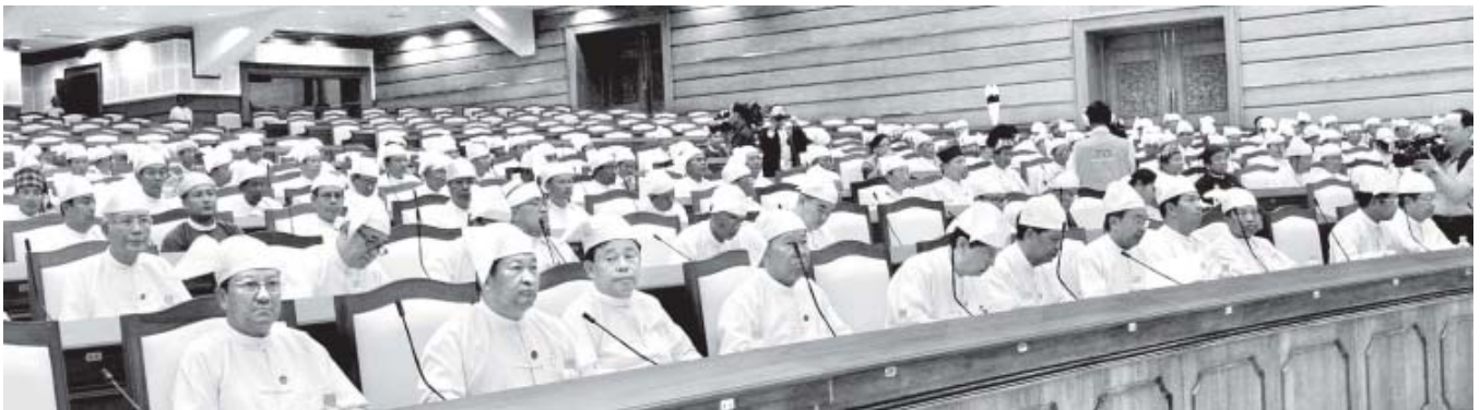
Representatives seen at the second regular session of the first Pyithu Hluttaw. —MNA

NAY PYI TAW, 31 Aug—The second regular session of the first Pyithu Hluttaw continued for the eighth day at Pyithu Hluttaw Hall of Hluttaw Building, here, at 10 am today, attended by Speaker of Pyithu Hluttaw Thura U Shwe Mann and 385 Pyithu Hluttaw representatives. Nine questions were raised and replied, one proposal discussed, and two new proposals and one bill submitted at today's Hluttaw. U Kyaw Myint U Myint Hlaing replied to four questions regarding the irrigation sector. U Po Tok of Momeik Constituency raised a question asking that