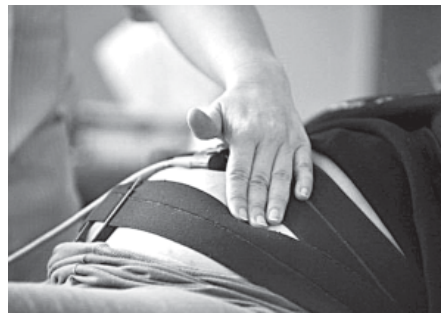
Pregnant women with heart disease face a 100-fold increased risk of death, with the danger for offspring multiplied by ten, according to figures released at a medical congress in Paris.