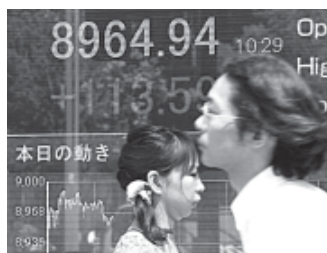
People walk by an electronic stock board of a securities firm in Tokyo, on 30 Aug, 2011.

But Hong Kong's Hang Seng index rose 0.3 percent to 20,262.99 and South