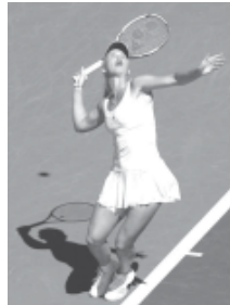
Caroline Wozniacki of Denmark

NEW YORK, 31 Aug — Caroline Wozniacki cruised into the second round of the US Open on