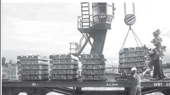
Workers seen at worksite of Concrete Sleeper Factory (Okshitpin).