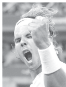
Rafael Nadal, of Spain, celebrates his 6-3, 7-6 (1), 7-5 victory over Andrey Golubev, of Kazakhstan.

NEW YORK, 31 Aug — Rafael Nadal's first match as defending US Open champion was hardly a tour de force. He would fall behind in a set, then come back. Fall behind, then come back. His serve was broken six times; that happened a total of five times in seven matches during his 2010 run to the title at Flushing Meadows. His shots didn't have their normal depth. He needed to save seven set points during the second set.