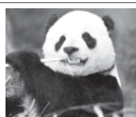
New research shows that panda feces contains bacteria with potent effects in breaking down plant material in the way needed to tap biomass as a major new source of biofuels.