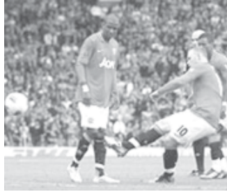
Wayne Rooney completes his hat-trick from the penalty spot.

His first effort saw him become the latest man to score 150 times for United. By the end he had overtaken Ruud van Nistelrooy as the 10th most prolific player in Red Devils' history. Still aged just 25, Rooney now has Charlton's 249 in his sights. "It is always a great feeling to score," he said. "Now I have over 150 goals for a club like United and hopefully there are many more to come. "I am delighted with the way it is going. I worked hard in pre-season. I have started well and the team have started great.