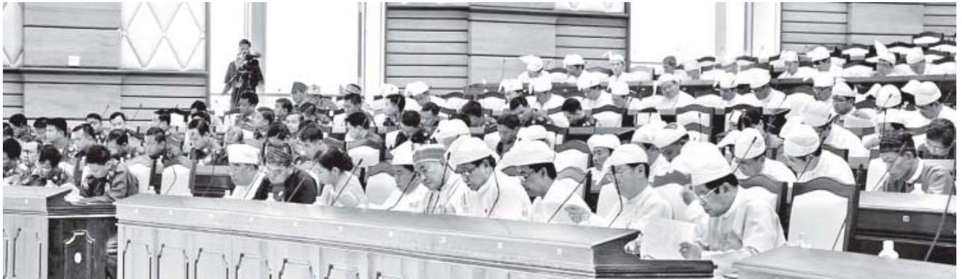
Hluttaw representatives attending second regular session of First Amyotha Hluttaw.

NAY PYI TAW, 31 Aug—The second regular session of the First Amyotha Hluttaw went on for the eighth day at Amyotha Hluttaw Hall in Hluttaw Building here today.