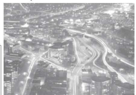
Auckland, New Zealand

the world. Bottom place went to Harare in Zimbabwe. Cities are assessed on 30 different factors, including stability, healthcare, culture and environment. — Xinhua