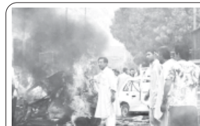
Eleven killed, 25 injured in blast in Pakistan