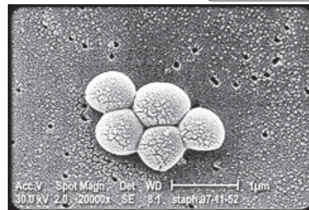
This tiny cluster of bacteria is methicillin-resistant Staphylococcus aureus (MRSA), seen under a microscope. This strain of the common "staph" bacteria causes infections in different parts of the body - including the skin, lungs, and other areas. MRSA is sometimes called a "superbug" because it is resistant to many antibiotics. Though most MRSA infections aren't serious, some can be life-threatening.