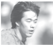
Park Chu-Young has joined Arsenal from Monaco.

LONDON, 31 Aug — Arsenal have completed the signing of Park Chu-Young from Monaco, subject to a formal registration process. The striker has penned what is thought to be an initial two-year contract, amid reports he will be forced to return home in 2013 for a period of military service. The Gunners have signed the 26-year-old from under the noses of Lille, who were convinced they had