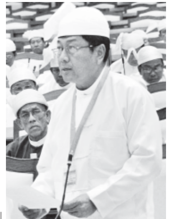
Union Minister for Livestock and Fisheries U Tin Naing Thein replies to questions.

Kodukwe Dam Project is being implemented in Bago Township of Bago Region, and feasibility studies are being conducted for implementation of Salu Creek and Shwelaung Creek Dam Projects. On completion, preventive measures can be taken in Bago Township, and the plans will be submitted to the State. Depending on the budget, the