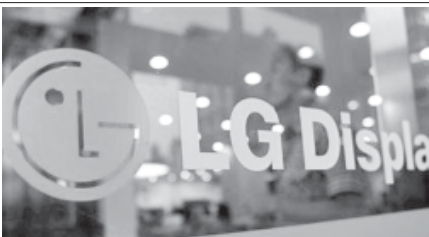
An employee of LG Display walks at the company's main office building in Seoul, on 29 August, 2011.