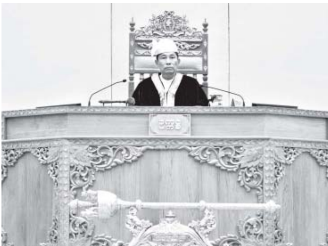
Speaker of Pyithu Hluttaw Thura U Shwe Mann attends seventh-day second regular session of first Pyithu Hluttaw.—MNA

NAY PYI TAW, 30 Aug — The first Pyithu Hluttaw second regular session continued for the seventh day at Pyithu Hluttaw Hall of Hluttaw Building here this morning.