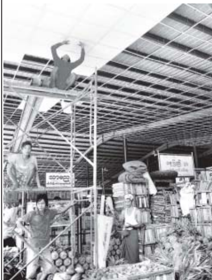
Photo shows ceiling tiles being installed at complex (B) of Thiri Mingala Market.

Article: Tin Win Lay (Kyimyindine); Photo: Myint Aung (Ahlon)