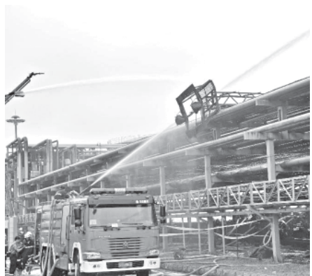
A fire engine works at the fire spot in a refinery owned by PetroChina in Dalian City, northeast China's Liaoning Province, on 29 Aug, 2011.

Police sent 65 fire trucks and nearly three hundred firemen. No casualties have been reported. The fire is thought to have begun after a pipe linking two tanks cracked. Further causes are still under investigation.—Xinhua