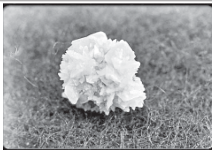
Kidney stones are made of salts and minerals in the urine that stick together, creating small "pebbles" formed within the kidney or urinary tract. They can be as small as grains of sand or as large as golf balls. Kidney stones are a common cause of blood in the urine and often severe pain in the abdomen, flank, or groin. One in every 20 people develops a kidney stone at some point in their life.—INTERNET