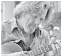
Actor Jeff Bridges

"It's good to block out external stimulus for a set