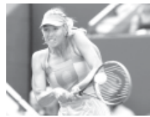
Maria Sharapova of Russia returns a shot to Heather Watson of Britain.

nal there before losing to Petra Kvitova. Fresh off that triumph, Kvitova—a 21-year-old from the Czech Republic seeded No 5 in Flushing Meadows — failed to follow it up, flopping at the US Open with a 7-6 (3), 6-3 loss to 48th-ranked Alexandra Dulgheru of Romania.