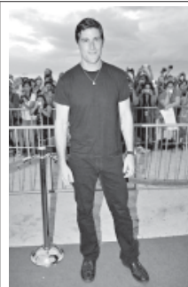
Cast member Matthew Fox poses for the cameras on the red carpet before the premiere of the sixth and final season of the television series "Lost" on Waikiki beach in Honolulu, Hawaii on 30 January, 2010.