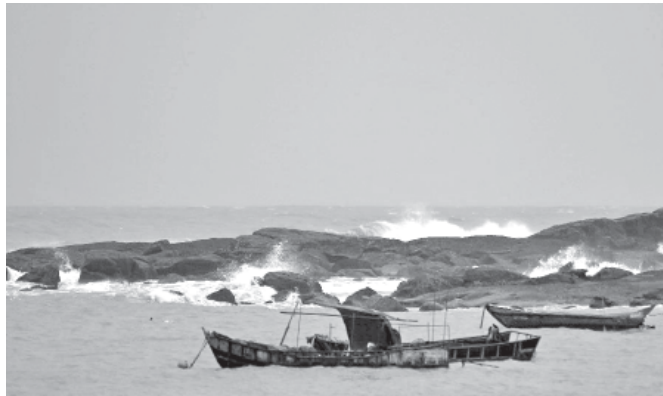
Fishing boats are seen anchored in harbor in Jinjiang, southeast China's Fujian Province, on 29 Aug, 2011. All personnels were asked to get onshore by authorities to avoid danger by typhoon Nanmadol, which was likely to make landfall over the southern part of Fujian on Tuesday.—XINHUA

Quanzhou municipal authorities have organized more than 41,000 people into rescue teams to prepare for potential emergencies. Nanmadol will bring high tide levels with heavy rainfall of 200 mm to 350 mm, which might lead to flooding and secondary disasters, according to a report released by the meteorological bureau.—Xinhua