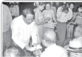
Union I&C Minister attends 5 th ceremony to pay respects to the aged theatrical artists PAGE(2)

NAY PYI TAW, 30 Aug—A strong earthquake of magnitude (6.8) Richter Scale with its epicenter outside Myanmar (Banda Sea, Indonesia) about (2600) miles Southeast of Kaba Aye seismological observatory was recorded at (13) hrs (34) min (40) sec MST today, announced the Meteorology and Hydrology Department.—MNA