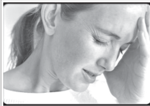
A migraine is a headache with throbbing pain that is usually worse on one side of the head. The pain is often severe enough to hamper daily activities and may last from four hours to three days if untreated. More than one in 10 Americans, including one in 6 women, have migraines, but many have been told mistakenly that they have a sinus or tension headache. Foods, stress, and hormones can be migraine triggers.—INTERNET