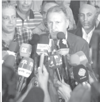
Brazilian coach Zico speaks to the media in Arbil, Iraq