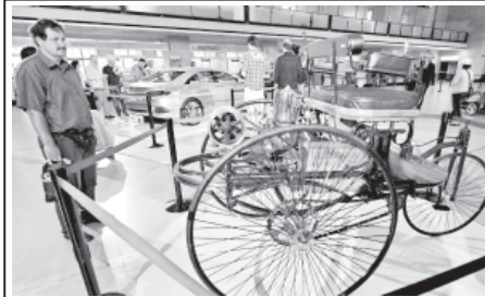
A visitor looks at a model of the automobile made by Carl Benz in 1886 during a Mercedes-Benz vintage car show to mark the German car maker's 125 founding anniversary at the former Tempelhof airport in Berlin, Germany, on 28 Aug, 2011.

The Sunshine Coast Regional Council said that while it sympathizes with the family's loss, searching the landfill, which takes in about 1,400 tons of waste each week, would be next to impossible. "To locate the lost items, this decaying compacted waste would need to be systemically excavated and sorted mechanically by the contractor," a council spokesman said.