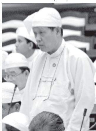
Amyotha Hluttaw representative U Tun Lwin of Kachin State Constituency No. 9 raises proposal. —MNA

Union Minister for Home Affairs Lt-Gen Ko Ko responded to the question that matters relating to prison visitors has been prescribed in Paragraph (24), (26) and (27) of Chapter (4) of Section (1) in the Prison Manuals (1894). Tasks for