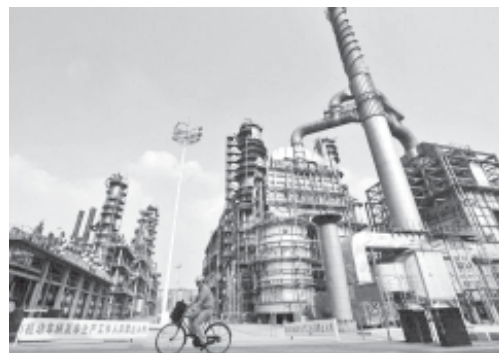
Chinese oil giant Sinopec, Asia's largest refiner, has reported a 12 percent gain in net profit for the first half this year, thanks to strong growth in the world's second largest economy.

Total revenue rose 31.5 percent on the year to 1.23 billion yuan in the first half. Sales of petroleum products, which accounted for more than 60 percent of total revenue, surged 31.6 percent to 746.3 billion yuan. "The Chinese economy has continued its steady and robust growth," the company