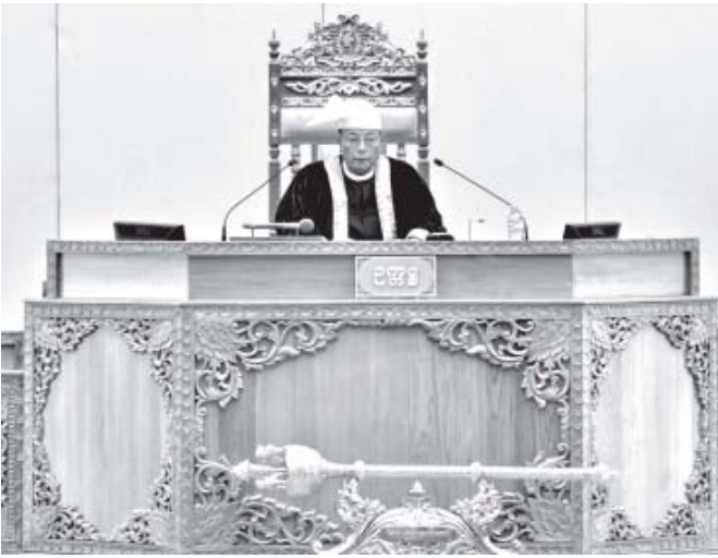
Speaker of Amyotha Hluttaw U Khin Aung Myint attends seventh-day second regular session of first Amyotha Hluttaw.

NAY PYI TAW, 30 Aug—The first Amyotha Hluttaw second regular session went on for the seventh day at Amyotha Hluttaw Hall of Hluttaw Building here this morning.