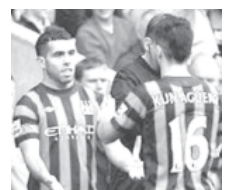
Sergio Aguero hopes his compatriot Carlos Tevez stays at City.