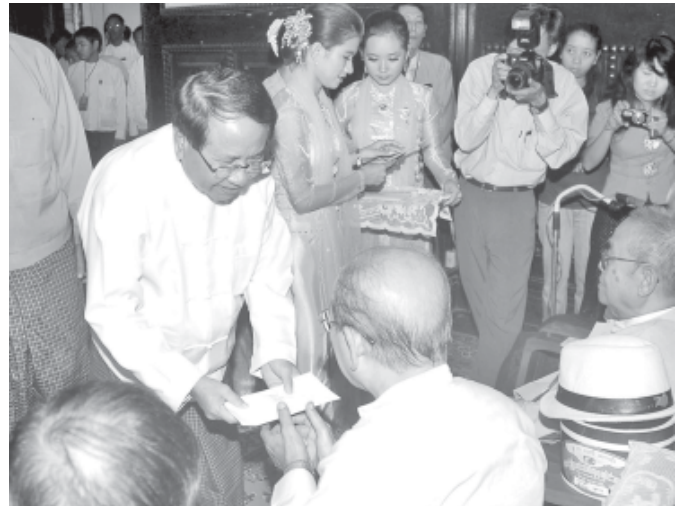
Union Minister for Information and for Culture U Kyaw Hsan presents cash and gifts to an aged theatrical artiste.