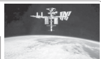
Astronauts might have to abandon space station