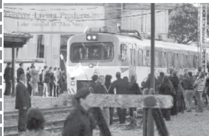
A new train is seen in Salto, Uruguay, on 29 Aug, 2011. The new train line joins Argentina and Uruguay for the first time across the Uruguay River, and will eventually unite the existing rail networks of both countries, according to the Argentine government.