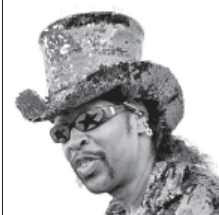
Musician Bootsy Collins poses at the 11th Annual BMI Urban Awards at the Pantages theatre in Los Angeles on 26 August, 2011.