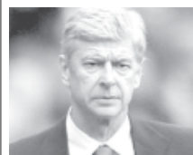
Arsene Wenger has apologized to Arsenal fans after defeat to Man Utd.

LONDON, 30 Aug — Arsene Wenger has apologized to the Arsenal fans for their 8-2 defeat against Manchester United on Sunday. The Gunners conceded eight goals for the first time since 1896 during the Barclays Premier League defeat at Old