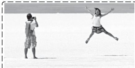
A tourist poses for pictures at Tuz Golu, about 130 km (81 miles) from Ankara on 29 Aug, 2011. Tuz Golu, which means Salt Lake in Turkish, is the second biggest lake in Turkey, located in the Central Anatolia Region.—XINHUA

The mother of the victim, who was born in 1959, contacted police in mid-August and investigators checked out his contacts, which led to the suspect.—Internet