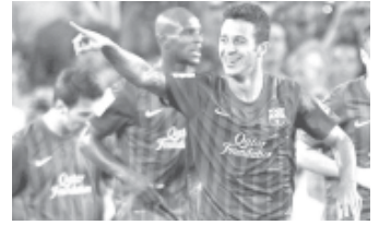
Barcelona's Thiago Alcantara celebrates after scoring a goal against Villarreal during their Spanish first division soccer match at Nou Camp stadium in Barcelona on 29 Aug, 2011.

Barcelona coach Pep Guardiola produced a surprise in his starting line-up: with central defenders Carles Puyol and Gerard Pique both injured, he started the game with just three defenders on the pitch, but with Cesc Fabrigas, who was