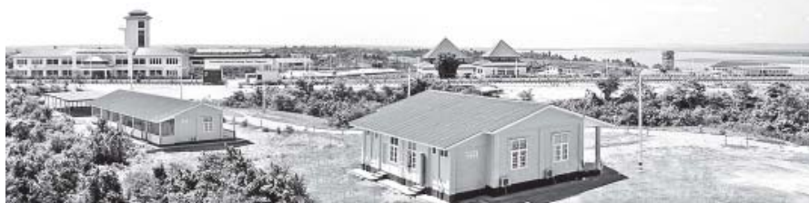
Automobile Technical Training School (Magway).

NAY PYI TAW, 30 Aug—Automobile Technical Training School (Magway) launched its course No. 1 on 26 August morning at its assembly hall.