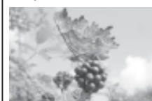
Warmer weather has brought the British comma dancing around Scottish nettles for the first time.

LONDON, 23 Aug — Animals and plants are shifting their natural home ranges towards the cooler poles three times faster than scientists previously thought. In the largest study of its kind to date,