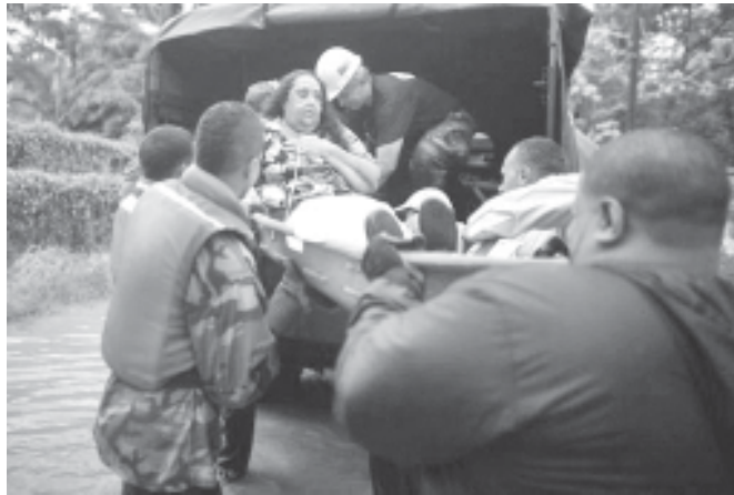
A woman is carried on a stretcher by civil defense workers after she was unable to attend a respiratory therapy due to an emphysema after hurricane Irene struck and flooded the area she lives in Naguabo, Puerto Rico, on 22 Aug, 2011.