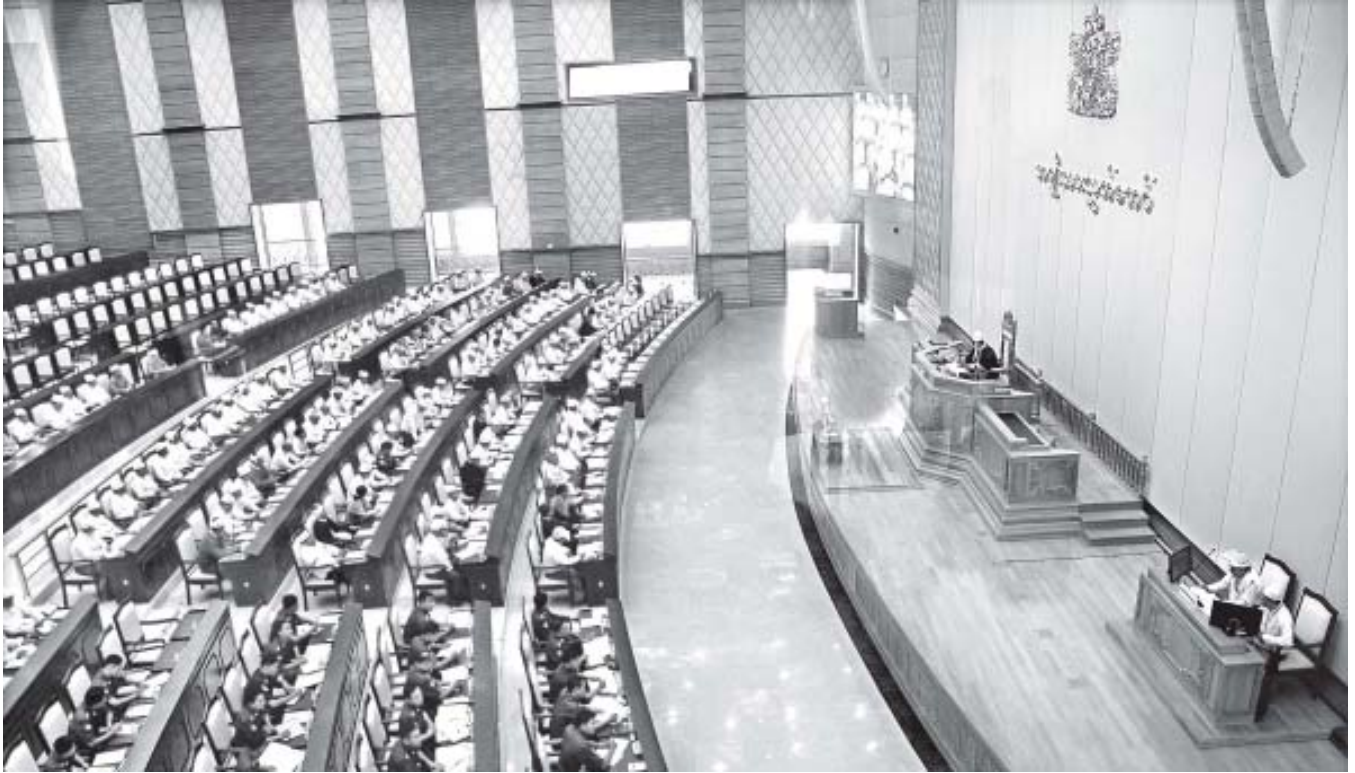
The second regular session of First Amyotha Hluttaw for second day in progress.—MNA

NAY PYI TAW, 23 Aug—The second regular session of First Amyotha Hluttaw was held at Amyotha Hluttaw Hall of Hluttaw Building here this morning for the second day.