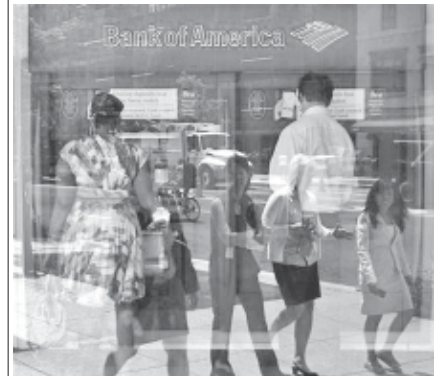
Pedestrians are reflected in the window as customers conduct transactions at a Bank of America ATM in Washington on 19 July, 2011.

NEW YORK, 23 Aug—A New York state judge granted the request of dozens of investors including pension funds, insurers and several Federal Home Loan Banks to intervene in Bank of America Corp's proposed $8.5 billion settlement with investors who lost money on mortgage-backed securities.