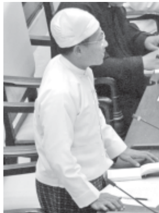
Amyotha Hluttaw representative U Tin Yu of Yangon Region Constituency No. 11.