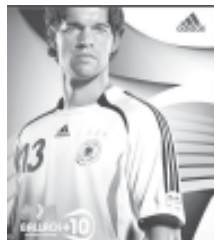
Ex-Germany captain Michael Ballack

Ballack, 34, has played in just one of Leverkusen's three league games so far this season and coach Robin Dutt has said he will not play the ex-Chelsea star alongside captain Simon Rolfes in their three-man midfield. Dutt has said he has no problem with the veteran midfielder who is under contract until June 2012.