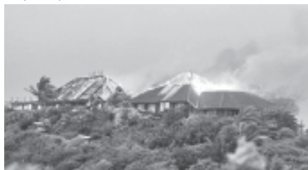
In this image issued Monday 22 Aug, 2011 by Virgin Limited Edition shows British entrepreneur's Sir Richard Branson's luxury home, on Necker Island, in the Caribbean, in flames as a fire which ripped through the luxury home.