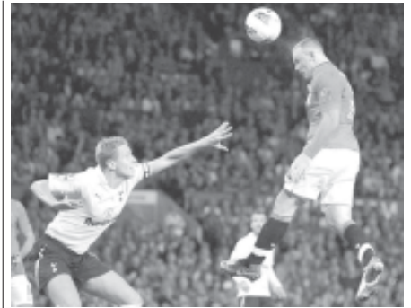
Manchester United's Rooney scores against Tottenham Hotspur during their English Premier League soccer match in Manchester, northern England on 22 Aug, 2011. Man United beats Tottenham 3-0.