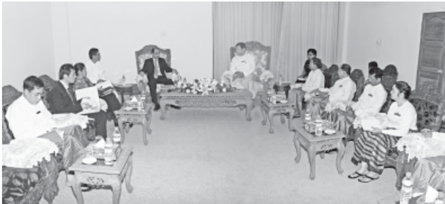
Chairman of Union Election Commission U Tin Aye receives Human Rights Special Rapporteur Mr Thomas Ojea Quintana and party at UEC office in Nay Pyi Taw.

NAY PYI TAW, 23 Aug—Human Rights Special Rapporteur Mr Thomas Ojea Quintana and party called on Chairman of Union Election Commission U Tin Aye at the office of Union Election Commission here today.