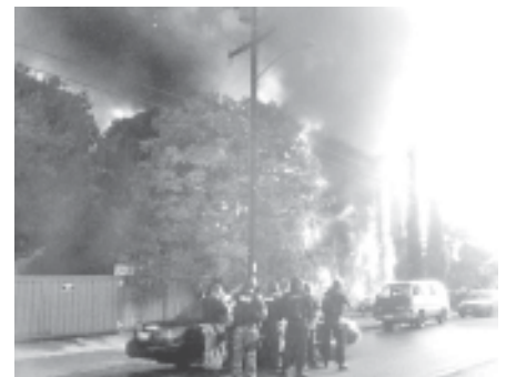
A photo provided by Heartland Fire & Rescue shows police in San Diego County, Calif, on 21 Aug, 2011 outside a burning building where a gunman had shot an El Cajon policeman. The fire broke out after the policeman was shot.