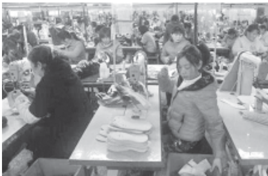
Workers make shoes, which will be exported to the US, at a shoe factory in Xihua county, Henan province on 2 April, 2011.

But that still left the index a touch below the 50-point mark that demarcates expansion from contraction in activity. HSBC publishes its final China PMI index for August on 1 Sept.