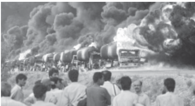
Residents and the media gather near the site of burning tankers, used to carry fuel for NATO forces in Afghanistan, which were attacked by unidentified gunmen on the outskirts of Quetta on 22 Aug, 2011.

ISLAMABAD, 23 Aug—At least 19 oil tankers were burnt when a NATO supply convoy came under attack Monday afternoon in Pakistan's southwest province of Balochistan, reported local Urdu TV channel Geo. According to the report, the attack took place at about 2:30 pm when unknown gunmen opened fire at a NATO convoy on the Sibi-to-Quetta Highway in the Dasht area of