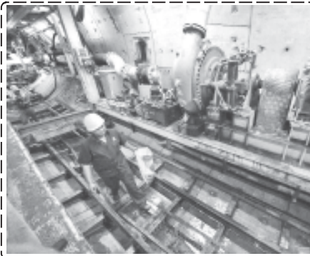
A worker walks in the subway tunnel built under the Yangtze River in Wuhan, capital of central China's Hubei Province, on 21 Aug, 2011. The 3.1-km-long subway tunnel is the first of its kind to cross the Yangtze River, China's longest river, and will start operating at the end of next year.

More than 110 companies from the DPRK, China, Russia, Australia, Italy and the United States brought to the fair electrical and electronic products, light industry goods, food stuff, medicine, vehicles and other commodities.—Xinhua