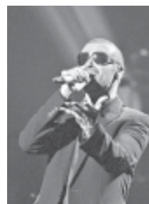
British singer George Michael arrives on stage before his concert at Czech State Opera House as a part of "Symphonica: The Orchestral Tour" in Prague 22 Aug, 2011.

There have been months of rumours and whispers about the couple's separation, however, Michael took to Twitter and went on live TV in March to say the