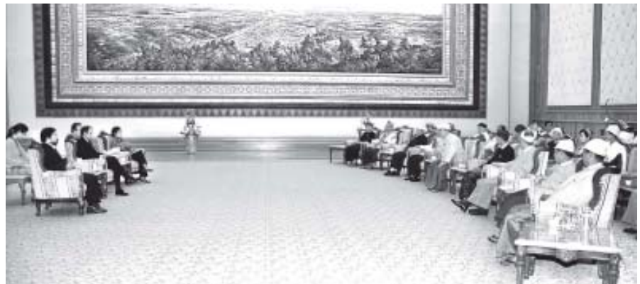
Hluttaw representatives of Pyithu Hluttaw and Amyotha Hluttaw met Human Rights Special Rapporteur Mr Thomas Ojea Quintana and party at Zabuthiri Meeting Hall in Hluttaw Building.—MNA

NAY PYI TAW, 23 Aug—The Hluttaw representatives of Pyithu Hluttaw and Amyotha Hluttaw met Human Rights Special Rapporteur Mr Thomas Ojea Quintana and party at Zabuthiri Meeting Hall in Hluttaw Building here this morning.