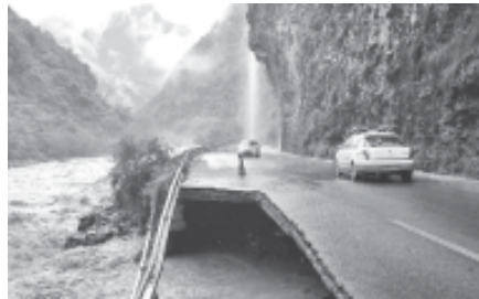
A collapsed road is seen in Xingshan County of Yichang City, central China's Hubei Province, 22 Aug, 2011. Rain-triggered mudslides hit the mountainous region in Yichang on Monday, blocking the No 209 National Highway and leaving hundreds of people stranded.