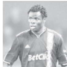
AC Milan left-back Taye Taiwo

he "has to learn about the way the game is played in Italy." Meanwhile, Swedish striker Zlatan Ibrahimovic is a doubt for Milan's season-opener against Cagliari in Sardinia with a knock to his left ankle. — Internet