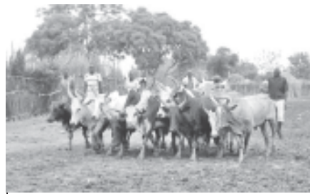
In this Wednesday, 13 July, 2011 photo, young men herd cattle through the mud-caked streets of Pibor, South Sudan.

South Sudan became the world's newest country in July, amid high hopes that it would leave its violent past behind. A 2005 peace deal with the north ended a civil war