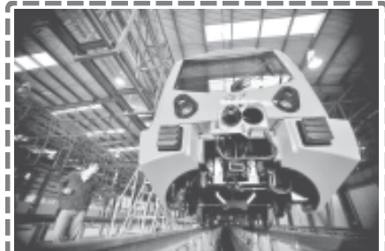
A visitor walks next to one of the new trains in the workshops at the station Tlahuac, in Mexico City, capital of Mexico, on 22 Aug, 2011. 30 trains made in Spain are already in the workshops and will circulate in the underground line in 2012.—XINHUA

Espersen explained the strategy is needed as the region "will undergo profound changes due to global warming in the short term, and these changes are forcing us to act now."—Xinhua