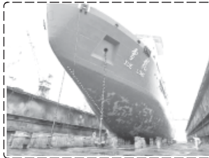
Photo taken on 22 Aug, 2011 shows China's Icebreaker "Xue Long" (Snow Dragon) in Shanghai, east China. A maintenance work is carrying out on "Xue Long", which is scheduled to begin its 28th Antarctic scientific expedition at the end of October this year.