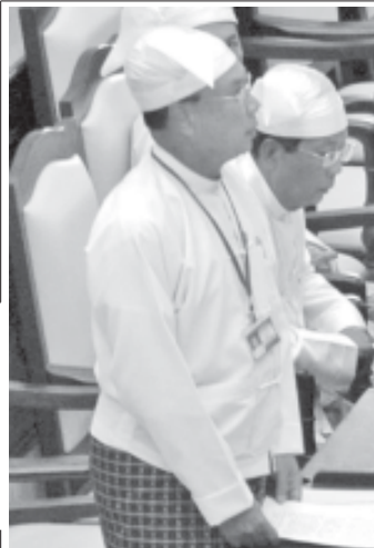
Union Forestry Minister U Win Tun replies queries.

the bill in accord with the current situations so as to pass it as an environmental conservation law.