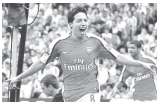
French midfielder Samir Nasri.

24, to travel to Manchester for a medical, meaning he will not feature in the Gunners' crucial Champions League play-off second leg at Udinese on Wednesday.