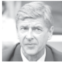
Arsenal manager Arsene Wenger

NYON, 23 Aug — UEFA gave Arsenal manager Arsene Wenger a two-match touchline ban on Monday for breaching the terms of a previous suspension during last week's Champions League playoff against Udinese. Wenger had been banned for the first leg for comments made about the referee follow-