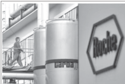
A worker makes its way on a bridge at Swiss pharmaceutical company Roche plant in Basel on 2 Feb, 2011.

It is still early days for dalcetrapib, and medical experts remain wary following the high-profile failure of a similar drug from Pfizer called torcetrapib. There is also a lack of evidence — so far at least — that raising HDL with drugs actually stops heart attacks and strokes.—Reuters