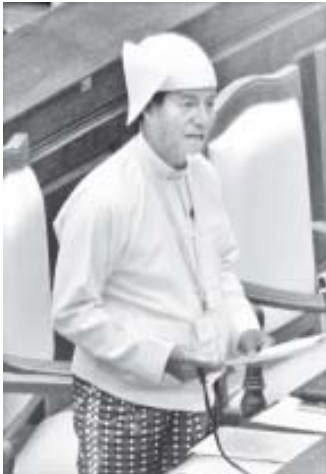
Union Construction Minister U Khin Maung Myint answering queries.