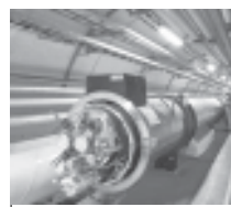
Two Large Hadron Collider (LHC) magnets are seen before they are connected together. The LHC simulates mini-Big Bangs allowing scientists to study theories of the dawn of time.