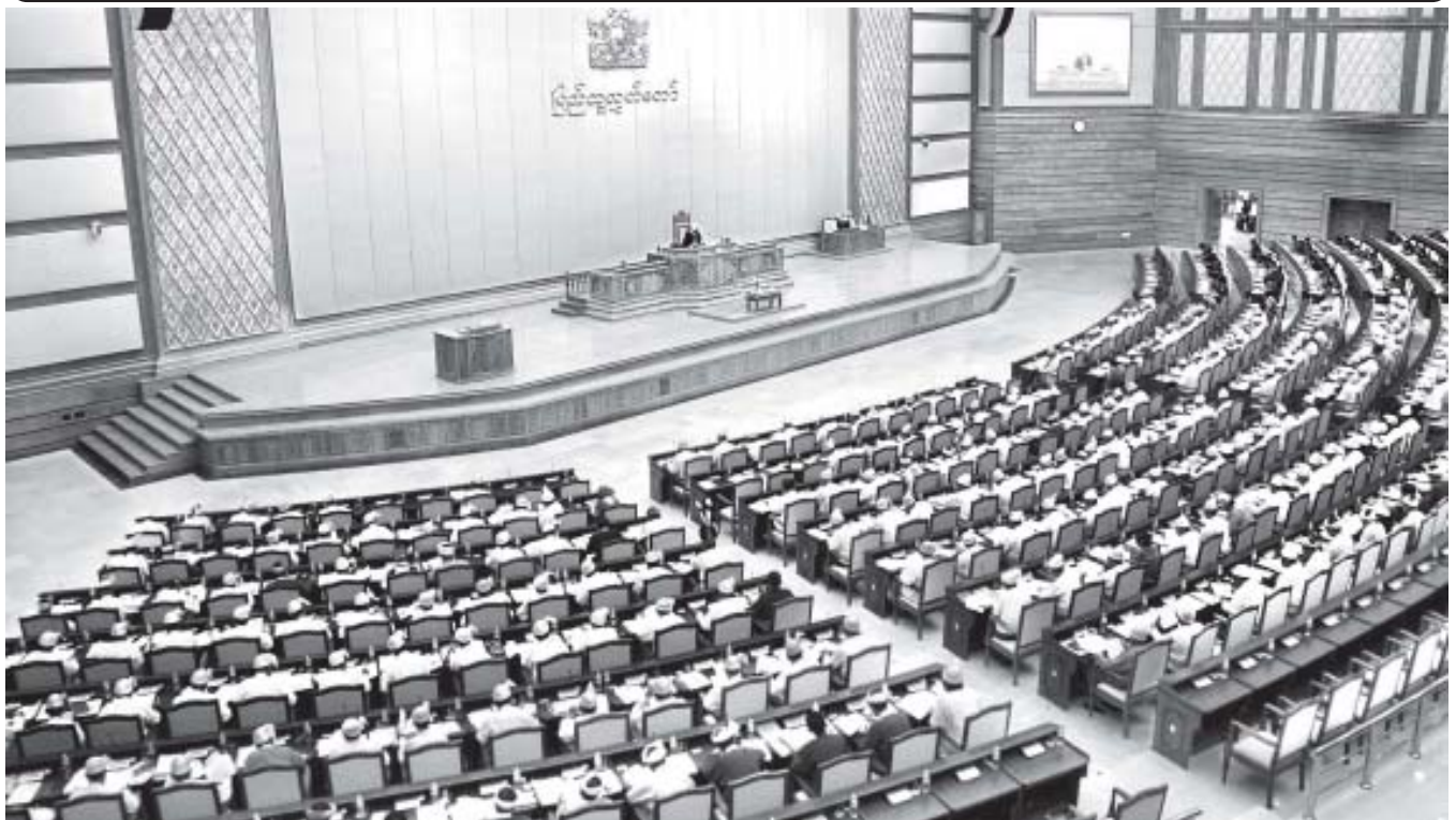
Second-day first Pyithu Hluttaw second regular session in progress.—MNA

NAY PYI TAW, 23 Aug—The first Pyithu Hluttaw second regular session continued for the second day at Pyithu Hluttaw Hall of Hluttaw Building here this morning.