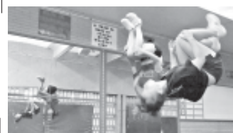
Some experts who study brain injuries in youth sports worry that female-dominated sports like gymnastics and cheerleading are being overlooked.—INTERNET

But that same level of awareness may not yet be there in female-dominated sports.—Internet