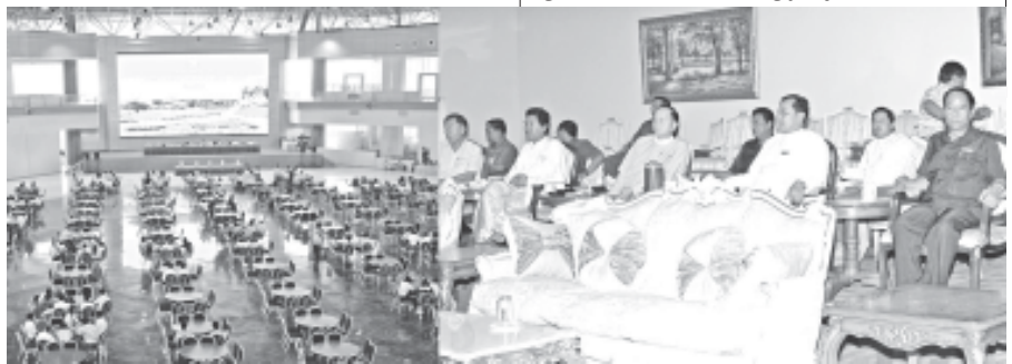
Union Minister for Mines U Thein Htaik views gem merchants bidding for jade lots.