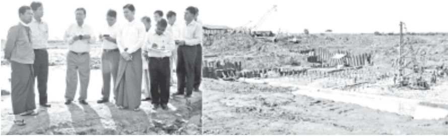
Union Minister for Agriculture and Irrigation U Myint Hlaing inspects construction of Ngamoeyeik Sluice Gate.—MNA

NAY PYI TAW, 15 Aug—Union Minister for Agriculture and Irrigation U Myint Hlaing made an inspection tour of Ngamoeyeik Dam Project near Sitpintaung Village in Dagon Myothit (East) Township, Yangon, yesterday.