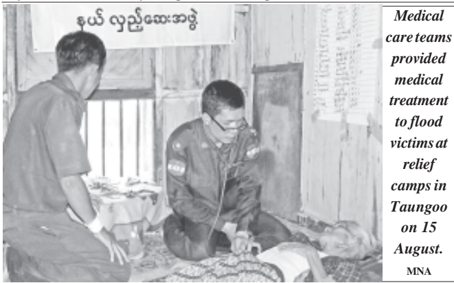
Medical care teams provided medical treatment to flood victims at relief camps in Taungoo on 15 August.

The Thai delegation paid homage to Uppatasanti Pagoda before their departure to Thailand.—MNA