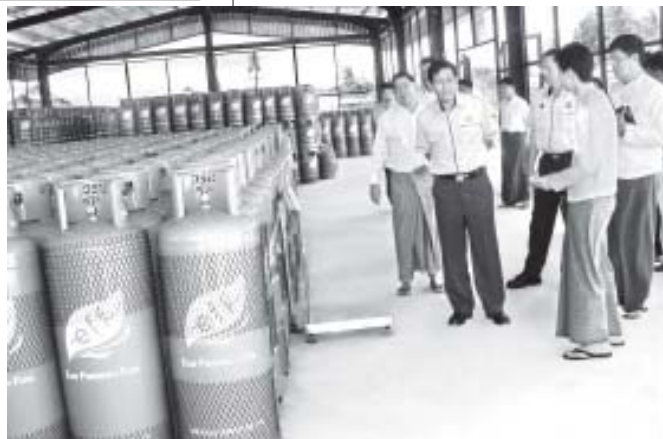
Union Minister for Energy U Than Htay inspects storage of LPG at Thanlyin Refinery.

uefied petroleum gas importers at the briefing hall of the refinery, said that private companies had been permitted to import and sell LPG; that 1200 tons of LPG imported had arrived July and called for increased distribution of LPG across the nation. He then inspected storage and distribution of LPG by Universal Energy Co and Green Luck Trading Co.—MNA