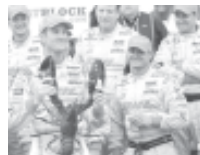
With his crew behind him, IndyCar driver Ryan Hunter-Reay holds a lobster given to him after winning the MoveThatBlock.com 225 IndyCar 225 auto race, on 14 Aug, 2011, in Loudon, NH.