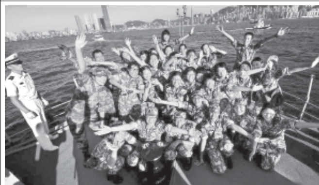
College students pose with soldiers of People's Liberation Army (PLA) Hong Kong Garrison on a landing craft in Hong Kong, south China, on 14 Aug, 2011. A total of 100 college students from universities in Hong Kong went onboard ships of the PLA Hong Kong Garrison for a visit on Sunday.

ranking released by China's Shanghai Jiao Tong University on Monday.