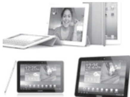
Samsung and Apple tablet devices.

Lawyers representing the two companies declined to comment on reasons for a separate case in the Netherlands but a technology expert who asked not to be named, said he believed the Dutch case was simply filed before the one in Germany.—Internet