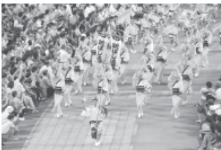
Dancers perform the traditional folk dance Awa Odori during the ongoing Awa Odori festival in Tokushima, Japan, on 13 Aug, 2011. The Awa Odori festival is one of the most well-known festival in Japan, which is expected to attract more than one million visitors this year.