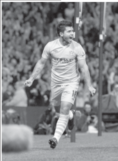
Manchester City's new striker Sergio Aguero celebrates after scoring against Swansea during their English Premier League soccer match at The Etihad Stadium, Manchester, England, on 15 Aug 2011.