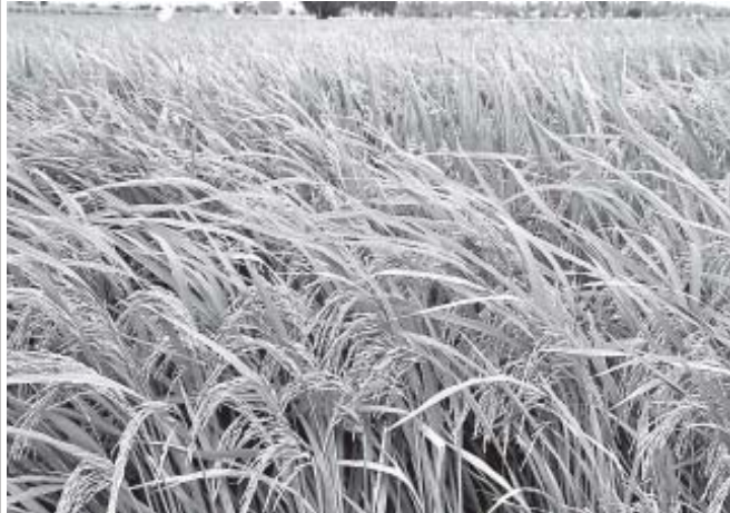
Photo shows use of inputs into the farmlands in systematic ratio.

water and nutrition are to be supplied to the farm continuously. The paddy farm must always be wet. After growing paddy plants, water is to be supplied to the paddy field in the following days. Water level is to be maintained in the farm at a time when paddy plants are thriving with flowers to be able to prevent growth of weeds and undesirable increased paddy saplings. It is necessary to