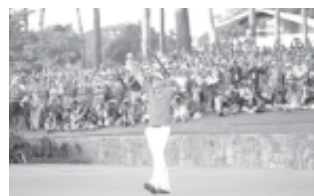
Keegan Bradley celebrates on the 18th green after winning a three-hole playoff against Jason Dufner at the PGA Championship golf tournament on 14 Aug, 2011, at the Atlanta Athletic Club in Johns Creek, Ga.

Trophy perched nearby. "I remember as a kid going out to her tournaments and literally staring her in the face, and I'm her nephew, but she was so into it, she wouldn't even recognize me. And I thought that was cool," said Bradley, now 25.