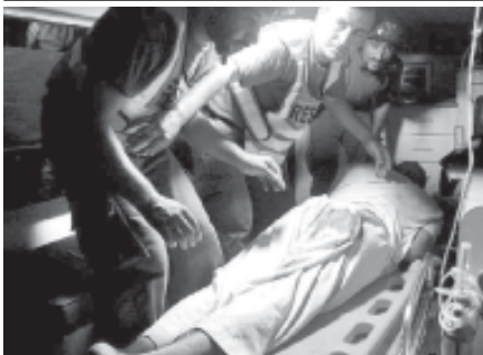
Rescuers transfer an injured man to hospital from the blast site in Peshawar, northwest Pakistan, on 15 Aug, 2011. At least one person was injured in a blast at a shop in Peshawar.