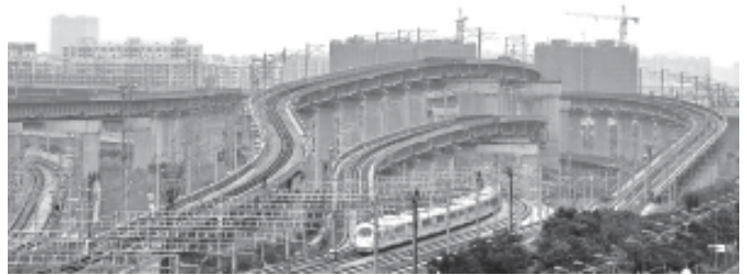
A bullet train runs near the Hongqiao Railway Station in Shanghai, east China, on 14 Aug, 2011. China's Ministry of Railways cut the number of high-speed trains running between Beijing and Shanghai to 66 pairs from 88 pairs per day, effective as of 16 Aug when a new operation chart will be carried out. —XINHUA

The ministry has vowed to improve the management of its train schedules and avoid delays caused by bad weather and construction.—Xinhua