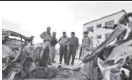
Afghan police men and Afghan soldiers inspect the site of car bomb outside governor's compound in Parwan provincial capital of Charikar, some 30 miles (50 kilometres) north of Kabul, Afghanistan, on 14 Aug, 2011.

No group claimed responsibility for the attack. But Baluchistan has experienced a decades-long militancy by nationalists who want a greater share of the region's natural resources.—Internet