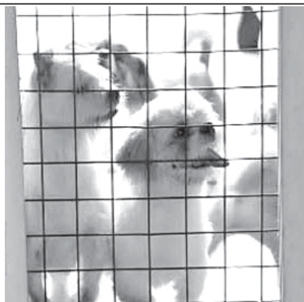
Dogs in a cage.