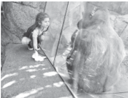
A girl and a gorilla look at each other at the Los Angeles Zoo in Los Angeles, California on 12 August, 2011.