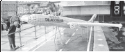
A citizen watches a model of Airbus 330 displayed at a shopping mall in Hangzhou, capital of east China's Zhejiang Province, on 14 Aug, 2011. The 6-metre long and 5.8-metre wide Airbus 330 model was made of 2,800 waste cans to advocate the concept of low-carbon flight.