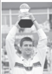
Novak Djokovic, from Serbia, raises the trophy after defeating Mardy Fish, from the United States.