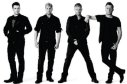
Westlife will perform in Singapore on 3 Oct.—INTERNET

Westlife is one of the longest lived boy bands in the UK, with a career spanning 12 years and 11