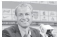
German football great Jurgen Klinsmann

NEW YORK, 15 Aug -- German football great Jurgen Klinsmann, drafted in to guide the underachieving United States to the 2014 World Cup, says he's encouraged by what he's seen of his players so far. "After a couple of days, I'm highly impressed with these guys," said Klinsmann, who will make his debut on the sideline for the United States in a friendly match against archrivals Mexico on Wednesday.