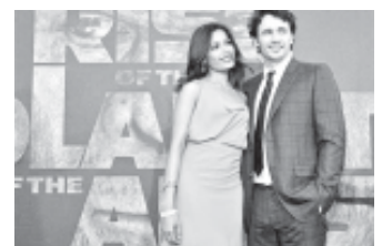
Cast members James Franco and Freida Pinto pose at the premiere of "Rise of the Planet of the Apes" at the Grauman's Chinese theatre in Hollywood, California on 28 July, 2011.

"Final Destination 5" was released by Warner Bros, a unit of Time Warner Inc. Walt Disney Co distributed "The Help," which was produced by DreamWorks.—Reuters