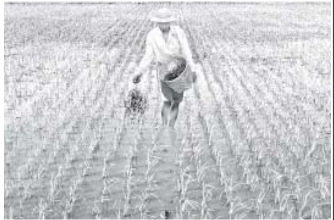
Water and nutrition being supplied to paddy fields.

For the 12 th point, it is necessary to wipe out weeds. In reality, weeds are enemy of paddy plantation. If weeds cannot be wiped out, they will consume water and nutrition. If seeds of weed will mix with paddy seeds during the harvesting period,