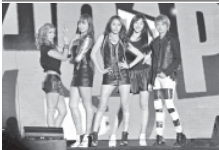
South Korean pop group f(x) perform at the "Incheon Korean Music Wave 2011" concert at the Incheon Munhak Olympic Stadium in Incheon City, Gyeonggi Province of South Korea, on 13 Aug, 2011.