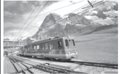
A cog train heads for the Jungfrauoch the highest railway station in Europe, in the Valais Alps, Switzerland on 13 Aug, 2011. Taking the cog train up across mountains and finally getting to its last stop the Jungfrauoch is Switzerland's most popular mountain railway excursion.