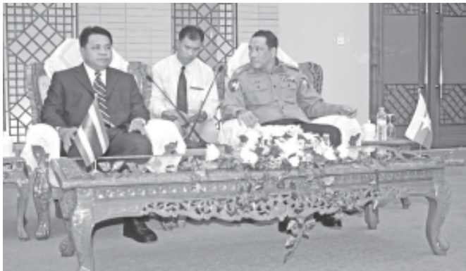
Chief of Royal Thai Police Force Mr Wichean Potephosree calls on Chief of Myanmar Police Force Kyaw Kyaw Tun at Myanmar International Convention Centre in Nay Pyi Taw.

NAY PYI TAW, 15 Aug— Six-member Thai delegation led by Chief of Royal Thai Police Force Mr Wichean Potephosree called on Myanmar side led by