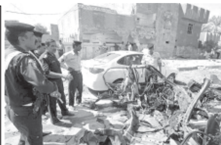
Policemen gather at the site of a bomb attack in Najaf, 160 km (100 miles) south of Baghdad 15 August, 2011.

provincial health department, said more than 68 people were wounded in the Kut blasts and doctors in the city's main hospital said they were struggling to treat casualties, many with severe burns.