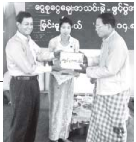
Union Minister for Construction U Khin Maung Myint presents K 10 million fund to Zeya Yadana microcredit association.