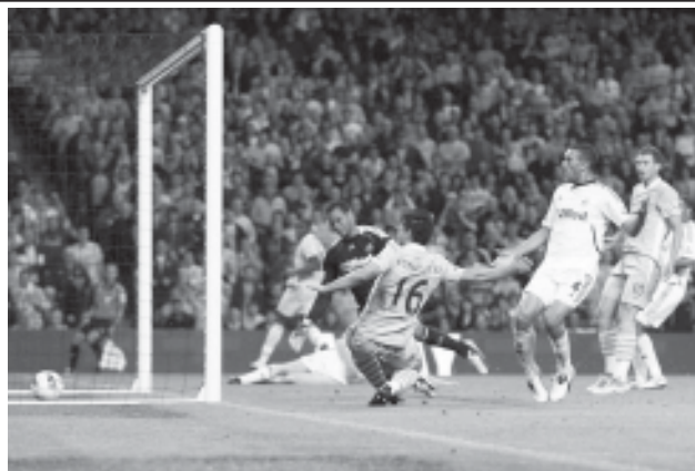
Manchester City's new striker Sergio Aguero, centre, scores against Swansea during their English Premier League soccer match at The Etihad Stadium, Manchester, England, on 15 Aug 2011.