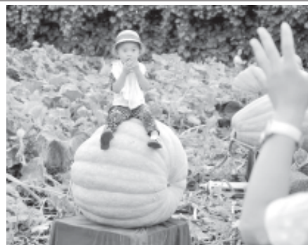
A child poses for photos as sitting on a huge pumpkin during an international agricultural and food fair in Changchun, capital of northeast China's Jilin Province, on 14 Aug, 2011.