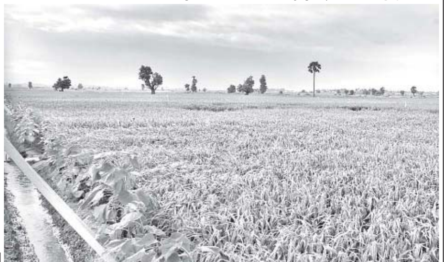
Water being drained out from paddy field so as to use manpower and farming machinery when ears of paddy are ripened.

For the 11 th point, inputs are to be used in ratio. One bag of compound fertilizer and a half bag of urea fertilizer are to be mixed with natural fertilizer to feed the paddy field for production of above 100 baskets of paddy per acre. In the final soil preparation, the field is fed with one bag of compound fertilizer and a half bag of Pearl fertilizer. In developing period of the plants, one quarter bag of pearl fertilizer mixed with