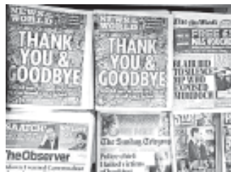
The last edition of News of the World newspaper goes on sale alongside other British Sunday newspapers in London on 9 July, 2011.