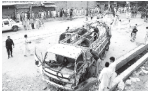
People gather at the blast site in northwest Pakistan’s Peshawar on 11 August, 2011.