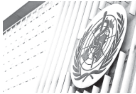
The World Health Organisation (WHO) headquarters, in Geneva, Switzerland. An estimated 500,000 people in west Africa are infected with lassa fever every year, WHO said Wednesday, amid calls for more money to be spent on preventing its spread.—INTERNET

Instead he argued that countries “should embark on adequate measures to prevent the spread of the disease and all available resources should be spent on those access that promote good health as well as personal and environmental hygiene.” The acute viral haemorrhagic fever causes some 5,000 deaths annually in west Africa, according to World Health Organization figures.— Internet