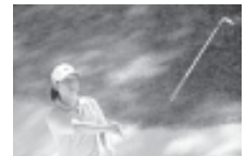
Anthony Kim tosses his club after hitting out of a bunker on the 16th hole during a practice round for the PGA Championship golf tournament on 10 Aug, 2011.

more difficult closing stretches in championship golf, the last four holes feature a pair of par 3s over water, including one that measures 260 yards on the scorecard.— Internet