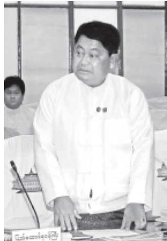
Union Minister for Hotels and Tourism and for Sports U Tint Hsan gives a report.—MNA

The meeting ended with necessary explanations of the Pyithu Hluttaw Speaker.—MNA