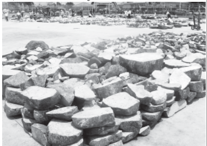
Low-grade utility jade stones are displayed to be sold at the Low-Grade Utility Jade Sales at Mani Yadana Jade Hall.