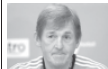
Liverpool boss Kenny Dalglish, pictured in July, 2011.

LONDON, 11 Aug — Liverpool boss Kenny Dalglish and his Everton counterpart David Moyes united in calls for an end to the rioting which has spread to the city here Wednesday.