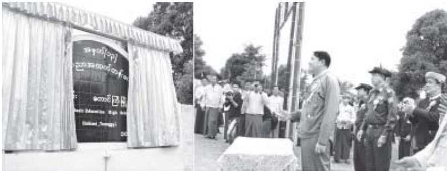
Shan State Chief Minister U Sao Aung Myat formally unveils the signboard of Kyauktalongyi Sub-township BEHS in Taunggyi Township.—MNA

NAY PYI TAW, 11 Aug—The ceremony to upgrade Basic Education High School (branch) into the level of basic education high school was held in the school compound in Hanhsee Village, Kyauktalongyi