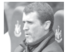
Manchester United legend Roy Keane, seen here in 2008.

they'll win it comfortably. Even last year when United were slipping up, no team was strong enough to take advantage of it." Keane said the arrival of Chelsea manager Andre Villas-Boas would not be enough to turn around the London club's fortunes.— Internet