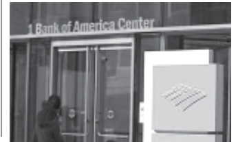
A Bank of America shareholder walks into the corporate headquarters prior to the start of the Bank of America annual shareholders meeting in Charlotte, North Carolina on 11 May, 2011.

Bank of America, whose shares have fallen 20 percent in the past week, did not mention the China investment during a widely followed conference call that top executives held Wednesday with thousands of investors.—Reuters