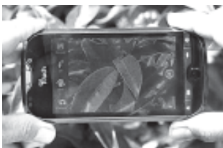
An Associated Press reporter demonstrates the camera on the HTC myTouch 4G Slide smartphone from T-Mobile during a product review in San Francisco, on 10 Aug, 2011.