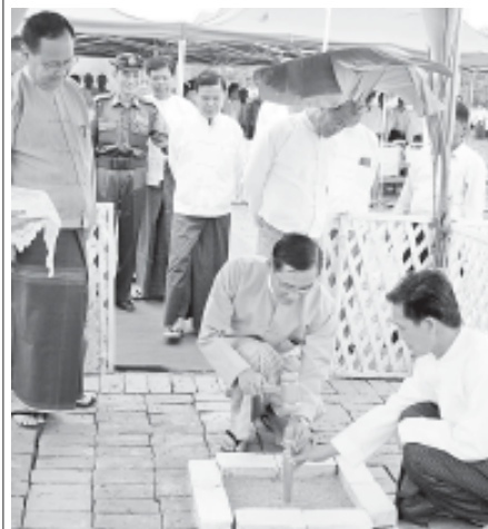
Kayah State Chief Minister U Khin Maung Oo drives a stake for erecting GSM tower.