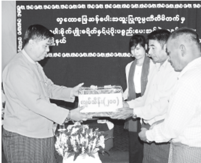
Chief Minister of Sagaing Region U Tha Aye presents agricultural loans to farmers of Hlataw and Mugyi villages in Wetlet Township.

The region chief minister and responsible persons handed over agricultural loans to farmers from Hlataw and Mugyi villages. The chief minister then inspected construction of Thasi-Thitgyingyi-Naunggyiai earth road and condition of water level of Chindwin River in Monywa.—MNA