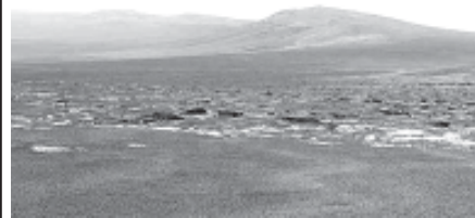
A portion of the west rim of Endeavour crater sweeps southward in this colour view from NASA's Mars Exploration Rover Opportunity.