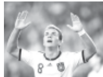
Germany's midfielder Mario Goetze celebrates scoring during their international friendly football match against Brazil at the Mercedes-Benz Arena in Stuttgart, southern Germany.

After a goalless first 45 minutes, a second-half penalty by Bayern Munich's Bastian Schweinsteiger and a super individual effort