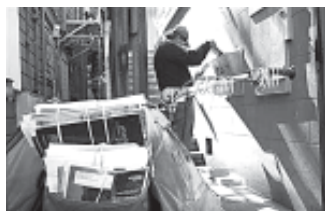
A mail carrier makes his rounds in the Cow Hollow neighbourhood in San Francisco, California on 20 March, 2009.

The agency sees online services and digital advertising as keys to survival, but many of those ideas are in their infancy and would face competition from Google Inc and Apple Inc and others for both customers and developers.