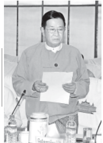
Union Minister for Rail Transportation U Aung Min gives a report.