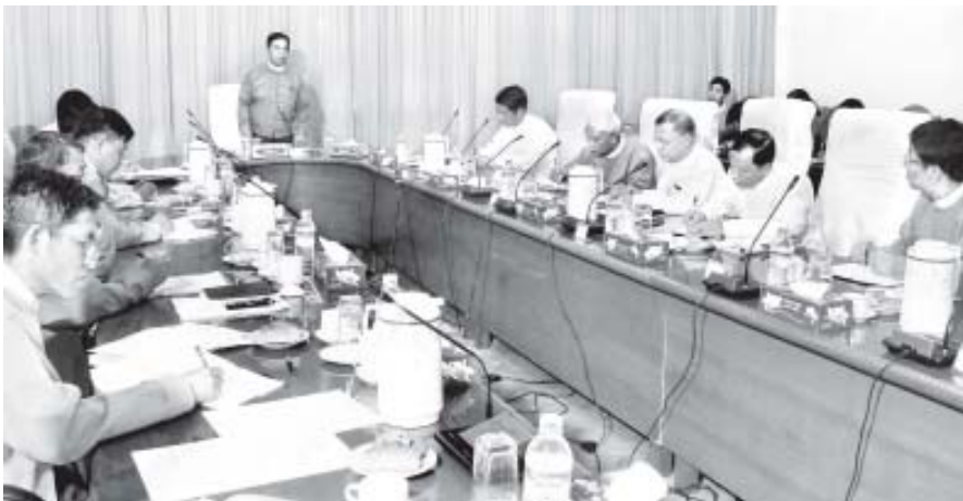
Union Minister for Labour U Aung Kyi addresses first coordination meeting of Overseas Employment Supervisory Committee.