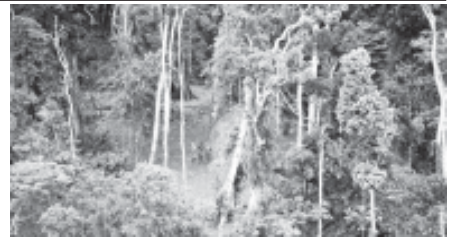
A picture released by Survival International shows indigenous people in the Brazilian Amazon forest, close to the country's border with Peru. Officials in Brazil have said they had no news of an isolated tribe of Amazonian natives who may have been attacked by suspected Peruvian drug traffickers, amid fears of a bloodbath.

In January, Brazil allowed the release of rare photographs of the natives — astonishing images taken by FUNAI showing adults and children peering skyward with their faces dyed reddish-