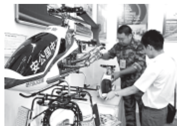
A visitor watches an unmanned police helicopter at an exhibition of police equipments used for criminal investigation, drug control and anti-terrorism in Beijing, capital of China, on 10 Aug, 2011. Over 230 companies producing police equipments participated in the three-day exhibition which kicked off here on Wednesday.—XINHUA