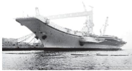
File photo of China's refitted aircraft carrier. The aircraft carrier left its shipyard at Dalian Port in northeast Liaoning Province on Wednesday morning to start its first sea trial.

The Russian expert pointed out it could be hard to make a aircraft carrier into a feasible combat ship.