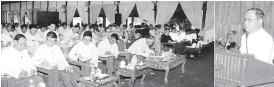
Chief Minister of Ayeyawady Region U Thein Aung addresses coordination meeting on rural development and poverty alleviation.