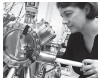
Australian professor Michelle Simmons observes the world's smallest quantum transistor in Sydney in 2010.

"Sophisticated machines might have an overall footprint comparable to a regular desktop PC."—Internet