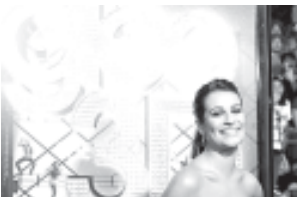
Actress Lea Michele arrives at the premiere of the feature film "Glee: The 3D Concert Movie" in Los Angeles on 6 Aug, 2011. The film opens in theaters on 12 Aug.