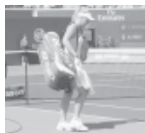
Caroline Wozniacki of Denmark