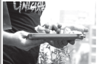
A man carries a hot dog tray during a hot dog eating competition in New York City, in July 2011.—INTERNET

"The good news is that such troubling risk factors can be offset by swapping red meat for a healthier protein." The data for the study came from questionnaire responses from more than 204,000 people in US nurses and health professionals' studies.—Internet