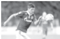
Schalke 04 coach Ralf Rangnick, pictured in action in January 2011, said on Wednesday.

MUNICH, 11 Aug—Schalke 04 coach Ralf Rangnick said on Wednesday Dutch international striker Klaas-Jan Huntelaar is not for sale despite a report Russian first-division club Rubin Kazan are willing to pay 14 million euros for him.