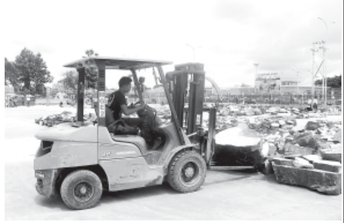
A worker drives a fork-lift to display low-grade utility jade stones to be sold at the Low-Grade Utility Jade Sales at Mani Yadana Jade Hall.—MNA

He added that the sale would help improve the finished jade jewellery market and create jobs in the nation; previous to the sale, gems mining companies had to rely on the gems emporiums at which exhibits were sold only by foreign currency; that the sale would ease the