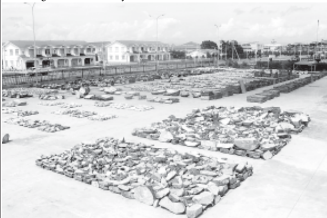
Low-grade utility jade stones are displayed to be sold at the Low-Grade Utility Jade Sales at Mani Yadana Jade Hall.

jade and nanjade are large in size, but are priced low. So, it is needed to organize separate sales for them. Only then will it be possible for national entrepreneurs to recoup their capitals gems mining and sales and go on their businesses.