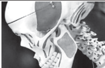
File photo shows a medical students' skeleton.

"When we realized it was real, we wanted to do right by this poor person, but we didn't know how, so we phoned the hospital and they suggested we bring it to the police," she told the newspaper.—Internet