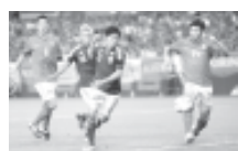
Japan's forward Shinji Kagawa (C) scores a second goal against South Korea during their international friendly match in Sapporo.

Kagawa, who broke a metatarsal bone against South Korea at the Asian Cup in January and missed the rest of the season as a result, avenged it by opening the scoring in the 35th minute.