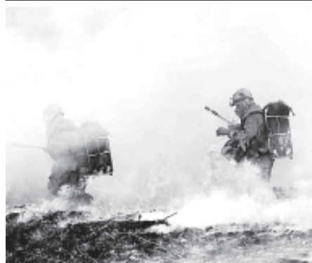
Fire fighters cross the fire line during a forest fire drill held in Dahinggan Mountains, northeast China's Heilongjiang Province, on 9 Aug, 2011. A forest fire drill was held there on Wednesday to test different fire fighting tactics and rescuers' skills.