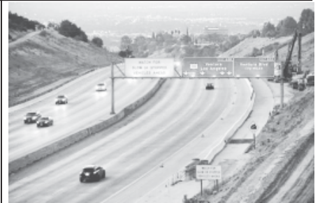
Traffic is sparse as it flows northbound towards the San Fernando Valley on Interstate 405, during the 11 miles shut down of Interstate 405 in Los Angeles on 15 July, 2011.