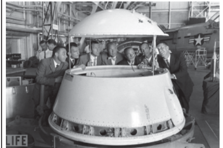
The original Mercury 7 astronauts (from left: Gus Grissom, Deke Slayton, Gordon Cooper, John Glenn, Scott Carpenter — the man who spoke the famous and moving words, “Godspeed, John Glenn,” during the countdown before Glenn’s 1962 orbital flight — Alan Shepard, and Wally Schirra) inspecting an early design of a space programme module.