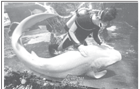
A diver takes care of a three-meter nurse shark presented by Taipei Sea World in 2002. The shark was rescued from a local fisherman after its dorsal fin was cut off at Ilan harbor, northern Taiwan. Taiwan, one of the world's major shark catchers, announced plans to tighten measures against hunting the ocean predator for its fin, the island's top fisheries official said.