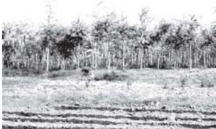
Photo shows thriving Thanatka plants on a commercial scale in the farm.