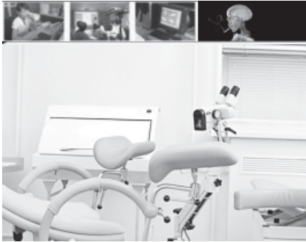
STD rate twice as high in older women: US study.—INTERNET