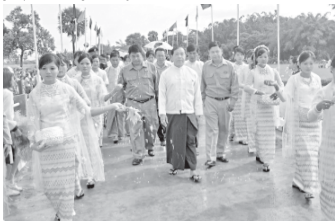
Mon State Chief Minister U Ohn Myint strolls along self-reliant new bridge in Kawparan Model Village in Mudon Township.—MNA