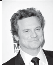
'The King's Speech' star Colin Firth.