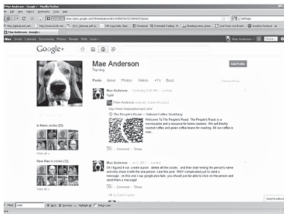
This screen shot shows a page from Google Plus. As the online world turns social with Facebook leading the way, Google's new Plus service represents its best shot yet at muscling into a market that has threatened to topple the Internet search leader.