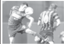
Club America defender George Corral (34) tries to control the ball against Manchester City Blues forward Edin Dzeko (10) in the first half of a soccer match, in San Francisco.

SAN FRANCISCO, 17 July—Ryan McGivern and Shaun Wright-Phillips scored first-half goals and Manchester City kicked off its North American tour with a 2-0 win over Club America in the World Football Challenge on Saturday night. Goals