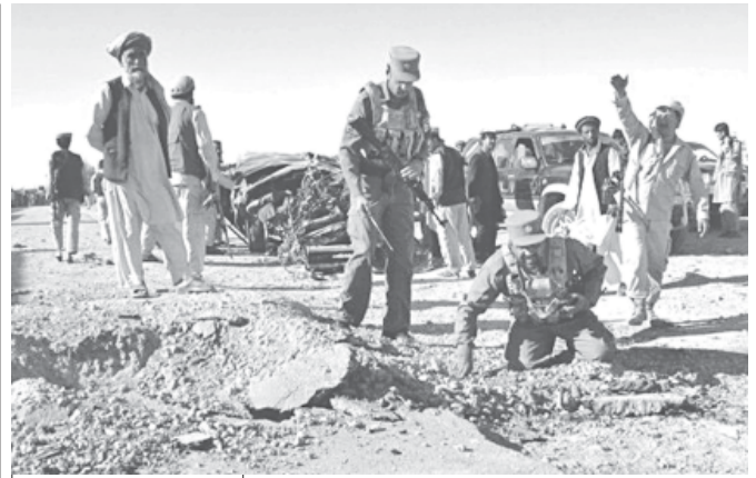
Afghan police officers inspect the site of a blast in the central province of Ghazni, Afghanistan recently. Two roadside bomb attacks on Saturday killed four private security guards escorting supply convoys for a NATO base in eastern Afghanistan, a police chief said.

Police have launched an investigation to find out who attacked the ceremony in Baghlani Jadid District in the northern Province of Baghlan, an area where