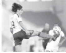
Colombian forward Radamel Falcao controls the ball.

SANTA FE, 17 July—Peru had a hero in Juan Vargas and Colombia had a villain in Radamel Falcao on Saturday as Italy-based Vargas scored while Porto's Falcao missed a penalty to send the Peruvians into the Copa America semi-finals. "Falcao never misses a penalty — not even in training," said Colombia's