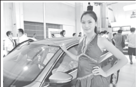
A model poses beside a Volkswagen car at the 3rd Hohhot International Auto Trade Show in Hohhot, capital of north China's Inner Mongolia Autonomous Region, on 16 July, 2011. Some 40 exhibitors brought more than 300 vehicles to the 3rd Hohhot International Auto Trade Show which is held from 15 to 19 July, 2011.

The Victorian police decided not to press charges against the mum, but the Department of Human Services is continuing its investigation into the family, and there is possibility that the woman's children could be taken into permanent care.