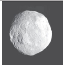
This picture provided by NASA shows an image obtained by NASA's Dawn spacecraft of the giant asteroid Vesta with its framing camera on 9 July.

After a year of observations and measurements around Vesta, Dawn will depart for its second destination, the dwarf planet Ceres, in July 2012. It will be the first craft to orbit two solar