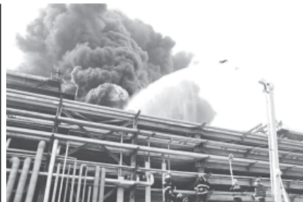
Firefighters spray water to extinguish fire in Dalian, northeast China's Liaoning Province, on 16 July, 2011.