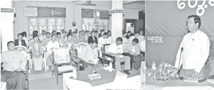
Union Minister for Finance and Revenue U Hla Tun meets with staff of departments and enterprises under the ministry at the district manager office of the Myanmar Economic Bank in Pakokku.