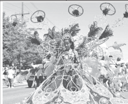
A girl participates in the 2011 Junior Carnival Parade in Toronto, Canada, on 16 July, 2011.—XINHUA

However, the researchers believe that if the "diagnostic threshold" were to be lowered, the result would be a dramatic rise in false positive diagnoses. The results have been published in the current edition of Deutsches Arzteblatt International.—Internet