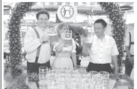
Visitors cheer as the first Beijing International Beer Festival opens in Beijing, capital of China, on 16 July, 2011.