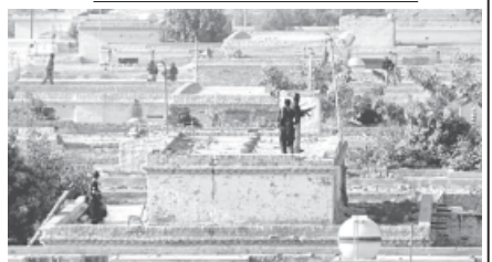
Pakistani policemen take positions during an operation against prisoners at Central Jail in Pakistan's southern city of Larkana on 17 July, 2011.—XINHUA

An estimated 70 prisoners later surrendered to the police while the other rebellious prisoners are still holding the hostage of five jail officials.—Xinhua