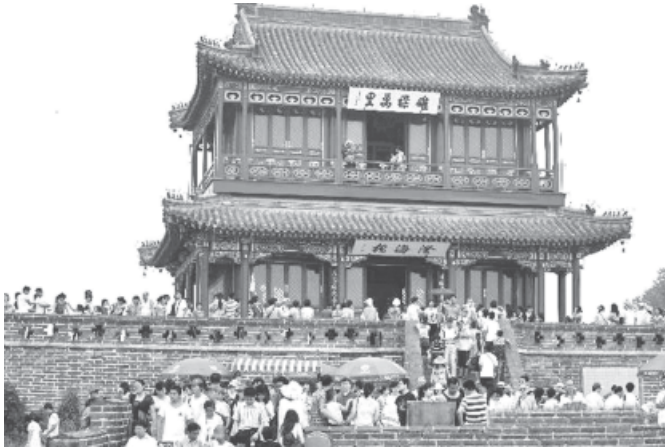
Tourists visit the Laolongtou scenic spot in Qinhuangdao City, north China's Hebei Province, on 16 July, 2011. As summer comes, Qinhuangdao City, which owns many famous scenic spots, enters a busy season of tourism.