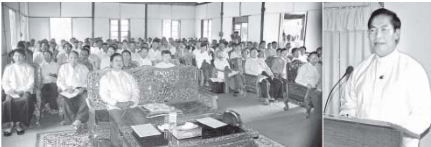
Union Minister for Cooperatives U Ohn Myint meets horticulturists, members of township cooperative syndicates and enthusiasts in Mudon.