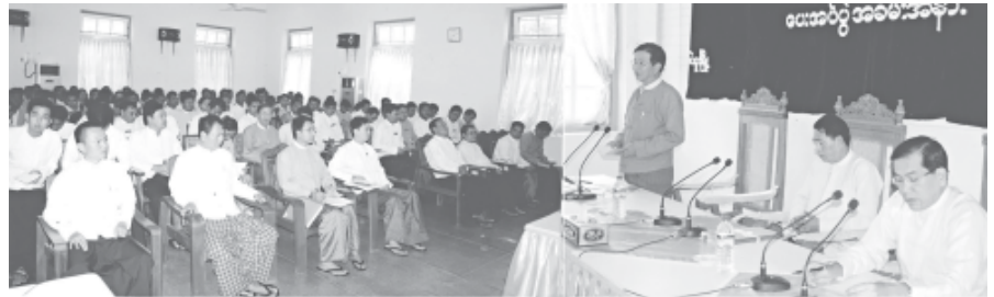
Union Minister for Rail Transportation U Aung Min explaining loan disbursement at the ceremony.

NAY PYI TAW, 17 July—A ceremony to disburse small loans by Subcommittee for development of microfinance institutions of Bago Region was held at Bago Region Government Office yesterday morning. At the ceremony, Union Minister for Rail Transportation U Aung Min explained loan disbursement, Bago Region Chief Minister U Nyan Win and Pyithu Hluttaw Representative U Soe Tha, tasks for rural development and poverty alleviation.