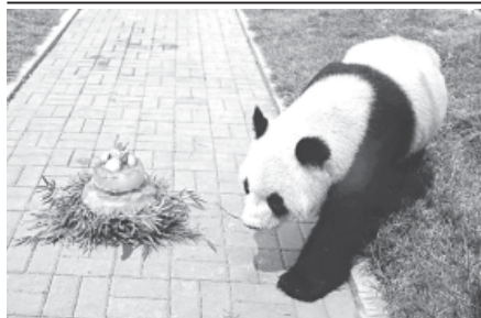
Giant panda Hua Ao walks to his birthday gift, an ice "cake" with fruit frozen inside, during its 4-year-old birthday party in Nanshan Zoo of Yantai City, east China's Shandong Province, on 16 July, 2011. More than 400 visitors witnessed the birthday party here Saturday.