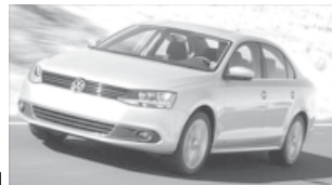
Volkswagen has sold more than 4 million vehicles during the first half of the year, a record for Europe's largest carmaker.

Volkswagen, headquartered in Germany, includes the Skoda, Seat and Audi brands, as well as VW. Its shares rose 1.3% in early trading in Frankfurt. Sales in Asia grew 19% to 1.26m, mostly in China, the region's largest market.