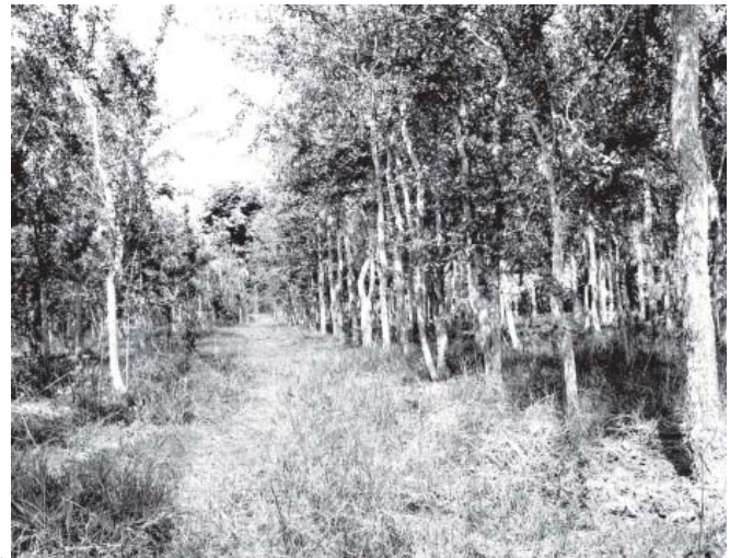
Pakokku Shinmataung Thanatka plants are in a row at the farm in Natchaung Village of Kalay Township.

One year later, Thanatka plants were about five-six feet high. Two years later, the plants were about 10 feet and one inch diameter. The plants were nurtured by pouring water and weeding daily.