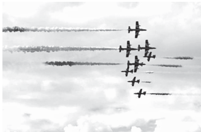
The Italian Freccie Tricolori aerobatic demonstration team performs on the Royal International Air Tattoo (RIAT) in Fairford, Britain, on 16 July, 2011. The annual RIAT, one of the world's largest military air show, is held from 16 to 17 July.