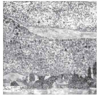
The work — Litzberg am Attersee in German — depicts a lake in Austria.