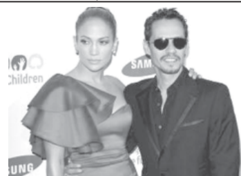
Jennifer Lopez and Marc Anthony

"We have decided to end our marriage," the former couple told People exclusively in a joint statement. "This was a very difficult decision. We have come to an amicable conclusion on all matters. It is a painful time for all involved and we appreciate the respect of our privacy at this time." No reason was given for the breakup.—Internet