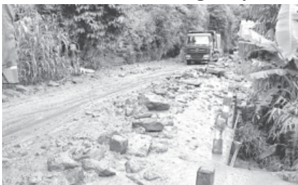
A heavy truck runs on a muddy road after landslide in Nujiang Lisu Ethnic Autonomous Prefecture, southwest China's Yunnan Province, on 16 July, 2011.

KUNMING, 17 July—Traffic has resumed on a highway in Yunnan Province that was blocked by a rain-triggered mudslide Saturday morning, stranding more than 800 people and 300-odd motor vehicles, according to local traffic police.