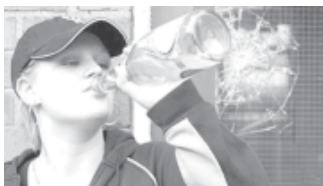
Adolescent girls could be risking damage to their brains if they binge drink.

NEW YORK, 17 July—Teenagers especially girls — who binge drink could be damaging the part of their brain which controls memory and spatial awareness, say Californian researchers. Young women's brains are particularly vulnerable to harm from alcohol because they develop