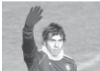
Manchester City's Argentinian forward Carlos Tevez

SAO PAULO, 17 July—Brazilian outfit Corinthians on Saturday said they had upped their offer to lure Manchester City's Argentinian forward Carlos Tevez back to Sao Paulo. With City holding out for more than the 40 million euros ($63.57 million) the Brazilians have offered, the latter have suggested paying a sum of bonuses to