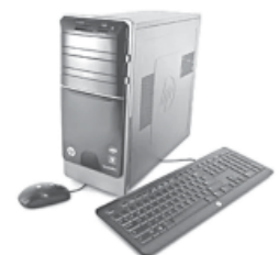
The HP Pavilion p7-1010 is a very affordable desktop system offering a quad-core processor and tons of storage space.—INTERNET

NerdBerry didn't provide any pictures of the rumored media box, but did say it "looks like a larger version of BlackBerry Presenter," a BlackBerry smartphone accessory that lets users present Microsoft PowerPoint slides wirelessly from their phones (pictured above left). RIM has been struggling of late with lower-than-expected sales of its smartphones and the sluggish start for its first tablet device, the BlackBerry PlayBook. The company has been sharply criticized by analysts and media in recent weeks, and if RIM does release the rumored media box, it can probably expect a lot of doubters to question that strategy.—Internet