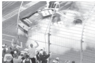
Fans cheer as NASCAR driver Kyle Busch does a burnout after winning the NASCAR Nationwide Series New England 200 auto race for his 100th career win on 16 July, 2011, at New Hampshire Motor Speedway in Loudon, NH.

LONDON, 17 July — Kyle Busch grabbed a souvenir for the victory lap he'd perfected 99 times before: A white "100" flag that rippled out the window of the No. 18 Toyota, one special number