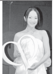
Actress Zhou Xun from the Chinese mainland poses for photos at a press conference held by a cosmetic brand which she endorses in Taipei, southeast China's Taiwan, 15 July, 2011.

"She was cooking one the other day when I was around, but it looks so difficult! I'm going to give it a go though," she added.—Internet