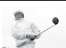
Rickie Fowler of the US