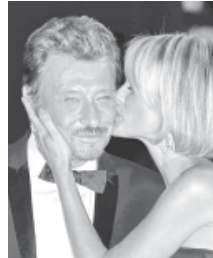
Rocker/actor Johnny Hallyday receives a kiss from his wife Laetitia after a screening of the film "Vengeance" at the 62nd annual Cannes Film Festival in Cannes, France.