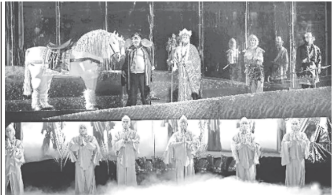
Actors perform in the drama "Pilgrimage to the West" during the opening ceremony of the First China Children's Theatre's Festival in Beijing, capital of China, 16 July, 2011. A total of 39 domestic and foreign dramas will be presented to Chinese children during the festival which kicked off on Saturday and will last until 28 Aug.