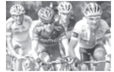
Cadel Evans (pictured, 2L) has hit back at the Schleck brothers Andy and Frank (R).