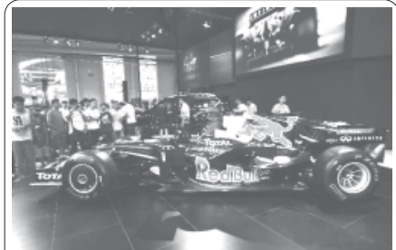
Photo taken on July 17, 2011, shows a racecar of Austrian Formula One racing team Red Bull Racing exhibited at the 8th China Changchun International Auto Expo, in Changchun, capital of northeast China's Jilin Province. The only Formula One racecar at the 8th China Changchun International Auto Expo attracted great attention on Sunday.