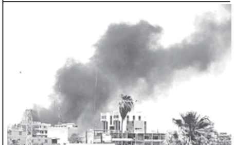
Smoke rises from the site of a bomb attack in Baghdad on 16 July, 2011. A parked car bomb targeting a night club killed two people and wounded nine others in central Baghdad, police and hospital sources said. Another police source said only six people were wounded by a roadside bomb.—INTERNET

The press release, however, did not identify the exact place of the incident and the nationality of the victim, saying that it is ISAF policy to defer casualty identification procedures to the relevant national authorities.— Xinhua