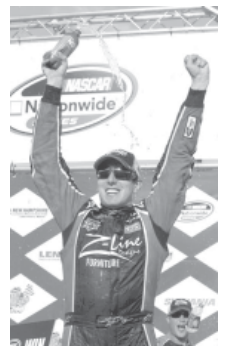
NASCAR driver Kyle Busch celebrates his victory in the NASCAR Nationwide New England 200 on 16 July, 2011, in Loudon, NH.