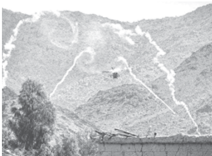
A coalition helicopter fires flares around a building believed occupied by Taleban fighters in Kuz Kunar, Nangarhar province east of Kabul, Afghanistan on Sunday, 17 July, 2011. Afghan and NATO officials say at least 13 insurgents have been killed in eastern Afghanistan after gunbattles and a coalition airstrike against a building occupied by Taleban fighters.