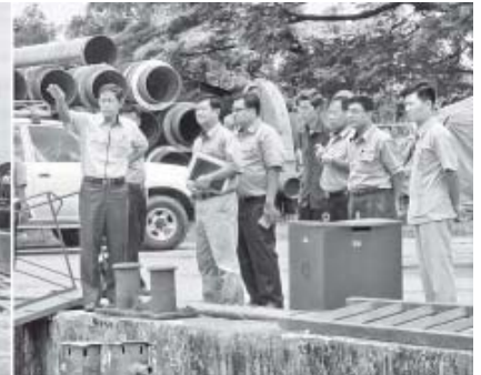
Union Minister for Energy U Than Htay inspects tasks of Thakayta Offshore Base of MOGE.