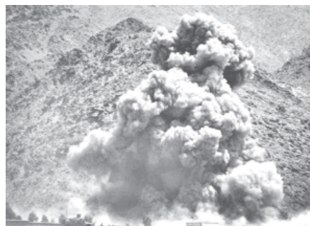
Smoke rises after a coalition air strike against a building believed occupied by Taleban fighters in Kuz Kunar, Nangarhar province east of Kabul, Afghanistan on Sunday, 17 July, 2011.