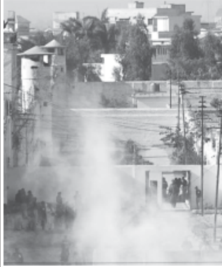
Smoke rises from Central Jail during an operation against prisoners in Pakistan's southern city of Larkana on 17 July, 2011. At least one policeman was killed and five others were held hostage by prisoners in the jail, reported local TV channel Express on Sunday.

According to the local media reports, the riot broke out among the prisoners in Larkana Central Jail in protest against an operation to move 200 prisoners to other jails. The prisoners refused to be moved because they were afraid it would cause trouble and inconvenience for their family members to visit them.