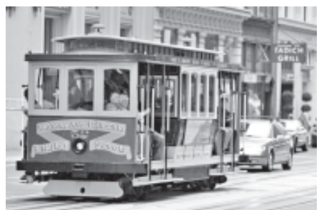
A cable car makes its way past the Tadich Grill on California Street in San Francisco, on 27 June, 2011. The popular San Francisco cable car line is back in business Monday following a six-month rehabilitation project.