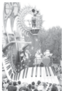
Cartoon characters are seen during a parade to celebrate "Tanabata" or the Star Festival at the Tokyo Disneyland in Urayasu city, suburban Tokyo on 1 July, 2011. In oriental mythologies, the two lovers, Altair and Vega, who are separated by the Milky Way on most days of the year, meet once a year on 7 July.