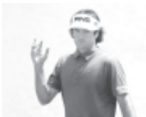
Bubba Watson of the US

ropes." Watson has won two titles this year but rarely plays in Europe. He was apparently affected by the permissive culture in France that allows spectators to snap photos and record videos during play. "I'm not used to that," Watson said.— Xinhua