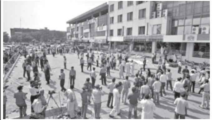
Pakistani security officials and media gather at the site of a suicide bombing in Islamabad, Pakistan, recently. A suicide bomber blew himself up at a busy market in the Pakistani capital, killing at least one person in the first bombing in Islamabad in over a year and a half, police said.

Cluster bombs are air-dropped or ground-launched explosive weapons that eject many small bomblets over a wide area. Hereby, they pose risks to civilians both during the explosion and afterwards.—Xinhua