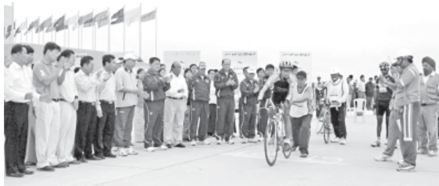
Chairman of Myanmar National Sports Committee Union Minister for Sports U Tint Hsan enjoyed 57 th Myanmar Cycling Federation President's trophy National Cycling Championship (Men's and Women's) at Myanmar International convention Centre on 2 July.