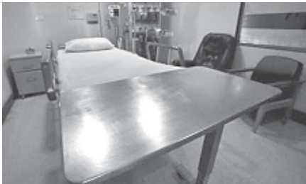
A copper bedside table is seen at the Copper Hospital in Calama city.