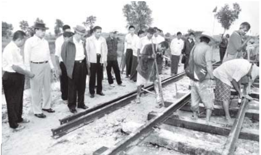
Union Minister for Rail Transportation U Aung Min inspects railway workers laying rail tracks.—MNA

On arrival at Sakkawt Station on Zalun-Sakkawt-Nyaungdon railroad section of Hinthada-Nyaungdon railroad construction project near Sakkawt Village in Nyaungdon Township, the Union Minister viewed construction of the station and laying rail tracks in the station yard.—MNA