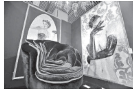
Photo taken on 1 July, 2011 shows a blossom-shaped sofa at a furniture exhibition in Beijing, capital of China. The exhibition will last until 10 July, showcasing all the designs exhibited during the Milan Furniture Fair held this April in Italy.