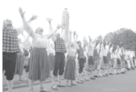
Young people in traditional clothes perform during the Youth Dance and Song Festival in suburb of Tallinn, capital of Estonia, on 1 July, 2011. The triennial festival, one of the country's biggest traditional cultural celebrations, kicked off on Friday, attracting tens of thousands of young performers and visitors from all over the country. — XINHUA