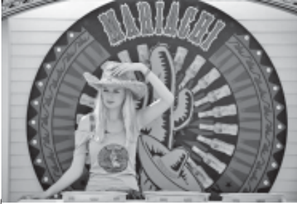
An attendant prepares entertainments for festival goers at the festival garden in Istanbul, Turkey, on 2 July, 2011. The two-day open-air Efes Pilsen One Love Festival started on Saturday in Istanbul.