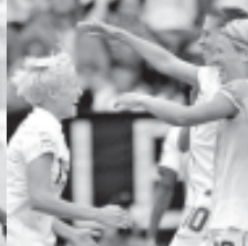
United States' Megan Rapinoe, left, is celebrated by teammates after she scored her side's 2nd goal during the group C match.