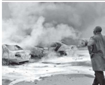
A man looks at burnt out cars, at the parking lot of the police headquarters, following an explosion, in Abuja, Nigeria on 16 June, 2011. A suicide bombing in the parking lot of police headquarters in Nigeria's capital Thursday has killed two people, police said.