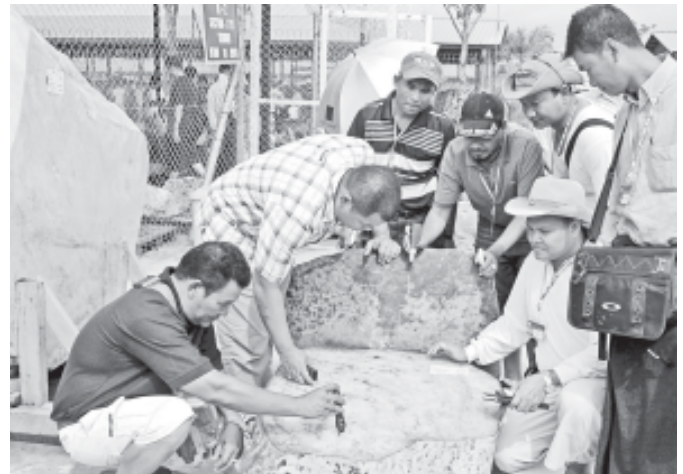
Local and foreign gems merchants at Special Sale of Jade, Gems and Pearls 2011.

Local and foreign gems merchants viewing jade lots at Special Sale of Jade, Gems and Pearls 2011.