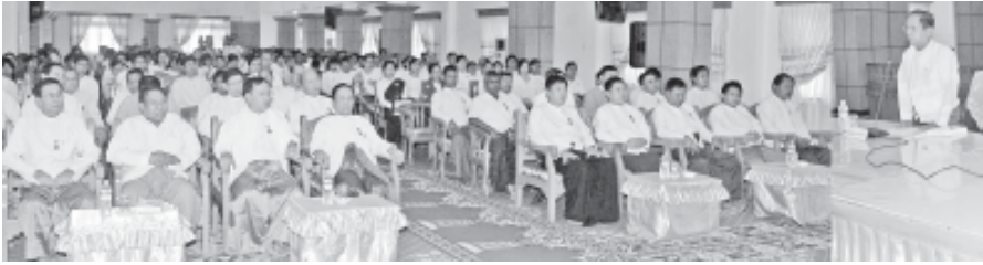
Union Minister for Religious Affairs Thura U Myint Maung addresses opening of Buddhist Culture Teachership Course 1/2011.