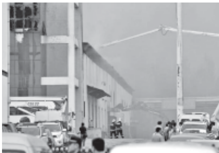
Photo taken on 2 July, 2011 shows the scene of a fire in Shuanghui Beidahuang Food Co, Ltd in Harbin, capital of northeast China's Heilongjiang Province. A fire took place at a workshop of Shuanghui Beidahuang Food Co, Ltd on Saturday morning, causing one dead and more than 400 workers evacuated. The fire was put out and the cause is under investigation.

Rescue workers said the fire was likely caused by overheated machinery. The cause of the fire is still under investigation.