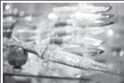
Photo taken on 28 June, 2011 shows knives at Russia's exhibition booth during an exhibition which marks the 20th anniversary of CIS (Commonwealth of Independent States) in Moscow, Russia.