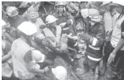
Bangladeshi firefighters retrieve a dead body in Chittagong, on 1 July.