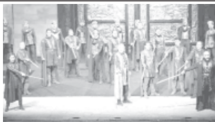
Actors perform on the first day of the 2nd International Istanbul Opera Festival in Istanbul, Turkey, on 1 July, 2011. The festival will last until July 21, hosting 19 opera shows at open air theaters and historic venues.