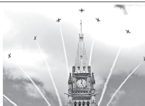
Snowbird Jets of the Canadian Air Force fly overhead during the 144th Canada Day celebrations on Parliament Hill in Ottawa, Canada, on 1 July, 2011. XINHUA

“HAL catches these signals through a sensor attached on the skin of the wearer. Based on the signals obtained, the power unit is controlled to wearers’ daily activities,” it added.— Xinhua