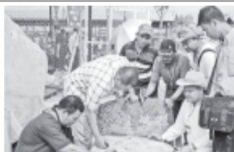
Local and foreign gems merchants at Special Sale of Jade, Gems and Pearls 2011.