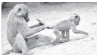
Baboons are said to be social creatures and not aggressive toward humans.