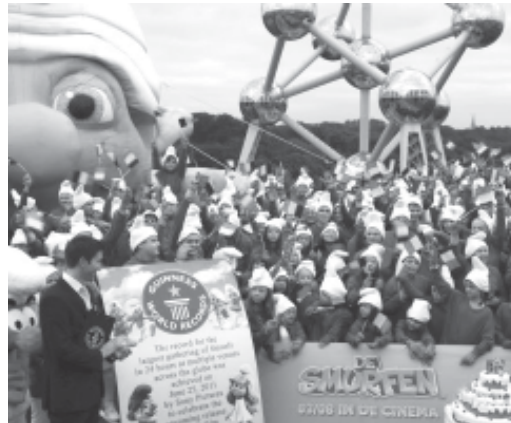
People dress as Smurfs pose for pictures in Brussels, Belgium on 25 June, 2011. A total of 4617 people from 12 countries took part in the simultaneous Smurf gatherings in Brussels attempt to break a world record.

White Siberian tigers are a subspecies of endangered Bengal tigers, the state-run news agency says. Two hundred to 300 white tigers live in captivity in China.