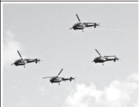
The rescue helicopters of Austrian Air Force perform during the AirPower11 airshow in Zeltweg in central Austria on 1 July, 2011. 200 aircrafts from more than 20 countries took part in the event.