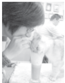
A girl plays with a cat at the Ningjing Cat Cafe in Shanghai.

"My daughter fell in love with cats when she