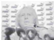
Thailand officially signed Germany's Winfried Schaefer, as coach for its national football team on a three-year contract.

Schaefer, 61, led Cameroon to victory in the 2002 African Nations Cup. He has also coached