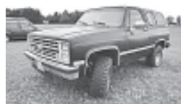
GM's June Sales Show Stronger Retail And Commercial Demand.