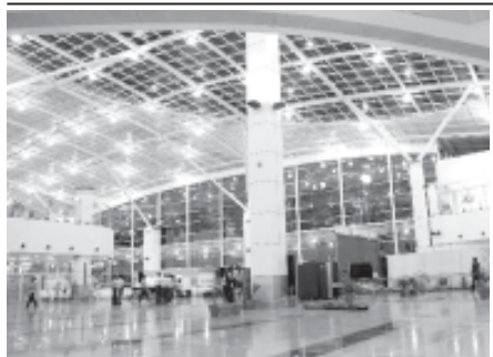
The photo taken on 28 June, 2011 shows the interior view of the newly integrated terminal building of Raja Bhoj international airport in Bhopal, capital of Madhya Pradesh state of India. This is the 18th international airport terminal of the country.