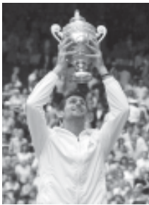
Serbian player Novak Djokovic poses with the trophy after beating Spanish player Rafael in the men's single final at the Wimbledon Tennis Championships.

WIMBLEDON, 3 July— Novak Djokovic has won his first Wimbledon title, and he beat defending champion Rafael Nadal to do it. Djokovic was already guaranteed to take over the No. 1 ranking from the Spaniard on Monday. He extended his mastery over Nadal this season with a fifth straight head-to-head victory Sunday, winning 6-4, 6-1, 1-6, 6-3.