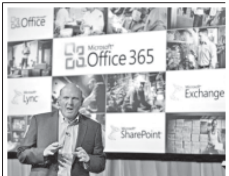
Microsoft CEO Steve Ballmer speaks at the launch of the company's Microsoft 365 cloud service in New York.