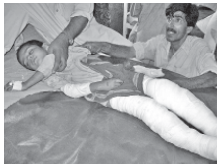
File photo shows an injured child in car bomb exploded in front of the high court building of Pakistan's Northwest Frontier Province recently, injuring nine people.

The US Drug Enforcement Administration describes Los Zetas as exceptionally violent and believed to be responsible for hundreds of deaths in Mexico and as far south as Guatemala. The DEA says the group was founded by deserters from the Mexican army.—Internet