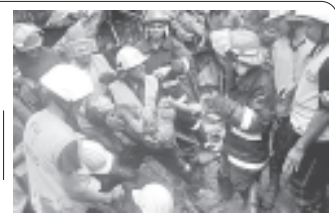
Bangladesh landslide toll rises to 17