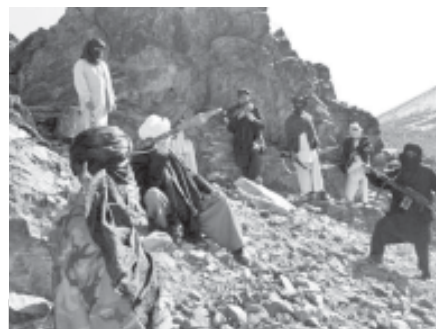
File picture shows Taliban fighters during a patrol in Ghazni Province. The Taliban has targeted top government officials in Afghanistan, killing seven people in a suicide car bombing and firing rockets at the vice president and interior minister, who escaped unhurt.