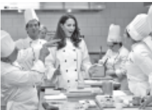
Catherine, Duchess of Cambridge, reacts during a cooking workshop at the Institut de tourisme et d'hôtellerie du Quebec in Montreal 2 July, 2011. Prince William and his wife Catherine are on a royal tour of Canada from 30 June to 8 July.