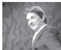
Comedian Martin Short will be joining the cast of the hugely successful sitcom 'How I Met Your Mother.'