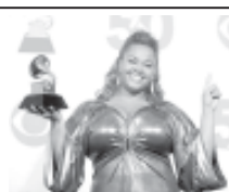
Jill Scott, whose album 'The Light of the Sun' topped the Billboard charts.

LOS ANGELES, 30 June—The eight final contestants from the US vocal competition series "The Voice" have been booked for a six-date concert tour, NBC announced. Sprint