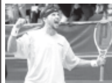
New captain Pat Rafter on Thursday warned his Australian team not to be complacent against China in their Davis Cup Asia/Oceania second round tie in Beijing next month.

LONDON, 30 June — New captain Pat Rafter on Thursday warned his Australian team not to be complacent against China in their Davis Cup Asia/