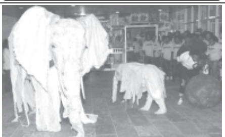
Actors imitate elephants in the opening ceremony performance of South Africa's National Arts Festival at Grahamstown of Eastern Cape, South Africa, on 29 June, 2011. The National Arts Festival of South Africa opened on Wednesday at Grahamstown, providing a cultural feast to local people and guests.