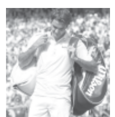
Switzerland's Roger Federer leaves the court after being defeated by France's Jo-Wilfried Tsonga in their match at the All England Lawn Tennis Championships at Wimbledon, on Wednesday.

Facing a younger, quicker and better-serving opponent, Federer failed to make his big lead stand up and lost 3-6, 6-7 (3), 6-4,