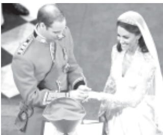
Prince William places the ring on the hand of Kate Middleton, who is the 11th cousin of author Jane Austen.