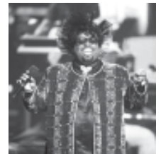
Cee-Lo Green wears a Patti LaBelle wig while performing a tribute to the Lifetime Achievement award winner LaBelle during the 2011 BET Awards at the Shrine Auditorium in Los Angeles on 26 June, 2011.