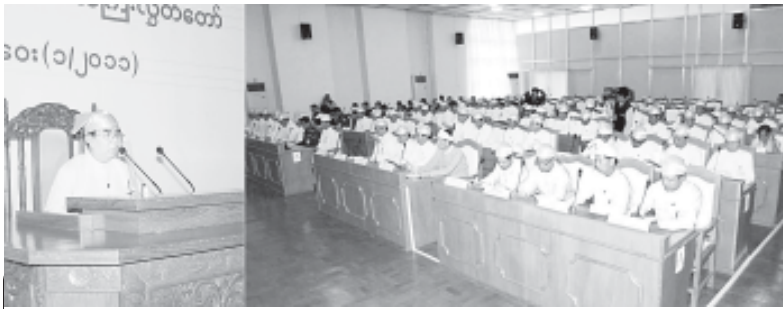
First Day session of First Special Meeting (1/2011) of Mandalay Region Hluttaw in progress.