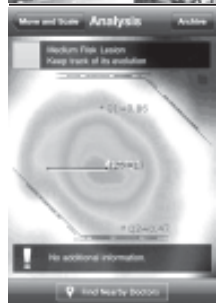
A new app, Skin Scan, claims to help diagnose life-threatening melanoma.