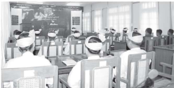
First Day session of First Special Meeting (1/2011) of Kayah State Hluttaw in progress.

The meeting came to an end at 10.15 am. —MNA