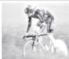
Australia's Cadel Evans, seen here in April 2011, said he's determined to build on his impressive season so far to relaunch his bid for the elusive Tour de France yellow jersey.