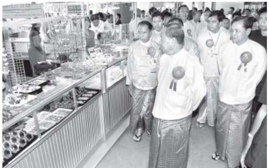
Vice-President Thiha Thura U Tin Aung Myint Oo at gems and jewellery shops in Jade, Gems and Pearl Special Sales at Mani Yadana Jade Hall.

On the First Floor of Mani Yadana Jade Hall, the