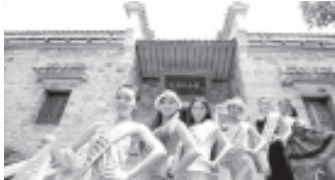
Contestants pose at the regional final of 51st Miss International China in Xingshan County, central China's Hubei Province, on 29 June, 2011. Some 32 people participated in the competition in Hubei on Wednesday.