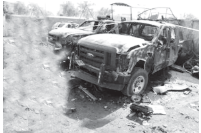
Photo shows a damaged car at the site of a bomb attack in Basra, 550 km (342 miles) south of Baghdad recently. A suicide bomber blew up an explosives-filled vehicle at the entrance to a police unit in Iraq’s southern oil port of Basra, killing five people and wounding 15, police and officials said.