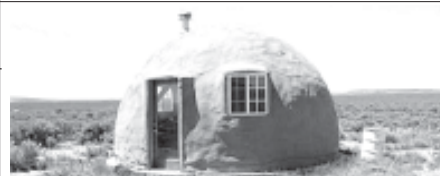
A 20-foot diameter dome home in Taos, NM. This teeny-tiny dome — measuring 20 feet in diameter — sits on a whopping ten acres in Taos, New Mexico. Like many other dome homes, it was built with a kit and an additional kit is also available for sale with the property. Located twenty minutes outside of town, this dome is better suited as a little getaway home rather than a primary residence.