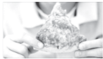
Foods like pizza are energy dense.

categorised as obese. A team from the University of North Carolina analysed data from food surveys carried out in the seventies, eighties, nineties and the last decade. The surveys record all food and drink a person consumes over a 24-hour period.