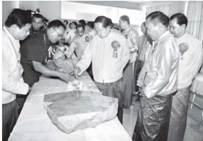
Vice-President Thiha Thura U Tin Aung Myint Oo inspects quality jade lots on the first floor of Mani Yadana Jade Hall.

Altogether 4310 foreign merchants from 1609 foreign companies of 13 countries and not less than 4065 gems merchants of 950 local companies will reportedly attend the sales that is the third of its kind held in Nay Pyi Taw.