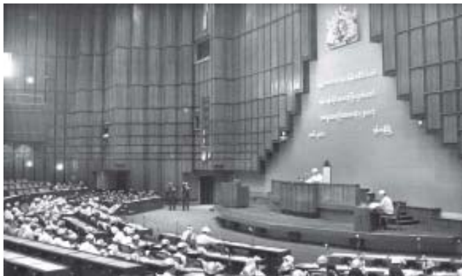
The second-day First Yangon Region Hluttaw special meeting (1/2011) in progress.—MNA

NAY PYI TAW, 30 June—The special meeting (1/2011) of Yangon Region Hluttaw went on for the second day at its meeting hall this morning.