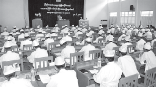
Third day of the Special Session 1/2011 of Sagaing Region Hluttaw in progress.

NAY PYI TAW, 30 June—The third day of the Special Session 1/2011 of Sagaing Region Hluttaw was held at the meeting hall of Sagaing Region Hluttaw this morning, attended by