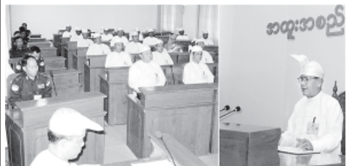
The First Taninthayi Region Hluttaw special meeting (1/2011) in progress.