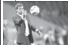
Chelsea manager Andre Villas-Boas

Villas-Boas worked for Mourinho as an opposition scout during his fellow Portuguese's time in charge at Porto, Chelsea