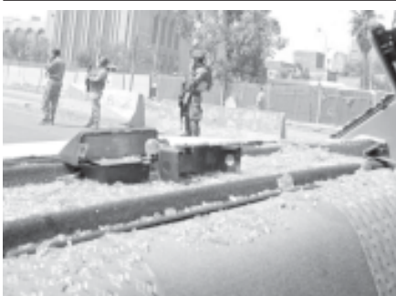
Iraqi security forces, seen through the smashed glass of a damaged vehicle, stand guard at the site of a roadside bomb attack targeting a police patrol that wounded several civilians in central Baghdad, Iraq recently.

A total of 368 civilians were killed in conflicts and Taleban-led militancy in May this year, the deadliest month for Afghan civilians since 2007, the United Nations Assistance Mission in Afghanistan (UNAMA) said in a statement earlier this month.