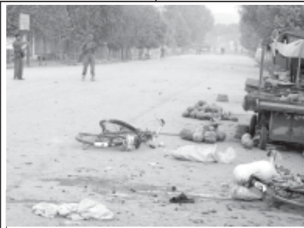
Afghan policemen secure the area after a suicide attack in Khan Abad District of Kunduz Province recently.