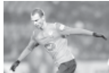
Veteran Czech Republic international defender David Rozehnal, signed a three year contract with French champions Lille on Wednesday from German outfit Hamburg after a successful loan spell with them last season.

has also played for Bruges, Newcastle and Lazio, had said several times that he wanted to stay with Lille. "I am very happy to be able to prolong my story at Lille," said Rozehnal.— Internet