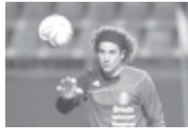
Mexico goalkeeper Guillermo Ochoa the banned substance clenbuterol. He had been linked with Paris Saint-Germain and Greek giants Olympiakos but has reportedly chosen to join Ajaccio in order to prove himself in Europe before moving to a more high-profile club.

Ochoa has 45 caps and represented his country at the World Cups in 2006 and 2010, but was suspended from playing at the recent CONCACAF Gold Cup — which Mexico won — after testing positive for