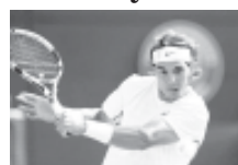
Spanish player Rafael Nadal returns a shot to US player Mardy Fish during the men's single quarter final at the Wimbledon Tennis Championships at the All England Tennis Club in London.