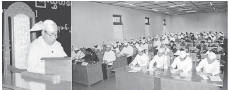
First Day session of First Special Meeting (1/2011) of Magway Region Hluttaw in progress.

The meeting came to an end at 11 am. —MNA