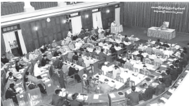
First day of the Special Session 1/2011 of Shan State Hluttaw in progress.—MNA

NAY PYI TAW, 30 June—The first day of the Special Session 1/2011 of Shan State Hluttaw was held at the meeting hall of Shan State Hluttaw this morning, attended by Shan State Chief Minister U Sao Aung Myat, Speaker of the Hluttaw U Sai Lon Hsaing, the deputy speaker, State Ministers and representatives.