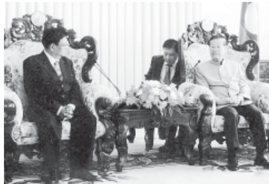
Deputy Minister for Foreign Affairs Dr Myo Myint meets Laotian Deputy Prime Minister Mr Somsavat Lengsavat.

NAY PYI TAW, 30 June—A Myanmar delegation led by Deputy Minister for Foreign Affairs Dr Myo Myint arrived back in Yangon by air yesterday evening after paying an official