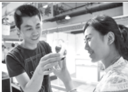
Visitors looks at a bracelet at a cultural exposition in Changchun, capital of northeast China's Jilin Province, 30 June, 2011.