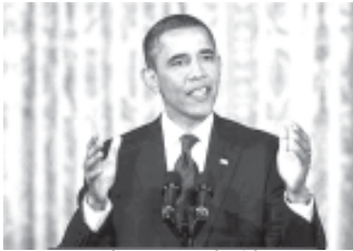
President Barack Obama

WASHINGTON, 30 June—US President Barack Obama said on Wednesday that the drawdown of US military forces from Afghanistan will be done “in a responsible way.”