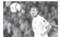
Turkey striker Umut Bulut, is set to join French first division team Toulouse.

since the start of the 2010-11 campaign. The striker, who has made two appearances for his national team, has scored 61 goals in five seasons with Trabzonspor.— Internet