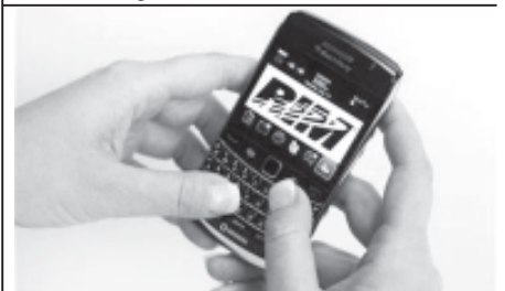
A person poses while using a BlackBerry Bold 2 smartphone made by Research in Motion.

Although there's no time limit for trial players, there's a great deal of other restrictions besides the 20-level limit: Trial players can have a maximum of 100 gold; their trade skills are capped at 100 ranks; they are unable to trade in the Auction House or join guilds; their chat options are limited; they cannot invite other players into a party and so on.— Internet