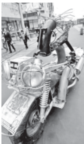
Photo taken on 23 May, 2011 shows an iron artwork at Hai'an cultural industry park in Nantong, east China's Jiangsu Province. An iron art show was staged here on Monday, in which over 20 sculptures made of wasted iron were shown to visitors.