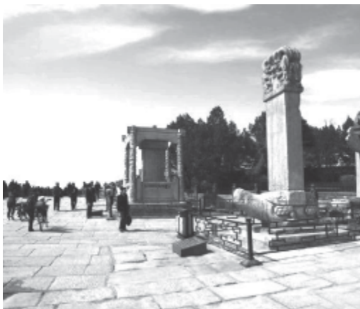
The Lugou Bridge, also known as the Marco Polo Bridge, is a famous stone bridge located 15 km southwest of the Beijing city center across the Yongding River. Situated at the eastern end of the bridge is the Wanning Fortress, a historic 17th century fortress. The Lugou Bridge is well-known because it was highly praised by the Venetian traveler Marco Polo during his visit to China in the 13th century, and for the Marco Polo Bridge incident, which marked the beginning of the Sino-Japanese War (1937-1945).

The epicentre was monitored at 39.8 degrees north latitude and 143.2 degrees east longitude with a depth of 30 km, the centre said.—Xinhua