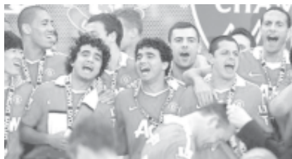
Manchester United players celebrate lifting the English Premier League trophy after their match against Blackpool at Old Trafford in Manchester.—INTERNET

"It is a final, it is a special match given what is at stake. The good memory of Rome is behind us. This will be a totally different match. We are facing a very strong adversary, which has very good players." —Internet