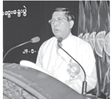
Union Minister for Education Dr Mya Aye speaks at the workshop on promotion of education sector.

pend programmes for the basic and higher education sectors by 2012-2013 academic year. Plans are underway to submit private school registration law and rules to Pyidaungsu Hluttaw to give more room to the private sector in the education sphere. It is required to lay down programmes to improve students' learning abilities, the programmes due to be implemented, and programmes to be implemented in combination to reduce drop-out rates of all standards. Plans to improve teaching skills standard-wise in the basic education sector must be taken into account along with plans to push teachers to take their teaching more seriously.