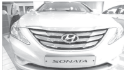
Hyundai has performed well in the US market.

SHIPPING AGENCY DEPARTMENT MYANMA PORT AUTHORITY AGENT FOR: M/S MALAYSIA INTERNATIONAL SHIPPING CORPORATION BERHAD (MISC) Phone No: 256908/378316/376797