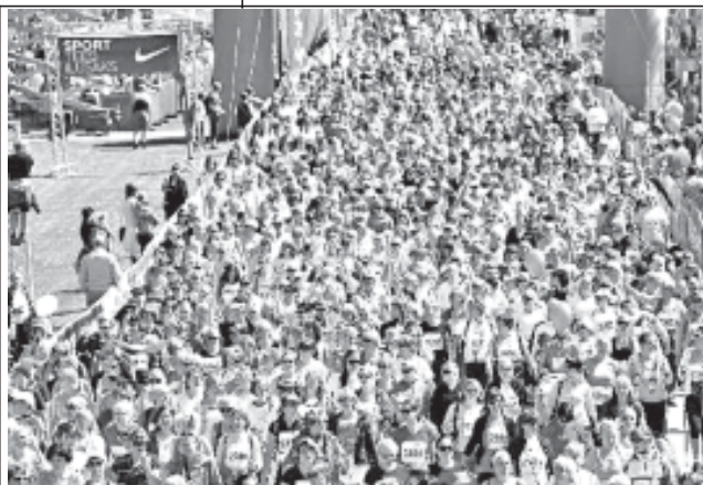
Participants take part in a seven-kilometre race in the suburbs of Tallinn, Estonia, on 21 May, 2011. Some 12,000 women and children participated in the charity activity to raise money for low-income families.

The crash killed all 228 people on board Flight 447, which was on a scheduled flight from Rio de Janeiro to Paris.