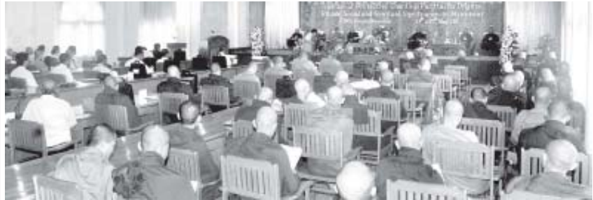
Opening of international conference Theravada on the Tradition of Buddhist Protective Chanting (paritta) International Buddhist Missionary University (Yangon).