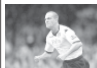
Fulham's English striker Bobby Zamora

Capello has also recalled former captain Rio Ferdinand for the first time this year and he looks set to partner the man who replaced him as skipper John Terry in the centre of defence as Spurs central defender Michael Dawson has been surprisingly left out.—Internet