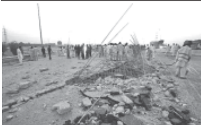
People gather at the blast site near Nowshera, northwest Pakistan, on 23 May, 2011. The Kalpani Bridge on Islamabad-Peshawar motorway near the Rashakai area in Nowshera was blown up on Monday evening by a bomb placed under the bridge.