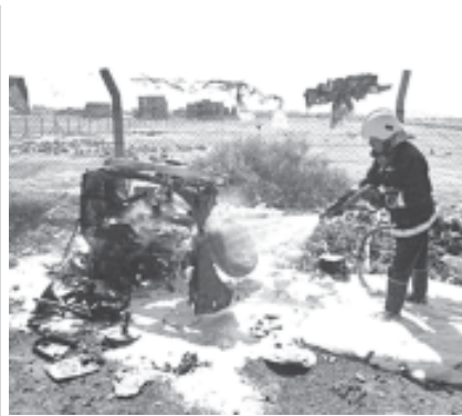
A fire fighter works at the scene of a car bomb attack in Kirkuk, 290 kilometers (180 miles) north of Baghdad, Iraq, on 23 May, 2011. Iraqi police say a car bomb has exploded in a northern city that is rife with ethnic tensions, killing and wounding several bystanders.