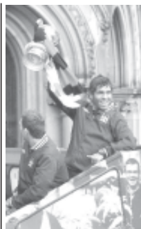
Manchester City's Carlos Tevez (R) holds up the FA Cup during the soccer team's victory parade to celebrate their FA Cup win, Manchester, northern England on 23 May, 2011.