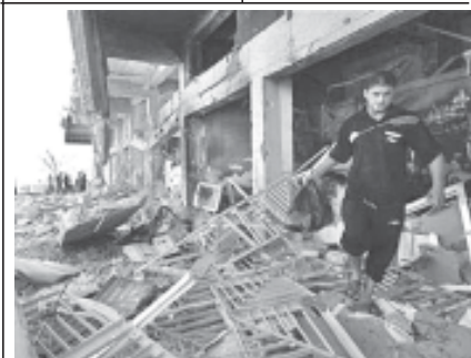
A resident inspects the site of a bomb attack in Baghdad on 23 May, 2011. A parked car bomb exploded at dawn near stores in eastern Baghdad causing damage to many shops including seven liquor stores, an Interior Ministry source said.