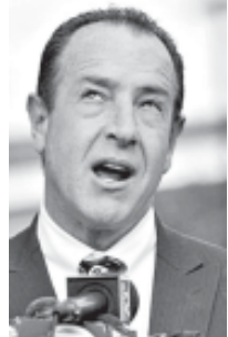
Lindsay Lohan's father Michael Lohan.