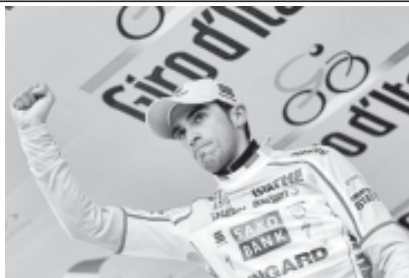
Spain's Alberto Contador celebrates on the podium following the 15th stage of the Giro d'Italia, Tour of Italy cycling race from Conegliano to Gardeccia Val di Fassa, Sunday, 22 May, 2011.