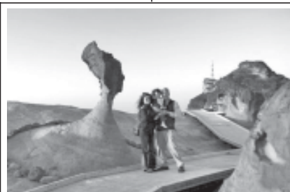
File photo taken on 20 April, 2011 shows visitors posing with a rock scenery spot named "Queen's Head" in the Yehliu Geopark, southeast China's Taipei. The unique rock, shaped by wind erosion for nearly 4,000 years, may collapse in ten years as its middle part becomes thinner and thinner. And thus the geopark has built a duplicate of the rock for the sake of those who could appreciate the landscape if it would disappear.

The thieves coordinated their actions in groups of three or four people who often changed places, and who used rental cars that were the same or similar to the vehicles used by the police, Guillen said.—Internet