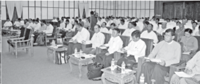
Pyithu Hluttaw Deputy Speaker U Nanda Kyaw Swar speaks at the second day session of discussion on Hluttaw procedures.