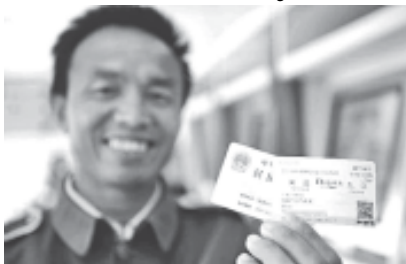
A railway passenger travelling from Nanchang to Jiujiang demonstrates a CRH ticket with his name on it in Nanchang, capital of east China's Jiangxi Province, on 23 May, 2011.