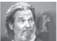
Actor Jeff Bridges poses during a photocall to promote the movie 'True Grit' at the 61st Berlinale International Film Festival in Berlin on 10 February, 2011.