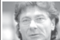
Napoli coach Walter Mazzarri

ROME, 24 May—Napoli coach Walter Mazzarri says he will now talk to the club about his future following his side's impressive third place finish in Italy's Serie A. Mazzarri made it clear over the last couple of months there was no guarantee he would stay with the club despite them having qualified for the Champions League for the first time in 21 years.