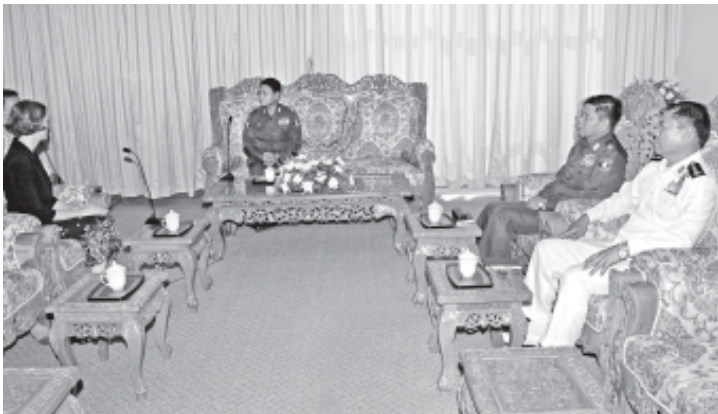
Union Minister for Defence Maj-Gen Hla Min receives Australian Ambassador to Myanmar Ms Bronte Nadine Moules. MNA

NAY PYI TAW, 24 May— Australian Ambassador to Myanmar Ms Bronte Nadine Moules called on Union Minister for Defence Maj-Gen Hla Min, at the Minister's office here this evening. Also present at the call were Deputy Minister Maj-Gen Kyaw Nyunt and Col Aung Thaw. MNA