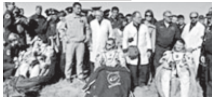
The International Space Station crew of US astronaut Cady Coleman (L), Russian cosmonaut Dmitry Kondratyev (C) and Italian astronaut Paolo Nespoli.