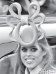
The much-mocked hat worn by Princess Beatrice to Britain's royal wedding last month — widely described as looking like a "toilet seat" — is up for sale on eBay where bids have reached 18,400 pounds ($29,940).

equally split between UNICEF and Children in Crisis, which posted the auction results on their websites.