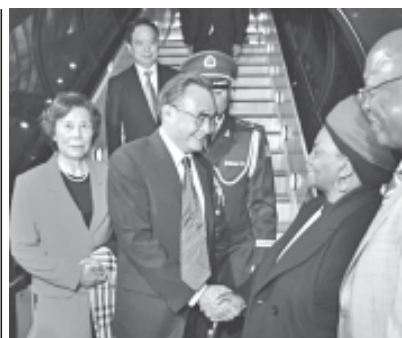
Wu Bangguo, chairman of the Standing Committee of the National People's Congress of China, is greeted by Deputy Speaker of the National Assembly of the Republic of South Africa Nomandla Mfeketo upon his arrival in Cape Town, South Africa, 23 May, 2011. Wu Bangguo arrived here Monday on a visit to South Africa.