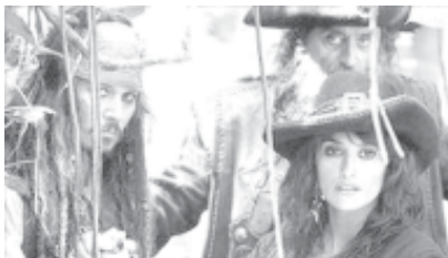
Penelope Cruz (R) joins Johnny Depp (L) in the fourth Pirates of the Caribbean film.