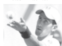
Serbia's Novak Djokovic

del Potro, a winner in four sets against Croatia's Ivo Karlovic. But sixth seed Czech Tomas Berdych, a semi-finalist last year, wilted in the heat, losing in five sets to French qualifier Stephane Robert, the world number 140. One day after his 24th birthday, the red-hot, world number two Djokovic comfortably saw off the 71st-ranked De Bakker in just 92 minutes.—Internet