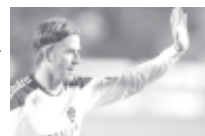
Former United star David Beckham

"To change the players around like he does over the years and still be a success is unbelievable. "Everyone is talking about Barcelona as one of the best club sides in the world - and of course they are. "But if anyone can beat Barcelona at their peak, then Sir Alex Ferguson knows how to do that. I hope they go and do that."— Internet