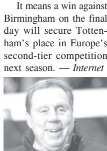
Tottenham Hotspur manager Harry Redknapp

It means a win against Birmingham on the final day will secure Tottenham's place in Europe's second-tier competition next season.