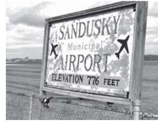
This 11 April, 2011 photo shows a sign to the Sandusky Municipal Airport in Sandusky, Mich.

SANDUSKY, 16 May—A Cessna airplane touched down about midnight, dropped a load of drugs and was back in the air in 90 seconds. Suddenly, the pilot of a US border patrol helicopter hovering nearby turned on a powerful spotlight and tracked an SUV fleeing with hockey bags stuffed with 175 pounds of marijuana and 400,000 Ecstasy-type pills. The bust by federal agents didn't happen on the southwestern border. It was in Michigan's rural Thumb region next to a soybean field. The remote airport here in Sandusky offers a smooth runway at any