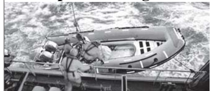
Crew members of the Danish navy board a zodiac in 2010. A Danish military ship has attacked a pirate boat in Somalian waters, killing four pirates and freeing 16 Iranian hostages on board, Denmark's navy said on Sunday.