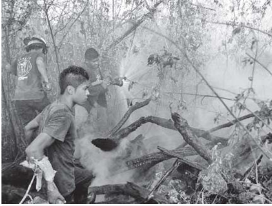
Firefighters try to put out the forest fire in Cancun, the State of Quintana Roo, south Mexico, on 15 May, 2011.