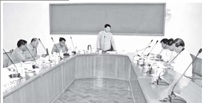
Chairman of Myanmar Olympic Committee Union Minister for Sports and for Hotels and Tourism U Tint Hsan meets MFF President U Zaw Zaw and officials.

sion with President of Myanmar Football Federation and officials on preparation for XXVI and XXVII SEA Games. The minister urged them to impose discipline on footballers, put discipline first