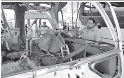
People inspect damage after a mortar landed in Baghdad’s central Tahrir Square, Iraq, on 15 May, 2011. Two mortar rounds slammed into the street at about 1:00 pm, killing two pedestrians and injuring eight others, a police officer said. He said the mortar rounds were aimed at Baghdad’s Green Zone, which houses Iraqi government headquarters and the US and British embassies. Two other mortar rounds landed in the Green Zone, but there was no immediate word on casualties.

Troops mainly from US, Britain, Canada and Australia have been stationed in the southern region within the framework of ISAF to fight Taleban militants there. Over 160 NATO soldiers, most of them Americans, have been killed in Afghanistan since beginning this year.—Xinhua