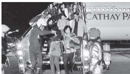
Passengers on Cathay Pacific flight CX715 disembark from the aeroplane after it landed safely at Changi Airport in Singapore.