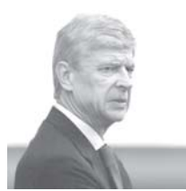
Arsenal manager Arsene Wenger

LONDON, 16 May—Arsene Wenger admits he could have no complaints about the angry reaction from Arsenal fans who booed their team during and after the 2-1 defeat against Aston Villa at the Emirates Stadium.