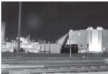
Firefighters douse an electrical transformer station behind several Las Vegas Strip casinos early on 15 May, 2011.