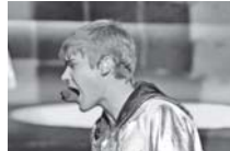
Canadian pop sensation Justin Bieber, seen here, usually draws legions of screaming girls at his sold-out concerts, but the mop-haired teen idol got a hugely disappointing greeting when he arrived in Hong Kong.

But some fans defended the heartthrob, saying his gloomy demeanour was due to him falling ill before arriving in the southern Chinese city.