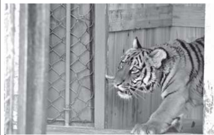
Photo taken on 14 May, 2011, shows a young female South China tiger in a breeding base in Suzhou City, east China's Jiangsu Province, on 14 May, 2011. The young female South China tiger, an endangered tiger species, which was born on 6 Sept, 2010, was the second viable baby South China tiger in the past five years at the Suzhou base.

CHICAGO, 16 May—Six people, including three young boys, were killed and at least a dozen others were injured after an apartment in Aurora, a city in the west of Chicago, caught fire on Sunday. The 3-floor apartment caught fire in the morning. A 10-year-old boy and two women in their 30s were also pronounced dead at the scene. Two other boys and a man were pronounced dead on arrival at hospitals, Chicago Tribune quoted Aurora Public Information official as saying. At least 12 people were injured, two of them critically, said Aurora Public Information officer Dan Ferrelli. The local police said that the fire started on the first floor and moved swiftly through the hallways and trapped people in the second and third floor. The detail of the accident is still under investigation.—Xinhua