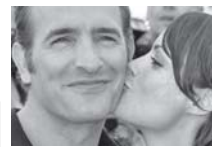
French actress Berenice Bejo kisses French actor Jean Dujardin during the photocall of "The Artist" at the 64 th Cannes Film Festival.

"The Artist" by Michel Hazanavicius won strong applause — and more than a few laughs — from festival goers who'd been wondering if Cannes this year was ever going to be about more than dysfunctional families and sexual deviancy.