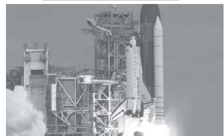
US space shuttle Endeavor lifts off on Monday morning from Kennedy Space Center in Florida, to deliver to the International Space Station a 2-billion-dollar, multinational particle detector known as the Alpha Magnetic Spectrometer (AMS).—XINHUA

Research In Motion and Staples could not immediately be reached by Reuters for comment.—Reuters