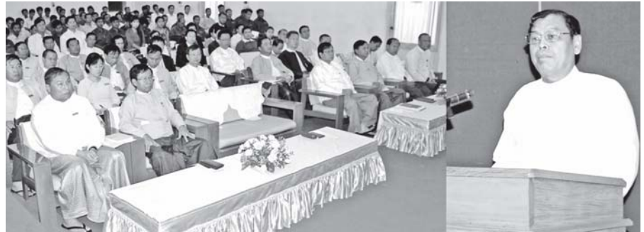
Union Minister for Communications, Posts and Telegraphs U Thein Tun addresses opening of basic mobile network system planning and installation course No 1/2011.—MNA

YANGON, 16 May—Telecommunications and Postal Training Centre today launched a basic mobile network system planning and installation course No 1/2011 with an address of Union Minister for Communications, Posts and Telegraphs U Thein Tun.