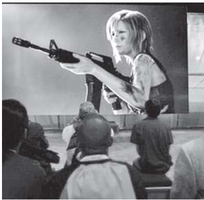
People view a game promotional video in the Square ENIX exhibit at the annual Electronic Entertainment Expo (E3) at the Los Angeles Convention Centre in 2010. Japanese game developer Square Enix Holdings said email addresses of 25,000 customers as well as resumes of 250 job applicants were leaked after a hacker attack against its European subsidiary.