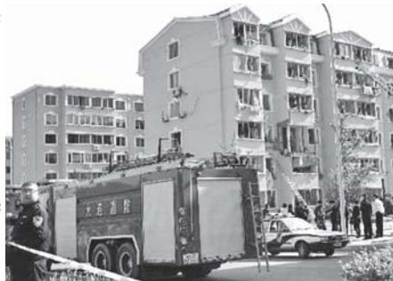
The site of a residential building explosion is seen in Dalian City, northeast China's Liaoning Province, on 16 May, 2011.

DALIAN, 16 May—Two people were killed and 12 others injured after a gas explosion occurred Monday morning in an apartment building in northeast China's Liaoning Province, police said.