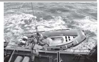
Crew members of the Danish navy board a zodiac in 2010. A Danish military ship has attacked a pirate boat in Somalian waters, killing four pirates and freeing 16 Iranian hostages on board, Denmark’s navy said Sunday.

“During a patrol along the Somali coast on the morning of Thursday 12 May, the Esbern Snare was