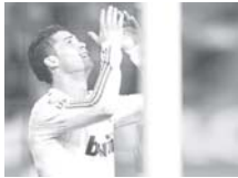
Real Madrid's Portuguese forward Cristiano Ronaldo

MADRID, 16 May—Portuguese goal machine Cristiano Ronaldo equalled the all-time league record of 38 goals with a brace in Real Madrid's 3-1 victory at Villarreal on Sunday. Ronaldo made it nine goals in his last