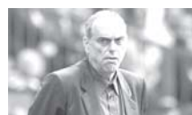
West Ham United's Israeli manager Avram Grant