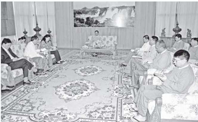
Union Minister for Electric Power No.1 U Zaw Min receives Vice-President Mdm. Zhang Xiaolu of China Power Investment Corporation (CPI) and party.—MNA

NAY PYI TAW, 16 May — Union Minister for Electric Power No.1 U Zaw Min received Vice-President Mdm. Zhang Xiaolu of China Power Investment Corporation