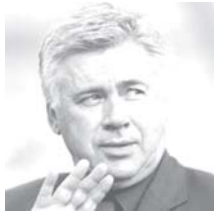
Chelsea manager Carlo Ancelotti