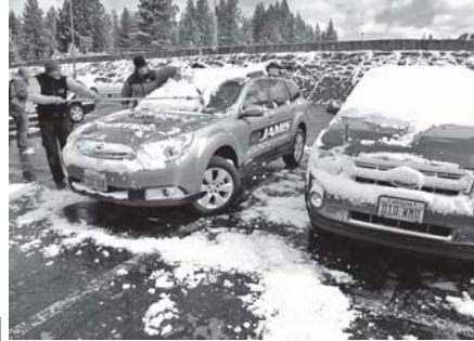
Race sponsors clear snow from their cars. Snowy conditions delay the Amgen Tour of California in South Lake Tahoe.