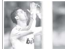
Real Madrid's Portuguese forward Cristiano Ronaldo