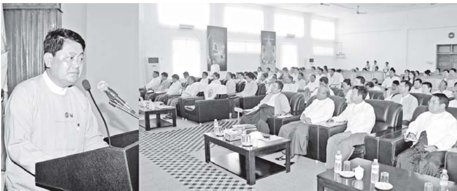
Union Minister for Hotels and Tourism U Tint Hsan holds discussions with hoteliers of Nay Pyi Taw Hotel Zone at Ministry of Hotels and Tourism.—MNA

NAY PYI TAW, 16 May—Union Minister for Hotels and Tourism U Tint Hsan met hoteliers of Nay Pyi Taw Hotel Zone at the Ministry of Hotels and Tourism here this afternoon and discussed matters to form Nay Pyi Taw Hotel Zone, reinforce laws, conduct hotel courses and standardize hotels.