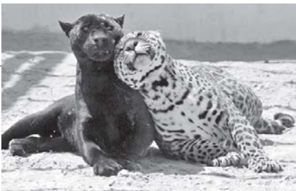
Lolo, a black jaguar, plays with Ward, her 14-month-old spotted cub, inside their enclosure at the zoo in Amman on 12 May, 2011.

"Everyone is doing well," she told the Pittsburgh Post-Gazette .