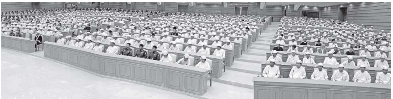
Attendees at 18th-day regular session of First Pyidaungsu Hluttaw session.

shaping a democratic system correctly and effectively.