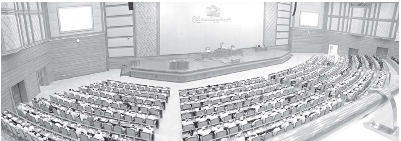
18 th day first regular session of Pyidaungsu Hluttaw in progress.

First Pyidaungsu Hluttaw regular session concludes successfully Elected President, elected Vice-Presidents, Union level organization members make affirmation President delivers address, his address recorded