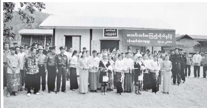
LIBRARY OPENED: Officials formally open New Light Library in Pannaunglon village of Tonta in Shan State (East) on 13 March. TOWNSHIP IPRD

The annual general meeting will be held in conjunction with special sales. All MWEA members are invited to attend the meeting. Tickets for dinner are