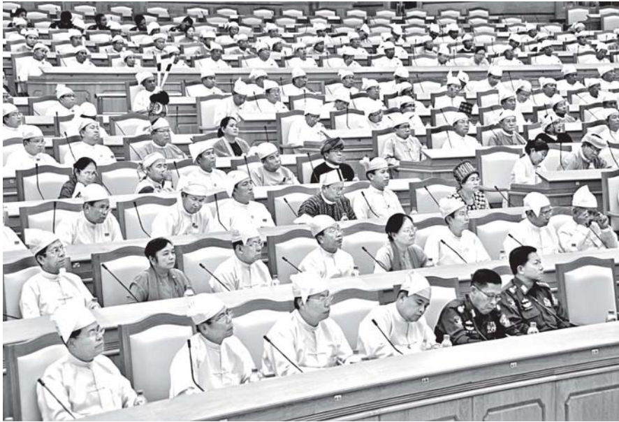
Attendees at 18th-day first regular session of Pyidaungsu Hluttaw session.—MNA