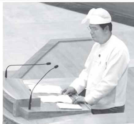
F & R Minister U Hla Tun responding to question.

Short-term loan means is for working capital and long-term investment is needed for expanding the business. According to statistics in 2004, SMEs in Myanmar were 43435 with 78% of which is small enterprises with workforce of under 50, and accounted 61% of employment rate, 41% of production rate, and 45% of investment rate of the nation