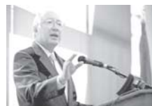
Secretary of the Interior Ken Salazar answers a question during a news conference on 22 March.

CHEYENNE, 23 March— Interior Secretary Ken Salazar announced plans