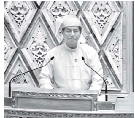
Minister for Construction U Khin Maung Myint replying queries.—MNA

Regarding Kyaukhtu-Pauk-Seikpyu Road, it is combination of three networks of roads—Seikpyu-Pauk-Kuakhtu Road (84 miles and three furlongs), Pakokku-Pauk-Kyaukhtu Road (79 miles) and Seikpyu-Pakokku Road (59 miles)