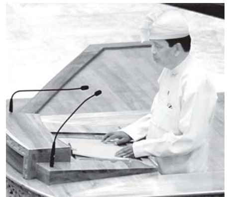
Minister for Education Dr Chan Nyein responding to question.—MNA

The higher education sector has 215 academic pro-