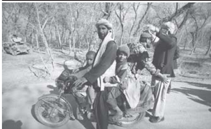
An Afghan Army soldier searches residents' bodies at a security checkpoint outside the city of Herat, Afghanistan, on 22 March, 2011.

In northeastern Baghdad, gunmen opened fire at a civilian car, wounding two people, the source added. Earlier in the day, the police reported that an Iraqi army officer and a policeman were killed and 13 people wounded in separate bomb attacks in the morning.— Xinhua