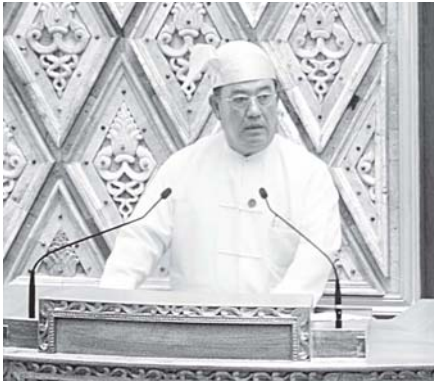
Minister for Home Affairs U Maung Oo replying queries.—MNA

NAY PYI TAW, 23 March—At today's Amyotha Hluttaw session, Minister for Home Affairs U Maung Oo responded to the query raised by U Paw Lyan Lwin of Chin State Constituency No.9.