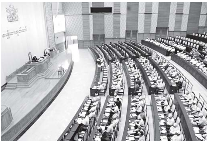
First regular session of Amyotha Hluttaw for 14 th day in progress.—MNA

NAY PYI TAW, 23 March—The First regular session of Amyotha Hluttaw was held for 14 th -day at Amyotha Hluttaw Hall of Hluttaw Building here at 10 am today.