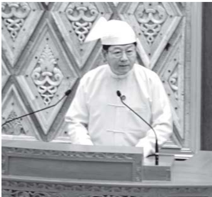
Minister for Commerce U Tin Naing Thein making clarifications.—MNA

NAY PYI TAW, 23 March – Four Hluttaw representatives discussed the proposal approved to be discussed to assist farmers in getting reasonable price of paddy, submitted by Dr Banya Aung Moe of Mon State Constituency-7, at today's Amyotha Hluttaw session.