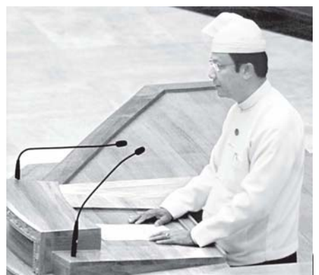
Minister for Electric Power No. 1 U Zaw Min answering query.—MNA

With regard to the electric power sector, Paragraph (4) (a) on Page 189 in the schedule two, Section 188 of the Constitution of the Republic of the Union of Myanmar states "Medium and small scale electric power production and distribution that have the right to be managed by the Region or State not having any link with national power grid, except