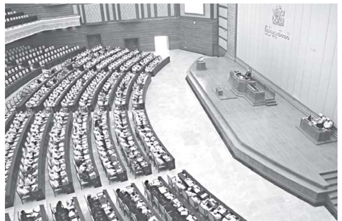
First regular session of Pyithu Hluttaw for 14 th day in progress.—MNA

The Speaker submitted the name list of chairman,