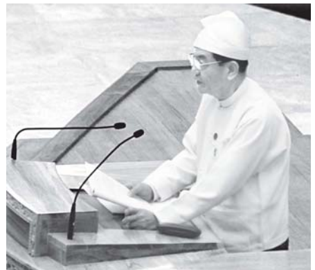
PBANRDA Minister U Thein Nyunt making clarification.

As the third plan, 6400 feet long and 15 feet high earthen dam is being built by damming Kanpaing Creek, 4200 feet north from Sittway. The facility will store 130 million gallons of water to supply 400,000 more gallons of water to seven wards of northern Sittway. The construction will cost K 195.22 million. On completion, Sittway can