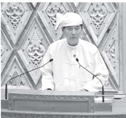
Minister for Health Dr Kyaw Myint making clarifications.—MNA

NAY PYI TAW, 16 March—At today's Amyotha Hluttaw session, Minister for Health Dr Kyaw Myint responded to the proposal "to form a board with the participation of experts for adopting the best system for health care service as it is weak" submitted by U Steven Thabeik of Chin State Constituency No.4.