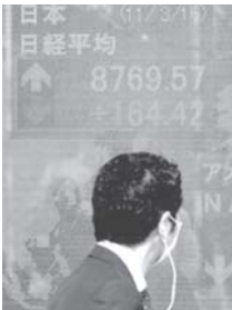
A man looks at the stock price board on a street Wednesday, 16 March, 2011 in Tokyo, Japan.