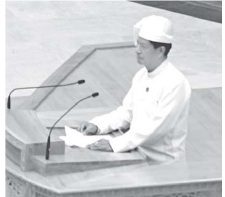
Construction Minister U Khin Maung Myint responds to question.—MNA