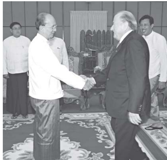
Prime Minister U Thein Sein cordially greets FIFA President Mr Joseph S. Blatter at Government Office in Nay Pyi Taw.