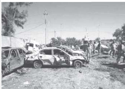
Soldiers gather at the site of a bomb attack that occurred in the town of Kanan, 70 km (43 miles) northeast of Baghdad on 14 March, 2011. A car bomb attack on an Iraqi army unit killed at least eight soldiers and wounded 12 others in Kanan, officials and security sources said. INTERNET

Afghan officials investigate the scene of a suicide attack in Kunduz, north of Kabul, Afghanistan on 14 March, 2011. A suicide bomber posing as an army volunteer struck an Afghan army recruitment center in the northern Kunduz Province on Monday afternoon, killing at least 33 people, Afghan officials said. INTERNET