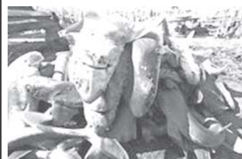
File photo shows dead sharks in East Java, hunted for their fins and sold mostly to China for shark fin soup. A member of China's parliament has proposed a ban on the trade in shark fins, state press said on Wednesday — a move that would likely face huge opposition from the nation's culinary traditionalists.

BEIJING, 16 March — A member of China's parliament has proposed a ban on the trade in shark fins, state press said on Wednesday — a move that would likely