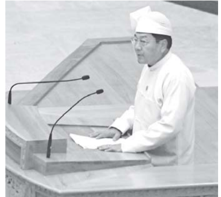
Commerce Minister U Tin Naing Thein making clarification.

Regarding the second point of the proposal, in accord with Para-35 of the 2008 constitution, the State will practise the market economy system. So, the government will not interfere with private assets and businesses. Only the private sector will trade freely in accordance with the market economy system. At present, regional millers, brokers and peasants are engaging in