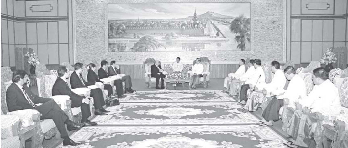
Prime Minister U Thein Sein receives FIFA President Mr Joseph S. Blatter and party at Government Office in Nay Pyi Taw. (News on page 16)