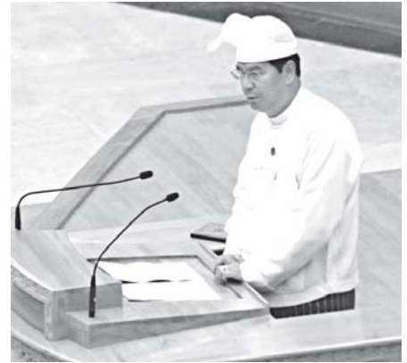
Minister for Finance and Revenue U Hla Tun making clarifications.

The speaker said that the proposal is nearly similar to the previous one, but he allowed