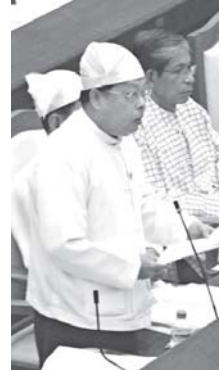
Pyithu Hluttaw representative U Ko Gyi of Aungmyethazan Constituency.