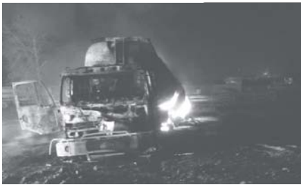
The wreckage of a NATO oil tanker is seen after attack near southwest Pakistan's Mastung on 16 March, 2011.