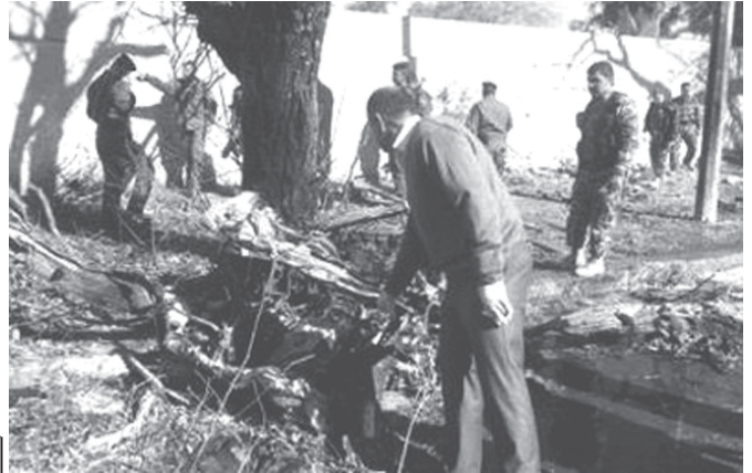
Security personnel inspect the site of a bomb attack in Kirkuk, some 250 km (155 miles) north of Baghdad, on 16 March, 2011. A car bomb killed two people and wounded 35 in central Kirkuk, police Major-General Torhan Abdul-Rahman said.