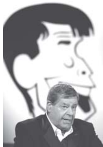
Jerry Lewis speaks following the opening of the Muscular Dystrophy Association's 40 th annual Jerry Lewis MDA Telethon held at the Beverly Hilton on 4 Sept, 2005.