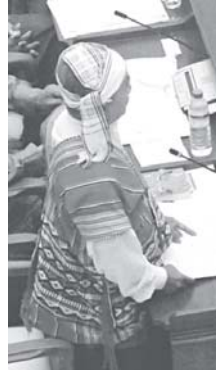
Pyithu Hluttaw representative U Saw Thein Aung of Hlaingbwe Constituency.