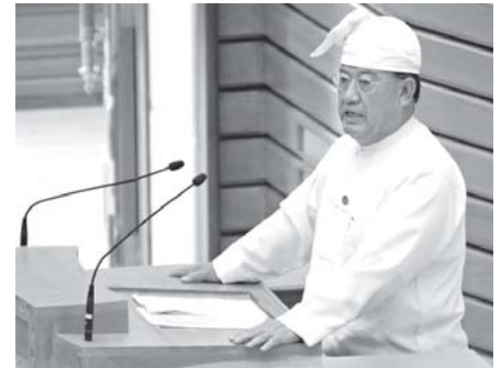
Minister for Immigration and Population U Maung Oo responds to question.—MNA

ing, visa-holders are allowed depart from other exits other than the border-crossing points they have entered with the recommendation of the relevant ministry and the permission of the department