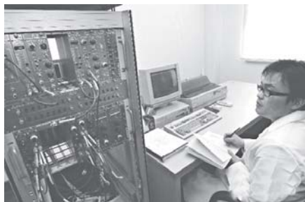
A staff member analyses the collected objects to check the radiation level at an environment supervision station in Shanghai, east China, on 15 March, 2011. China's meteorological authority announced Tuesday the nuclear radiation leakage following explosions at the Fukushima nuclear power plant in Japan would not affect China over the next three days.