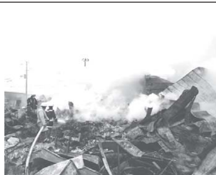
Rescuers put out fire in the quake-hit area of Kesenuma city, Miyagi Prefecture, Japan, on 15 March, 2011.