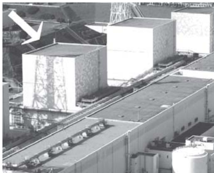
This file photo released by Kyodo News Agency on 13 March, 2011 shows the No 3 nuclear reactor of Japan's Fukushima No 1 nuclear power station.—XINHUA

where high amounts of radiation have been detected. According to the plant's officials, the fire was spotted at 05:45 am local time at the northwestern corner of the building that houses the No 4 reactor.