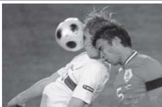
Moments of kissing balls