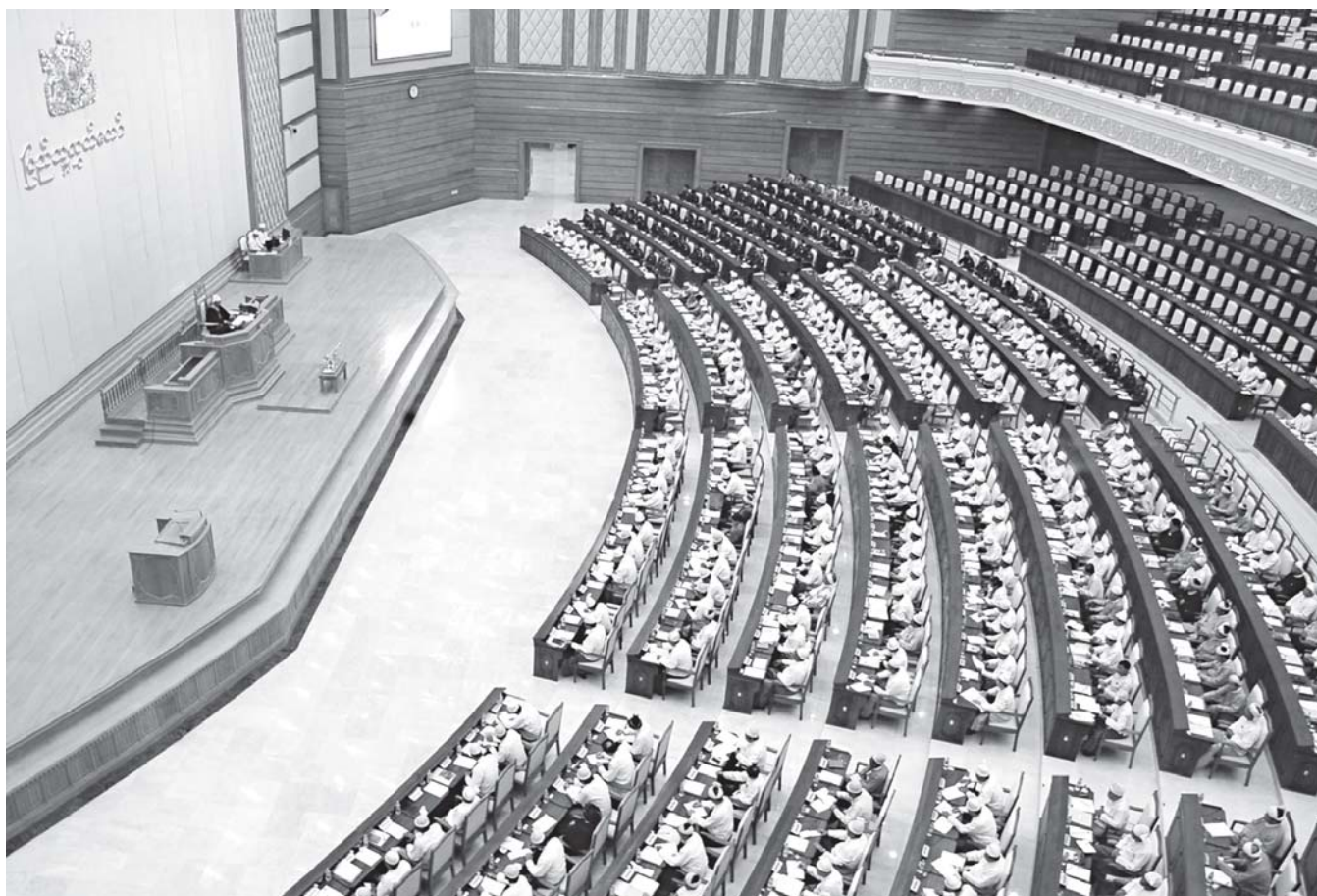
First regular session of Pyithu Hluttaw for eleventh day in progress.—MNA

NAY PYI TAW, 16 March — The first regular session of Pyithu Hluttaw continued for the eleventh day at Pyithu Hluttaw Hall of Hluttaw Building here this morning, with the attendance of Pyithu Hluttaw Speaker Thura U Shwe Mann and Pyithu Hluttaw representatives.