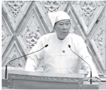
Minister for Energy U Lun Thi responding to question.

Regarding the question, Minister for Energy U Lun Thi replied that 260 fuel stations in States and Regions were transferred to private sector by National