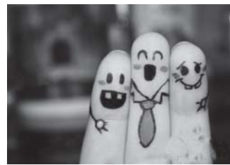
Creativity on finger heads.