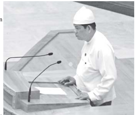
A&I Minister U Htay Oo responds to question.

Regarding the question, Minister for Agriculture and Irrigation U Htay Oo explained that Ministry of Agriculture and