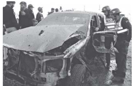
Rescuers inspect the police van destroyed in suicide blast in northwest Pakistan's Peshawar on 31 Jan, 2011.