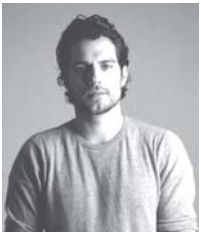
This undated photo provided by Warner Bros shows actor Henry Cavill.

NEW YORK, 31 Jan—British actor Henry Cavill is going up, up