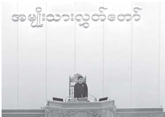
Chairperson of Amyotha Hluttaw U Khat Htein Nan extends greetings.

task rightfully in line with the laws and bylaws. MNA