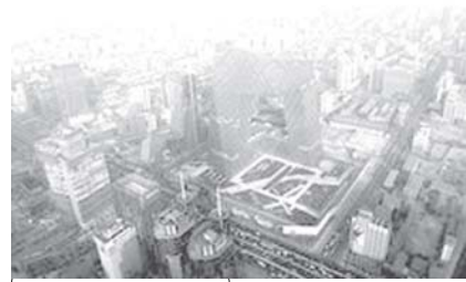
The new CCTV headquarters (C) rises out of the central business district in Beijing.