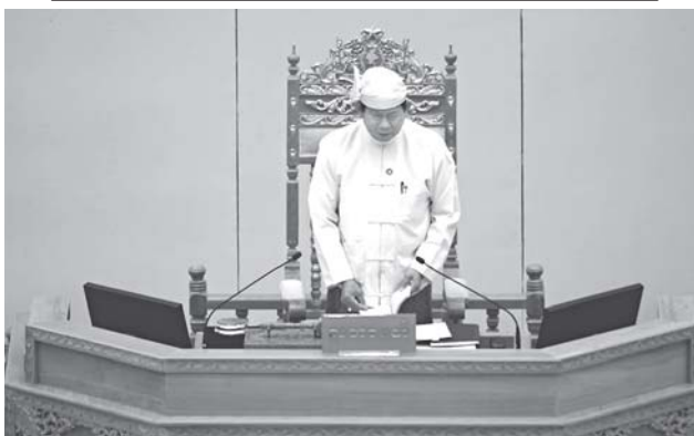
Chairperson of Pyithu Hluttaw U Htay Oo extends greetings.