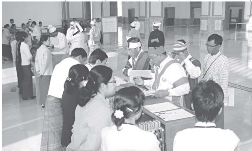
Amyotha Hluttaw representatives sign attendance book for first regular session of Amyotha Hluttaw.

The Amyotha Hluttaw speaker announced the end of the first day meeting of the first Amyotha Hluttaw regular session as the Pyithu Hluttaw representatives had to attend the Pyidaungsu Hluttaw session at the invitation of the Pyidaungsu Hluttaw Speaker. The meeting was concluded at 1.35 pm.