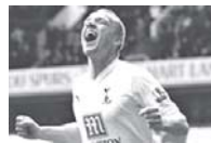
Tottenham midfielder Jamie O'Hara

LONDON, 31 Jan — Wolves signed Tottenham midfielder Jamie O'Hara