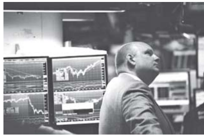
Traders work on the floor of the New York Stock Exchange (NYSE).

Officials suspect the attacks were designed to spread panic among markets and destabilise