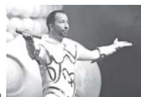
Swiss singer, dancer and music producer DJ BoBo performs in 2010.