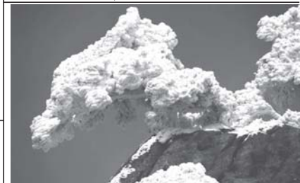
Photo taken on 29 Jan, 2011 shows a snow-covered pine tree on a cliff in the Yellow Mountain (Huang Shan Mountain), a place of interest famed for its versatile scenery, east China’s Anhui Province.

A sensor continually monitored sugar levels, which fed the information to a computer, which then told an insulin pump how much of the hormone to inject. The early study showed that normal sugar levels could be maintained.—Xinhua