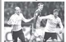
Bayern Munich winger Arjen Robben (L) celebrates after scoring with teammate Thomas Mueller (R).

BERLIN, 31 Jan — Borussia Dortmund tightened their grip on the Bundesliga title race