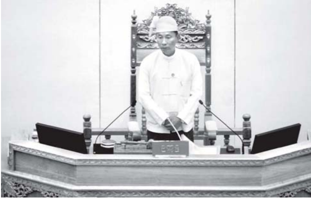
Speaker of Pyithu Hluttaw Thura U Shwe Mann extends greetings.