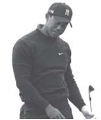
Tiger Woods reacts to another mis-hit shot while playing the fourth hole of the South Course at Torrey.

SAN DIEGO, 31 Jan — Tiger Woods began a new year with his worst season debut.