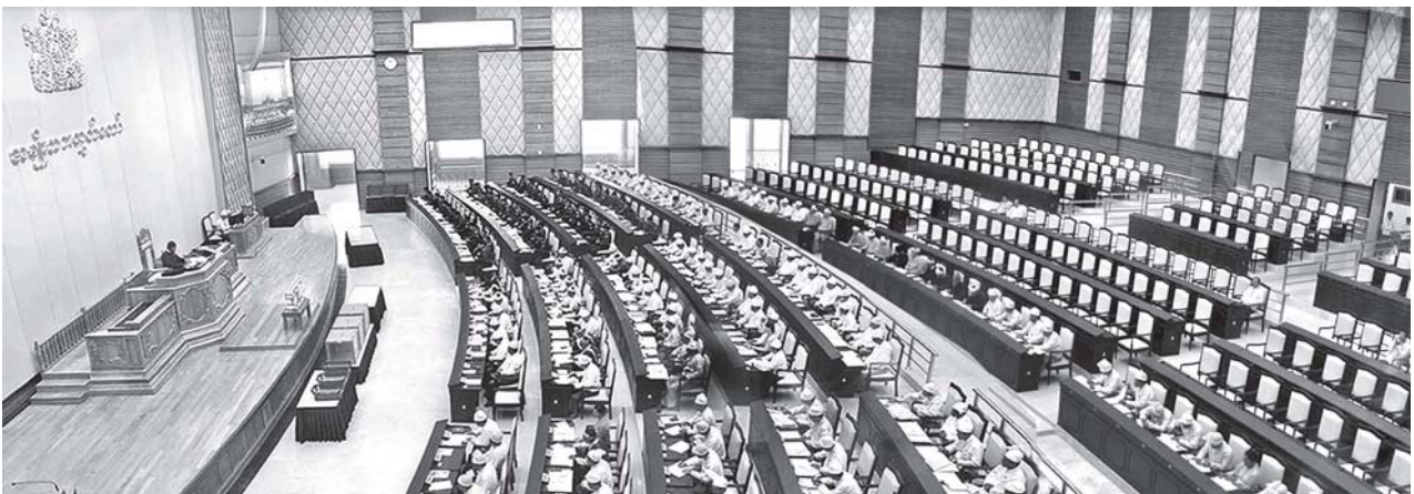
First Amyotha Hluttaw regular session in progress.

First Amyotha Hluttaw regular session commences with cent per cent attendance of Amyotha Hluttaw representatives and Defence Services Personnel Amyotha Hluttaw representatives