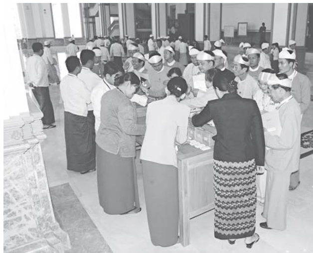
Pyithu Hluttaw representatives sign attendance book.

U Shwe Mann from Zeyathiri Constituency was elected as Speaker of Pyithu Hluttaw and U Nanda Kyaw Swar as Deputy Speaker of Pyithu