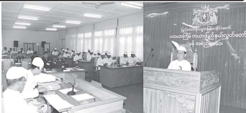
Regular session of first Kayah State Hluttaw in progress.