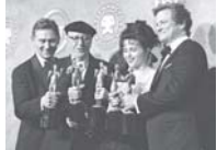
From left, Anthony Andrews, Geoffrey Rush, Helena Bonham Carter and Colin Firth hold best ensemble awards for 'The King's Speech' at the 17th Annual Screen Actors Guild Awards on Sunday, on 30 Jan, 2011 in Los Angeles. Firth also won best actor.