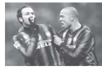
Inter's Giampaolo Pazzini (L) celebrates with teammate Houssine Kharja after scoring against Palermo.