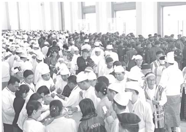
Pyidaungsu Hluttaw representatives sign attendance book for First Pyidaungsu Hluttaw Regular Session.

Pyidaungsu Hluttaw Regular Session were present and announced the opening of the session.