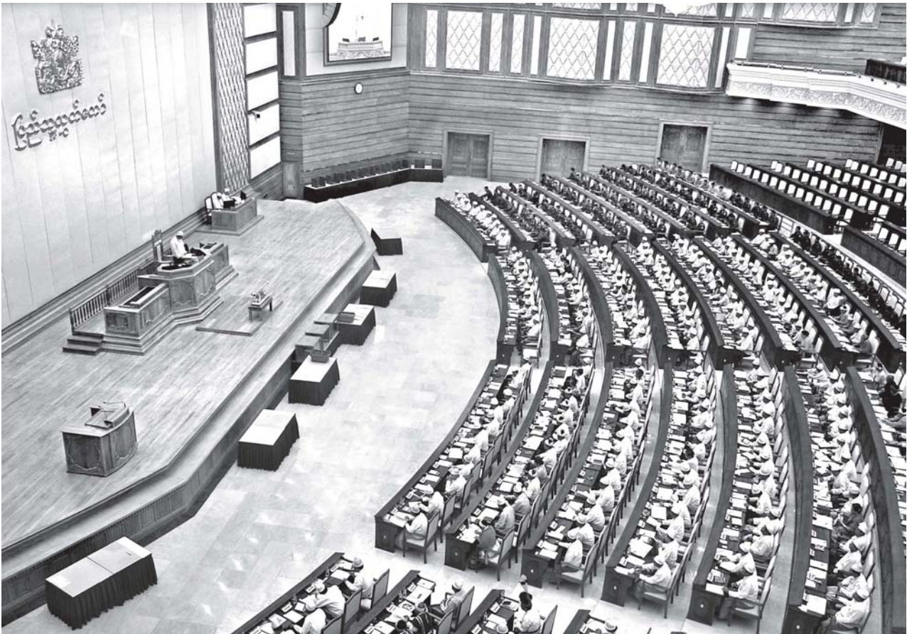
First Pyithu Hluttaw regular session in progress at Pyithu Hluttaw Hall of Hluttaw Building in Nay Pyi Taw.