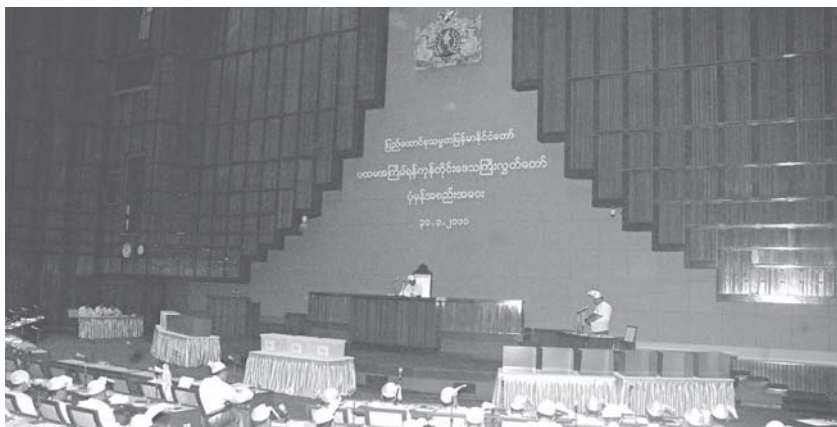
The regular session of first Yangon Region Hluttaw in progress.

Chairpersons, Speakers and Deputy Speakers at the first-day regular sessions of State/Region Hluttaws were elected in accordance with the provisions of Chapter-IV and Chapter-V of Region or State Hluttaw Bylaws.