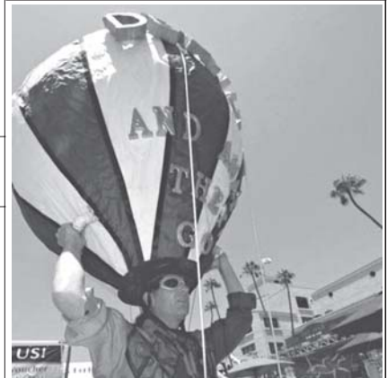
Bizarre hats show