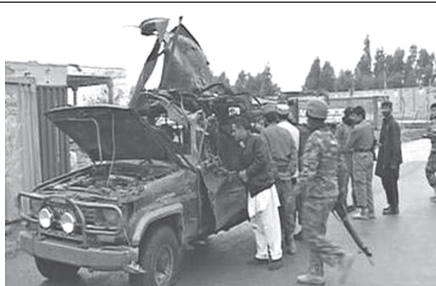
Security personnel examine the damaged vehicle belonging to the deputy governor of Afghanistan's southern Kandahar Province, after an attack in Kandahar City, in this image taken from video, on 29 January, 2011.