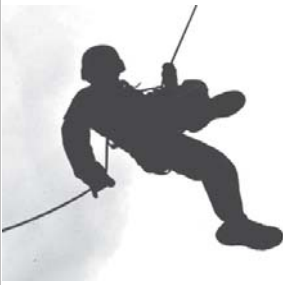
A climber who fell around 300 metres from the summit of a Scottish mountain is lucky to be alive, his rescuers said Sunday.

A mountain climber in Scotland fell 1,000 feet and then stood up to await rescue, the British military said. The unidentified 35-year-old man from Glasgow slipped and fell Saturday afternoon on the 3,600-foot mountain in west-central Scotland, Scotland on Sunday reported.