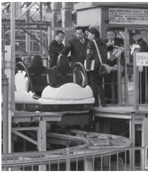
Police investigators examine a spinning roller coaster after a man fell from that to his death at the Tokyo Dome City Attractions on 30 Jan, 2011 in Tokyo.

TOKYO, 31 Jan—Police say they are investigating the death of a man who fell from a roller coaster at a Tokyo amusement park.