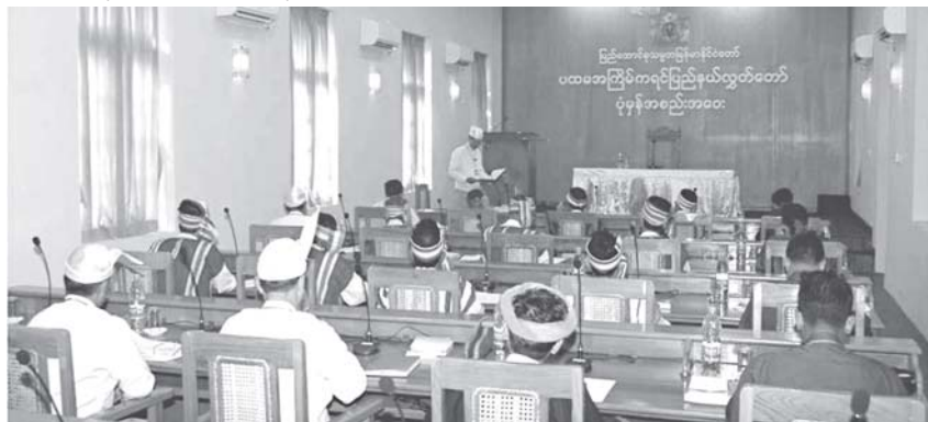
Regular session of first Kayin State Hluttaw in progress.