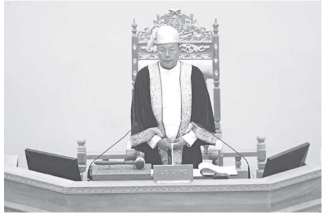
Pyidaungsu Hluttaw Speaker U Khin Aung Myint extends greetings at first regular session of Pyidaungsu Hluttaw.

We can notice that the State Peace and Development Council not only promulgated related laws but also made all arrangements with farsightedness and goodwill for the comfort and convenience of hluttaw delegates such as very grand Hluttaw buildings and facilities.