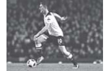
Veteran Tottenham striker Robbie Keane

loan until the end of the season with a view to making a permanent six million pounds (9.5 million dollars) switch to the east London club.—Internet