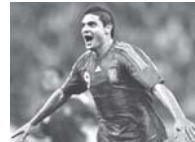
Greece striker Angelos Charisteas

Despite having qualified for the last 16 of the Champions League, Schalke are 11th in the league and