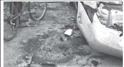
A massive car bomb ripped through a funeral ceremony in a Shiite district of Baghdad on Thursday, killing 48 people in Iraq's bloodiest day in more than two months.