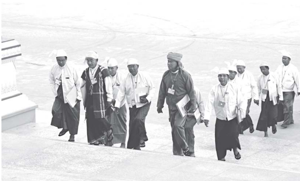
Pyithu Hluttaw representatives arrive at Pyithu Hluttaw Building to attend first regular session of Pyithu Hluttaw.