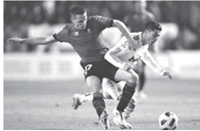
Real Madrid's Portuguese forward Cristiano Ronaldo (R) vies with CA Osasuna's midfielder Javier Camunas (L) during the Spanish league football match Club Atletico Osasuna vs Real Madrid CF at the Reyno de Navarra stadium in Pamplona. Real Madrid's title hopes were left hanging by a thread after Jose Mourinho's side suffered a shock 1-0 defeat at relegation-threatened Osasuna.