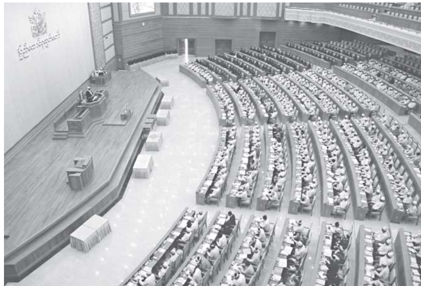
Pyidaungsu Hluttaw representatives attend first Pyidaungsu Hluttaw Regular Session.

The speaker said that the First Pyidaungsu Hluttaw Regular Session was valid as all of 659 representatives who were eligible to attend the First