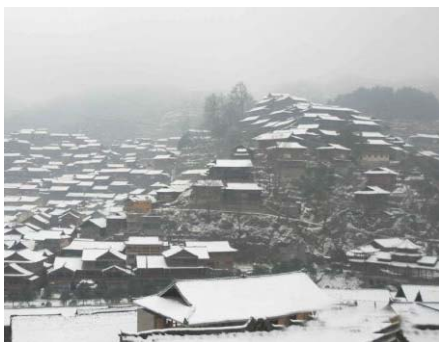
Photo taken on 22 Jan, 2011 shows Xijiang Village covered in snow in Leishan County, Qiandongnan Miao and Dong Autonomous Prefecture, southwest China's Guizhou Province. More than 1,200 families of the Miao ethnic group reside in the village, which has a history of some 2,000 years and well preserved customs.

Both agencies released the information Saturday.— Internet