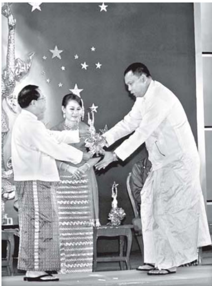
Minister for Information U Kyaw Hsan presents Best Film Award to Zinyaw Film Production.—MNA