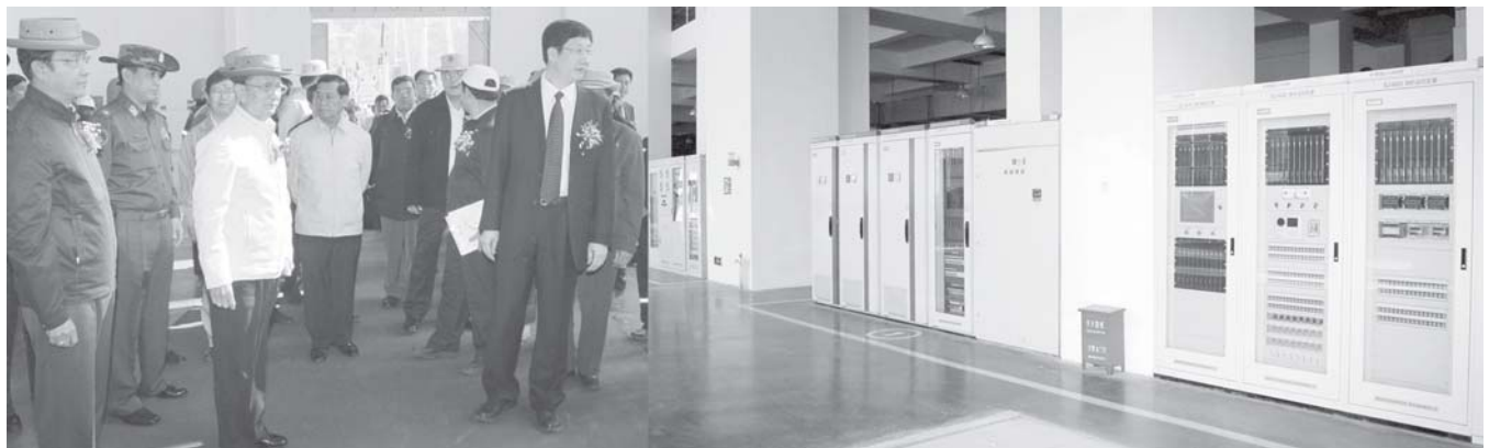
Prime Minister U Thein Sein observes Tarpein-1 Hydropower Station.—MNA

The country now sees 31 power plants with a capacity of 3285 MW. In the near future, Shwegyin hydropower project (75 MW) and Kwunchaung hydropower project (60 MW) are due to be completed.