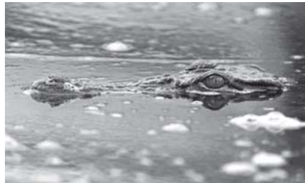
A Nile Crocodile at an animal park. A crocodile in Ukraine who swallowed a cell phone has refused to touch his food for a month and attempts to prompt nature to take its course have so far failed, vets said Saturday.

In an effort to induce bowel movements, vets gave Gena laxatives and vitamins injected in quail but he refused to touch it.