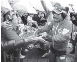
Japanese comedian Kanpei Hazama (R) is greeted by his fans upon his arrival at the Fukuoka Marina on 4 January as the last leg of his Earth marathon.

"I'm home now!" Hazama, wearing a black running suit and sunglasses, yelled to his fans and his fellow comedians, 17 days after he landed in Japan after sailing from China to southwestern Fukuoka harbour.