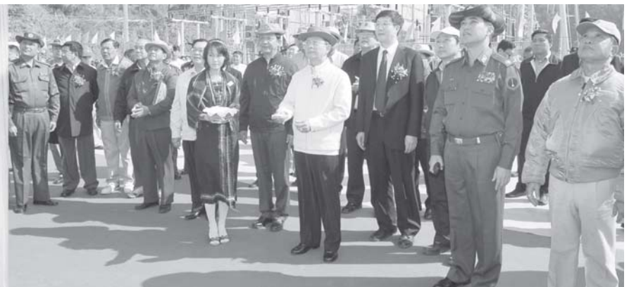
Prime Minister U Thein Sein unveils the stone plaque of Tarpein-1 Hydropower Plant.—MNA

NAYPYI TAW, 23 Jan— A ceremony to inaugurate Tarpein-1 Hydropower Plant of Hydropower Implementation Department under the Ministry of Electric Power No. 1 was held at the plant in Momauk Township Kachin State, this morning, with an address by Prime Minister U Thein Sein.