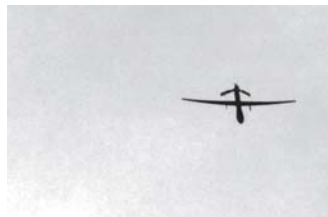
A US "Predator" drone is seen near a US base in Kandahar, Afghanistan. A drone attack has killed at least four militants in Pakistan's North Waziristan tribal district, officials have said.

In the first drone attack, the aircraft fired two missiles at a vehicle and a house in Doga Mada Khel village, killing four suspected militants, said intelligence officials, speaking on condition of anonymity because they were not authorized to talk to the media.—Internet