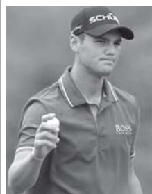
Martin Kaymer of Germany reacts after putting on the eighth hole during the second round of the Abu Dhabi Golf Championship.

ABU DHABI, 23 Jan—Defending champion Martin Kaymer extended his lead at the Abu Dhabi Golf Championship to five strokes over Rory McIlroy after shooting a 6-under 66 in the third round on Saturday.