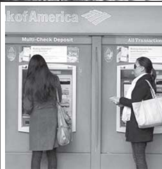
Bank of America customers use an ATM on 21 Jan, 2011 in San Francisco, California. Bank of America reported a fourth quarter loss of $1.2 billion, or 16 cents a share, bringing total losses for the year to $2.23 billion, or 37 cents a share.—INTERNET

In Beijing alone, there are about 1,000 governmental design businesses