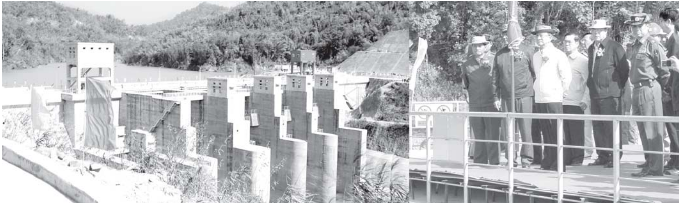
Prime Minister U Thein Sein inspects concrete embankment, power intake structure and inflow of water of the station.