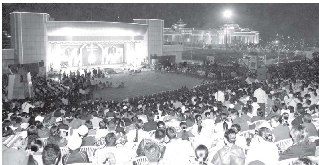
Myanma Motion Picture Outstanding Award (Academy Award) presentation ceremony in progress at open air theatre of Nay Pyi Taw City Hall.—MNA

Looking back to the historical background of the Myanmar film world, film professionals have preserved a fine tradition of working together in the interest of the film industry and the nation and the people. In view of