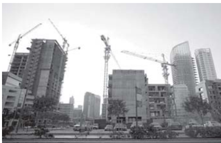
In this photo taken 22 Jan, 2011, cranes in construction sites are seen in Downtown Beirut, Lebanon.

BEIRUT, 23 Jan—The political crisis in Lebanon is threatening to derail economic progress after a year that saw 7 percent economic growth, a record number of tourists and bank deposits among the highest in the Middle East.