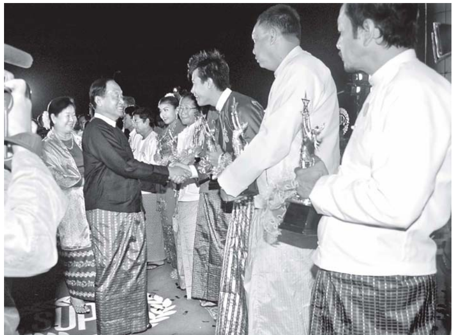
SPDC Secretary-1 Thiha Thura U Tin Aung Myint Oo and wife Daw Khin Saw Hnin greeting the academy award winners at the Myanmar Motion Picture Outstanding Awards (Academy Award) Ceremony.

Speaking on the occasion, the minister said it is a great pleasure for him to see all were gathered together here to attend the Myanmar Motion Picture Outstanding Award (Academy Award) Ceremony. Today's ceremony was to present academy awards to the outstanding artistes and technicians from (See page 9)