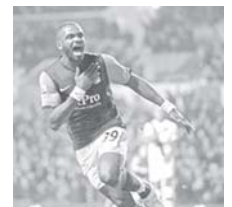
Aston Villa's striker Darren Bent celebrates scoring during their English Premier League.

Bent, who arrived from Sunderland in mid-week, struck just 17 minutes into his Villa bow when he displayed the predatory instincts which persuaded Gerard Houllier to pay 24 million pounds for his services.