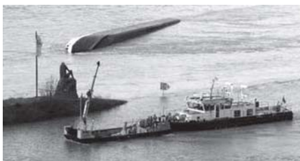
A rescue ship arrives at a tanker ship capsized in the middle of the Rhine (Rhein) river, next to Loreley statue near Sankt Goarshausen on 14 Jan, 2011.

BERLIN, 23 Jan— Cranes have begun working on salvaging a capsized tanker loaded with sulfuric acid that has been floating in the Rhine River for days.