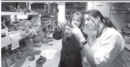
File picture of researchers inspecting a specimen at Australia's Peter MacCullum Cancer Centre, where scientists investigate families with multiple cases of breast cancer. The improved blood test for cancer — developed by pharmaceutical giant Johnson & Johnson — will allow closer monitoring of tumours in real time, advancing doctors' understanding of how cancer develops.