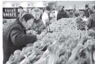
Chinese customers buy vegetables at a supermarket in Hefei, east China's Anhui province in December. World Trade Organization chief Pascal Lamy says chances of closing the long-delayed Doha round of talks on a new free trade pact are much better than a year ago.

Analysts said businesses that held back on buying new trucks during the recession were behind much of the recent increase in sales.—Internet