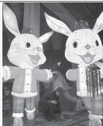
A craftsman adjusts the illumination of rabbit-shaped lanterns in a lantern factory in Suzhou, east China's Jiangsu Province, on 23 Jan, 2011.

Five people were injured in the fire, three of whom were hospitalised, Oleg Zügeyev, spokesman of the regional Emergencies Ministry, told news agency RIA . The cause of the blast was not immediately clear, but Zügeyev said the fire was believed to have started in a room reserved for smoking water pipes located on the third floor.— MNA/Reuters