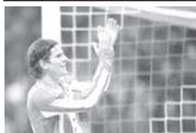
Bayern Munich's striker Mario Gomez celebrates after the third goal for Munich during their German Bundesliga.

Despite being held, the leaders remain 13 points clear at the top with Bayern 14 points behind after Gomez netted three second-half goals to bring his tally to 15 in 17 league matches this season.