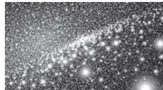
This artist's concept shows a view across a mysterious disk of young, blue stars encircling a supermassive black hole at the core of the neighbouring Andromeda Galaxy.

The cost savings of such an arrangement are obvious. More payload can be launched into low Earth orbit at one time. The cost of stacking a three stage rocket and the complexity of multiple rocket engines are done away with.