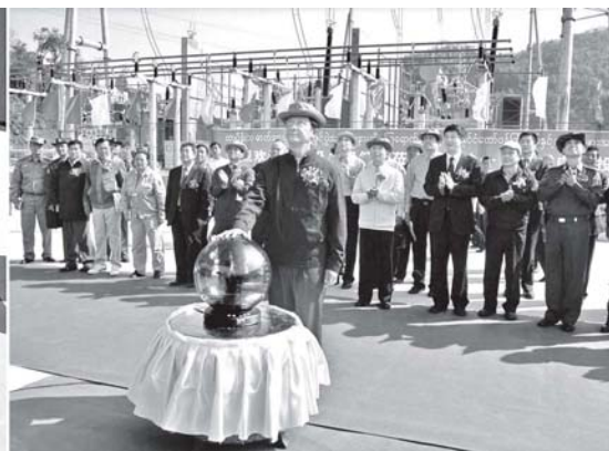
Minister for Electric Power No.1 U Zaw Min unveils sign-board of Tarpein Hydropower Station.