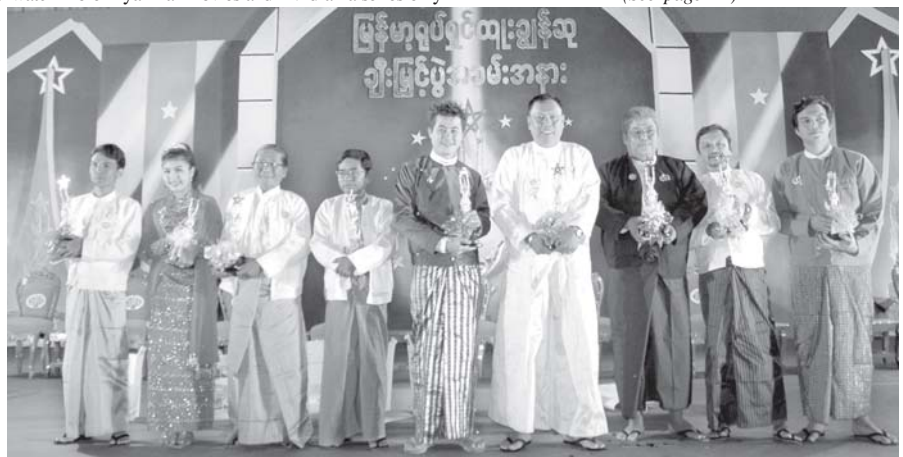
Photo shows Myanmar Motion Picture Outstanding Award (Academy Award) winners for 2009.