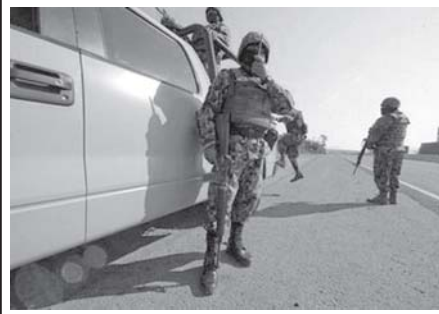
File photo shows marines manning a checkpoint in Apatzingan, Michoacan State, Mexico. Ten alleged drug cartel members have been killed in a clash with Mexican soldiers in the northeastern state of Tamaulipas, which borders the United States, the Mexican army has said.