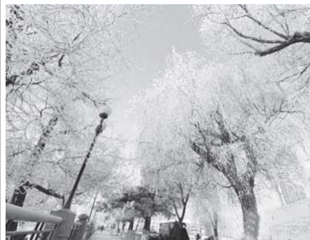
Photo taken on 22 Jan, 2011 shows the rime scenery along the Songhuajiang river in Jilin City, northeast China's Jilin Province.

China's consumer price index (CPI), the main gauge of inflation, rose 4.6 percent in December year-on-year and 3.3 percent for the whole of 2010, breaking the government's 3 percent inflation ceiling.—Xinhua