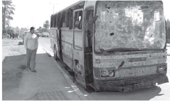
A resident looks at a damaged bus after a bomb attack in Baghdad's Kadhimiya District on 23 Jan, 2011. A car bomb went off near the bus carrying Iranian pilgrims, killing one pilgrim and wounding seven in Baghdad's Kadhimiya District, an Interior Ministry source said.