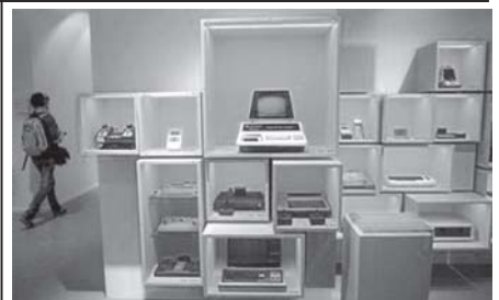
A woman walks past a Commodore computer (C, Top) and other historical devices at the new Computer Game Museum in Berlin on 20 January.

The newspaper said Saturday Smith has been working increasingly with her two children. Her son is a guitar player married to Meg White of the White Stripes. Her daughter, a composer, is taking part in a couple of the shows on the current tour.