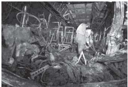
Pakistani volunteers search for bodies inside a burnt-out passenger bus after it collided with an oil tanker near Nooriabad.