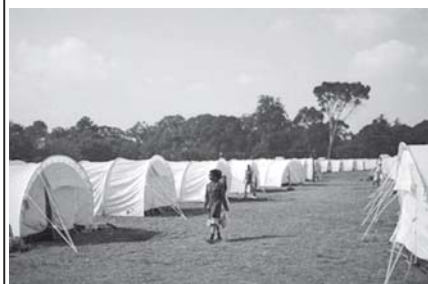
Emergency tents for refugees pictured at Johannesburg's Rand Airport in 2008.