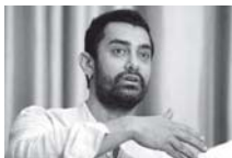
Bollywood actor and producer Aamir Khan, seen here on 20 Jan, will bring some Indian spice to the jury at the 61st Berlin film festival next month, organizers said Friday.