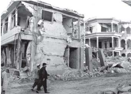
Afghans walk past a building destroyed by an explosion in Kandahar.

Afghanistan with experiencing over three decades of war and civil strife is the most mine contaminated country in the world.