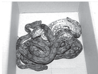
Snakes found in the luggage of a passenger arriving at Abu Dhabi International Airport.

Media reports Tuesday say it's unclear how the animals passed authorities in Indonesia. But there was no real-life replay of the 2006 thriller "Snakes on a Plane" during the flight. Police did not identify the snake