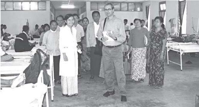
Responsible persons of Health Department and IUATLD visit Specialist Hospital (Thakayta).