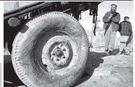
A pushcart's wheel is seen with bloodstains at the scene of a suicide attack in Kabul, Afghanistan, on 12 Jan, 2011. A suicide bomber on a motorbike blew himself up next to a minibus carrying intelligence service employees in the Afghan capital Wednesday.—INTERNET

He said several shops have been damaged in the blast and windows of several houses smashed near the site, in west of Kabul.— Xinhua