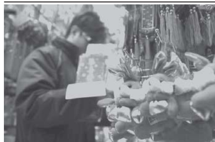
A customer selects New Year decorations in a market in Macao, south China, on 11 Jan, 2011 for the upcoming Spring Festival of the Year of Rabbit in Chinese Lunar Calendar.