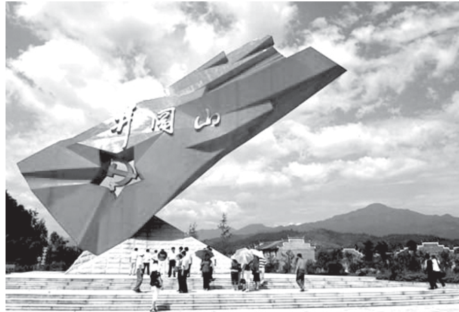
Tourists in Jingtangshan City in Jiangxi Province visit a sculpture incorporating the badge of the Communist Party of China, the red flag and the Chinese characters for the city of Jingtangshan.