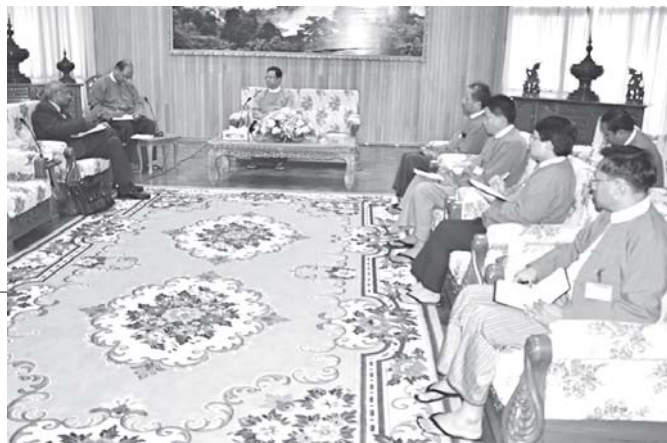
Minister for Electric Power No. 1 U Zaw Min meets Indian Ambassador Dr V S Seshadri.

They held discussions on cooperation in hydropower projects. MNA