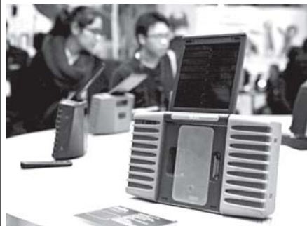
The Soutra solar powered sound system for iPod and iPhone is seen here being displayed in the Eton booth during the 2011 International Consumer Electronics Show at the Las Vegas Convention Centre, on 6 Jan, in Las Vegas, Nevada. Apple snubbed the event but vendors of accessories for its hot devices turned out in force.

The coach belonged to the Pingdingshan Transport Company.