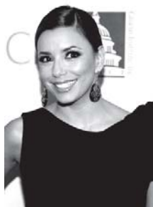
Actress Eva Longoria Parker.

The suit was filed Monday in Los Angeles County Superior Court.