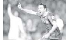
Barcelona midfielder Xavi Hernandez