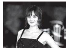
French actress Marion Cotillard.

After winning the best actress Oscar in 2007 for her role as iconic singer Edith Piaf in "La Vie en Rose," Cotillard has concentrated her career in larger Hollywood movies in