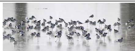
Sea gulls rest in the coastal wet land in Ganyu County of Lianyungang City, east China's Jiangsu Province, on 12 Jan, 2011.—XINHUA

The country was hit by the disease in 2000, 2002 and twice early last year.—Xinhua