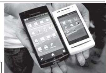
Sony Ericsson smartphones, Xperia Arc (L) and XperiaX8, are displayed during the 2011 International Consumer Electronics Show.