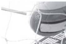
More than half of Europe's top football clubs are still in the red, with a record 1.2 billion euro losses about a year before UEFA's new financial rules kick in, the organization says.

“At present there are still 56 percent - that means more than half of all professional football clubs are in the red,” Infantino