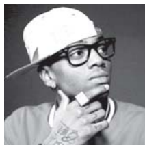
Artist Soulja Boy.

NEW YORK, 12 Jan—Soulja Boy is pulling a Kanye about Kanye West. The rapper's break-