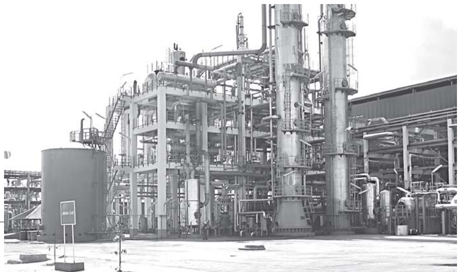
Photo shows No (5) Fertilizer Plant of Myanma Petrochemical Enterprise of the Ministry of Energy.

It is needed to make sustained efforts to scale up national development through industrialization.