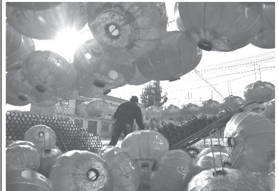
A farmer dries lanterns in the sun in Yangzhao Village of Yuncheng City, north China's Shanxi Province on 11 Jan, 2011. Farmers in Yangzhao Village, which is famous for producing lanterns, work hard to produce festival lanterns in order to meet the market demand as the Chinese Lunar New Year approaches.

Founded in 1956, the Wu Opera Troupe of Zhejiang has dedicated to rescuing and restoring the Wu opera, the second major theatrical genre in Zhejiang with a history of over 400 years.