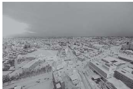
Photo taken on 11 Jan, 2011 shows an aerial view of Sapporo City in Hokkaido, Japan. Hokkaido is the northernmost one of Japan's four largest islands. In winter, the unmelted snow makes Hokkaido a white world, which attracts many tourists overseas.