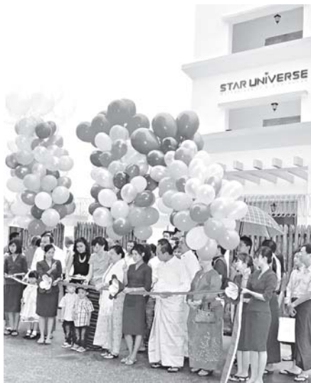
Opening ceremony of office of Media Lane, The Creative Agency and Myanmar Star Universe Co Ltd in progress.

High literacy rate is a source of national pride, reflecting high socio-economic status of the people. Therefore, all newly-literate people should keep reading in order to widen their horizons.