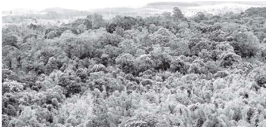
Thriving Silver Oak trees providing shade for coffee plants.

Kandawgyi watershed area. Since over the last ten years, coffee and silver Oak trees have been grown in Kandawgyi watershed area. Like Kandawgyi, Doegwin lake had to face shortage of water. Only after silver oak trees have been grown together with the coffee plants, did the lakes return to normal. In PyinOoLwin region, 261,035 silver oak trees and 1,305,175 "Kathit" (Erythrina arborescens) shady trees