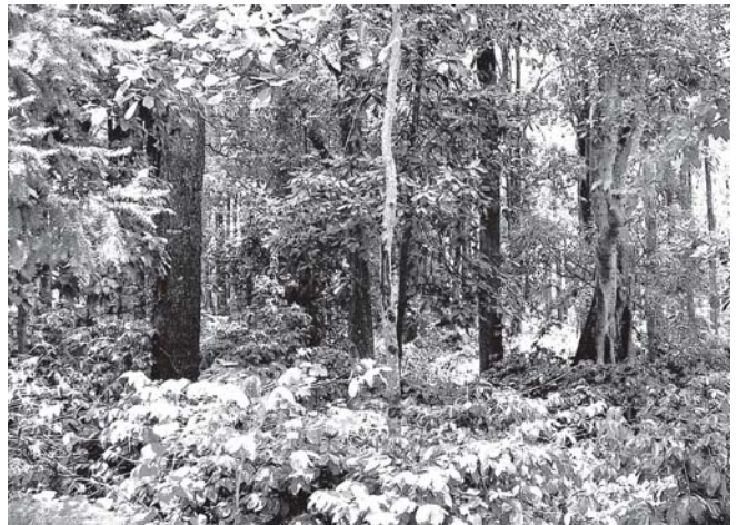
Photo shows coffee plantation among Silver Oak trees.

saplings at State-owned coffee farms, and are distributing them to the growers. At least 170 silver Oak saplings are to be grown in one acre of coffee farm. PyinOoLwin region is now covered with silver Oak forest because during the periods from 1995 to 2010, silver oak trees were grown together with coffee plants. In the past, the lake in National Landmark Garden, which is a glory of PyinOoLwin, often ran dry due to deforestation of