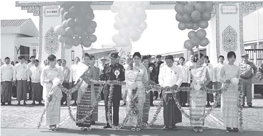
Commander Brig-Gen Tin Maung Win and Minister U Lun Thi formally open No (5) Fertilizer Plant (Pathein). —MNA

technologies from them, regular maintenance of machines, conducting in-service training courses to improve skills of workers in order that the plant will be able to regularly operate at full capacity, improvement of technological expertise and maintenance of machines, careful attention to technological dissemination, minimizing loss and unnecessary wastage, and security of the plant.