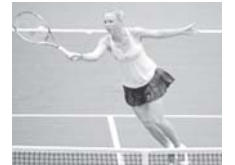
Caroline Wozniacki of Denmark plays a forehand volley against Dominika Cibulkova of Slovakia during their second round match at the Sydney International tennis tournament on 11 Jan, 2011.