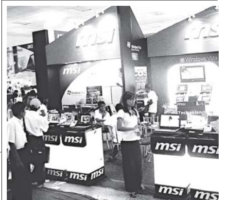
BOOTH STAGED: Products of Royal Smart Co., Ltd put on display at New Year Special Sales exhibition 2011 at Tatmadaw Convention Hall in Yangon on 12 January.—MNA

consumers meet and Vibrant Gujarat 2011 being held from 11 to 13 January. Officials saw off the delegation at Yangon International Airport. MNA