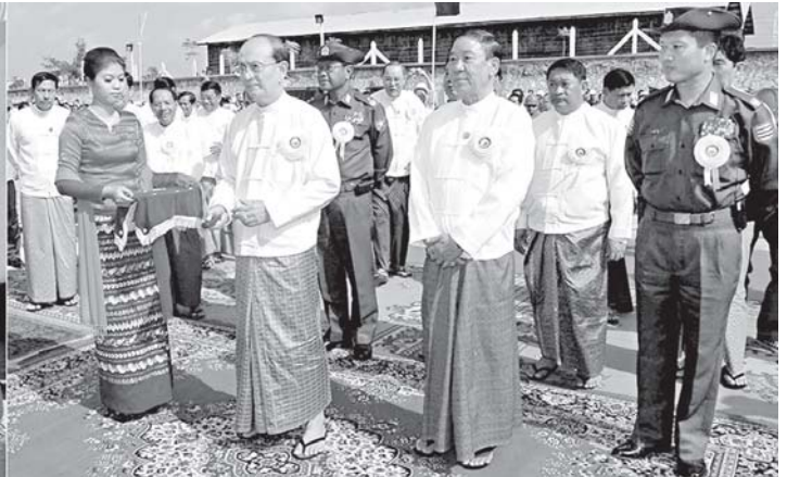
Prime Minister U Thein Sein unveils the stone plaque of No (5) Fertilizer Plant (Pathein).

region, district and township levels, the factory manager and workers, officials of China Huanqiu Contracting & Engineering Corporation of the