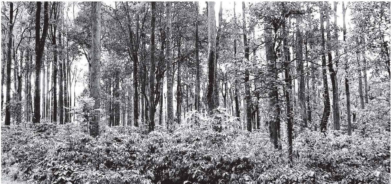
Coffee plantation seen together with Silver Oak trees in PyinOoLwin.

Scotland established Shan Mountain Coffee Estate, now called Chaungway, near Chaungway village, Nawngkhio Township, Shan State (North) about 30 miles north of PyinOoLwin. The estate had a total area of 400 acres, and of them, 350 (See page 9)