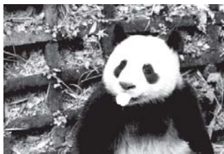
Giant pandas greatly prefer old-growth forests, a finding with repercussions for China's efforts to save the iconic species, according to a study published on Wednesday.

SAN DIEGO, 12 Jan— Giant pandas need old-growth forests as much as they need bamboo forests, a study by the San Diego Zoo in collaboration with other organizations concluded.