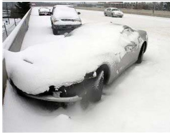
Snow covered cars sit idle alongside Interstate 85 after a snow carpeted the Deep South in Atlanta, Georgia, on 10 Jan, 2011.

During this winter, the virus strain has resurfaced in several European countries including Britain, Sweden, Iceland and Finland. —Xinhua