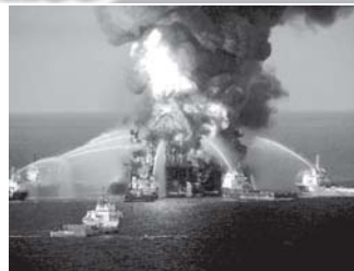
Fire boats battle the April 2010 blaze on the Deepwater Horizon oil rig in the Gulf of Mexico. A presidential commission probing the Gulf of Mexico oil spill said Tuesday that industry practices must be overhauled and a tough new safety watchdog set up to avoid a repeat of the disaster that killed 11 men and caused huge environmental damage.—INTERNET