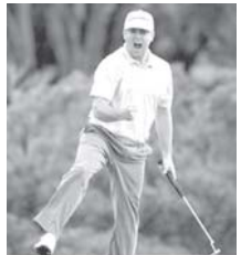
Robert Garrigus reacts after making an eagle putt on the 18th green during the third round of the Hyundai.