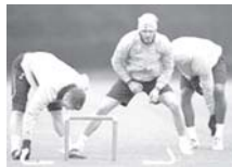
English footballer David Beckham (C) trains with Tottenham Hotspur at their Spurs Lodge training complex.

“There is nothing at the moment, but we will