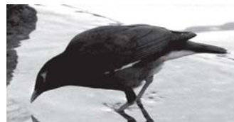
A mynah drinks water in a small water -falls in Fiji.