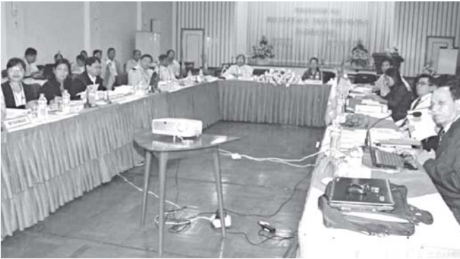
A workshop on coordination of processes to draw procedures to test biological effectiveness in progress.—MNA

NAY PYI TAW, 12 Jan—The Myanmar Agriculture Service of the Ministry of Agriculture and Irrigation and FAO regional office based in Bangkok, Thailand, co-organized a workshop on coordination of processes to draw procedures to test biological effectiveness