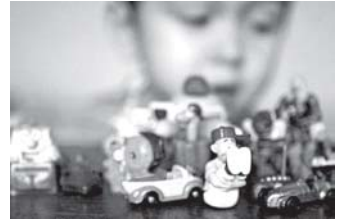
A child plays with small toys collected from the famous Kinder Surprise chocolate eggs.

confection in Italy in 1972, but has been denied access to the US market over concerns that tiny toys hidden inside the eggs pose a choking hazard to small children. The United States also prohibits embedding non-food items in confections.