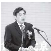
Beijing Mayor Guo Jinlong

BEIJING, 12 JAN—Xinhuanet Industrial Park — a major project of Xinhua News Agency to develop new media technologies — opened Tuesday at China New Media Development Zone in southern Beijing.