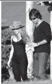
Colombian pop singer Shakira and her boyfriend Argentina's Antonio de la Rúa.

The new CD has a song titled "Grammy," which features singer-songwriter Ester Dean. Soulja Boy hopes that after the Grammy committee hears the track, it will change its "perception." West has earned 14 Grammys; Soulja Boy has not been up for an award since "Crank Dat" was nominated.— Internet