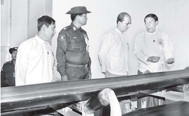
Prime Minister U Thein Sein at No (5) Fertilizer Plant (Pathein).