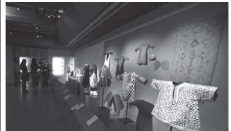
Audience visit an exhibition of Asian children's clothing at Guimet Museum in Paris, France, on 10 Jan, 2011. The exhibition with the theme of the "children's clothes, adults' mirror" will last till on 24 Jan, 2011.—XINHUA

Several roads in the area have been closed with motorists advised to avoid the area.—Xinhua