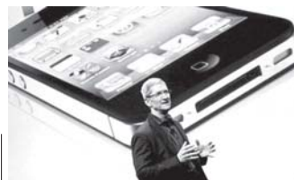
Apple Chief Operating Officer Tim Cook speaks during the Verizon iPhone announcement in New York City. Verizon Wireless announced Tuesday it will begin offering the Apple iPhone next month, ending AT&T's monopoly and raising the prospect of millions of additional buyers of the coveted device.

"We have enormous respect for the company Verizon has built and the loyalty they have earned from their customers," Cook added.— Xinhua