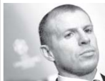
Celtic manager Neil Lennon

GLASGOW, 12 Jan — Celtic manager Neil Lennon was given a six-match touchline ban by the Scottish Football Association on Tuesday.