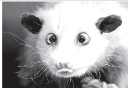
A cross-eyed opossum (didelphis) called Heidi sits in its interim enclosure, in the zoo in Leipzig, Germany, on Wednesday, 15 Dec, 2010. The animal came from a zoo in Denmark to Leipzig, where they found out that she is cross-eyed.

The boy was taken to a Woodward hospital for treatment. The scene was similar to one in "A Christmas Story," a 1983 movie adapted from Jean Shepard's memoir of a boy in the 1940s.