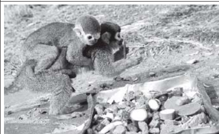
Animals have Laba feast during the Laba Festival in a wild animal park in Qingdao, east China's Shandong Province. Staff members in the animal park prepared special food according to folk traditions for the animals. Chinese people have long followed the tradition of celebrating the Laba Festival which falls on Tuesday this year. Laba literally means the eighth day of the twelfth month on Chinese lunar calendar.