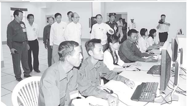
Prime Minister U Thein Sein inspects No (5) Fertilizer Plant (Pathein).

He stressed the importance of cooperative production of goods with foreign experts to learn