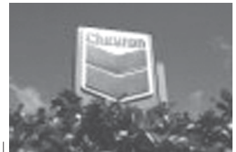
Chevron confirmed on Monday that one of its pipelines was breached in Nigeria, causing a suspension in production, after a militant group over the weekend claimed to bomb three different facilities.