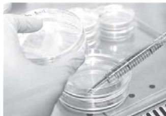
A researcher works in his laboratory at the Institute for Stem cell Therapy and Exploration of Monogenic Diseases.