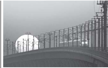
In this 18 Dec, 2010 photo, a CRH train runs on the Shanghai-Hangzhou high-speed railway as the sun sets in Jiaxing in east China's Zhejiang province.

The Chinese passenger train hit a record speed of 302 miles per hour (486 kilometres per hour) earlier this month during a test run of a yet-to-be opened link between Beijing and Shanghai, state media said.—INTERNET