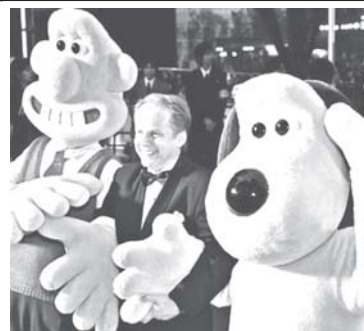
Park is in talks to develop a Wallace and Gromit theme park ride at Blackpool Pleasure Beach.

The Preston-born animator told Kirsty Young about the plan on Saturday's edition of the Radio 4 programme Desert Island Discs. "We are in the middle of discussions with Blackpool Pleasure Beach about a Wallace and Gromit ride," Park said. "It's not a hair-raising terrifying ride, it's a family friendly ride." Park, who has won four Oscars for his animated films, said some of his early inspiration came from his youthful reading of the Beano.—Internet