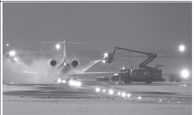
An aircraft is de-iced on the snow covered tarmac of Zaventem international airport near Brussels on 19 December, 2010. Heavy snow and freezing temperatures caused travel chaos across northern Europe during the weekend, with about 1,500 passengers being stranded for the night in Brussels due to bad weather conditions.