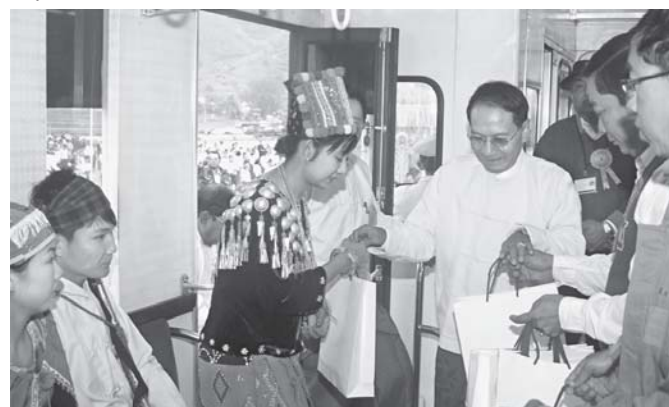
Minister U Tin Htut presents gifts to local people on board.