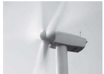
In this 19 July, 2009 photo, blades blur on a spinning windmill on Stetson Mountain in Range 8, Township 3, Maine.

But the other half of the Cape Wind project's electricity remains available with no obvious takers, raising the possibility of a smaller project with pricier power.