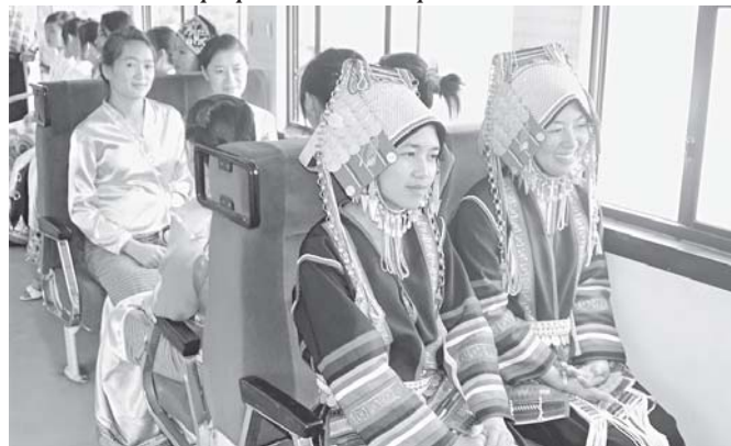
Local people on board the special train.

The transportation of locomotives and coaches which will ply on the railroad section was completed in a short range of time with cooperative contribution of staff of Myanmar Railways, officials of Public Works and of Township Electricity Supply, Tatmadawmen from local battalions.