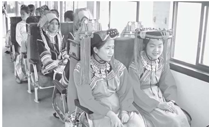
Local people on board the special train.

documentary photo taken together with local people at the ceremony.