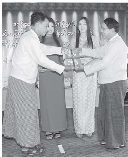
Patron of Rural Library Foundation Minister U Kyaw Hsan presents publications for village libraries through an official.