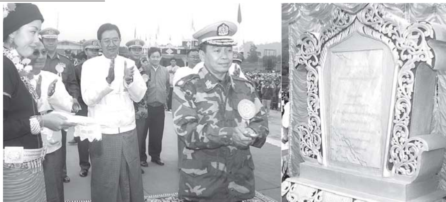
Commander Brig-Gen Than Tun Oo unveils stone inscription at opening of Kengtung-Wenkaung road section.