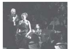
Egyptian actor Ezzat Abu-Ouf claps as Bushra goes to receive the Best Actress award for the film "six-seven-eight" in the Muhr Arab Feature category during the closing night and awards ceremony of the 7th Dubai International Film Festival on 19 December, 2010.

Twelve films competed in the best Arab film category, including entries from Egypt, Lebanon, Syria, Iraq and Morocco.