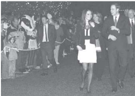
Britain's Prince William (R) and his fiancée Kate Middleton arrive at The Thursford Collection in Norfolk, England, 18 December, 2010.

The top prospect for Cape Wind is the state's second-largest electric utility, NStar. But NStar is uninterested and says it can find cheaper renewable power elsewhere.—Internet