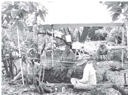
This photo provided on 17 Dec, 2010, by The International Group For Historic Aircraft Recovery (TIGHAR) shows researchers working at the dig site on the uninhabited island of Nikumaroro, in the South Pacific, where researchers say they found bone fragments that could help prove that famed aviator Amelia Earhart died as a castaway after failing in her quest to circumnavigate the globe.

It could be months before scientists know for sure — and it could turn out the bones are from a turtle. The fragments were found near a hollowed-out turtle shell that might have been used to collect rain water, but there were no other turtle parts nearby.