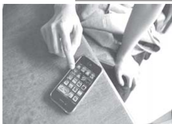
Traveller Sul-hee Kim, 25, of Seoul, looks for travel applications on her iPhone 4G at a restaurant in the Sultanhamet area of Istanbul, Turkey, in this 30 September, 2010 file photo.