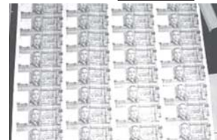
An uncut sheet of Philippine 500 pesos bank notes.

The new-generation banknotes, rolled out earlier this month and containing the signature of President Benigno Aquino who took office this year, bombed spectacularly in the graphics department, critics say.