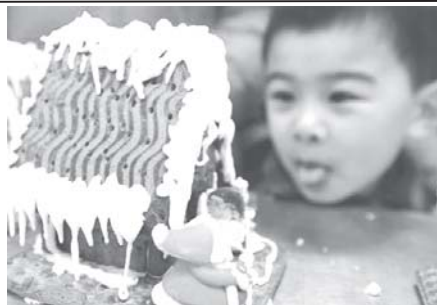
A Christmas cake is seen at a shopping mall in Huaibei, east China's Anhui Province, on 18 Dec, 2010. Chinese children were invited to a cake-making contest held in the shopping mall on 18 Dec, 2010, to "build Christmas cottages" with biscuits and cream as Christmas approaches.

Police say the ecstasy had a street value of about 20 million Australian dollars ($19.7 million).—Internet