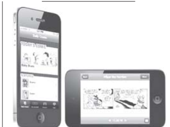
In this publicity image released by King Features Syndicate, comic strips ‘Baby Blues,’ left, and ‘Hagar the Horrible,’ are displayed on a portable digital device.

According to the demo, the Adam appears capable of performing all sorts of tasks with one finger, unlike the Apple iPad, like stretching content and scrolling through a page.