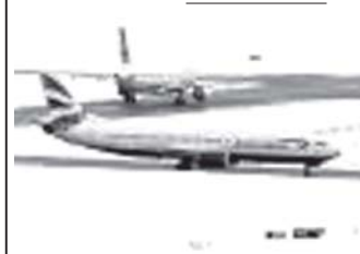
A British Airways plane surrounded by snow at Gatwick airport, West Sussex.

But there was little respite for people trying to get