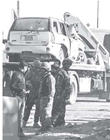
Iraqi security forces stand guard as a damaged vehicle is towed away after a bomb attack in Baghdad, Iraq, on 20 Dec, 2010.