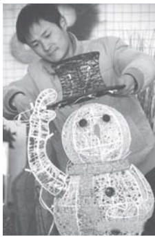
A craftsman trims a snowman made from iron wires in Linyi of east China's Shandong Province, 18 Dec, 2010. A craftwork manufacturer in Linyi designs and makes eco-friendly Christmas decorations with grass, wicker, iron wires, etc, and the Christmas products of the manufacturer are welcomed in European and American countries.