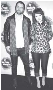
Zac Farro and Hayley Williams of the band Paramore, winners of mtvU's 2008 Woodie of the Year.

"A couple of months ago, Josh and Zac let us know they would be leaving the band after our show in Orlando last Sunday," Paramore said in a 18 Dec posting on its Web site. "None of us were really shocked. For the last year it hasn't