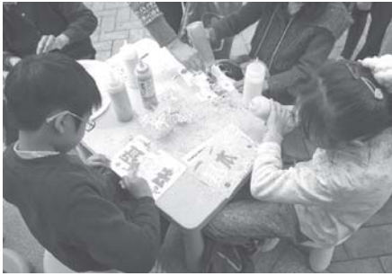
Kids take part in games during the Basic Law Carnival in Hong Kong, south China, on 19 Dec, 2010. Hong Kong held the carnival on Sunday to commemorate the 20 th anniversary of the promulgation of the Basic Law.