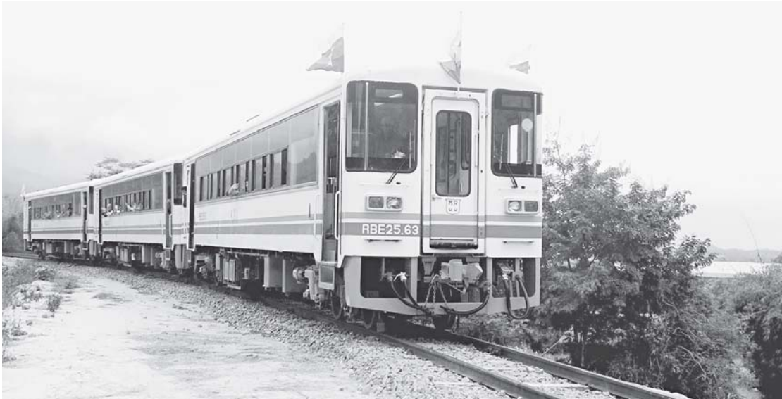
Train making its debut on Kengtung-Wenkaung railroad section of Mongnai-Kengtung railroad project.

It was attended by Chairman of Shan State (East) Peace and Development Council Commander of (See page 8)