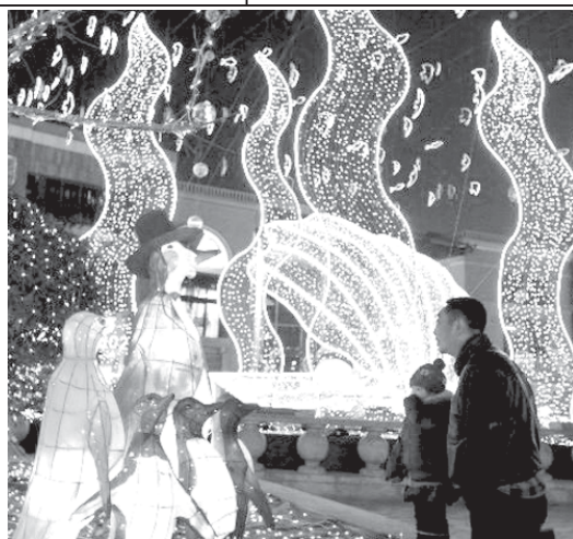
Visitors view light creations at the SOLANA Shopping Park in Beijing, Capital of China, on 19 Dec, 2010. More than 1,000 sets of light creations were presented at the 3rd SOLANA Lights Festival, which was launched here on 17 Dec, 2010.

"The positive demand shock has continued relentlessly," Barclays Capital said in a report. Prices will likely rise "given the strength in underlying fundamentals and with macroeconomic sentiment continuing to improve."—Internet