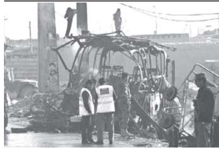
Investigators stand in front of a destroyed bus after a suicide attack in Kabul on 19 December, 2010.