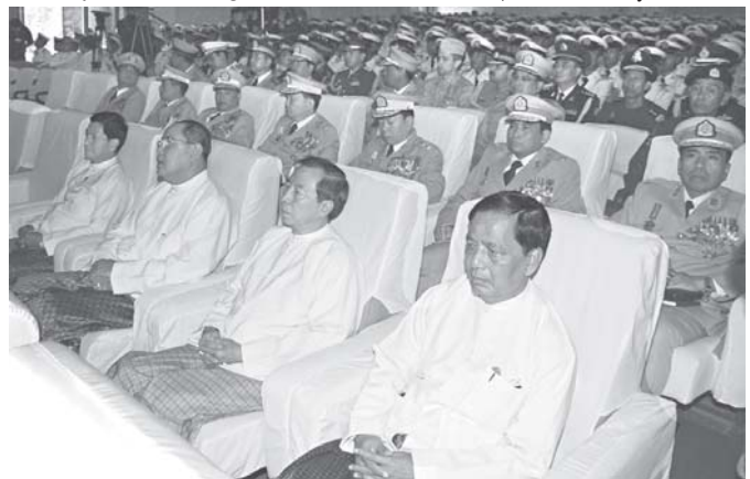
Dignitaries at the Graduation Parade of No. 53 Intake of the Defence Services Academy.—MNA

Dignitaries at the Graduation Parade of No. 53 Intake of DSA.—MNA