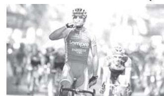
Italian Olympic Committee (Coni) prosecutors have asked for an entire family to be banned for doping offences related to a case involving Alessandro Petacchi, seen here in September 2010.

ROME, 10 Dec — Italian Olympic Committee (Coni) prosecutors have asked for an entire family to be banned for doping offences related to a case involving Alessandro Petacchi. Coni has asked for Petacchi's former Lampre