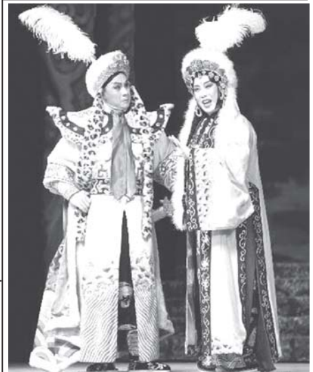
Artists from Heilongjiang Peking Opera Troupe perform "Lu Gou Xiao Yue" (the moon at dawn in Lu Gou) in Beijing, capital of China, on 8 Dec, 2010. The show reflects the life and culture of the Nuzhen people, an ancient nationality in China. Wednesday is the second day of the month-long demonstration of excellent Peking Opera plays in Beijing.