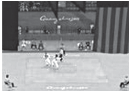
Competitors fight during the women's taekwondo quarterfinals at the Guangdong Stadium in Guangzhou.