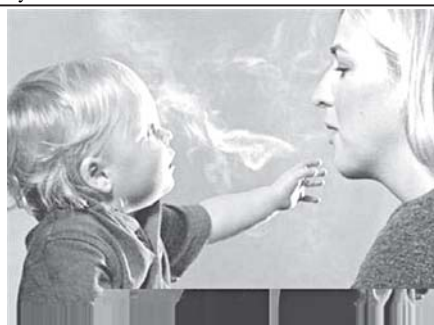
This handout image, released on November 10, 2010 depicts a mother blowing cigarette smoke in a child's face in one of the Federal Drug Administration's proposed new "graphic health warnings." Diseased lungs, dead bodies, a man on a ventilator and mothers blowing smoke in their children's faces are among the images US health officials are considering in their effort to revamp tobacco warning labels.