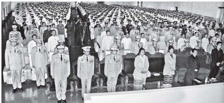
Com- mander-in- Chief of Defence Services Senior General Than Shwe takes salute of cadet battalions.