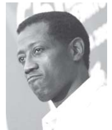
In this file photo, actor Wesley Snipes poses during the photo call for the film 'Brooklyn's Finest' at the Venice Film Festival in Venice, Italy. Snipes reports to the Federal Correctional Institution McKean in Lewis Run, Pa Thursday, on 9 Dec, 2010, to begin his three-year sentence for failing to pay taxes.

The most jarring aspect of the celebrity's stay might be the five daily head counts, three during the overnight hours. And Snipes, who earned a reported $13 million for the "Blade: Trinity" sequel, will have to adjust to earning just pennies an hour handling kitchen, laundry or other campus chores. He can spend just $290 a month at the prison commissary.