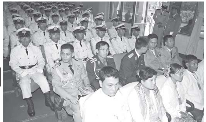
Dignitaries seen at the Graduation Parade of No. 53 Intake of the Defence Services Academy.

In nation-building, to ensure the simultaneous