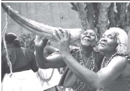
Dancers from coastal province of Kenya dance during the Kenya Music and Cultural Festival in the capital city of Nairobi, on 6 Dec, 2010.