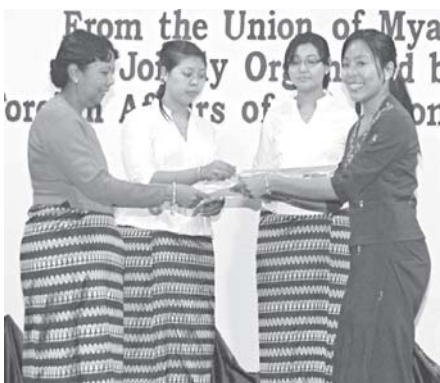
Director-General of Training, Research and Foreign Languages Department presents completion certificate to a trainee.

YANGON, 10 Dec— The International Laws Training, jointly conducted by the Ministry of Foreign Affairs and United Nations Institute for Training and Research (UNITAR) based in Geneva concluded at Chatrium Hotel, here, this evening.