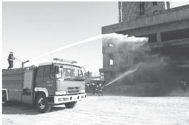
Firemen attend an anti-terrorism drill in Luliang City of north China's Shanxi Province, on 7 Dec, 2010.—XINHUA