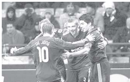
Ajax Amsterdam's Belgian defender Toby Alderweireld (C) celebrates after scoring with forward from Uruguay Luis Suarez (R).

"Klitschko Management Group are working on finding an alternative date with the SAP Arena (in Mannheim)," the fighter's team said in a statement on Thursday. "Tickets are still valid and once talks with the arena have been completed we will make the decision known," they said, refusing to say who he would be fighting against. —Internet