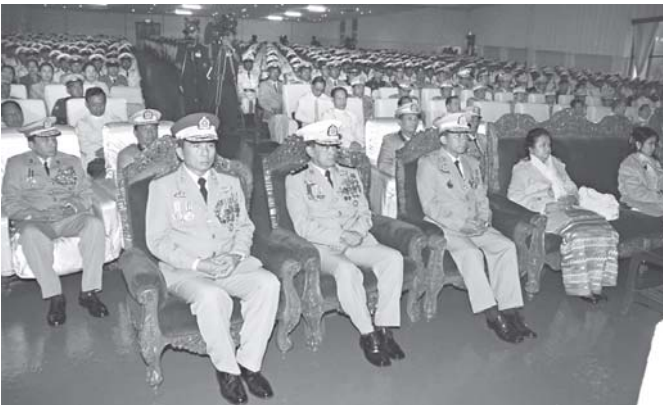
Dignitaries seen at the Graduation Parade of No. 53 Intake of the Defence Services Academy.

In uplifting the economy of the State, our Tatmadaw worked for agricultural development as the basis and then for all-round development of other sectors of the economy, as our country has been an agricultural country through generations.