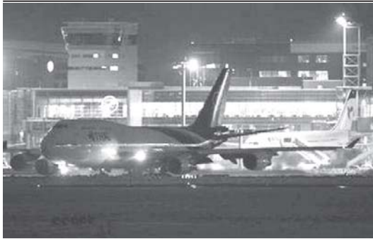
A Thai Airlines Boeing 747 passenger aircraft (L) is pictured at Frankfurt's Airport on 9 December, 2010.