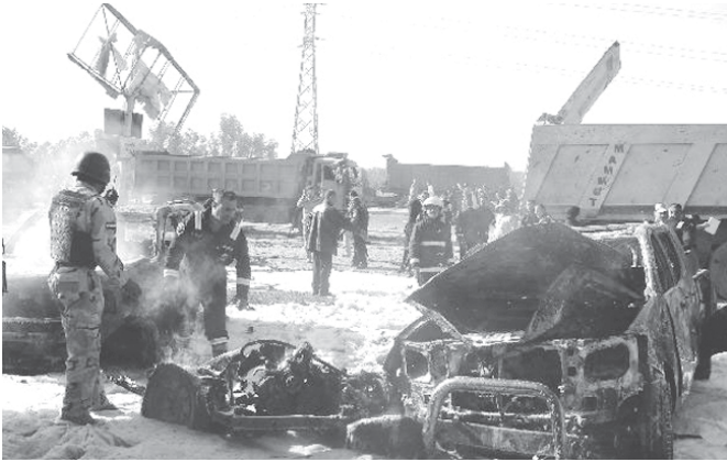
Firefighters hose down burnt vehicles after a bomb attack in the outskirts of Baghdad on 8 December, 2010.