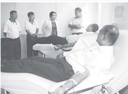
Myanmar Brewery Limited Family's members partaking in its 6th blood donation process.

We all Buddhists throughout the country are very pleased and honoured to learn that the 63 rd Sacred Tipitakadhara Tipitakakovida Selection Examination will be held at Mahapasana Cave (Great Cave) in the precinct of the Siri Mangala Kaba Aye Pagoda, Yangon, Myanmar and it will take 33 days starting from 12 December 2010. It is learnt that over 120 entitled candidates of members of Sangha who have been enrolled throughout the Union of Myanmar, will sit for the 63 rd Sacred Tipitakadhara Tipitakakovida Selection Examination of year 2011. Lodging and messing (four kinds of requisites) for candidates will be provided by the Ministry of Religious Affairs, other donors and well-wishers throughout 33 days. It is further learnt that devotees, well-wishers and other people are cordially invited to visit the Mahapasana Cave (examination centre) for paying profound respect to the members of Sangha who are sitting for the 63 rd Sacred Tipitakadhara Tipitakakovida Selection Examination of year 2011.