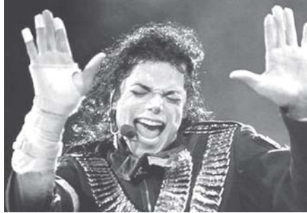
A second song from a new posthumous album by late pop legend Michael Jackson, seen here in 1993, was released on Thursday, days before the beyond-the-grave record hits music shops around the world.

The video for "Hold my Hand" "tells the story of the song through a collage of images of both Michael and Akon as well as people representing Michael's legacy, shining a light on the aura left behind by King