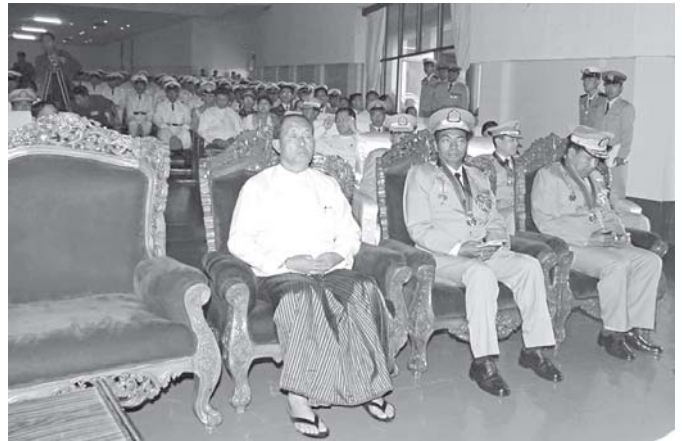
Dignitaries seen at the Graduation Parade of No. 53 Intake of the Defence Services Academy.

forest cultivation measures were put in place extensively and energetically to prevent wastage and deterioration of the valuable forest resources of Myanmar, while the Yoma Greening Project was implemented to