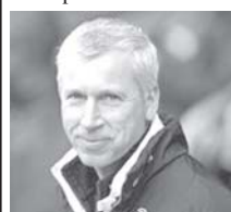
Former West Ham boss Alan Pardew, was on Thursday appointed the new coach of Newcastle, the Premier League club announced.

Newcastle owner Mike Ashley gave Pardew a five-and-a-half-year contract, an indication he wanted the sixth manager at St James' Park since he took charge in 2007 to stay for the long haul. It also appears to signal that Ashley, who tried and failed to sell Newcastle, was preparing to remain in control of the north-east club.