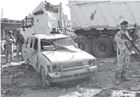
Iraqi soldiers inspect the site of a bomb attack in the outskirts of Baghdad on 8 December, 2010.