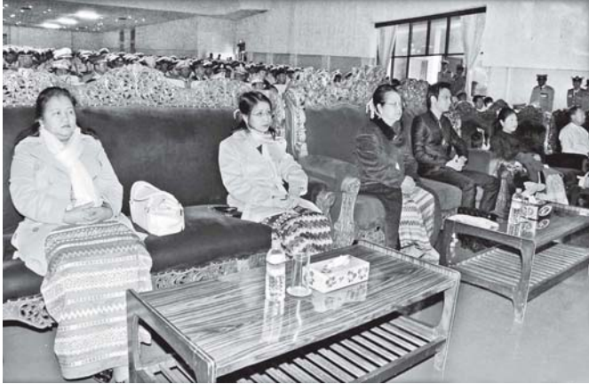
Dignitaries seen at the Graduation Parade of No. 53 Intake of the Defence Services Academy.—MNA