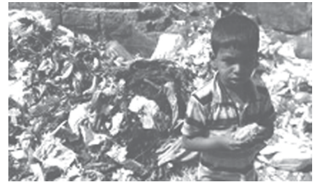
A street child eats a mango in Mumbai in February.

"The challenge now is to quickly revert to the high GDP growth path of nine percent plus and even find the means to cross the double-digit