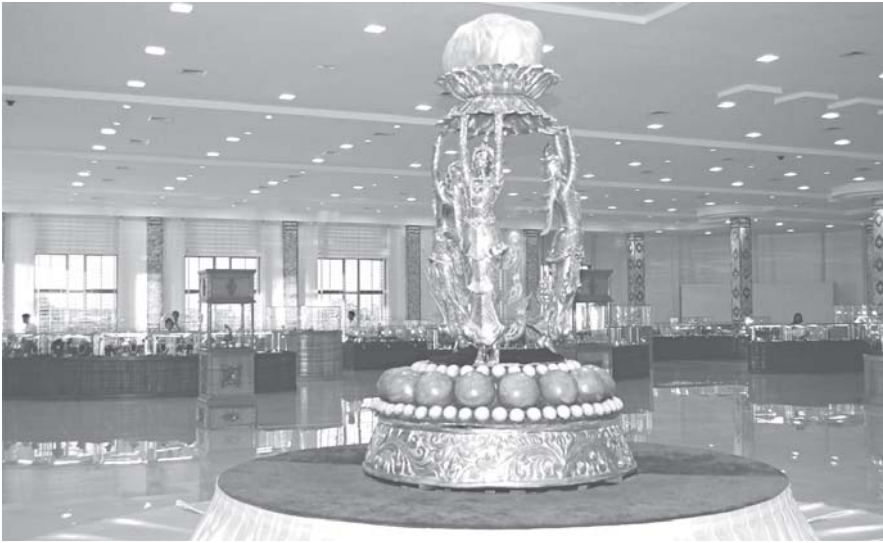
Gems and jewellery displayed at Myanma Gems Museum. (News on page 1)—MNA