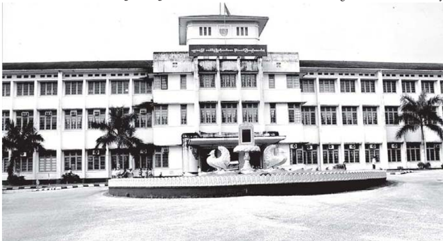
Photo shows Mawlamyine University after renovation.

Mawlamyine Inter-College in 1953. It was then upgraded to Mawlamyine College in 1963, Mawlamyine Degree College in 1981 and finally to Mawlamyine University in 1986. The university is conducting 19 undergraduate courses, 19 postgraduate courses, 15 postgraduate (Research) courses, and PhD course in marine science. Stu-