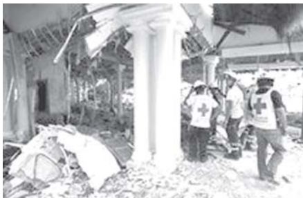
Members of the Red Cross stand near a destroyed area after an explosion at a hotel in Cancun on 14 Nov, 2010.—INTERNET

Officials from the Canadian embassy were not immediately available to comment.—Internet