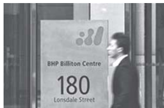
A man walks past the head office of BHP Billiton in central Melbourne on 18 October, 2010.

MELBOURNE, 16 Nov—Top global miner BHP Billiton (BHP.AX) scrapped its $39 billion bid for Canada's Potash Corp (POT.N), the world's biggest deal this year, and bowed to calls from investors to return cash with a $4.2 billion share buyback.