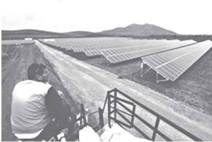
A worker looks on as he rests in a solar farm in Thiva, some 110 kilometres north of Athens on 14 November.