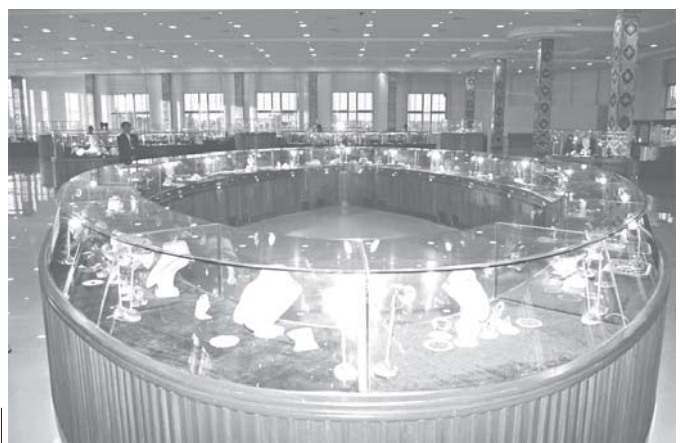
Gems and jewellery displayed at Myanmar Gems Museum.