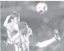
Chelsea's Paulo Ferreira (L) vies with Sunderland's Asamoah Gyan (R) during their English Premier League match.

"It is an injury, but he can control it. He has controlled it for 12 games. He is doing good prevention, good treatment. Everything will be okay for him."— Internet