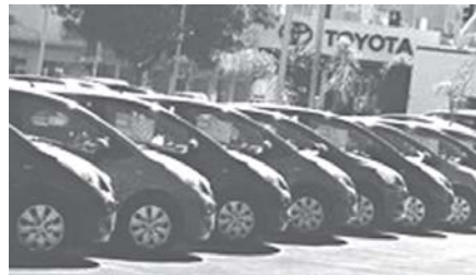
Toyota vehicles are lined up for sale at a car dealership.

TOKYO, 16 Nov—Japan's economy expanded in the third quarter as car buyers rushed to make the most of expiring subsidies and smokers scrambled to beat a tax hike, data showed Monday, but analysts warned of risks ahead.