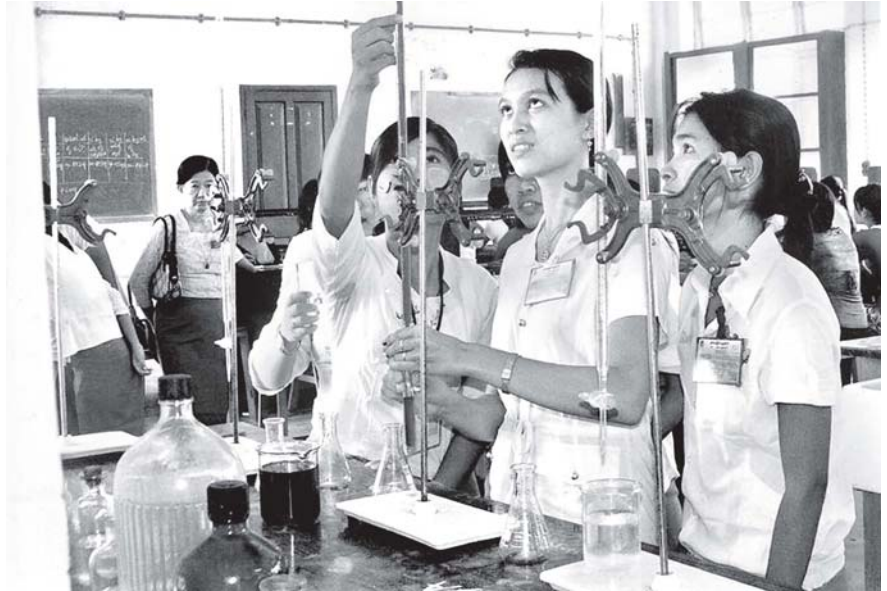
Students doing practical in the lab at Technological University (Mawlamyine).