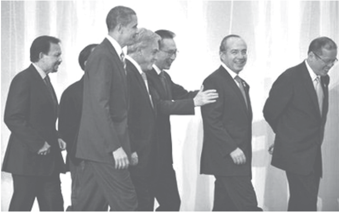
US President Barack Obama (C) walks with (L/R) Brunei Darussalam Sultan Haji Hassanal Bolkiah, Chilean President Sebastian Pinera Echenique, South Korean President Lee Myung-Bak, and Philippines President Benigno Aquino. Pacific Rim leaders including the US and China pledged Sunday to turn their dreams of a vast free-trade zone into reality.