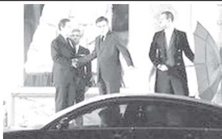
French Prime Minister Francois Fillon (C) shakes hand with France's President Nicolas Sarkozy (L).