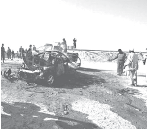
Afghan policemen stand guard at the site of a suicide attack in Ghazni Province.