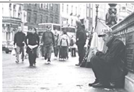
A beggar sits on O'Connell Bridge in the centre of Dublin, Ireland on 2 October, 2010.