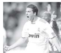
Real Madrid's Argentinian forward Gonzalo Higuain celebrates after scoring against Sporting during their Spanish first league football match at the Molinon Stadium in Gijon.