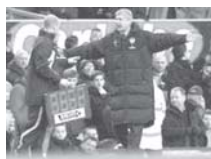
Arsenal manager Arsene Wenger (right) argues with the fourth official during their English Premier League match.

Wenger said: "It is very difficult for me for