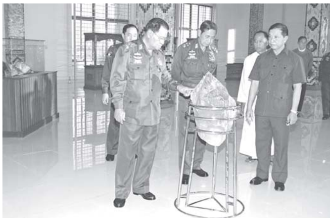
Senior General Than Shwe views Myanmar gems and jewellery on display at Myanmar Gems Museum.—MNA