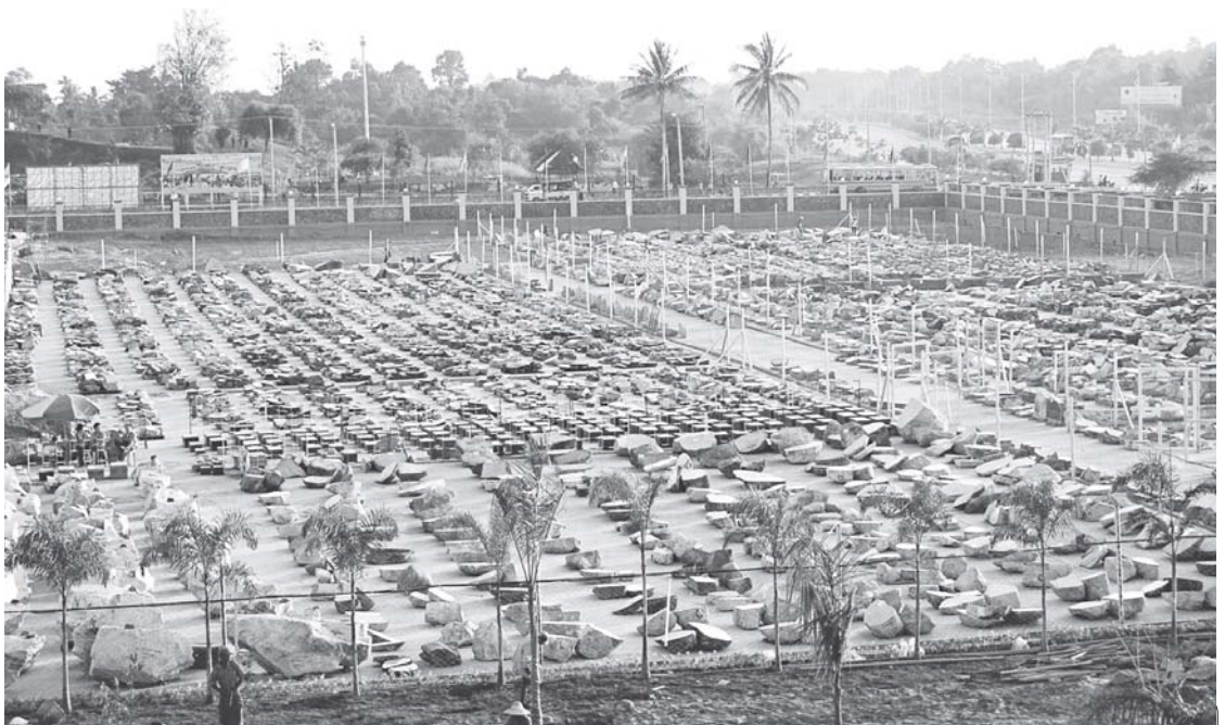
Photo shows display of lots of jade.