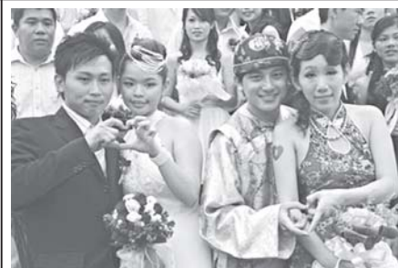
Newly wed couples pose at a photo session during a mass wedding ceremony at the Hokkien Association building in Klang, outside Kuala Lumpur, Malaysia recently.