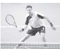
Swedish Robin Soderling returns the ball to his French opponent Gael Monfils during the Paris masters.