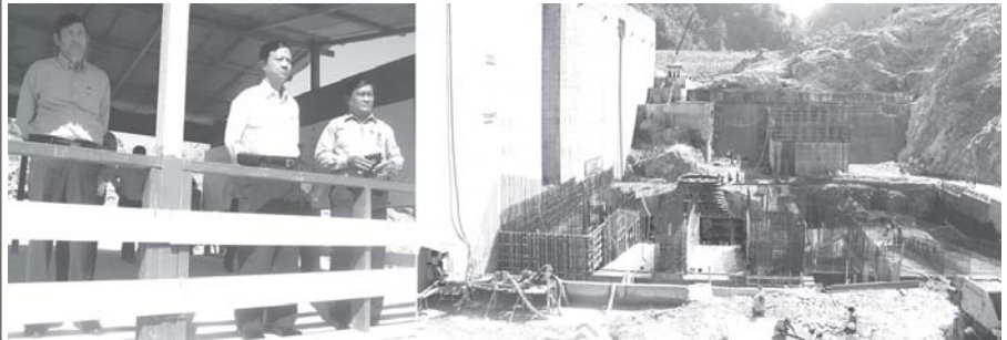
EP-1 Minister U Zaw Min inspects upper Paunglaung Hydropower Project.

NAY PYI TAW, 16 Nov — Minister for Electric Power No.1 U Zaw Min visited the upper Paunglaung Hydropower Project site, about 26 miles from Pyinmana in Nay Pyi Taw District yesterday morning. At the briefing hall, construction director U Thauang Han reported on progress in construction work. The minister gave an instruction on stockpiling and systematic using of all necessary construction materials.