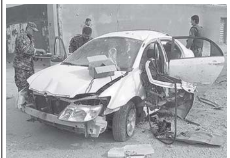
Iraqi security forces inspect a damaged car at a bombing site in Baghdad, Iraq recently. Police officials say a roadside bombing has targeted the convoy of a deputy minister in Iraq's government, killing and injuring several people.

More than 70 people were hospitalised after the blaze, Xinhua news agency reported earlier. The Shanghai Government information office later said the death toll had risen to 53. Residents and relatives searched hospitals for people who lived in the apartment in Jing'an District, many of them teachers and pensioners.—MNA/Reuters