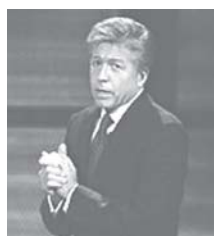
Bill McDermott, co-chief executive officer of SAP AG, speaks during the World Business Forum in New York.

global market for software that helps businesses run more