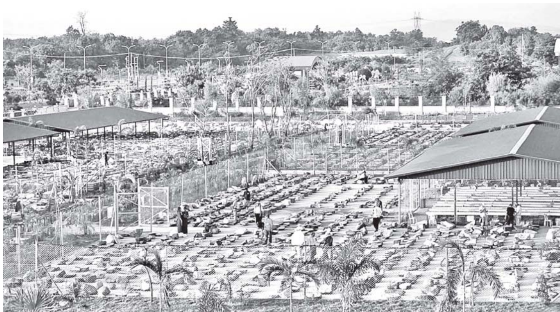
Senior General Than Shwe observes uncut jade decorated with flowery plants at Jade Garden.

On his arrival at Mani Yadana Jade Hall near Myanmar Gems Museum in Zabuthiri Township of Nay Pyi Taw District where 2010 Mid-year Myanmar Gems Emporium will take place, at 4.30 pm, Senior General Than Shwe was welcomed by Vice-Chairman of the State Peace and Development Council Deputy Commander-in-Chief of Defence Services Commander-in-Chief (Army) Vice-Senior General Maung Aye, Member of the panel of the patrons of central committee for organizing 2010 Mid-year Myanmar Gems Emporium Commander of