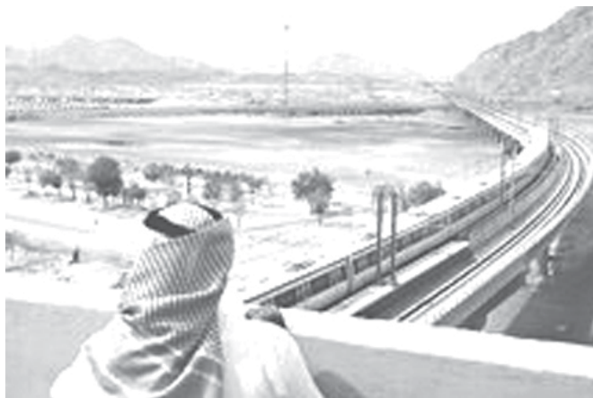
A man watching the Mecca Metro pass through the western Saudi City of Mecca.