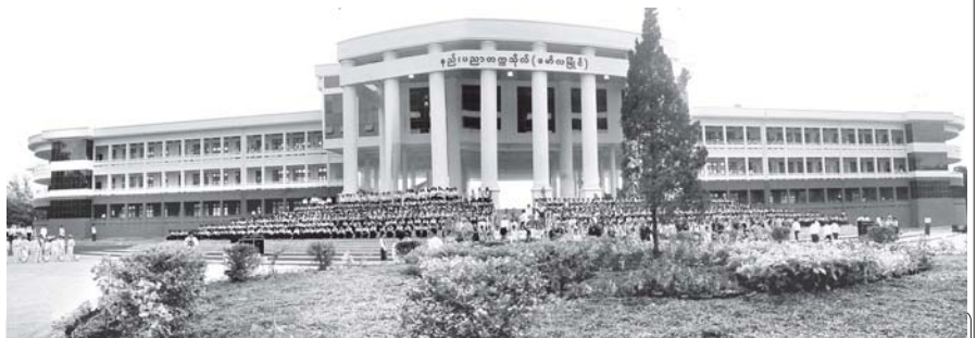
Technological University (Mawlamyine).

The third place we visited was University of Computer studies (Mawlamyine). The university came into existence as a Government Computer College in the compound of University