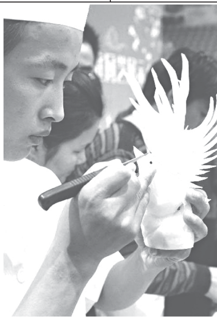
A resident cooks during the cooking section of 5 th neighbourhood festival in a community in Yixing City, of east China's Jiangsu Province recently.