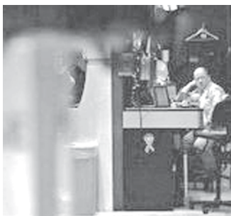
A trader sits at his stock terminal on the floor of the New York Stock Exchange in New York, on 14 November.

NEW YORK, 16 Nov—Without a boost from Washington policymakers or data showing budding strength in the economy, Wall Street's rally may be running out of fuel as the S&P 500 eases off its 2010 high.