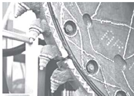
Detail of a cutting wheel used to lay a national Australia-wide network of broadband cable is seen in Sydney.

"While establishing a monopoly in this way would protect the viability of the government's investment project, it may not be optimal for cost efficiency and innovation," the Organisation for Economic Co-operation and Development (OECD) warned in a report, which groups the world's top economies.