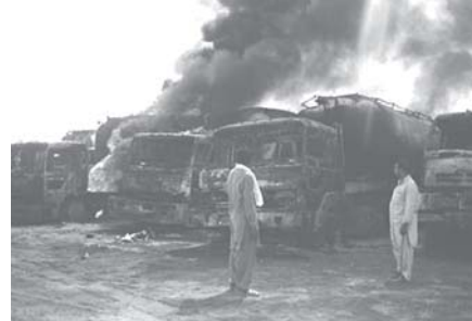
Local residents look to burning oil tankers after a militant attack in Mithri, about 200 kilometers (120 miles) east of Quetta, Pakistan recently.