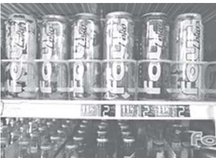
Cans of Four Loko are seen on display at a liquor store in Palo Alto, Calif, on 18 Oct, 2010.

Conservationists warn that stocks will collapse unless the International Commission for the Conservation of Atlantic Tunas (ICCAT), meeting in Paris for ten days from Wednesday, suspends or sharply reduces catches long enough for the species to recover.— Internet