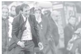
AC Milan's coach Massimiliano Allegri, seen here during his team's Italian Serie A match against Inter Milan, on 14 November, in San Siro stadium.

Ibrahimovic came back to haunt his former team as he scored the only goal of the game to give the rossoneri derby bragging rights despite the dismissal of Ignazio Abate.