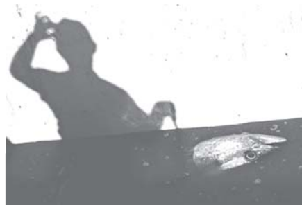
Fishermen haul out tuna after a catch.