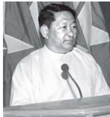
Minister for Hotels and Tourism U Soe Naing making a speech at concluding ceremony.