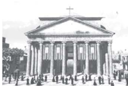
A screenshot of the Pantheon which will be part of the backdrop for the latest instalment of the video game phenomenon Assassin's Creed.