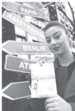
A young Albanian woman is seen with her new biometric passport in front of a sign showing European Capitals in the Albanian capital Tirana.

The 37-year-old waiter plans to celebrate the New Year with his brother who has