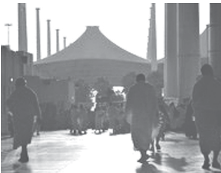
People arrive at King Abdulaziz International Airport in Jeddah last week for the Hajj pilgrimage.

It will also build what the statement called the world's tallest airport control tower at 133 metres (436 feet), and infrastructure linking the terminal with roads