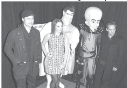
Cast members (L-R) Brad Pitt, Tina Fey, and Ben Stiller arrive for the premiere of the film "Megamind" in New York on 3 Nov, 2010.

did that good without much of a boost from pricey 3-D admissions, as only 66 percent of the gross came from 3D shows, of which 7 percent was IMAX 3D. The movie is especially popular with young and female moviegoers, as 52 percent of the audience was under 25, and 57 percent was female, the distributor's exit polls show. Opening in second place is "Due Date," a road-film comedy released by Warner Bros. and took in 33.5 million dollars, the eighth-biggest opening ever for an R-rated comedy.