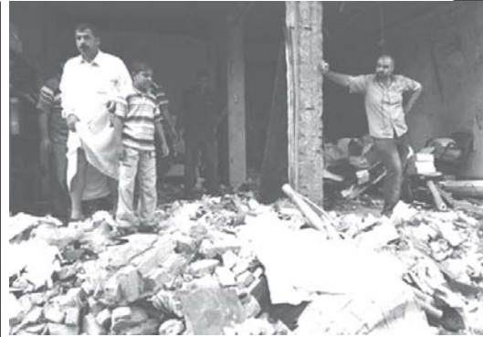
People stand at the scene an explosion in Basra, Iraq’s second-largest city, 550 kilometres (340 miles) southeast of Baghdad, Iraq, recently.