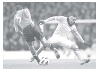
Manchester City's Argentinian striker Carlos Tevez (R) vies with Manchester United's English defender Rio Ferdinand during a match at the City of Manchester stadium on 10 Nov.