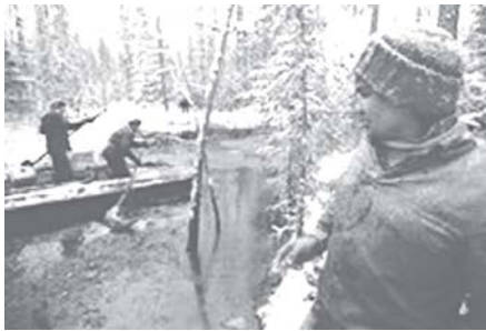
Workers on a boat navigate the Kolva river as they try to clean up an oil spill.

In Asia on Tuesday, crude traders took their cues from stock markets