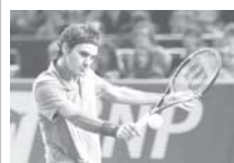
Switzerland's Roger Federer returns a backhand to French Richard Gasquet during their Paris Masters 1000 ATP tennis tournament second round match.