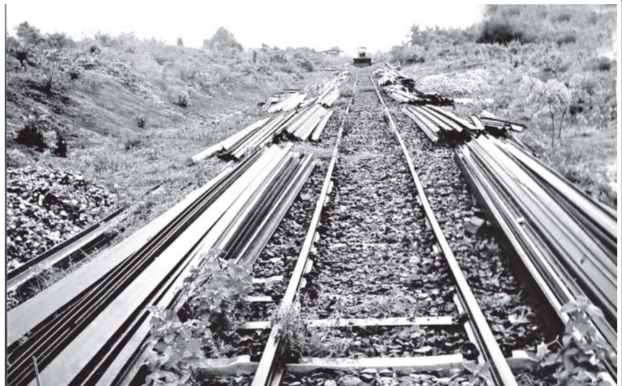
Railroad tracks ready for service.