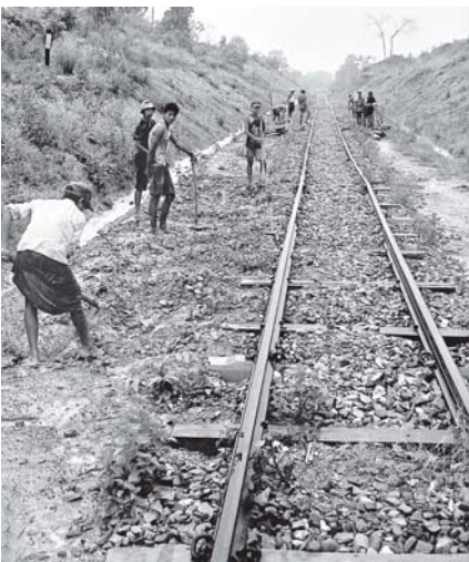
Maintenance works carried out in all weathers.

The construction of 28 under 40 feet long bridges have been completed out of 31 bridges and three 40-180 feet long bridges, out of four between