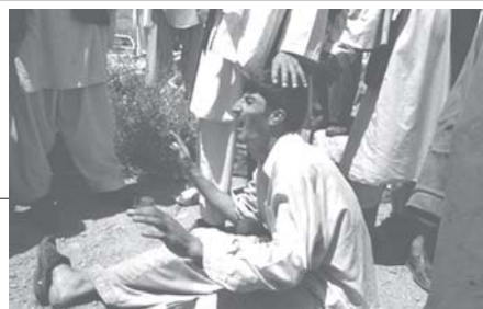
A relative mourns for Afghans who the mourners said were killed by US forces during a raid in Sayed Abad District of Wardak Province west of Kabul, Afghanistan recently.

Attackers detonated bombs or fired mortar rounds in more than a dozen attacks in the Iraqi capital late on Tuesday and early on Wednesday, the security sources said. An Iraqi police source put the toll at three dead and 37 wounded, while an Interior Ministry source said four people were killed and 33 wounded. Both sources asked not to be named. — MNA/Reuters