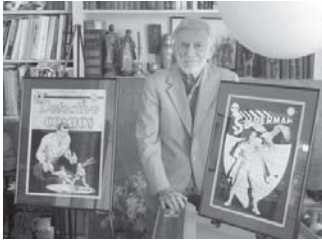
In this undated photo released on 8 Nov. 2010 by ComicConnect.com, Jerry Robinson, who created the Joker, stands with the two framed covers, Superman #14 and Detective Comics #69, that will be offered for auction on ComicConnect.com.