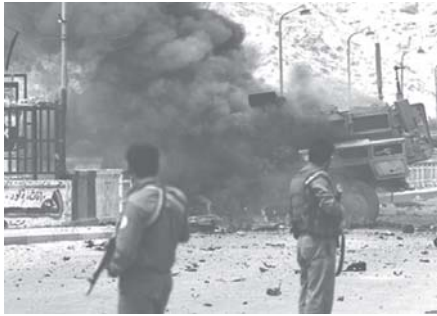
Afghan policemen watch a burning NATO vehicle after the convoy was hit by a suicide attack in Jalalabad, Afghanistan recently. INTERNET