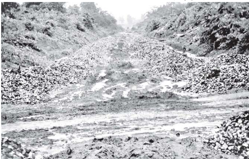
Alignment for Moetargyi-Chaungwa railroad section.