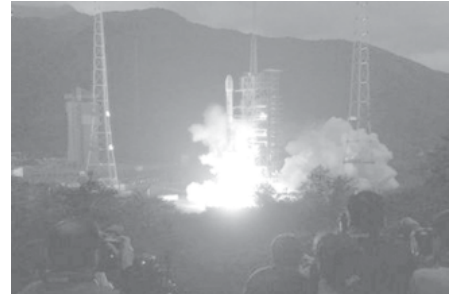
A Long March 3C rocket carrying the Chang'e-2 probe, set to go into lunar orbit, blasts off from its launch centre in Xichang in the southwestern province of Sichuan on 1 Oct, 2010. China has unveiled photos taken by the lunar probe of the moon's Sinus Iridium, the area marked out for the nation's first landing, highlighting the success of the mission so far.

The images of Sinus Iridium, also known as the Bay of Rainbows, show the surface is "quite flat" with craters and rocks of different sizes.