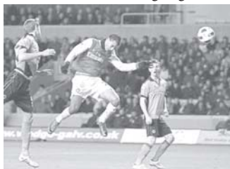
Arsenal's French-Moroccan striker Marouane Chamakh (2nd L) scores the opening goal of the English Premier League football match between Wolverhampton Wanderers and Arsenal at Molineux Stadium.

WOLVERHAMPTON, 11 Nov—Marouane Chamakh scored Arsenal's fastest ever Premier League goal and