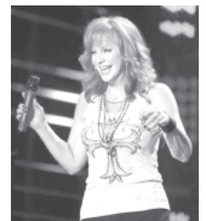
Country singer Reba McEntire performs during the CMA Music Festival at LP Field in Nashville.

1986 — around the time Lambert turned 3 and Scott was a few months old — and a quarter of a century later at 55, she's still as vibrant and active as ever. She's up for female vocalist of the year Wednesday night and is poised to release her 34th album, "All The Women I Am," the day before. —Internet