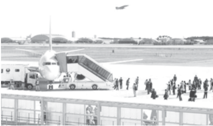
Journalists surround a Skymark jetliner at Ibaraki airport, northeast of Tokyo. Japan's low-cost carrier Skymark Airlines said Monday it will buy four A380 superjumbos from Airbus, with an option on two more, in a deal worth a total of two billion euros by catalogue price.

tions it has not yet announced. "The company plans to introduce the aircraft for international flights to start in fiscal year 2014 and to operate major international routes," it said in a Japanese-language Press release. —Internet