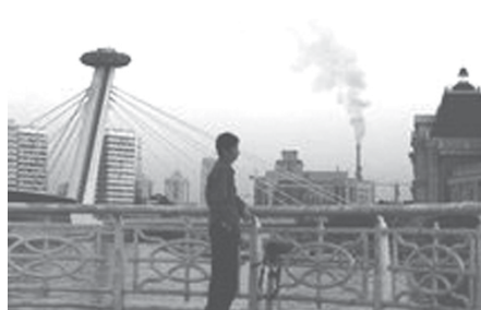
Smoke rises from a chimney in the northern port city of Tianjin in October 2010.