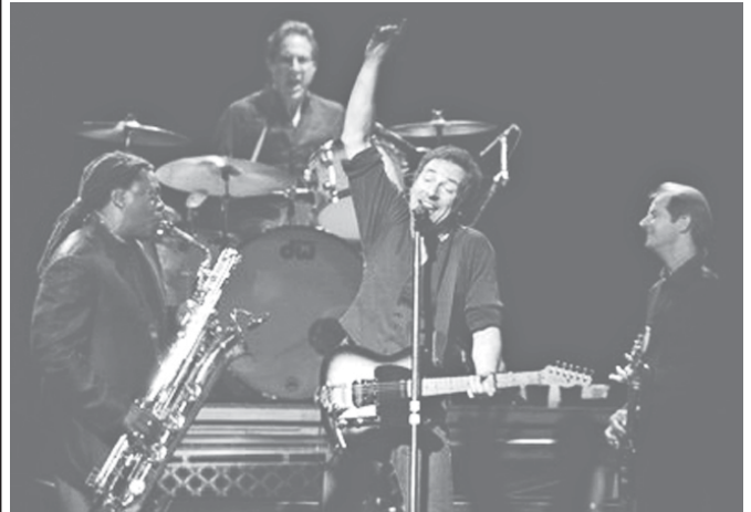
In this file photo, Bruce Springsteen, second from right, performs with members of the E Street Band during a concert at the Great Western Forum in Inglewood, Calif.

NEW YORK, 11 Nov— A uniquely crafted new Springsteen concert video promises to stoke the souls of insatiable Bruce buffs. And, judging from the wild response at its big-screen premiere, film fanatics may be captivated as well.