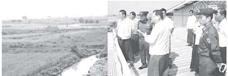
Maj-Gen Tin Ngwe of Ministry of Defence visits the site for construction of Container Terminal at corner of Shweli and Ponnami Roads in Dagon Myothit (Seikkan) Township.

YANGON, 11 Nov—Maj-Gen Tin Ngwe of the Ministry of Defence, accompanied by Chairman of Yangon Region Peace and Development Council Commander of Yangon Command Brig-Gen Tun Than and officials, looked into tarmacking of Yadana Road in Dagon Myothit (Seikkan) Township this morning.