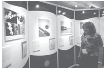
removing or adding to existing structures and nano-medical researchers are building new ways to deliver drugs.

Physicists are developing new materials by