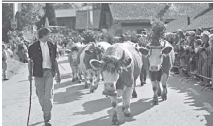
Local herdsmen and their families in traditional dress drive their cows down the mountains during the Desalpe festival in Etivaz, Switzerland. The Desalpe is the customary annual procession when cows make their way down to the plain at the beginning of autumn after more than four months of grazing on the Alpine pastures during the summer.