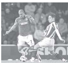
West Ham's Kieron Dyer (L) vies with West Brom's Frahan Dorrans (R) during their English Premier League match at the Boleyn Ground on 10 Nov, 2010.

Peter Odemwingie had put the Baggies in front from the penalty spot on 28 minutes, but West Ham fought back level before the break when Scott Parker smashed in a 25-yard effort. Frederic Piquionne put West Ham ahead from the spot at the start of the second half and then missed a great chance to make it 3-1 before Pablo Ibanez headed in an equaliser to earn the visitors a share of the spoils on Wednesday.—Internet