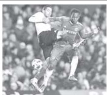
Chelsea's Ghanaian midfielder Michael Essien (R) fights for the ball with Fulham's US midfielder Clint Dempsey (L) during their English Premier League football match at Stamford Bridge in London.