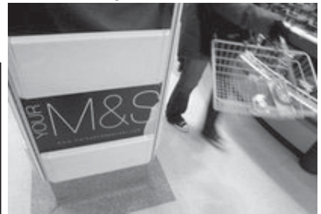
A shopper walks past a Marks and Spencer sign at a store at Covent garden in London, 2006.

In food, more customers chose to shop with us recognising our quality, innovation, and improved values."—INTERNET