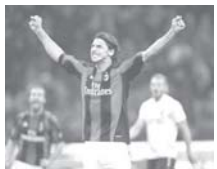
AC Milan's Swedish forward Zlatan Ibrahimovic celebrates after scoring against Palermo during their Italian Serie A match in San Siro stadium in Milan.