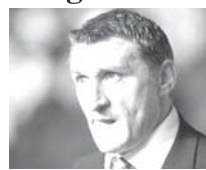
Tony Mowbray, pictured at Celtic Park, Glasgow, last October while he was Celtic manager.

Formerly in charge of West Brom and Hibs, Mowbray had a disastrous spell as coach of Glasgow giants Celtic which lasted