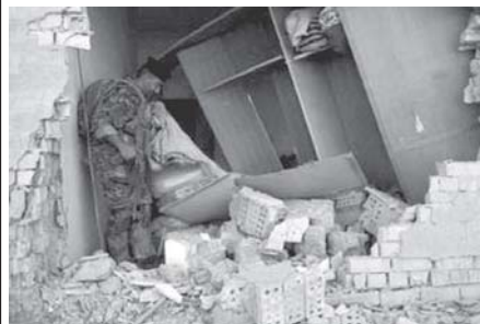
A policeman inspects the site of a bomb attack in Tikrit, 150 km (95 miles) north of Baghdad recently.