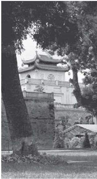
A picture shows a newly restored pavillion inside the former imperial citadel of Thang Long in Hanoi. The world culture body UNESCO on Friday confirmed the ancient citadel as a World Heritage site during a ceremony to begin celebrations marking the city's 1,000th anniversary.