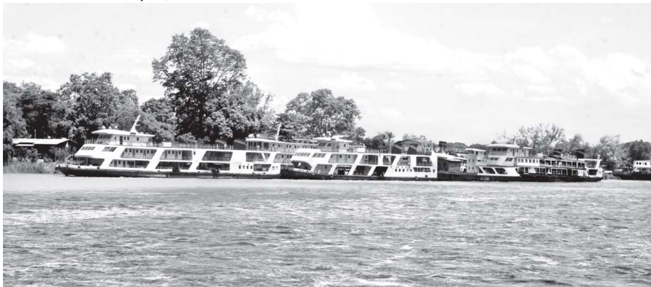
Passenger vessels are running everyday for convenience of travellers.