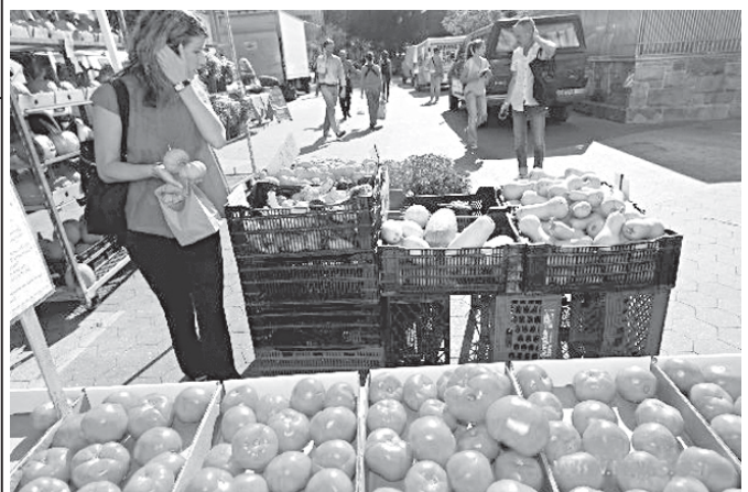
A citizen buys vegetable at the New Green City Fair 2010, New York City's largest annual green event, held in Union Square Park, New York, the United States.

"They appeared to be exhausted and unable to fly," Syncrude said in a statement. "Birds that landed on roads and parking lots were approachable, strengthening the opinion that fatigue forced them to land."—Internet