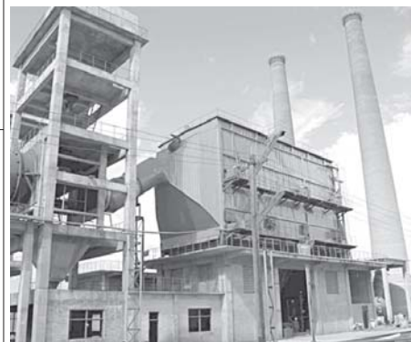
Maj-Gen Aung Than Htut at Nagar Cement

section and operation theatre, X-ray room and medicine store of Pinlaung People's Hospital and presented foodstuff and cash assistance to patients and medicines to the