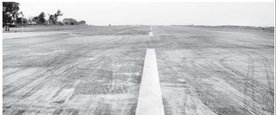
The extended runway of Kengtung Airport.