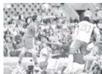
South African defender Bongani Khumalo, pictured (right) scoring the opener in the 2-1 World Cup victory.

The 23-year-old impressed Spurs boss Harry Redknapp during a trial in