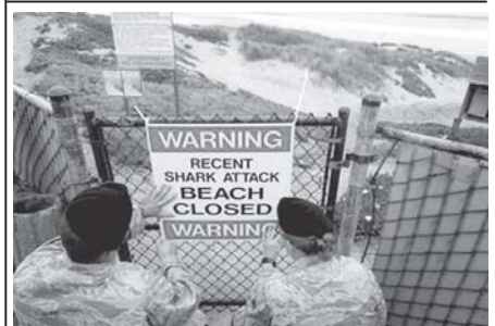
Airmen post a sign warning surfers of a recent shark attack Friday, on 22 Oct, 2010, at Vandenburg Air Force Base, Calif. INTERNET