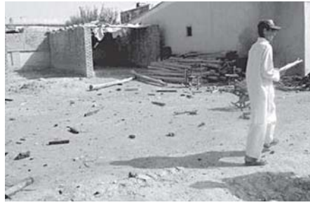
File photo show an Afghan boy walks at the site of a blast at a polling station in Khost Province.