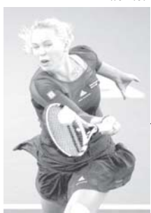
Caroline Wozniacki of Denmark returns a shot against Vera Zvonareva of Russia in Beijing on 11 October.