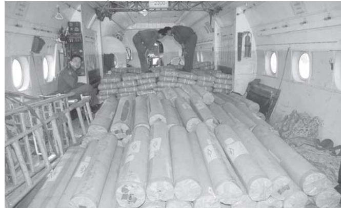
Tatmadawmen loading up the plane with relief aids to be supplied to the storm-hit regions in Rakhine State.