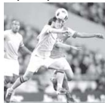
Manchester City have vowed to comply with UEFA's new financial fair-play rules despite lavish investment.

LONDON, 28 Oct — Manchester City have vowed to comply with UEFA's new financial fair-play rules despite lavish investment of more than 500 million dollars in only two years, it was