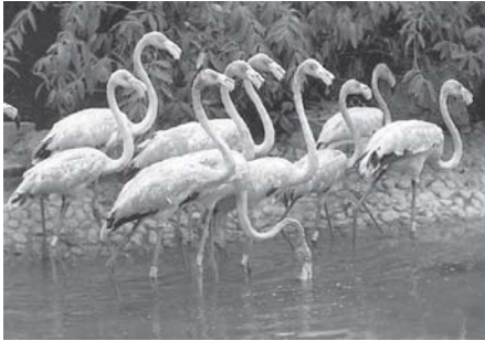
Flamingos from Cuba are seen at the Yangzhou zoo in Zhuyuan scenic spot, Yangzhou, east China's Jiangsu Province. Eleven flamingos from Cuba started to live in Yangzhou.