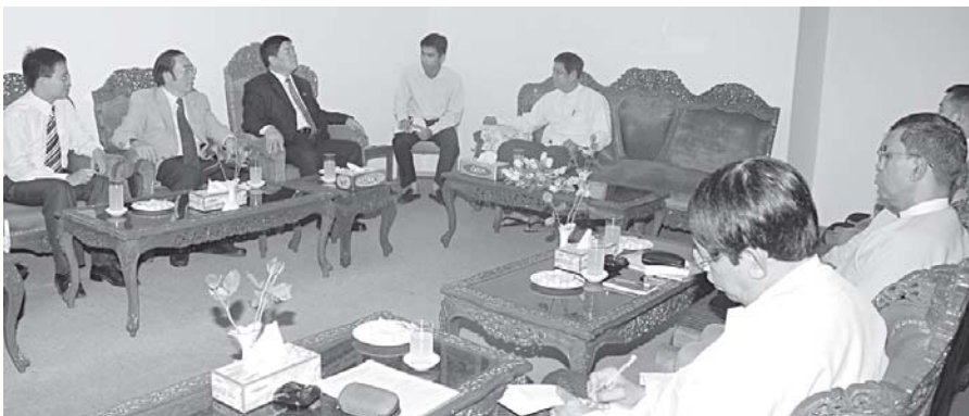
Minister U Htay Oo receives Vietnamese Ambassador Mr. Chu Cong Phung.