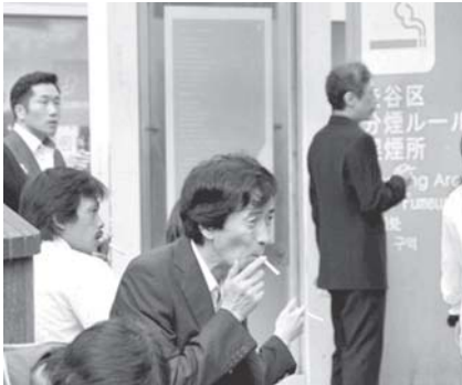
People are seen smoking cigarettes at a designated smoking area in Tokyo. Japan on Friday imposed the biggest tax hike on cigarettes in its history, with some brands costing nearly 40 percent more in a country seen as a smoker's haven.