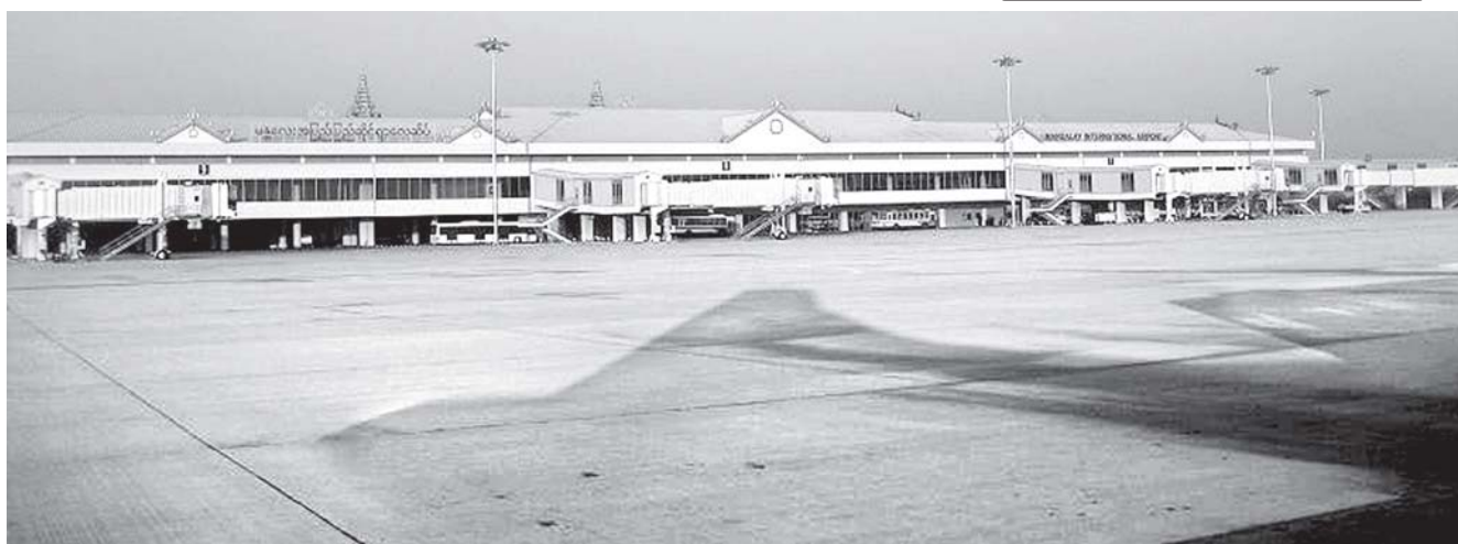
Photo shows magnificent Mandalay International Airport.

I recently paid a visit to the only uncle on my mother side on a holiday. My uncle is by nature happy to receive his relatives in his home. He is in the habit of hoping the visits of relatives. When I got into his house, he was reading newspaper and watching TV. As he always reads newspaper and watches TV, he