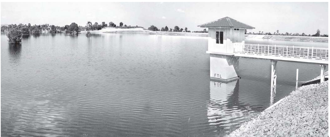
Kandaunt Dam helping farmers in Pale Township in Sagaing Region to practise multiple-cropping pattern.