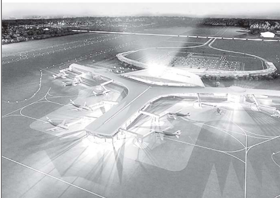
The aerial view of design of Nay Pyi Taw International Airport upon its completion.