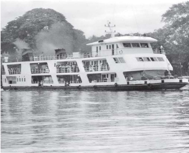
A passenger vessel leaving Bhamo Port for Mandalay.