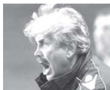
Monaco's coach Guy Lacombe reacts during the French LI football match Monaco vs Valenciennes.

The club from the principality are on a dreadful run of form and the players confidence is draining away, with just one win in their last 10 league matches, have failed to