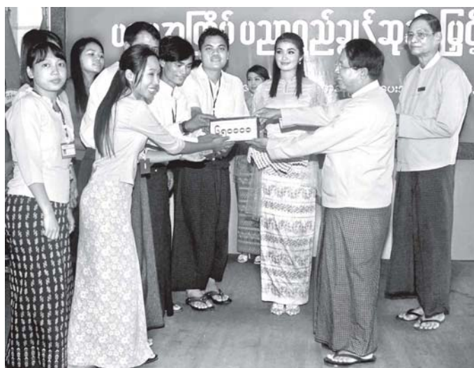
Minister for Information U Kyaw Hsan accepts a projector and gifts presented by trainees from Journalism Course No. (1/2010) for MWJA.