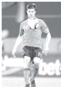
Spain's midfielder Xabi Alonso controls the ball during his Euro 2012 group 1 qualifying match.