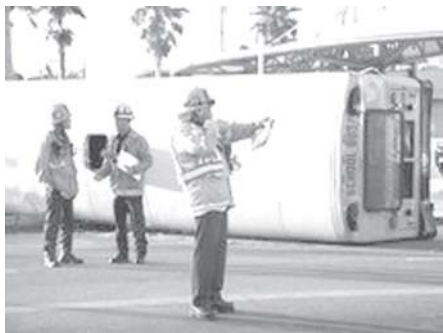
3 boys face charges in Calif school bus crash.