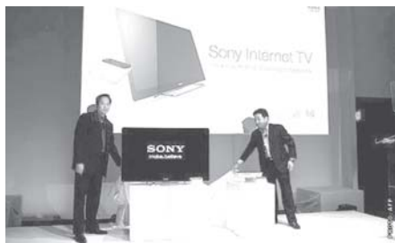
Japanese electronics giant Sony unveiled a line of television sets on Tuesday featuring "Google TV," which merges online content with traditional television programming.—INTERNET

One World Trade Center (L), also known by its former name Freedom Tower, rises in Lower Manhattan on 17 September, 2010.—INTERNET