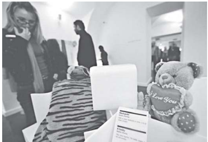
A visitor looks at stuffed toys displayed at the Museum of Broken Relationships in Zagreb. The exhibition features over 700 material remnants of failed romances from the mundane and sad to bizarre and even downright kinky.