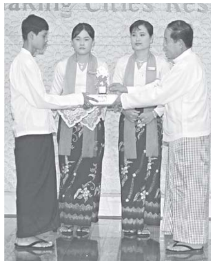
Minister for Social Welfare, Relief and Resettlement U Maung Maung Swe presents prize to a winner.

Taking lessons from sufferings faced by Indonesia, Thailand, eastern India and Sri Lanka due to tsunami tidal waves that occurred in December 2004, Myanmar formed the National Disaster Preparedness Central Committee and 10 subcommittees with the Prime Minister at the helm along with ministers and departmental heads and laid down work programmes systematically.