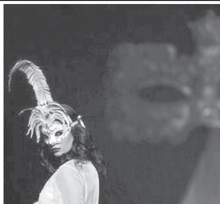
A model shows off a creation during the Nayomi winter 2010 nightwear fashion show in Dubai.