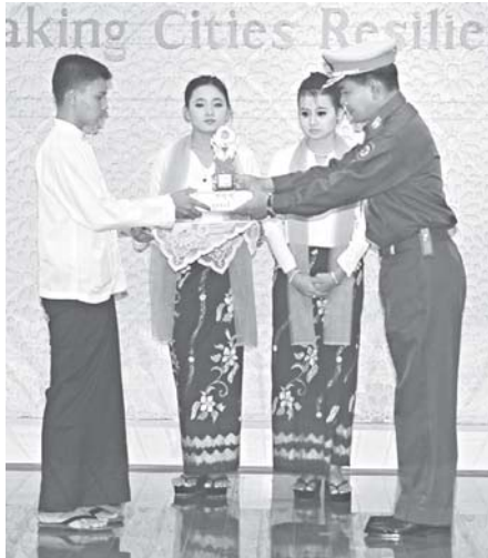
Commander of Nay Pyi Taw Command Brig-Gen Maung Maung Aye awards prize to a winner.

ries and State-owned infrastructural buildings and suffer heavy loss in the face of natural disasters. UN disaster reduction strategy department is taking measures for establishment of disaster resilient cities in 2010 and 2011. The theme of the movement is "My City is Getting Ready".