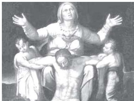
A painting believed to be by Michelangelo, belonging to a New York family, may be the art find of the century.

A family in New York may have had an unfinished Michelangelo painting hanging on their living room wall for a year.