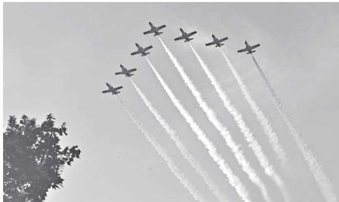
Spanish air force take part in a military parade during Spain's National Day in Madrid, Spain, on 12 Oct, 2010.