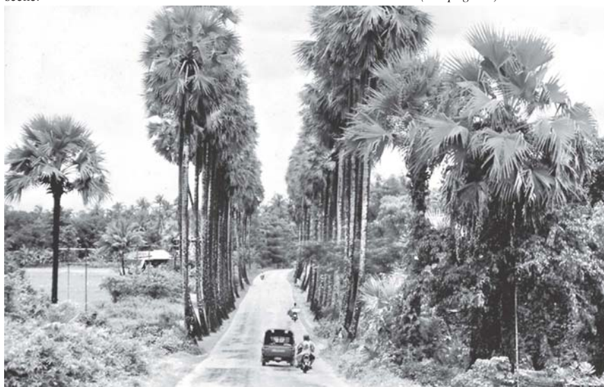
The road to Kyaikmaraw Township is flanked by neat rows of toddy palms.