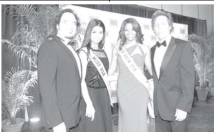
(L-R) Kim Coates, Miss USA Rima Fakih, Miss Teen USA Kamie Crawford and William Fichtner pose for photos during the 2010 USO Gala at Marriot Wardman Park Hotel on 7 October, 2010 in Washington DC.