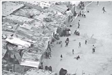
Residents are seen in the shantytown community of Boa Vista in Luanda, the Angolan Capital. The loss of a giant market in the centre of the city has cut into the livelihoods of people who depended on it for work.