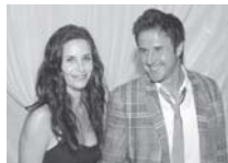
Courtney Cox Arquette (L), and husband David Arquette.

BEIJING, 13 Oct—A day after the announcement of separation from wife Courtney Cox, David