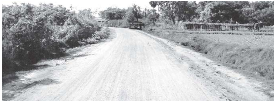
Photo shows 10,300 feet long Kyaikmaraw-Kyuniya road.

Translation: MS Myanmar Alin: 13-10-2010