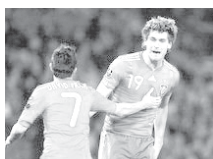
Spanish forward Fernando Llorente (R) celebrates after scoring the third goal during their Euro 2012.

A David Villa penalty put Spain ahead on the stroke of half-time and Andres Iniesta doubled their lead ten minutes into