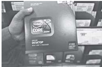
In this 8 Oct, 2010 photo, Intel chips are displayed at a computer store in Santa Clara, Calif. Intel Corp. is scheduled to report its third-quarter financial results on 12 Oct, after the market closes.