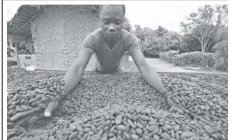
An agricultural worker prepares cocoa beans in Akati, in the Ivory Coast. A World Bank report last month said there had been a dramatic increase of investor interest in large scale land purchases in the developing world since 2008, with reported farmland deals amounting to 45 million hectares (111 million acres) in 2009 alone.