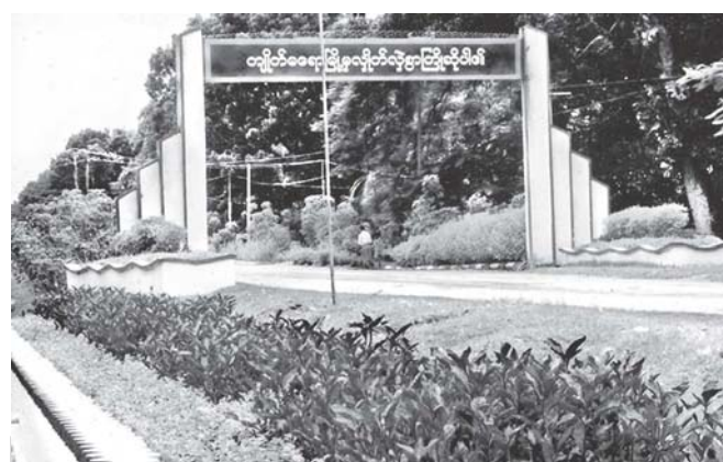
The archway to Kyaikmaraw Township is decorated with flower beds.

wards, 44 village-tracts and 166 villages; that from 2009 to 2010, their committee had built and rebuilt 18 tarred roads (three miles and 0.71 furlong in total), 10 gravel roads (one miles and seven furlongs), 30 laterite roads (10 miles and 3.64 furlongs), two wooden bridges, 29 concrete bridges, and one culvert bridge and one other-type bridge totaling 33 bridges in urban areas, four tarred roads (eight miles and 3.22 furlongs), five gravel roads (16 miles and 2.63 furlongs), 20 laterite roads (69 miles and 0.66 furlong), and 21 earthen roads (49 miles and 0.9 furlong), 48 wooden bridges, 58 concrete bridges and eight