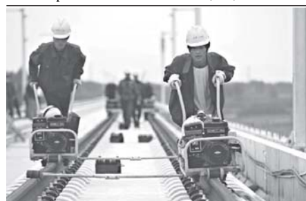
Workers fix up railway track on Beijing-Shanghai High-Speed Railway in Cangzhou City, east China's Hebei Province, on 12 Oct, 2010. The track laying operation of Beijing-Shanghai High-Speed Railway will be completed by the end of this October.