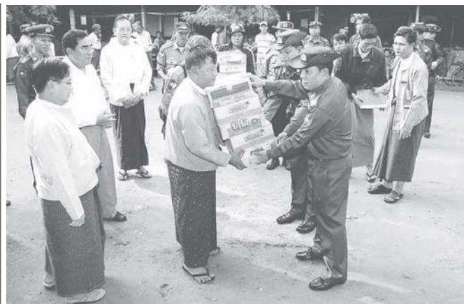
Commander of Central Command Brig-Gen Ye Aung presents relief supplies to flood victims in Chanmyathazi Township of Mandalay. (News Reported)—MNA

Due to heavy rains, flood victims were evacuated to the safe places in Dabayin, Indaw, Ayadaw, YeU, Myinmu and Monywa townships, and the victims were provided with food, bags of rice and bottles of purified drinking water. As