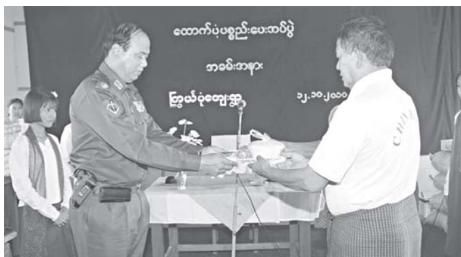
Chairman of Sagaing Region PDC Commander of North-West Command Brig-Gen Soe Lwin presents aid to flood victims of Kywepon Village of Sagaing Township.