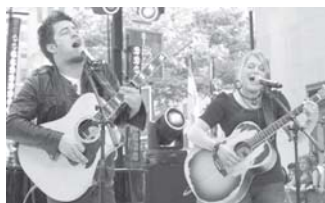
"American Idol" winner Lee DeWyze performs with finalist Crystal Bowersox (R) on NBC's "Today" show in New York, on 3 June, 2010.