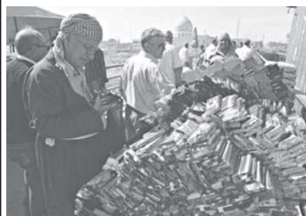
A resident in traditional Kurdish dress shops at a market in Kirkuk, 250 km (155 miles) north of Baghdad, on 12 October, 2010. Turf battles and tensions between Arabs and Kurds are resurfacing in oil-rich Kirkuk as Iraq's central government delays a national census that was supposed to help resolve long-standing disputes in restive areas of northern Iraq.