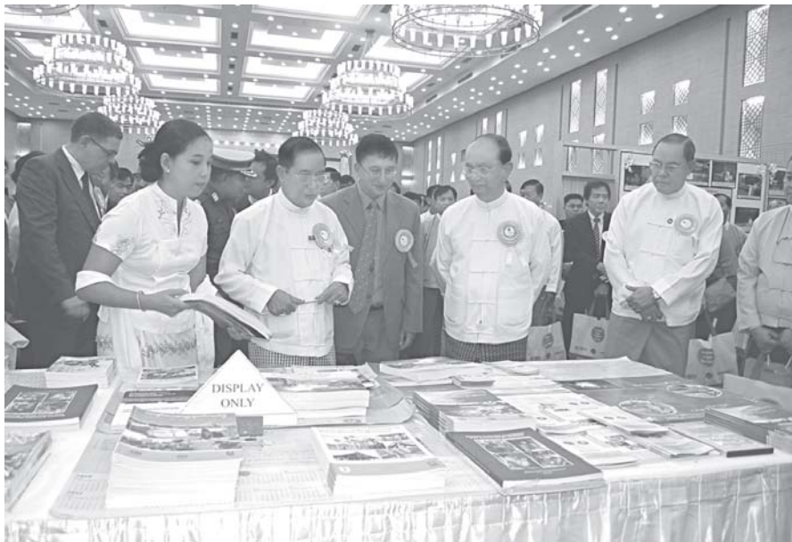
Chairman of National Disaster Preparedness Central Committee Prime Minister U Thein Sein observes documentary photos displayed in the hall.—MNA

And in 2010, Haiti, Chile and New Zealand