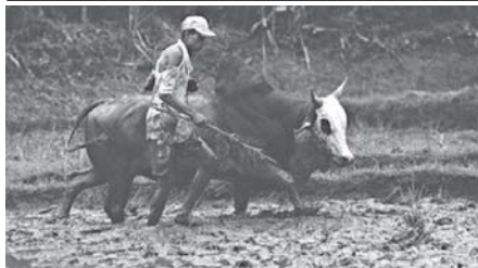
A farmer drives his farm animal through a rice field in Imurna, Madagascar in preparation for the planting of rice.