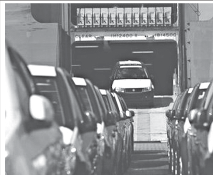
Vehicles from Japan exit a cargo ship in Bremerhaven, northern Germany. Core private-sector machinery orders in Japan, a leading indicator of corporate capital spending, have risen 10.1 percent from July, compared with forecasts of a 4.5 percent fall.

The findings were based on an analysis of data on US women aged 50 to 79 from the Women's Health Initiative study starting in 1993. During 5.4 years of follow-up, 1,997 women were diagnosed with invasive breast cancer.—Xinhua