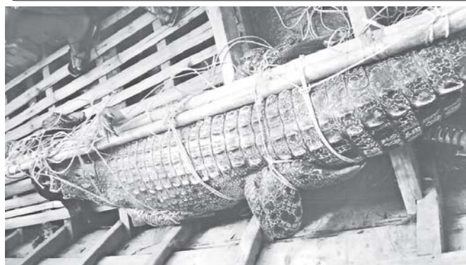
Photo shows a crocodile captured alive in Maelanpyaw Wetland, Pantanaw Township.