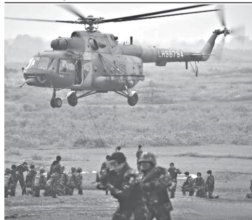
Soldiers practise airlanding in Guilin, southwest China's Guangxi Zhuang Autonomous Region, on 12 Oct, 2010. The "Strike-2010" joint anti-terrorism drill held by Chinese and Thai special forces launched an airlanding practice Tuesday.

He added Uganda hopes to enhance cooperation with China in fields such as infrastructure, energy, tourism and agriculture.—Xinhua