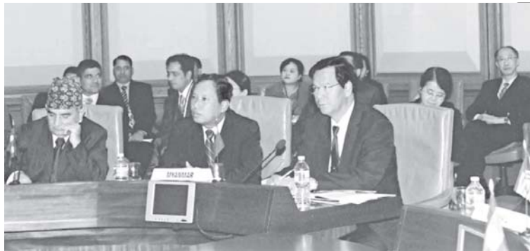
Minister for Finance and Revenue U Hla Tun attends International Monetary and Financial Committee Meeting. F&R

YANGON, 13 Oct—A Myanmar delegation led by Minister for Finance and Revenue U Hla Tun attended the annual meetings 2010 of International Monetary Fund (IMF) and the World Bank in Washington DC in the United States of America from 8 to 10 October.