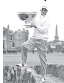
Germany's Martin Kaymer poses with the trophy after his victory during the Alfred Dunhill Links Championship at St Andrews Golf Course, Scotland, on 10 Oct, 2010.