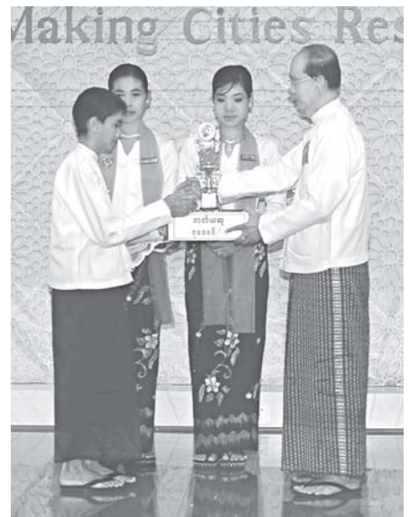
Chairman of National Disaster Preparedness Central Committee Prime Minister U Thein Sein presents prize to a winner in the painting contest to mark International Day for Disaster Reduction.

Occurrence of such natural disasters is largely due to world climate change and global warming. The main cause is strong impact on natural ecology resulting from excessive emission of greenhouse gases from factories in industrialized