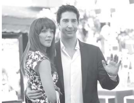
Cast member David Schwimmer, who gives voice to Melman, poses with actress Zoe Buckman at the premiere of "Madagascar: Escape 2 Africa" at the Mann Village theatre in Westwood, California on 26 October, 2008.