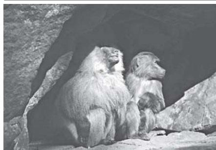
A baboon couple sitting on rocks enjoy the sun in their enclosure in Berlin's Tiergarten zoo.