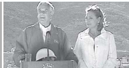
Chilean President Sebastian Pinera: "We have learned from this accident".