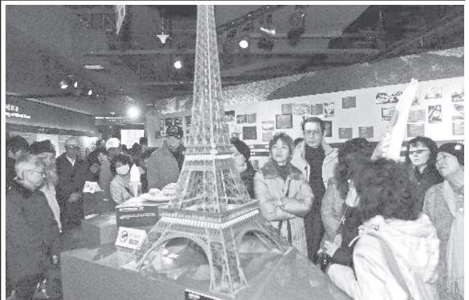
Visitors learn the planning of the 2010 Shanghai Expo at the Expo Exhibition Centre in Shanghai, east China, on 16 Feb, 2010. The Expo Exhibition Centre attracted many citizens and tourists during the Spring Festival holidays.