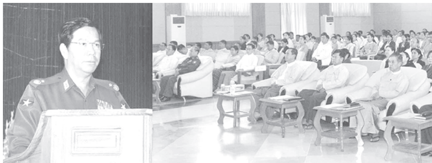
Minister for Finance and Revenue Maj-Gen Hla Tun speaking at concluding ceremony of Spoken English Course No. 1/2009.