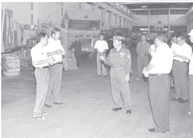
Minister for Forestry Brig-Gen Thein Aung visits Main Workshop (Pyinmana) of Engineering Department under Myanmar Timber Enterprise.—MNA