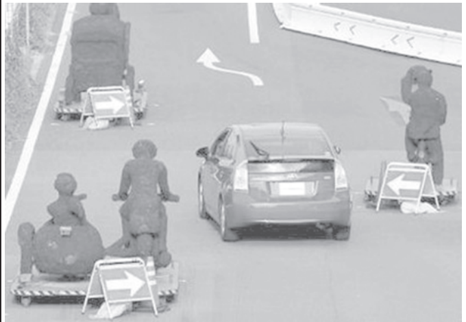
Toyota Motor Corp's newest Prius hybrid car is seen at a test course in Tokyo on 19 Feb, 2010. The head of Toyota Motor Corp will testify to US lawmakers next week after bowing to pressure to explain the company's worst ever safety crisis, becoming the highest profile Japanese executive to face a such a grilling from Congress.

The study that included scientists from the George Washington University Medical Centre appears in the journal Molecular Cell .—Internet