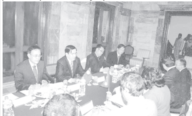
Minister U Nyan Win holds discussion with Deputy Prime Minister and Minister of Foreign Affairs of Nepal Ms Sujata Koirala.

Minister U Nyan Win visited Lumbini Garden to pay homage to the birth place of Lord Buddha and Myanmar Golden Monastery and Panditayama International Vipassana Meditation Center. The delegation attended dinners hosted by Minister of Culture Dr Minendra Prasad Rajil and President of the Nepal-Myanmar Friendship Council Mr Rudra Man Pradhan. Minister U Nyan Win visited Myanmar Embassy in Kathmandu. —MNA