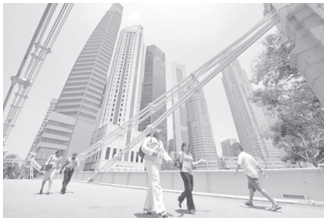
Singapore has raised its economic growth forecast this year as countries that buy most of its exports emerge from recession.

The ministry said the economy fell an annualized seasonally adjusted 2.8 percent in the fourth quarter, a smaller drop than the ministry's initial estimate last month of a 6.8 percent contraction.—Internet