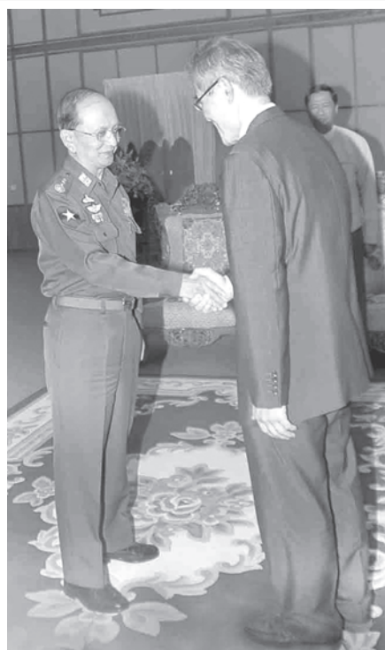
Prime Minister General Thein Sein greets Ambassador of the Republic of Korea Mr. Park Key Chong at Government Office.