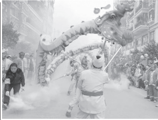
People perform dragon dance on street in Yijiang Tujia and Miao Autonomous County, southwest China's Guizhou Province, on 17 Feb, 2010.