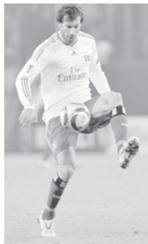
Hamburg SV's Ruud van Nistelrooy controls the ball during their Europa League last 32 first leg soccer match against PSV Eindhoven in Hamburg on 18 February, 2010.