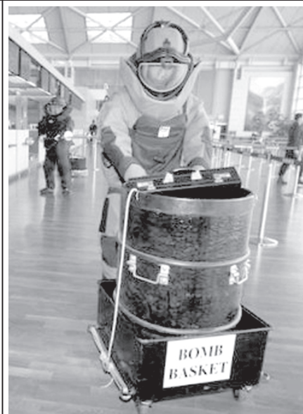
Police officers from a bomb disposal unit conduct an anti-terrorism drill in preparation for the upcoming G20 Summit, at Incheon Airport, west of Seoul on 19 Feb, 2010. South Korea will host the G20 Summit in Seoul from 11-12 November.

After researchers discovered the copied gene, they examined thousands of wing-colour patches and found butterflies with just one UV-vision gene had yellow wing pigment that was not UV. However, the pigment was UV in butterflies with both genes.