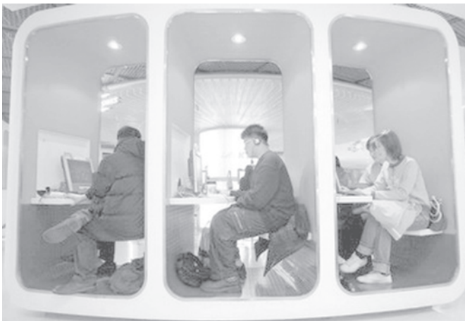
An Internet cafe in the South Korean capital, Seoul. Hackers have created a “dangerous new” network of virus-infected computers in 2,500 businesses and government agencies around the world, a US Internet security firm has warned.—INTERNET

“Cyber criminal elements, like the Kneber crew quietly and diligently target and compromise thousands of government and commercial organizations across the globe.”— Internet