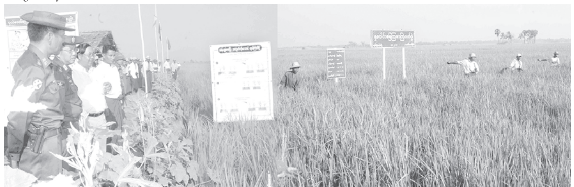
Lt-Gen Myint Swe of Ministry of Defence inspects broadcasting of fertilizer at summer paddy plantation in Kungyangon Township.