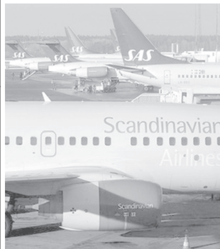
SAS aircraft are parked at the gates at Arlanda airport, north of Stockholm in 2009. The Swedish government sought parliamentary approval on Thursday to be allowed to sell its stake in loss-making SAS Scandinavian Airlines at an “opportune moment.”

Petrobras holds a five percent stake in Block 15/06 while local company Eni Angola a 35 percent stake in it. Other participants in the consortium are Sonangol P&P, with a 15 percent stake, SSI Fifteen Limited, with a 20 percent stake, Total, with a 15 percent stake, Falcon Oil Holding Angola AS, with a five percent stake, and Statoil Angola Block 15/06 AS, also with a five percent stake.