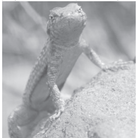
Evolutionary game of rock-paper-scissors may lead to new species.

SCIENCE DAILY, 19 Feb—When Earth was young, it exhaled the atmosphere. During a period of intense volcanic activity, lava carried light ele-