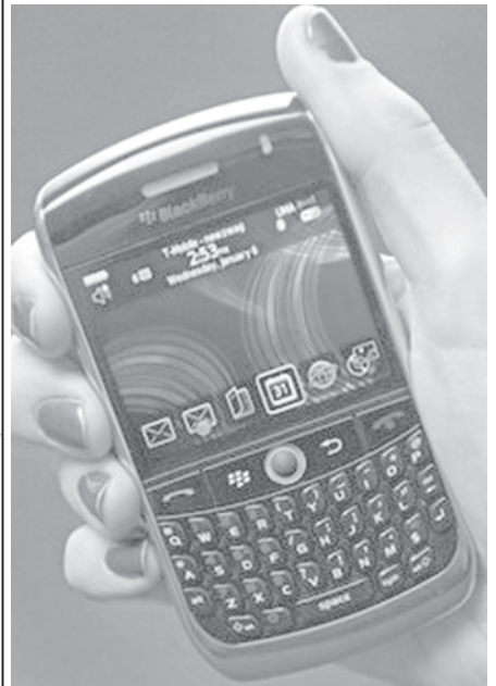
Amazon released a free Kindle for BlackBerry application that makes the online shop’s electronic books available for reading on the Research In Motion smartphones.—INTERNET