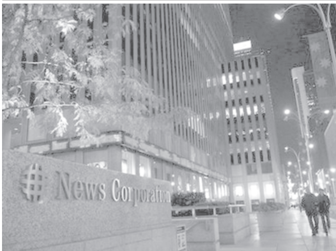
A News Corp. sign is seen outside of its offices in New York. Media giant News Corp said on Thursday it has agreed to sell its Bulgarian terrestrial TV business, bTV, for 400 million dollars (294 million euros) in cash to leading regional broadcaster CME.

The government confirmed on Thursday that it would still take part in SAS' planned 500-million-euro (700-million-dollar) cash raising exercise to help it cope with the slump in air travel sparked by the global financial crisis.