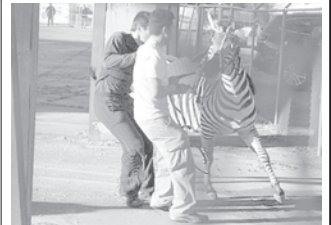
Workers try to contain a zebra that broke loose from the Ringling Brothers and Barnum & Bailey Circus, on 18 Feb, 2010, in downtown Atlanta. The animal made its way through downtown to the interstate highway that cuts through the centre of the city.