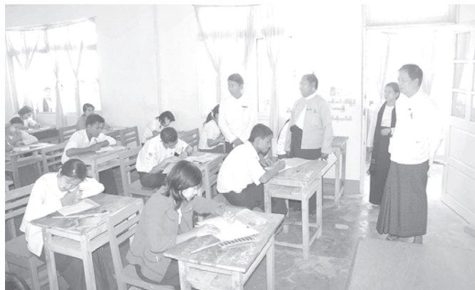
Minister for Education Dr. Chan Nyein visits classroom of Basic Education High School in Nay Pyi Taw.

NAY PYI TAW, 19 Feb—Minister for Education Dr Chan Nyein inspected students sitting for second-semester examination at No.5 Basic Education High School