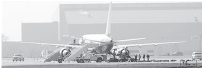
A United Airlines 757 sits on the tarmac at the Salt Lake International Airport as officials search the aircraft after the plane was diverted during a flight from Denver to San Francisco on 18 Feb, 2010.