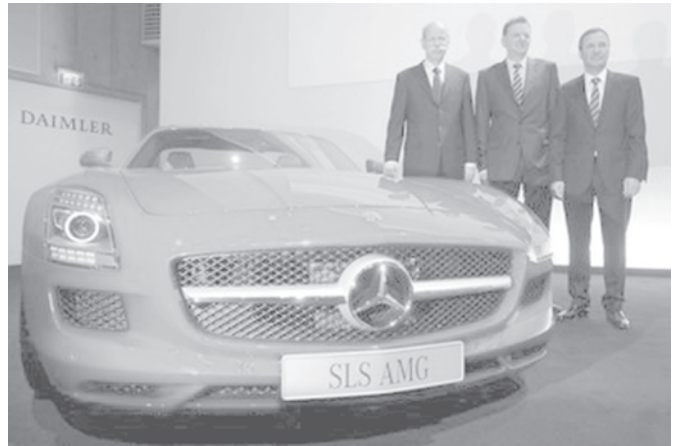
(From L) Dieter Zetsche, CEO of German auto giant Daimler AG, and members of the board of management pictured before annual results press conference in Stuttgart, southern Germany, on 18 February. Daimler suffered a sharp loss last year that surprised markets on Thursday and pushed its share price lower as the group reported results from one of the auto sector's most challenging years.