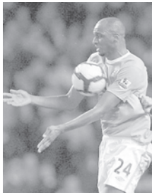
Manchester City's veteran French midfielder Patrick Vieira

Tony Pulis, the Stoke manager, was enraged Vieira escaped on-field punishment from referee Alan Wiley.— Internet