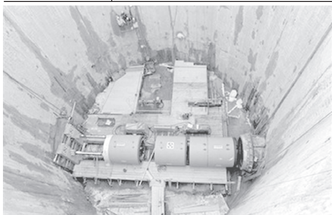
A tunnel drilling machine is seen at the construction site of a natural gas transfer station for the gas pipeline OPAL in Lubmin, northern Germany, on 18 Feb, 2010.