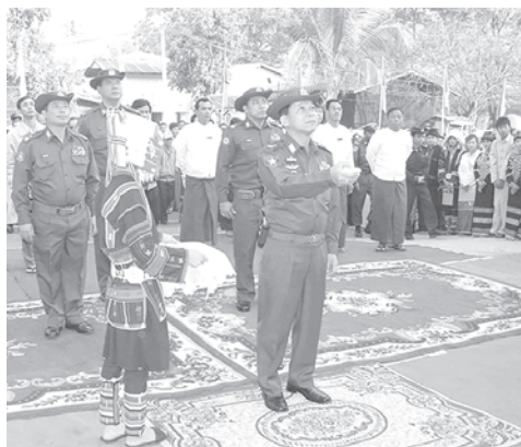
Lt-Gen Min Aung Hlaing unveils signboard of Myanmar Fire Brigade in Kengtung.—MNA

On his arrival in Kengtung, Mongpan and Homein, he called for boosting agricultural production with the effective utilization of natural resources and