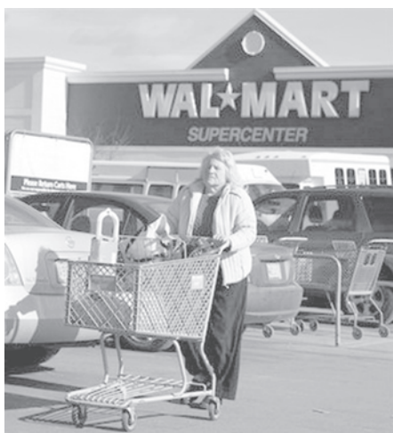
A shopper makes her way to her car at Wal-Mart in Brunswick, Maine on 18 Feb, 2010. Wal-Mart Stores Inc, one of the recession's biggest beneficiaries, felt the pinch during the fourth quarter as quarterly sales fell at US Wal-Mart stores for the first time.