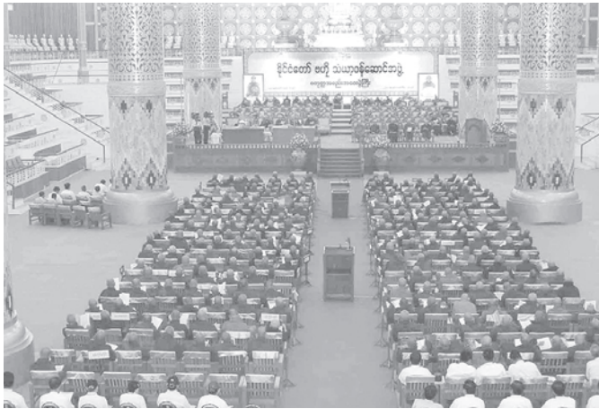
The fourth meeting of sixth State Central Working Committee of the Sangha in progress at Maha Pasana Cave on Kaba-Aye Hill in Mayangon Township.