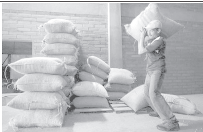
A coffee farmer carries bags of the beans in Ciudad Bolivar, in Colombia. Combined coffee production in nine Latin American countries fell 28.2 percent in the first four months of the 2009-2010 growing season, the National Coffee Association of Guatemala has said.