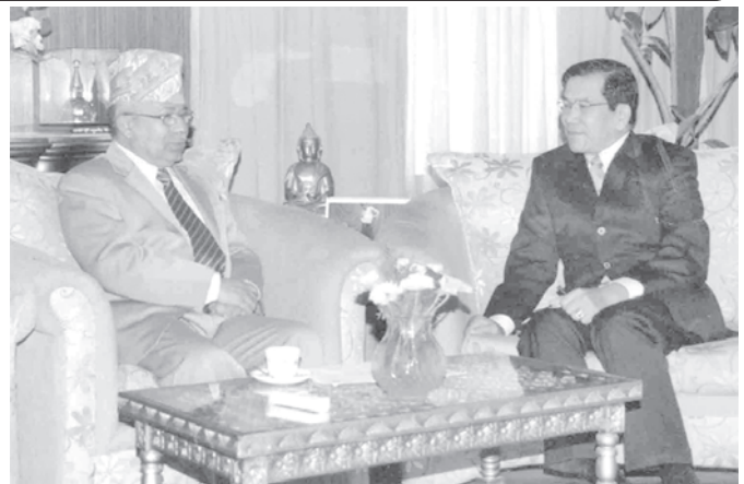
Minister U Nyan Win meets Nepalese Prime Minister Mr. Madhav Kumar Nepal.—MOFA

On 15 February, Minister U Nyan Win held a bilateral meeting with the Deputy Prime Minister and Minister of Foreign Affairs at Yak and Yeti Hotel in Kathmandu. The meeting focused on mutual interest to further strengthening the bilateral relations and cooperation including celebration of the golden jubilee of diplomatic