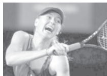
Top seed Maria Sharapova (pictured in January) continued her march through the WTA Tour event in Memphis, reaching the semi-finals with a straight-sets victory over Elena Baltacha, 6-2, 7-5.

MEMPHIS, 19 Feb—Top seed Maria Sharapova continued her march through the WTA Tour event here, reaching the semi-finals with a straight-sets victory over Elena Baltacha.