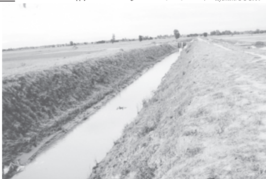
A canal of Chaungmange Dam.