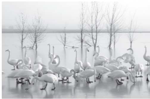
Resting whooper swans are seen at the Yellow River wetland in Pinglu County, north China's Shanxi Province, on 1 Feb, 2010. The World Wetlands Day 2010 is celebrated on 2 Feb.