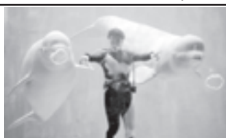
Two white whales blow heart-shaped bubbles in the water at the Harbin Polarland in Harbin, capital of northeast China's Heilongjiang Province.

"Tete de Femme (Jacqueline)" fetched 8,105,250 pounds, said Christie's, and was just one of a string of masterpieces up for sale which also included works by Renoir