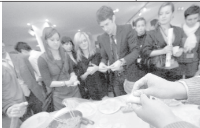
Guests learn to make Chinese dumplings during a cultural presentation of the Chinese lunar new year at the European Parliament headquarters in Brussels, capital of Belgium, on 2 Feb, 2010.—XINHUA

attend the three-day meeting, including former US Secretary of State George Shultz, Swedish Foreign Minister Carl Bildt, Brazilian Foreign Minister Celso Amorim, and Queen Noor of Jordan.—Xinhua