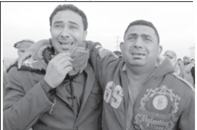
People mourn for their relative during a mass funeral for victims of a suicide attack, northeast of Baghdad on 2 Feb, 2010.