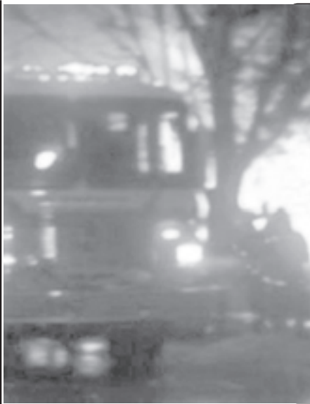
Image from WGRZ-TV in Buffalo, New York shows firefighters at the scene after a commercial plane crashed into a house on 12 Feb, 2009 in Clarence Centre, New York. A pilot who pulled instead of pushing a control column and an inattentive crew led to the crash last year which killed 49 people on board and one on the ground, a probe said on Tuesday.