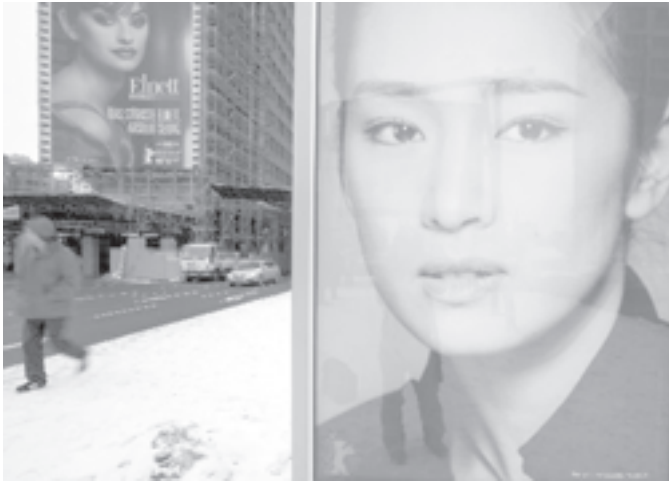
A poster of movie actress Gong Li is seen on a street in Berlin, capital of Germany, on 2 Feb, 2010. The 60 th Berlin International Film Festival (Berlinale) will kick off in Berlin on 11 Feb.