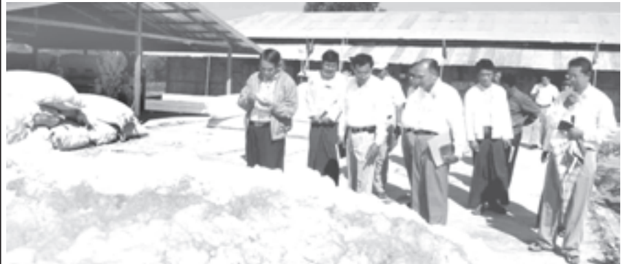
Minister for Industry-1 U Aung Thaung inspects products of Yamethin Cotton Mill.—MNA

NAY PYI TAW, 4 Feb—On the occasion of the 62 nd Anniversary of the Independence Day of the Democratic Socialist Republic of Sri Lanka which falls on 4 th February 2010, U Nyan Win, Minister for Foreign Affairs of the Union of Myanmar, has sent a message of felicitations to His Excellency Mr. Rohitha Bogollagama, Minister of Foreign Affairs of the Democratic Socialist Republic of Sri Lanka.—MNA