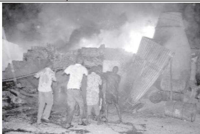
People try to extinguish the fire in Bakara Market, where fuel in barrels and tanks is sold, in Mogadishu, capital of Somalia, on 2 Feb, 2010. The fire destroyed hundreds of thousands of dollars’ worth of goods, mainly petrol and diesel.