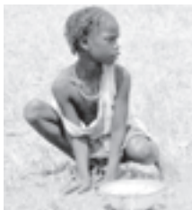
A southern Sudanese girl collects sorghum grain spilled from split bags that were earlier airdropped from the United Nations World Food Programme in the state of Jonglei, in 2009. The number of hungry people in southern Sudan has quadrupled since last August to some 4.3 million because of conflict and drought, the UN emergency food agency said on Tuesday.