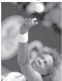
Top seed Gael Monfils of France

The 23-year Frenchman ranked 13 in the world was clearly stung by the early form of the veteran Slovak and lost just one of the remaining 13 games at the Montecasino entertain-