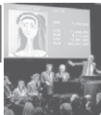
A Picasso masterpiece not seen in public for more than four decades has sold at auction for 8.1 mln pounds —more than twice the expected price. "Tete de Femme (Jacqueline)", a portrait of the Spanish artist's second wife, had not been seen in public since 1967 and was expected to fetch up to four million pounds at the sale in London, according to Christie's auctioneers.