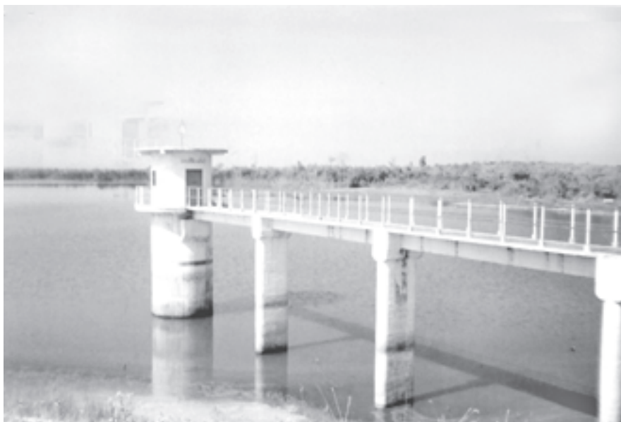
Photo shows water control tower and storage of water at Chaungmange Dam.

Article & Photos: Khin Maung Than (Sethmu)