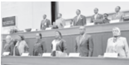
Participants stand up for the African Union anthem during the closing ceremony of the 14th summit of AU in Addis Ababa, capital of Ethiopia, on 2 Feb, 2010. The 14th summit of AU concluded here on Tuesday with African leaders pledging that they would take concrete measures to development Information and Communication Technologies (ICTs) in the continent. —XINHUA