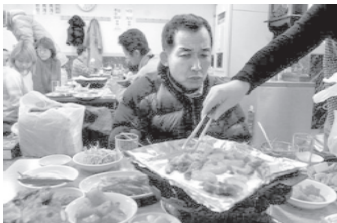
Tourists enjoy South Korean foods at a Korean restaurant in 2001. Astronauts could soon be eating seaweed soup and spicy, garlic-laden meat dishes after South Korea won approval to send several national dishes into space.