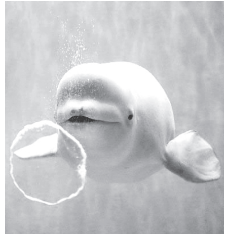
A white whale blows a bubble in the water at the Harbin Polarland in Harbin, capital of northeast China's Heilongjiang Province, 2 Feb, 2010. The white whales in the Polarland gained the skills as a new year gift for visitors after one-year of training.