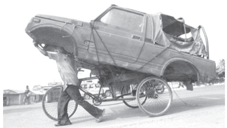
A cycle-rickshaw puller moves the wreckage of a car to a scrap yard in the eastern Indian city of Siliguri on 2 February 2010.