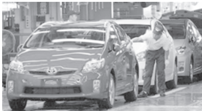
A Toyota Motor Corp worker gives the final examination on an newly assembled Prius at Toyota Tsutsumi Plant in Toyota, central Japan.