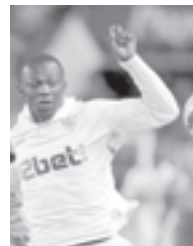
Sevilla's Ivorian international striker Arouna Kone, seen here in 2009, has joined struggling Bundesliga club Hanover on a six-month deal, the German club said Tuesday.