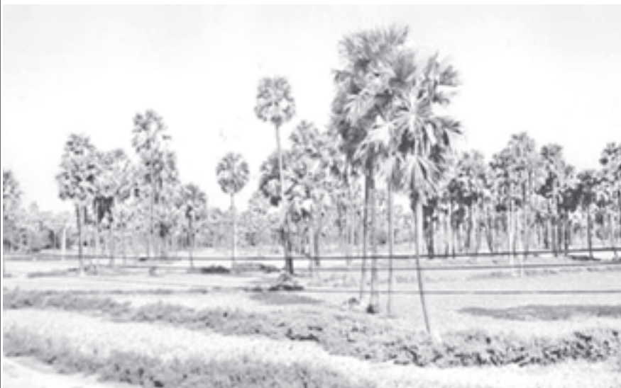
A toddy palm grove in an arid region.

Mon and Shan nationals call toddy palm, Tan. Toddy palm is of about 1500 species including coconut, areca nut, dani (nipa palm), salu, and date, and they are native to Asia, Africa, America, and (See page 10)