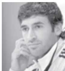
Real Madrid captain Raul Gonzalez

But coach Manuel Pellegrini has left him on the bench in recent months in favour of France's Karim Benzema and Ar-