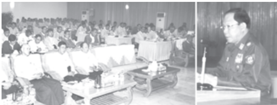
Minister for Forestry Brig-Gen Thein Aung addresses the opening of Workshop on Review of Forest Management Project.

NAY PYI TAW, 3 Feb—The opening of Workshop on Review of Forest Management Project organized by Forest Department of the Ministry of Forestry took place at Ingyin Hall of the Office of the Director-General of the department here this morning with an address by Minister for Forestry Brig-Gen Thein Aung.