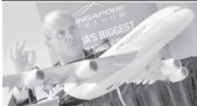
Airbus CEO Tom Enders speaks to media during a Press conference at the Singapore Airshow on 3 Feb, 2010 in Singapore.

In the United States, the consumer price index had increased by 2.7 percent by December 2009. Consumer prices in Japan had decreased by 1.7 percent by December while in the OECD area the figure rose by 0.5 percent on average between 2008 and 2009 after a growth of 3.7 percent between 2007 and 2008. The OECD said consumer energy prices declined by 10.5 percent between 2008 and 2009, after an increase of 12.3 percent between 2007 and 2008.—Xinhua