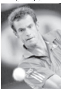
World number three Andy Murray (pictured) and US Open champion Juan Martin del Potro will top the bill at the 512,750-euro ATP Marseille event on February 15-21, organisers have announced.

"Del Potro is also very strong on this surface and he preferred to play in Marseille than in the Argentine Championship (in Buenos Aires)."— Internet