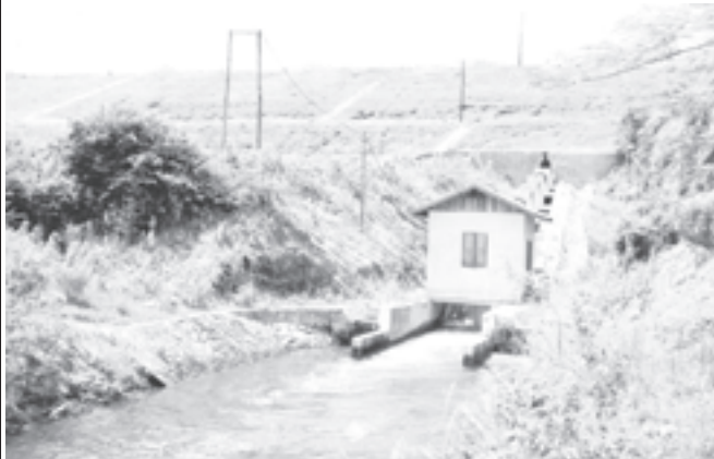
A small-scale hydropower plant at embankment of Chaungmange Dam to supply power to nearby villages.

Article & Photos: Khin Maung Than (Sethmu)