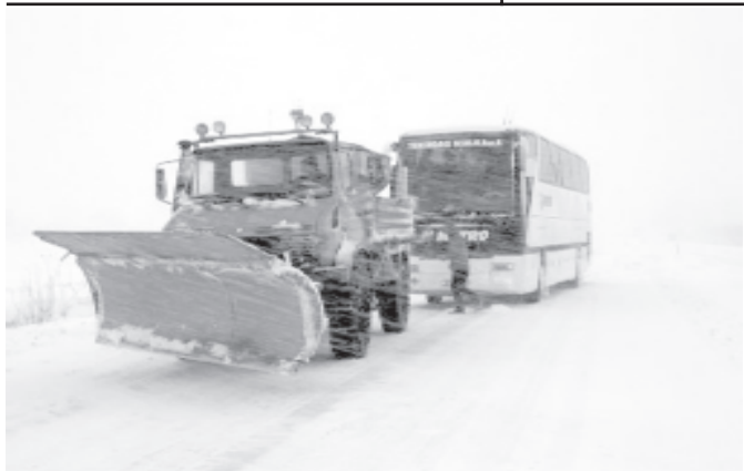
A snowplough clears snow on a road in Tekirdag, central Turkey, on 2 Feb, 2010. Heavy snowfall swept Tekirdag on Tuesday, paralyzing the traffic.