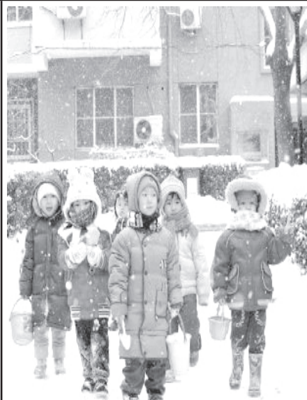
Children prepare to play with snow in a community of Shijingshan district, Beijing, China, on 3 Jan, 2010.