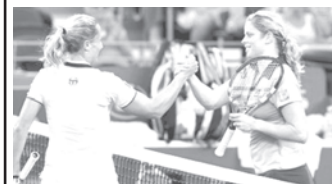
Kim Clijsters of Belgium (R) shakes hands with Tathiana Garbin of Italy (L) after defeating her in the first round of the Brisbane International tennis tournament being played in Brisbane.