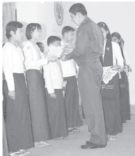
Minister Maj-Gen Htay Oo presents awards to the outstanding students.—MNA

Minister U Nyan Win presenting award to an outstanding student. MNA