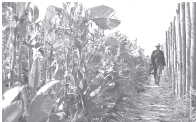
A worker walks among tobacco plants at a farm in Cuba's western province of Pinar del Rio on 26 Feb, 2008.—XINHUA

Typical tobacco plant leaves contain 1.7 percent to 4 percent of oil per dry weight.—Xinhua