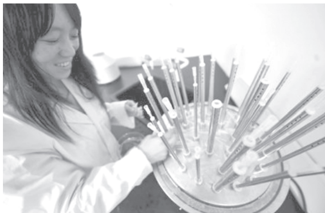
A staff member tests the pesticide residue of vegetables in an export company in Chengmai, a county in south China Hainan Province, on 29 Dec, 2009. The total export of Hainan's melons and vegetables amounted to 4.86 million tons, valuing 15.4 billion yuan. Some of them were exported to countries and regions like Central Asia, Japan, and Hong Kong.