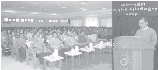
Minister U Aung Kyi delivers an address at 62 nd founding anniversary of Ministry of Labour.

NAY PYI TAW, 3 Jan—The Ministry of Labour celebrated its 62 nd founding anniversary along with commemorative sports events at its assembly hall here on 1 January.