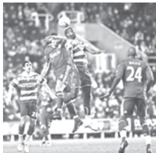
Liverpool's captain Steven Gerrard (2nd L) jumps for the ball against Reading's midfielder Kalifa Cisse (2nd R) during their FA Cup third round football match at The Madejski Stadium in Reading.

Portsmouth was held to a 1-1 draw at home by second-tier Coventry. Birmingham managed only a scoreless draw with Coventry while Aston Villa and Wigan outplayed Premier League rivals to reach the fourth round. There were comfortable victories for Tottenham, Bolton, Everton, Sunderland, Stoke and Burnley against opponents from lower divisions.