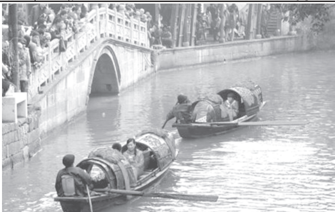
Newlyweds go to the wedding site by black-roof boat in the ancient waterside town of Anchang in Shaoxing City, east China's Zhejiang Province, on 2 Jan, 2010.

between Israel and the PNA stopped in December 2008 and efforts to restart them failed due to the continuation of Jewish settlement in the West Bank and East Jerusalem.