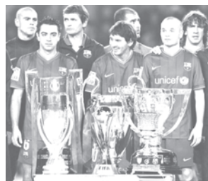
Barcelona's Xavi Hernandez, Lionel Messi and Andres Iniesta (L-R) pose with the 6 trophies the team won during the 2009 season, before their Spanish first division soccer league match against Villarreal at Camp Nou stadium in Barcelona, on 2 Jan, 2010.

MADRID, 3 Jan—FC Barcelona could only draw 1-1 at home to Villarreal in the biggest game played this Saturday in Spain's Primera Liga.