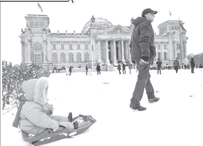
A little girl sits on the sled while her father pulls it in snow in Berlin of Germany, on 2 Jan, 2009.