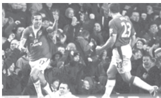
Australia's Tim Cahill, fired Everton into the FA Cup fourth round as his 50th goal for the club inspired a 3-1 win against Carlisle on Saturday.

It needed a typically predatory finish from Cahill, who reached his half century of goals in his 192nd appearance for the Toffees, eight minutes from full-time to shatter Carlisle's resistance before Leighton Baines put a flattering gloss on the score with a late penalty. Carlisle were never overawed by their more illustrious opponents and, backed by 6,000 fans who had braved blizzards to get to Merseyside, they were unfortunate not to earn a money-spinning replay.