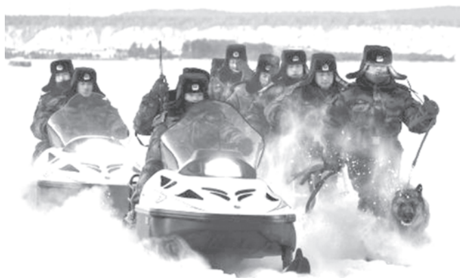
Soldiers of Heilongjiang Military Zone of the Chinese People's Liberation Army patrol the border from "North Pole" village of Mohe, northeast China's Heilongjiang Province, on 2 Jan, 2010.