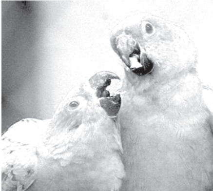
A pair of parrots enjoy their meal in Suzhou Zoo of Suzhou City, east China's Jiangsu Province, on 3 Jan, 2010. The lovely and happy animal "stars" in Suzhou Zoo have attracted a lot of visitors during the New Year holidays.