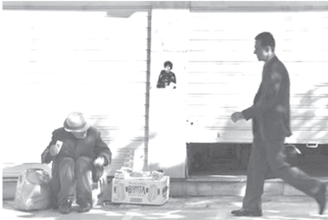
An elderly man sells tissues in central Athens. The eurozone's new year heralds a debt crisis that has alarm bells ringing and markets tracking government plans to tame the growing shortfall.