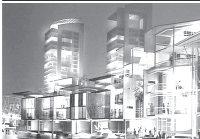
All glass, concrete and steel, rising from the desert sands, Dubai has in the space of decades become a symbol of architectural innovation, proving a boon for architects seeking to display their prowess.