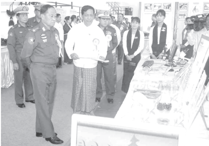
Secretary-1 General Thiha Thura Tin Aung Myint Oo views booths displayed at School Family Day for 2009-2010 Academic Year.