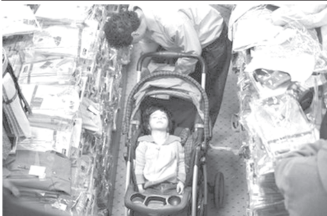
A girl sleeps as her father shops for bargains at the Glendale Galleria shopping mall in Glendale, California in November 2009. It seems parents have long been right. Going to bed early is key to getting enough sleep and helping adolescents feel on top of the world, a new study reported.