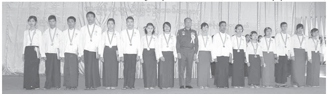
Secretary-1 General Thiha Thura Tin Aung Myint Oo has photo taken together with outstanding students.

In the higher education sector, the government has so far set up 159 universities, degree colleges and colleges across the nation. It is also ensuring easy access to education and supervising education promotion plans through various ways such as opening master degrees' courses, master research degrees' courses, and PhD courses extensively, running applied courses after forming centers for human resources in