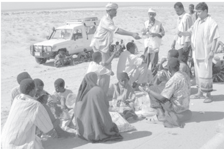
Yemeni NGO workers give newly arrived Somali migrants water on the beach of Hasn Beleid village, 230 kms east of the Red Sea port of Aden in October 2008. The number of migrants fleeing the unstable Horn of Africa and arriving in Yemen rose by 50 percent this year, reaching a record high of 74,000, the UN refugee agency said on Friday.

There are about 1,590 pandas living in the wild in the country, mostly in Sichuan and the northwestern provinces of Shaanxi and Gansu.