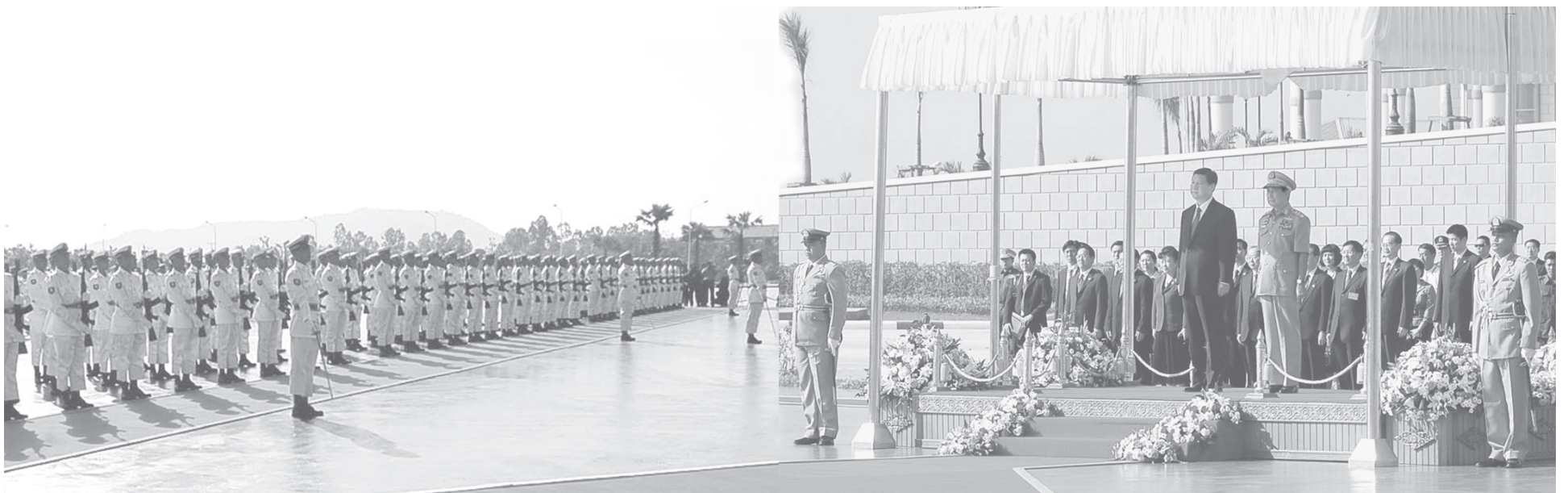
Vice-Senior General Maung Aye and Chinese Vice President Mr Xi Jinping take salute of the Guard of Honour.