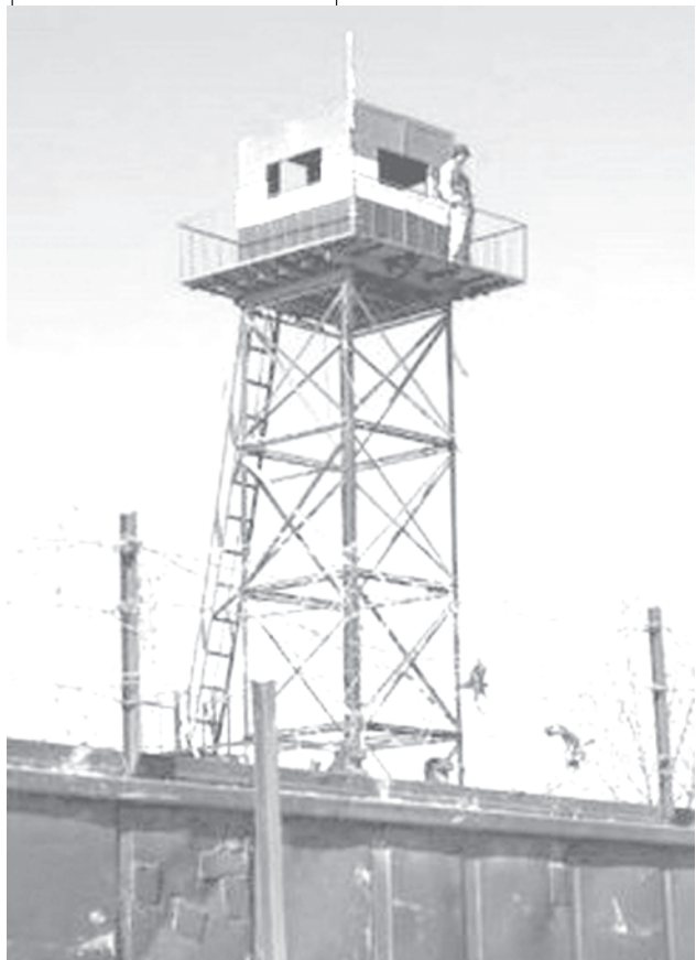
An Egyptian soldier stands guard near the border between Egypt and Gaza Strip 19 December, 2009