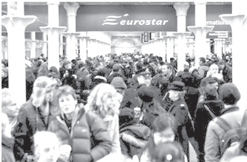
Stranded passengers wait at London St Pancras Eurostar terminal after lengthy delays inside the tunnel caused by adverse weather conditions in London.