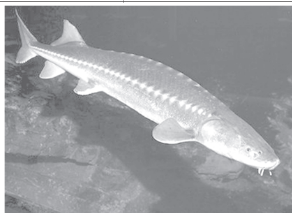
This undated image shows the endangered Kootenai River white sturgeon. As efforts falter to save this largest freshwater fish — a toothless beast left over from the days of dinosaurs — officials hope to stave off extinction by sending more water hurtling down a river so the fish can spawn in the wild.

Metro employees shut off the power, and a passer-by held the bird to keep it from injuring itself more. When firefighters arrived, they removed a portion of the escalator to free the bird.