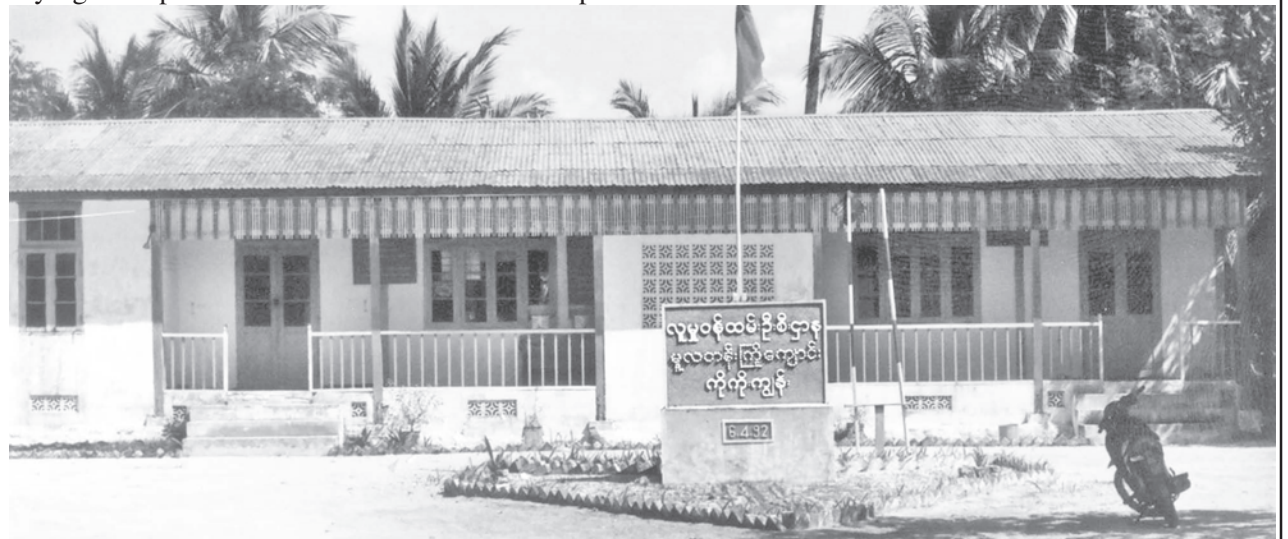
The pre-primary school of Cocogyun Township Social Welfare Department.

a basic education high school furnished with three computer sets and a printer, and 25 teachers and over 200 students. Now, the principal and teachers are trying to improve the education of the township. It