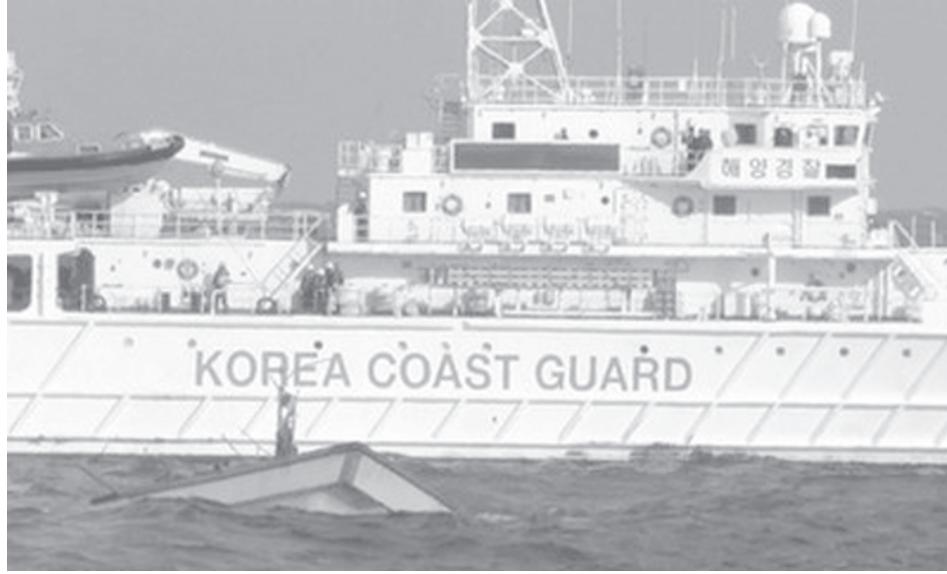
File photo, provided by the Korea Coast Guard, shows a rescue vessel close to a submerged ship off the country's coast. Five fishermen have been reported missing after their boat sank off South Korea's southeastern port of Busan, officials have said.

Procurement Committee Ministry of Information Myanma Motion Picture Enterprise No.28, Kokkine Yeiktha Street, Bahan Township, Yangon Ph: 534574, 536029