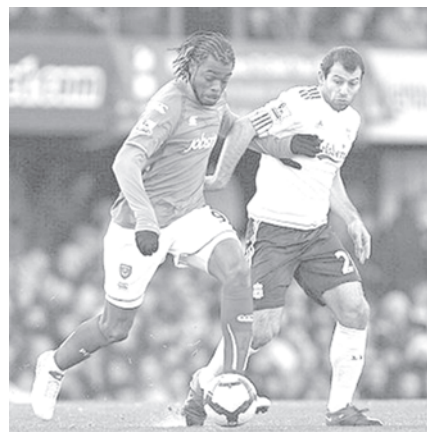
Portsmouth's striker Frederic Piquionne (L) clashes with Liverpool's midfielder Javier Mascherano during their English Premier League football match at Fratton Park in Portsmouth.

PORTSMOUTH, 20 Dec—Liverpool manager Rafael Benitez insisted he does not fear the sack despite seeing his team suffer their seventh Premier League defeat of an increasingly poor season at bottom club Portsmouth.