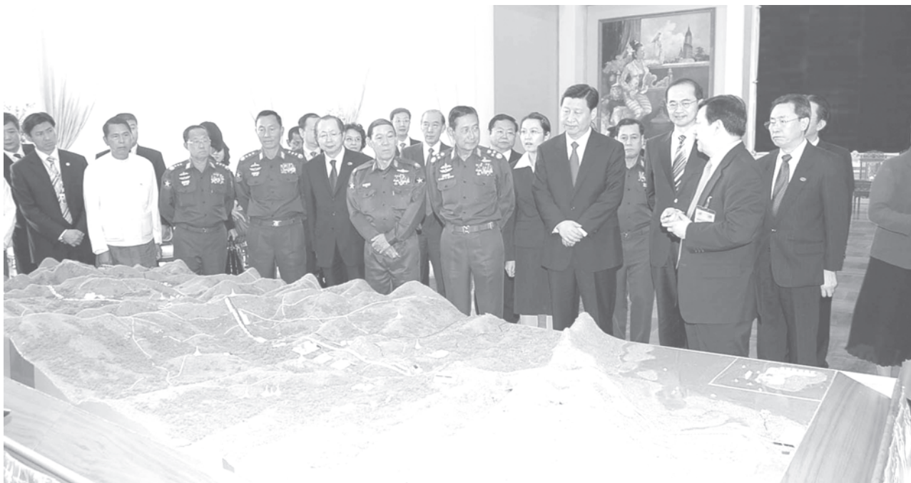
Vice-Senior General Maung Aye and Chinese Vice President Mr Xi Jinping view scale model of oil and gas pipeline project (Myanmar section).

Thura Tin Aung Myint Oo, SPDC member Lt-Gen Tin Aye, Minister for Agriculture and Irrigation Maj-Gen Htay Oo, Minister for Foreign Affairs U Nyan Win, Minister for National