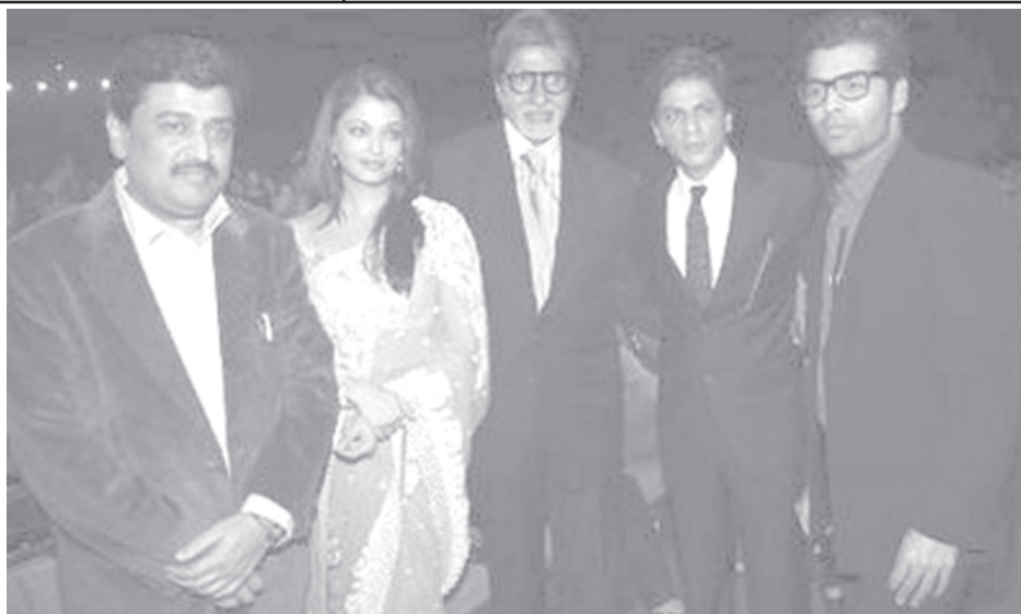
(L-R) Maharashtra Chief Minister Ashok Chavan, Bollywood actress Aishwarya Rai Bachchan, actor Amitabh Bachchan, actor Shah Rukh Khan and director Karan Johar pose at the annual police show in Mumbai on 19 Dec, 2009.