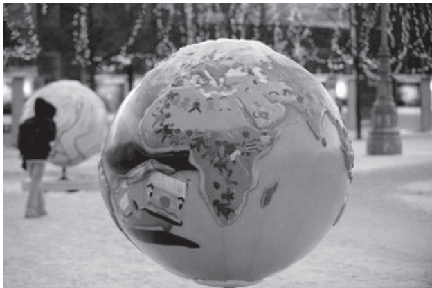
A UN conference has rammed through a battle plan against climate change forged by US President Barack Obama and other top leaders, sidelining smaller states which lashed the deal as a betrayal.