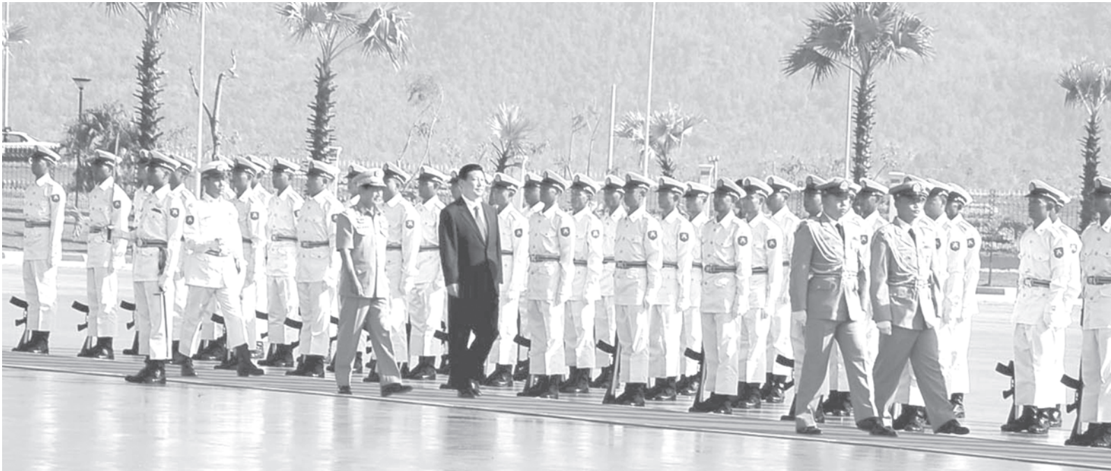
Vice-Senior General Maung Aye and Chinese Vice President Mr Xi Jinping inspecting Guard of Honour. (News on page 16)