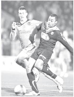
Bordeaux's forward David Bellion (R) fights for the ball with Lorient's defender Laurent Koscielny (L) during their French L1 football match at Chaban Delmas stadium in Bordeaux. A double by Bellion inspired Bordeaux to a 4-1 home win over Lorient on Saturday that stretched their lead at the top of the French first division to nine points.

Second-placed Marseille could have cut the gap to six points but they were held to a 0-0 draw at Saint-Etienne in the late game despite the hosts having to play with 10 men for over 80 minutes. Greek defender Efstathios Tavaridis was dismissed in the eighth minute for a last-man foul on Bakary Kone but a bravura performance from goalkeeper Jeremie Janot enabled Les Verts to earn a point that takes them out of the relegation zone.— Internet