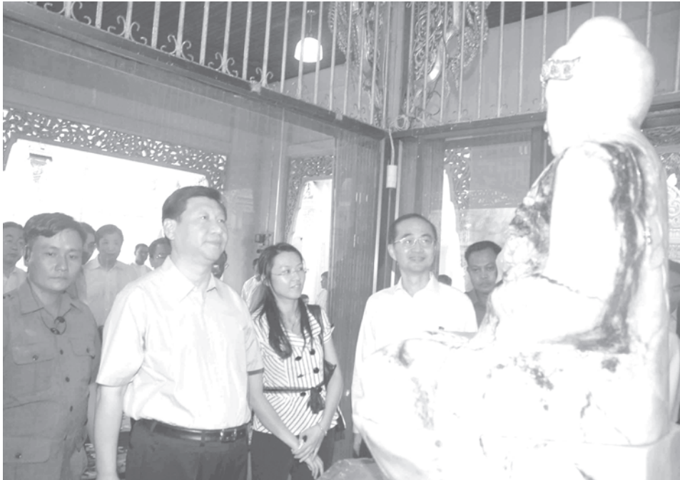
Delegation led by Chinese Vice President Mr Xi Jinping at Shwedagon Pagoda.