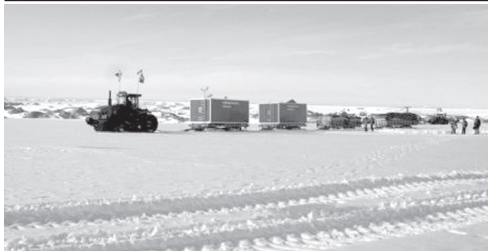
Some members of China’s expedition team sets out from the Zhongshan station, Antarctica, on 18 Dec, 2009. China’s expedition team sent two teams to the inland of Antarctica on Friday. One team headed to China’s Kunlun Station, the other one went to the Grove Mountains.