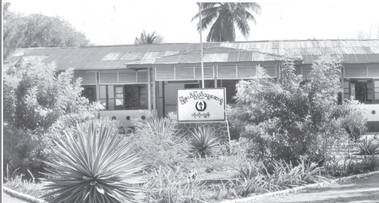
Cocogyun Township People's Hospital (25-bed).

project was completed in 1993. The earthen type dam is some 800 feet from the sea. About 30,000 gallons of freshwater are pumped to the town a day with the use of a 52 HP waterworks.