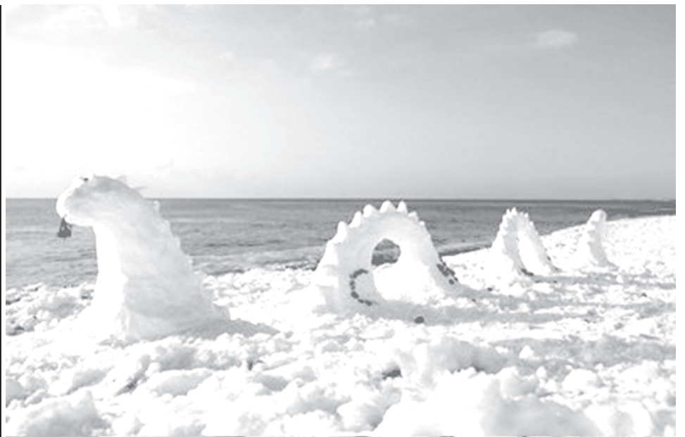
The Loch Ness monster made out of snow on Brighton beach. Two London airports closed by heavy snowfall have reopened, but forecasters are warning of a repeat of the bad weather that caused traffic chaos and closed schools across the southeast.

Yong said the positive outcomes of the conference were that it upheld the principle of "common but differentiated responsibilities" recognized by the Kyoto Protocol, and made a step forward in promoting binding emissions cuts for developed countries and voluntary mitigating actions by developing countries.