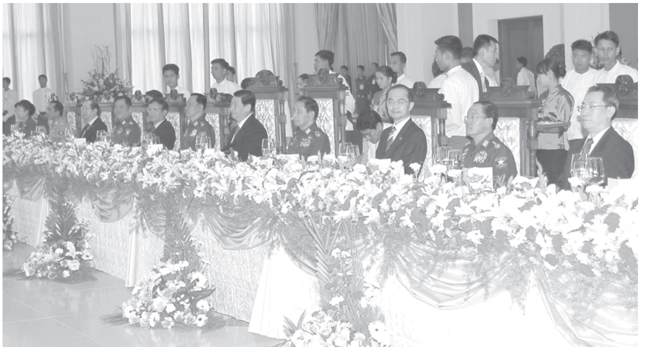
Vice-Senior General Maung Aye hosts luncheon to Chinese delegation headed by Vice President Mr Xi Jinping at Zeyathiri Beikman in Nay Pyi Taw.

After the luncheon, Vice-Senior General Maung Aye presented the photo album of the Chinese goodwill