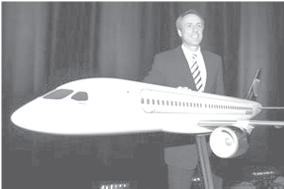
Guy Hachey, president and COO of Bombardier Aerospace poses with a model of the new CSeries jet before the groundbreaking ceremony for the CSeries assembly plant on 15 Sept, 2009 in Mirabel, Quebec north of Montreal.