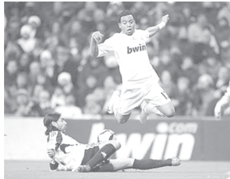
Real Madrid's defender Marcelo (R) jumps over a challenge from Zaragoza's defender Roberto Ayala during their Spanish League football match at Santiago Bernabeu stadium in Madrid. Real Madrid sent out a message of intent to all-conquering champions Barcelona with a 6-0 demolition of Real Zaragoza.