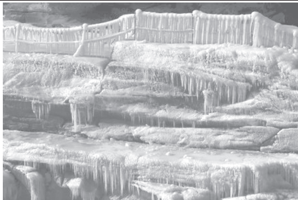
Photo taken on 19 Dec, 2009 shows the icicle scene at the Hukou Waterfall, northwest China’s Shaanxi Province. Crowds of visitors and photographers came to the Hukou Waterfall to admire the icicle scene recently.