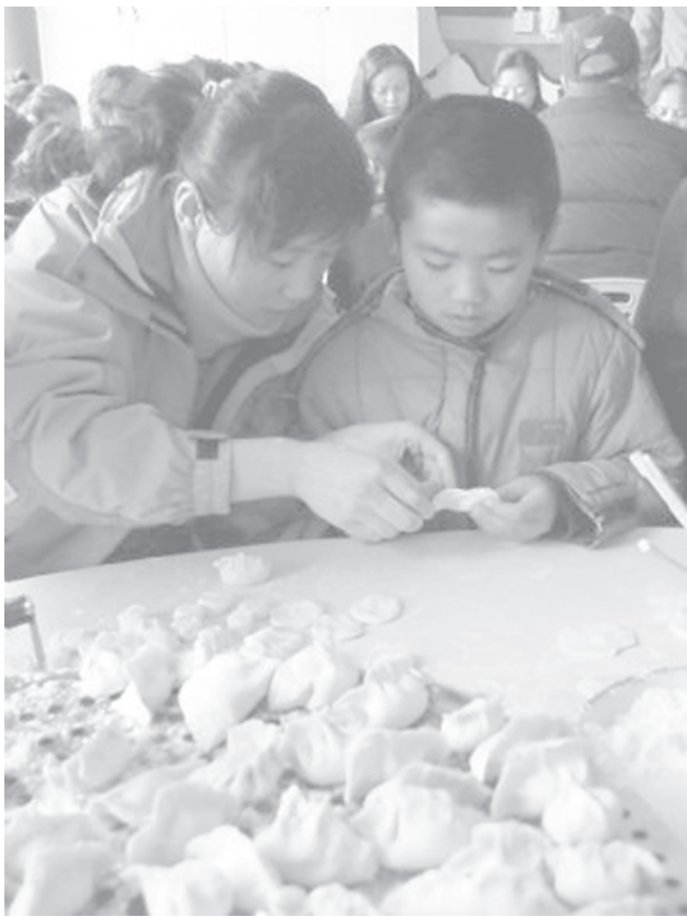
A volunteer teaches disabled children to make dumplings, or jiaozi in Chinese, at Xi'an Xinxin Kindergarten in Xi'an, capital of northwest China's Shaanxi Province, on 19 Dec, 2009. With the advent of winter solstice, over 30 volunteers came to Xi'an Xinxin Kindergarten on Saturday and made dumplings with the disabled children there.

So far, it has proven more than 2 billion tonnes of oil reserves and 2.7 trillion cubic meters of gas reserves. —Xinhua