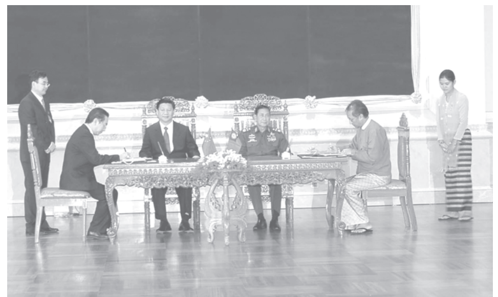
Officials of Myanmar and the PRC sign MoU and agreements.