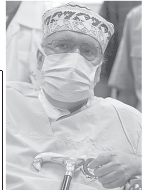
Freed Lockerbie bomber Abdelbaset Ali Mohmet al-Megrahi is pictured at a hospital in Tripoli in September 2009.

"His condition was examined on Saturday by a team of European experts who agreed on the continuation of chemotherapy sessions while also administering other medicaments to treat the disease," the hospital said in its first bulletin released since Megrahi's return in August.— Internet