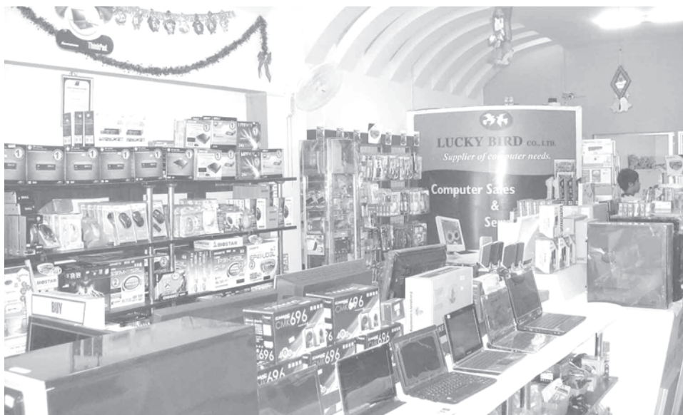
Laptops and projectors on display at the special sales of Lucky Bird Group of Companies.