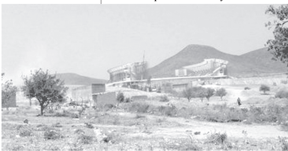
A view of the construction site of the stadium of Benguela in September 2009, one of the four stadiums to host the African Nation’s Cup (CAN). One of the four stadiums built for the African Cup of Nations (CAN) in Angola was officially handed over to the public works minister, state news agency ANGOP reported on Saturday.