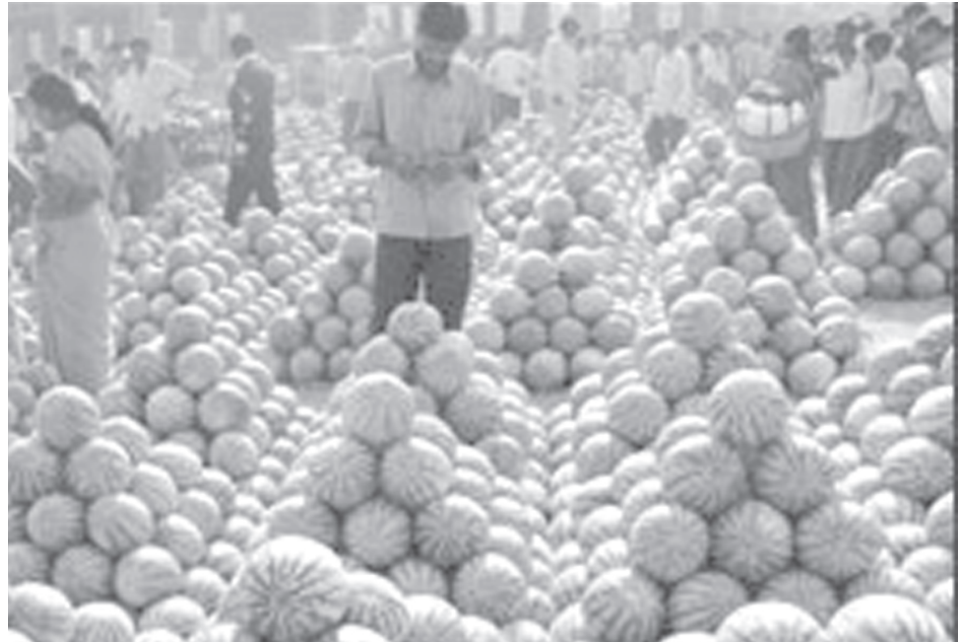
India is grappling with rising food prices.