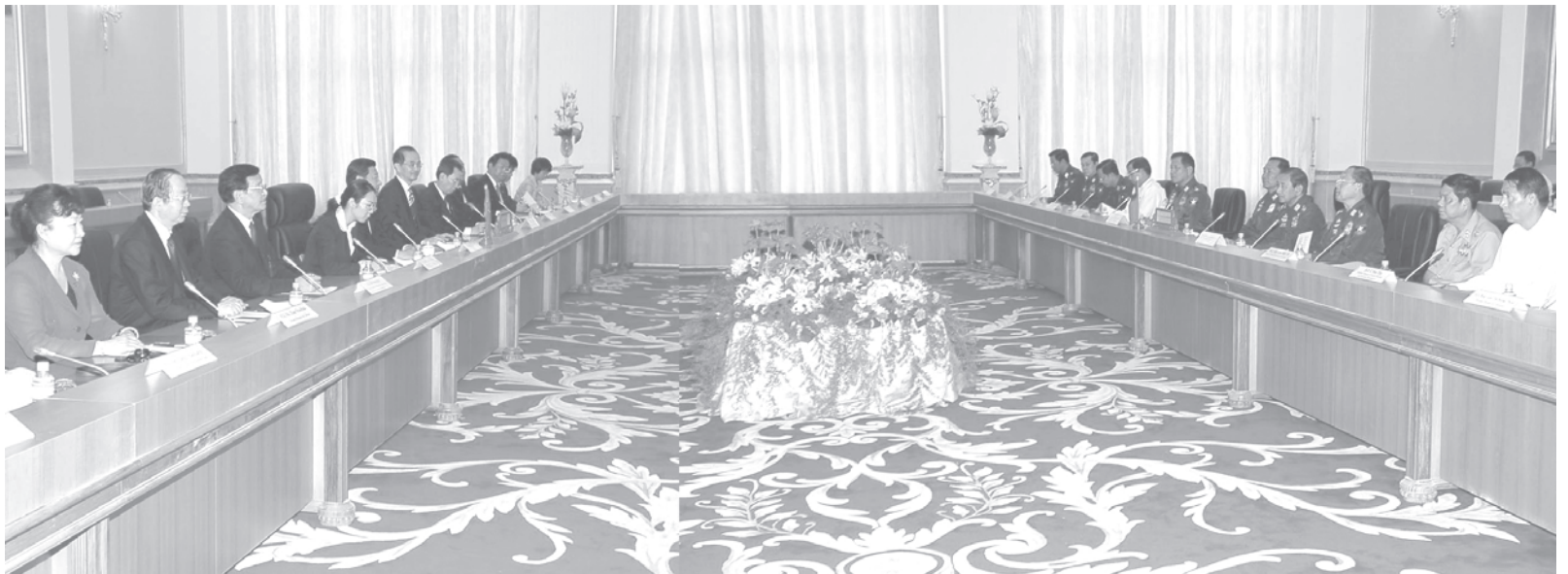
Vice-Senior General Maung Aye and Chinese Vice President Mr Xi Jinping hold discussions in Nay Pyi Taw.

Present at the call together with Vice-Senior General Maung Aye were SPDC member General Thura Shwe Mann, SPDC Secretary-1 General Thiha