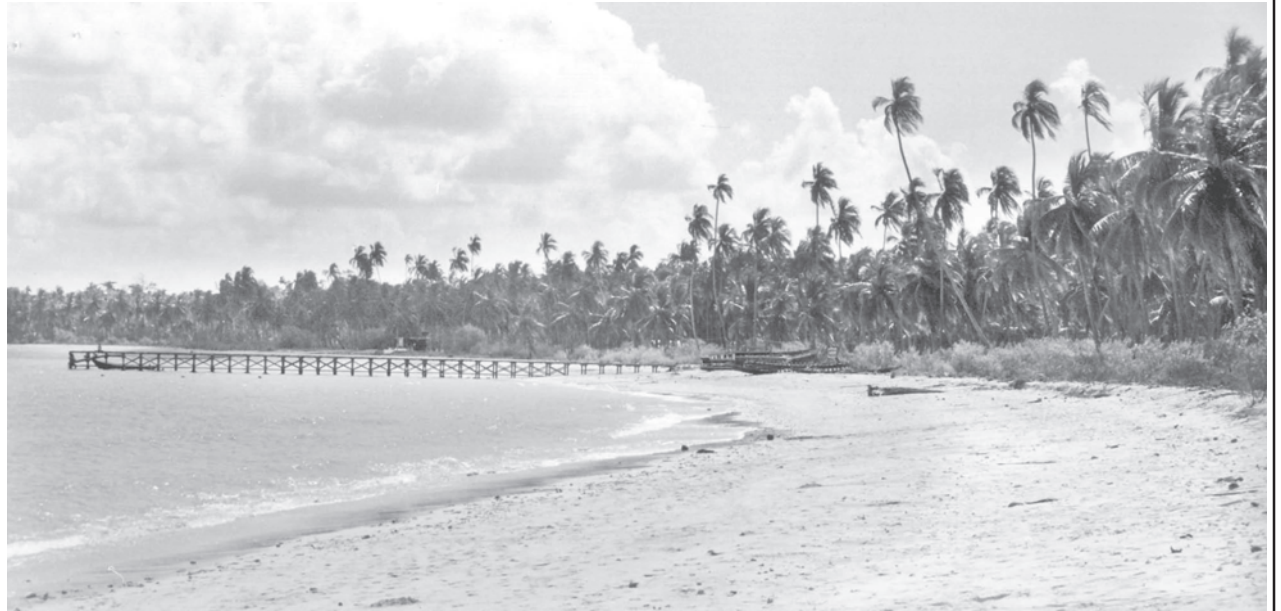
The beach of Coco Island and the wooden landing stage.

Being situated in the sea, it has a temperate climate pattern. Its average annual rainfall is about 95 inches, and average temperature is 28 degree centigrade. It does not have any steams that flow all year round. So, Cocogyun Dam with a water storage capacity of 49 million gallons was constructed in 1991, and the