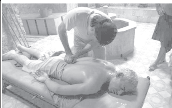
Palestinians enjoy massage before bathing at "Hamam Alshefa", the traditional Turkish bath in the West Bank city of Nablus. The Turkish bath, built about 400 years ago during the Ottoman rule, opens 24 hours a day and has separate days for men and women.

Small bits of debris from the Jet Falcon N-28 RK were found scattered about 15 miles (24 kilometers) from the remote Bahamian island's only settlement, Matthew Town. Investigators plan to examine a sprawling area of dense vegetation on Sunday, Brown said.— Internet