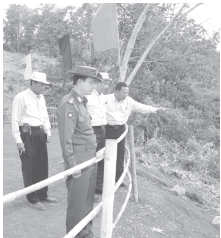
Minister for Electric Power No. 1 Col Zaw Min inspects Upper Yeywa Hydropower Project.—MNA

A total of 10 teams will participate in men's event and six in women's. Myanmar Cricket Federation will award K 70,000 for first prize winner, K 40,000 for second and K 20,000 for third.—MNA