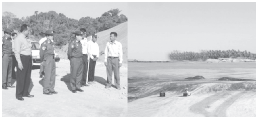
Commander Maj-Gen Thaug Aye and Minister for Transport Maj-Gen Thein Swe inspect extension of the runway of Thandwe Airport.—TRANSPORT

NAY PYI TAW, 18 Dec—Chairman of Rakhine State Peace and Development Council Commander of Western Command Maj-Gen Thaug Aye together with Minister for Transport Maj-Gen