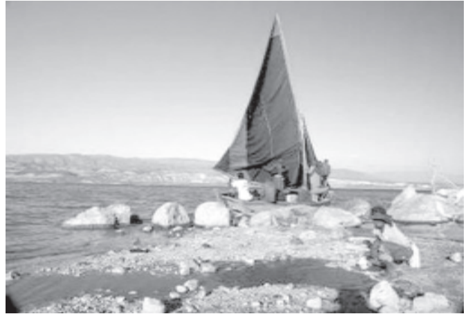
A Haitian girl collects water in a flood-affected area in Malpasse on 17 December, 2009. Two of the ten countries which were more affected by climate change between 1990 and 2008 belong to the Caribbean.