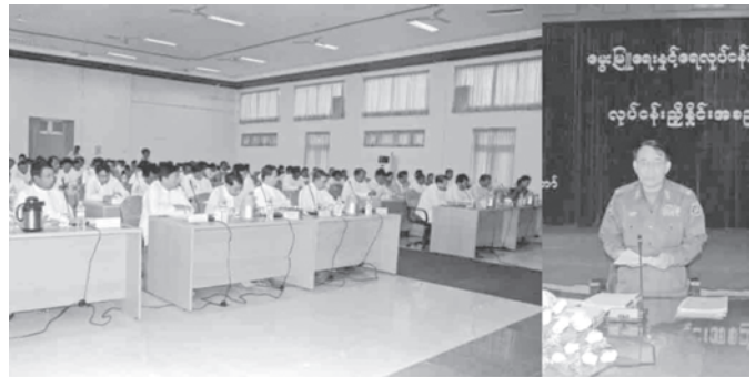
Minister for Livestock and Fisheries Brig-Gen Maung Maung Thein delivers an address at work coordination meeting.

The minister then presented cash awards to children of staff of Livestock, Feedstuff and Dairy Products Enterprise, Livestock Breeding and Veterinary Department, Fisheries Department, Livestock Breeding and Fisheries