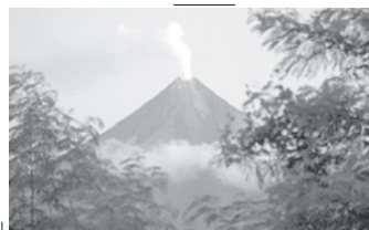
Plumes of ash and smoke stream from the top of the Mayon volcano in the Philippine town of Legaspi in November.—INTERNET

should not be in those danger zones when a hazardous explosion happens," said chief government volcanologist Renato Solidum.—Internet