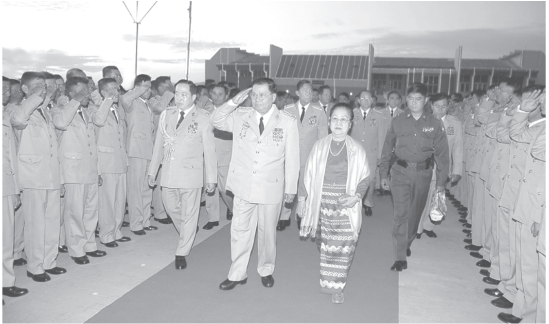
Chairman of the State Peace and Development Council Commander-in-Chief of Defence Services Senior General Than Shwe and wife Daw Kyaing Kyaing attend graduation dinner of the 12th Intake of Defence Services Technological Academy.

Also present at the graduation dinner were Member of the State Peace and Development Council General Thura Shwe Mann, Secretary-1 of the State Peace and Development Council Quartermaster-General General Thiha Thura Tin Aung Myint Oo, Member of the SPDC Lt-Gen Tin Aye of the Ministry of (See page 7)