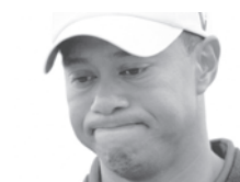
Tiger Woods reacts during the British Open Golf Championship at the Turnberry Golf Club in Scotland, in this on 16 July, 2009 file photo. Woods said on 11 December he would take an "indefinite break" from professional golf, acknowledging the disappointment and hurt his "infidelity" had caused his family.