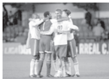
Salzburg's players celebrate their victory over Villarreal after their Europa League soccer match at the Madrigal Stadium in Villarreal on 17 December, 2009.

Only several places were up for grabs in Thursday's 12 games, with a number of teams having already qualified including