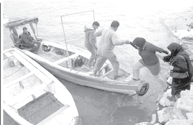
A woman is helped onto a small boat that transports people over the Tigris River in central Baghdad, Iraq, on 17 Dec, 2009. Many civilians use small boats to cross the Tigris River and avoid the traffic jams and possible attacks on the roads.

At an hourlong news conference on Wednesday, al-Maliki cited the continuing investigation of the 8 Dec attacks. He said several security forces were involved in the probe.— Internet.