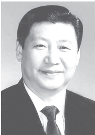
Mr Xi Jinping.

Mr Xi Jinping is an ethnic Han and born in June 1953, in Fuping, Shaanxi Province. He joined the Communist Party of China (CPC) in 1974. He received Doctor of Laws (LLD) from the School of Humanities and Social Sciences of Tsinghua University, majoring in Marxist theory and ideological education.