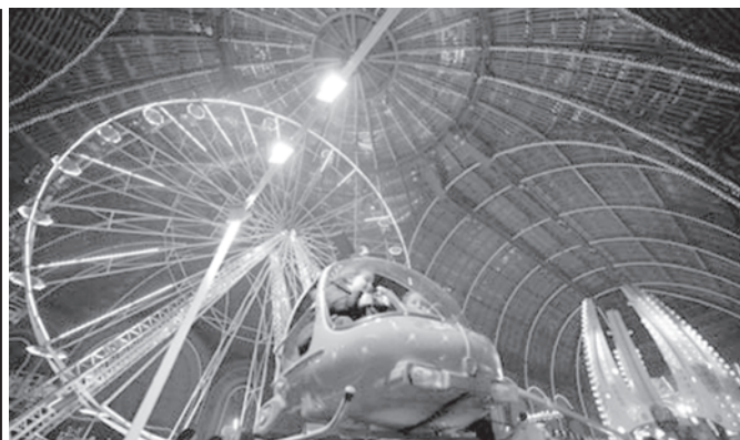
Children sit in the helicopter of a merry-go-round at a funfair inside Paris' Grand Palais as part of holiday activities in the French capital on 17 Dec, 2009. —XINHUA

China will continue its support and aid to these countries on agriculture, health care, education and climate change in the frameworks of South-South cooperation and bilateral cooperation, he said.—Xinhua