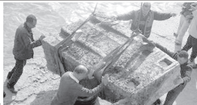
Workers handle an ancient Egyptian granite tower that was retrieved from the Mediterranean Sea, at Alexandria's eastern harbour on 17 Dec, 2009. The tower is a part of a pylon of the temple to Isis, and was found next to Cleopatra's submerged mausoleum on the murky seabed.