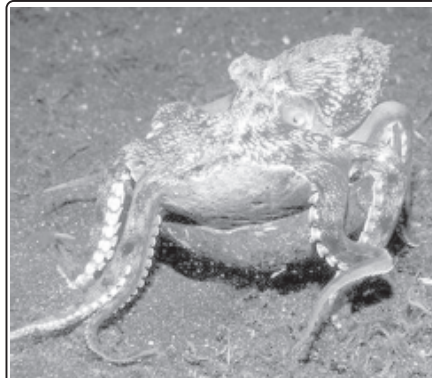
In this 10 Dec, 2009 photo taken near Indonesia and released by Museum Victoria, a veined octopus, Amphioctopus marginatus crawls along the ocean floor holding one half of a coconut shell. Australian scientists have filmed the octopus collecting coconut shells for shelter, unusually sophisticated behaviour that the researchers believe is the first evidence of tool use in an invertebrate animal.