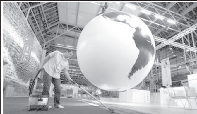
A workman cleans the floor in the Bella Centre as negotiators worked through the night to form a draft text at the UN Climate Change Conference 2009 in Copenhagen on 18 Dec, 2009.

A partial aerial view of the man-made Palm Jumeirah island built by Nakheel property giant off the coast of Dubai. Abu Dhabi's last-minute lifeline to debt-laden Dubai, which prevented a potential major default, was an interest-bearing commercial loan and not a handout, a government-owned daily has said.