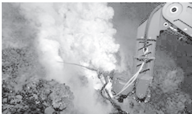
In this image taken from a May 7, 2009 video and provided by the National Science Foundation and the National Oceanic and Atmospheric Administration, a robotic arm collects samples at the West Mata Volcano nearly 4,000 feet beneath the Pacific Ocean, south of Samoa.—INTERNET