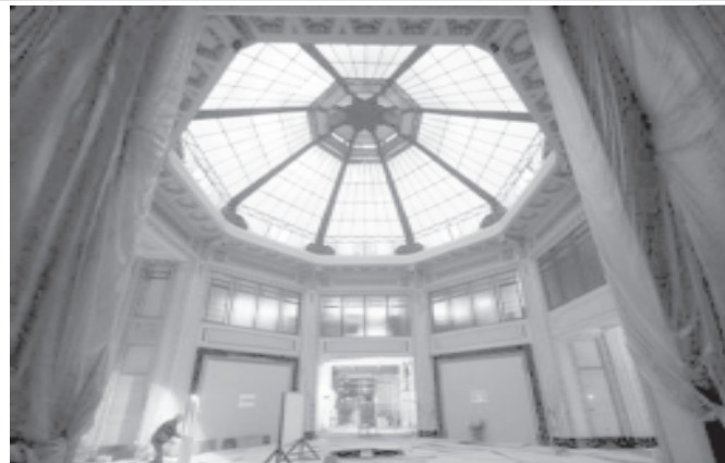
A construction worker works at the Octagonal Hall of the Shanghai Peace Hotel in Shanghai, the economic and financial hub of China, on 17 Dec, 2009. With a history of nearly one hundred years, the landmark building in Shanghai began its reconstruction and renovation to welcome visitors all over the world by the time when Shanghai Expo would be held next year.