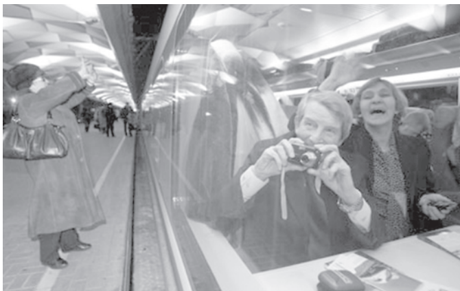
A passenger takes a picture as he sits aboard high speed train Sapsan in Moscow, on 17 Dec, 2009. Sapsan will take passengers from Moscow to St Petersburg in 3 hours and 45 minutes at a top speed of 250 kmph (155 miles per hour).