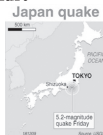
Map locating the epicentre of a 5.2-magnitude quake that struck off the coast of Japan on Friday. At least seven people were injured and more than 20 buildings damaged.

The tremor shattered windows and cracked some roads and sidewalks, toppled over tombstones in a cemetery, caused the collapse of a hotel wall and damaged more than 20 other buildings in Ito City, eastern Izu. Among those injured was a 78-year-old man who broke his hip when he fell on a stairwell,