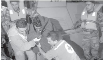
Rescue workers help a survivor of a sunken Panama ship after he was rescued off the port of Tripoli in northern Lebanon, on 17 December, 2009.

The crew members were from Britain, Australia, Russia, Lebanon, Syria, Pakistan, the Philippines and Uruguay, the state-run National News Agency reported.— Internet