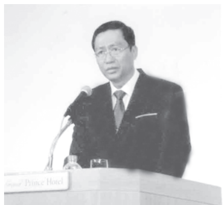
Deputy Minister U Maung Myint speaking at Myanmar Investment Seminar sponsored by ASEAN-Japan Promotion Center on Trade, Investment and Tourism held in Japan.

On 15 December, the deputy minister and party attended the Myanmar Investment Seminars at Grand Prince Hotel in Tokyo. At the seminar, the deputy minister and party presented the overviews of economic, industrial, tourism and commercial development of Myanmar and the business and investment opportunities as well as Japanese investment in Myanmar. The delegation exchanged views and had discussion with the participants. More than 200 Japanese businessmen attended the seminar. During the visit, the deputy