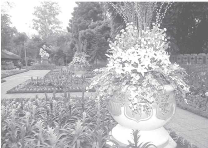
Flowers in full bloom at National Kandawgyi Gardens. MNA (News on page 16)