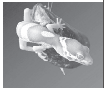
A German visitor has been caught trying to leave New Zealand with 23 geckos and 20 skinks hidden in his underwear, a court has been told.