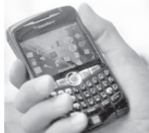
Research In Motion Ltd was hit by an email outage on Thursday for its popular Blackberry but there were no problems with the quarterly earnings of the Canadian smartphone maker.

Besides releasing results that surpassed the expectations of Wall Street analysts, RIM also announced that in addition to China Mobile it was adding China Telecom as a Blackberry part-