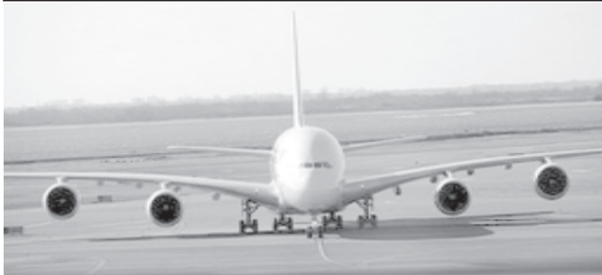
An Airbus A380. France's financial markets watchdog on Thursday cleared 17 current and former EADS aerospace executives accused of making millions in insider trading linked to the Airbus A380 superjumbo project.

POSCO, South Korea's leading steelmaker, has reportedly shown interest in joining the bid which kicked off in October when a consortium of Merrill Lynch & accounting firm Samjong KPMG was picked as main arranger. The South Korean government is pushing for a swift retrieval of the so-called 'bailout funds', which they formed to save the local financial market falling into a disorder from corporate bankruptcies amid the 1997-98 Asian financial crisis.— Xinhua