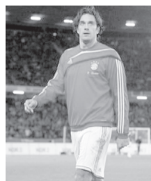
Italian World Cup winner Luca Toni