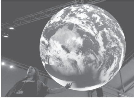
A visitor looks at a projection of Space and Earth, a part of the NGO presentation in Oksnehallen in the centre of Copenhagen, 17 December 2009, during the United Nations Climate Change Conference 2009.