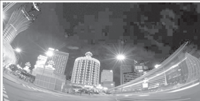
Photo taken in November 2009 shows the night view in Macao Special Administrative Region (SAR) in south China. The 10 th anniversary of Macao's return to the motherland will fall on 20 Dec this year.