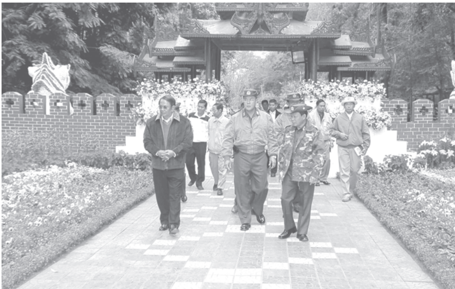
Ministers inspect upgrading of National Kandawgyi Gardens in PyinOoLwin.—MNA

The ministers then visited butterfly museum where they viewed various species of butterflies from Myanmar, Nepal, Chinese Taipei, South America, Japan and South East Asia.—MNA