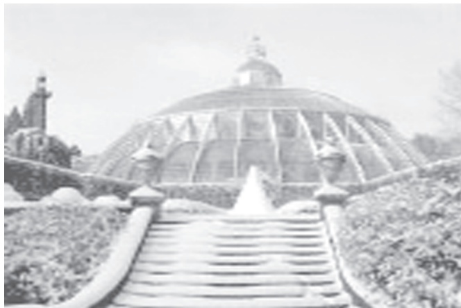
The floral houses of the Royal Castle of Laeken in Brussels, seen under the snow on 18 Dec, 2009.