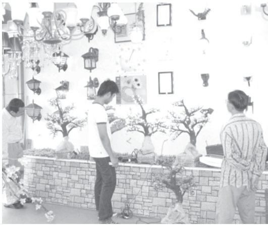
Newly-opened show room of Asia Light Electrical Accessories on Upper Pansodan Road in Mingala Taungnyunt Township. UMFCCI

The show rooms of Asia Light Electrical Accessories have been opened between No.97 and No. 30 Streets (Ph: 0209421 and 0274655) and at No. 269 between No. 26 and (83x84) Streets (Ph: 0266655 and 0272300). One may contact the show rooms Asia Light through Email: asialight-27@gmail.com . —MNA