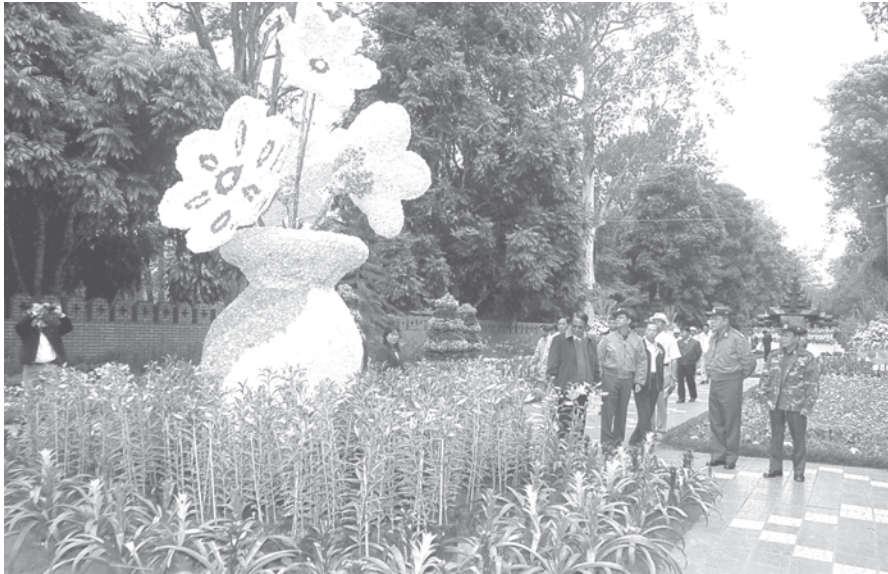
Ministers view progress in upgrading of National Kandawgyi Gardens in PyinOoLwin. (News on page 16)