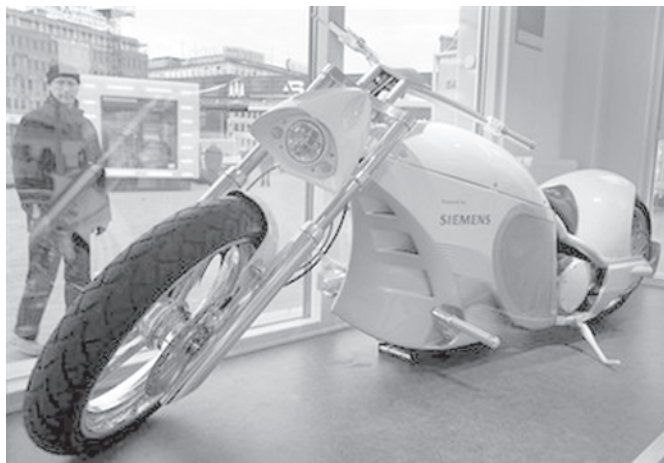
A man inspects a fully electronic motorcycle on display in the city center of Copenhagen on 16 Dec, 2009. The largest and most important UN climate change conference is underway in Copenhagen, aiming to secure an agreement on how to protect the world from calamitous global warming.