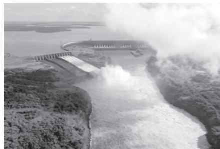
The Itaipu dam, the world's second-largest hydroelectric power producer, is seen in the Parana River along the border of Brazil, right, with Paraguay, left, on 15 Dec, 2009. The 25-year-old dam provides about 20 percent of Brazil's electricity, and was the largest producer of electricity in the world until China's Three Gorges dam recently surpassed it.