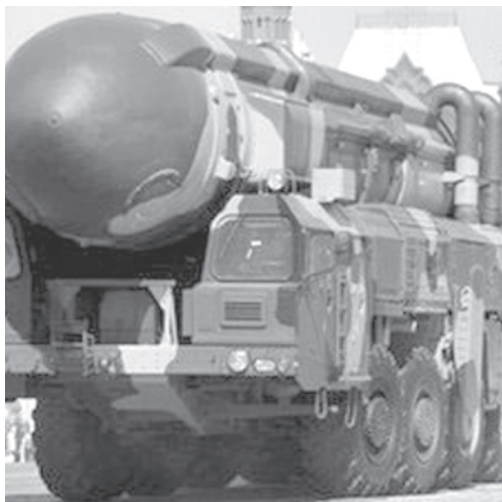
A Russian Topol-M intercontinental ballistic missile parades through Red Square in Moscow. Russia has accused the United States of slowing down talks to agree a new nuclear weapons disarmament treaty, after officials admitted the two sides could no longer sign the accord this year.

Any enthusiasts may attend and discuss National Language Processing and Search Engine free of charge. For further information dial 652276.