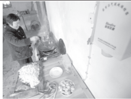
Ye Xiuhua uses methane to cook at home in Lantang Village of Longyou County, Quzhou City, east China's Zhejiang Province, on 16 Dec, 2009. As a clean energy resource, methane is now widely used in the villagers' daily life in Lantang Village.

The pilot was also taken to hospital with undisclosed injuries. The crash prompted transport officials to close the westbound lanes of the Bonaventure Expressway.— Xinhua