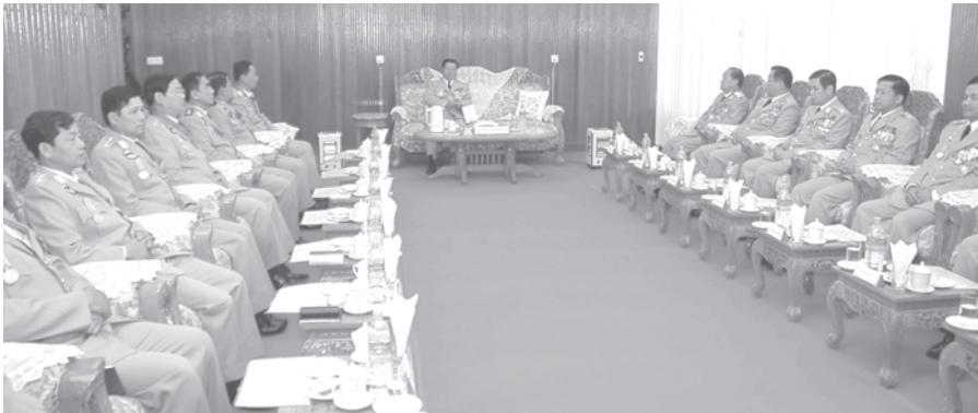
Commander-in-Chief of Defence Services Senior General Than Shwe meets with three outstanding cadets and their parents at the hall of DSTA.

Commanding Officers Course and the Military Staff College. When required, you must be ready to serve in infantry units in the battle field. There have been precedents in the history of the Tatmadaw where in the units from the Engineering Corps defeated the enemies alone without the infantry support. In order to fulfill the duties assigned to you, it is imperative that you constantly study not only technical subjects but