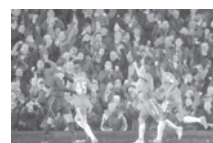
Chelsea's Frank Lampard (C) celebrates with team mates after scoring against Portsmouth during their English Premier League soccer match at Stamford Bridge in London on 16 December, 2009.

Champions Manchester United had pulled level on points on Tuesday after beating a second-string Wolverhampton Wanderers 3-0 in manager Alex Ferguson's 900th league game in charge.— Xinhua