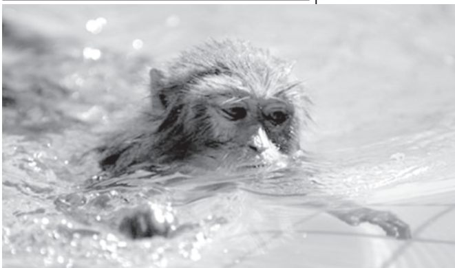
A macaque monkey swims in Hainan, S China, on 16 Dec, 2009.