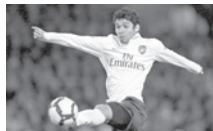
Arsenal's Croatian forward Eduardo controls the ball during the English Premier League football match against Burnley at Turf Moor, Burnley. The match ended in a 1-1 draw.

Yet Owen Coyle's team have more character than most and managed to level the scores in the 27th minute when Thomas Vermaelen conceded a penalty for a crude challenge on Andre Bikey, which Alexander duly converted to make it 14 from 14 successful spot kicks during his Burnley career.