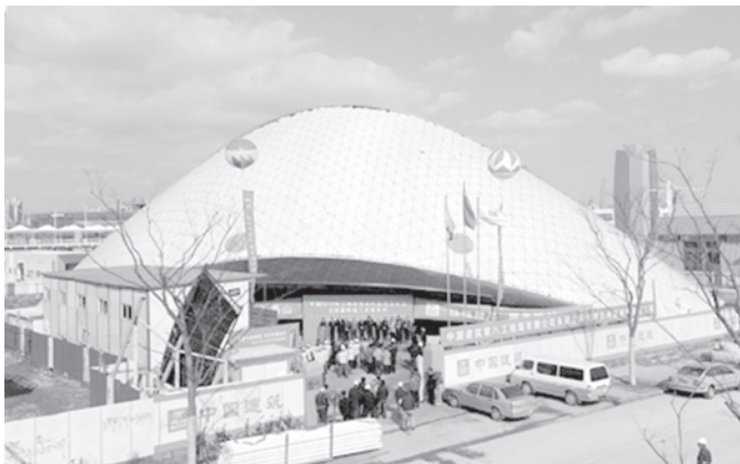
The photo taken on 16 Dec, 2009 shows the UAE Pavilion in the Pudong Park of Shanghai World Expo. The ceremony for celebration of completion of base building of the Pavilion of the United Arab Emirates was held in Shanghai on Wednesday. Shaping like rolling sand hills, the UAE Pavilion covers an area of 6000 square metres.