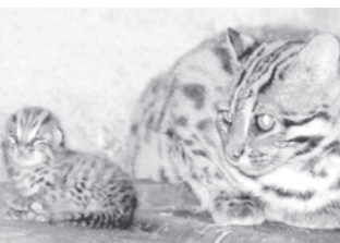
Leopard cats in an Indian zoo in 2003. A Malaysian woman has been arrested for keeping endangered animals including a leopard cat, a honey bear and a slow loris as pets in her apartment, reports said.

"I'm A Celebrity ... Get Me Out Of Here," which is now in its ninth series, pits contestants against each other in a knock-out contest which involves a series of scary and stomach-churning tasks in a remote setting.