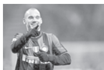
Inter Milan's Dutch midfielder Wesley Sneijder celebrates after scoring against Livorno at San Siro Stadium in Milan.

Inter coach Jose Mourinho resisted the temptation to make too