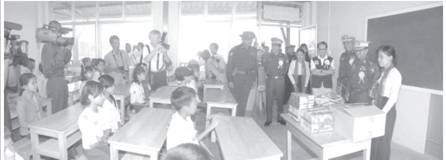
Lt-Gen Myint Swe inspects new school building of BEMS-1 of Thingangyun Township.