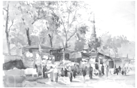
Two paintings displayed at the exhibition.

The 54-year old artist's second solo exhibi-