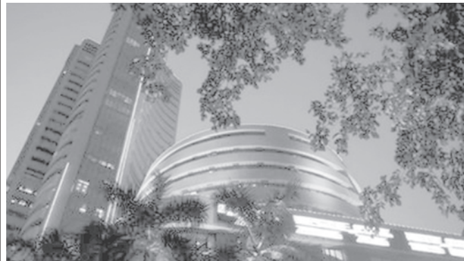
The Bombay Stock Exchange building during a special trading session in Mumbai in October 2009. India's two main stock exchanges announced late on Wednesday an extension of daily trading starting on Friday, to boost volumes and the size of the market.