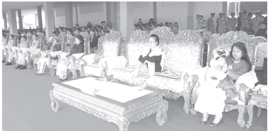
Distinguished guests at graduation parade of 12th Intake of Defence Services Technological Academy.

The development of every state depends on the