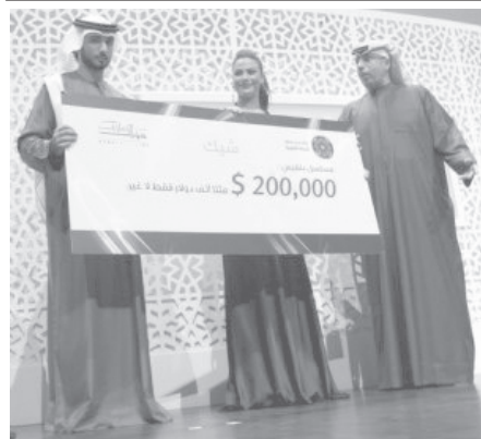
Jordanian actress Saba Mubarak receives an award from Sheikh Majed (L), the son of the Dubai ruler Sheikh Mohammed bin Rashid al Maktoum, during the Closing Night and Award Ceremony of the Dubai International Film Festival (DIFF) in Dubai on 16 December 2009.—INTERNET

Neither Israel nor the United States have ruled out military action if diplomacy fails to resolve the dispute. Iran has vowed to retaliate for any attack.—MNA/Reuters