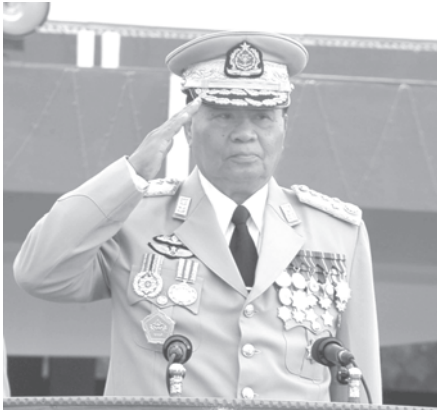
Commander-in-Chief of Defence Services Senior General Than Shwe taking the salute of the cadet companies.

Tatmadawman could fulfill the Five Basic Qualities such as strength of mind, discipline, loyalty,