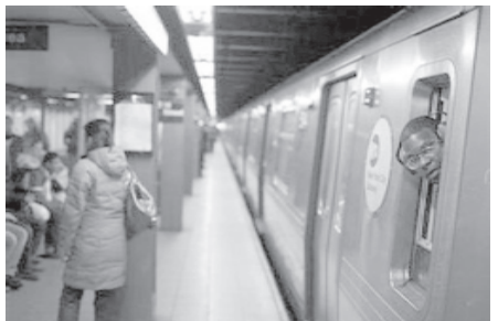
A train conductor leans out his window as a subway car starts down the tracks in New York, on 25 March, 2009.—INTERNET

and 2013. The deficit-plagued MTA, the largest US mass transit agency with about 10 million daily riders, had dodged the service cuts in the spring after a state bailout, but the state rescue unexpectedly fell short, causing a late-year deficit.—Internet