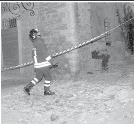
An Italian firefighter looks at damaged buildings in Spina, near Perugia, central Italy, after residents were evacuated on 16 Dec, 2009. Authorities said a magnitude 4.2 earthquake has shaken the Italian region of Umbria but caused no injuries. Towns in the Province of Perugia reported buildings lightly damaged by the temblor, monitored by Italy's national institute of geophysics. Italy's Agriculture Minister said on Tuesday 600 people were evacuated until their homes can be inspected. Mayors of several hamlets ordered schools closed on Wednesday for inspections.—INTERNET

The report also found that groups that are most likely to lack health coverage were Hispanics, men and young adults aged 18 to 24.—Xinhua