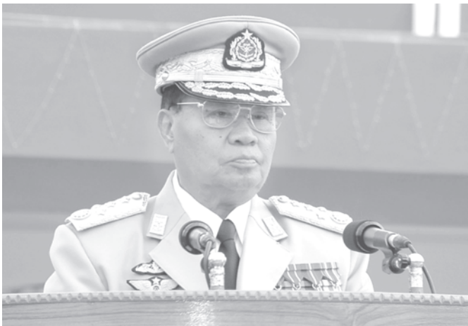
Senior General Than Shwe addresses Graduation Parade of 12 th Intake of Defence Services Technological Academy.