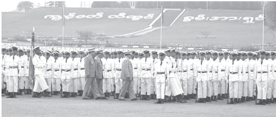
Commander-in-Chief of Defence Services Senior General Than Shwe inspects cadet companies.