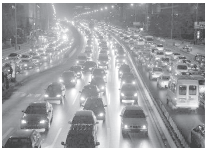
The photo taken on 15 Dec, 2009 shows the vehicle flow on the West Second Loop Road in Beijing. According to Beijing Traffic Administration, the number of motor vehicles in Beijing mounted to 3.991 million up to 13 Dec, and is expected to exceed 4 million in a few days.

The one-year-old girl, who was suffering nervous-system disorders, was hospitalized for high fever and coughs last month, but her conditions continued to deteriorate despite taking Tamiflu, or double doses of it in her final days, according to Ministry of Health, Welfare and Family Affairs. Health authorities last week confirmed the virus resistant to Tamiflu was found in the infant's body.—Xinhua