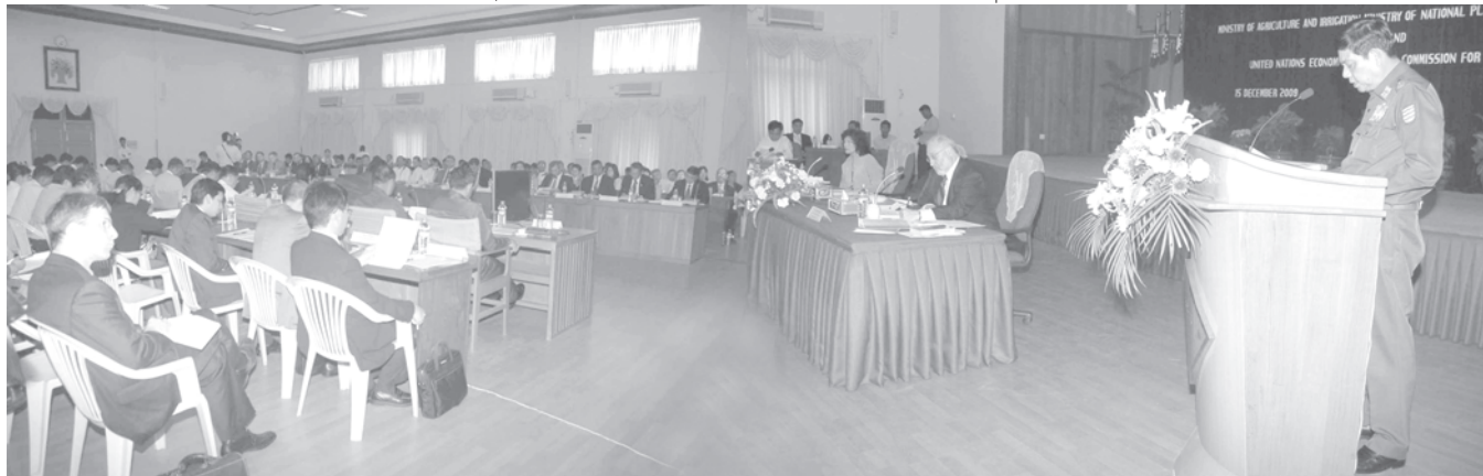
Minister for Agriculture and Irrigation Maj-Gen Htay Oo gives speech at forum on policies for enhancing rural livelihoods - effecting change in Myanmar's rural economy.