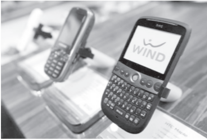
WIND Mobile cell phones are displayed at a retail store before the official launch of WIND Mobile, a new cellular service for the Canadian market, in Toronto, on 16 December, 2009. Upstart cellular phone company Globalive Wireless said on Monday it will offer its Wind Mobile cellular phone service at a number of Blockbuster Video stores in Canada. Globalive spent C$442 million ($415.9 million) to buy wireless spectrum in an auction held by the government last year to boost competition in the market.