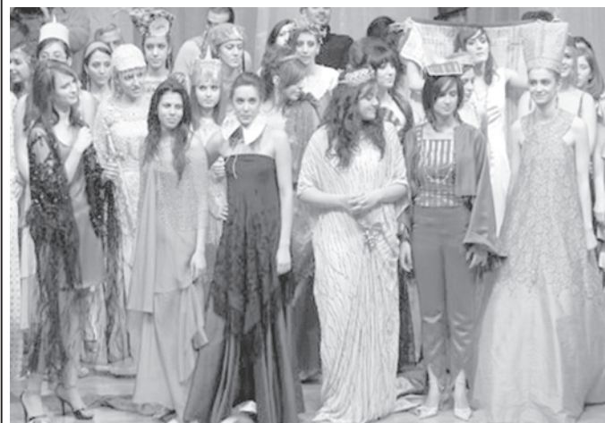
Jerusalem catwalk: Models showcase clothes by Palestinian designers during a fashion show in Jerusalem.