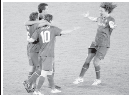
Barcelona's Lionel Messi (3rd L) celebrates his goal with teammate Carles Puyol (R) during their FIFA Club World Cup semi-final soccer match against Atlante at Zayed Sports City stadium in Abu Dhabi on 16 December, 2009.

Atlante took a foul from deep in its own penalty area. There should have been no problem, but the Barcelona defense totally misjudged the ball and goalkeeper Victor Valdes mistimed a run off his line to leave Rojas with a simple tap in.