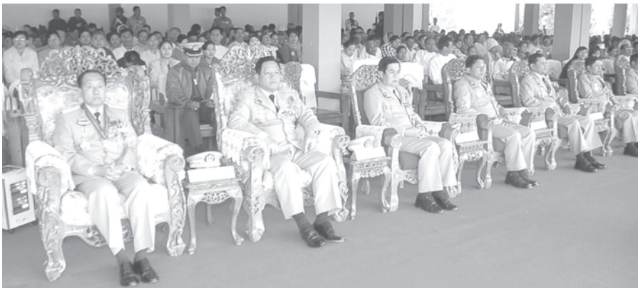
Dignitaries at the graduation ceremony of 12th Intake of Defence Services Technological Academy.

also military science. As we, Tatmadawmen, uphold the four loyalties, we have never been hesitant to sacrifice our life, our sweat, and our blood for the State and the citizenry. You must preserve these fine traditions even at the expense of your lives. You must as well strive to achieve the ten strength of Tatmadaw such as loyalty, obedience, valour and military discipline.