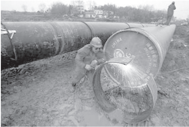
A worker welds next to a gas pipeline at a construction site of West-to-East Gas Transportation Project in Suizhou, Hubei Province December 16, 2009. PetroChina completed the capacity expansion project of the West-to-East natural gas pipeline on 14 December, the China Petroleum Daily reported on Thursday.