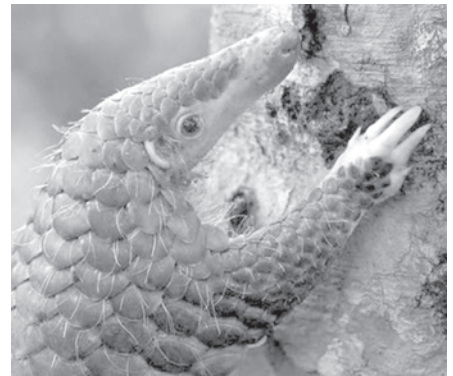
A Malaysian pangolin (Manis javanica), also known as a scaly anteater, climbing a tree. Malaysian marine police said on Thursday they had seized 62 pangolins, destined for cooking pots and medicine shops overseas, in a two-week operation.

golins are considered a delicacy in China but are classified as a protected species under the UN's Convention on International Trade in Endangered Species.