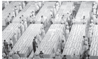
Chefs and culinary students display 5,000 cheese-inspired dishes in an attempt to set a new world record at a coliseum in Manila on 14 December, 2009. The event aimed to beat the Guinness World Record of "The most number of dishes on display, in a single day" of 4,668 set by India in 2007.

He faces charges for a variety of driving offences.