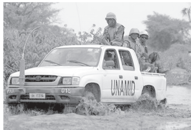
A convoy of the United Nations Assistance Mission in Darfur (UNAMID) crosses through mud in the southern village of Kashalongo, south of Nyala in southern Darfur, in June 2009. Two civilian staffers working for the joint UN-African Union peacekeeping force in Darfur were freed on Sunday after 107 days in captivity, a UNAMID spokesman told.—INTERNET

The two, a Nigerian man and a Zimbabwean