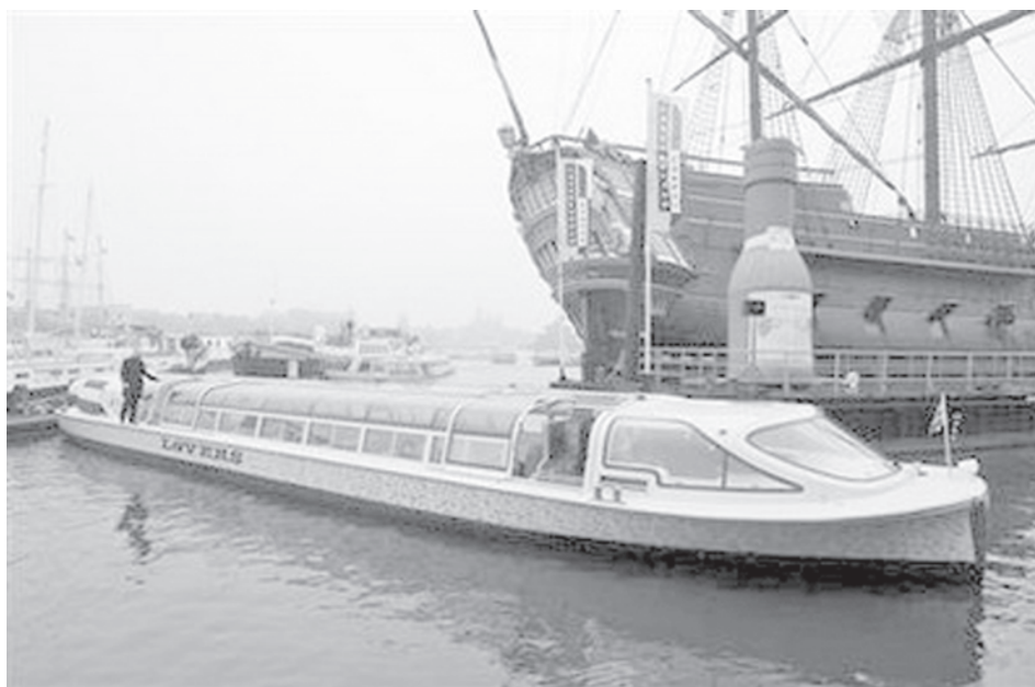
Nemo, the world's first canal boat powered by hydrogen fuel cell, arrives in Amsterdam recently.