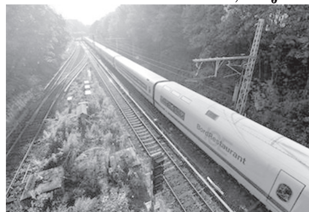
A high-speed Inter-City Express train of the Deutsche Bahn makes its way on Berlin's so-called ring way in October. German rail operator Deutsche Bahn plans to cut 14,000 jobs over the next five years, the Tagesspiegel newspaper has said in a report.

BERLIN, 14 Dec—German rail operator Deutsche Bahn plans to cut 14,000 jobs over the next five years, the Tagesspiegel newspaper said in a report to be published on Monday. Deutsche Bahn currently employs 240,000 people. It has 182,000 in Germany.