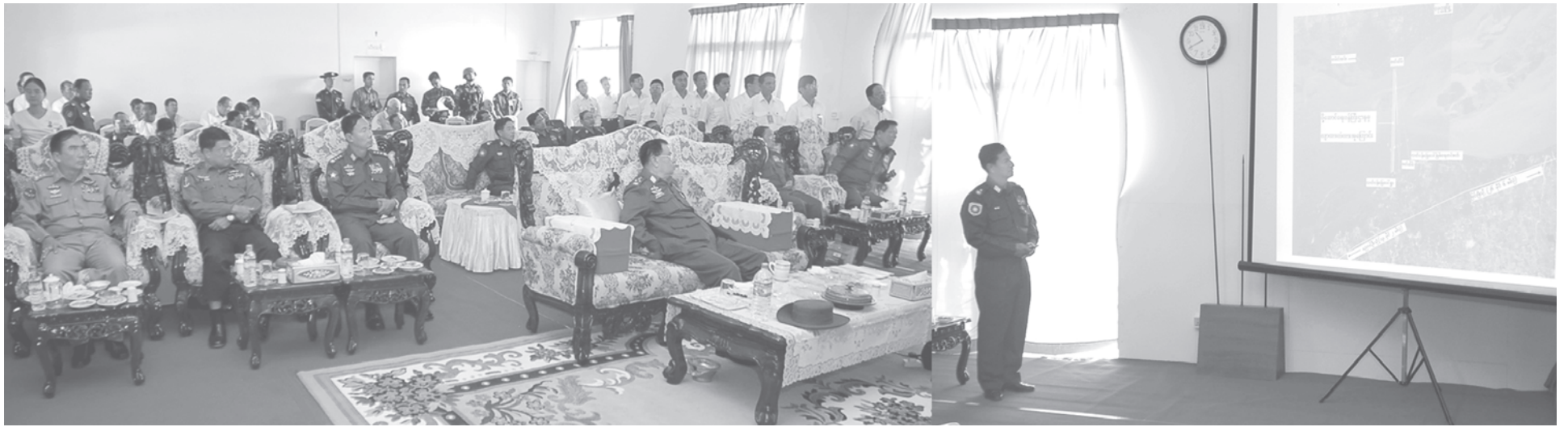
Senior General Than Shwe hears reports submitted by Minister Maj-Gen Khin Maung Myint.