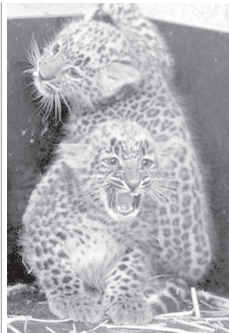
Persian Leopards Razan and Marum are pictured at the zoo in Chemnitz, eastern Germany in 2007. Russia on Tuesday asked Iran if it would be prepared to supply rare Persian leopards as part of a Russian project to reintroduce the big cat to its Caucasus region.