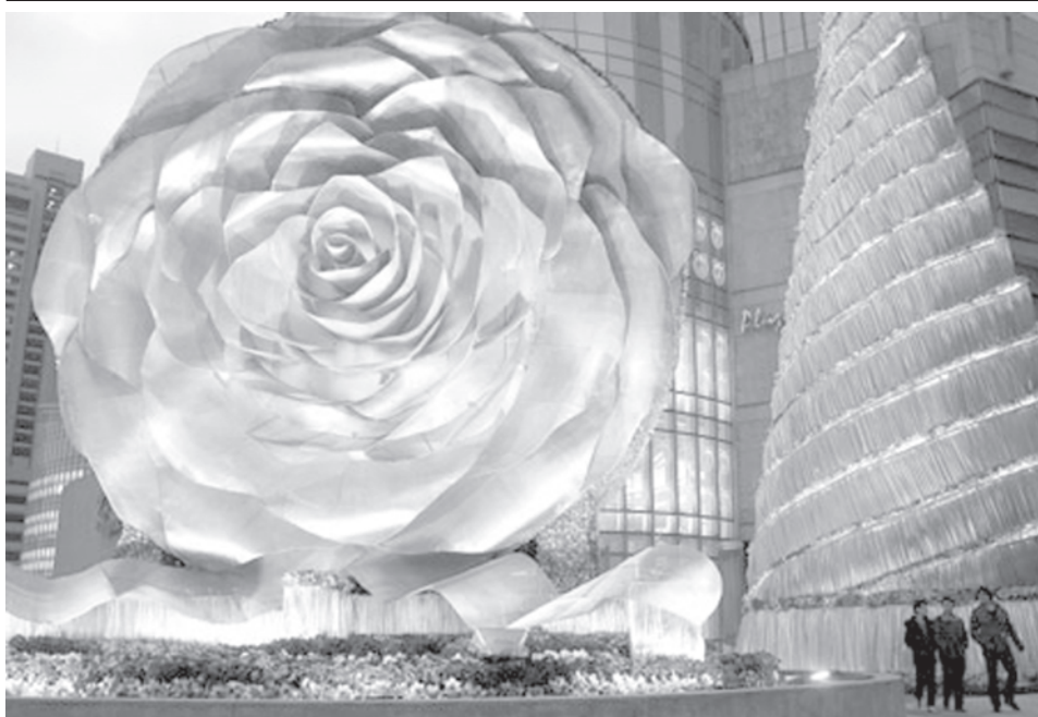
A huge flower statue for New Year celebration is seen in Shanghai municipality in east China, on 13 Dec, 2009.

Meanwhile, he noted that the illiteracy eradication in Venezuela, Bolivia and Nicaragua is of great significance and a step of the fight against the social problem. Additionally, Castro also praised the achievements of the Miracle Operation, through which at least 1 million people in many countries of the region recovered the eyesight.—Xinhua