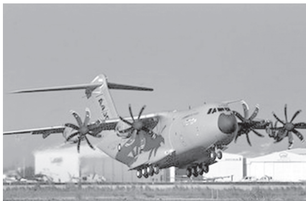
The new military Airbus A400M transport plane takes off during its exhibition flight at Seville, Spain, on 11 Dec, 2009.

A Deutsche Bahn spokesman declined to comment when contacted by the Tagesspiegel .— Internet