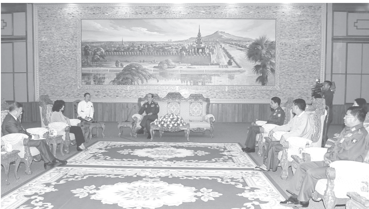
Prime Minister General Thein Sein receives UN Under Secretary General Dr Noeleen Heyzer and party at the Government Office in Nay Pyi Taw.