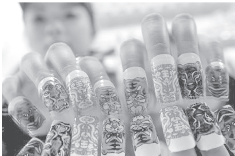
A boy poses beside an image of the Virgin of Guadalupe in San Salvador on 12 December 2009.