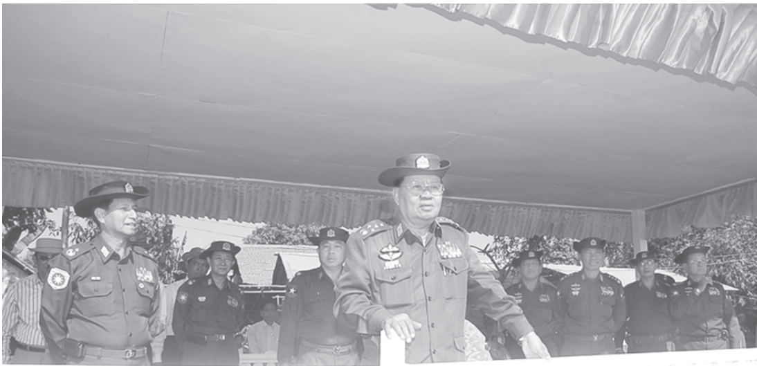
Chairman of the State Peace and Development Council Commander-in-Chief of Defence Services Senior General Than Shwe inspects alignment for Ayeyawady Bridge (Pakokku).

Senior General Than Shwe inspects Ayeyawady Bridge (Pakokku) Project