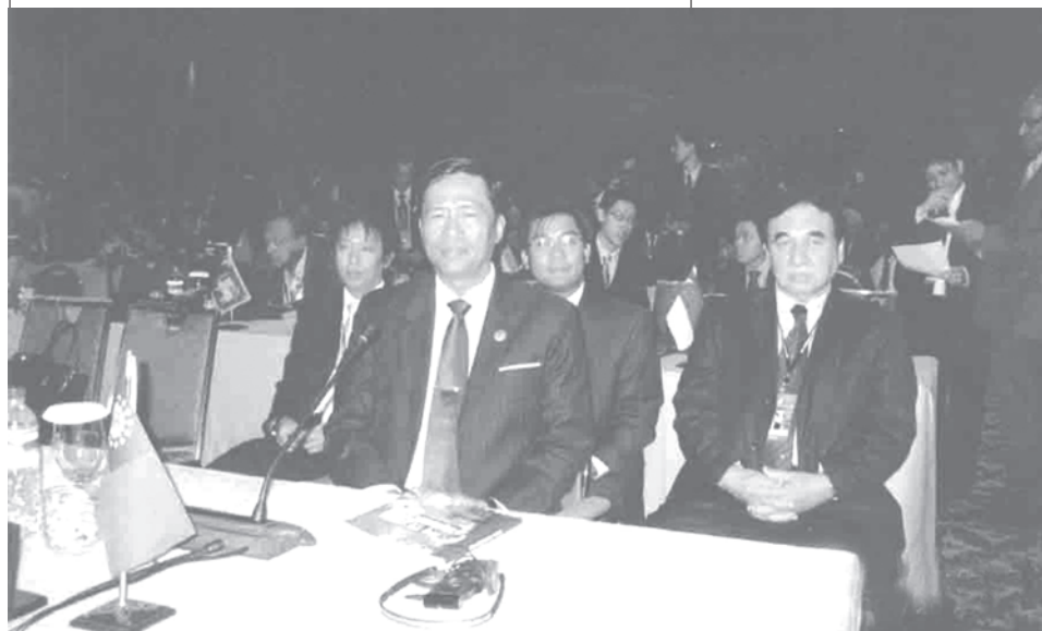
Deputy Minister U Maung Myint attending 2 nd Bali Democracy Forum.

President hosted a luncheon at Grand Hyatt Hotel.