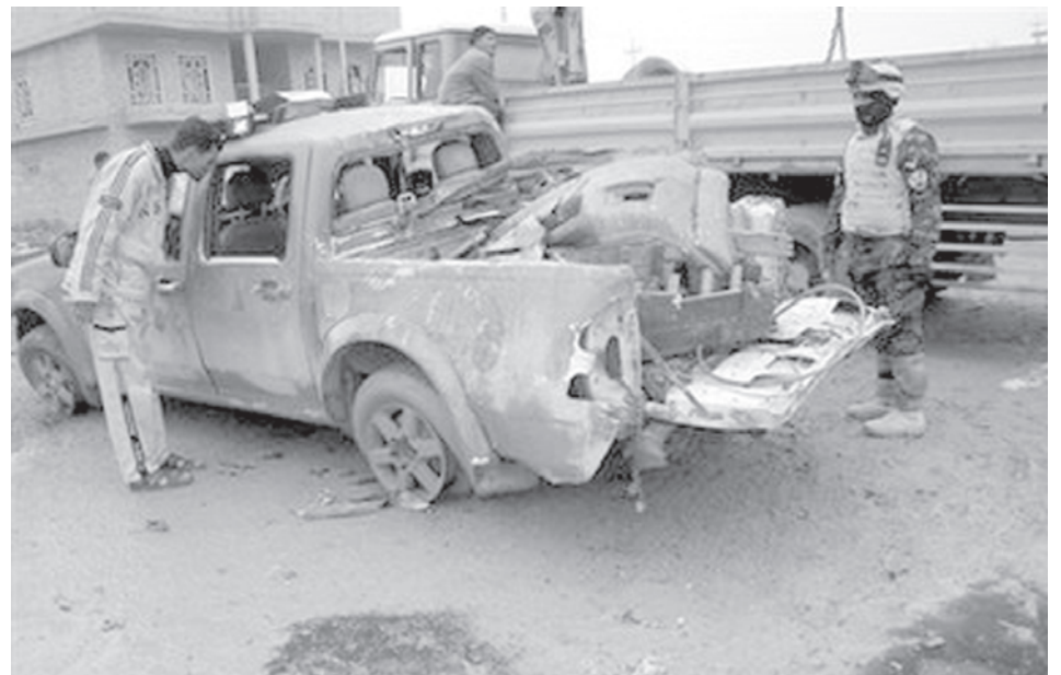
Iraqis inspect a destroyed police car after a car bomb attack in Fallujah, about 40 miles (65 kilometres) west of Baghdad, Iraq, on 13 Dec, 2009. A car packed with explosives blew up near a passing police patrol.