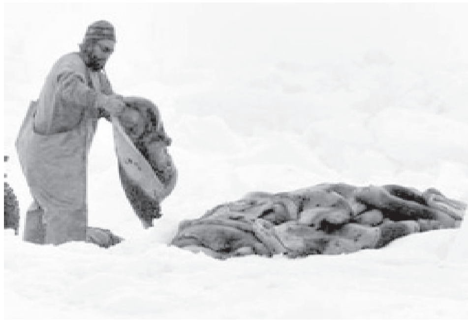
File photo shows a Woodside Petroleum gas production platform off the coast of Australia. The energy firm has said it would raise 2.5 billion dollars (2.3 billion US) by selling new shares to pay for a push into the growing liquefied natural gas sector.