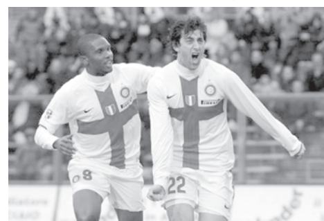
Inter Milan's Diego Milito (R) celebrates with his team mate Samuel Eto'o after scoring against Atalanta during their Italian Serie A soccer match at the Atleti Azzurri d'Italia stadium in Bergamo on 13 Dec, 2009.

ROME, 14 Dec—Italian Serie A leaders Inter Milan were held to a 1-1 draw at Atalanta, while their arch-rivals AC Milan fell into a humbled 2-0 defeat at home by Palermo on Sunday.