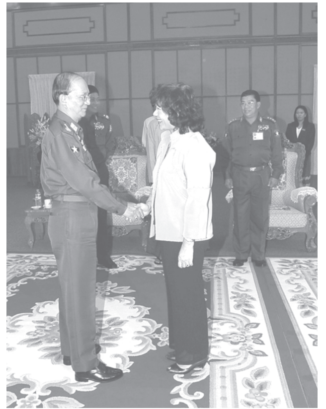
Prime Minister of the Union of Myanmar General Thein Sein shaking hands with UN Under Secretary General and UN Executive Secretary of UNESCAP Dr Noeleen Heyzer. (News on Page-16)