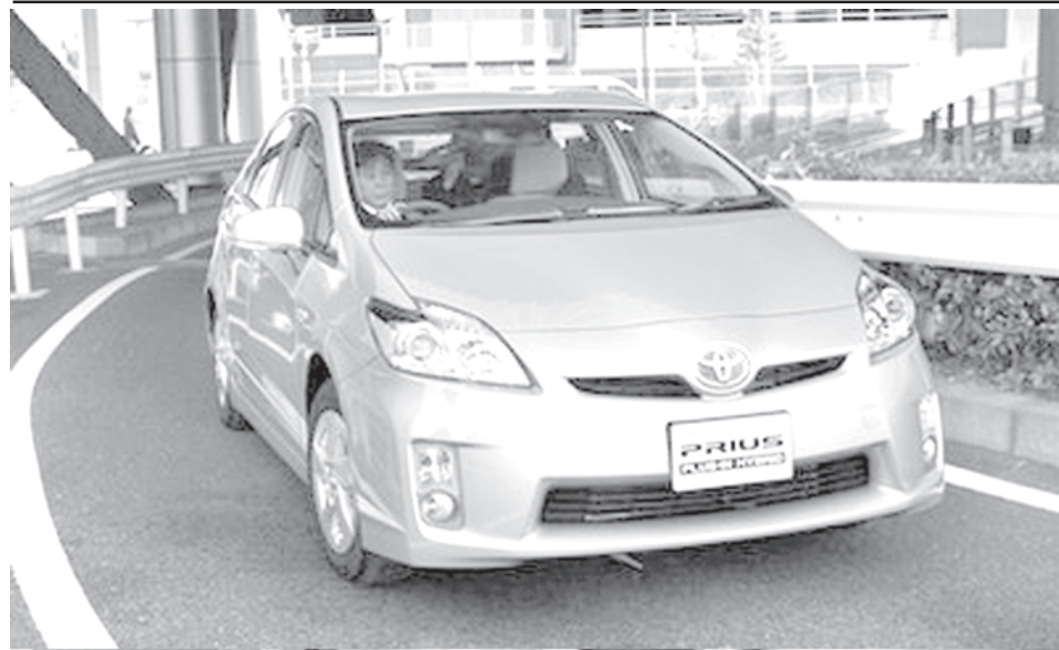
A man drives a Toyota Motor Corp's 'Prius Plug-in Hybrid' during a test drive event at a Toyota facility in Tokyo, Japan, on 14 Dec, 2009. Toyota showed its new plug-in hybrid, packed with a more powerful battery called lithium-ion that's different from the batteries used in Prius hybrids on roads today, available for leasing this month in Japan, the US and Europe, and promised the green vehicle for sale to regular consumers by 2011 at an 'affordable' price.