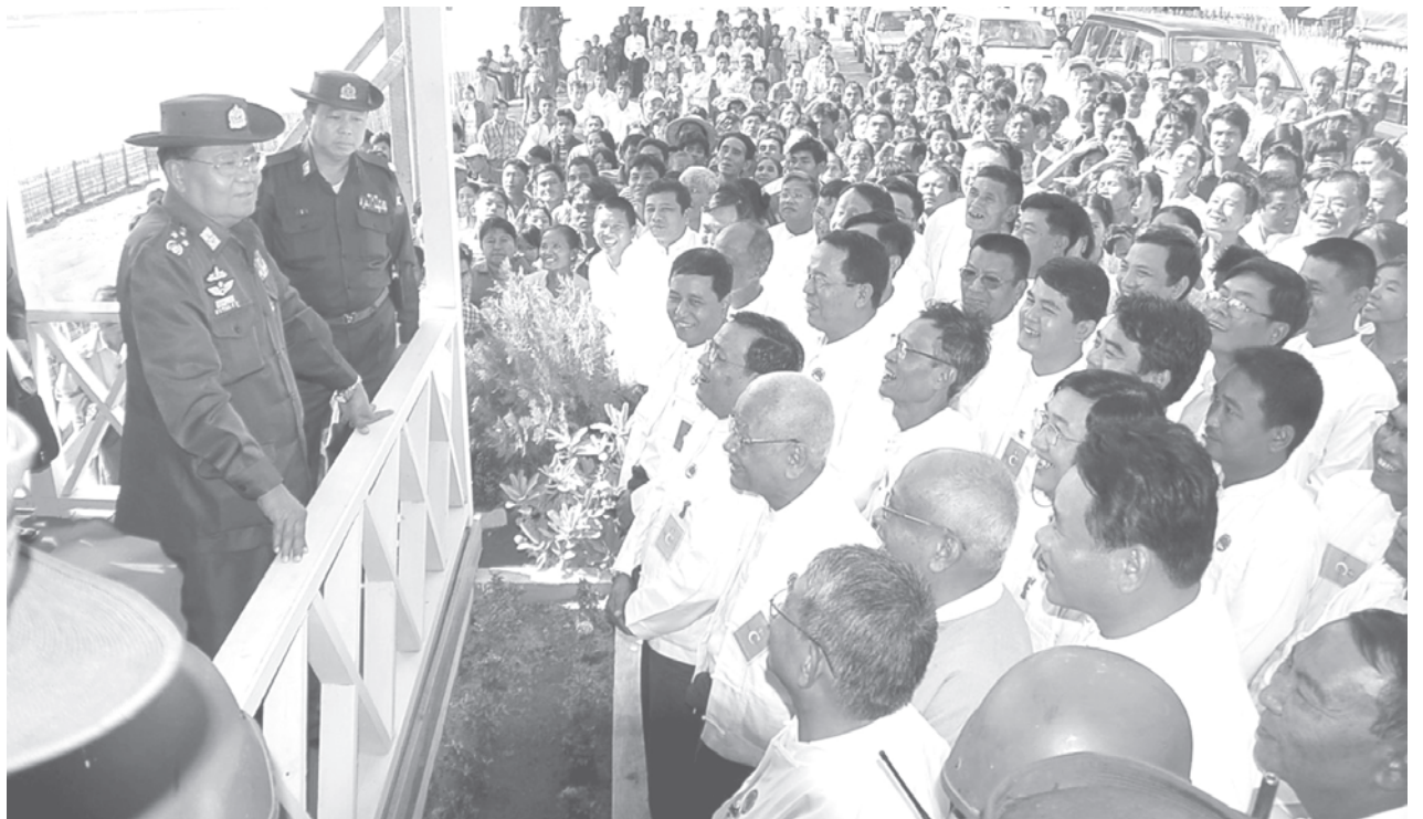
Senior General Than Shwe meets local people at the briefing hall of Ayeyawady Bridge (Pakokku) Project.

it will link Magway-Taungwingyi railroad section on the eastern bank and Kyangin-Pakokku railroad under construction on the