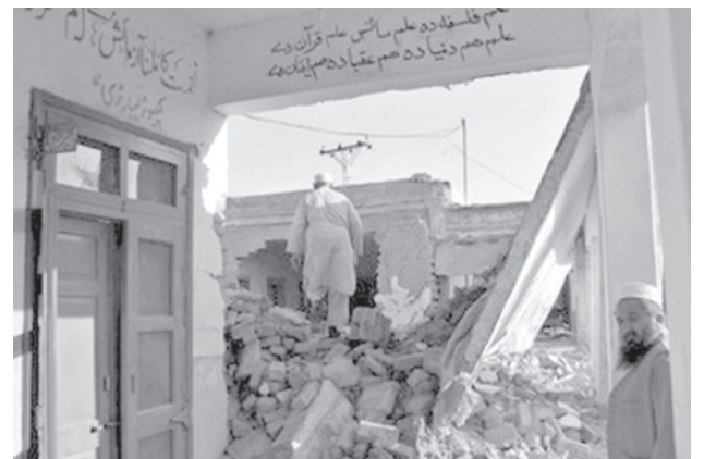
Pakistani men inspect the damage after suspected militants blew up a school building in Khyber region's Bara town in November.

“They are Taleban. They are the same people