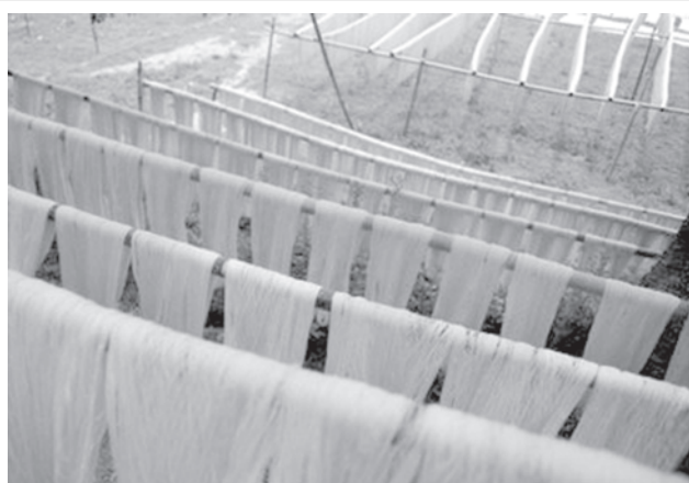
Lines of dyed cotton are hung out to dry in Narshingdi, 50kms north-east of the Bangladeshi capital Dhaka recently.