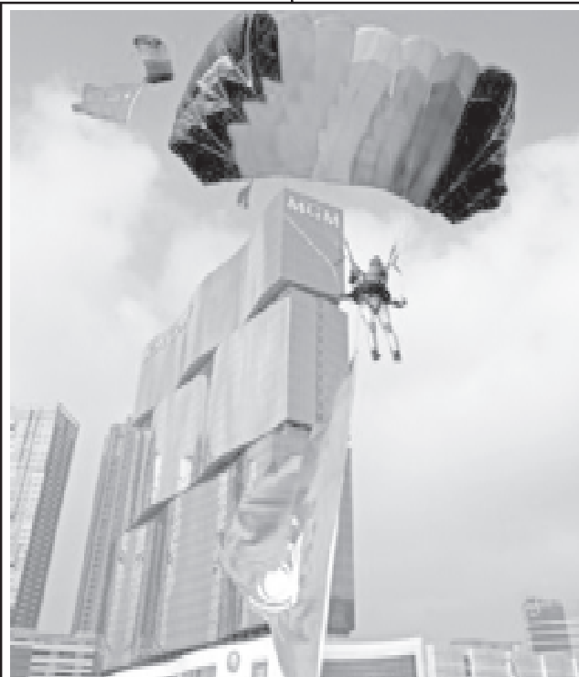
Members of the Bayi (1 Aug) Parachute Jumping Team of the Air Force of the Chinese People's Liberation Army (PLA) perform to celebrate the 10th anniversary of Macao's return to China, in Macao, south China, on 13 Dec, 2009.

The accident is under investigation, the report said.—MNA/Xinhua