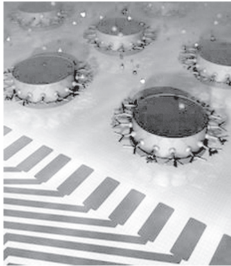
Illustration of a nanosensor chip for measuring biomarkers in whole blood. The picture depicts blood being filtered and transferred to the nanosensors.—INTERNET

PARIS, 14 Dec — Scientists have used nanosensors for the quick detection of cancers through blood tests, with nanomaterial also enabling the release of medicine at targeted organs, said studies released on Sunday.