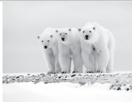
A female polar bear (R) and her two two-year cubs stand at Cape Blossom on the Isle of Vrangal in this 2002 archive picture. Russia's polar bears are adapting their behaviour to overcome the "catastrophic effects" of global warming, but new migration routes are pushing them dangerously close to humans, a leading researcher said.

They took off from Omarama, flew to Ward in Marlborough, back to Clyde, near Alexandra, and then back up and level with Taihape in the North Island, before turning around and landing at Omarama.