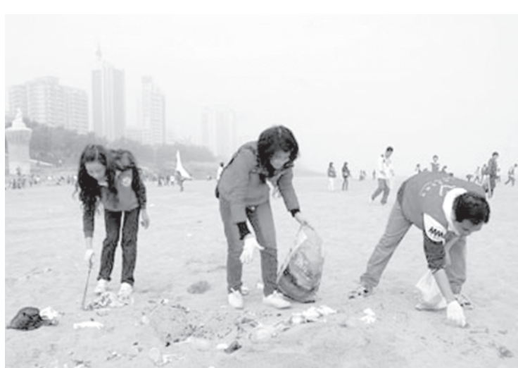
Some 200 local volunteers take part in a rubbish collection campaign along the Beiji River in Qingyuan, south China's Guangdong Province, on 13 Dec, 2009.

TAIYUAN, 14 Dec—China will launch a remote-sensing satellite, "Yaogan VIII" in the coming days from the Taiyuan Satellite Launch Centre in northern Shanxi Province, the centre said on Sunday. The satellite would be sent into the space aboard a Long March 4C carrier rocket, the centre said. Also on board is China's first public-welfare mini satellite, "Hope I," which will be used for the country's young people to experience aerospace science and technology.—Xinhua