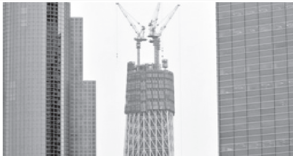
The giant new Tokyo Tower seen under construction in the Japanese capital on 9 December. Business confidence in the country has improved for a third straight quarter but firms plan to slash investment to cope with the fallout of the worst recession in decades, the central bank said on Monday.