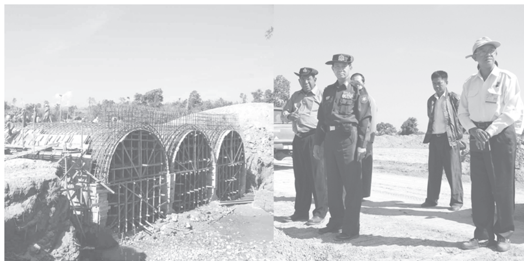
Minister Maj-Gen Aung Min inspects construction of Maehin Bridge near Maehin village on Katha-Moetagyi railroad section.

The dam can supply irrigation water to 700,000 acres in Zawgyi irrigation system of Kyaukse District and 445,605 acres for greening Meiktila Plain by controlling water from ongoing Kengkham Dam project and completed Zawgyi Dam.—MNA