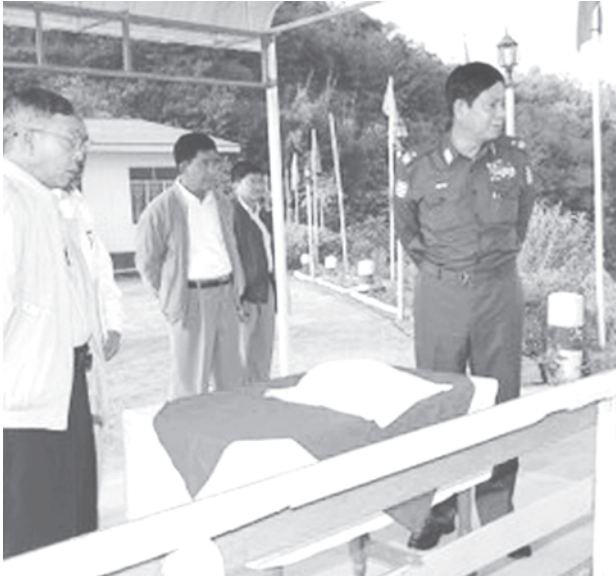
Minister for Agriculture and Irrigation Maj-Gen Htay Oo inspects Myogyi dam project.—MNA

NAY PYI TAW, 14 Dec—Minister for Agriculture and Irrigation Maj-Gen Htay Oo on 9 December visited Myogyi Dam being built on Zawgyi River near Myogyi village, Ywangan Township, Shan State (South), by Construction Group-7 of Irrigation Department.