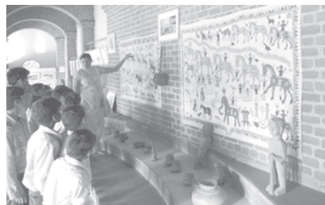
In this picture taken, Indian students from tribal communities are taught about tribal symbols at the Adivasi Academy in the village of Tejgadh, some 200kms from Ahmedabad. Classrooms at the Adivasi Academy in western India echo to the speech patterns of languages that may soon become no more than a meaningless jumble of noises.