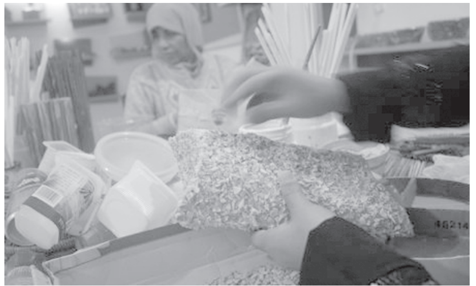
Palestinian women working with the Recycle and Rescue of House Wastes Project transform waste material into art pieces in Khan Yunes, southern Gaza Strip, on 13 Dec, 2009.