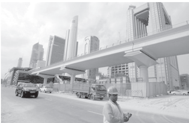
A construction site is seen here in Dubai in November. Gulf leaders meeting on 14 Dec will give the green light to a number of multi-billion-dollar economic projects, but it remains unclear whether they will also step in to ease the woes of debt-ridden Dubai.—INTERNET

The UAE central bank, based in the federation's capital Abu Dhabi, also says it is prepared to provide support to local banks.— Internet