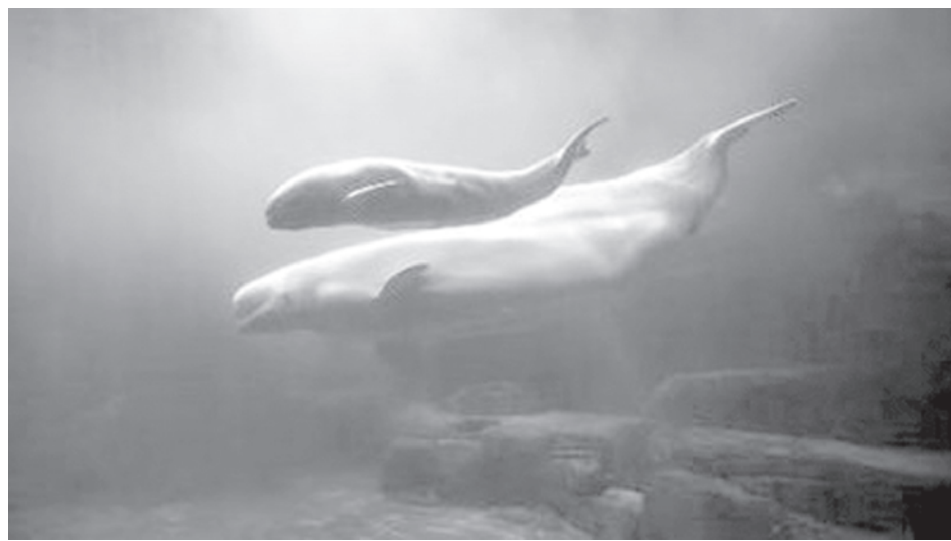
A 20-year-old Beluga whale, swims with her newborn calf after giving birth at the Vancouver Aquarium in Vancouver, British Columbia recently. Aurora was in labour for about three hours before delivering the calf.

Current cancer tests take several days but the new device is able to read out biomarker concentrations in a just a few minutes.