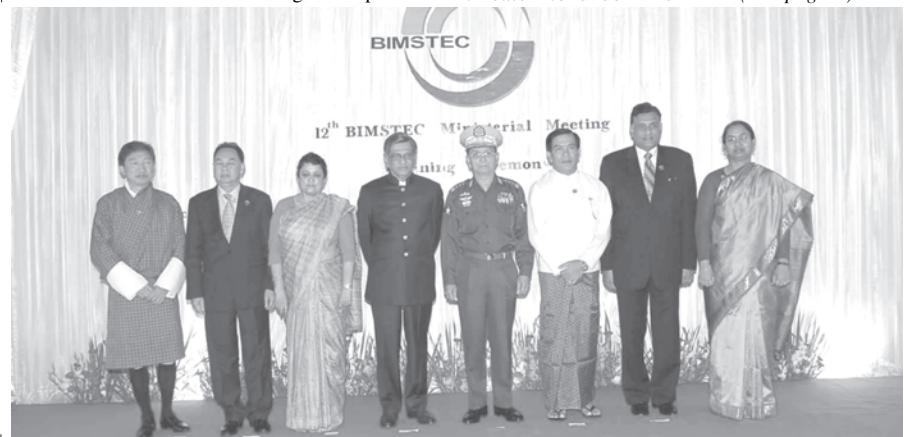
Prime Minister General Thein Sein poses for documentary photo together with foreign ministers of BIMSTEC member countries.

The emerging global issues of climate change, financial and economic crises, and food and energy crises threaten to undermine