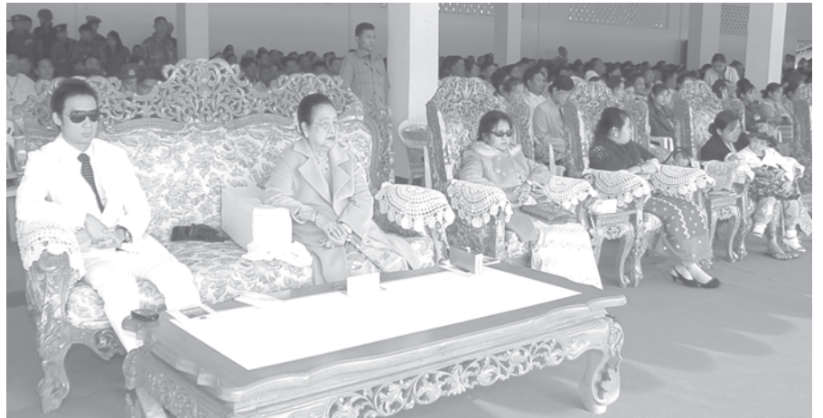
Distinguished guests at graduation ceremony of the 52 nd Intake of Defence Services Academy.—MNA

Our Tatmadaw was born out of historical neces-