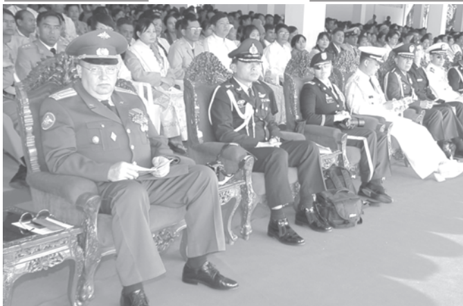
Distinguished guests at graduation ceremony of 52 nd Intake of Defence Services Academy.