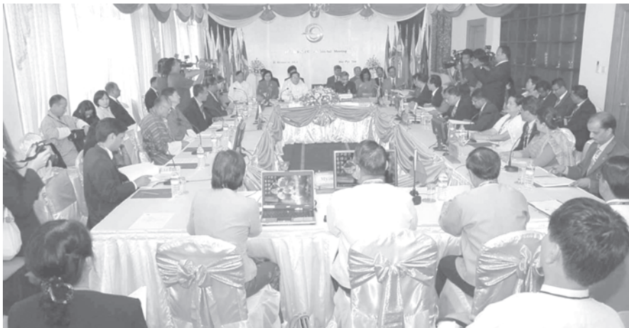
The 12 th BIMSTEC Ministerial Meeting in progress at Lake View Hall of Shwenandaw Hotel in Nay Pyi Taw Hotel Zone.

of Foreign Affairs of Bhutan H.E. Lyonpo Ugyen Tshering, Minister of External Affairs of the Republic of India H.E. Mr S.M Krishna, Deputy Prime Minister and Minister of Foreign Affairs of the Federal Democratic Republic of Nepal H.E. Ms Sujata Koirala, Minister of Foreign Affairs of the Democratic Socialist Republic of Sri Lanka H.E. Mr Rohitha Bogollagama and Minister of Foreign Affairs of Thailand H.E. Mr Kasit Piromya also made speeches.