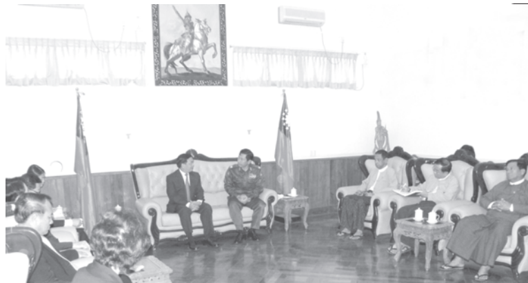
Deputy Minister Brig-Gen Than Htay receives Deputy Minister of Commerce of Thailand Mr Alongkorn Ponlaboot and party.