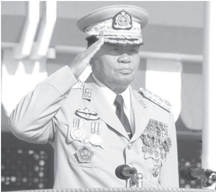
Commander-in-Chief of Defence Services Senior General Than Shwe taking salute of cadet battalions.