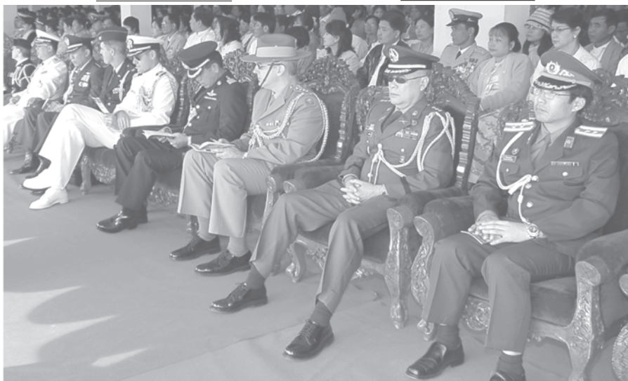
Dignitaries at the graduation ceremony of 52 nd Intake of Defence Services Academy.