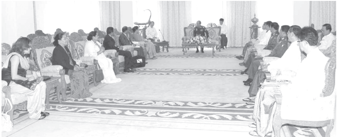
Prime Minister General Thein Sein receives Deputy Prime Minister and Foreign Minister of Federal Democratic Republic of Nepal H.E Ms Sujata Koirala.—MNA

Also present at the call were Minister for Foreign Affairs U Nyan Win, Minister for National Planning and Economic Development U Soe Tha, Deputy Minis-