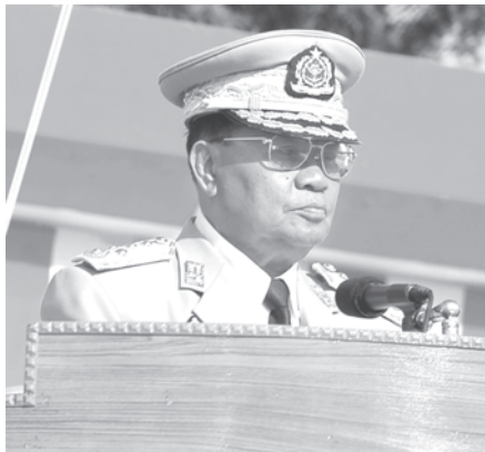
Senior General Than Shwe delivers an address at the graduation ceremony of 52 nd Intake of Defence Services Academy.

Today is the Graduation Ceremony of the 52nd Intake of the Defence Services Academy. It is a day of important milestone in your lives since you have successfully accomplished your study of academic and military knowledge at the Defence Services Academy. Likewise, it is also a day of reinforcement