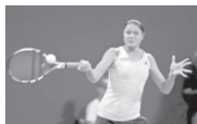
Russia's world number two Dinara Safina.

"I know she would have been working around the clock to try to be ready for the event, but in the end time has beat her and she is still undergoing treatment."