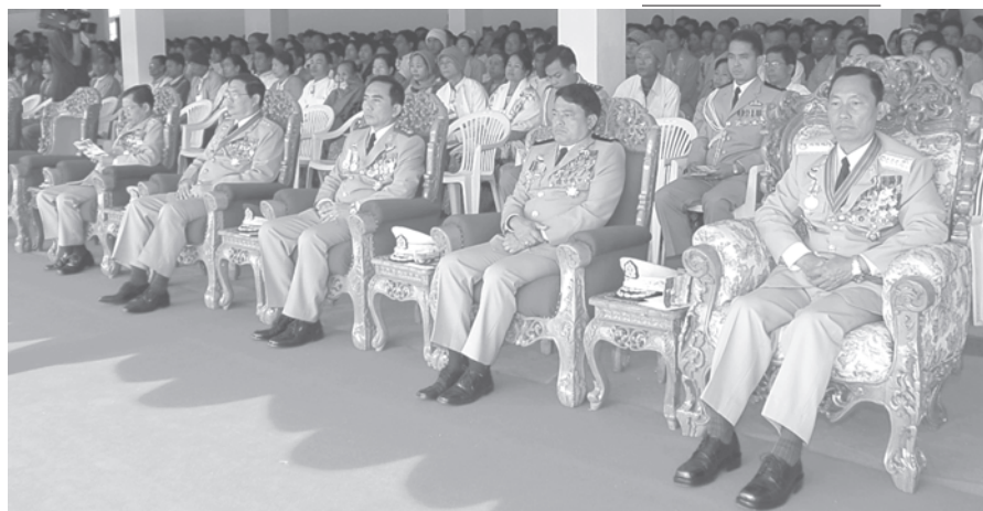
Dignitaries at the graduation ceremony of 52 nd Intake of Defence Services Academy.