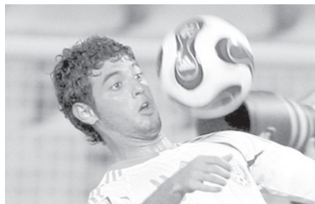
Mexico's Carlos Vela

LONDON, 11 Dec — Mexico striker Carlos Vela has signed a new contract with Arsenal, the English Premier League club said on Thursday. The 20-year-old Vela, who joined Arsenal two years ago, is now set to stay with the north London club until 2015. Vela, who arrived at Arsenal from Spanish side Celta Vigo before returning to Spain for an 18-month loan spell, has so far scored seven goals in 38 first-team appearances for the Gunners.