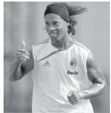
AC Milan's Ronaldinho.