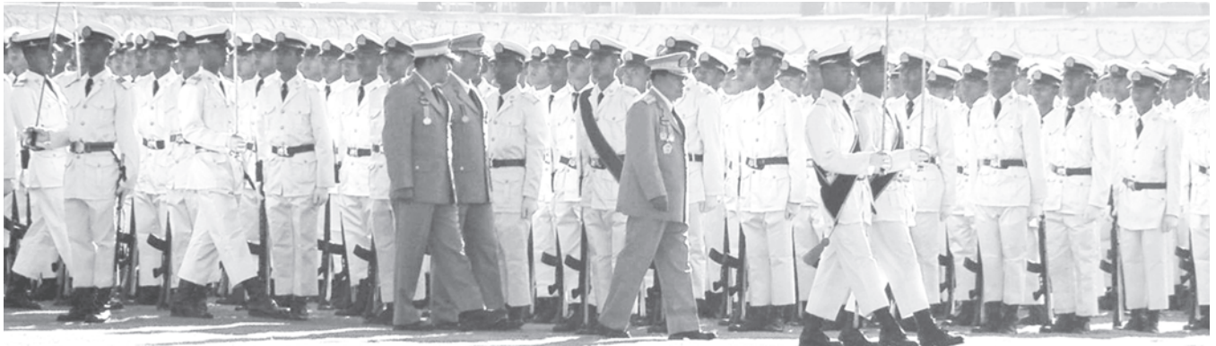
Commander-in-Chief of Defence Services Senior General Than Shwe inspects cadet battalions.