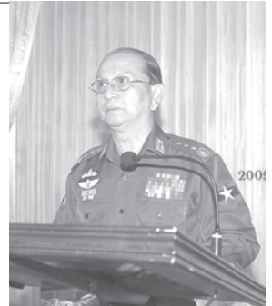
Prime Minister General Thein Sein delivers an address at 12 th BIMSTEC Ministerial Meeting.

socio-economic progress so far gained, including the achievements to date of the Millennium Development Goals. These challenges that we must address and overcome are disparate and varied. No country can tackle these challenges alone. All must work together to overcome them. To this end, multilateralism today is more important than ever.