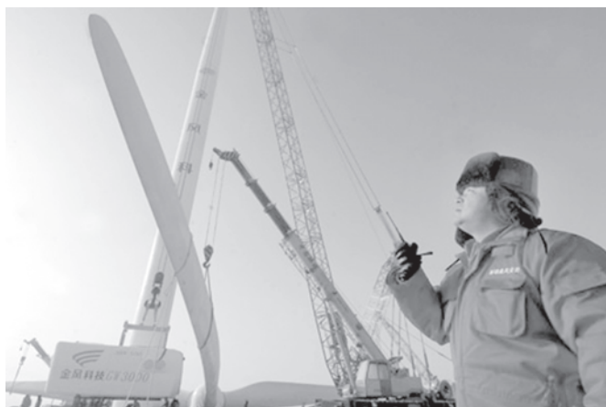
A worker instructs the installation of a huge wind turbine in Dabancheng of northwest China’s Xinjiang Uygur Autonomous Region 10 Dec, 2009.