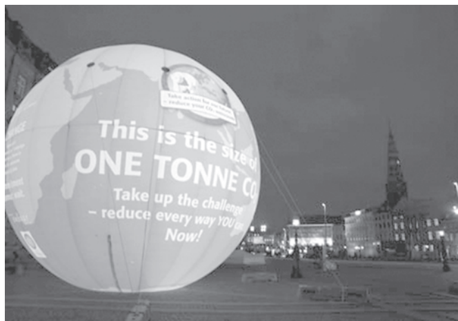
A balloon with "This is the size of one tonne CO 2 " written on it is seen in Copenhagen, capital of Denmark, on 9 Dec, 2009, on the occasion of the United Nations Climate Change Conference.