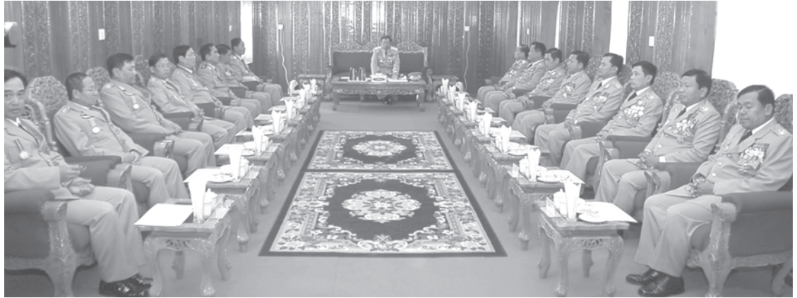
Commander-in-Chief of Defence Services Senior General Than Shwe meets with four outstanding cadets and their parents at the hall of Defence Services Academy (Headquarters).