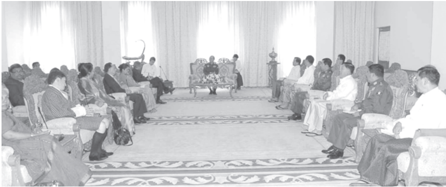
Prime Minister General Thein Sein receives foreign ministers, high-ranking officials and ambassadors to the Union of Myanmar of BIMSTEC countries at Nay Pyi Taw City Hall.—MNA