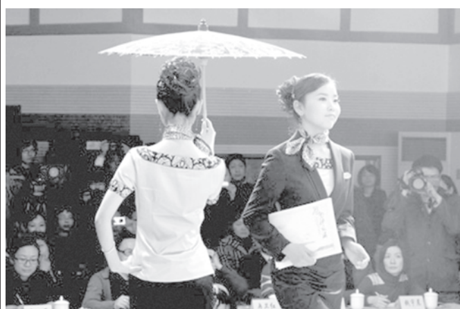
A pair of female contestants from a scenic zone show off their service business apparels on T stage, during the 2009 Suzhou First Tourist Scenic Zone & Hotel Vocational Apparels Presentation Contest, in Suzhou, east China’s Jiangsu Province, 10 Dec.2009.