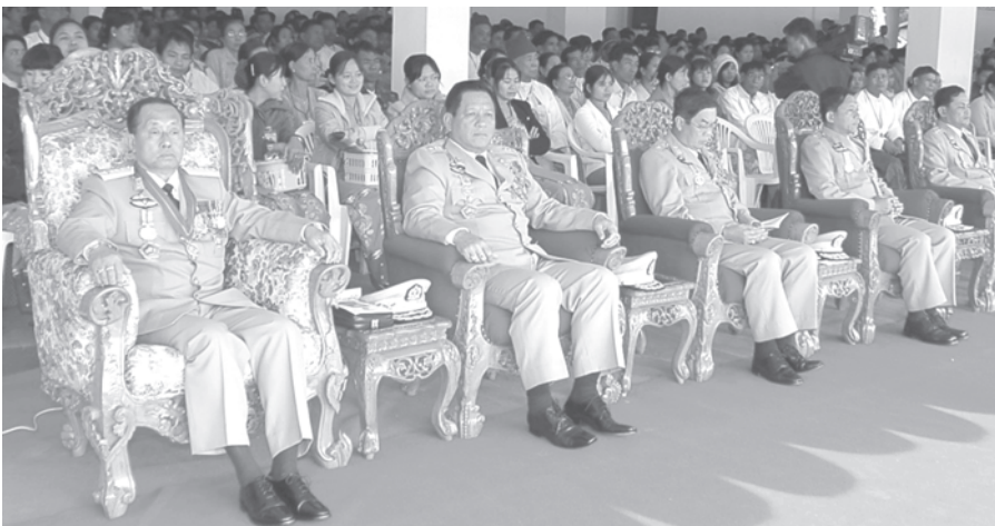
Dignitaries at graduation ceremony of the 52 nd Intake of Defence Services Academy.