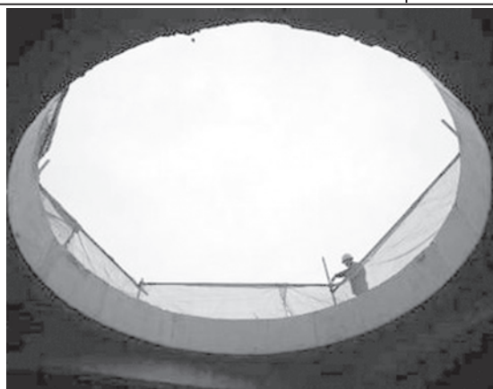
A labourer installs steel frames at a construction site in Suining, Sichuan province 11 December, 2009.