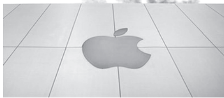
FILE - In this on 19 Oct. 2009 file photo, the Apple logo is seen on an Apple store in San Francisco. Apple Inc. is suing cell phone maker Nokia Corp. for patent infringement, a countermove to Nokia's earlier suit against technologies used in Apple's iPhone.