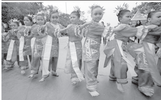
Indonesian students perform a traditional Jakarta dance during a ceremony in Jakarta, Indonesia, on 10 Dec., 2009.

Preserve caretakers sought to have Gijima tested for the potentially deadly virus after the large cat began showing symptoms on 15 Nov . The animal appeared lethargic and had little interest in food, caretakers said. Officials at the wildlife site said it remains unclear how Gijima, who has since recovered from the virus, contracted H1N1.—Internet