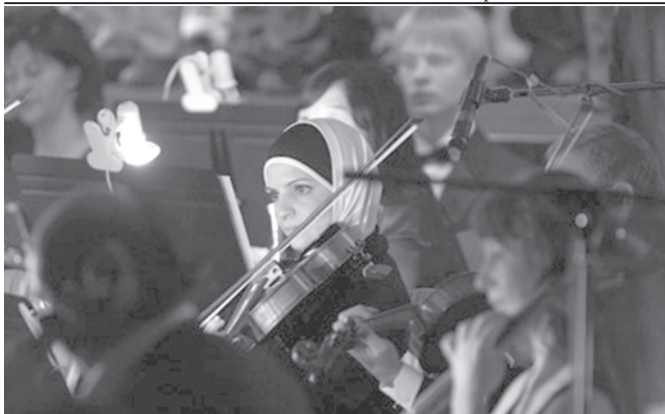
The Amman Symphony Orchestra perform "The Nutcracker, A Christmas Tale" at the Hyatt Amman Hotel on 19 Dec, 2009. The show will run for two days.