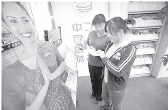
Two girls check the prices for overseas tours at the China International Travel Service Co Ltd in Beijing on Tuesday. Tours are selling well as the New Year approaches, tourism agencies said. —XINHUA