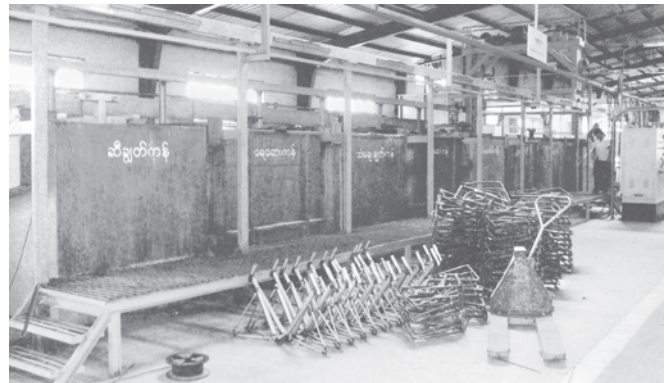
A production line in Bicycle Factory (Kyaukse).

factory can produce all kinds of bicycle parts with domestic materials including frame, fork, mud-guard, chain guard, rim, carrier, spoke of nipple, saddle, brake assembly, steering assembly, bell, handle bar, hub assembly, free wheel, stand, and chain.