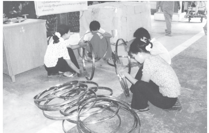
Workers checking rims for quality control.

The majority of the workforce of the factory are women. They were found skilled in assem-