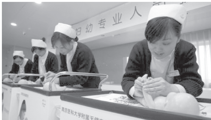
Contestants compete during a Maternal & Child Care Centre in Wuxi, east China’s Jiangsu Province, on 8 Dec, 2009. Baby touch, which can help baby develop and communicate with mother, is now becoming popular.