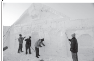
Local snow artists work on snow-carving at a snow park in Mudanjiang, northeast China's Heilongjiang Province.