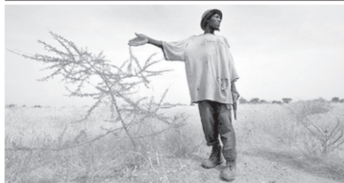
A peasant in Burkina Faso stands near the grass he planted to help stop the advance of the Sahara desert in November 2009.