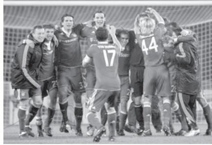
Bayern Munich's players celebrate their win at the end of their Champions League soccer match against Juventus at the Olympic stadium in Turin on 8 Dec, 2009. Bayern Munich won 4-1.