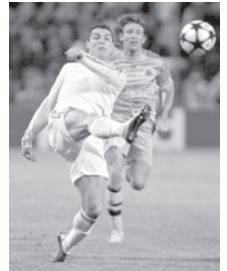
Real Madrid's Cristiano Ronaldo (L) kicks the ball as Olympique Marseille's Gabriel Heinze (R) looks on during their Champions League soccer match at the Velodrome stadium in Marseille on 8 Dec, 2009.

Meanwhile midfielder Rafael Van der Vaart was in the side, playing in a midfield position behind Gonzalo Higuain and Ronaldo. Former Real Madrid defender Gabriel Heinze started the game in the heart of the Olympique defence.—Xinhua