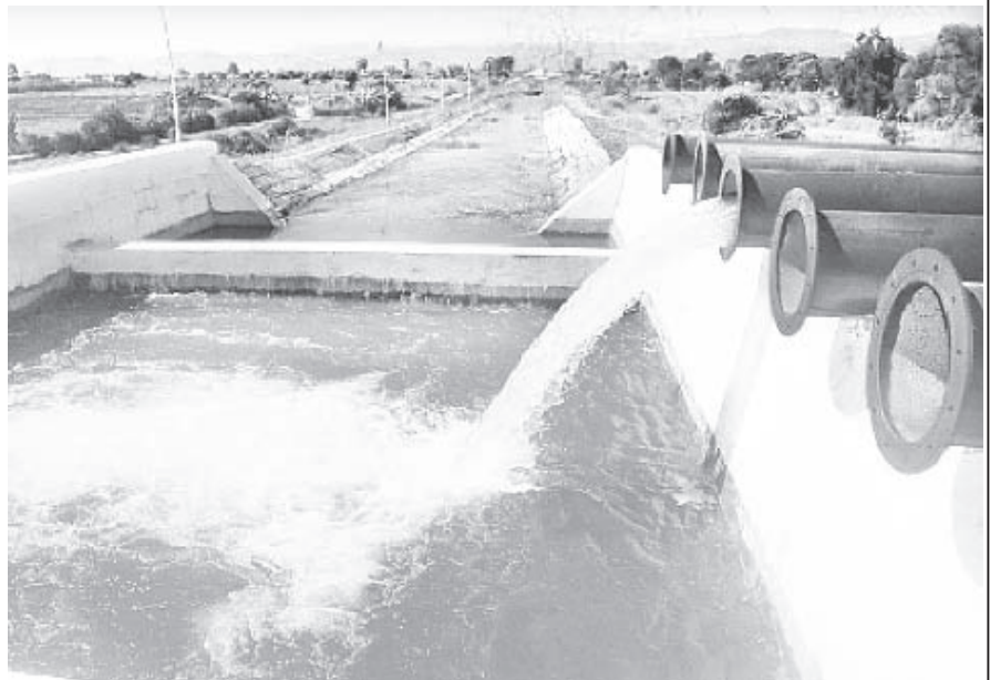
Dahseik river water pumping project in Dahseik Village, Langkho Township of Shan State (South) supplying water for agriculture.

Land reclamation was carried out not only on plain regions but also on hilly regions. So, Langkho and the (See page 7)