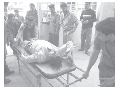
A wounded teacher is rushed to the hospital after a bomb exploded outside a Baghdad elementary school in the Shiite enclave of Sadr City, Baghdad, Iraq, on 7 Dec, 2009.