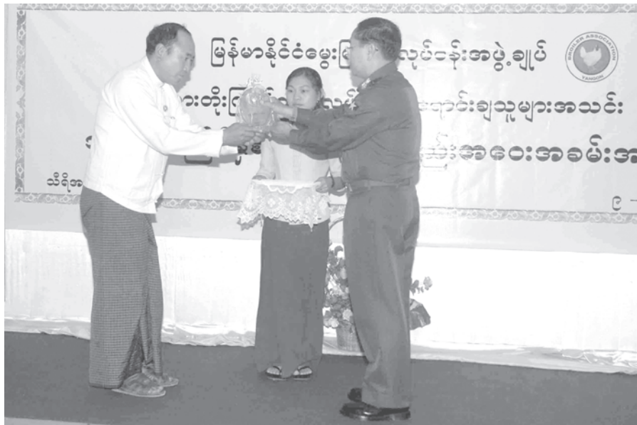
Lt-Gen Myint Swe of Ministry of Defence awards a prize winner at 2nd annual general meeting of Myanmar Broilers Entrepreneurs Association. (News on Page-1)