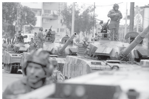
soldiers wait on their tanks before a military parade in Lima, on 8 Dec, 2009.