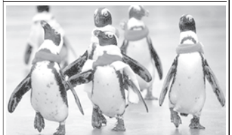
Jackass Penguins, wearing colourful ribbons, take a walk at the Hakkeijima Sea Paradise aquarium-amusement park complex in Yokohama, southwest of Tokyo, Japan.