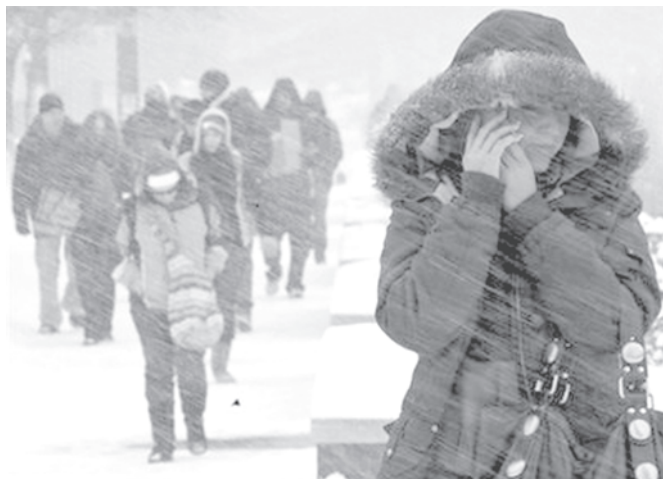
Students brave the snow on the campus of the University of Nebraska-Omaha, in Omaha, Neb, on 8 Dec, 2009, as a winter storm travels through the region.—XINHUA

The storm also produced high winds and a possible tornado near Lake Pontchartrain, the National Weather Service said.—Xinhua