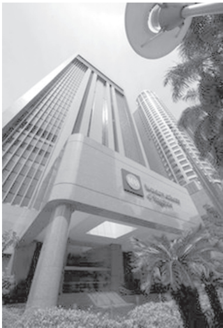
A view of the Monetary Authority of Singapore headquarters in the city state. Private-sector economists in the tiny south east Asian nation have tipped an average 5.5 percent economic growth for 2010, beating official forecasts of 3-5 percent, the central bank has said.