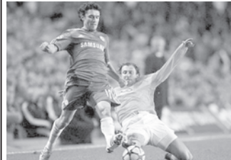
Chelsea's Yuri Zhirkov (left) is challenged by APOEL Nicosia's Kamil Kosowski during their Champions League Group D match at Stamford Bridge in London. Chelsea were made to pay for more costly mistakes as APOEL Nicosia increased the gloom around Stamford Bridge with a 2-2 draw.

LONDON, 9 Dec—Carlo Ancelotti faces a nervous wait to discover how long he will be without Michael Essien after the Ghana midfielder limped off with a hamstring injury during Chelsea's 2-2 draw against APOEL Nicosia.