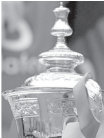
A view of the FA Cup trophy. US-based satellite broadcaster ESPN has signed a four-year deal worth some 35 million pounds (57 million dollars) to televise the FA Cup, England's governing Football Association (FA) announced Tuesday.

Both ITV and ESPN will have the right to show the