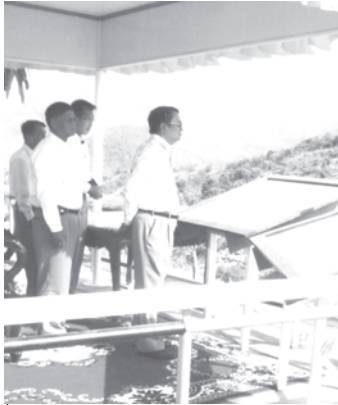
Minister U Aung Thaung inspecting progress in construction of buildings.—MNA

NAY PYI TAW, 9 Dec—Minister for Industry-1 U Aung Thaung arrived at the Glass Factory project of Myanma Ceramics Industries in Kyaukse yesterday.