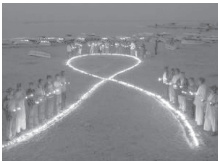
Ribbon on the beach : Indian villagers hold oil lamps as they surround a huge AIDS symbol on the beach at Nalsarovar, some 60 kms from Ahmedabad, on the eve of World Aids Day.