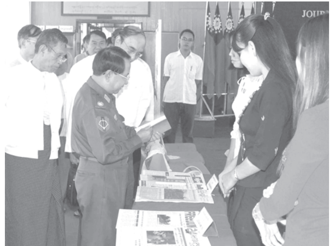
Minister Brig-Gen Kyaw Hsan views journals and documentary photos published by trainees.

Indeed, the people who play the most important role in a nation should be taken into consideration as the fifth pillar, he noted. He continued to say that the media are responsible for conducting check and balance of three pillars and for helping the way of thinking and ideology of the people right and correct. A review of the history in the past centuries showed that the nations stuck to ideology. In the 21st century, they gave priority to national interest, instead of clinging on to ideology. The interest of a nation is the first priority of that nation. In the history, however, some countries have become lessons for others as they are badly affected by their own extremism as they placed