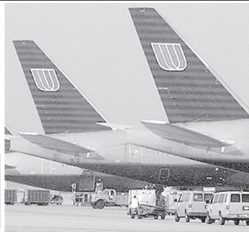
United Airlines aircraft sit at the terminal at O'Hare International Airport in Chicago. United Airlines on Tuesday announced firm orders for 25 Airbus 350 aircrafts and 25 Boeing 787s, modernizing its fleet to make it more fuel efficient and environmentally friendly.

Analysts said United was able to use the economic downturn and fierce competition between the two manufacturers to get a bargain on the aircraft. At list prices, this first order for United since 1998 represents roughly 10 billion dollars: about six billion for Airbus and four billion for Boeing.—Internet