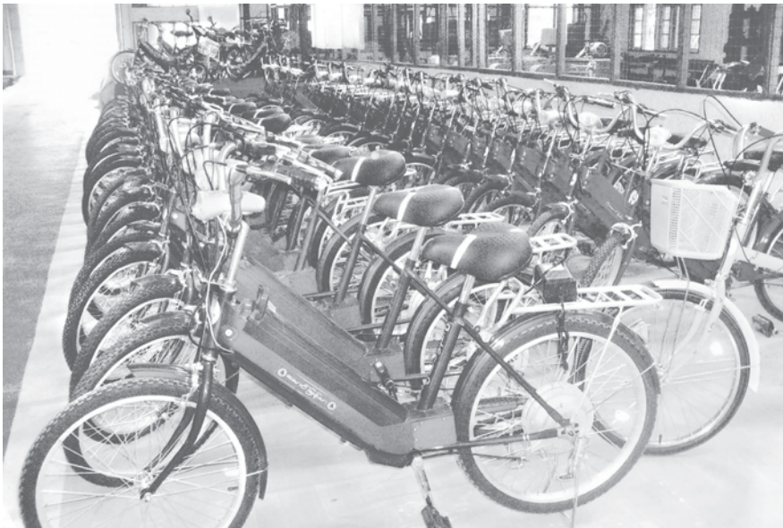
Electric bicycles in Bicycle Factory (Kyaukse).

"In order to produce 15 more kinds of bicycle parts, we dealt with Laxmi International on 19 March (See page 10)