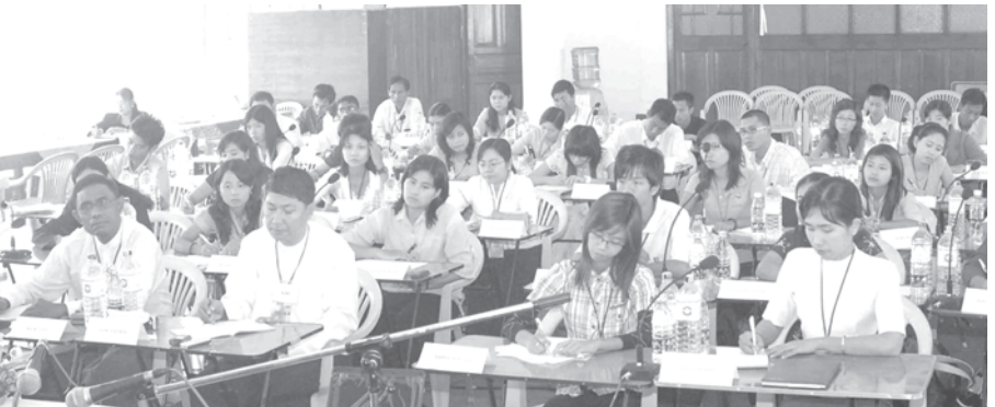
Minister Brig-Gen Kyaw Hsan meets the trainees of Journalism Course (3/2009).—MNA

of the State in the future as a Myanmar saying goes: 'Today's youth are the future's force'. The force or strength is essential for development of a nation or a race, he said. He added that nowadays, there are over 200 countries with different sizes of areas and populations across the world. Every country has to build the forces namely economic force, organizational force and defence force to be able to stand as a sovereign and