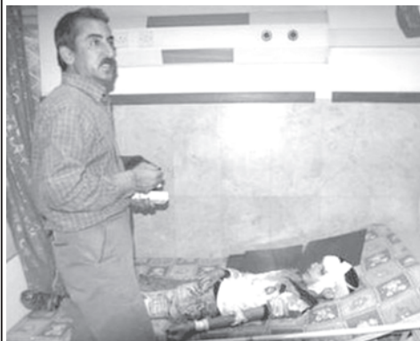
A man stands next to his son, who was wounded in a bomb attack, in a hospital in Baghdad, on 7 December, 2009. Seven children were killed and 42 others were wounded in a Shi'ite district of Baghdad on Monday when a bomb exploded in their schoolyard, police said.—INTERNET

An Afghan girl grimaces while placing a bucket of water on her head at a water pump in Kabul in November.