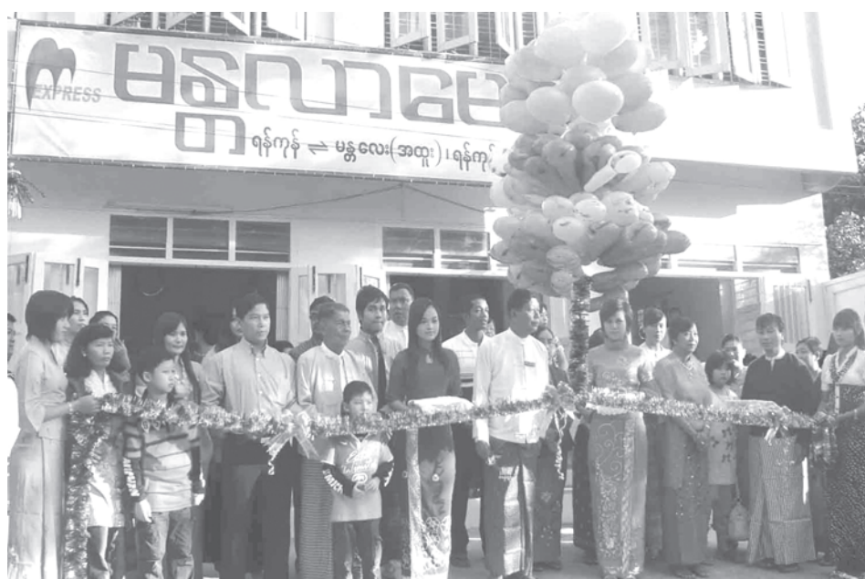
The launch of new Yangon-Meiktila (Special) Bus Line Service of Mandalay May Express Passenger Transport Service in progress.

YANGON, 6 Dec—Under the supervision of Meiktila District Peace and Development Council, a ceremony to launch new Yangon-Meiktila (Special) Bus Line Service of Mandalay May Express was held at Mandalay May Express Highway Bus Terminal near Shwewontha Pagoda on 1 st Lanmadaw Street in Meiktila on 29