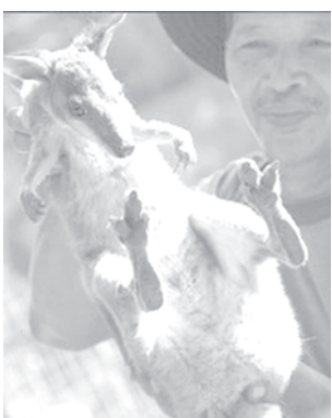
The kangaroos were being transported by sea.—INTERNET

SURABAYA, 6 Dec—An Indonesian man has been arrested on suspicion of smuggling 10 rare kangaroos from their native habitat of New Guinea Island.