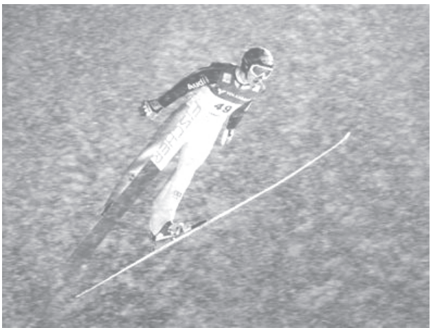
Pascal Bodmer of Germany competes during the ski jumping World Cup at Lillehammer on 5 December 2009.