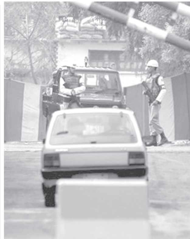
Pakistan's army troops stand guard at the site of Friday's suicide attack, covered with tent, on 5 Dec, 2009 in Rawalpindi, Pakistan.