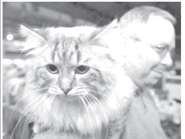
A Siberian cat sits on the arm of its owner during the 8th International Cats Exhibition in Moscow on 5 Dec, 2009.

One of the ferries reportedly broke in half and sank after the collision while the other overturned, near the northern city of Rashid. It was unclear how many passengers were on the two vessels.