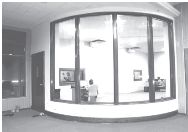
A studio of Pyinsawadi FM Radio.