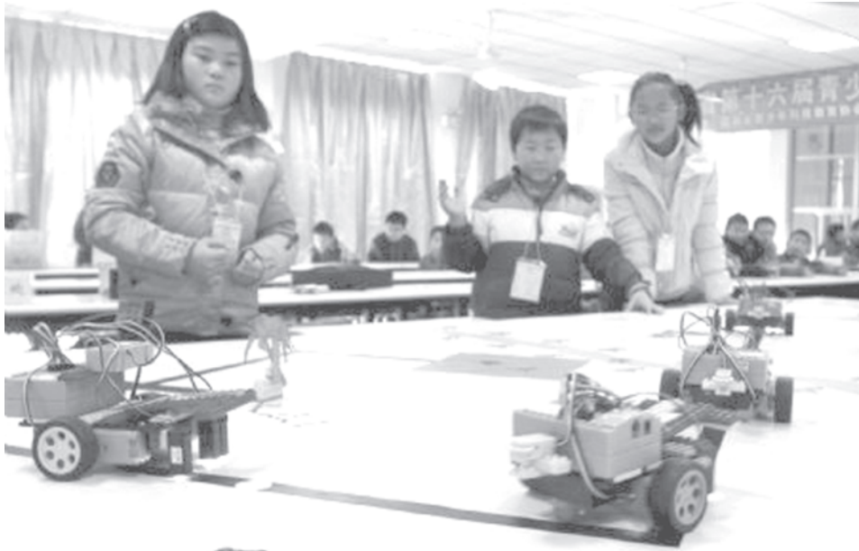
Students compete during the 16th Teenagers' Technology Models Contest in Wuxi, east China's Jiangsu Province, on 5 Dec, 2009. More than 300 students from over 40 schools' robot teams all over the province took part in the contest.