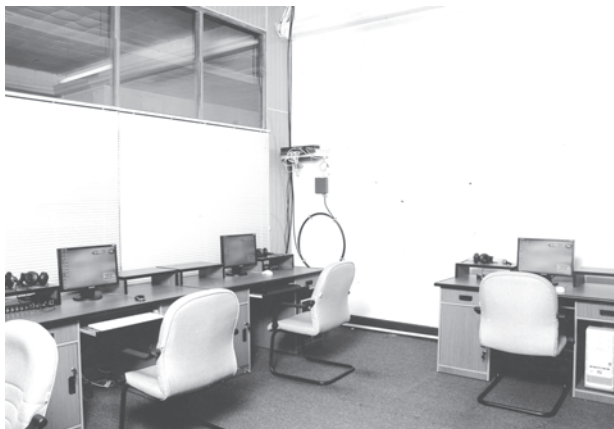
The editing room of Pyinsawadi FM Radio.