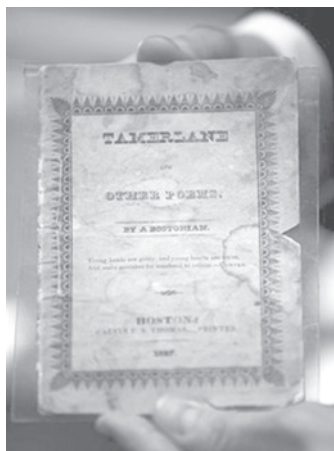
An employee of Christie's holds an original copy of American writer Edgar Allan Poe's Tamerlane and Other Poems, which will be auctioned on Friday for an expected $500,000 to $700,000, in New York.