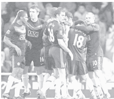
Manchester United's midfielder Paul Scholes (2nd R) celebrates scoring the opening goal with teammates during their English Premier League football match against West Ham United at the Boleyn Ground, Upton Park in East London.