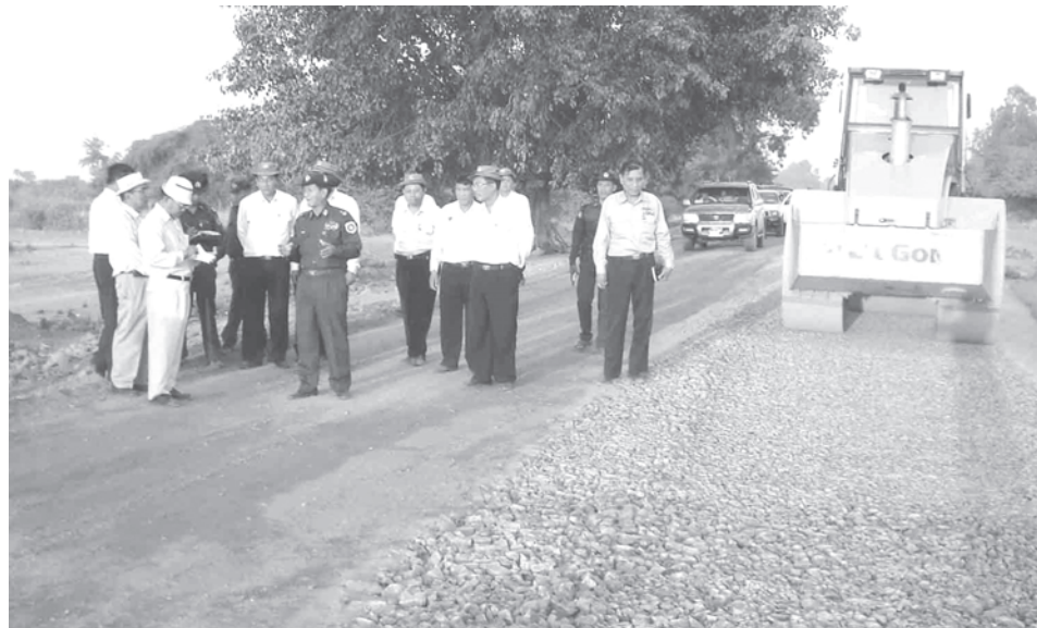
Minister Maj-Gen Khin Maung Myint inspects NyaungU-Myingyan road section.—CONSTRUCTION

NAY PYI TAW, 6 Dec—Minister for Construction Maj-Gen Khin Maung Myint inspected the construction of Ayeyawady Bridge (Pakokku) undertaken by special projects implementation group (3) on the bank of Letpan Chepaw village in NyaungU Township, yesterday afternoon.