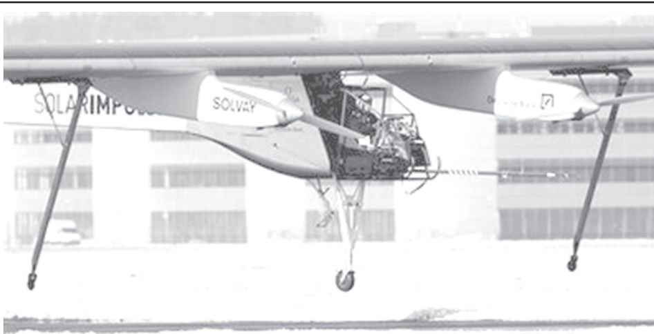
The prototype of a solar powered plane flies one meter above the field of the Airport in Duebendorf, Switzerland, on 3 Dec, 2009. Swiss adventure Bertrand Piccard plans to fly around the world to highlight the potential of alternative energy sources. The prototype, HB-SIA, has the wingspan of a jumbo jet but weighs only as much as an average family car.

The Brazilian Pavilion will be adjacent to those of the United States, Peru and Colombia. To take advantage of the proximity, the commissioners of the four countries have decided to share a cultural programme in open space, as well as a business agenda.