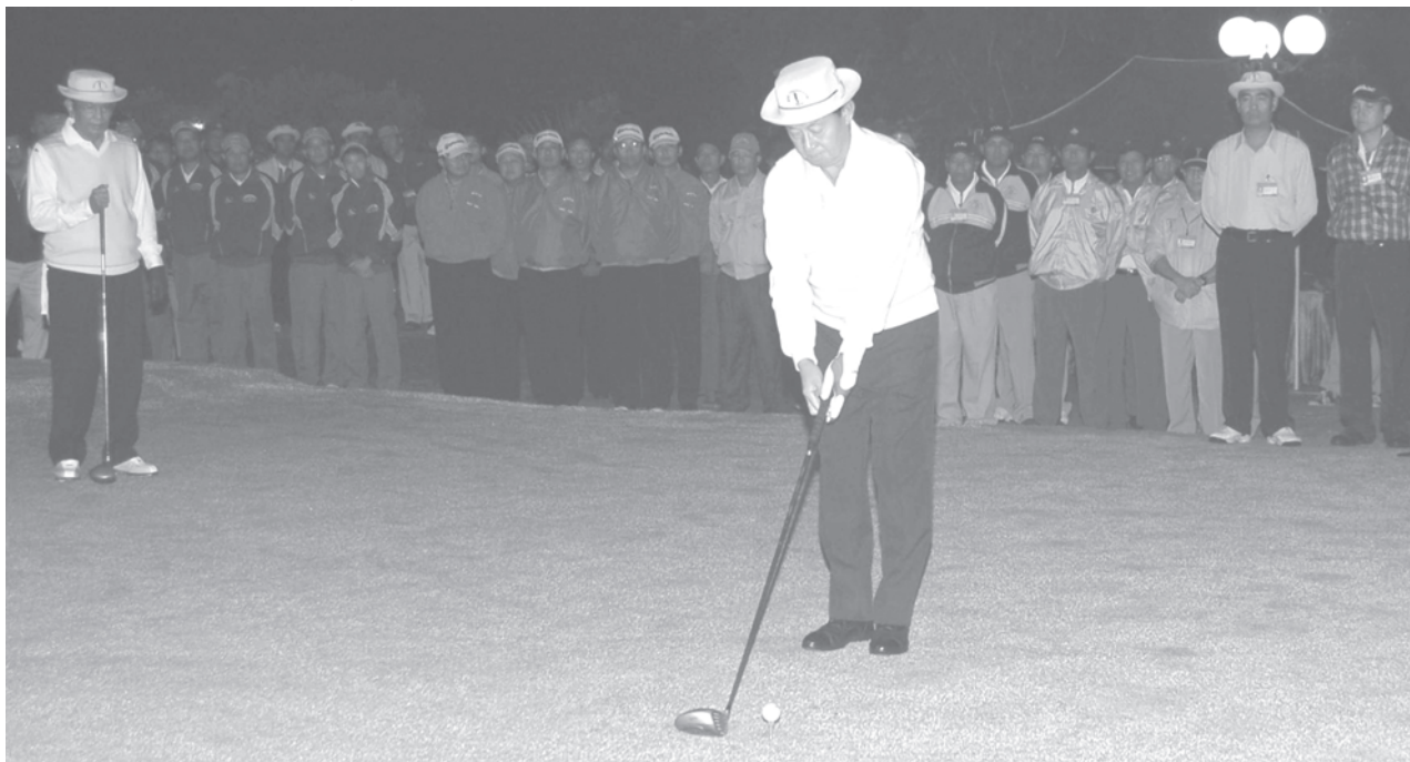
Secretary-1 General Thiha Thura Tin Aung Myint Oo tees off tracer ball to open SPDC Chairman's Trophy Golf Tournament (2009).

The best loser prize went to Ministry of Labour in team handicap event whereas best loser prize for team scratch event went to Ministry of Culture.