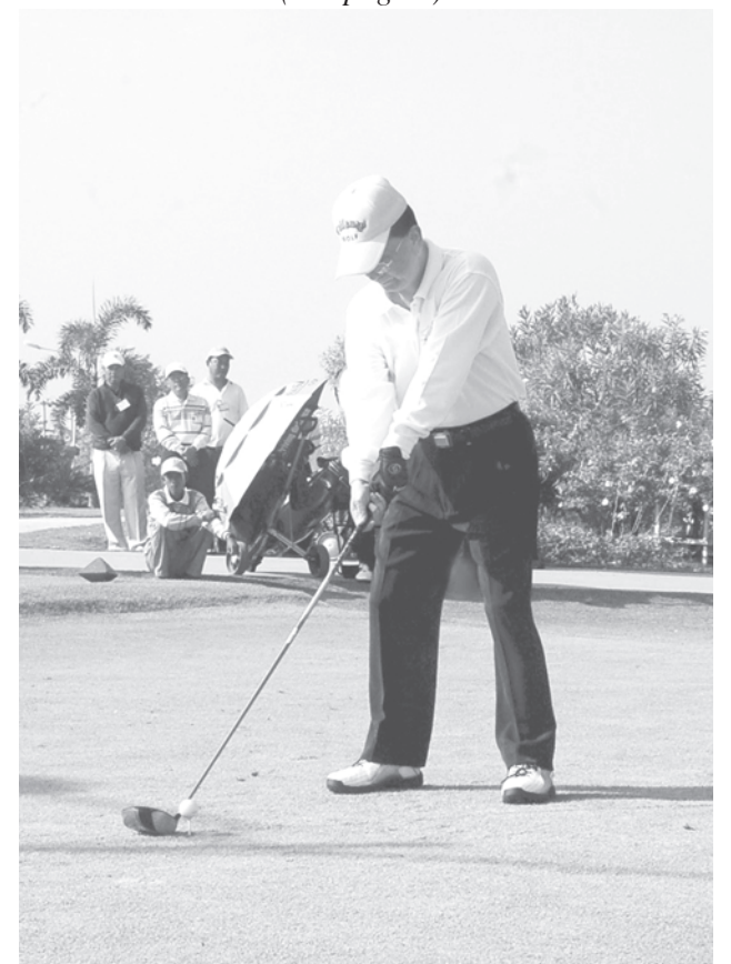
Prime Minister General Thein Sein taking part in SPDC Chairman's Trophy Golf Tournament.