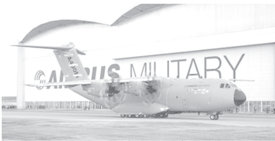
The Airbus Military A400M at Airbus Military's Seville, Spain plant. The Airbus A400M military plane is scheduled to take to the skies on its first test flight late next week after a long delay that has caused headaches for European defence group EADS and the loss of a client.