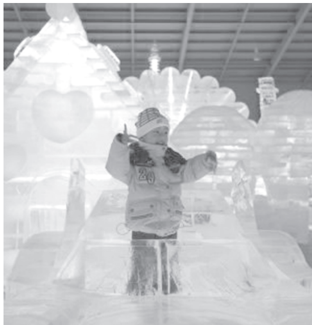
A kid smiles on an ice sculpture during a Chinese ice sculpture exhibition in Hwachon-gun, the Republic of Korea (ROK), on 5 Dec, 2009. Some 17 ice sculptures made by Chinese artists are displayed during the exhibition, which kicked off on Saturday.