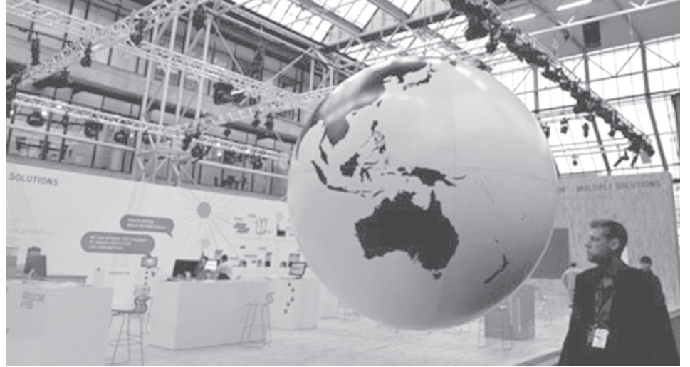
A man walks past a earth ball prior to the 15th United Nations Climate Change Conference (COP15) at Bella Center in Copenhagen, capital of Demark on 6 Dec, 2009. The conference will be held from 7 to 18 Dec.