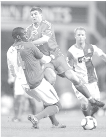
Liverpool's midfielder Steven Gerrard (C) collides with Blackburn Rovers defender Christopher Samba (L) during their English Premier League football match at Ewood Park in Blackburn.

BLACKBURN, 6 Dec—Rafael Benitez dropped a strong hint he will give midfielder Alberto Aquilani his long-awaited first start in a Liverpool shirt next week after a frustrating goalless draw away to Blackburn. The Italian international, a 20 million pounds (22.1 million euros) pre-season signing from Roma has endured a frustrating start to his Anfield career after being troubled by injury.— Internet