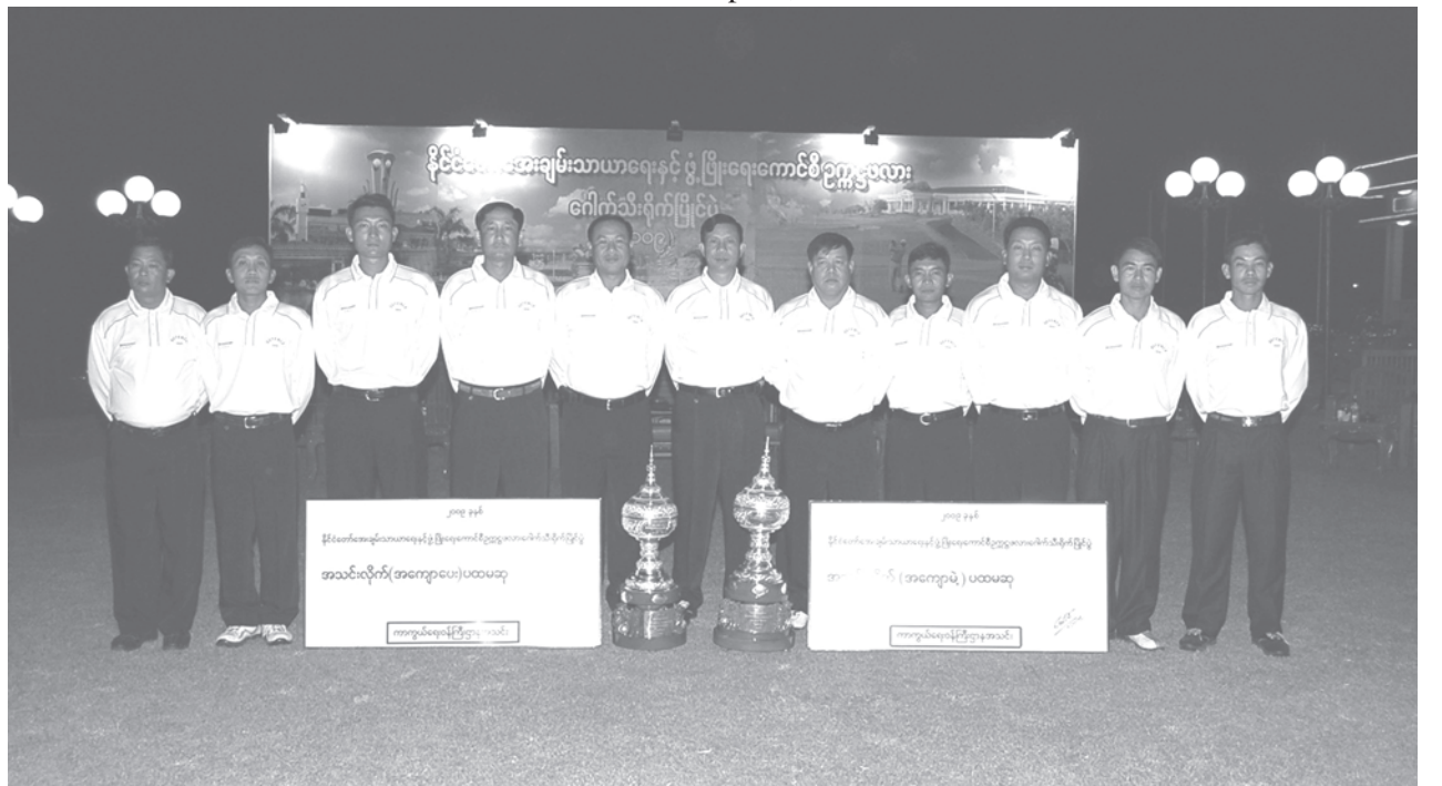
The trophy winners of Defence Ministry team in team handicap event and team scratch event seen with SPDC Chairman's Trophies.