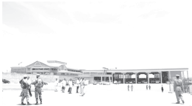
Picture taken on 5 Dec, 2009 shows a view of the Chirundu Post at the border between Zambia and Zimbabwe.

"Chirundu's strategic location as a node of trade between southern and eastern Africa and its role as gateway between two busy regions has made the port an ideal choice as a pilot site for the one-stop border control programme," the President said.—Xinhua