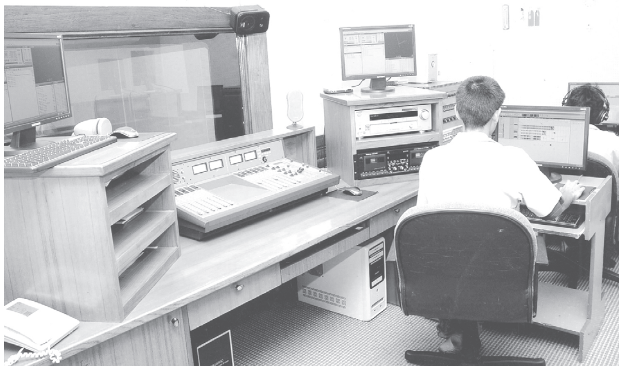
Staff members broadcasting programmes to Rakhine State and Ayeyawady Division.