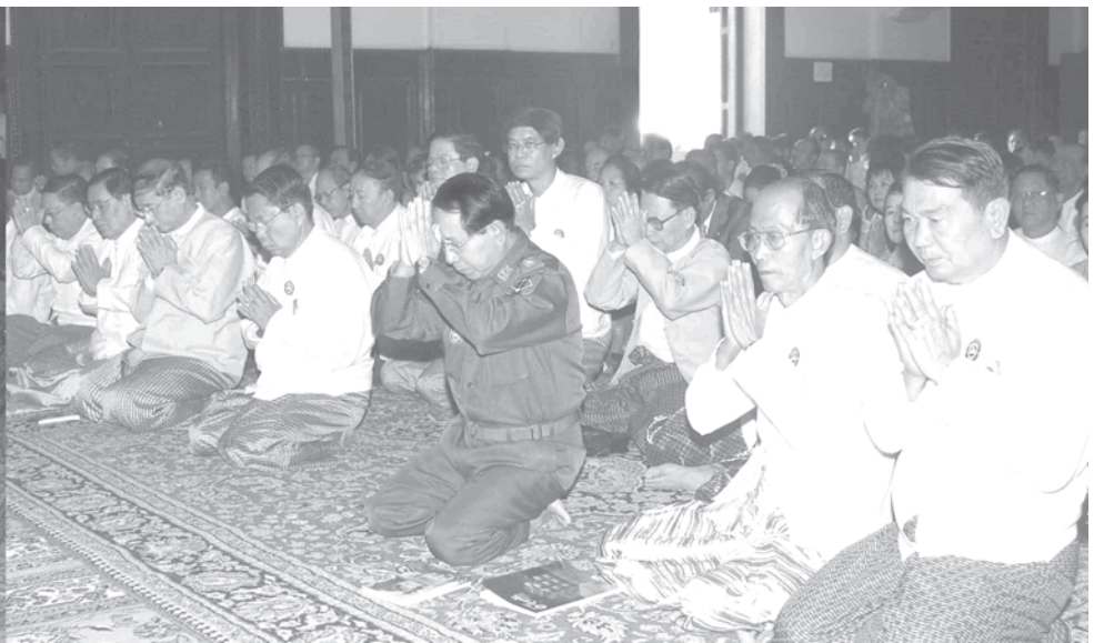
Minister Brig-Gen Kyaw Hsan and party and guests pay respects to doyen literati.