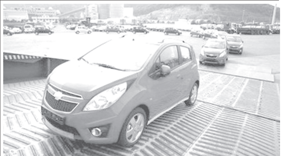
GM Daewoo manufactured "Matiz Creative" vehicles are exported from Incheon port, South Korea. The auto-maker has decided to recall 30,751 units of the mini-car because of defects in their airbags and windshield wipers, government officials have said.

A woman wearing traditional healer's attire walks through Faraday market in Johannesburg. Traditional medicine is big business in South Africa where health-care is split between pricey, top-notch urban private care and run-down, overstretched state services that cater for most of the 48 million population.