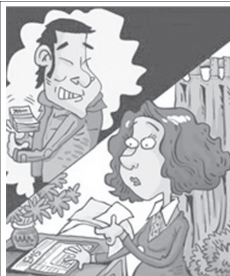
A woman in Wuhan, capital of Hubei province, was dumbfounded when she received a special express mail containing her driving licence and an IOU her business partner wrote her earlier this week.