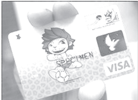
The first round of ticket sales opened in February 2009.—INTERNET

LONDON, 6 Dec — A global rush for tickets to the 2010 FIFA World Cup finals has begun, a day after the group-phase draw was made in host country South Africa. More than a million new tickets are up for sale, now the 32 teams