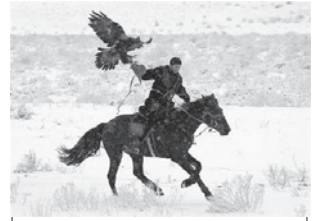
A participant rides with his eagle during an annual hunting competition in Chengelsy Gorge, some 150 km east of Almaty, 5 December, 2009.

ton last month, said he hoped the Russia trip would focus on defence, civil nuclear energy and science issues.