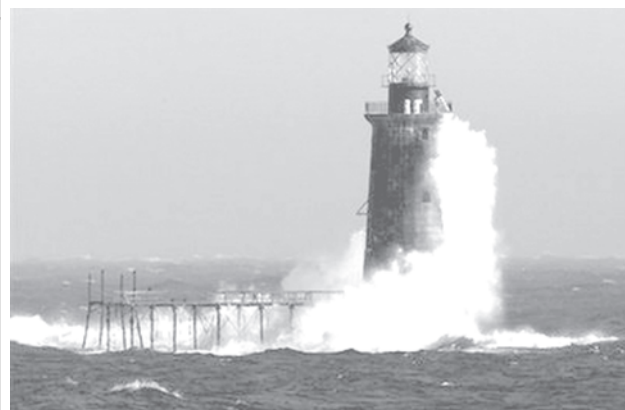
Heavy surf slams into the 72-foot-tall Ram Island Ledge Light, on 3 Dec, 2009, at the mouth of Portland Harbour, in Portland, Maine. A quick moving storm with winds approaching 50 miles per hour brought record breaking warmth to Portland where the temperature reached 68 degrees.