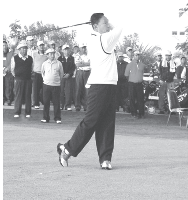
General Thura Shwe Mann of Ministry of Defence taking part in SPDC Chairman's Trophy Golf Tournament.

The awarding ceremony was held at City Golf Course at 6 pm today, which was attended by the Secretary-1, senior military officers, the commander of Nay Pyi Taw Command, ministers, deputy ministers, heads of department, members of the committee for organizing the tournament, and the participants.