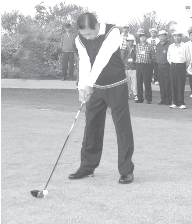
Vice-Senior General Maung Aye taking part in SPDC Chairman's Trophy Golf Tournament.

NAY PYI TAW, 6 Dec—The State Peace and Development Council Chairman's Trophy Golf Tournament (2009) took place with 36 teams from central offices and ministries at City Golf Course and Yepyar Golf Course here on 5 and 6 December.