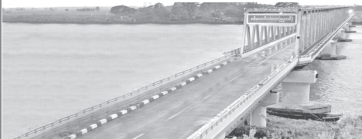
Photo shows Sittoung Bridge (Moppalin) in Mon State on Yangon-Mawlamyine Road.

Translation: ZZS (Myanma Alin: 4-12-2009)