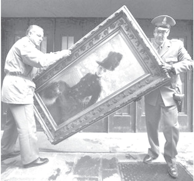
Italian tax police officers hold a Giuseppe De Nittis painting, one of the 19 masterpieces which was seized in Parma, Italy, on 5 Dec, 2009. Italian tax police have seized a secret attic and basement stash of Van Gogh, Picasso, Monet, Cezanne and other art works from the disgraced founder of Parmalat, the dairy company that collapsed a few years ago under billions of dollars of debt. Authorities estimated the total value of the works at more than euros 100 million.