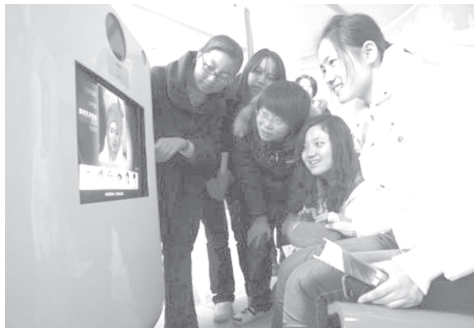
A visitor experiences the visual effect of changing her own hairstyle in a large Science Popularity Tour Show on the theme of Cracking the Hair Secret in Suzhou City, east China’s Jiangsu Province, on 5 Dec, 2009.