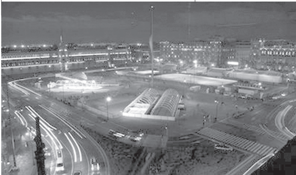
Mexico City's Zocalo plaza's buildings are lit in red as part of World AIDS Day celebrations in Mexico City, on 1 Dec, 2009.

In order to tackle the situation, the government has extended unemployment benefits and social incentives to many families. Prime Minister Silvio Berlusconi in recent weeks has repeatedly expressed optimism on the economy's state. "This is much better than the European average," said Italian Economic Development Minister Claudio Scajola commenting Istat's report. Internet