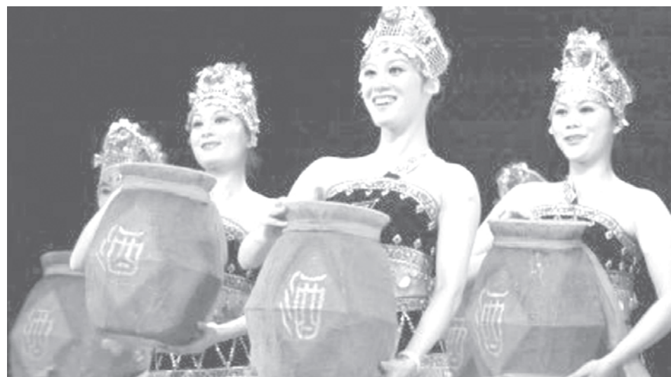
Dancers perform in the Song and Dance Pageant on Affection with the Homeland of Yao Ethnic Group, in the Grand Theatre of Hezhou City, southwest China's Guangxi Zhuang Autonomous Region, on 1 Dec, 2009.

Eyewitnesses said the suicide bomber was a teenager wearing blue jacket.—Xinhua