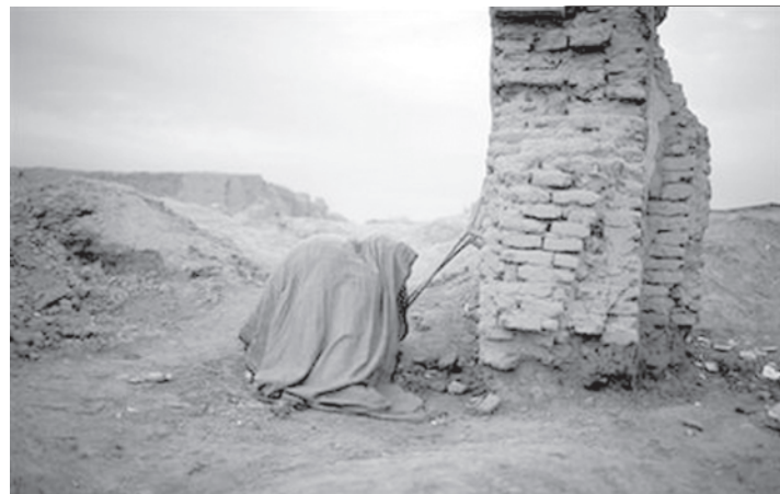
A man smokes opium in the outskirts of Kabul, Afghanistan, on 30 Nov, 2009.