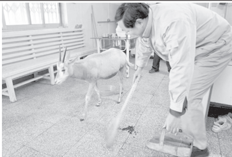
A zookeeper cleans the ambience for Niuniu, an oryx gazella born at the veterinary hospital in the Zoo of Jinan, east China’s Shandong Province, on 1 Dec, 2009. The cub oryx gazella suffered an injury of broken front legs upon its birth on 29 July, 2009 and has received intensive caretaking by local veterinarians. It has come to convalescence now and get on a normal life.