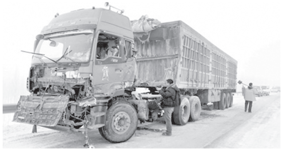
The picture taken on 1 Dec, 2009 shows a damaged van at the traffic accident site in Mulan County, northeast China's Heilongjiang Province. At least six people have been confirmed dead after a mini-bus collided with the van in the province, local officials said Tuesday. The accident happened on Hazhao Road in Liuhe Township, Mulan County, at about 7:40 am.

The research was published recently in the Journal of Quaternary Science.