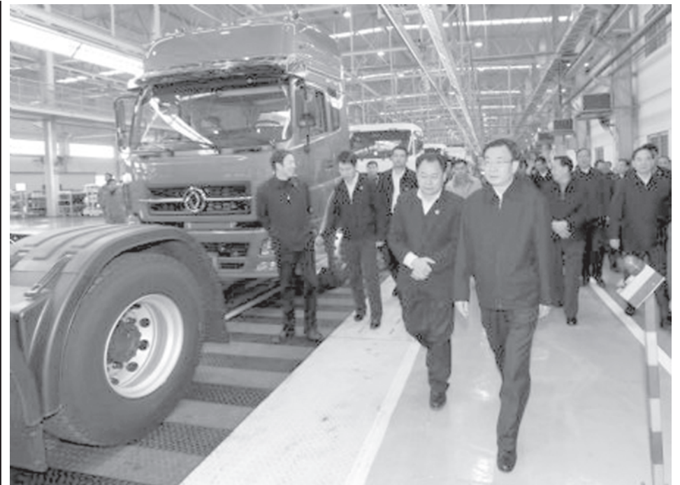
He Guoqiang (front), a member of the Standing Committee of the Communist Party of China (CPC) Central Committee Political Bureau and also secretary of the Central Commission for Discipline Inspection of CPC, inspects the Dongfeng Motor Company in Shiyan city of central China’s Hubei Province on 30 Nov, 2009.