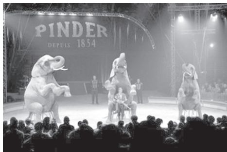
Elephants performing at the French circus Pinder in 2005. The head of Cirque Pinder called on Monday for clowns, lion-tamers and other staff to be publicly vaccinated against swine flu under the big tops where they perform.