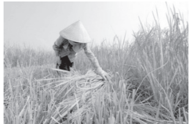
A farmer harvests rice near Hanoi. Vietnam, the world’s second-biggest rice exporter, has said it needs help to safeguard the world’s food supply from the consequences of global warming.