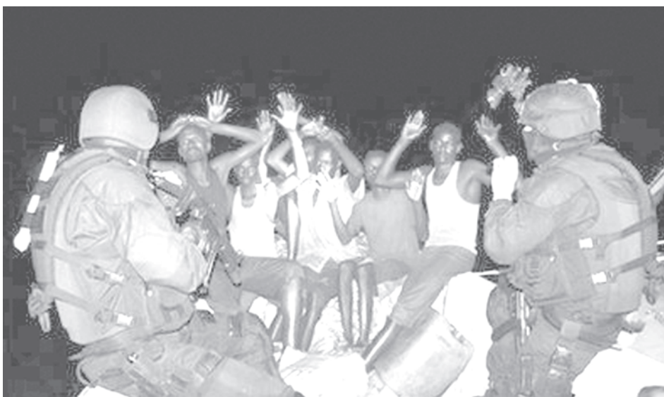
In this image made available by NATO in London, on 30 Nov, 2009, Portuguese Naval Marines from the frigate 'Alvares Cabral', guard a group of Somali pirates, during a joint operation with Seychelles and EU forces in the Somali Basin, off the Seychelles, on 29 Nov, 2009.