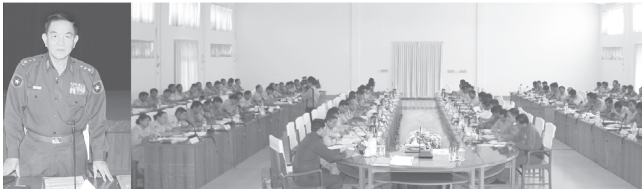
Minister Col Thein Nyunt addresses coordination meeting.—MNA

Up to the end of 2008-2009 financial year, the Development Affairs Department built 323 miles and five furlongs of gravel roads, 184 miles and one furlong of tarred roads, and 783 bridges, conduits and culverts in Inter-District Road (1); 160 miles and six furlongs of gravel roads and 738 bridges, conduits and culverts in Inter-District Road (2); and it is now building 28 miles of earth roads and 50 miles of gravel roads in Inter-District Road (3).—MNA