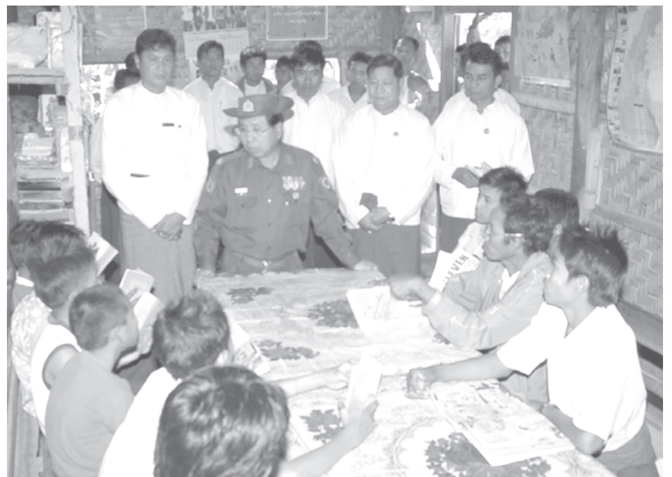
Minister Brig-Gen Kyaw Hsan greets locals reading at Pyinnya Dazaung Library.—MNA

A total 60 health staff attended the two-day course.—MNA