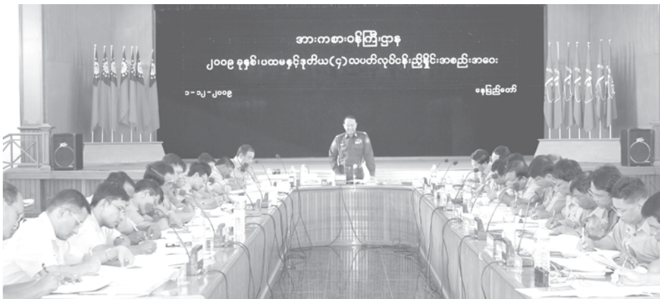
Minister Brig-Gen Thura Aye Myint addresses coord meeting.—MNA

The deputy director-general (Minister Office) and directors discussed on submission presented by the principals of Sports and Physical Education Institutes (Yangon and Mandalay) and sports officers.—MNA