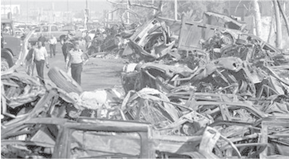
File photo shows Iraqis walking past destroyed cars after a massive bomb attack in front of the Foreign Ministry in Baghdad, Iraq.—INTERNET