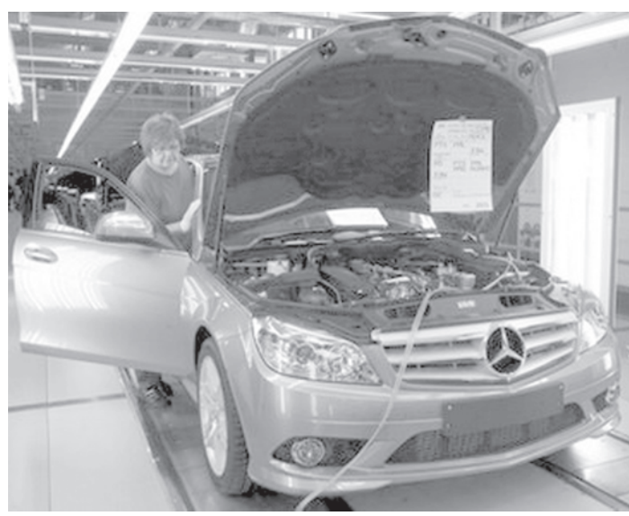
A worker at the Daimler AG plant assembles C-class Mercedes-Benz cars in Sindelfingen. German luxury car maker Daimler said on Wednesday that it will manufacture its popular C Class automobiles at a US plant in Tuscaloosa, Alabama. INTERNET

The United Nations advocates for universal human rights and development for all as fundamental goals and as essential foundations for peace, security and prosperity. The United Nations Convention on the Rights of Persons with Disabilities, which entered into force in 2008, is one of our most important tools to advance this cause. We must continue to work for its implementation and its universality. On this International Day, let us pledge to break down the barriers to participation and access which persons with disabilities face in their daily lives. Let us empower them as an indispensable means for achieving the Millennium Development Goals and development for all.— UNIC