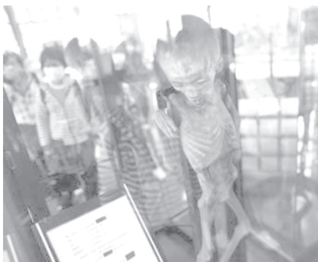
Thai school children visit a museum exhibiting preserved bodies of AIDS victims at a Buddhist temple Wat Prabat Nampu, in Lopburi, on the World AIDS day, on 1 December 2009.