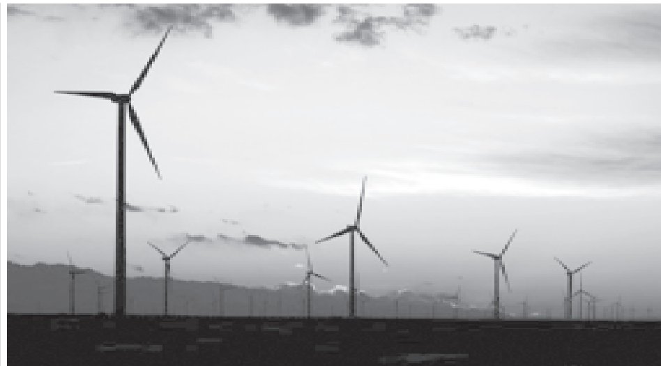
Photo taken on 30 Nov, 2009 shows the Jiuquan wind power base in north-west China's Gansu Province. Jiuquan wind power base is the first 10 million kilowatts of wind power base construction project in China. The whole construction has gone well since the first phase project started on 8 August in 2009. The installed capacity of wind power is estimated to break 2 million kilowatts this year.