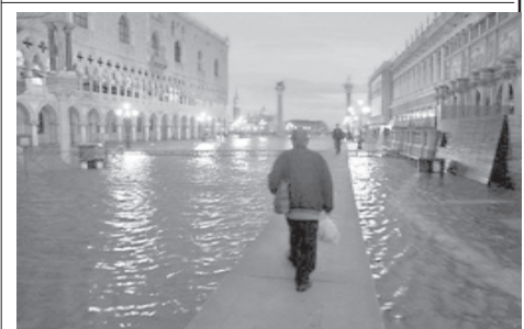
People walk on a platform on the flooded Piazza San Marco (St Mark’s square) in Venice. Much of the historic Italian city of Venice, including St Mark’s Square, was underwater Monday following a meteorological exexpression combined with natural tide waters, officials said.