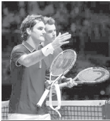
Roger Federer (L) of Switzerland reacts after winning his Group A match against Andy Murray of Britain at ATP World Tour Finals in London, capital of Britain, on 24 Nov, 2009. Federer won 2-1.

In his second Group A match at the ATP World Tour Finals, Federer lost the first set 6-3 to Murray, who led the head-to-head record in 6-3. However, the Swiss superstar was calm enough to keep his accurate long balls, winning the following set in 6-3.