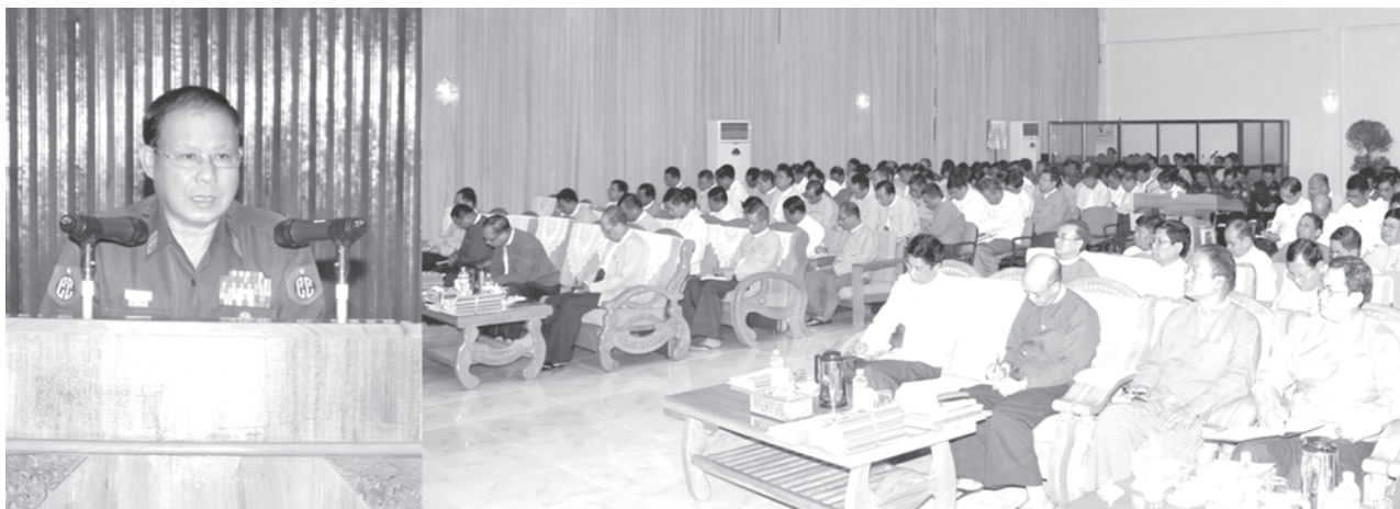
Minister Brig-Gen Thein Aung delivers an address at State/Division Work Coordination Meeting of Ministry of Forestry.

NAY PYI TAW, 25 Nov—Minister for Forestry Brig-Gen Thein Aung addressed the state and division coordination meeting of the Ministry of Forestry at the meeting hall of the ministry here this morning.