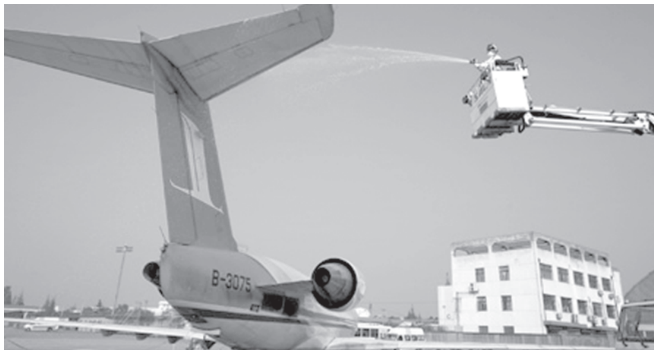
A staff worker from China's Shanghai Airlines practises snow removal from a plane in a drill on 23 Nov, 2009 in Shanghai, east China. As winter came to southern part of China, the airlines implements a series of drills to maintain efficiency of all its flights.