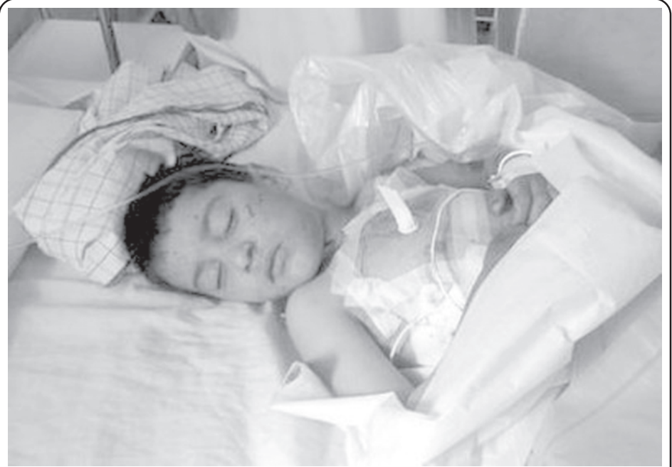
An Afghan boy who was injured in a bomb blast lies in hospital in Farah Province on 20 Nov, 2009. A suicide bomber on a motorcycle detonated his explosives in a crowded area in southwest Afghanistan on Friday, killing 15 people, including a senior police official, Afghan authorities said.