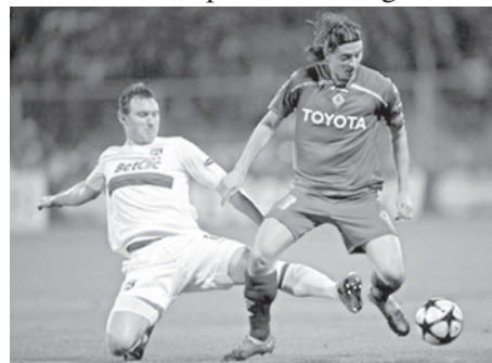
Lyon's Sweden midfielder Kim Kallstrom (L) fights for the ball with Fiorentina's midfielder Riccardo Montolivo during their UEFA Champions League Group E football match at Artemio Franchi Stadium in Florence.

"I am French but I'm just so happy about this qualification, we were so motivated today, this is a huge emotion," he said. "We've grown, we've matured, we've changed a few players, however at home we've always managed to impose our game.—Internet