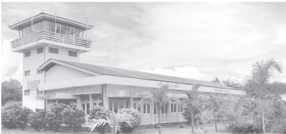
Neat and clean Bhamo Airport.

said, "There were only 3 miles and 2.36 furlongs of tarred roads, 4 miles of gravel roads and 12 miles of earth roads before 1988."