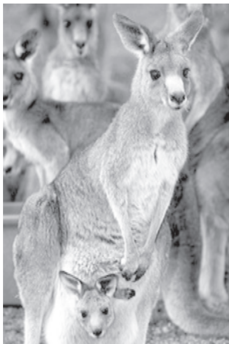
In this file photo taken on 29 Aug, 2005, file photo, a female kangaroo and her joey are seen in suburban Sydney, Australia. An Australian man was in stable condition on 23 Nov, 2009, after being slashed across the abdomen and face by a kangaroo that was holding his dog underwater.