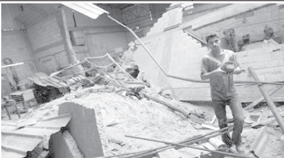
A Palestinian inspects a factory's workshop destroyed in an Israeli air strike near the border between Egypt and the southern Gaza Strip on 24 November, 2009. Three Palestinians were wounded early on Tuesday as Israel carried out three air strikes on Hamas-run Gaza in response to rocket fire from the enclave, witnesses, medics and the army said.

But they said by using the new device, physicians can essentially perform a “liquid” biopsy, allowing for early detection and diagnosis, as well as improved treatment monitoring.—Internet