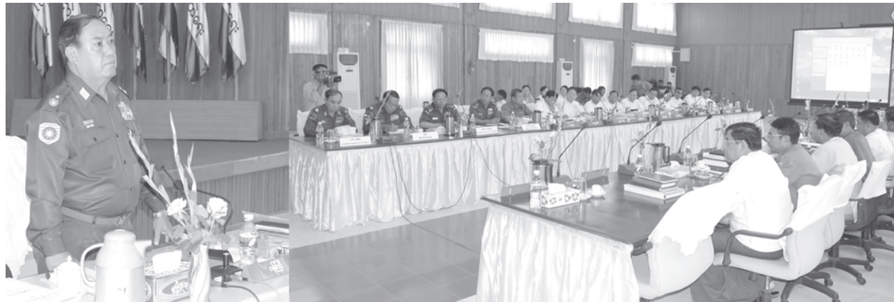
Minister Maj-Gen Maung Oo addresses the work coordination meeting 2009 of General Administration Department.

NAY PYI TAW, 25 Nov —The General Administration Department under the Ministry of Home Affairs held the work coordination meeting for 2009 at the meeting hall of the ministry here this morning, with a speech made by Minister for