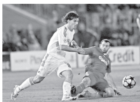
Liverpool's Jamie Carragher (R) fights for the ball with Hungarian Zolt Laczko (L) of VSC Debrecen in the Puskas stadium of Budapest during their UEFA Champions League football match. Liverpool's miserable season continued as they were knocked out of the Champions League at the group stage despite a 1-0 victory over Debrecen.

The victory at least secures a berth in the Europa League but it will be scant consolation for a side whose last group-stage exit came in 2002-03.