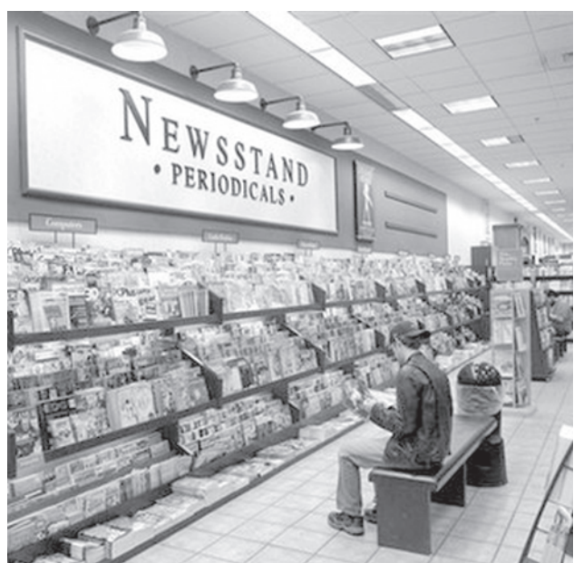
In this 18 May, 2009 file photo, a customer reads magazines inside the Barnes and Noble store in Tallahassee, Fla Barnes & Noble said on 24 Nov, 2009, it posted a wider loss in the second quarter because of costs for an acquisition.