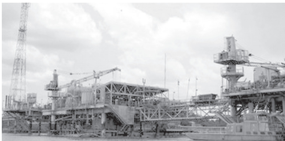
A flow station in Kula in the Niger Delta. Nigeria's 2010 budget will be based on an oil price of 57 dollars per barrel and oil production of 2.088 million barrels per day, President Umaru Yar'Adua said in a budget statement on Tuesday to parliament.

Inflation fell from 15.1 percent in December 2008 to 10.4 percent in September, he said.