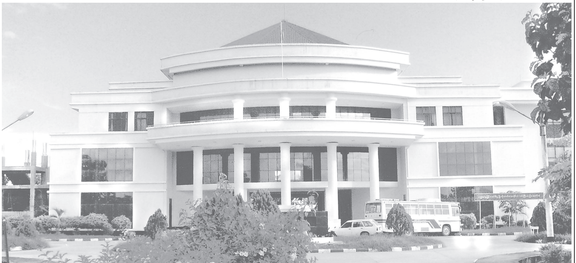
Photo shows magnificent Bhamo University.