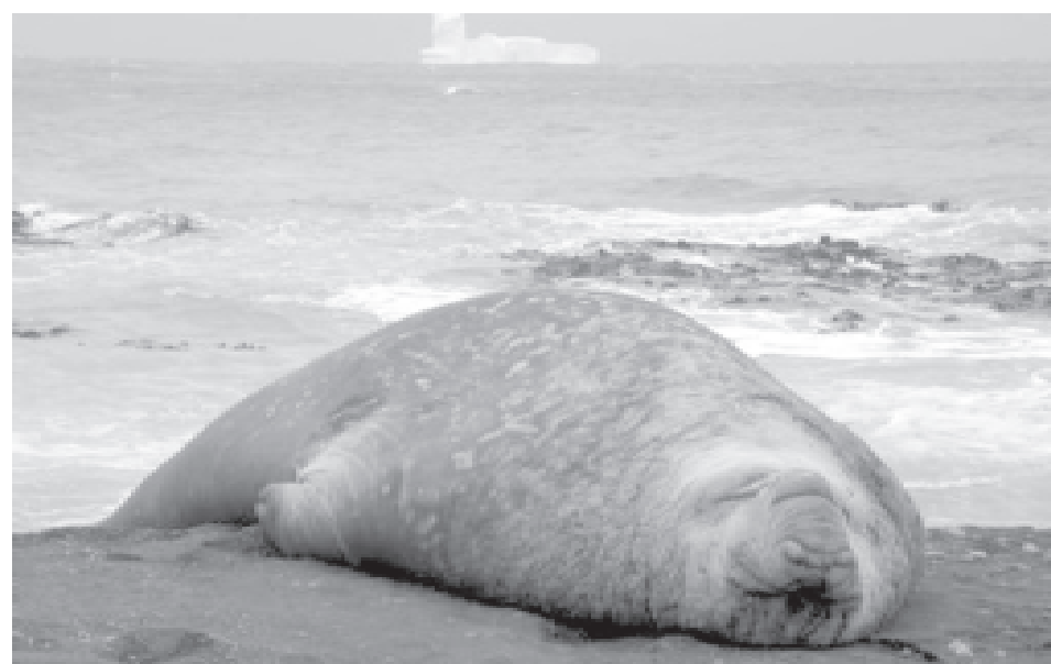
In this 16 Nov, 2009 photo released by the Australian Antarctic Division, an iceberg is seen behind a lying elephant seal at Sandy Bay on Macquarie Island's east coast, in the Southern Ocean 1,500 kilometers (930 miles) south-east of Tasmania, Australia. It is very rare to see icebergs from Macquarie Island and is uncommon to find icebergs in this general region.—INTERNET

Because nerves usually are not severed in a common type of spinal cord trauma, called “compression” injuries, the drug offers hope as a possible treatment, said Shi, one of the authors of the study.—Internet