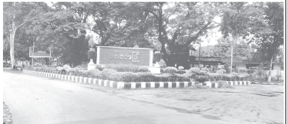
Signboard at the entrance to Bhamo.