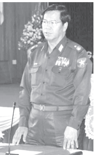
Minister Maj-Gen Hla Tun makes an address at work coordination meeting.—F&R