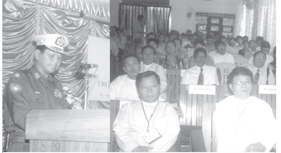
Commander Maj-Gen Hla Min delivers an address at 11th Conference of All Myanmar General Practitioners Society.