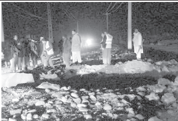
File photo shows Afghans gather at the site of an attack on lawmaker Abdul Rab Rasoul Sayaf. Bomb attacks have killed 23 people in Afghanistan, a deadly start to President Hamid Karzai's second term that underscored spiralling insecurity nine years into the US-led war.