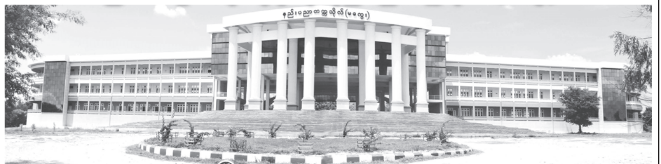
Magway Technological University.

It was learnt that Civil Engineering, Electronic and Communication Engineering, Electrical Power Engineering, Mechanical Power Engineering, Machine Tools and Design Engineering, Mechatronics Engineering, Architecture Textile Engineering, Petroleum Engineering and Chemical Engineering courses were opened in AGTI, B Tech and B E levels in every