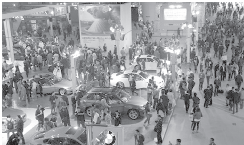
A large crowd of visitors is seen at the 7th Guangzhou Auto Show on 24 Nov, 2009 in Guangzhou, south China's Guangdong Province. The international auto show, which was opened on Tuesday, would exhibit more than 720 various cars to meet the stronger demand of Chinese customers.