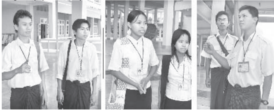
Students expressing their gratitude for having opportunities to pursue higher educations in their own region.