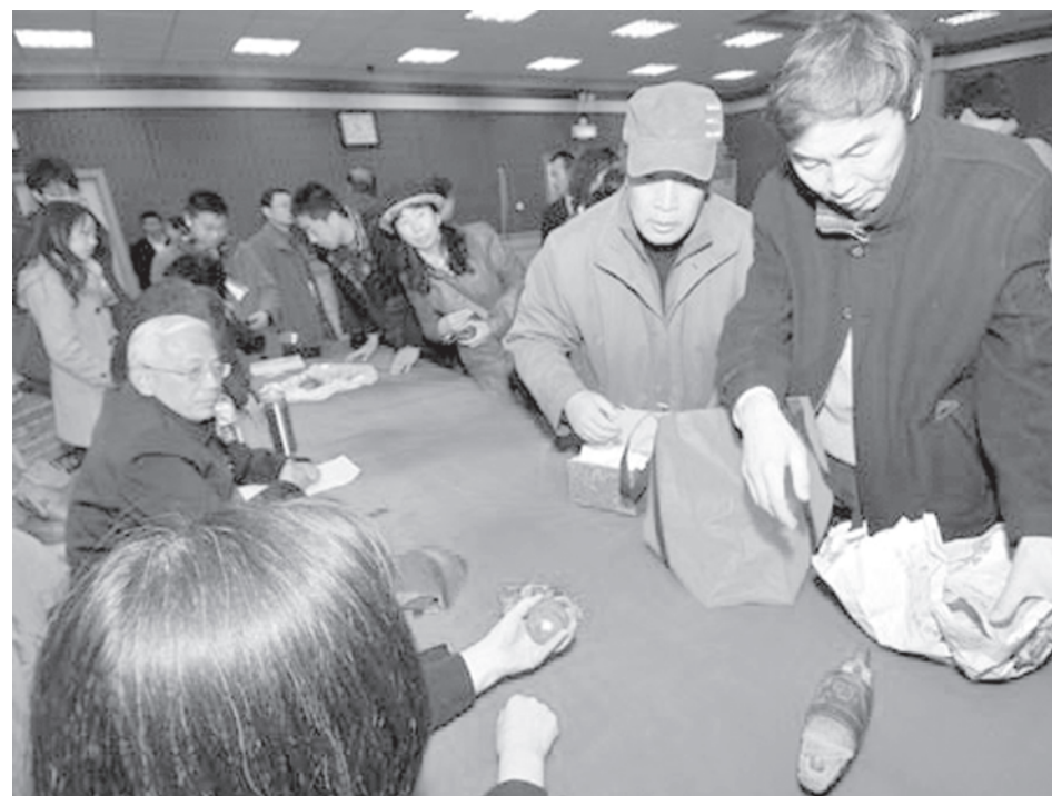
Local citizens bring forth their antiques under private collections to the specialists of cultural relics for authoritative authentication, during one of the series activities as a part of the 8 th Beijing Southern Xuanwu District Cultural Festival, in the China Bookstore of Liulichang, in downtown Beijing, on 24 Nov, 2009.