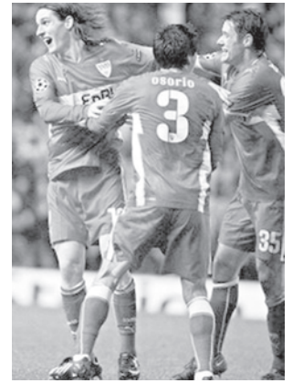
Stuttgart's Sebastian Rudy (L) celebrates with teammates after scoring the opening goal against Rangers during the UEFA Champions League football match in Glasgow. Rangers' Champions League hopes were extinguished for another season hereon Tuesday as they slumped to a 2-0 defeat to Stuttgart at Ibrox.