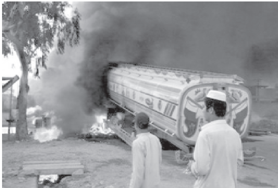
Pakistani men look on at a burning oil tanker in Khyber in July 2009. Suspected Taliban militants on Wednesday again attacked and destroyed a tanker supplying fuel to NATO troops in neighbouring Afghanistan, police said.— INTERNET

Militants carry out frequent attacks on supplies for US and NATO-led forces fighting against Taliban militants across the border.— Internet