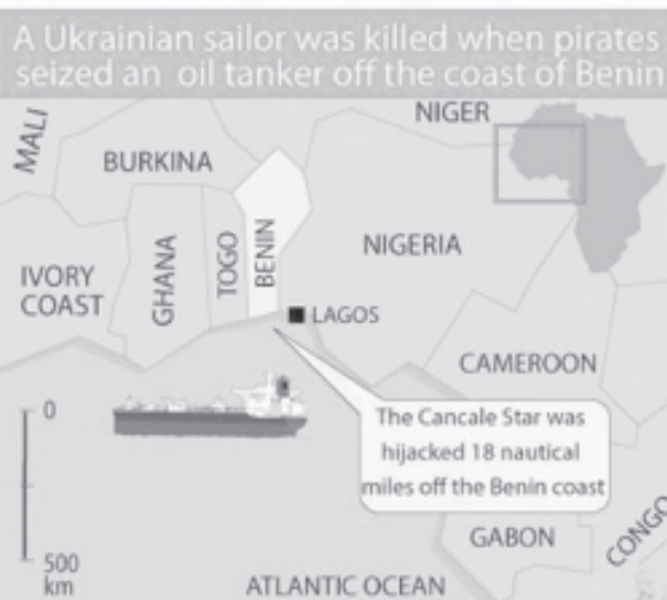
A map of West Africa. Pirates attacked an oil tanker off the coast of west Africa, killing a Ukrainian officer before escaping with the contents of the ship's safe, the ship's owners and Benin's navy commander said on Tuesday.

The tanker's owners Chemikalien Seetransport said in a statement issued from Germany that the vessel's chief officer, or second in command, "has tragically lost his life in a piracy attack off the coast of Benin in the early hours of 24 November".— Internet