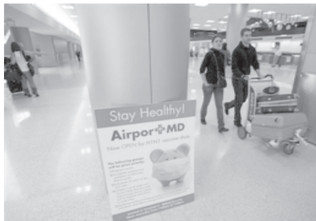
Swine flu shots are advertised outside of Airport MD at Miami International Airport in Miami on 24 Nov, 2009.

Space agency managers said transfer operations underway aboard the complex might have stirred up dust particles that triggered the sensitive station alarm sensors. The combined 12-member crew of space shuttle Atlantis and the International Space Station finished their remaining tasks on Tuesday, in preparation for Wednesday's shuttle uncoupling. Among those tasks was a formal change of ISS command.