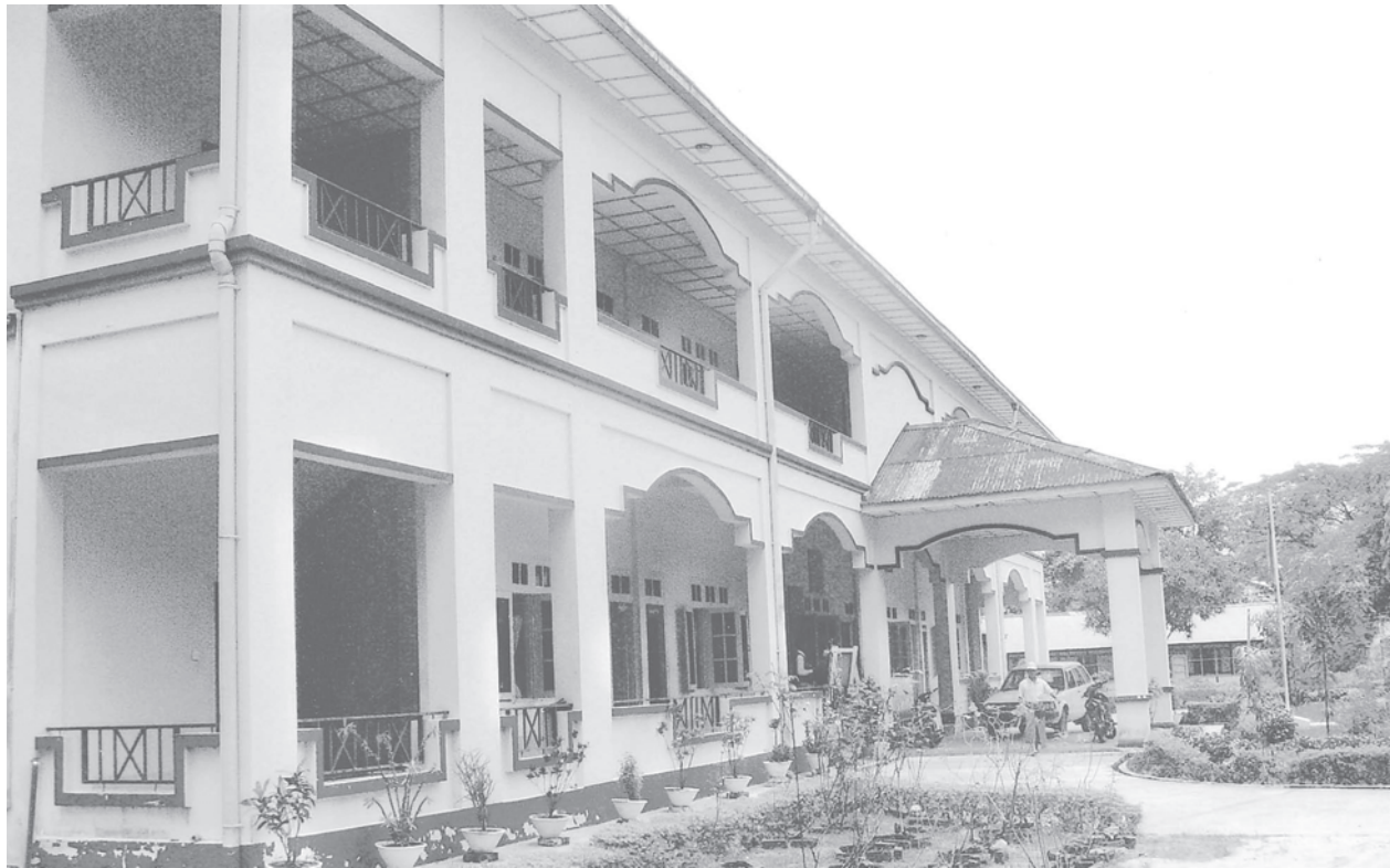
Bhamo Nursing School.

almost as good as tarred one. Then we reached Moemauk Township, one of the townships of Bhamo District, where forest reserves are conserved systematically. As a result of prevailing stability and tranquillity, hamlets along the motorway have transformed from hamlet into large villages.