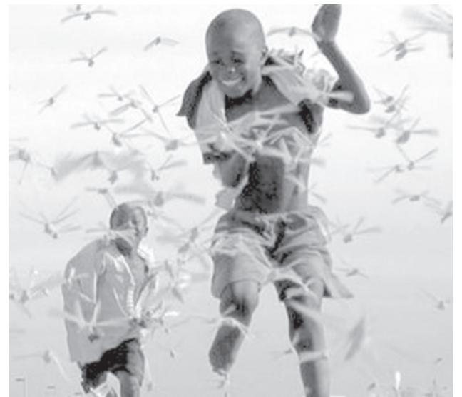
Senegalese children run as locusts spread in the capital Dakar on 1 Sept, 2004. Only a military-style operation with bases across West Africa can stop the worst locust invasion for 15 years, Senegal's President Abdoulaye Wade said on Tuesday as the insects swept into his capital.

The chief of anti-drug police in southwestern Oruro state said families in poor, highland villages process the coca leaf into cocaine paste and sell it to traffickers on the Brazilian border.—Internet