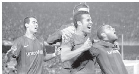
Barcelona's Pedro Rodriguez (C) celebrates with teammates Dani Alves (R) and Sergio Busquets after scoring against Inter Milan during their Champions League soccer match at Nou Camp stadium in Barcelona on 24 Nov, 2009.

MADRID, 25 Nov—Reigning Champions FC Barcelona took a huge step towards qualifying for the last 16 of the Champions League following a 2-0 win at home to Inter Milan.