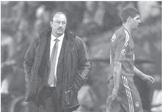
Liverpool coach Rafael Benitez looks on as Steven Gerrard (R) walks off the field during their UEFA Champions League match against Debrecen at the Puskas stadium in Budapest on 24 November 2009.