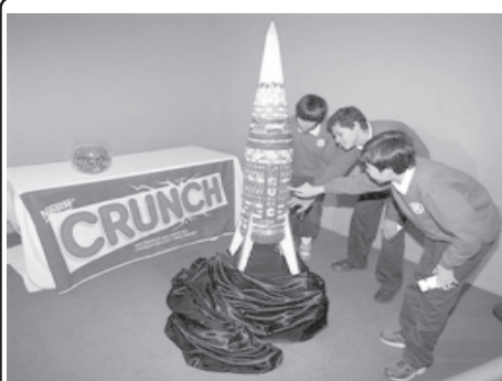
Guests of the Tech Museum of Innovation get up close and personal with a candy creation comprised of more than 3,000 discarded Halloween treats. Nestle Crunch commissioned renowned 'found art' artist Leo Sewell to construct the work of art using unwanted Halloween candy that museum visitors donated in exchange for a Nestle Crunch bar.