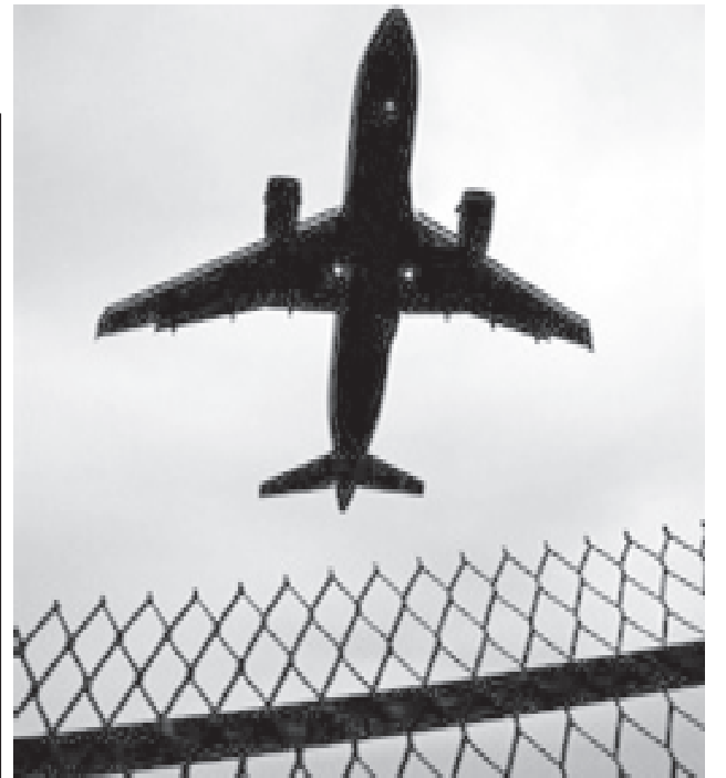
A commercial airliner prepares to land at London's Heathrow airport. Police arrested a United Airlines pilot on suspicion of being drunk as he was about to help fly a passenger plane from London's Heathrow Airport, an officer and the airline said on Tuesday.