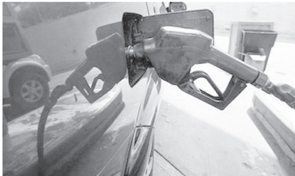
World oil prices rose as traders digested the latest demand growth forecasts from the OPEC crude producers' cartel, and awaited this week's snapshot of US energy inventories.