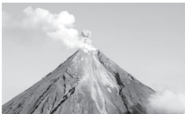
Mayon volcano spews grayish ash for the second time in a day on 11 Nov, 2009 at Legazpi, Albay province, about 340 kilometers (212 miles) southeast of Manila, Philippines.—INTERNET

1,000 people. Two explosions early Wednesday sent ash and rocks more than half a mile (a kilometer) into the air, reaching nearby Camalig town along Mayon's foothills.—Internet