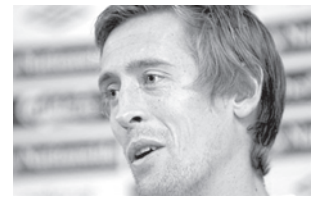
England footballer Peter Crouch, seen here addressing the press in London Colney, believes this week's friendly against five-time World Cup winners Brazil will provide a true test of the team's progress under Italian manager Fabio Capello.

about their strengths and weaknesses and see how close we are to them.