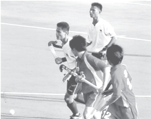
Myanmar and Japanese youth competing in 2nd U-18 Asian Youth Hockey Tournament.