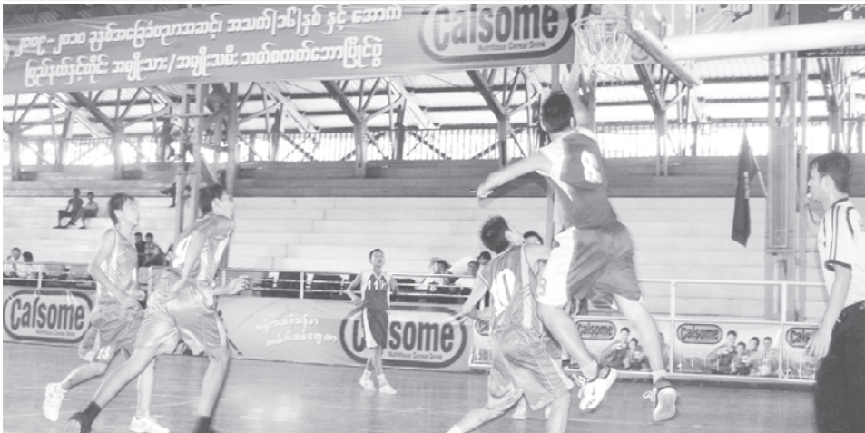
Mandalay Division plays against Mon State in Basic Education Level Inter-State/Division U-16 Men's and Women's Basketball Tournament.