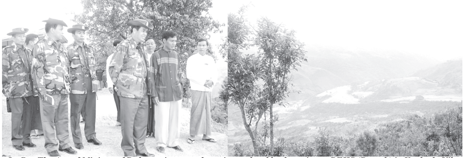
Lt-Gen Tha Aye of Ministry of Defence views tea plantation and paddy plantation at BEHS (Branch) in Yanhtalo Village.