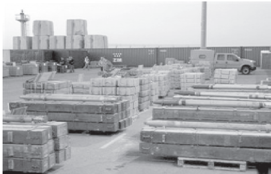
Rockets seized by Israeli authorities on a ship near Cyprus, are presented in the port of the Israeli city of Ashdod, on 4 Nov, 2009.—INTERNET

When receiving the document, Sarney highlighted the "tradition of brotherhood" between the South American peoples and pledged to support the initiative.—Xinhua