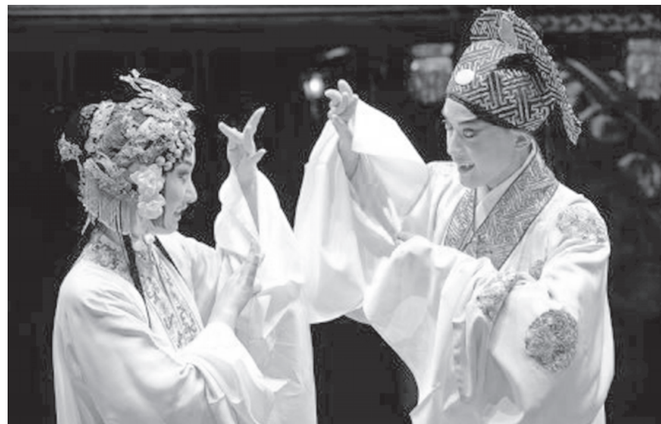
Photo taken on 7 Nov, 2009 shows a scene of "Peony Pavilion", a well-known Chinese traditional Kunqu Opera, at the ancient stage of Sanshan Guildhall in Shanghai, east China. The Kunqu Opera "Peony Pavilion" will be staged during the 2010 Shanghai World Expo for 120 times.

According to a white paper published in 2006, China's Shijian, or Practice, series of satellites are designed for scientific research and technological experiments.