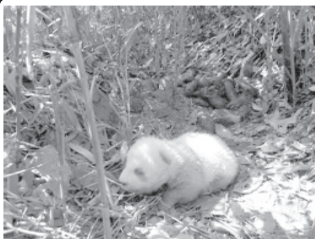
A rare brown baby giant panda has been discovered by researchers in northwest China on 1 November, 2009.

"Although international food prices have fallen significantly since their peaks a couple of years ago, wheat and maize prices strengthened in October and rice export prices are still way above pre-crisis levels," FAO said in the report, noting that 31 poorest countries which are seriously affected by critical food insecurity require emergency assistance.—Xinhua