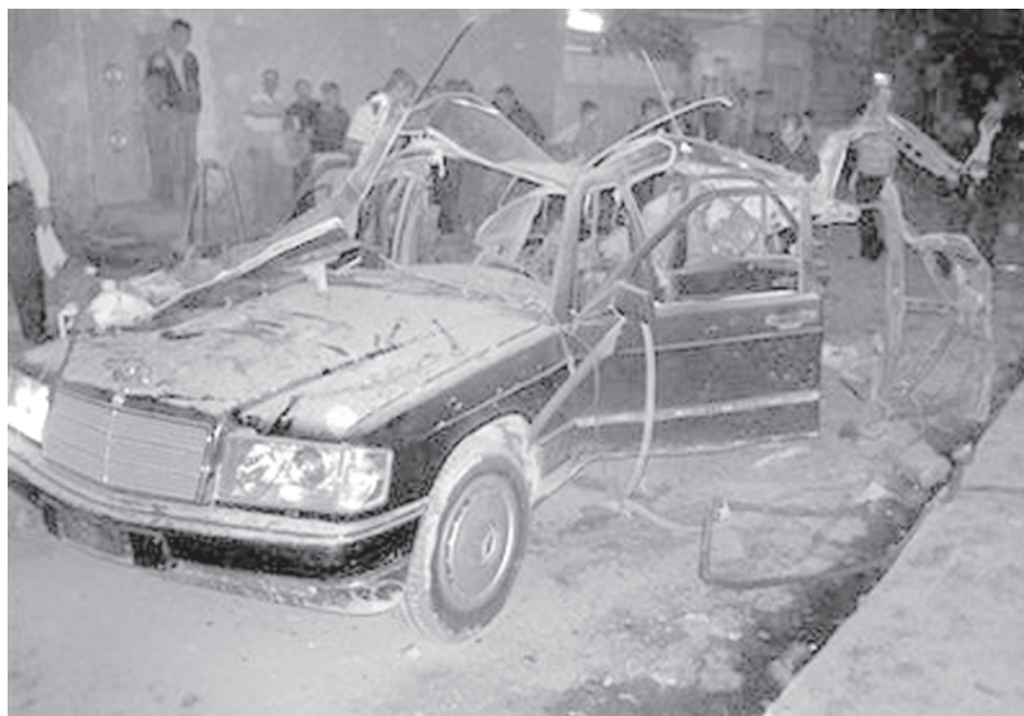
People inspect a damaged car after a bomb attached to the car exploded at Raheem Awah area northern part of Kirkuk city, 290 kilometres (180 miles) north of Baghdad, on 10 Nov, 2009, wounding one civilian, the police said.