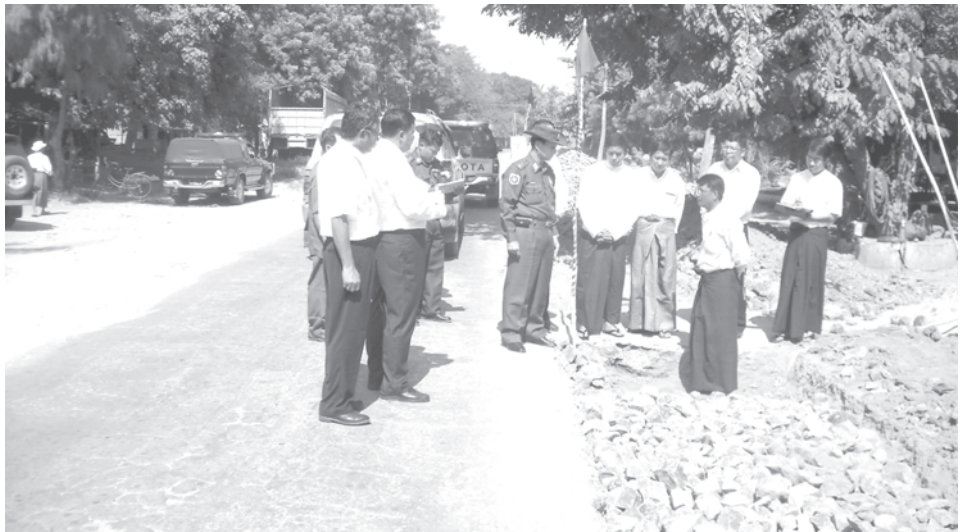
Minister Maj-Gen Khin Maung Myint inspects Mandalay-Madaya-Phauktaw-Thabeikkyin road.