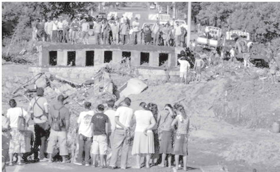
Residents look at destroyed buildings, after heavy rains brought on by Hurricane Ida, in the village of Verapaz, near San Salvador on 9 Nov, 2009. Strong rains brought over by hurricane Ida have killed 175 people in El Salvador, the Civil Protection office said on Tuesday.