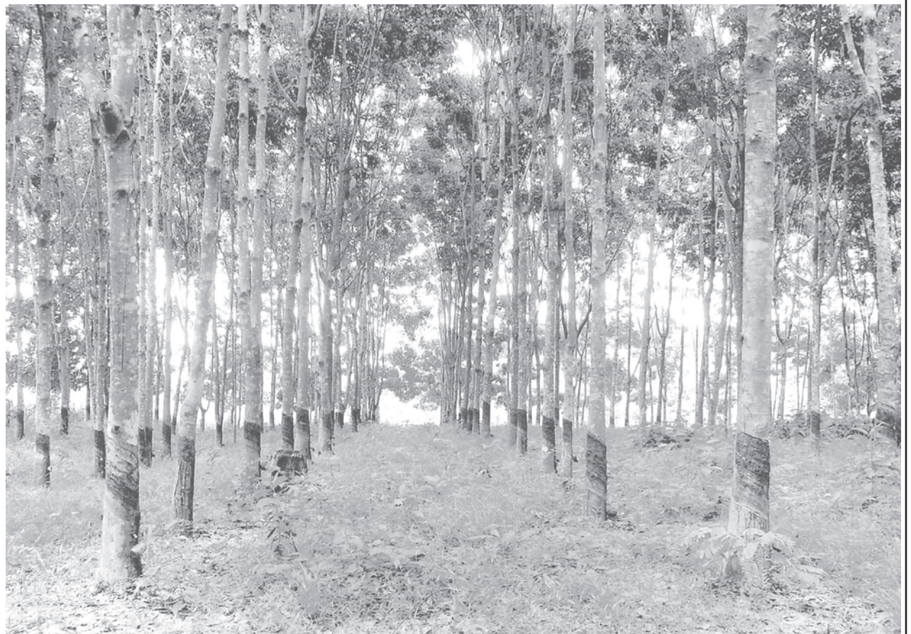
Latex is being collected from rubber plantation near Nyaunggaing Village of Mohnyin Township.

We had an interview with Daw Khin Sein, a rubber farm owner in Nyaunggaing Village. She said, "I established this rubber farm in 2002. Since last two years, I have started collection of rubber latex from 300 plants. We produced 10 pounds per day and sold them for over K 700 one pound. Rubber latex can be (See page 10)