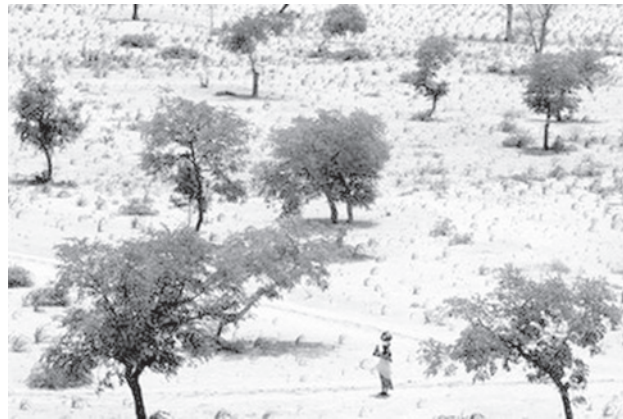
A Nigerian peasant woman walks in a farming area at Farab village of Niger's southern city Tsaoua, in 2008.

DAKAR, 11 Nov—The cereal crop will decline sharply in Chad, Niger and Mauritania in 2009-2010 because of drought, the permanent Inter-state Committee to Fight Drought in the Sahel (CILSS) announced on Tuesday.