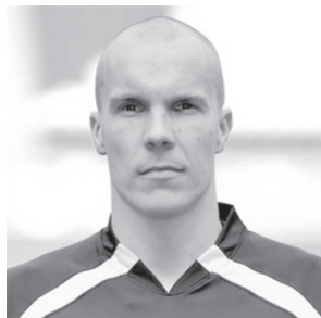
FILE - Picture taken 8 July, 2009 shows Robert Enke, goalkeeper of the German first division Bundesliga soccer club Hannover 96 during the official photo opportunity in Hanover, Germany. The 32-years-old goalkeeper of the German national soccer team has died, his club confirmed on 10 Nov, 2009.