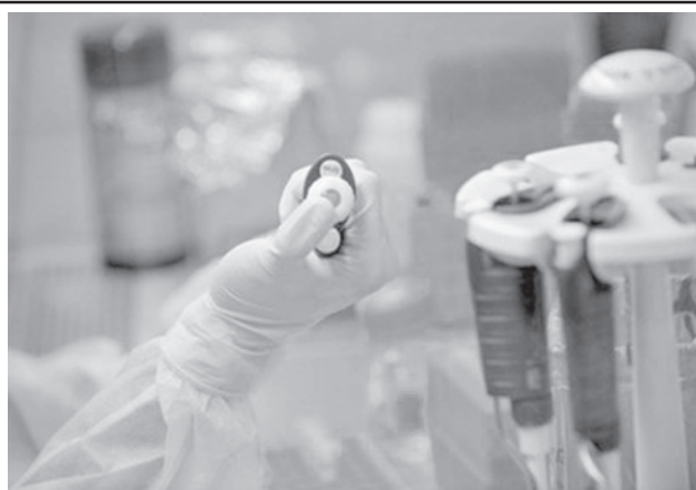
A lab technician prepares samples at a research institute. British drug maker GlaxoSmithKline has announced that US regulators have approved its swine flu vaccine for adults in the United States.

"The Gomel State Technical University in Belarus has expressed its intention to cooperate with Indonesian universities in exchange of students, professors and university graduates, as well as employee training in the field of techniques, energy, physics, chemistry and other technology," said the statement.—Xinhua