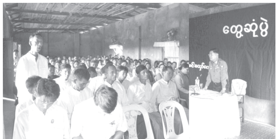
Minister for Industry-2 Vice-Admiral Soe Thein meets local people from seven village-tracts at Monghlaw Village in Kyunsu Township.

On 8 November, the minister attended the opening ceremony of the new building of rural clinic in Kapa village of Kyunsu Township.—MNA