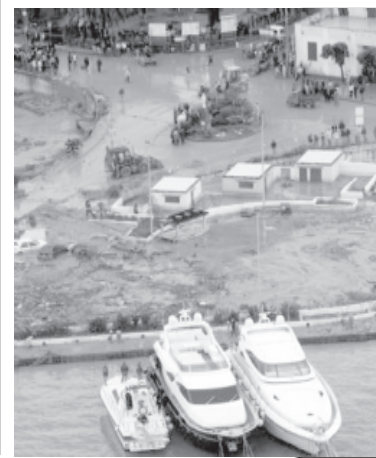
Mud covers the port area after a deadly landslide on Ischia island's main town of Casamicciola on 10 November, 2009.

The statement by the national prosecutors office said American authorities asked for the man's arrest and have sought his extradition.—Internet