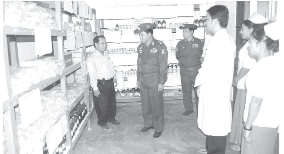
Lt-Gen Min Aung Hlaing inspects Tongtah Station Hospital of Mongping Township.

At the 24 th -mile camp on Kengtung-Monghkat-Mongyan Road, Lt-Gen Min Aung Hlaing attended