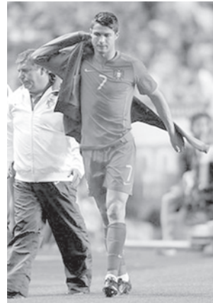
Portugal's Cristiano Ronaldo, seen here in October 2009, was ruled out on Tuesday of his country's crucial World Cup play-off matches after undergoing medical tests on a troublesome ankle injury.