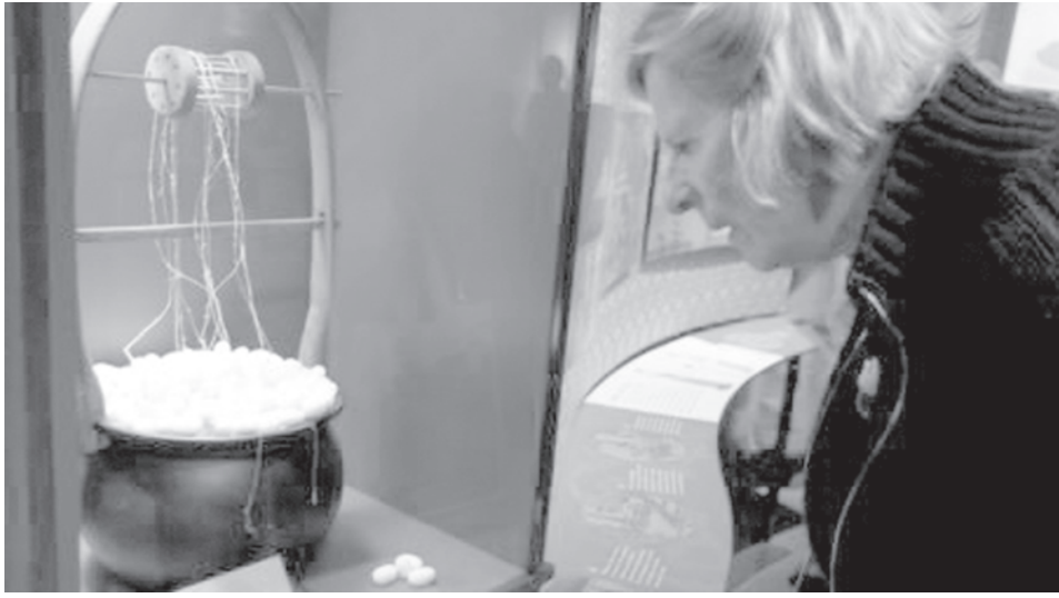
A woman views a silkworm cocoon reeling machine during the media preview of the "Travelling the Silk Road" exhibition at the American Museum of Natural History in New York on 10 Nov, 2009.