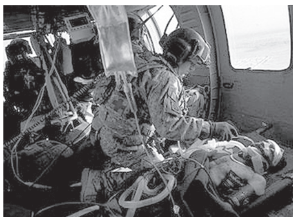
A medic treats an injured man in the helicopter during transportation to a hospital in Kandahar, on 4 November. At least 25 NATO and Afghan soldiers were wounded on Friday as the hunted for two US paratroopers missing in remote northwestern Afghanistan, according to NATO.—INTERNET