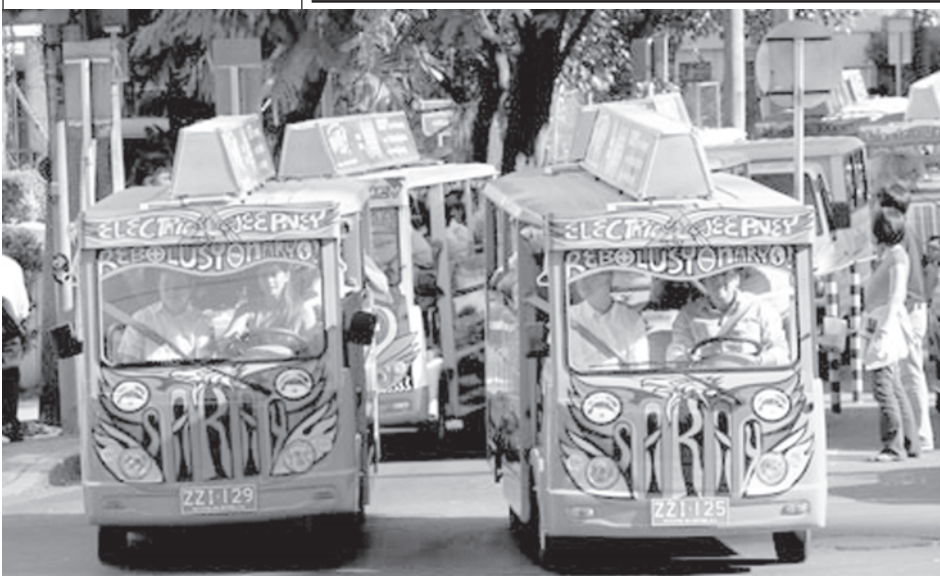
Electric Jeeps ply in Makati District of Manila, capital of the Philippines, on 10 Nov, 2009. Passengers received on Tuesday a free ride that financed by the city government as part of a campaign to reduce its greenhouse emissions.