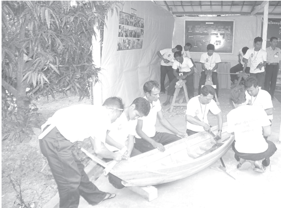
Senior General Than Shwe inspects boat building at carpentry, masonry and steel fixing course No. 2 in Sasana Beikman in Labutta Township.—MNA

Razudaing Bridge No (1) is of one-way steel girder type. The main