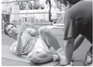
Philippine boxing hero Manny Pacquiao (L) exercises during a training session at a gym in Manila on 24 October, 2009.