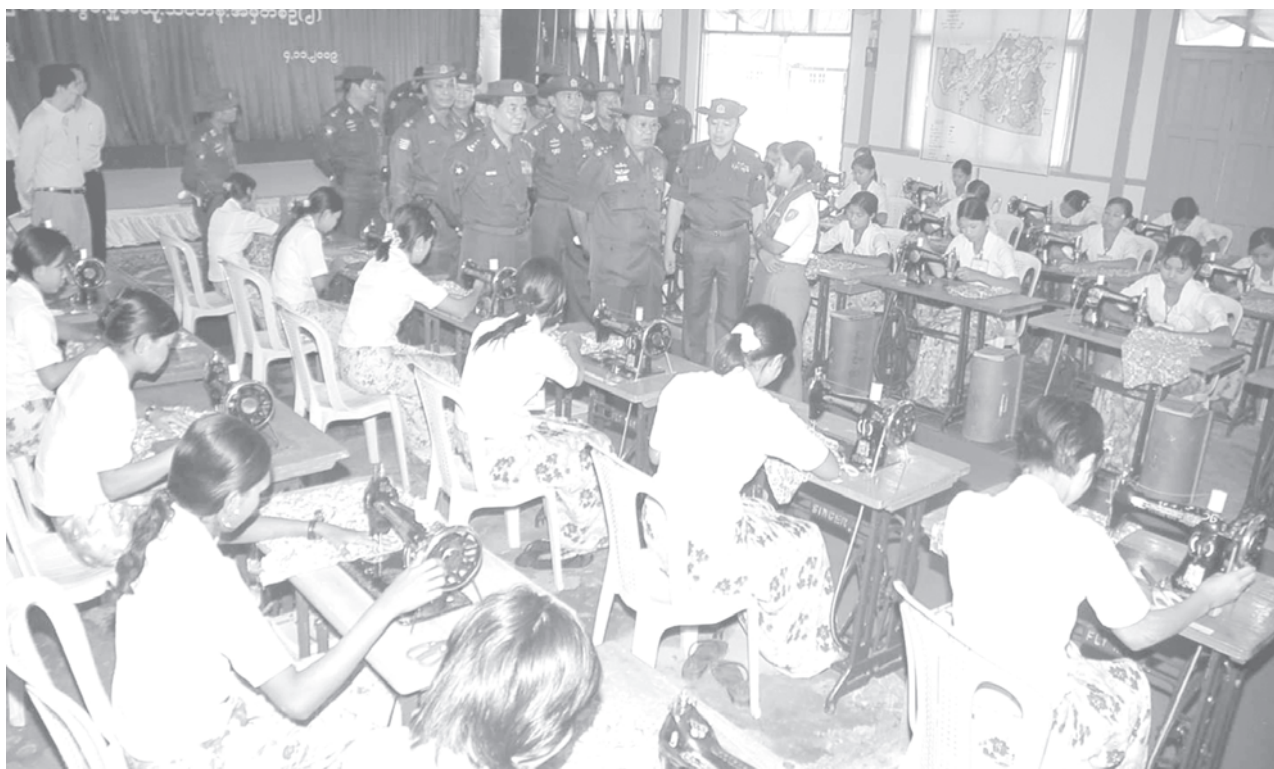
Senior General Than Shwe inspects tailoring of Basic Vocational Special Course No. 2 at Yway Nadi hall in Labutta.—MNA