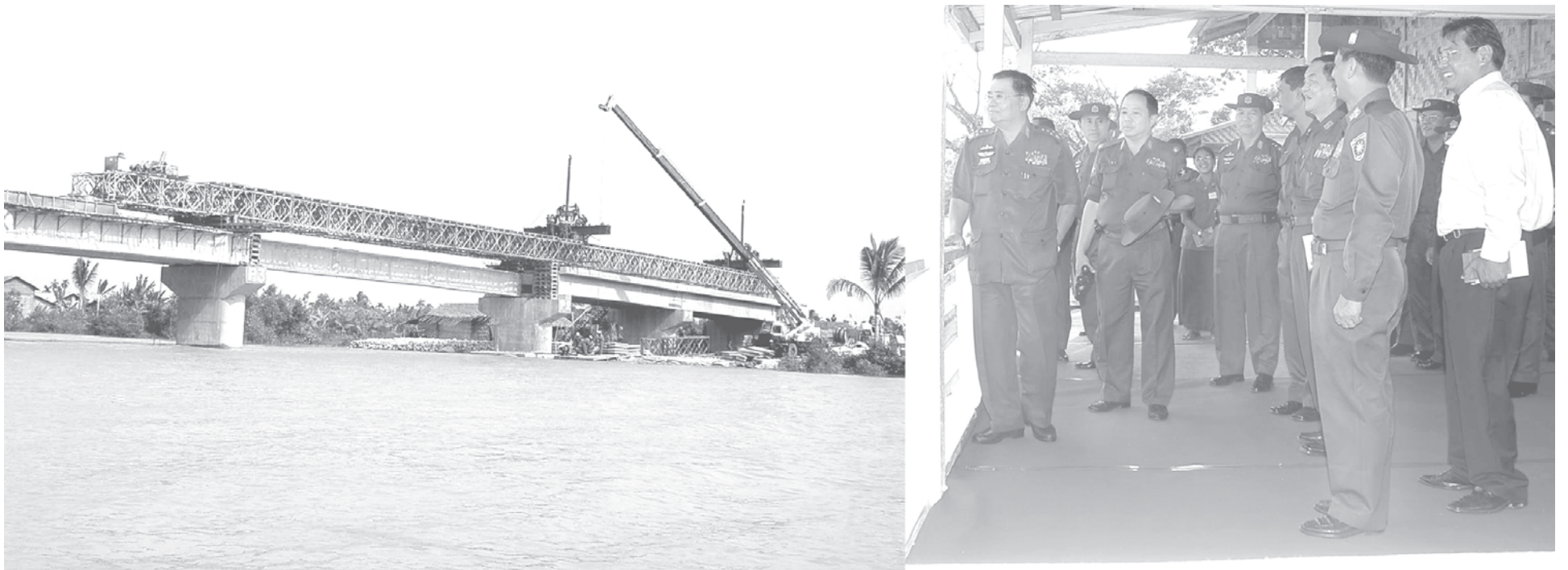
Senior General Than Shwe inspects construction site of Razudaing bridge No.2 in Mawlamyinegyun township.—MNA

Senior General Than Shwe views progress of rehabilitation and reconstruction in storm-ravaged regions of Ayeyawady Division