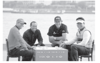
From left, Yang Yong-eun of South Korea, Tiger Woods of the US, Phil Mickelson of the US and defending champion Sergio Garcia of Spain smile during a photo call of the HSBC Champions golf tournament on 3 Nov, 2009 in Shanghai, China. The golf tournament will be held at Shanghai Sheshan International Golf Club from on 5 to 8 Nov.

And it’s equally difficult to ignore the sarcastic, yet caustic comment from Stuart Appleby at the start of the decade when a dozen Americans decided against going to Spain to close out the