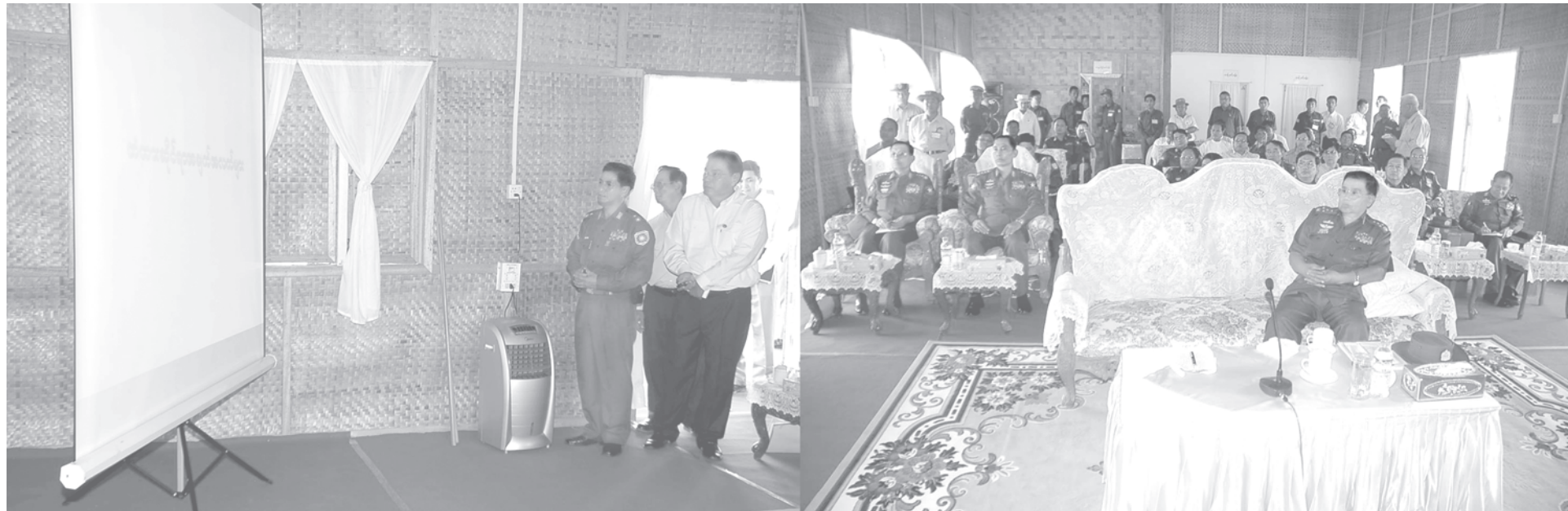
Senior General Than Shwe hears report presented by Minister for Construction Maj-Gen Khin Maung Myint on fact about Razudaing Bridge.

At Yway Nadi Hall in Labutta, they arrived at the training school of