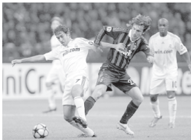
AC Milan’s Andrea Pirlo (R) fights for the ball with Real Madrid’s Raul during their Champions League soccer match at the San Siro stadium in Milan on 3 November, 2009.