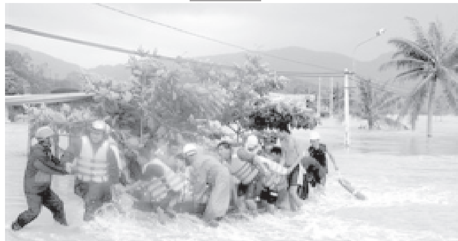
Rescue workers pull a boat through flooded waters in Binh Dinh province, in south central coast, in Vietnam, on 3 Nov, 2009.