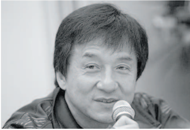
Smile Ambassador for Operation Smile Jackie Chan gestures while speaking during a news conference in Hanoi, Vietnam, Wednesday, 4 Nov, 2009.