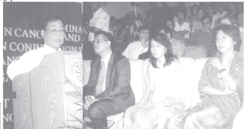
Educative talks on common cancer diseases and latest treatment in progress. —NLM

sponsored by Calsome (MDG Co Ltd), was held at Western Park Royal (Kandawgyi), here, this morning.