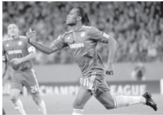
Chelsea’s Didier Drogba celebrates his first goal during their Champions League soccer match against Atletico Madrid at the Vicente Calderon stadium in Madrid, on 3 November, 2009.

Maccabi Haifa, Besiktas, APOEL Nicosia and Atletico were all eliminated, but could yet finish third in their respective groups and go into the Europa League.—Xinhua