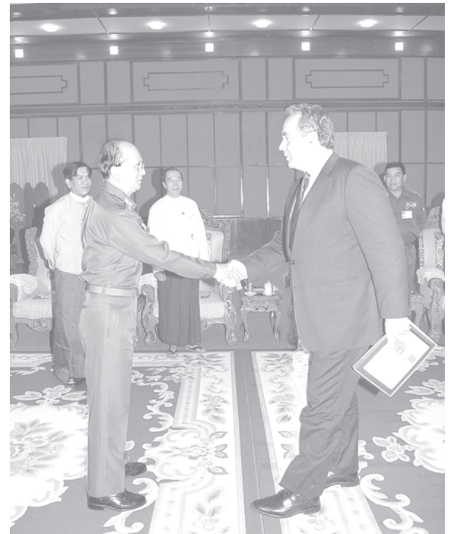
Prime Minister General Thein Sein cordially greets US Assistant Secretary of State for Bureau of East Asian and Pacific Affairs Mr Kurt Michael Campbell at the meeting hall of Government Office in Nay Pyi Taw. (News on page 16)

At 10 am today, Mr. Kurt Michael Campbell and party left Nay Pyi Taw for Yangon by air. They were seen off at Nay Pyi Taw Airport by officials of the Ministry of Foreign Affairs. On arrival at Yangon International Airport, Mr. Kurt Michael Campbell and party were