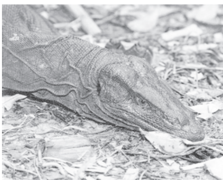
This undated photo shows a Panay monitor lizard in the Philippines. The animal is 1.7 metres long, is vegetarian and lives most of its life in trees. Switzerland-based IUCN surveyed a total of 47,677 animals and plants for this year’s ‘Red List’ of endangered species and determined that 17,291 of them, including this reptile, are threatened with extinction.

The smugglers brought in used clothes, particularly from Japan and South Korea, to be reprocessed and sold to many inland Chinese areas, including the northeastern region and Xinjiang Uygur Autonomous Region, authorities said.