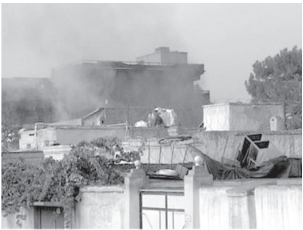
Taliban suicide gunmen stormed a UN guesthouse in Kabul, killing eight people in an attack.