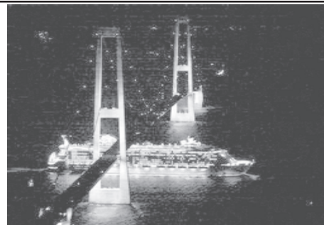
The Oasis of The Seas, the world’s largest cruise ship clears a crucial obstacle, lowering its smokestacks, to squeeze under a bridge in the Baltic Sea, Denmark on 31 Oct, 2009.

The Oasis of the Seas, which rises about 20 stories high, passed below the Great Belt Fixed Link with a slim margin as it left the Baltic Sea on Saturday on its maiden voyage to Florida. Five times larger than the Titanic, the ship has seven neighborhoods, an ice rink, a small golf course and a 750-seat outdoor amphitheater.