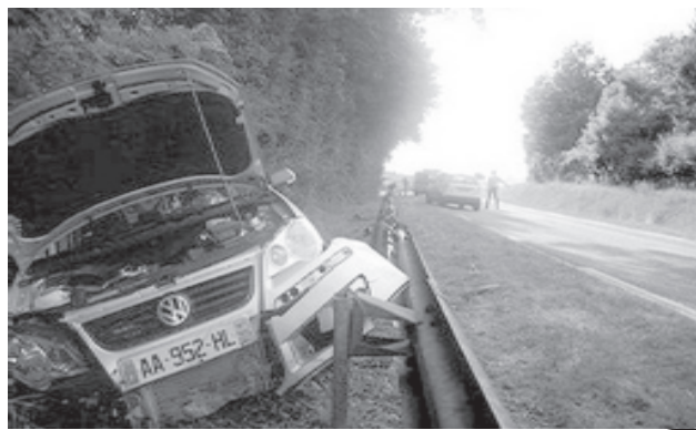
A crashed car in France in July 2009. A seven-year-old Australian boy "redefined the word lucky" on Tuesday when he managed to escape from an out-of-control car moments before it plunged off a cliff, police said.