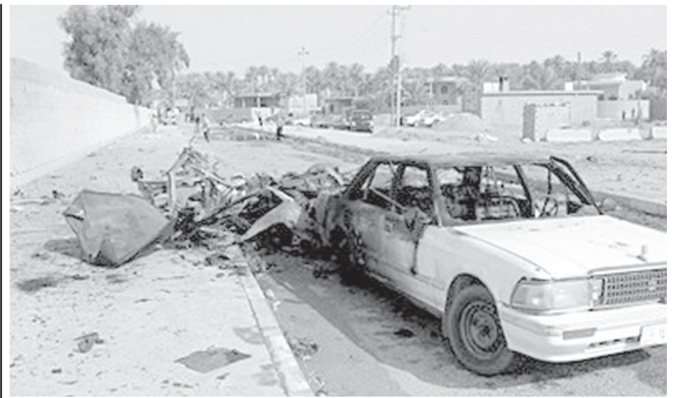
Iraqis walk towards a destroyed vehicle caught in one of two suicide bombings in the western city of Ramadi, 100kms west of the capital Baghdad, on 1 November.