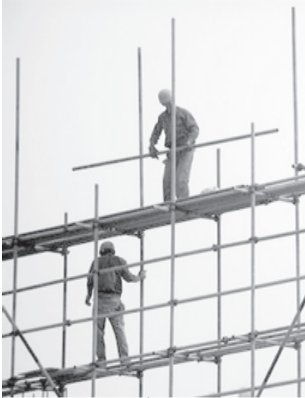
Chinese labourers at a construction site in Hefei, eastern China. The World Bank has upgraded its 2009 economic growth forecast for the country to 8.4 percent on the back of huge public spending but warned stronger domestic demand was needed to ensure a sustainable recovery.—INTERNET

They accused rich countries of backsliding on saying how deep they will rein in their greenhouse-gas pollution in the medium term.— Internet