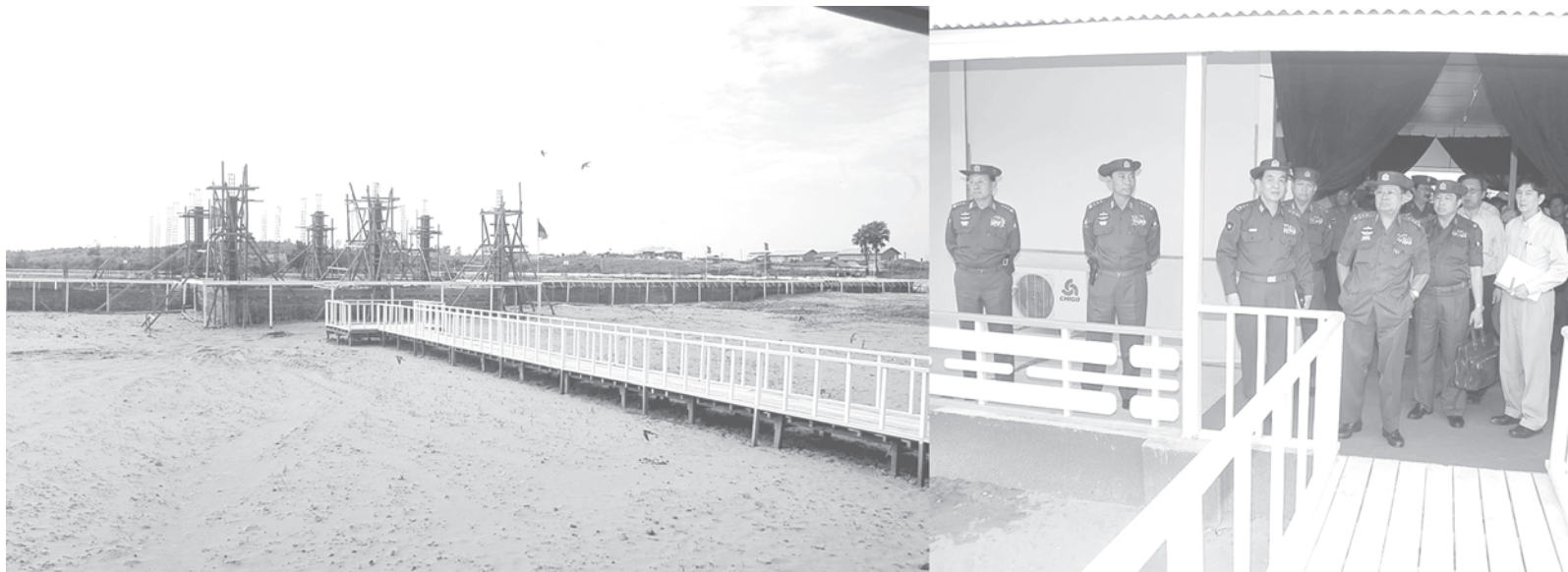
Senior General Than Shwe inspects construction of 200-bed hospital in Labutta District.—MNA

Basic Vocational Domestic Science Special Course No. 2 being conducted by the Ministry of Progress of Border Areas and National Races and Development Affairs. They viewed practical works of female trainees, teaching aid and garments and equipment.