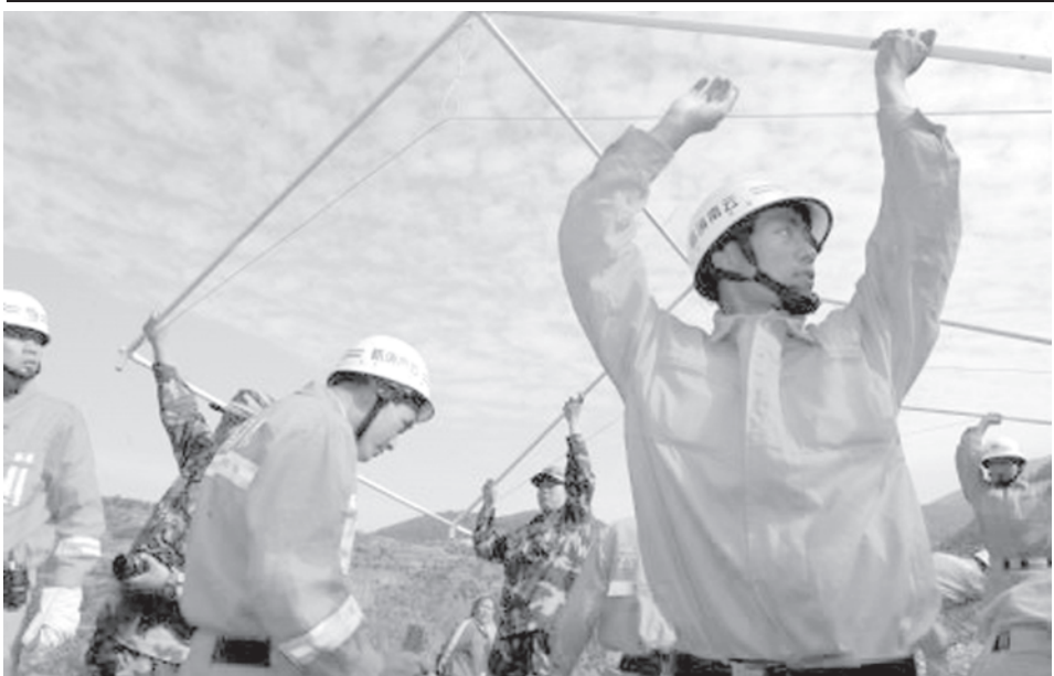
Firemen help local residents build temporary tents at Mahua Village in Binchuan County of Dali Bai Autonomous Prefecture, southwest China's Yunnan Province, on 3 Nov, 2009. Binchuan County was hit by an earthquake measuring 5 on the Richter scale early on Monday.