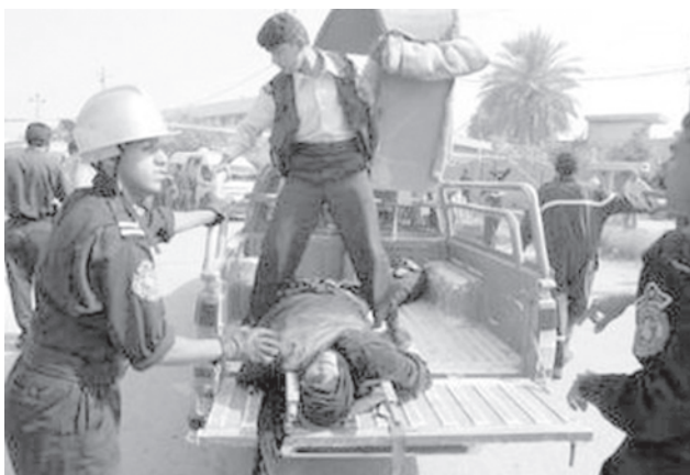
Iraqi policemen transport a wounded woman, after a bomb attack planted in a bus in Kerbala, 80 km (50 miles) southwest of Baghdad on 1 November, 2009.