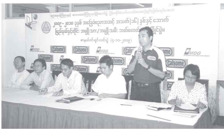
Press conference on Basic Education Level Inter-school U-16 Basketball tourney in progress. NLM

YANGON, 4 Nov— A press conference on Basic Education Level Inter-school U-16 Boys' and