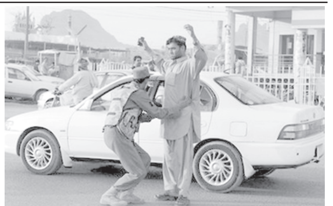
A policeman searches a man on a street in Kandahar on 1 November. Challenger Abdullah Abdullah on Sunday pulled out of Afghanistan's run-off election, plunging the country into fresh political chaos as international pressure grew for the race to be scrapped.

Howells also called for an expansion of intelligence operations abroad and greater co-operation with foreign intelligence services.—Internet