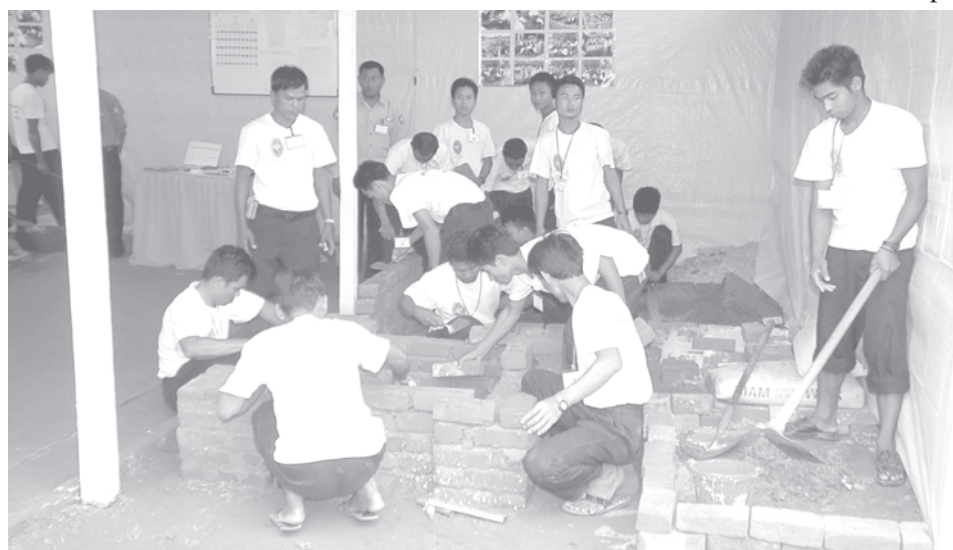
Carpentry, masonry and steel fixing course No 2 being opened at Sasana Beikman in Labutta Township.