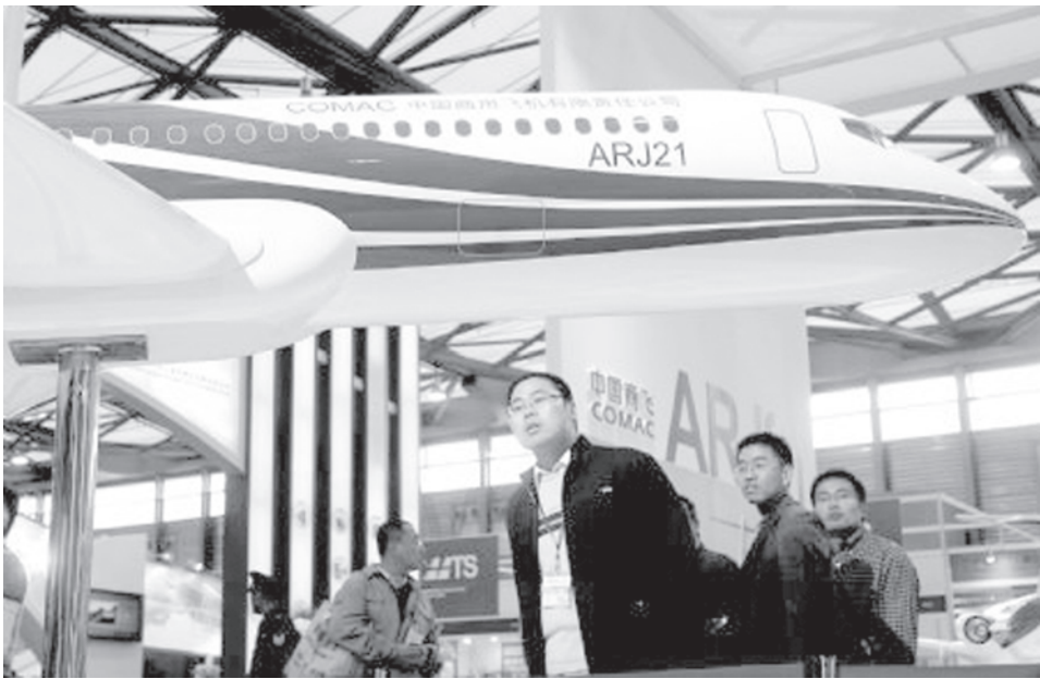
Visitors look at the model of Chinese-made ARJ-21, short for "Advanced Regional Jet for the 21 st Century", at the China International Industry Fair 2009 in east China's Shanghai, on 3 Nov, 2009.