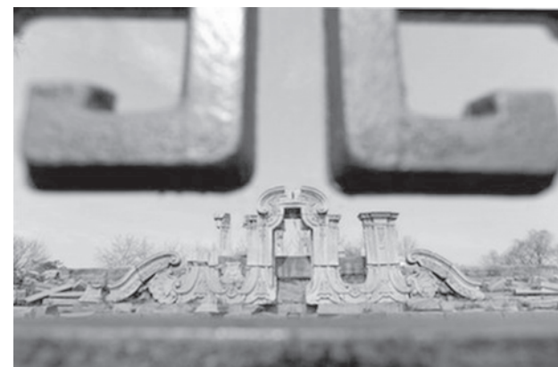
The general view shows the ruins of the Guanshuifa Fountain at the Old Summer Palace in Beijing, February 2009.