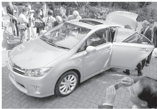
Journalists view the Toyota Motor Corp's hybrid sedan 'Sai' during the news conference in Tokyo, Japan, on 20 Oct, 2009. Toyota is coming out with a more expensive and bigger hybrid-only model than its popular Prius, the Sai.