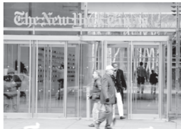
File photo taken on 10 March, 2009 shows people walking past the New York Times headquarters building in New York.