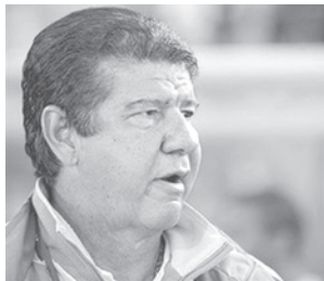
South Africa fired coach Joel Santana

JOHANNESBURG, 20 Oct—World Cup hosts South Africa fired coach Joel Santana on Monday after eight losses in nine matches, a national football association spokesman said here.