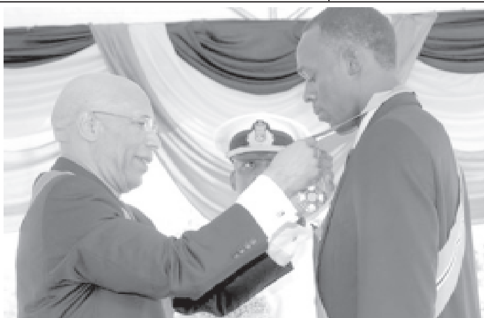
Triple Olympic and world champion sprinter Usain Bolt (R) receives the Order of Jamaica from Jamaica's Governor General Patrick Allen during Jamaica's annual National Honours and Awards ceremony in Kingston, on 19 October, 2009.