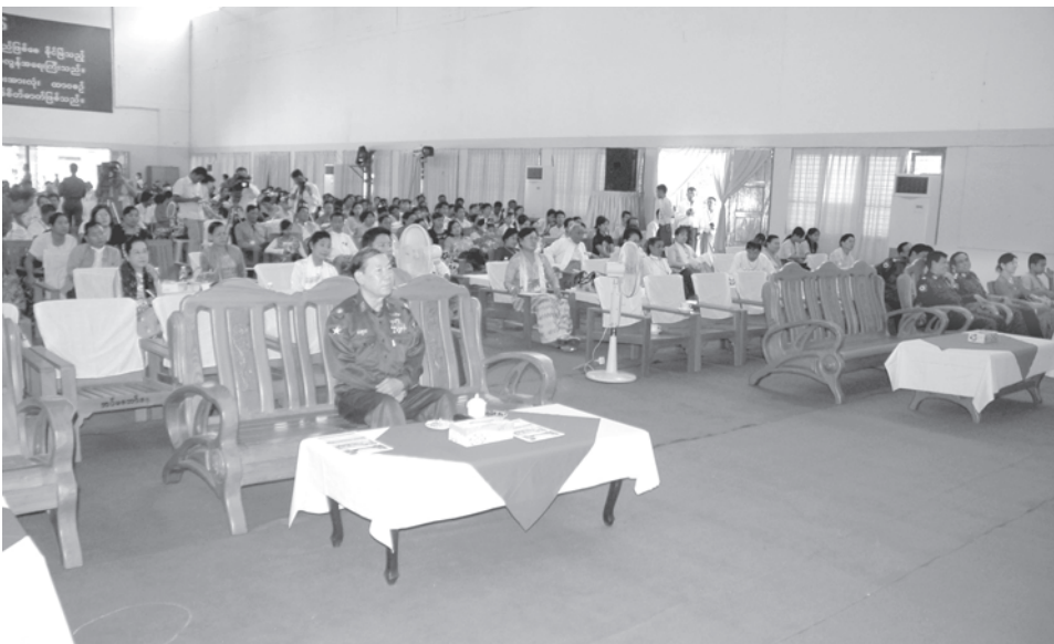
Minister Brig-Gen Lun Thi enjoys the presentations of contestants.

ter for Communications, Posts and Telegraphs Brig-Gen Thein Zaw, Minister for Energy Brig-Gen Lun Thi, Minister for Sports Brig-Gen Thura Aye Myint, Minister for Health Dr Kyaw Myint, Deputy Minister for Social Welfare, Re-