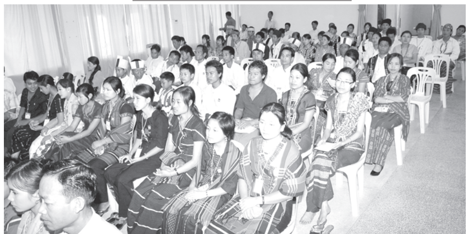
Contestants and managers from States/Divisions enjoy the performance of contestants.