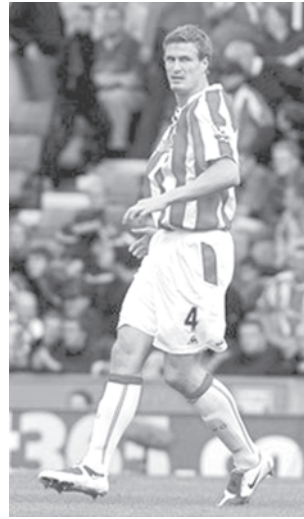
Stoke City defender Robert Huth

"I haven't spoken to the referee about it. I don't think I need to talk to him. It is down to the authorities to decide (whether further action is required) - it won't change the story for me."— Internet