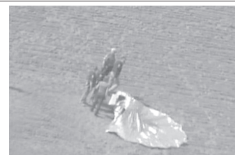
A Fox News grab showing rescuers gathering around a homemade balloon after it landed in a field. A six-year-old Colorado boy feared to have fallen to his death from a homemade helium balloon was found hiding in his garage, ending a televised drama that transfixed the nation.