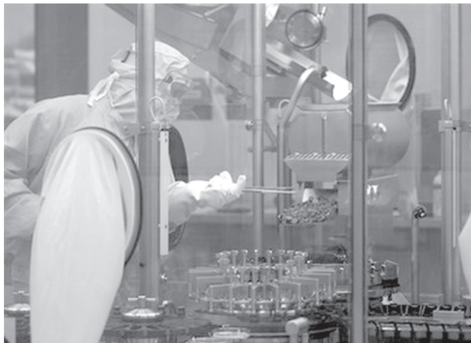
A laboratory technician is seen at a Sanofi-Pasteur production plant manufacturing Panenza, a vaccine for the H1N1 flu virus, in Val-de-Reuil, western Paris, on 19 Oct, 2009. France will begin vaccinating key medical workers against swine flu on 20 Oct, 2009.