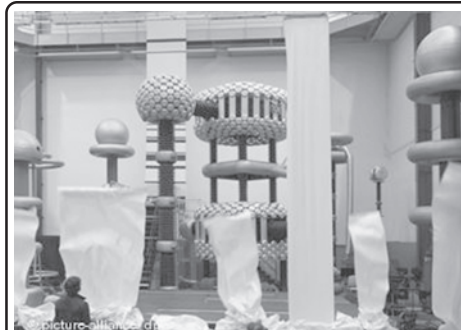
Saxony's State Opera is getting ready for a world premiere of "UT-OP er," a work inspired by 16th century English statesman Thomas More's "Utopia."

A hazardous materials team has been brought in to make sure no toxic substances were released by the blast.