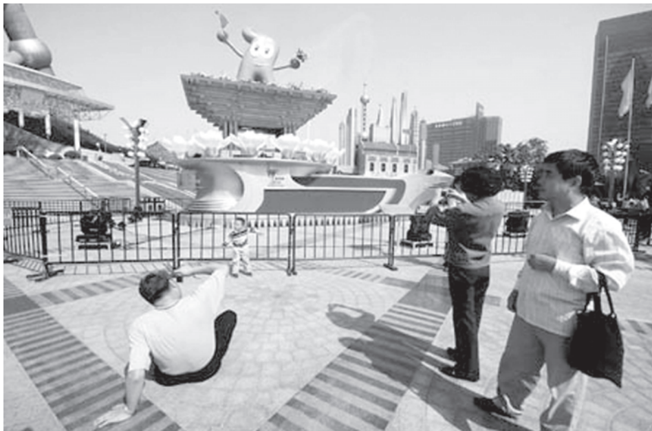
Several visitors take souvenir photos of the florid float of Soaring Shanghai, which participated in the grand parade in celebration of the 60 th anniversary of the founding of the People's Republic of China on the Tian'anmen Square on the Oct 1 st National Day, and now makes presence on the Oriental Pearl Square to start its 1-month-long public show to local citizens, in Shanghai, east China, on 18 Oct, 2009.