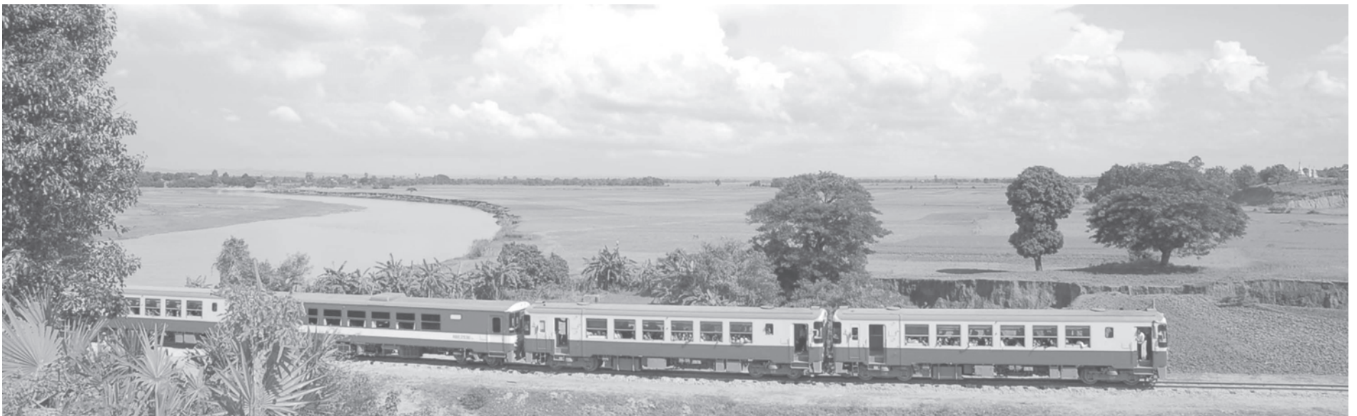
First train plying Kanma-Thayet Railroad section.

Article & Photos: Thant Zin Tun (Kyemon)