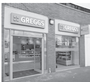
The baker Greggs, a seller of sandwiches and pastries, has announced a plan to open at least 600 shops in Britain in the coming years, creating 6,000 jobs.

The company said it hoped to open 50-60 new shops in 2011 and then at least 70 per year starting in 2011.—Internet