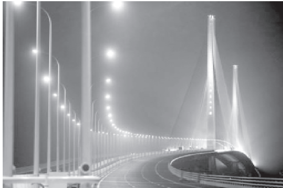
The Shanghai Yangtze Grand Bridge is brightened with dazzling illumination and looks more brilliant against the nocturnal sky, as over 1,200 road lamps being lightened in a successful overall trial illumination to present a spectacular night scene of the newly-completed Shanghai Yangtze Grand Bridge, in Shanghai, east China, on 18 Oct, 2009.—XINHUA

"We firmly oppose trade and investment protectionism in any forms, in a purpose to advance global economic recovery and sustainable prosperity," Li said.—Xinhua