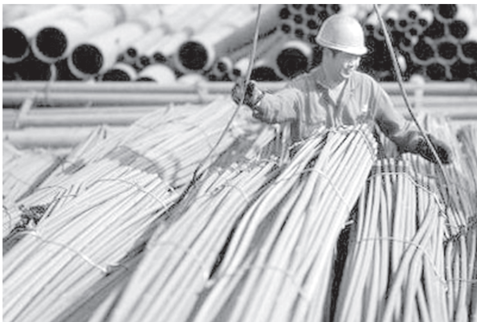
A worker transports steel bars at a steel market in Hefei, Anhui Province, on 20 Oct, 2009. China's gross domestic product grew more than 7 percent in the first nine months, a senior official from the National Development and Reform Commission said on Monday.