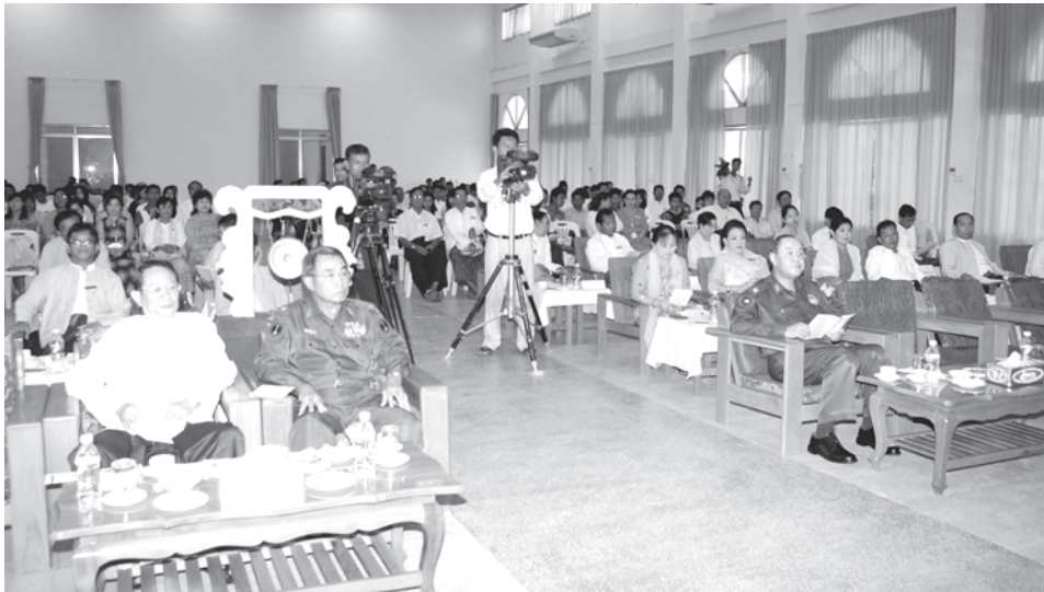
Minister Brig-Gen Thein Zaw enjoys the presentations of contestants.—MNA

egraphs Brig-Gen Thein Zaw, Minister for Energy Brig-Gen Lun Thi, Minister for Sports Brig-Gen Thura Aye Myint, Minister for Health Dr Kyaw Myint, Deputy Minister for Social Welfare, Re-