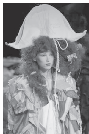
A model displays a creation by Japanese designer Aya Furuhashi at a fashion show during Japan Fashion Week in Tokyo 19 October, 2009.