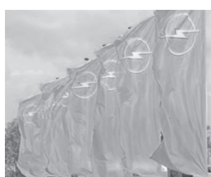
Flags outside the Opel car factory building in Antwerp in September. The top manager at struggling German carmaker Opel warned it could run out of cash within three months unless a deal to sell it off to the Canadian group Magna goes ahead quickly.