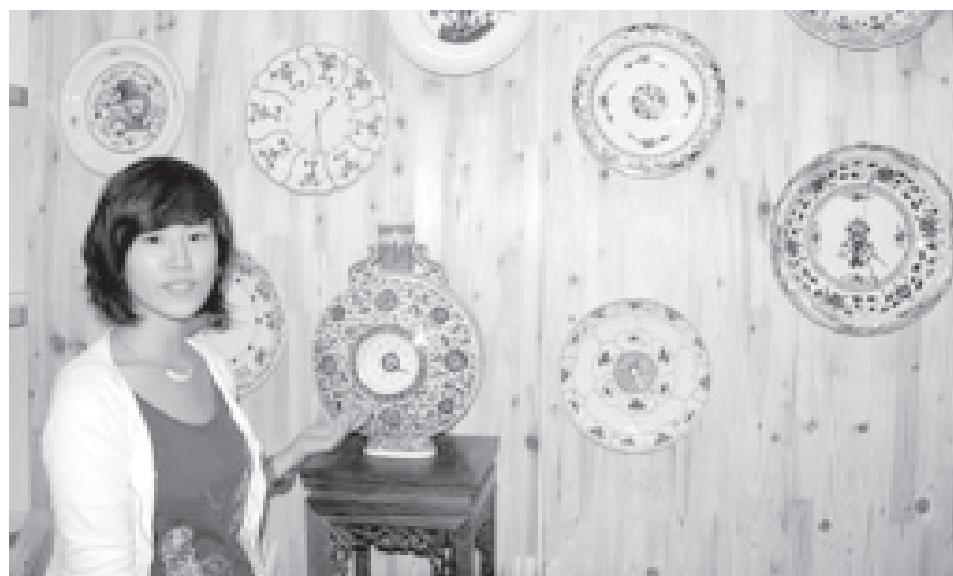
A woman shows blue-and-white porcelain clocks at the exhibition hall of 2009 China Jingdezhen International Ceramic Fair in Jingdezhen, east China's Jiangxi Province, on 18 Oct, 2009.