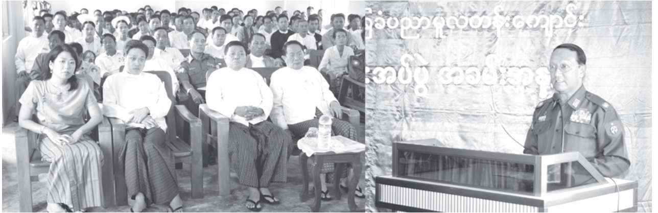
Minister Brig-Gen Thura Aye Myint delivers an address at the opening ceremony of new school building of No.2 BEPS in Thayethamein (model) village of Waw Township.—MNA

NAY PYI TAW, 20 Oct—Chairman of Bago Division Peace and Development Council Commander of Southern Command Maj-Gen Hla Min and Minister for Sports Brig-Gen Thura Aye Myint attended the opening ceremony of new school building of No.2 Basic Education Primary School in Thayethamein (model) village of Waw Township in Bago Division on 18 October.