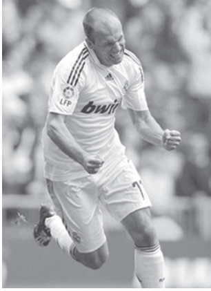
Dutch winger Arjen Robben

MUNICH, 20 Oct—Bayern Munich coach Louis van Gaal has decided against risking Dutch winger Arjen Robben for Wednesday's Champions League clash at Bordeaux.