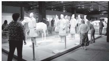
Visitors admire the displayed terra cotta warriors at the Houston Museum of Natural Science in Houston, the United States, on 18 Oct, 2009. The exhibition "Terra Cotta Warriors: Guardians of China's First Emperor" is concluded at the museum on Sunday, receiving over 200,000 visitors during its 5-month-long exhibition period.

Her passport and legal papers were ordered blocked so an investigator could examine whether she misled law-enforcement authorities. Prosecutors filed the charges, according to a statement.