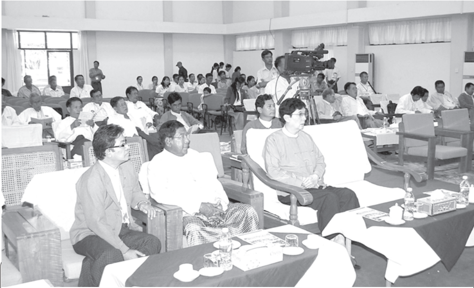
Minister Dr Kyaw Myint enjoys the performance of contestants.