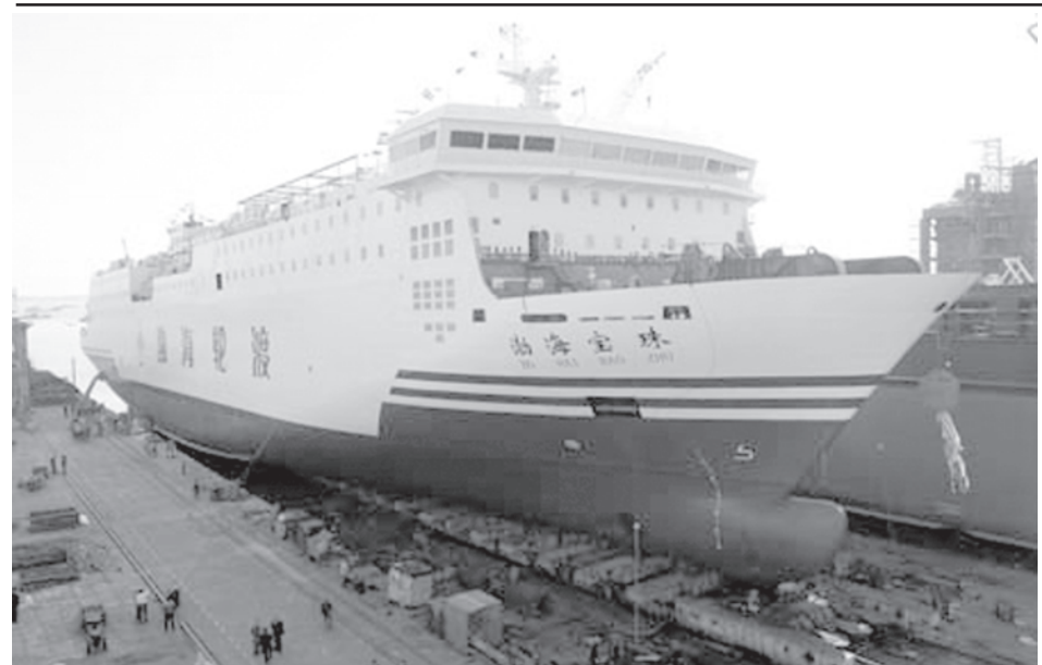
The giant luxurious Ro-Ro Passenger Vessel Bo Hai Bao Zhu (Pearl on Bohai Sea), is launched at the wharf of the dockyard of Yellow Sea Shipbuilding Co Ltd, in Rongcheng, east China's Shandong Province, on 18 Oct, 2009.