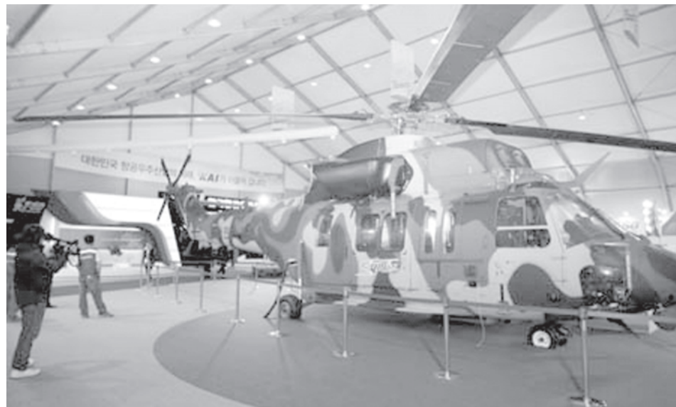
A helicopter for display is placed at an exhibition hall in Seoul Airport in Seongnam, Gyeonggi Province, South Korea, on 19 Oct, 2009. The Seoul International Aerospace and Defence Exhibition (ADEX) 2009, one of the largest arms exhibitions in Asia, will take place here from Tuesday to Sunday.—XINHUA

But some members of Hatoyama's government want the Futenma base closed and the remaining US troops moved out of Japan altogether. Okinawa residents have complained that the military bases cause too much noise and crime.—Internet