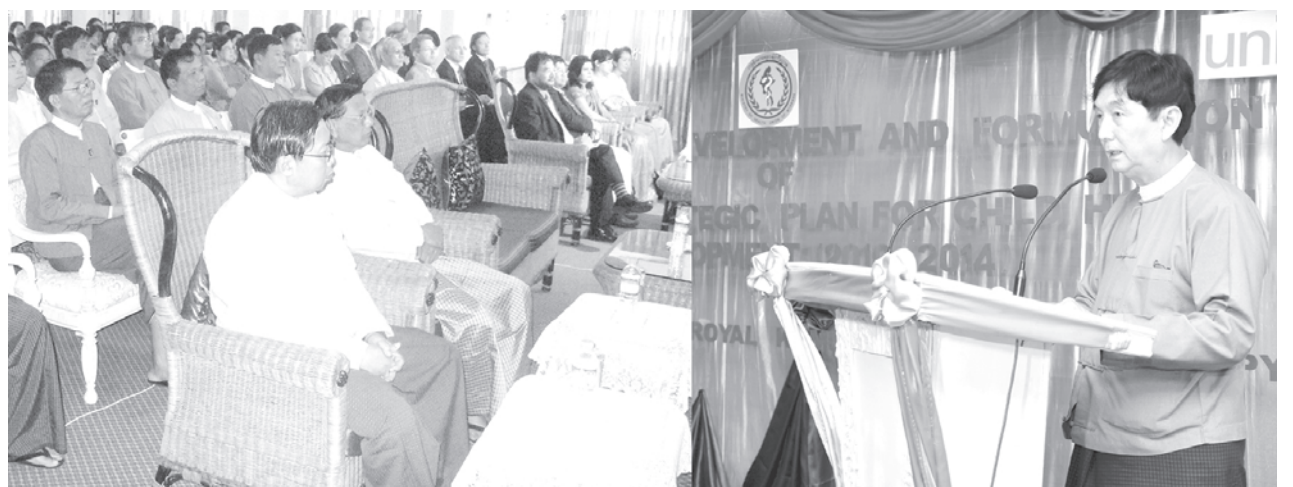
Minister Dr Kyaw Myint addresses the workshop on revision of plans for child health development.—MNA

NAY PYI TAW, 20 Oct—The Ministry of Health, World Health Or-