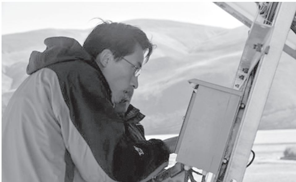
A technician debugs devices at the unmanned earthquake monitor in Tingri County, southwest China's Tibet Autonomous Region, on 17 Oct, 2009. China's first unmanned earthquake monitor has been established and put into use at 4255 metres above sea level on Mt Qomolangma.