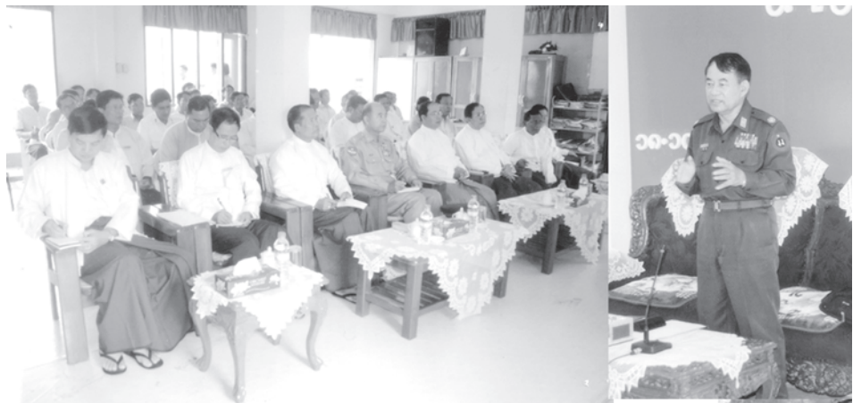
Minister Brig-Gen Maung Maung Thein meeting with departmental officials and businessmen from the fishery sector.

On 17 October, the minister attended an extempore talk on English at Pale Yadana Hall in Myeik. Students from basic and higher education level participated in the talks. MNA