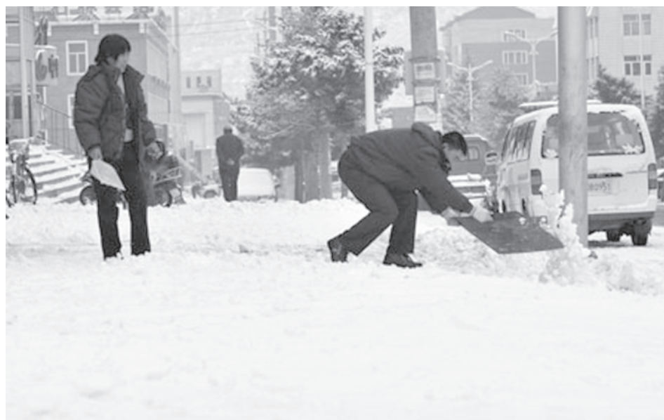
Local residents clear snow on the road in Hexigten Banner, north China's Inner Mongolia Region, on 20 Oct, 2009. A snowfall hit the area on Tuesday.