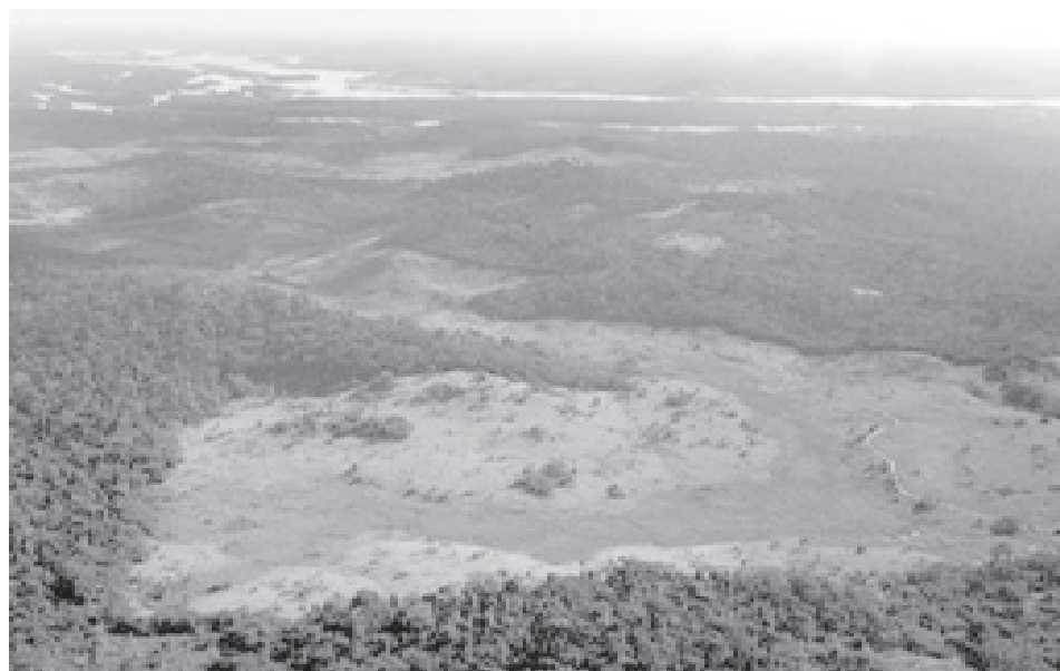
A view of a deforested area on the border of Xingu river, 140 kms from Anapu city in the Amazon rain forest, northern Brazil in 2005. President Luiz Inacio Lula da Silva said on Tuesday he will offer to reduce the pace of deforestation in Brazil's Amazon rain forest by 80 percent by 2020 when he attends December's global climate talks in Copenhagen.