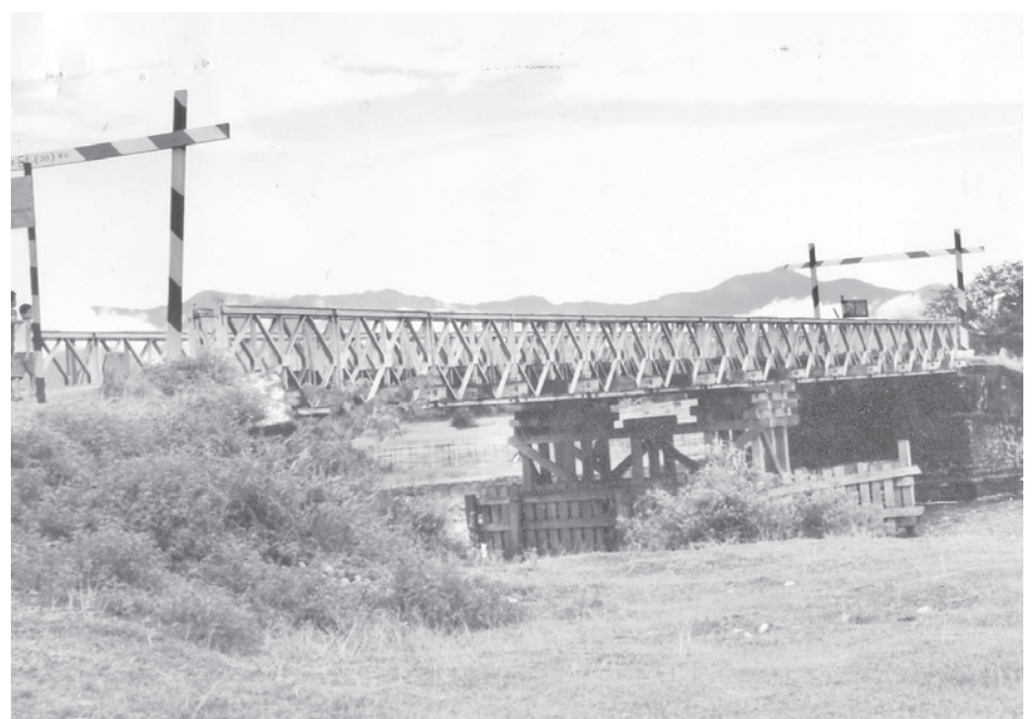
Lonesut Steel Girder type bridge on Myitkyina-Putao Road at the entrance to Putao Township.

In 2008-2009, it put 27,408 acres under monsoon paddy and 118 acres, under summer paddy. So far in 2009-2010, it has grown 28,307 acres of monsoon paddy. The monsoon paddy per acre yield was 57.91 baskets, and summer paddy per acre yield, 45.98 baskets, (See page 7)