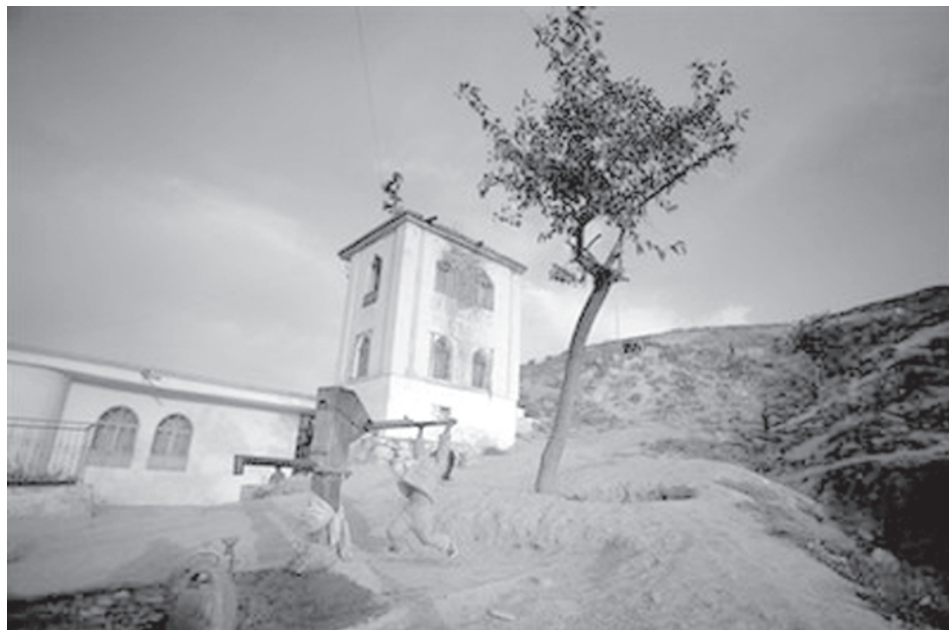
A young Afghan girl exerts all her force to fetch water from a tube well in Kabul, Afghanistan, on 13 Oct, 2009. Eight years after the fall of the Taliban, most Afghan children still don't attend school and face the prospect of a life of poverty no different from their parents. Prospects for girls are bleaker. Figures show that only about 13 percent of females over 15 years old can read or write — compared to 43 percent for males.