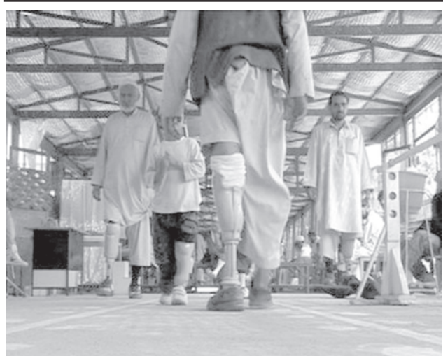
Roadside explosive devices, or IEDs, now pose a threat on many roads in Afghanistan. As the Taliban insurgency spreads, military, as well as civilian casualties are growing.