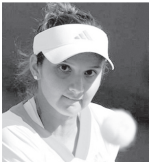
India's Sania Mirza