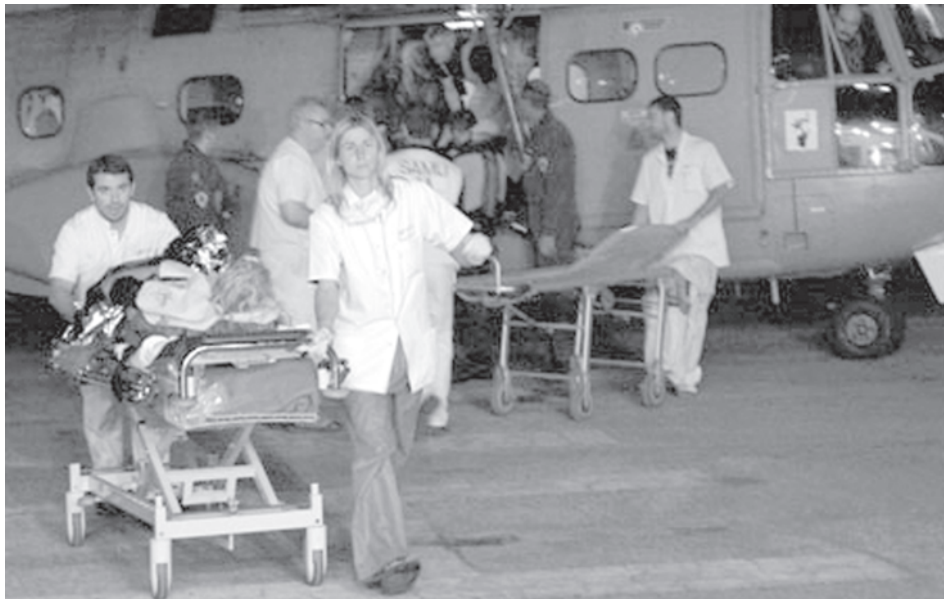
Six people, including the pilot, all survived and were rescued after their light plane plunged into the sea near the French island of Corsica on 12 Oct, 2009.