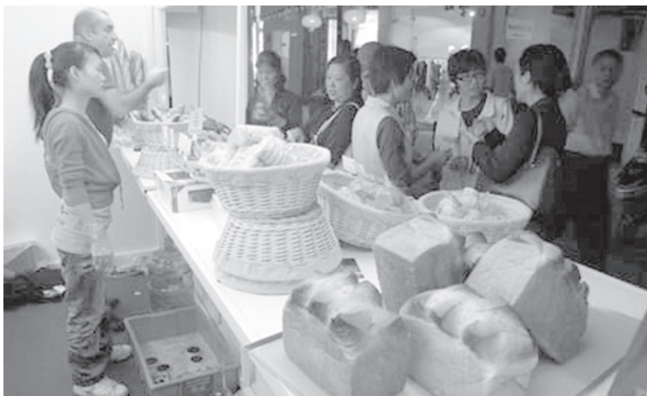
People are attracted by the delicious food during the 8 th France Week in Shanghai, east China, 12 Oct, 2009. The 7-day France Week in Shanghai displayed automobile, wine, food, fashion design, tourism and culture with France characters.—XINHUA