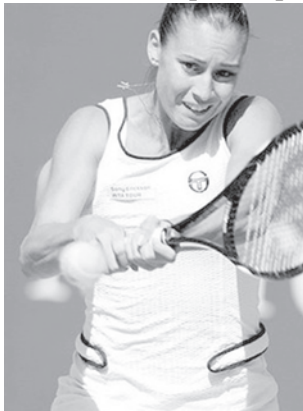
Flavia Pennetta of Italy

LINZ, 14 Oct—Flavia Pennetta kept herself in contention for a place in the WTA Championships