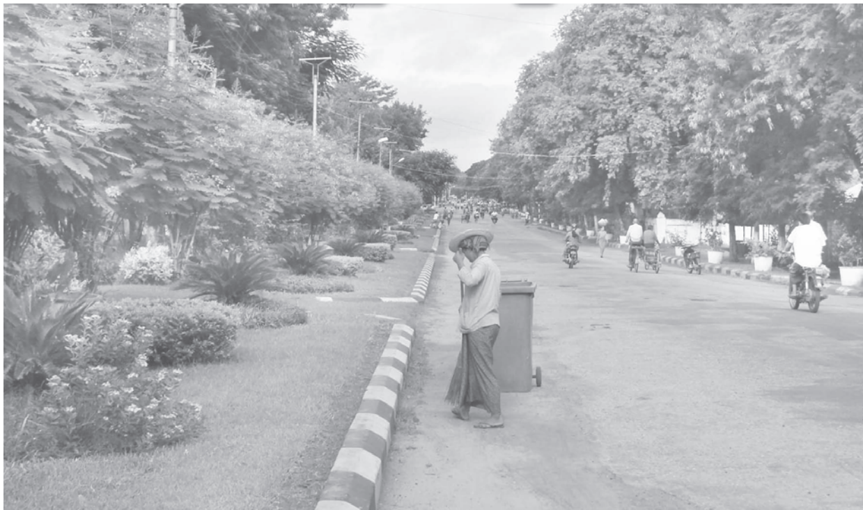
A smooth road in downtown Taungdwingyi.