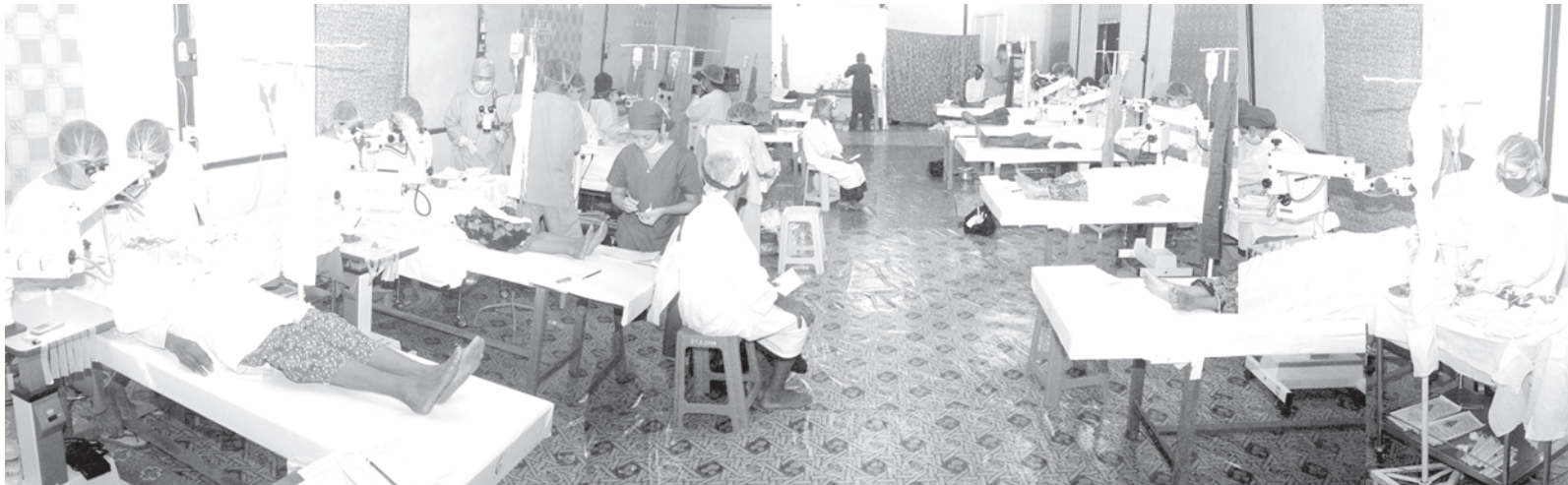
Eye specialists performing operations on patients with eye complaints from Kyaukpadaung Township.

The minister, wife and officials presented sunglasses and eye drops to the patients and officials gave talks on eye care knowledge. International Beverages Trading Co Ltd donated medicines, medical equipment and cash for the free eye care services.