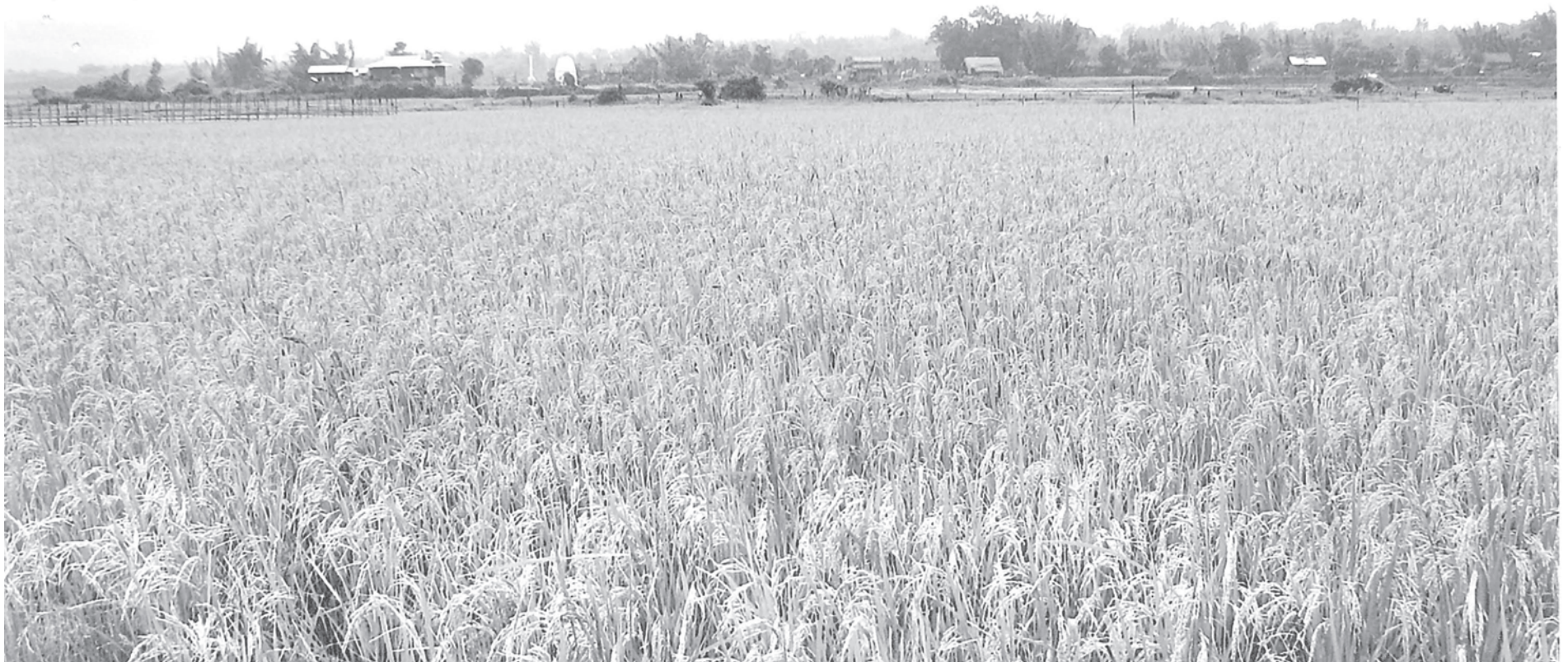
A thriving paddy field near the entrance to Putao Township in Kachin State.

It was on 26 September 2009, I was on board the airplane flying at an altitude of 16,000 feet to Putao in the northernmost part of Myanmar which is famous for snow-capped mountains.