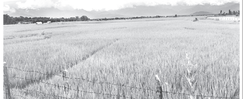
A thriving paddy field in Airport Ward, Putao Township.

Putao District is pursuing the target of 51,750 acres of monsoon paddy for 2009-2010. Thanks to the close supervision of local