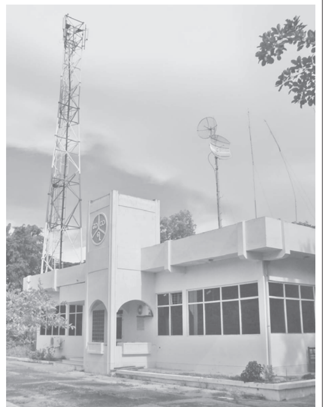
MPT Tower in Taungdwingyi.