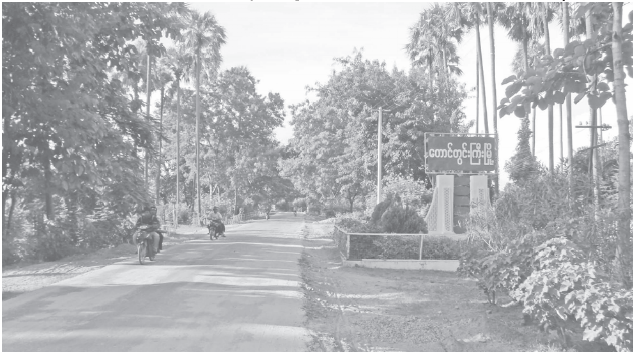
Entrance to Taungdwingyi welcoming with shade trees.

crew, proceeded to the tube well of in Maungtaing ward (1). "The Municipal took responsibility in township water supply before 1948. In the years 1987-1990, Japan U.W.S.P established 10 artesian wells as part of the Nine Town project. But no water was pumped out from six wells in about 1993-1996. There had already been three wells before the project. So, we are now supplying water from eight wells including the extended one in 2005-2006.", explained Engineer U Win Naing.