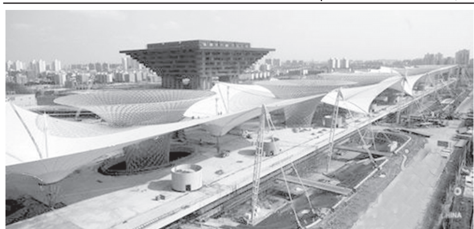
A general view of the Expo Boulevard at the World Expo site in Shanghai on 10 Oct, 2009. The construction of the Expo Boulevard, a large, integrated commercial and traffic complex, has entered the stage of "fine decoration."

The authors note that looking at naturally occurring cancer biology and treatment in animals, known as comparative oncology, is not a new concept. In the last 30 years, they say this approach has advanced treatment of several cancers including osteosarcoma — a bone cancer — and melanoma, a deadly form of skin cancer.— Internet