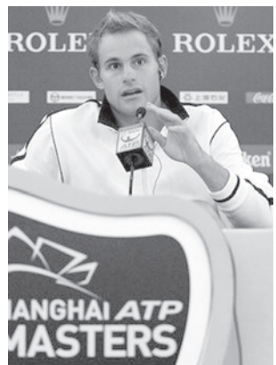
Andy Roddick of the US talks to the press in Shanghai after being forced to retire after injuring his knee in a second-round match at the Shanghai Masters.

ach for treatment before giving up and shaking hands after 36 minutes on court.—Internet