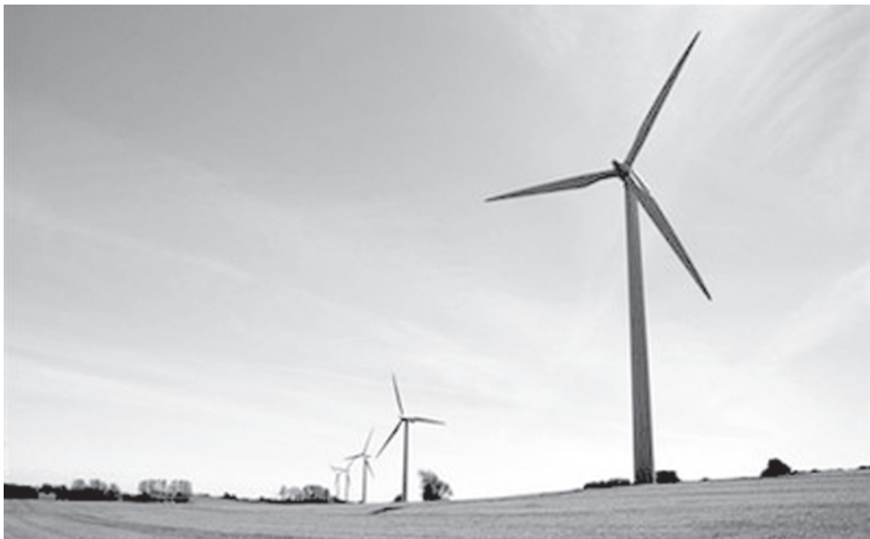
View of wind generators set up in a wind farm in Denmark in June 2009. Germany will help Bosnia to develop its energy sector and improve environmental standards with financing worth 60 million euros (89 million dollars), the German embassy announced on Tuesday.