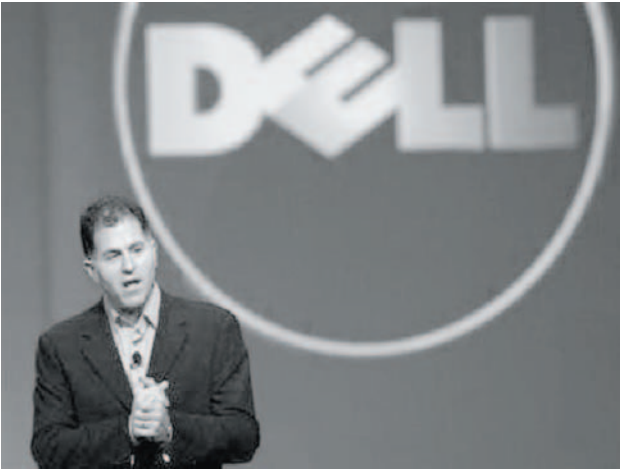
Dell Inc. Chief Executive Officer Michael Dell speaks during his keynote address at Oracle Open World in San Francisco, California, on 13 Oct, 2009.

SANTA CLARA, 14 Oct—Dell Inc Chief Executive Michael Dell said the business climate was improving and repeated his expectation for a “powerful” hardware refresh cycle beginning next year.