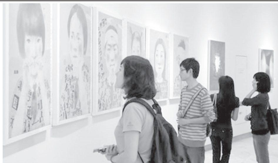
Visitors watch the artworks exhibited at the ongoing 11 th Art Design Exhibition of the National Art Exposition in Shenzhen, south China’s Guangdong Province. A total of 460 pieces in the categories of industrial, graphic and finery designing were displayed in the exhibition.