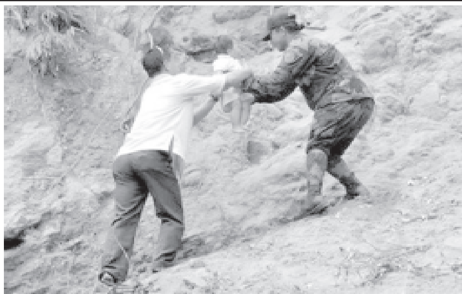
Philippine policemen help transfer a child to the other end of the cut-off highway in the town of Tuba, in Benguet Province near Baguio City, north of Manila, on 12 October.

al-Qaeda since a suicide bomber injured Assistant Interior Minister Prince Mohammed bin Nayef in the western seaport of Jiddah on 27 Aug. The attacker was a member of the Yemen-based al-Qaeda in the Arabian Peninsula.—Internet