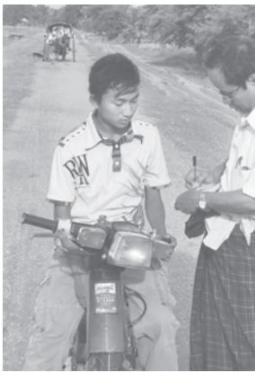
Ko Zeya Thura Maungtaing (2), Taungdwingyi.

GSM tower was established on 1 March 2009, first tested in 1 April and it could be utilized by 355 users. There were also many PCO boxes in urban area. So, it could be noted as a town of good