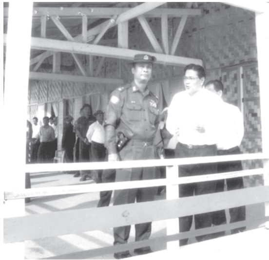
Commander Maj-Gen Kyaw Swe inspects the construction of Rasudine Bridge No-2 on the Maubin-Shwetaunghmaw-Kyaikpi-Mawlamyinegyun Road.—MNA