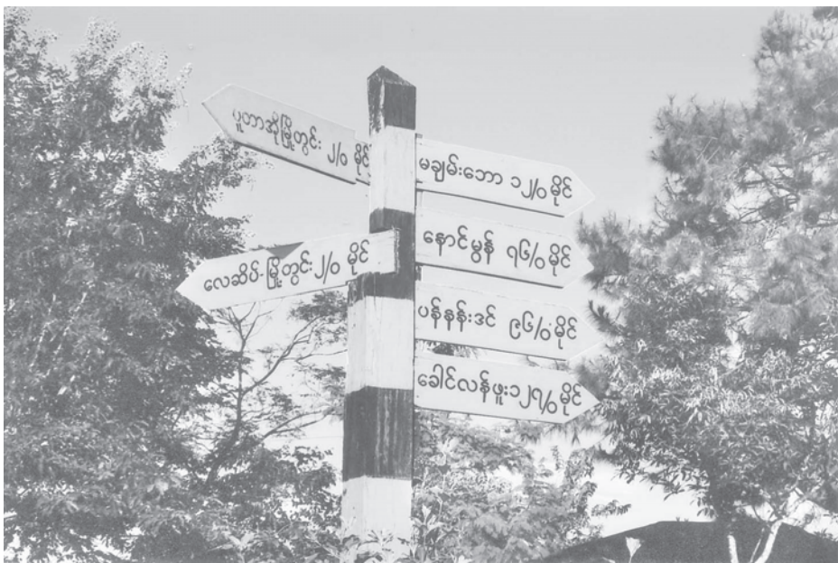
A road indicator at Putao Airport junction.

12,000. Having many mountains, the township is in no position to grow monsoon paddy on a large scale, only 5413 acres. Its rice supply is only 63.98 percent. It gets average annual rainfall of 105.95 inches.