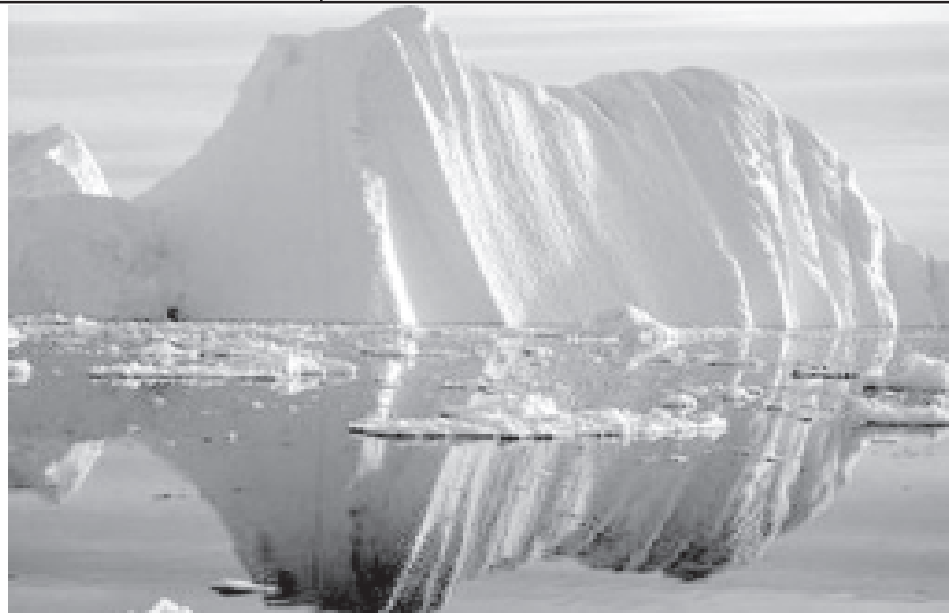
An iceberg carved from a glacier floats in the Jacobshavn fjord in south-west Greenland in this undated handout photograph released on 20 September, 2006.