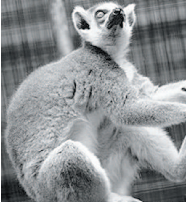
Lemur catta : A ring-tailed lemur ( Lemur catta ) sits on a tree in its enclosure at the zoological gardens in Hong Kong.