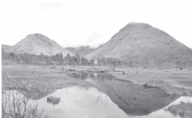
Lwesamsit mountain on Kutkai-Hsenwi road.

With respect to health care, it has two people's hospitals (25-bed), three people's hospitals (16-bed), seven rural health care centers, 35 rural health care centers (branch) and two station hospitals. Mongs station hospital is now being built and has been completed by 75 percent.