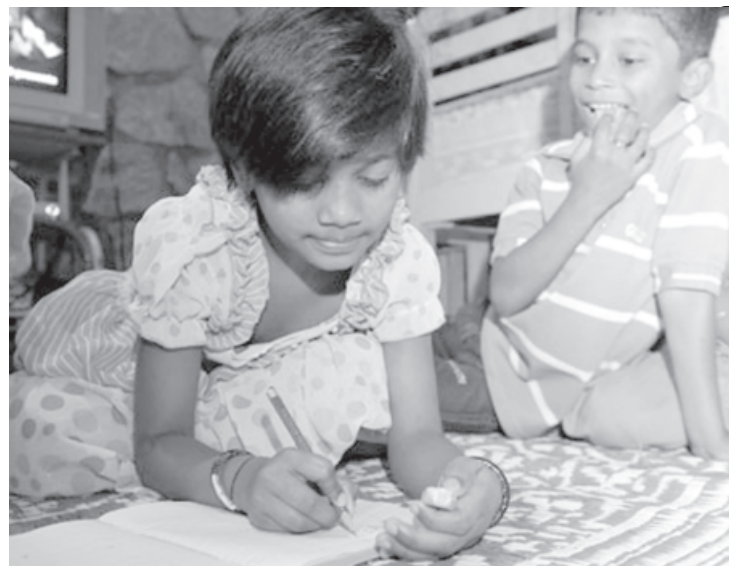
An orphan does her homework at the SOS Children's Village in Bangalore, on 10 Oct, 2009. Founded in 1988, the SOS Children's Village in Bangalore now has 16 families, with 8 to 10 orphans adopted for each.