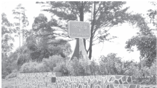
Signboard shows entrance to Kutkai Township.

Kutkai Township, included in Muse District of Shan State (North), is located on Muse-Lashio-Mandalay Union Highway. It shares borders with Muse Township in the North, Thanlwin River and Kunlong Township in the east, Hsenwi Township in the south and Namhkam Township and Namtu Township in the west.