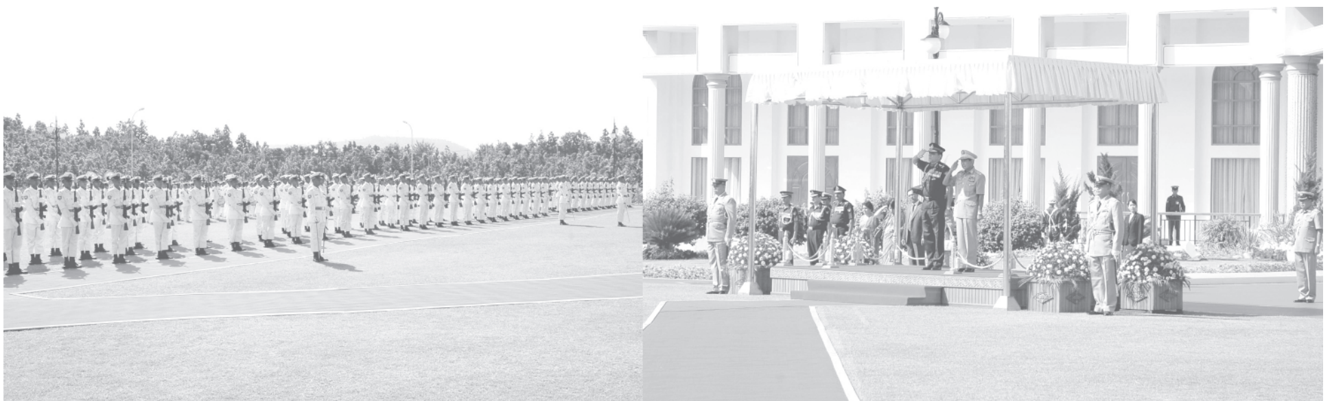
Vice-Senior General Maung Aye and General Deepak Kapoor take the salute of the Guard of Honour.