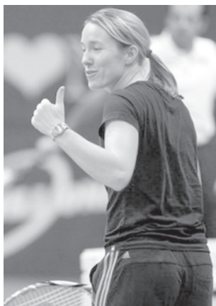
Former world number one Justine Henin

SYDNEY, 12 Oct—Former world number one Justine Henin has been granted a wildcard to play in the 2010 Australian Open in her return to tennis, organizers said on Monday. The 27-year-old Belgian, who won the Australian Open in 2004, announced last month that she was ending her self-imposed retirement to come back to the women's tennis circuit.