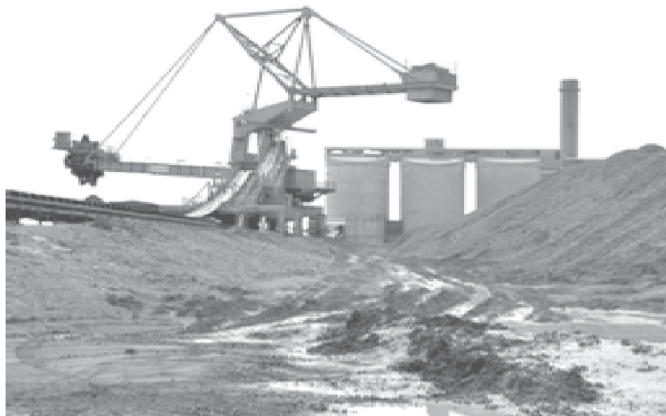
File photo shows bauxite being processed at a factory run by Guinea's largest mining firm, Compagnie des Bauxites de Guinee (CBG) , at Kamsar, a town north of the capital Conakry. Guinea is the world's leading exporter of bauxite, an ore from which aluminium is produced. Guinea's ruling regime is in talks with China over investment in its natural resources