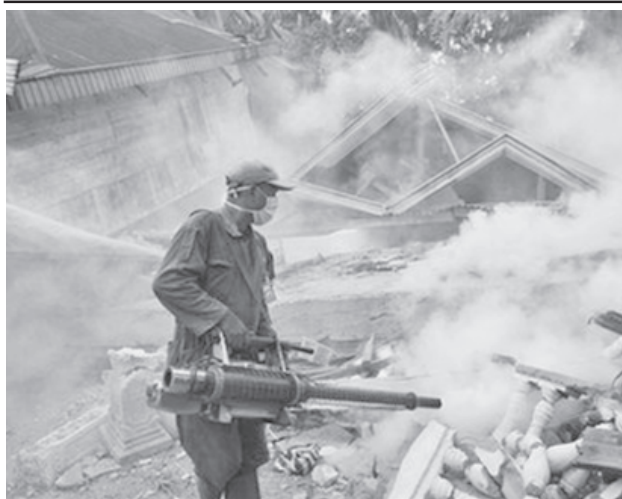
A worker sprays insecticide to prevent dengue fever at a neighborhood affected by an earthquake in Padang Pariaman, Indonesia, on 12 Oct, 2009. The 7.6 magnitude temblor devastated a stretch of more than 60 miles (100 kilometers) along the western coast of Sumatra island on 30 Sept.