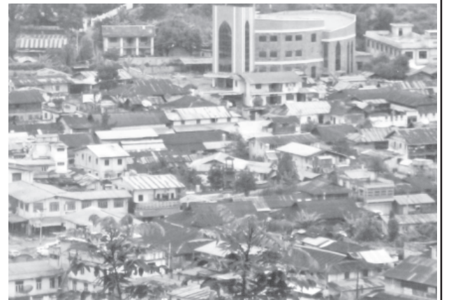
An aerial view of Kutkai Township.

Thanks to smooth transport, 13 bus lines run in the township. Shwethraphu, Hteiktanaung and Yehteiktan bus lines run on Kutkai-Lashio-Muse road, Yemanaung, Shwenyinaung, Kwutkahingman, Kwutkahing shweman and Shweman bus lines, on Kwutkahing-Lashio-Mandalay road, Nawarat bus line, on Kutkai-Tarmoene-Mongs-Lashio-Muse road, Lucky and Hein Htet bus lines, on Kutkai-Lashio-Muse-Mandalay road and Arthit and Shwele bus lines on Kutkai-Lashio road. With regard to Township roads, it has Kutkai-Lashio (tarred road) (58 miles),