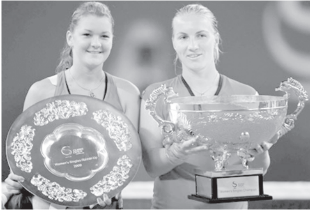
Svetlana Kuznetsova of Russia (R) and Agnieszka Radwanska of Poland hold up their trophies during the awarding ceremony after women's singles final at the 2009 China Tennis Open Tournament in Beijing, on 11 Oct, 2009.