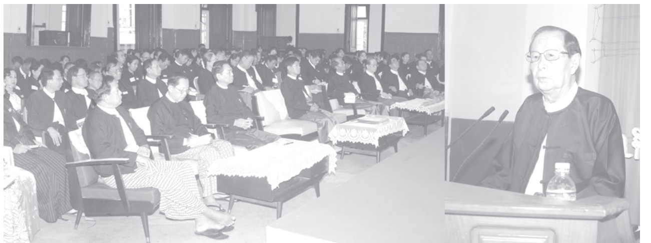
Chief Justice U Aung Toe addresses the concluding ceremony of Refresher Course No.6 for township judges.