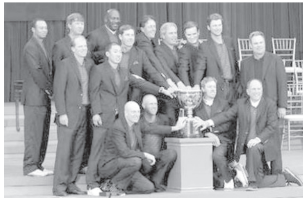
Members of the US team pose with the trophy after winning the Presidents Cup golf tournament at Harding Park golf course in San Francisco, California, on 11 Oct, 2009.

His 6-and-5 victory over Y.E. Yang was a tiny token of revenge for Woods blowing a final-round lead to him in the PGA Championship this summer. Even so, it was the first time in either the Presidents Cup or Ryder Cup that Woods earned the decisive point. And he didn't even know it.