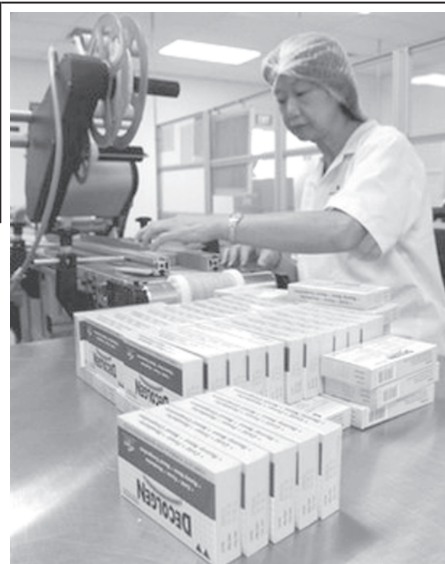
A worker is seen on the production line at a pharmaceutical firm in Singapore. Growth in the third quarter in the city-state was driven by expansion in the biomedical and electronics manufacturing industries, which are the key pillars of the country’s industrial sector.