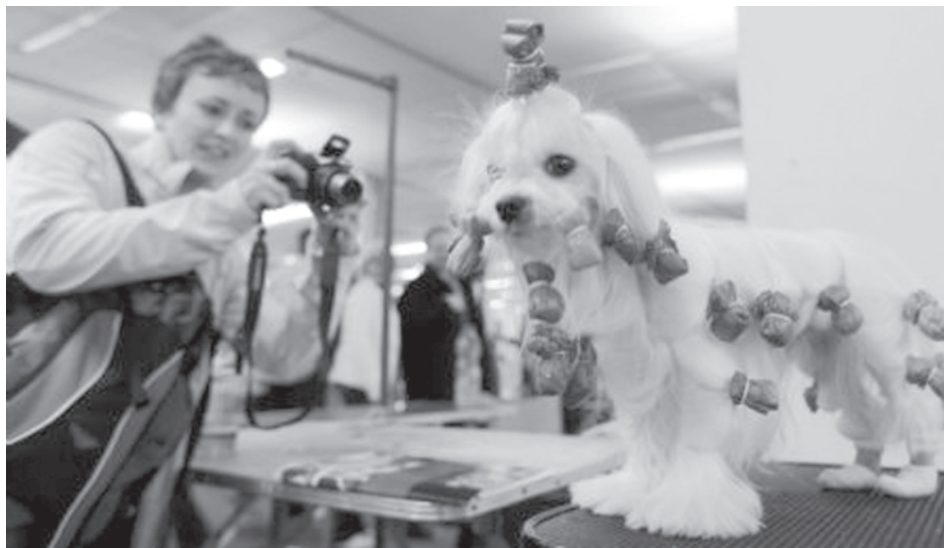
A visitor takes a picture of a poodle during the World Dog Show in Bratislava on 10 October, 2009. The dog show which is on until Sunday, saw more than 30,000 dogs from 59 countries registered for the event.— INTERNET

The college is lobbying the government for opt-out opportunities allowing surgeons to work up to 65 hours a week, the newspaper said.— Internet