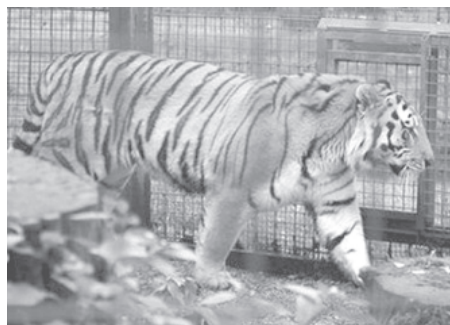
Vitali the Siberian tiger roams in his cage in the Calgary Zoo in Calgary, Alberta.

Alerted to the situation, security guards took the alleged intruders to their office, where the injured man was treated before being rushed to hospital. Police are investigating.