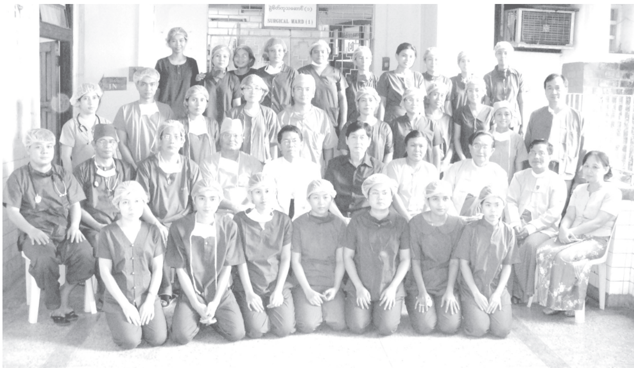
Minister Dr Kyaw Myint poses for a documentary photo together with surgical team.—MNA