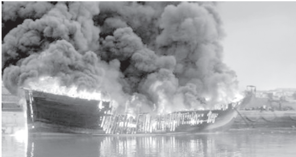
A boat carrying oil catches fire in the commercial port town of Bossasso in the semi-autonomous northeastern Somali region of Puntland, on 10 Oct, 2009. The boat was engulfed in flames after workers trying to off load the consignment of oil. The accident caused brief suspension of work at the port.