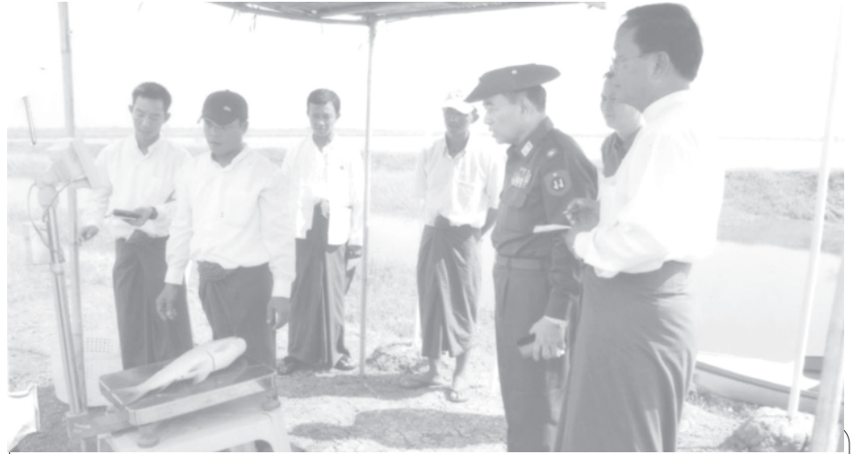
Minister Brig-Gen Maung Maung Thein inspects No. 6 fish breeding camp (Mee-thway-chaung).—MNA

Next, the minister looked into progress in breeding of 6-month old fishes.—MNA