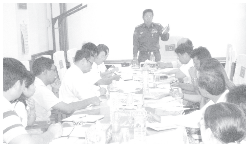
Deputy Minister Brig-Gen Myint Thein addresses coord meeting of construction of Cyclone Shelters.—MNA

It was attended by Deputy Minister for Construction Brig-Gen Myint Thein who called for completion of work in the open season.—MNA