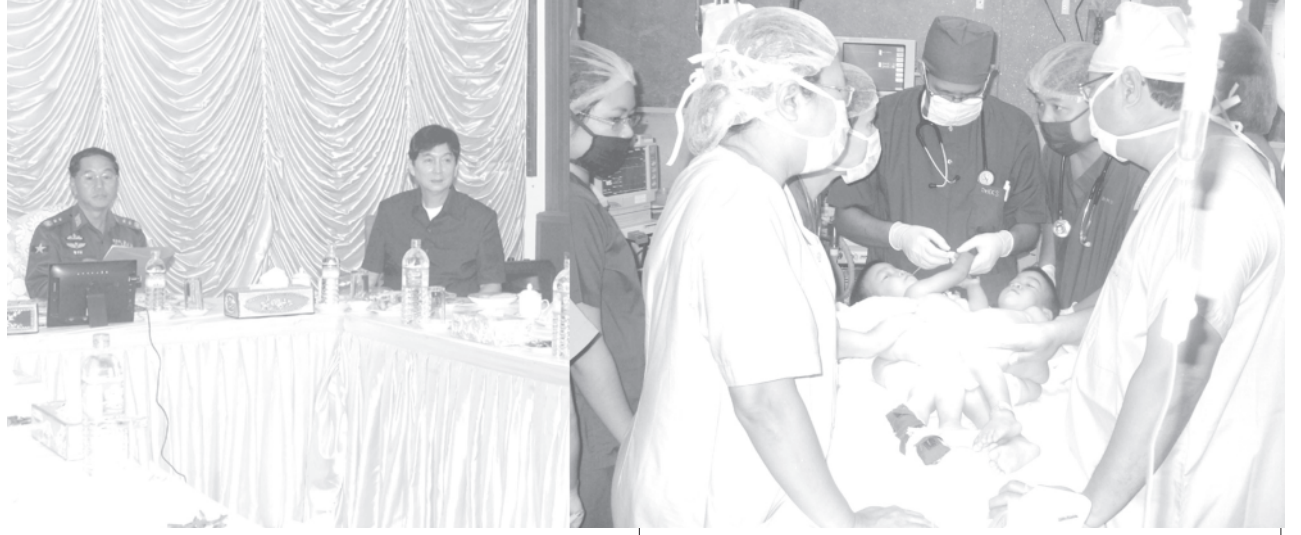
Lt-Gen Myint Swe and Minister Dr Kyaw Myint view surgical operation on conjoined twins. MNA

electrolyte beverage for the operation. The operation was successfully performed at 1.15 pm. The minister had a documentary photo taken together with the surgical team.