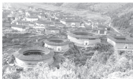
Photo taken shows the Chuxi Tulou, earth buildings in Chinese, in Yongding County, southeast China's Fujian Province. Built on a base of stone, the thick walls of Tulou were packed with dirt and fortified with wood or bamboo internally. The architectural arts of the Fujian Tulou can be traced back nearly 1,000 years, and their design incorporates the tradition of fengshui (favorable siting within the environment).