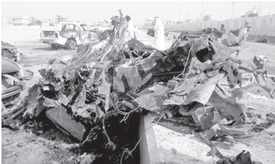
Photo shows the site of twin car bombs in Ramadi, the capital of Anbar Province in western Iraq, on 11 October. Twin car bombs and an apparently coordinated suicide attack killed 19 people in Ramadi on Sunday.