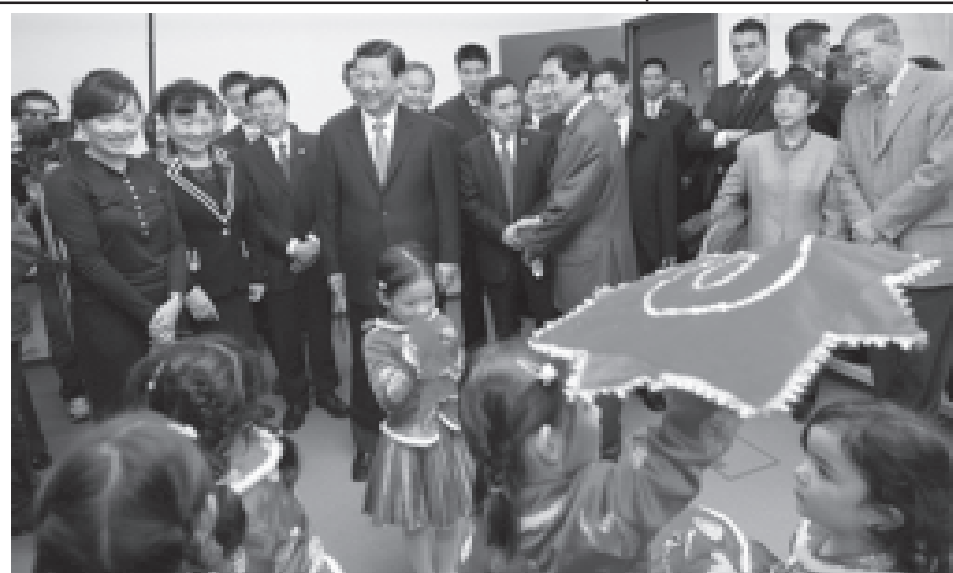
Chinese Vice President Xi Jinping (4 th L, front) watches the performances by children at the Chinese Culture Center in Berlin, capital of Germany, on 11 Oct, 2009.