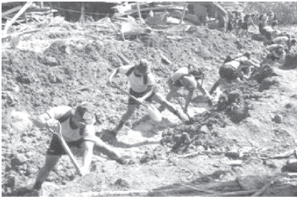
Philippine police rescuers search for more missing landslide victims at Puguis village in La Trinidad, Benguet, in northern Philippines on 12 October, 2009.