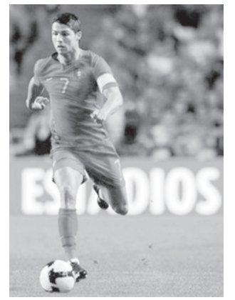
Real Madrid striker Cristiano Ronaldo will not be fit to play in Portugal's final World Cup qualifier against Malta.

LISBON, 12 Oct—Real Madrid striker Cristiano Ronaldo will not be fit to play in Portugal's final World Cup qualifier against Malta on Wednesday. Ronaldo had shaken off a twisted ankle to start Saturday's Group One clash against Hungary, but lasted just 27 minutes of the 3-0 victory at the capital's La Luz stadium.