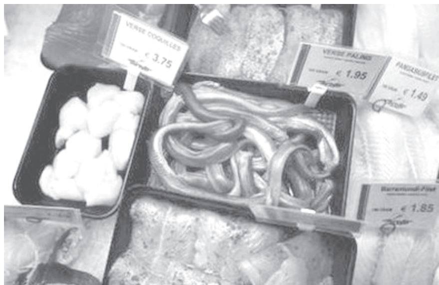
Fresh eel is displayed in a cooler at a fish monger in the southern Dutch village of Oud Bijerland on 28 Sept, 2009. Fishing for plump, fattened eels that the Dutch consider a delicacy smoked on toast or in bread—and which are eaten in stews across Europe—is no longer allowed during October and November. The government ban is aimed at stemming a 95 percent slide in the European eel population in the past four decades. Picture taken on 28 Sept, 2009.—INTERNET

The group were supposed to arrive at the Sudbury airport on Saturday evening but did not turn up on time. A search and rescue team scouring the provincial park located the plane early on Sunday morning in an area only accessible by plane or helicopter, Const. Carolle Dionne of the North Bay Ontario Provincial Police detachment told reporters on Sunday.—Xinhua