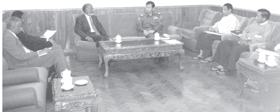
Deputy Minister for Energy Brig-Gen Than Htay meets with Deputy Minister of Foreign Affairs of the Republic of Sudan Mr Ali Ahamed Karti and party.