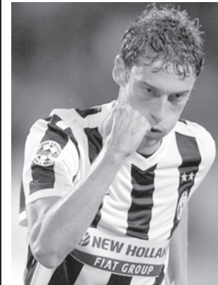
Juventus' Claudio Marchisio.

ROME, 9 Oct — Juventus midfielder Claudio Marchisio will miss Italy's World Cup qualifiers against Ireland