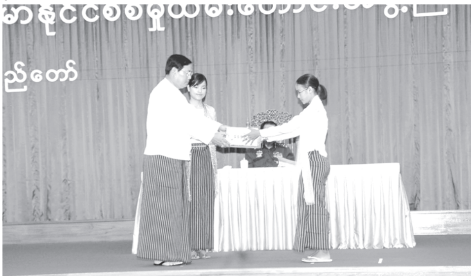
Lt-Gen Thura Myint Aung presents cash award for outstanding students for their higher education.