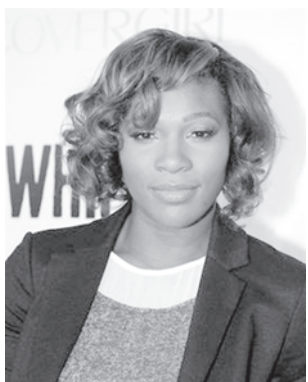
American tennis superstar Serena Williams.