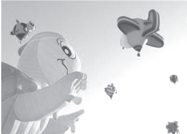
Special shaped hot air balloons fill the sky during the Albuquerque International Balloon Fiesta in Albuquerque, NM, on Thursday, 8 Oct, 2009. The annual event is scheduled to wrap up Sunday.