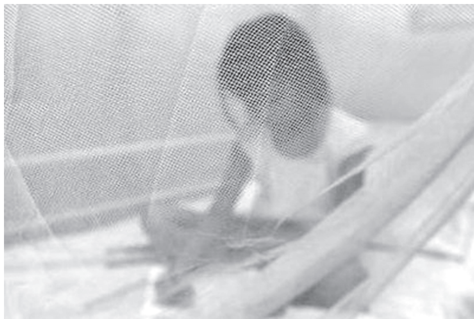
A girl with dengue fever draws while sitting on her bed behind a mosquito net in a hospital in Managua on 8 October, 2009. According to Nicaraguan health authorities, ten children have died and more than 1,500 people are infected with the tropical illness transmitted by mosquitoes.