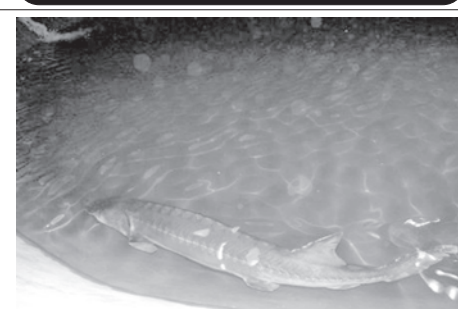
The male Chinese sturgeon which attended the total artificial propagation is seen at the Chinese Sturgeon Research Institute (CSRI) of the China Three Gorges Corporation in Yichang, central China's Hubei Province. Chinese scientists announced here on 1 Oct that the artificial propagation of the rare Chinese sturgeon would no longer count on wild fish as they have made successful artificial insemination and spawning of cultured sturgeons.