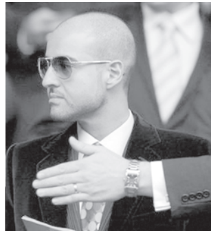
Prince Faisal bin Fahd bin Abdullah al-Saud.