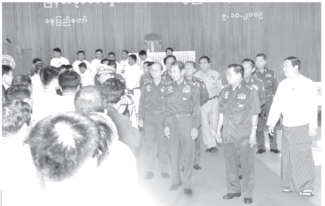
Senior General Than Shwe cordially greets delegates of States and Divisions who are attending Myanmar War Veterans Organization Conference (2009).