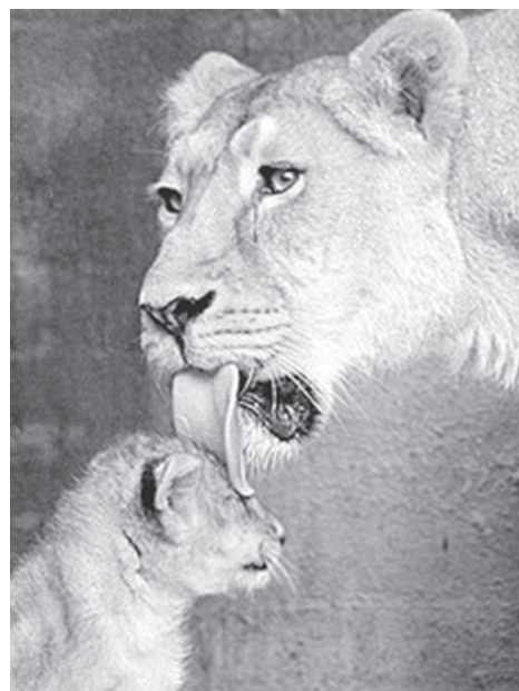
An Asian lioness is pictured with one of her two 10 week-old cubs at London Zoo. Spanish police said they were looking for a lioness that had been sighted by several witnesses on the loose in the mountains of eastern Spain.

It was not clear where the lioness came from although Spanish media reported that the animal may have escaped from a circus.