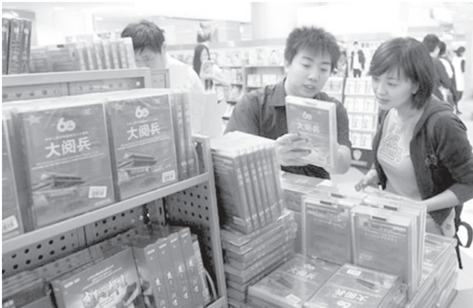
Readers purchase the DVD of the Grand Parade, recording the National Day celebrations, including the military parade, grandiose pageant and the evening gala during the grand celebrations of the 60 th founding anniversary of the People's Republic of China, at the Beijing Books Building, in Beijing, on 7 Oct, 2009.