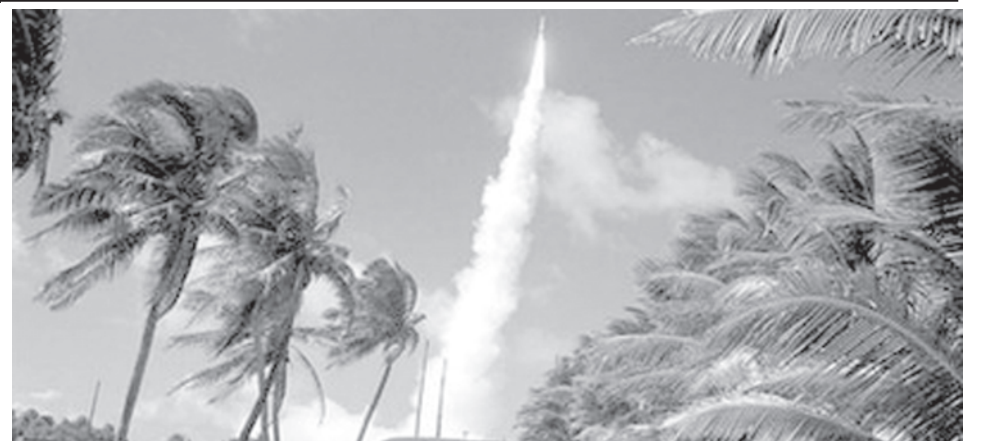
A rocket is launched from the Reagan Test Site in Kwajalein Atoll in the Marshall Islands. A powerful traditional chief in the Pacific island chain is suing the western nation’s government over a treaty which gives the US the use of his land for a missile testing base.