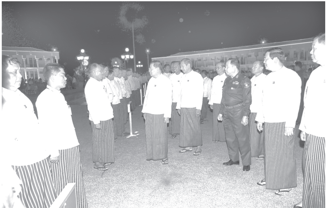
Senior General Than Shwe cordially greets delegates of States and Divisions to MWVO Conference (2009).

At 7 pm, the Senior General arrived at Bayintnaung Yeiktha where he was welcomed by Vice-Chairman of the State Peace and Development Council Deputy Commander-in-Chief of Defence Services Commander-in-Chief (Army) Vice-Senior General Maung Aye, Member of the State Peace and