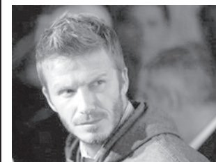
England midfielder David Beckham.