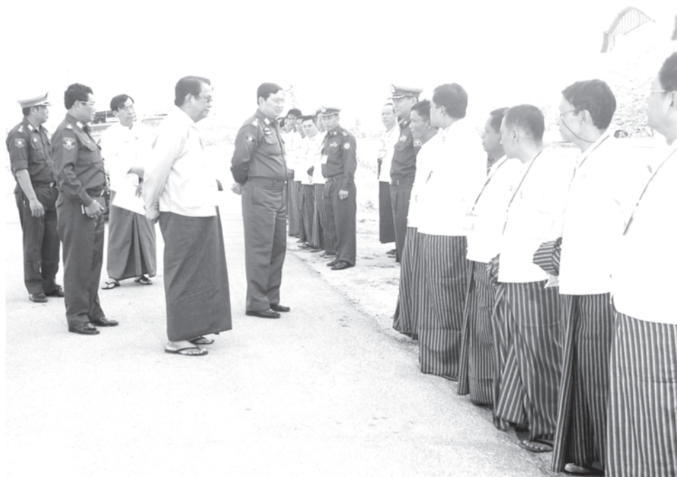
Lt-Gen Thura Myint Aung cordially greets delegates of States and Divisions attending the MWVO Conference (2009).