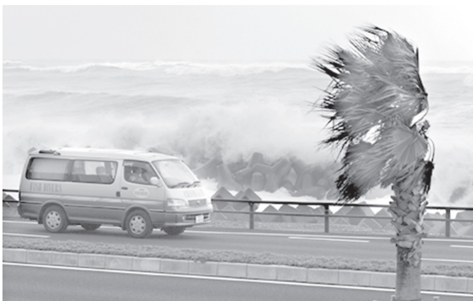
A van passes by strong waves striking barriers in Shizuoka City, west of Tokyo on 8 October, 2009. A strong typhoon barreled into Japan's main island on Thursday, disrupting transport and prompting warnings of landslides and floods, although there were no reports of serious damage.—XINHUA

A Participants ride in a homemade go-kart during a soapbox race in Jerusalem on 7 October, 2009. More than 50 homemade go-karts competed in the race in Jerusalem on Wednesday.—XINHUA