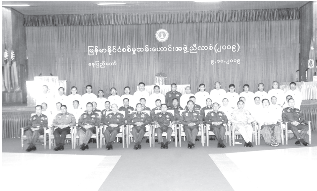
Senior General Than Shwe, members of the Panel of Patrons and CEC members of MWVO pose for a group photo together with chairmen of State/Division MWVO Supervisory Committees.

So, you have to work with correct concept and stands, trying with the sense of camaraderie to take organizing measures inside and outside the organization, dealing with national races throughout the nation.