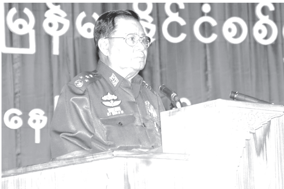
Senior General Than Shwe delivers an address at second-day session of MWVO conference (2009).—MNA

Senior General Than Shwe addresses second-day session of MWVO conference