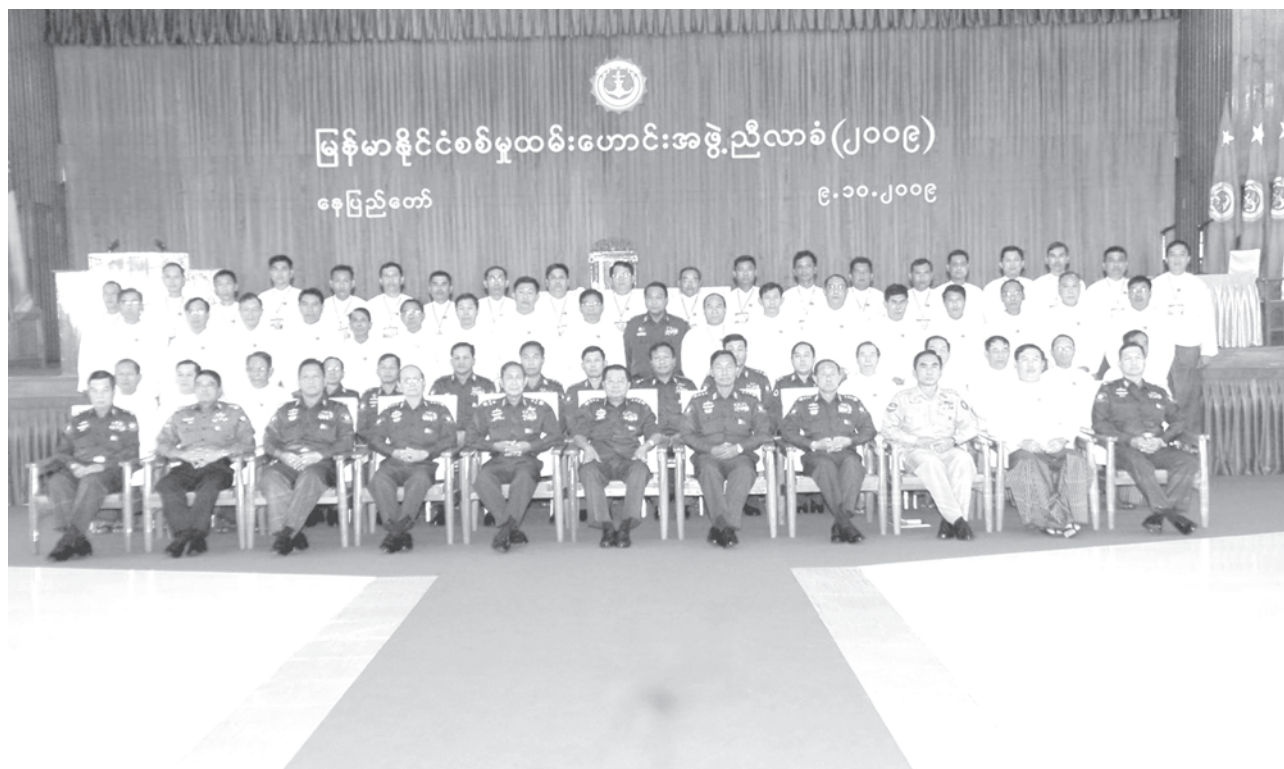
Senior General Than Shwe, members of the Panel of Patrons and CEC members of MWVO pose for a group photo together with chairmen of State/Division MWVO Supervisory Committees.—MNA

Tatmadaw government had to work hard for proper evolution of a constitution in order to introduce democracy and the market economy in compliance with the desire of the people. The government convened the National Convention with representatives from the states and divisions including representatives from political parties, representatives-elect, peasants of national races, intellectuals and intelligentsia, State service personnel and other invited persons. The State Constitution Drafting Commission drafted the constitution based on the principles adopted through discussions. A referendum was held in May 2008, and the draft constitution was approved with the votes of the great majority of the voters. There will soon be follow-up programmes in accordance with the