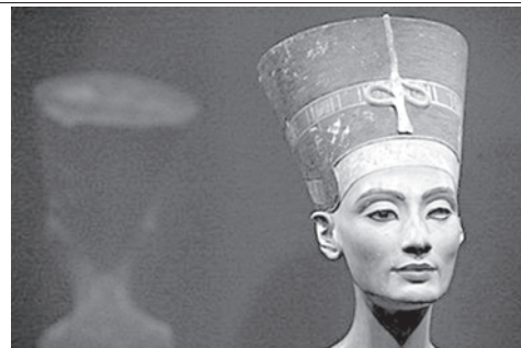
The bust of one of history's great beauties, Queen Nefertiti of Egypt, after returning to Berlin's Museum Island, in 2005. The bust of Nefertiti, believed to be 3,400 years old, has been moved gingerly to its new home in Berlin before it is to go back on display this month, the city's museum authority said on Monday.

The report said the child, who had driven the truck previously, was not injured.