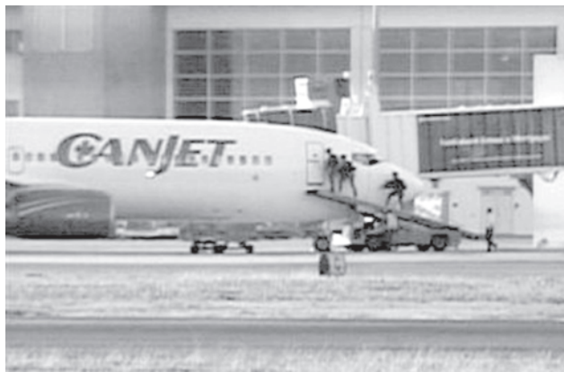
Jamaican soldiers stand on a ramp beside a CanJet aircraft in Montego Bay, Jamaica, in this frame grab taken in this 20 April, 2009 file photo. A would-be hijacker who held more than 180 people at gunpoint aboard a Canadian charter jet in Jamaica in April was jailed for 20 years on Thursday.