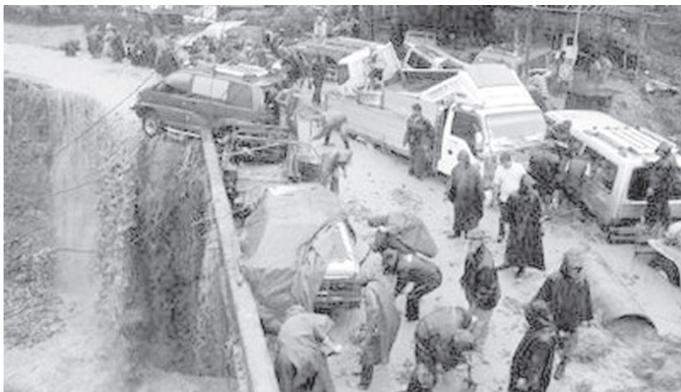
Rescuers try to recover vehicles after a landslide caused by rains from tropical storm Parma in La Trinidad, Benguet, north of Manila on 8 October, 2009. A week of relentless rains in the northern Philippines have put dozens of towns and villages under water, with more than 100 people drowned or killed by landslides, officials said.