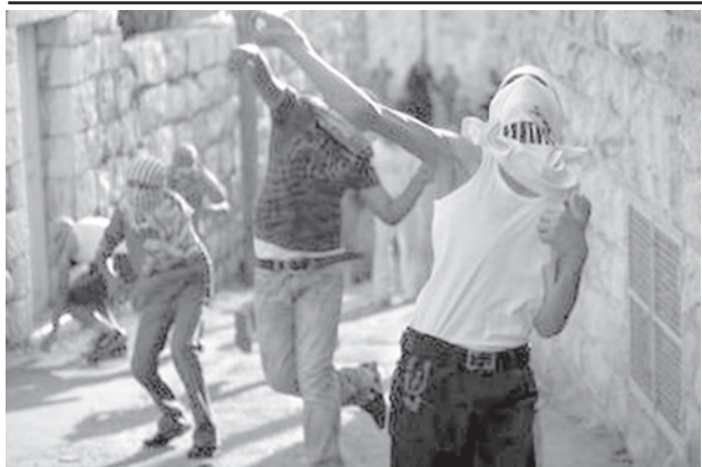
Palestinians throw stones towards Israeli border police officers (not pictured) in the East Jerusalem neighbourhood of Ras al-Amud on 8 Oct, 2009.

SHIPPING AGENCY DEPARTMENT MYANMA PORT AUTHORITY AGENT FOR: M/S REGIONAL CONTAINER LINES Phone No: 256908/378316/376797