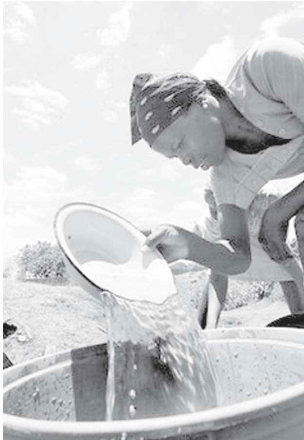
This file picture shows a Zimbabwean woman fetching water from an unprotected well in Harare. African policy makers meet in Ouagadougou Friday to discuss climate change just two months before a critical UN summit where African countries are poised to seek billions in compensation for the effects of global warming.—INTERNET

However, Africa needs “to make it clear to countries that have achieved their economic development to the detriment of the environment that they have to take responsibility and reduce their greenhouse gas emissions and help the continent most vulnerable to climate change,” he said.— Internet