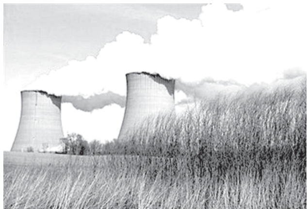
Steam billows from cooling towers at a nuclear power generating station in Illinois. Denmark's climate minister predicted that a UN summit in Copenhagen in December would not reach a global climate accord without the backing of the United States to aggressively cut greenhouse gas emissions.—INTERNET

Yildiz said oil drilling work with Petrobras will last for about two or three years and end up with considerable amounts of oil reserves.—Xinhua