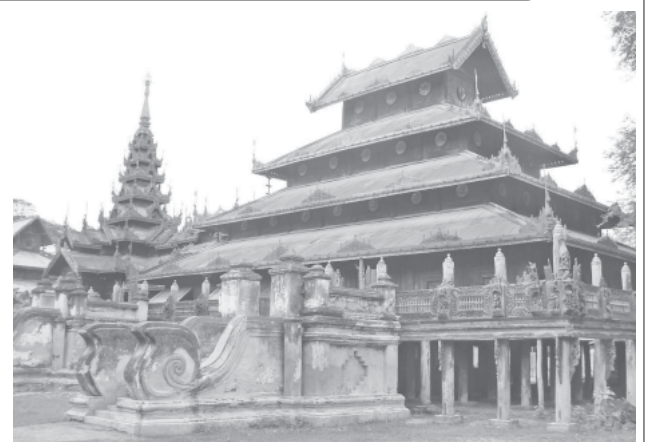
A wooden religious edifice in Magyeegan Village in the north of Salin Township.