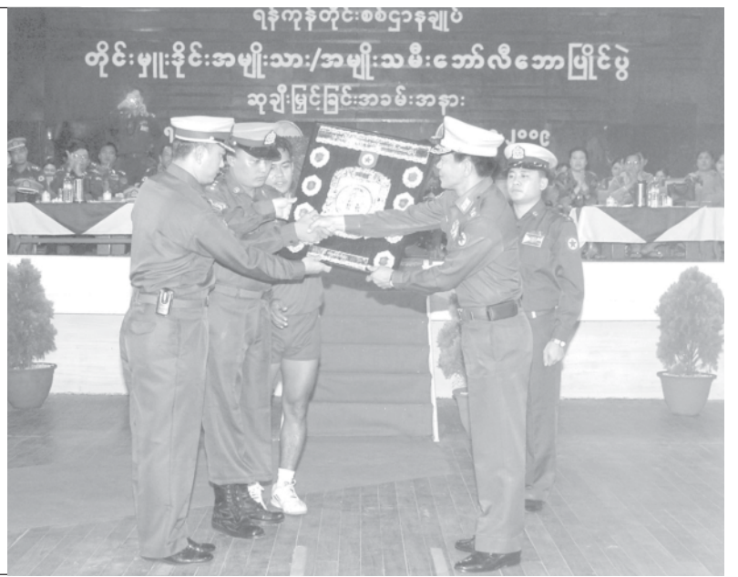
participants. After the commander and party had enjoyed the prizes to the winners. finals, they presented MNA