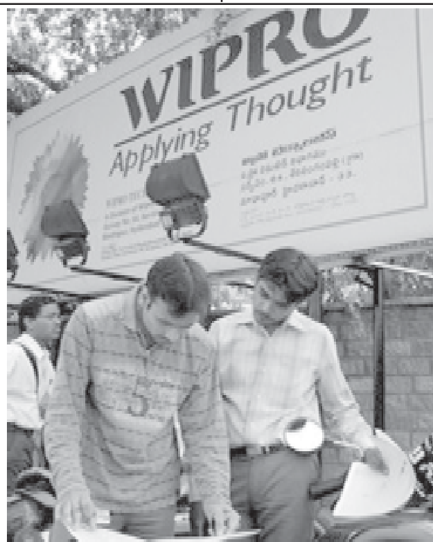
File photo shows Indian Information Technology workers consulting documents at Cyberabad IT City on the outskirts of Hyderabad. Information technology will be an employment machine, generating 5.8 million new jobs in the coming four years, according to International Data Corporation (IDC) research released.