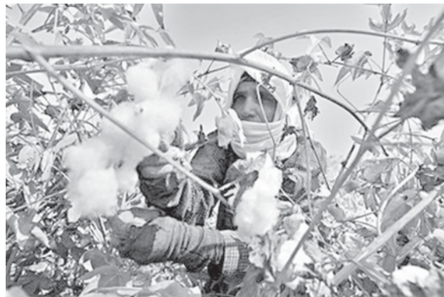
An Egyptian farmer collects the cotton harvest at a farm in al-Massara village near the Nile delta city of Mansura, 130 kms north of Cairo in September 2009. Egyptian cotton production is in decline, having this year reached its lowest in 100 years.

"I will have to stop growing cotton altogether if prices fall further. Costs are high and harvests are smaller," he said. The Egyptian cotton crop has shrunk to its lowest total in more than a century and producers are demanding a return to subsidies like those still paid in some other countries.— Internet