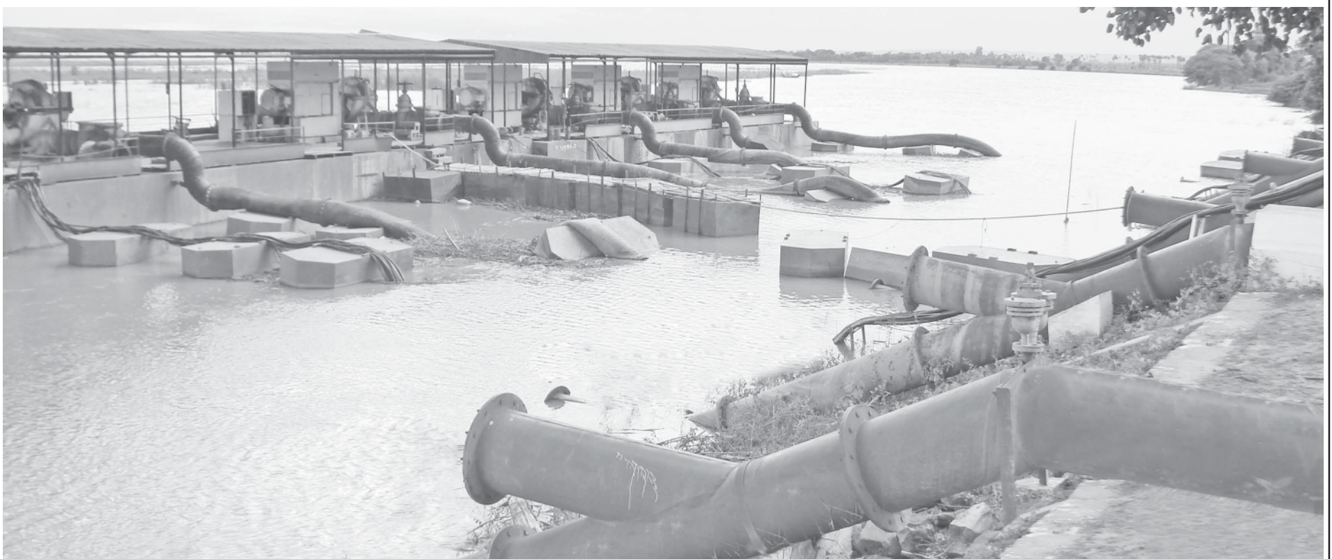
Tanyaung River Water Pumping Station in Tanyaung Village-tract, Salin Township.

I interviewed branch clerk U Aye Ko, a local. (See page 10)