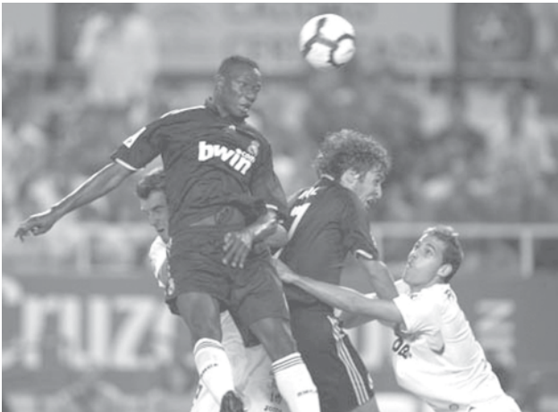
Real Madrid's Diarra (L) jumps to head the ball next to Raul and Sevilla's Fernando Navarro during their Spanish First Division soccer match at Ramon Sanchez Pizjuan stadium in Sevilla on 4 Oct, 2009.