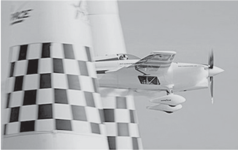
Flying through : Britain's Paul Bonhomme on his way to win the 2009 Red Bull Air Race World Championship with a victory in the final race of the season in Barcelona.