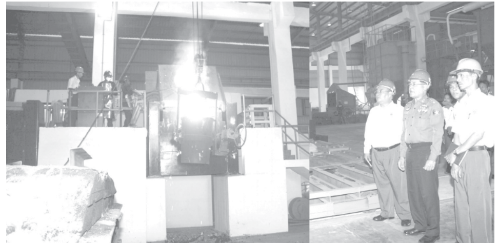
Minister Vice-Admiral Soe Thein inspects production line in Machine and Machine Tools Factory in Myaing.—MNA

Afterwards, the minister went to the Machine and Machine