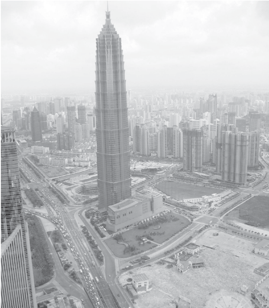
Jin Mao Building

If you have been to Shanghai, you will notice that the whole city looks no different from New York City or Japan. The whole downtown area of Shanghai is packed with skyscrapers and high-rise buildings. The functional logic and aesthetic composition conveyed in Shanghai buildings are similar to those of buildings of highly industrialized countries. Today, growing foreign influences, such as copy-cat towers, are diminishing the traditional architecture in Shanghai, and the architects are trying their best to preserve its local identity by cooperating between Western values and Chinese elements.