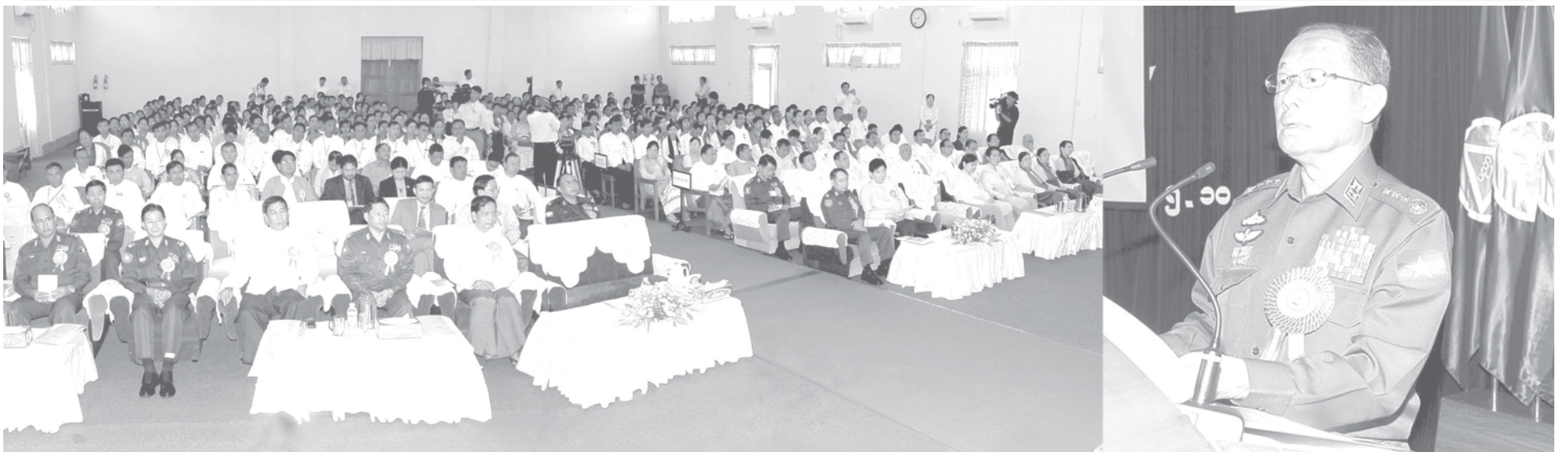
Secretary-1 General Thiha Thura Tin Aung Myint Oo addresses at commemorative ceremony to mark World Teacher's Day.—MNA

NAY PYI TAW, 5 Oct—The Ministry of Education observed the World Teachers' Day at its office here this morning.