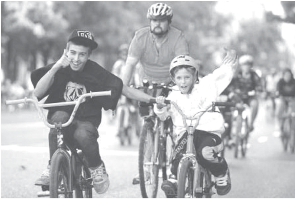
People take part in the car-free day event by riding bicycles in Madrid, capital of Spain, on 4 Oct, 2009. The event was held to promote the green lifestyle and ease the traffic jam while 22-kilometer-long roads were closed for bicycles only in central Madrid.