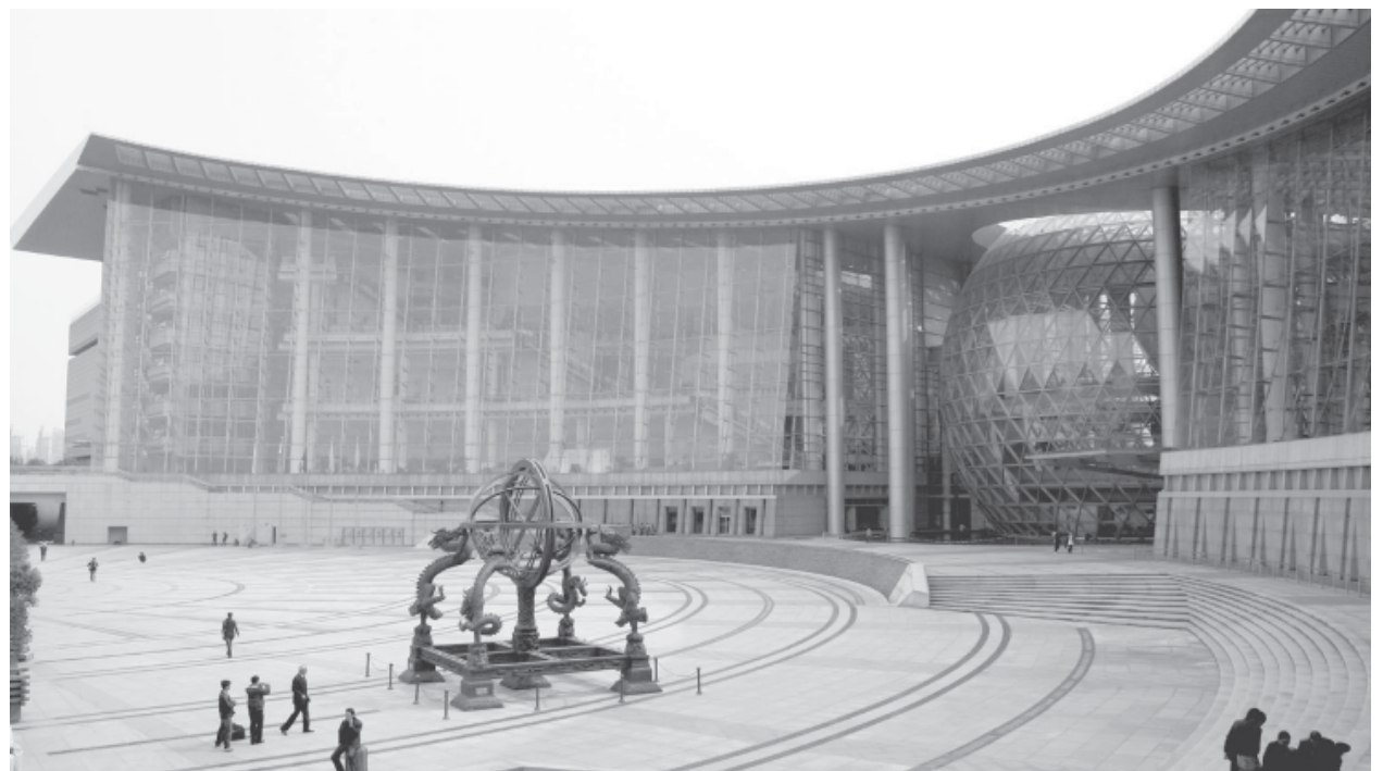
The Museum of Science and Technology