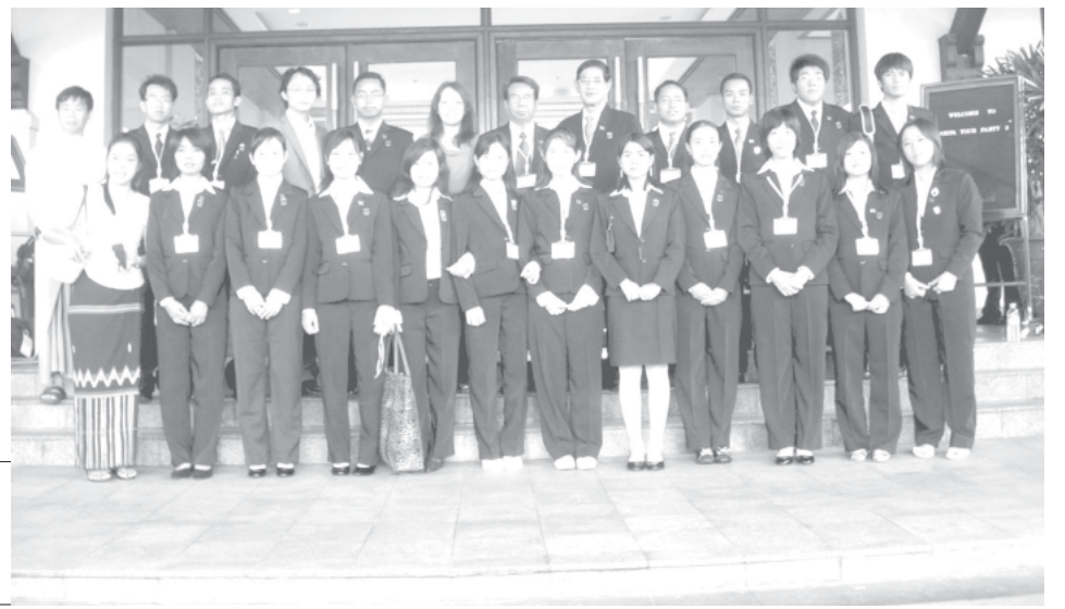
Eighteen members delegation of MES seen at Yangon International Airport before departure for Japan.