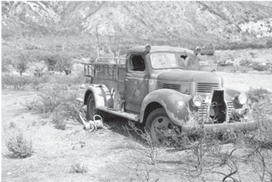
A vintage fire engine that was destroyed by the Sheep fire is seen, on 4 Oct, 2009 in San Bernardino, Calif.