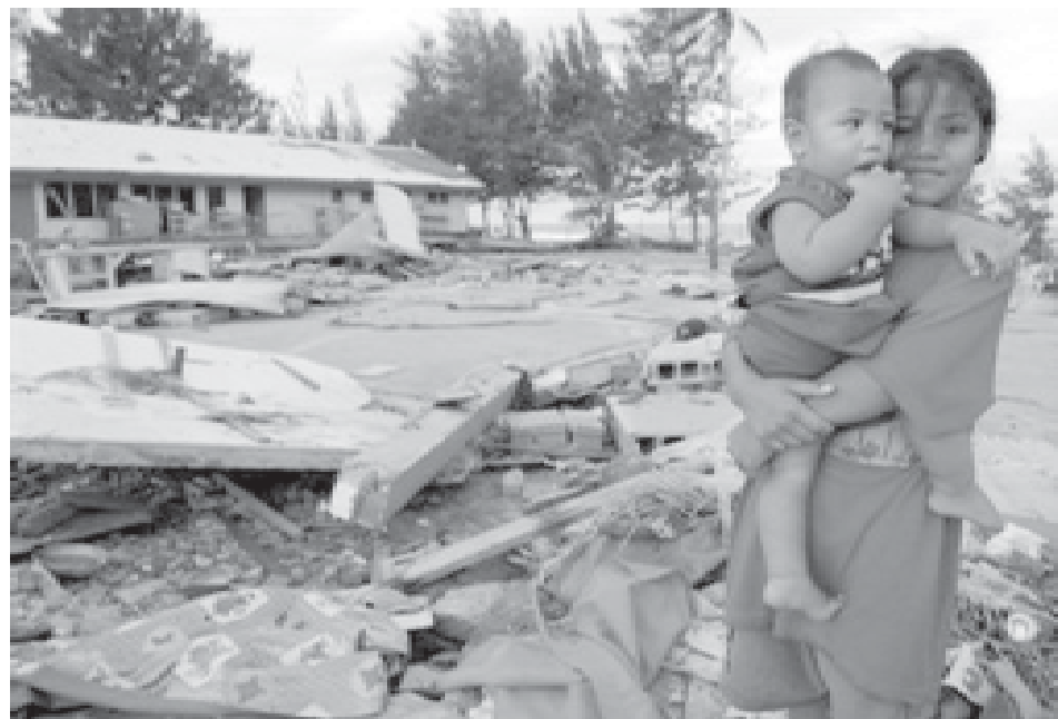
Children walk amidst the ruins of the tsunami devastated village of Tula in American Samoa on 2 October.—INTERNET