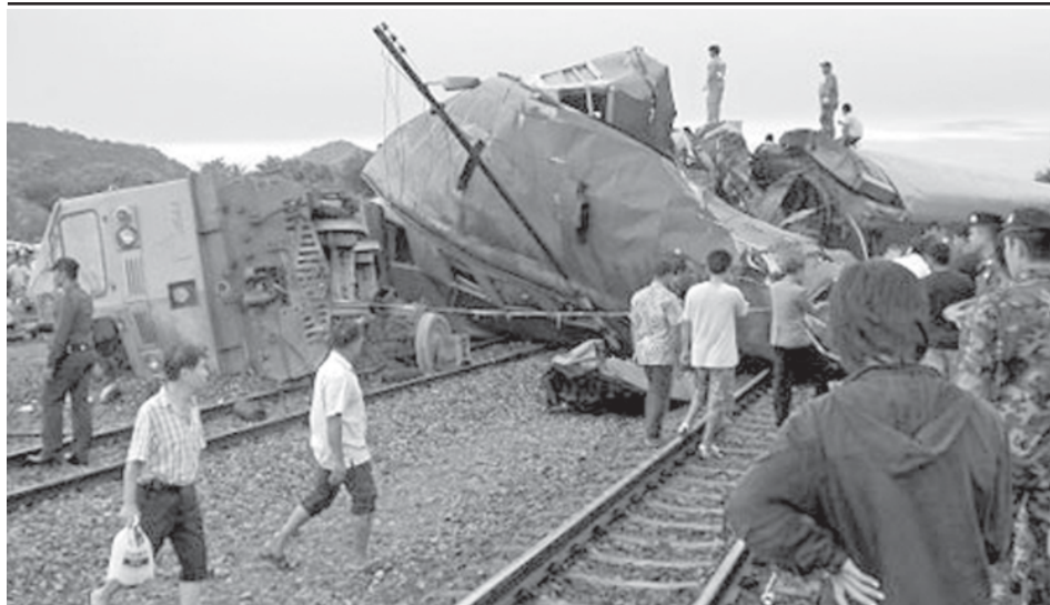
A train from southern province Trang to Bangkok derailed on Monday morning in Hua Hin, killing at least seven passengers and injuring more than 60, on 5 Oct, 2009.