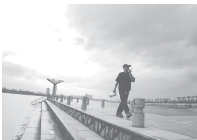
A security member patrols along the riverside at Jiangbin park in Fuzhou, capital of southeast China's Fujian Province, on 5 Oct, 2009. As the approaching 17th tropical storm of the year Parma has brought gales to coastal areas of central and northern Fujian Province, local authorities were ordered to take precautions to ensure the safety of people and minimize losses.