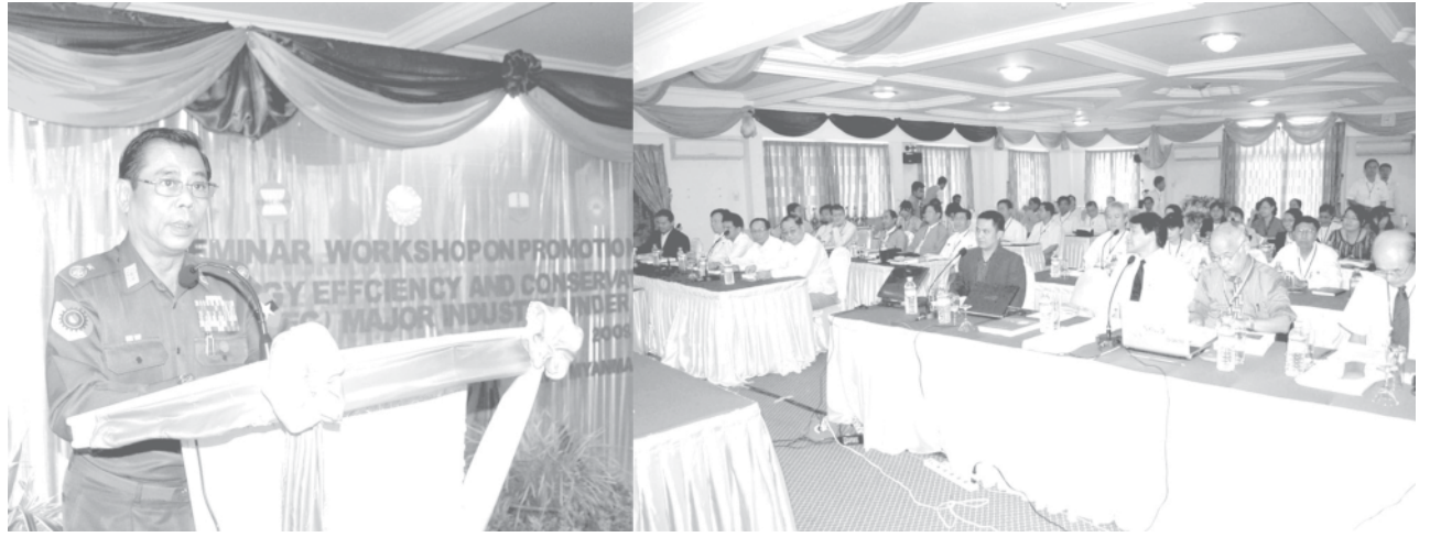
Deputy Minister Maj-Gen Kyaw Swa Khaing makes speech at workshop on survey of energy efficiency and ASEAN energy.—MNA

In his opening speech, the deputy minister said survey of energy use was successfully conducted from 28 September to 2 October at No 1 Automobile Industry under the Ministry of Industry-2. He said he thanked responsible persons of ACE and ECCJ, experts and