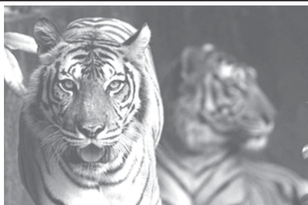
A Sumatran tiger is seen at the Malaysia national zoo in Kuala Lumpur. Malaysian wildlife authorities have rescued a five-year old Malayan tiger, badly injured in a snare set up by poachers near the country's jungle border with Thailand, officials said on Monday.—INTERNET

The case has been reported to the Hospital Authority Head Office and the Centre for Health Protection.—Xinhua