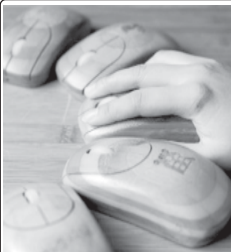
Photo taken on 3 Oct, 2009 shows some bamboo mice manufactured by a bamboo flooring company in Tonggu County, east China's Jiangxi Province.