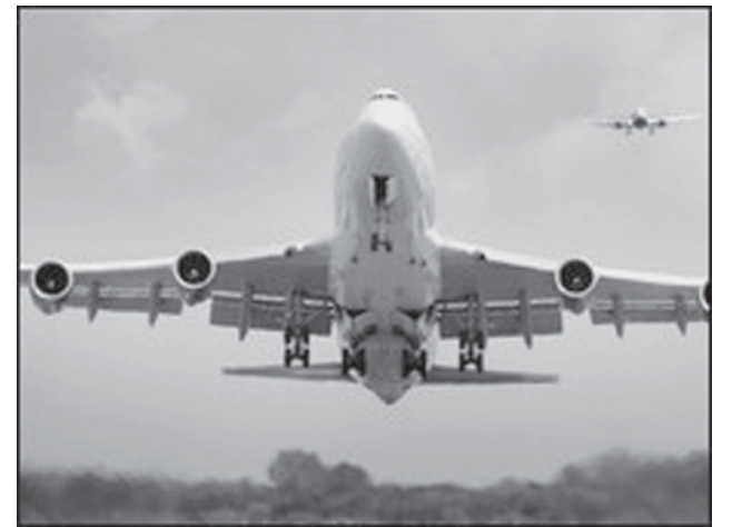
Pilots claim long duty hours are putting passengers in danger.