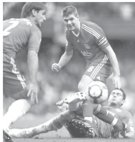
Chelsea's Frank Lampard (R) gets in a tackle to strip the ball from Liverpool's Steven Gerrard (C) during the Premiership match at Stamford Bridge.

"Their result was a surprise for sure but we want to stay concentrated on our own season," Ancelotti said. "This season depends only on us. We're top of the table and we prepare for the next game with concentration and de-