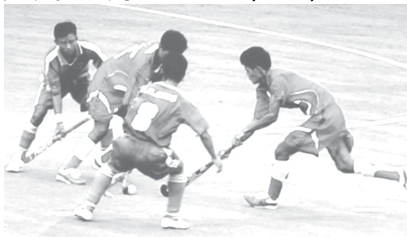
Yangon Division vying with Sagaing Division at Theinbyu Hockey pitch. MHF

pitch this morning. Yangon Division won over Sagaing Division with 2-0 in their debut yesterday.