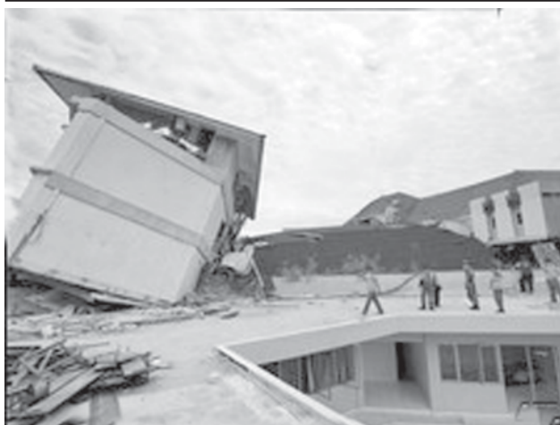
City dwellers are trying to resume their lives amid the rubble.