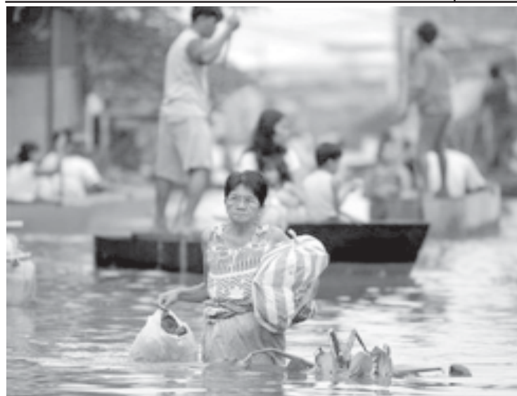
A Filipino woman carries her belongings as she wades through floodwaters in some parts of still submerged Taytay township, Rizal Province, Philippines on 5 Oct, 2009.