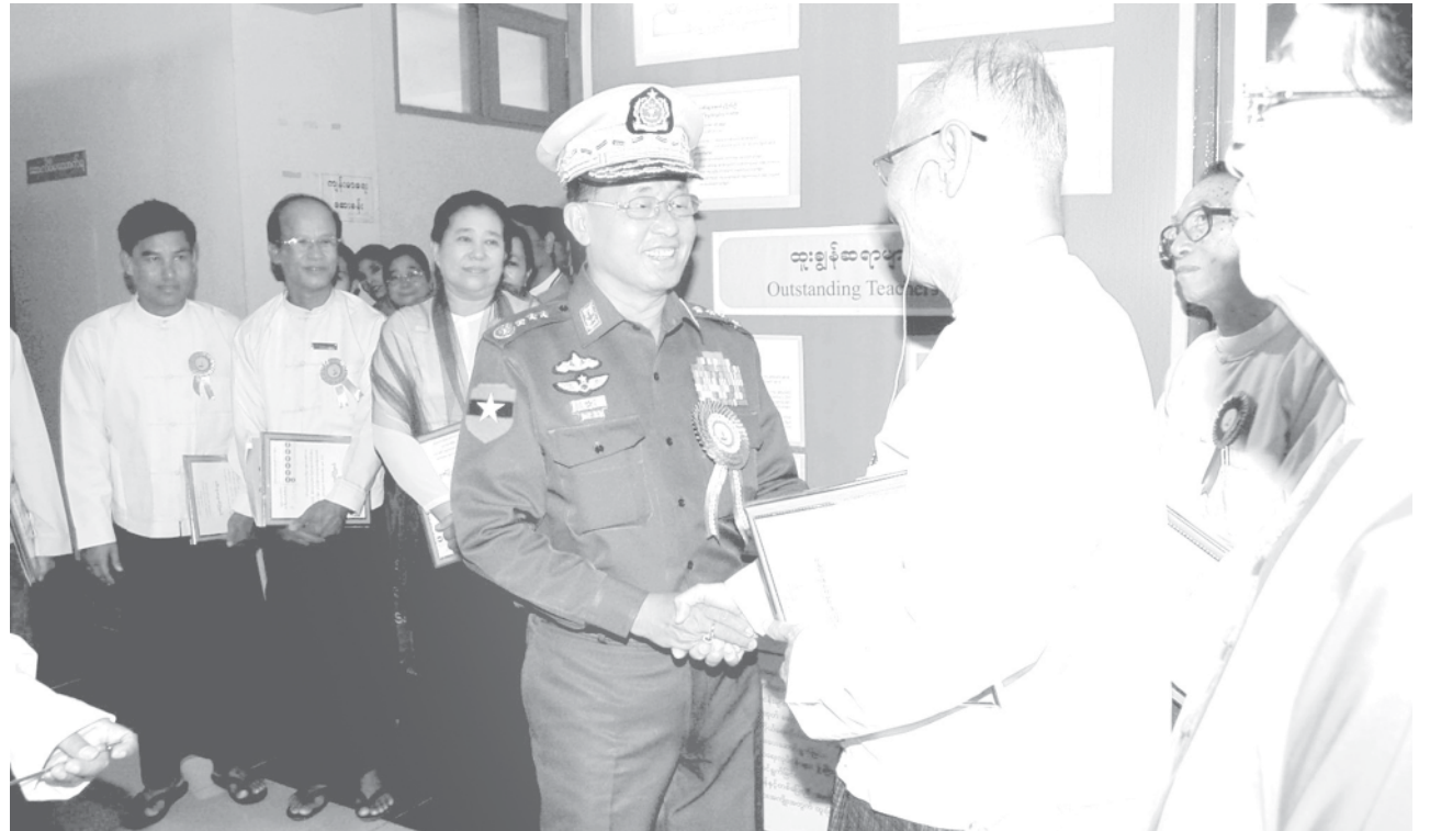
Secretary-1 General Thiha Thura Tin Aung Myint Oo cordially greets attendees.