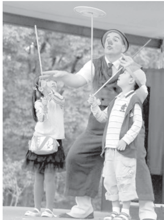
A buffoon actor instructs two kids the slick circumvolving trick during the 2009 Hangzhou International Buffoons Carnival, inside the Botanical Garden of Hangzhou, east China's Zhejiang Province, on 1 Oct, 2009.—XINHUA

SAC, established in 1951, is a renowned Chinese military-civil plane manufacturer under AVIC (Aviation Industries of China) Corporation. Cessna is a leading designer and manufacturer of light and midsize business jets, utility turboprops and single engine aircraft. It has so far sold more than 190,000 aircraft.—Xinhua