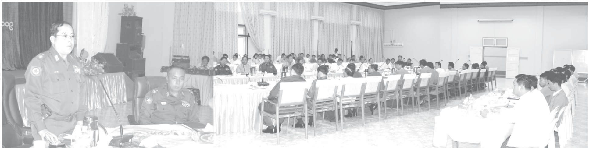
Commander Maj-Gen Wai Lwin addresses second coordination meeting of 17th Myanmar Traditional Cultural Performing Arts Competitions Organizing Committee and representatives from States/Divisions.