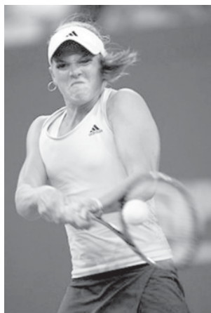
US teen sensation Melanie Oudin.