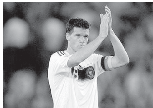
Germany captain Michael Ballack.

The result gave Shakhtar sole possession of the lead in Group J after Toulouse was held to a 2-2 draw at home by Club Brugge.