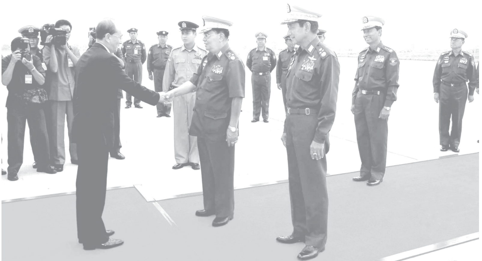
Senior General Than Shwe welcomes back Prime Minister General Thein Sein who arrives back from the United States of America after attending 64th UN General Assembly in New York of the USA.

Also present together with the Senior General at the airport were Vice-Chairman of the State Peace and Development Council Deputy Commander-in-Chief of Defence Services Commander-in-Chief (Army) Vice-Senior General Maung Aye, Member of the State Peace and Development Council General Thura Shwe Mann, Secretary-1 of the State Peace and Development Council General Thiha Thura Tin