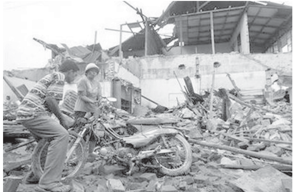
People drag out their motorcycle from the ruins of their house in Padang on Indonesia's Sumatra Island on 1 Oct, 2009.—INTERNET

“The Iranian government heard a clear and unified message from the international community. Iran must demonstrate through concrete steps that it will live up to its responsibilities with respect to its nuclear programme,” Obama said.— Internet