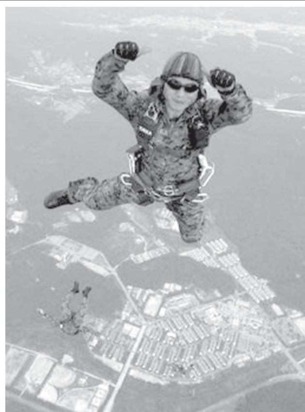
A member of the special warfare command poses for photographs as he parachutes from a helicopter during a practice for the upcoming 61st anniversary of the Armed Forces Day, in the sky above the Gyeryong military headquarters, about 140 km (87 miles) south of Seoul, on 29 Sept, 2009. South Korea's Armed Forces Day falls on 1 Oct.

Suicide blasts and bus bombs were hallmarks of the Liberation Tigers of Tamil Eelam (LTTE), whom the military defeated in May and ended a 25-year civil war. Since then, soldiers and police have been rounding up a handful of rebels still in hiding and seizing massive caches of weapons. Northern Sri Lanka, where the rebels tried to establish their own state, is awash in hidden caches of guns and military hardware.— Internet