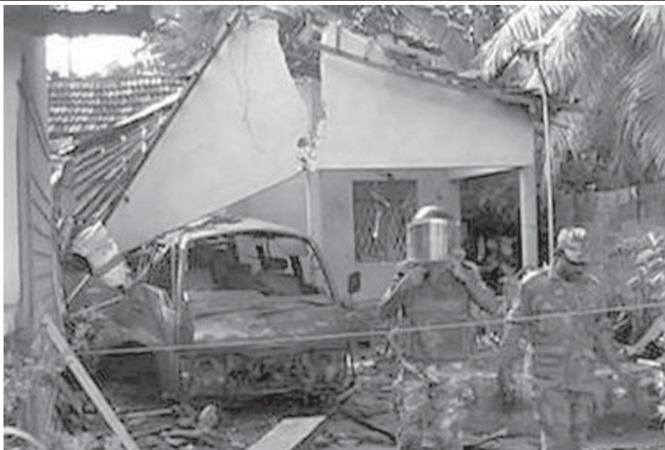
A van that exploded in the morning, injuring 12 schoolchildren and the driver of the van, in the northwestern town of Kurunegala on 2 Oct, 2009. It was not clear whether the blast was caused by explosives or the accidental ignition of a gas tank inside the van, which the military said was parked near a house.