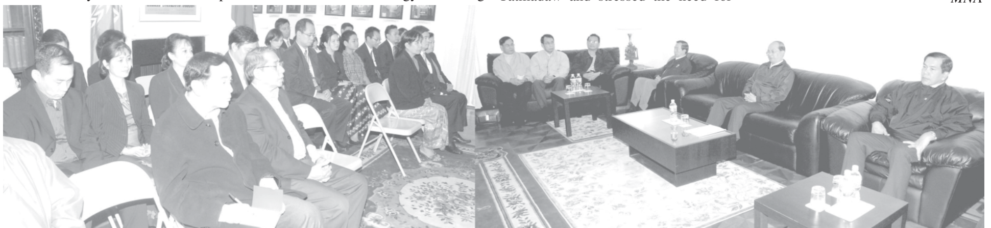
Prime Minister General Thein Sein meets staff and their families of Office of Myanmar Permanent Representative to the United Nations in New York.