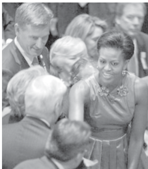
US first lady Michelle Obama arrives for the opening ceremony for the 121st IOC session and XIII Olympic Congress at the Opera house in Copenhagen, on 1 Oct, 2009.