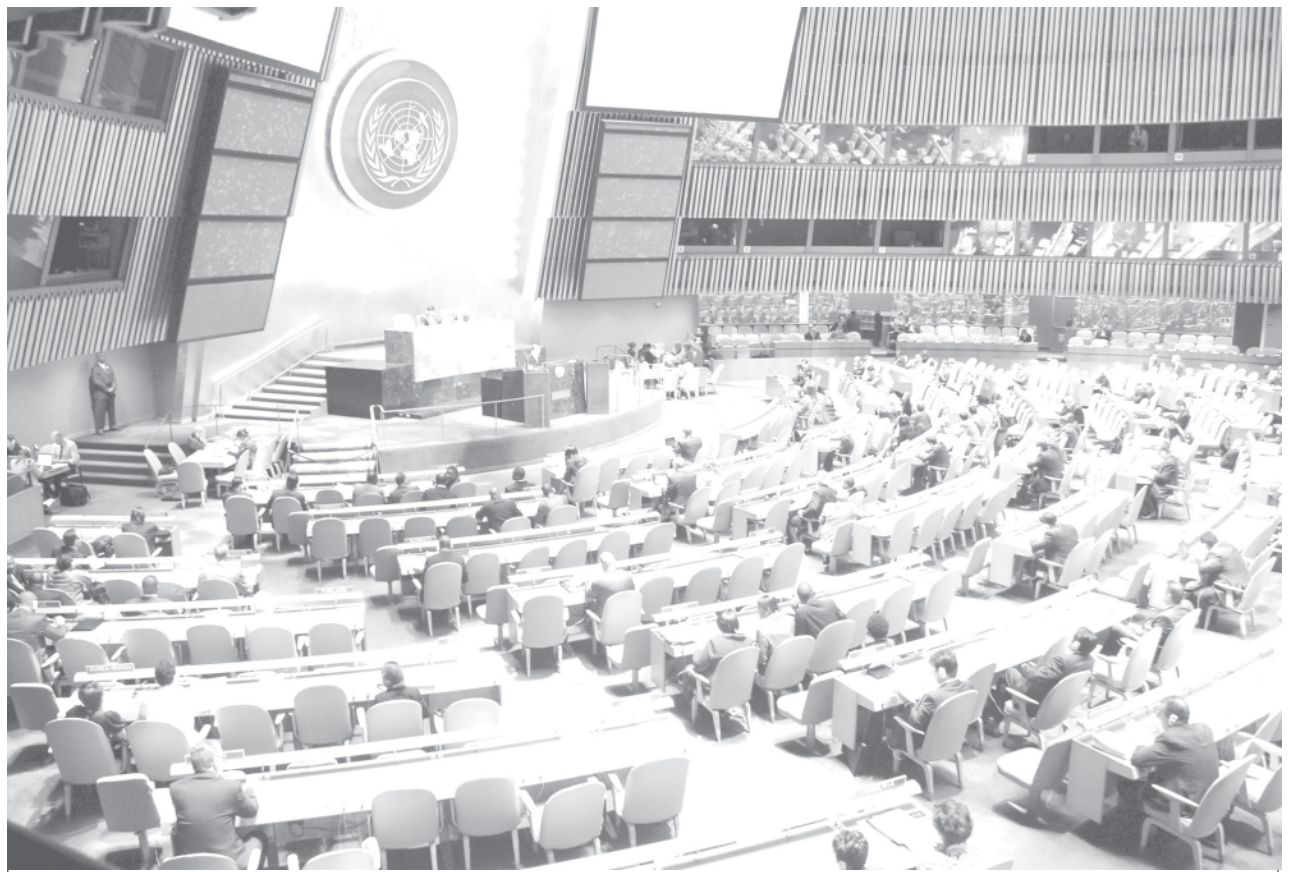
Prime Minister General Thein Sein addresses 64th United Nations General Assembly in New York. (News on Page 8)

Next, representative person from States/Divisions, officials from the committee and sub-committees and judge presented carry-out tasks and Minister Maj-Gen Khin Aung Myint then attended to the needs.