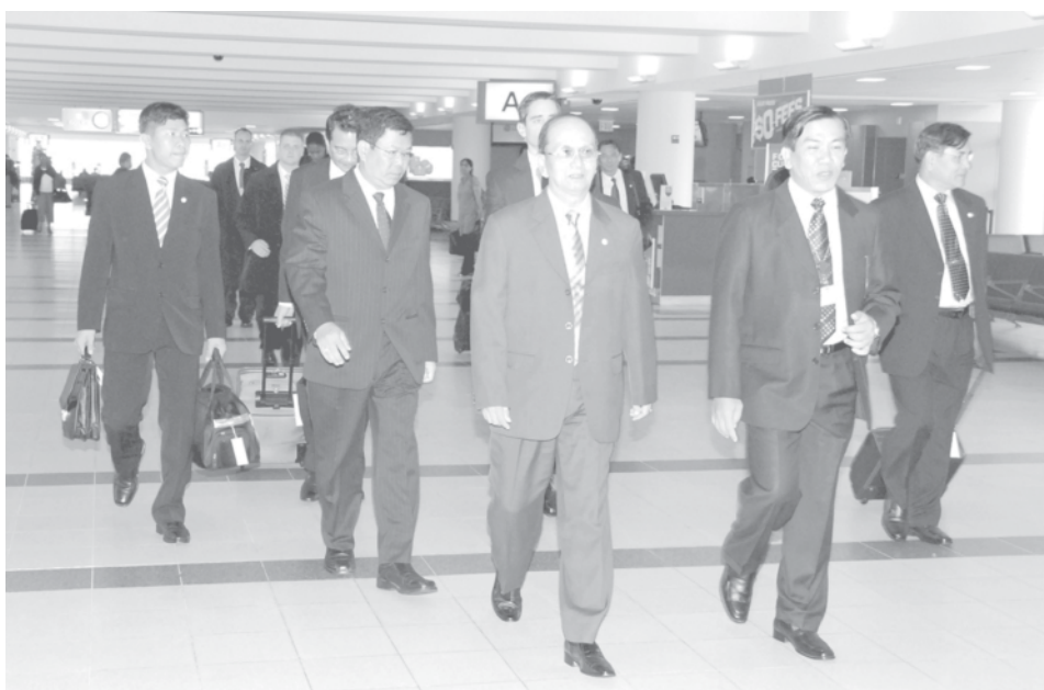
Prime Minister General Thein Sein being welcomed by Myanmar Permanent Representative to the UN U Than Swe at J.F.K Airport in New York.

The Prime Minister and party were welcomed at the airport by Minister for Foreign Affairs U Nyan Win who was in advance there to attend the 64 th UNGA and Myanmar Permanent Representative to the UN U Than Swe. Then the Prime Minister and party put up at East Gate Hotel in New York. — MNA