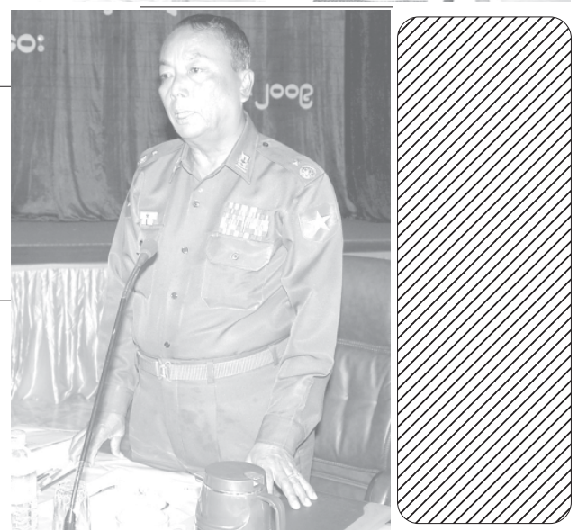
Minister Brig-Gen Ohn Myint addresses local people in Nat Hmaw Village of Paung Township.

In the afternoon, member of Myanmar Industrial