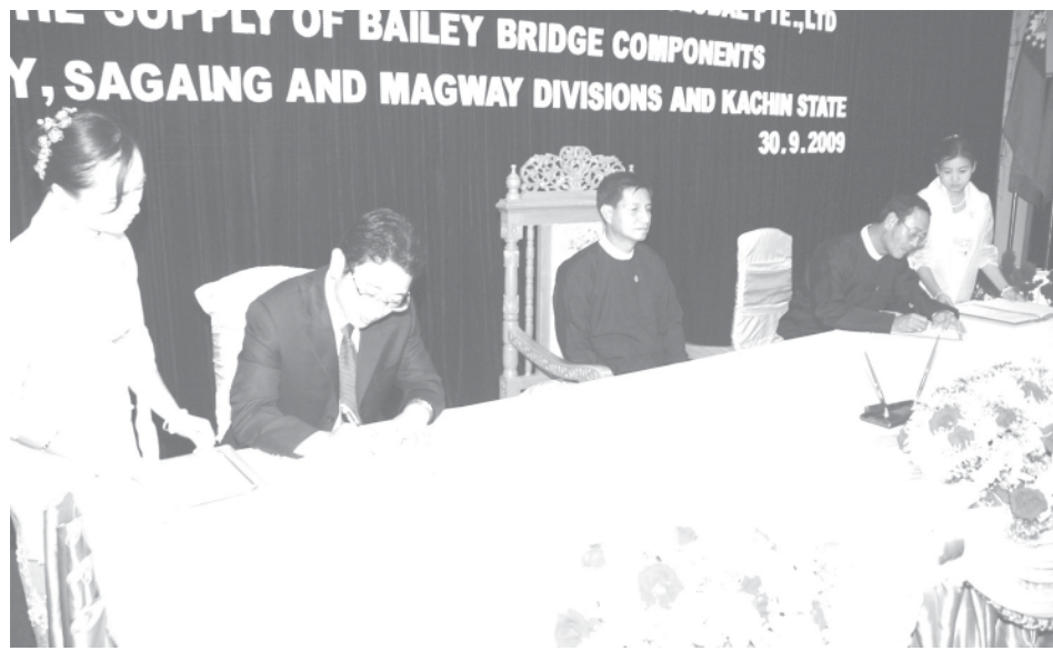
Minister Maj-Gen Khin Maung Myint attends ceremony to sign an agreement between Public Works, Hubei Huazhou Industry Co Ltd and A.A Global (Singapore) Pte Ltd.—MNA

All of those materials will be used in the bridges in States and Divisions being undertaken by Public Works under the Ministry of Construction.—MNA