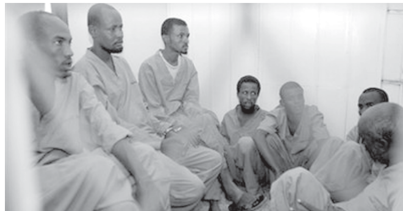
Somali suspected pirates stand behind the bars at state security court in Sana’a Yemen, on 29 Sept, 2009 on charges of piracy and hijacking of Yemeni oil tanker enroute from Mukala to Aden port city in April 2009.