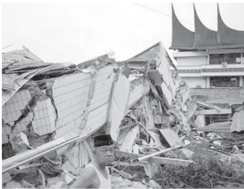
A man stands in front of a collapsed building after an earthquake hit Padang, on Indonesia’s Sumatra island on 30 Sept, 2009. A 7.6 magnitude earthquake struck off the city of Padang on Indonesia’s Sumatra island on Wednesday, killing at least 75 people and trapping thousands under rubble, officials said.—INTERNET

The undersea quake of 7.6 magnitude was followed by a powerful, shallow inland earthquake on Thursday morning with a preliminary magnitude of 6.8, the US Geological Survey said. It hit about 150 miles (240 kilometres) south of Padang at a depth of just under 20 miles (24 kilometres).— Internet