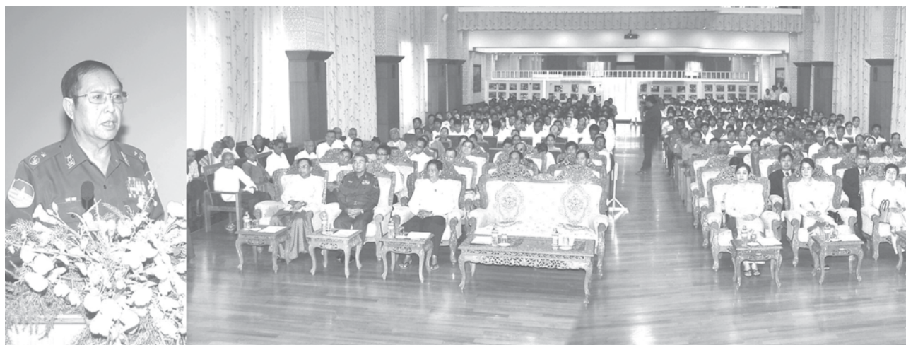
Minister Maj-Gen Maung Maung Swe addresses International Day of Older Persons 2009.—MNA

health, fitness and education standards of the entire nation, Myanmar, an ASEAN member country, is placing special emphasis on protection and caring children, youth, women, disabled persons and older persons. Four main areas for older persons were included in Macao Plan of Action for Older Persons in Asia and the Pacific 1999. The third term of the project of home care for older persons was designated from June of 2009 to May of 2012. Activities of home care for older persons were being carried out in eight states and divisions. To realize