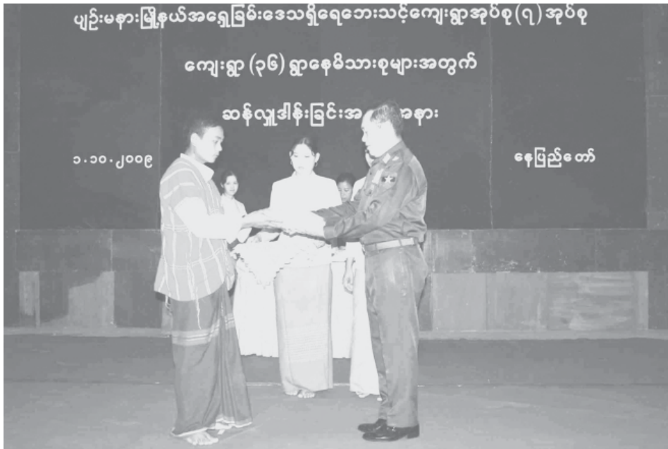
Minister Maj-Gen Thein Swe provides bags of rice to Thiton village-tract in Nay Pyi Taw District.