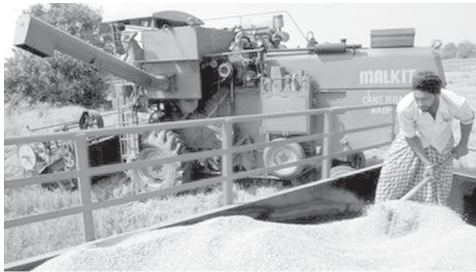
An Indian farmers harvests a crop of rice on the outskirts of Amritsar on 30 Sept. Giant neighbours China and India will lead Asian expansion as domestic stimulus measures spur demand, the International Monetary Fund forecast on Thursday.