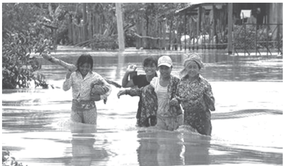
Cambodian women walk through floodwaters in Kampong Thom province. Millions of flood-hit survivors of devastating Typhoon Ketsana waited desperately for aid and braced for a new super storm as the disaster's death toll climbed to 383.