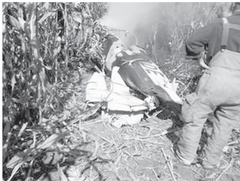
In this cell phone photograph provided by David Lykins, a single engine plane is shown after crashing in Randolph County, Ind, on 30 Sept, 2009.—INTERNET