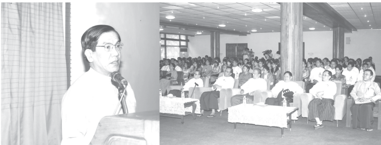
Foreign Affairs Minister U Nyan Win delivers an address at opening ceremony of Basic Diplomatic Skill Course (22/2009).—MNA

YANGON, 1 Oct—The opening ceremony of Basic Diplomatic Skill Course (22/2009), organized by the Ministry of Foreign Affairs, took place at Wunzinmin Yarzar Hall of the ministry, here, this evening.