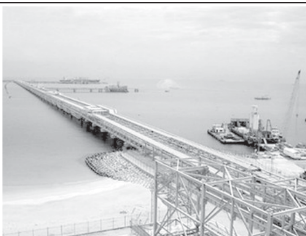
The largest and most advanced pier in the Middle East at Kuwait's largest refinery of Al-Ahmadi just north of Al-Shuaiba.

Drivers under 20 years old were involved in 16 percent of distracted-driver fatal crashes. Those ages 20 to 29 accounted for another 12 percent.—Internet