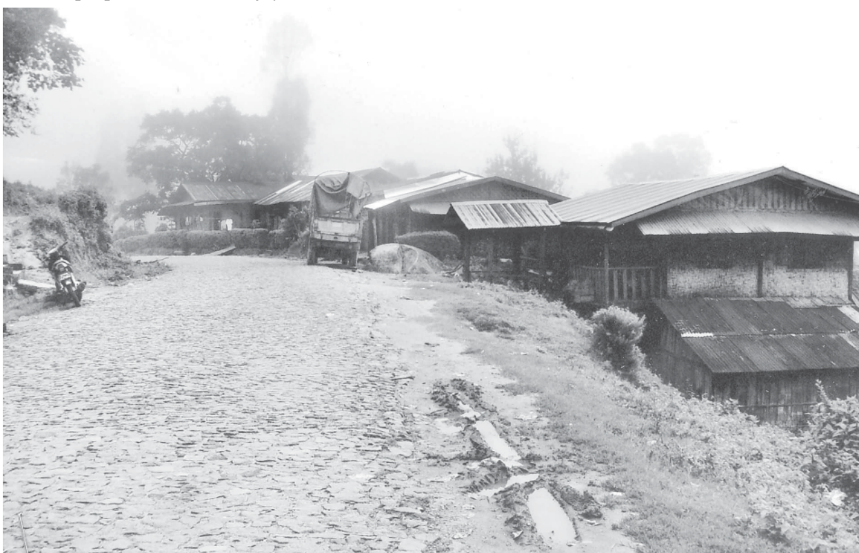
Peaceful Seinlong village being covered by mist on Lwejel road.