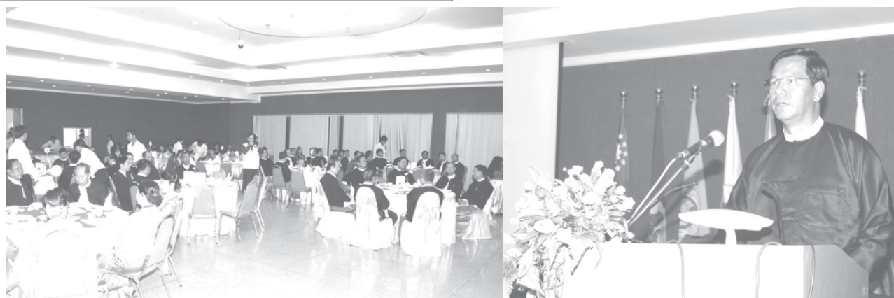
Minister Maj-Gen Hla Tun gives speech at concluding ceremony of Diploma in Banking Course No (2).—MNA