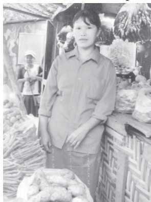
"I wish perpetual tranquility of Seinlong mountain."

Along the upward motorway, sometimes, we saw motorbikes overtaking us, and motorbikes and vehicles descending from the mountain. The spiral