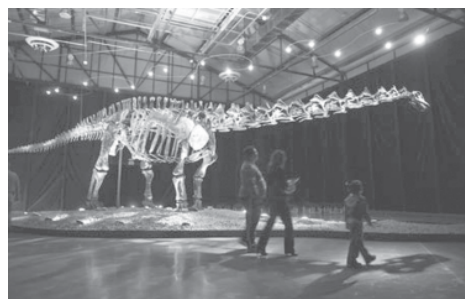
Visitors look at the skeleton of an Apatosaurus named "Einstein" displayed at the Lewis hall in Fundidora park in Monterrey, northern Mexico, on 23 Sept, 2009.

Exceptionally well preserved dinosaur fossils uncovered in north-eastern China display the earliest known feathers. The creatures are all more than 150 million years old. The new finds are indisputably older than Archaeopteryx, the "oldest bird" recognised by science.