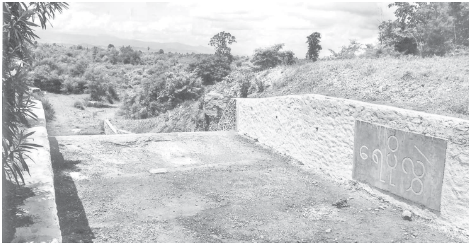
The 190 feet long and 30 feet wide spillway of Yinshay Dam.