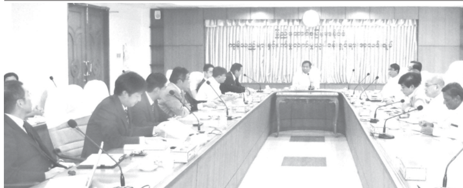
President of UMFCCI U Wint Myint and members hold talks with delegation of Kubota Corporation and Japan External Trade Organization.