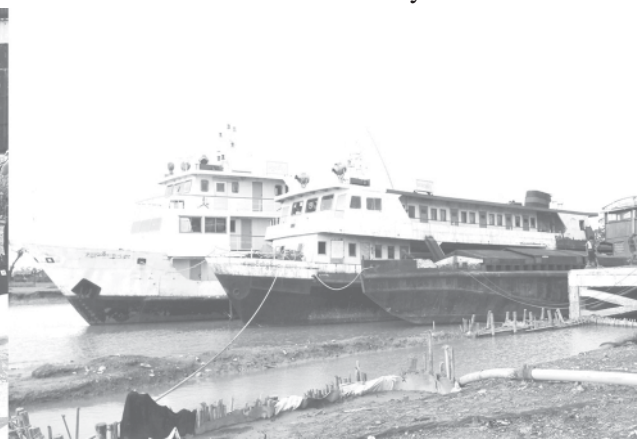
Commander Maj-Gen Thaung Aye and Minister Maj-Gen Thein Swe look into Sittway shipyard.