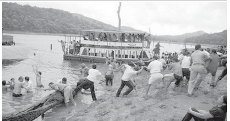
Rescue personnel use ropes to pull a capsized vessel to shore at the Thekkady Tiger reserve near Thiruvananthapuram in southern India on 30 Sept. Rescue workers pulled bodies from a lake in southern India on Thursday after a boat carrying tourists capsized, killing at least 37 people.