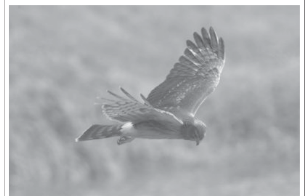
The northern harrier is a grasslands bird whose habitat may be threatened by crop-based biofuel production.

SCIENCE DAILY, 1 Oct— When society jumps on a bandwagon, even for a good cause, there may be unintended consequences. The unintended consequence of crop-based biofuels may be the loss of wildlife habitat, particularly that of the birds who call this country's grasslands home, say researchers from Michigan Technological University and The Nature Conservancy.