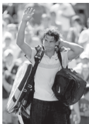
Spain's Rafael Nadal.