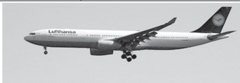
The leading German airline, Lufthansa, has said that it will buy a remaining 20-percent stake in British carrier BMI from the Scandinavian SAS group.—INTERNET

The Destatis statistics office bases its estimation on six German states which represent around 76 percent of all German retail sales.— Internet