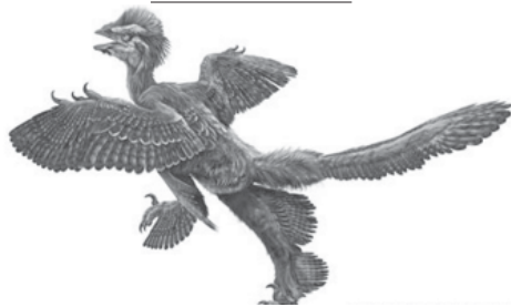
An artist's impression of how these creatures may have looked.

But the new fossils, which come from two separate locations, are in most cases about 10 million years older than the primitive Archaeopteryx discovered in the late 19th Century. One of the new dinosaur specimens, named Anchiornis huxleyi, is spectacular in its preservation. It has extensive plumage covering its arms and tail, and also its feet — a "four-winged" arrangement, says Professor Xu from the Chinese Academy of Science in Beijing.