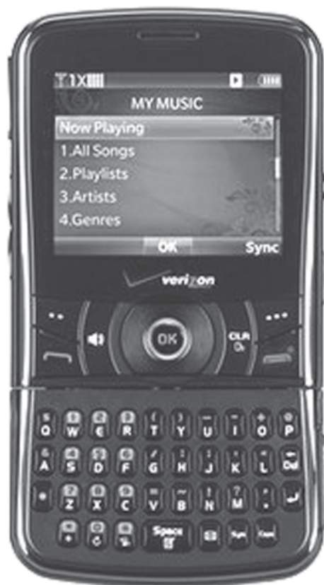
Verizon Wireless today introduced the Verizon Wireless Razzle(TM), a fashionable phone developed by Personal Communications Devices, LLC.