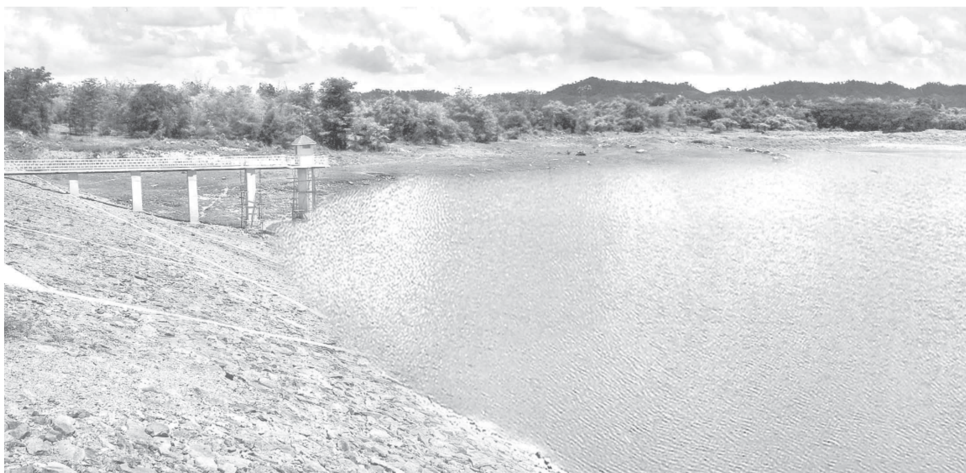
Yinshay Dam and its control tower with the west Yoma mountain range in the background.

Deputy Head U Tin Win said that they undertook the construction of the dam in 2001; that the dam was projected to irrigate 500 acres, but it could benefit 570 acres of agricultural farms; that six years later, the irrigable area would (See page 10)