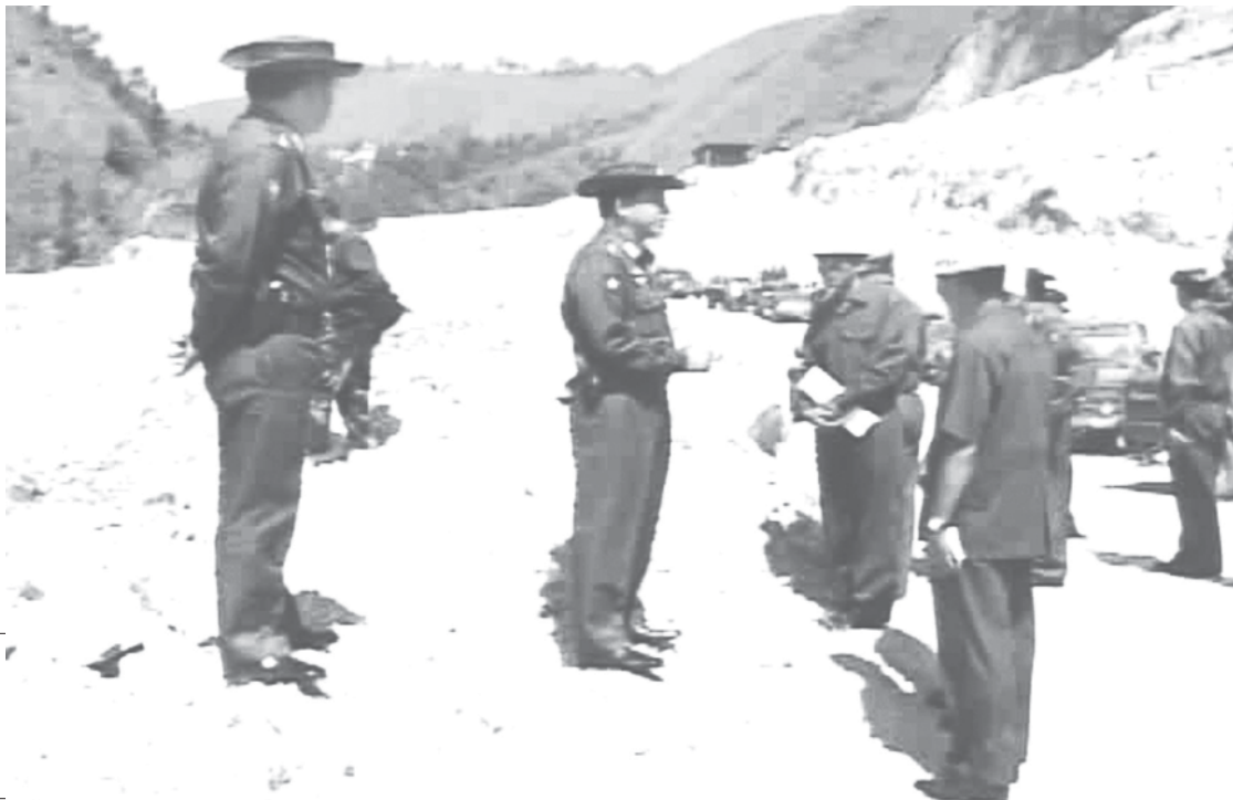
Lt-Gen Min Aung Hlaing visits Namtu Bawtwin.