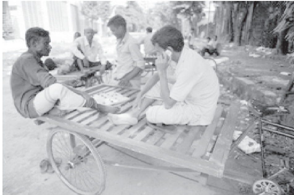
A local rickshaw-van puller is seen speaking on his mobile phone in Dhaka. Bangladesh's biggest mobile phone provider Grameenphone is expected to shatter all records for the impoverished country's capital market as it launches an Initial Public Offering (IPO) on 4 October.