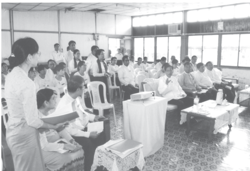
Minister Dr. Chan Nyein meets with education staff at No. 1 BEHS in South Okkalapa Township.— EDUCATION