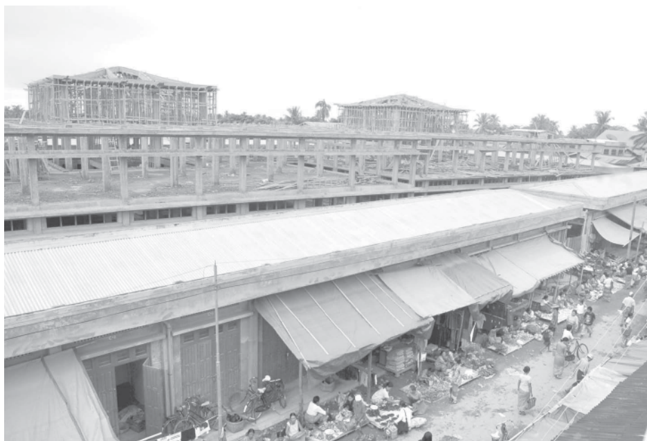
Tahan new market is under construction in Kalay Township, Sagaing Division.