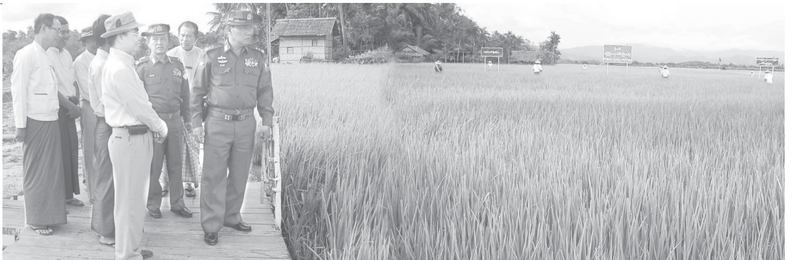
Lt-Gen Khin Zaw of the Ministry of Defence views spreading fertilizer on rain-fed paddy field in Kanthaya Village, Myeik Township.