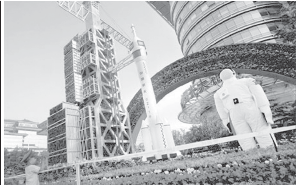
A child plays nearby the aerospace science & technology flower parterre in Beijing on 14 September, 2009.