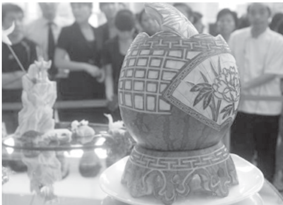
A dish sculptured from a watermelon is seen during a cooking competition greeting the 2010 Shanghai World Expo held in Wujiaochang in Yangpu District of Shanghai, east China, on 15 Sept, 2009, which attracted chefs from 16 catering companies joining in the competition.