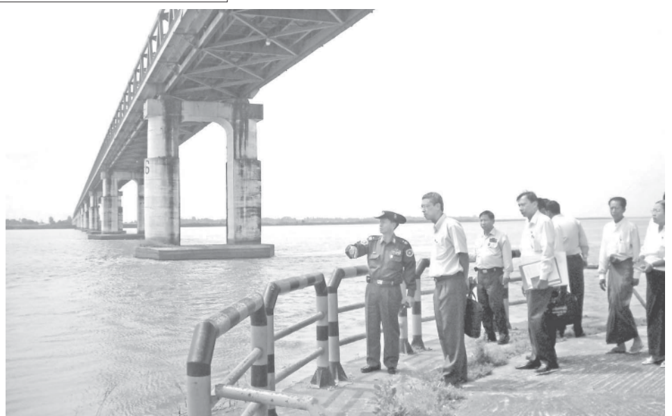
Minister Maj-Gen Khin Maung Myint inspects the durability of Bo Myat Tun Bridge.—CONSTRUCTION