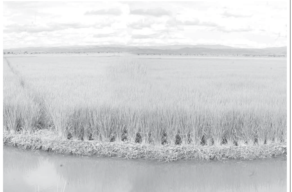
Thriving paddy plantations of Mauklinn village and neighbouring villages in Kalay Township.