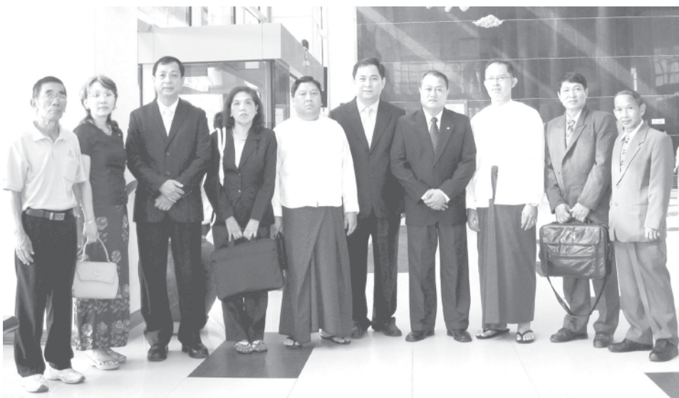
Myanmar delegation led by Secretary U Zaw Moe Khine of MPMEEA being seen off at Yangon International Airport.