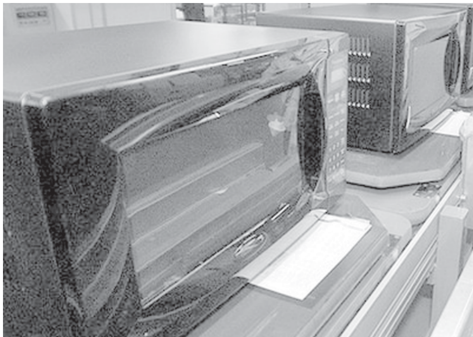
Microwave ovens are shown along a production line. From the land of fish and chips, beans on toast and deep-fried Mars Bars come fish fingers specially designed to be crispy, not soggy, when they come out of the microwave.—INTERNET