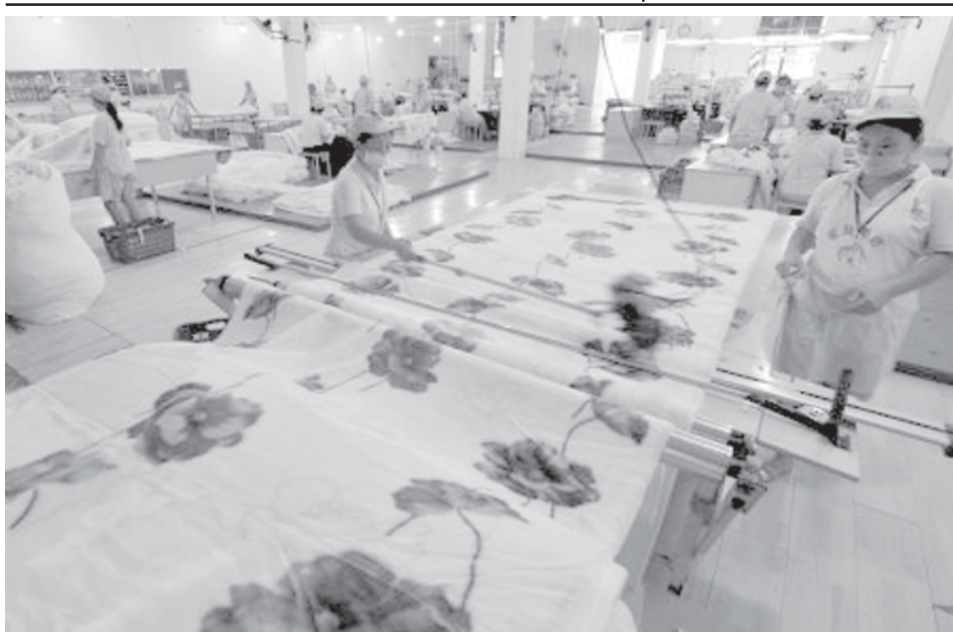
Workers cut blankets at Yehai Blanket Factory in south China’s Hainan Province, on 14 Sept, 2009. The factory exported over 500,000 blankets of 52 brands in the first eight months this year, much more than the same period last year.