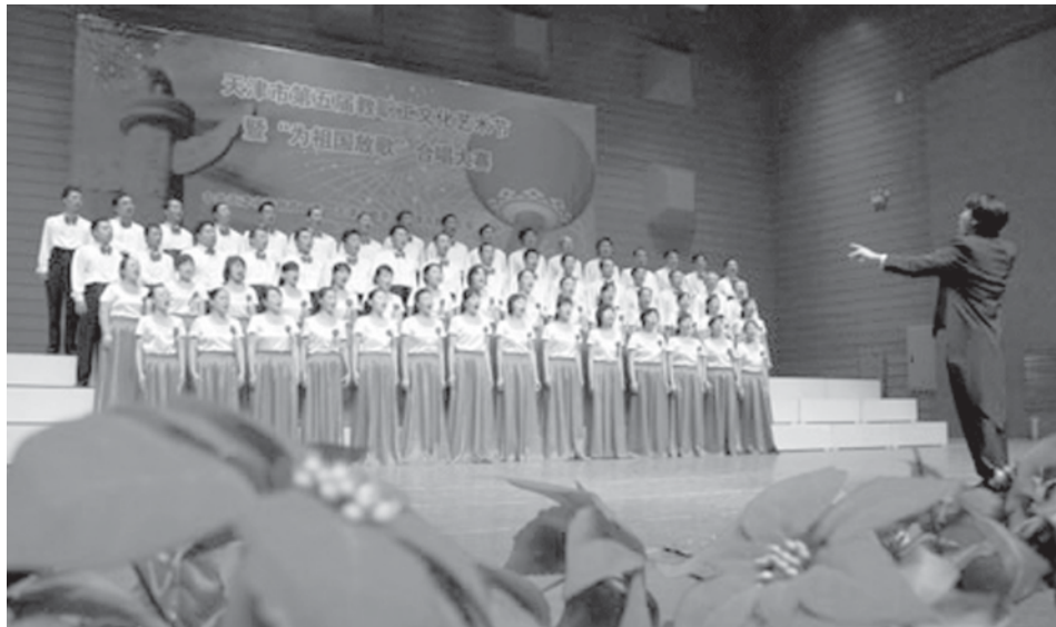
An amateur chorus sings the songs among the repertoire of odes to the homeland, during the large chorus contest of Singing for the Homeland by the Educational Department, Universities, Middle and Elementary Schools, which draws a total of 44 choruses to participate in, at the Musical Hall of the Tianjin Normal University, in Tianjin, north China, on 13 Sept, 2009.