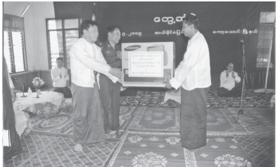
Minister Brig-Gen Maung Maung Thein presents a set of 21-inch colour TV for 10th Mile Village, Kawthoung.—L&F