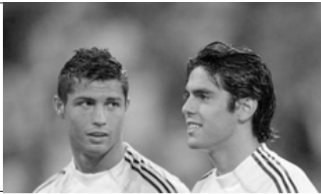
Cristiano Ronaldo (left) looks at teammate Kaka.

ZURICH, 15 Sept—Cristiano Ronaldo and Kaka, who cost Real Madrid over 150 million euros, aim to lead the Spanish giants to a 10th European title this season, with their campaign starting in the humble surroundings of FC Zurich on Tuesday.