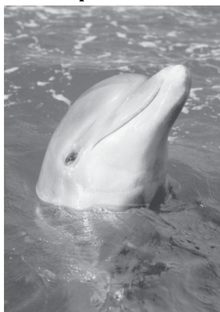
Dolphins like Natua, pictured here, may share with humans the ability reflect upon their states of mind.