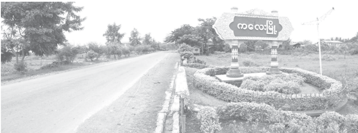
The signboard at the entrance to Kalay surrounded by multicoloured flowers.