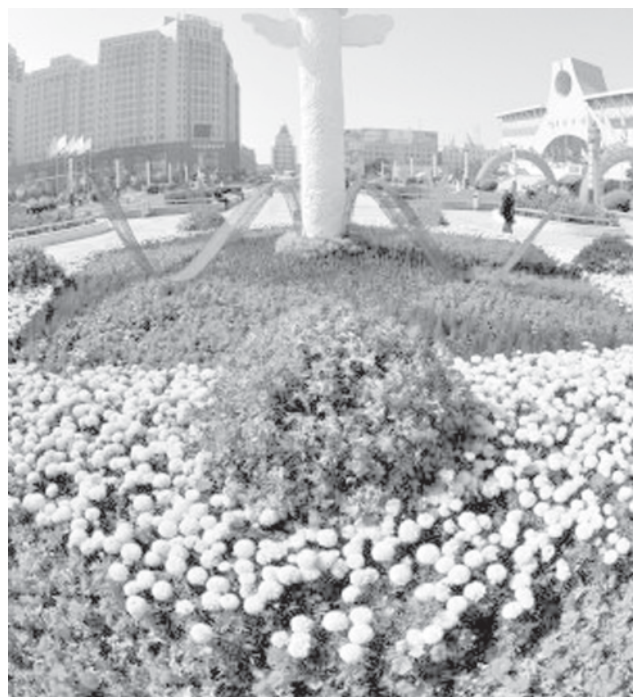
Flowers are displayed at a square in Yinchuan, capital of northwest China's Ningxia Hui Autonomous Region, to celebrate the upcoming National Day of China on 14 Sept, 2009.