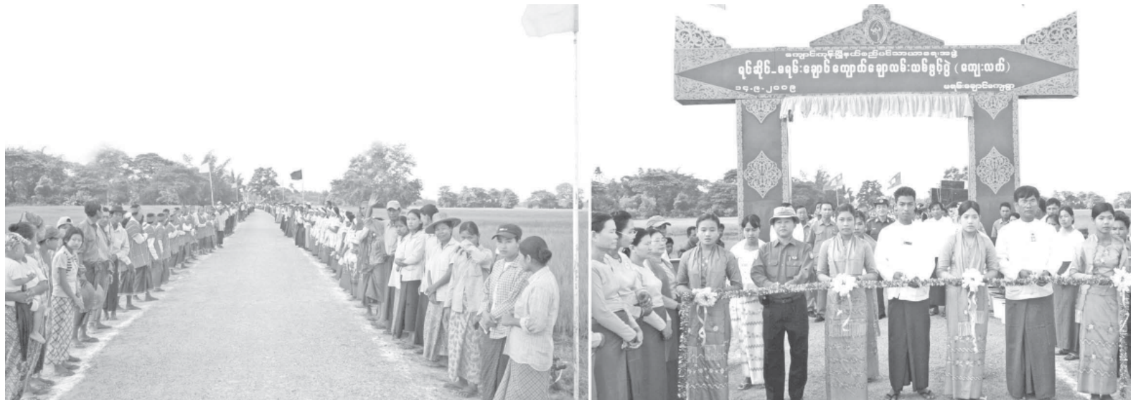
Minister Col Thein Nyunt attending the opening of Yinsaing-Mayanchaung gravel road in Kyaungkon Township.

Similarly, at 12.45 pm on 14 September, 83 kilos of unidentified white chemical powder, 3,024,000 white tablets each with 15 milligrams of caffeine, 323,000 brown methamphetamine stimulant tablets (thick) and 4,990,000 brown methamphetamine stimulant tablets (thin) were seized from a cave near Yinsin Village. In connection with the cases, action is being taken to expose the culprits.—MNA