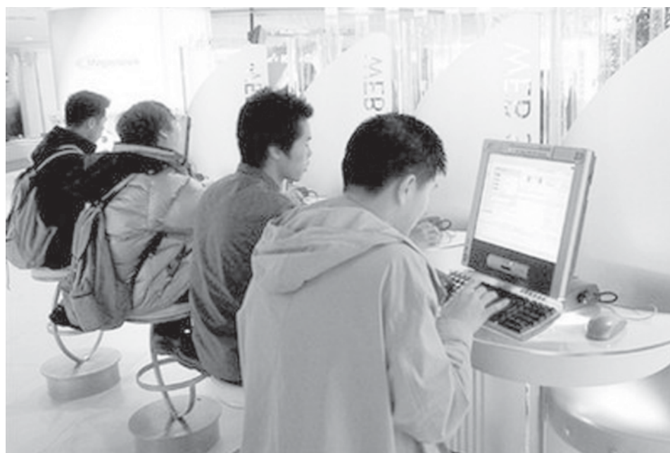
South Korea plans to train 3,000 "cyber sheriffs" by next year to protect businesses after a spate of attacks on state and private websites, a report said on Sunday.—INTERNET