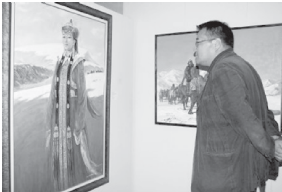
A man visits a painting exhibition in Ulan Bator, capital of Mongolia, on 15 Sept, 2009. Eighty paintings by Chinese artists were displayed at the exhibition for the 60th anniversary of the establishment of the China-Mongolia diplomatic relations.