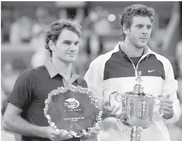
Juan Martin Del Potro (R) of Argentina and Roger Federer of Switzerland pose during the awarding ceremony for the men's singles final at the US Open tennis tournament in New York, on 14 Sept, 2009.