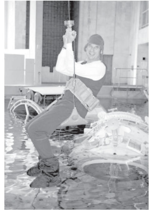
Canadian billionaire Guy Laliberte drops into a pool during an emergency landing practice at the training centre in Star City outside Moscow, on 14 Sept, 2009. Laliberte, who owns Cirque du Soleil, is set to become the world's seventh and Canada's first space tourist after being slated to travel on a Russian Soyuz space craft to the International Space Station at the end of September.