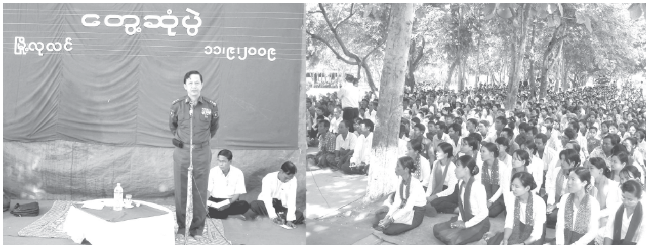
Minister for Electric Power No. 1 Col Zaw Min meeting with local people from 18 villages.—MNA

NAY PYI TAW, 15 Sept—Minister for Electric Power No. 1 Col Zaw Min met with local people from 18 villages in Myolulin, Hsutagyi, Pategon, Myaypyintha village tracts