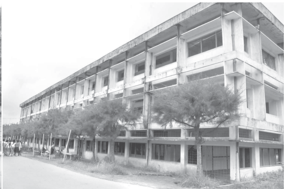
Kalay University in Kalay, Sagaing Division provides tertiary education for local national youths.