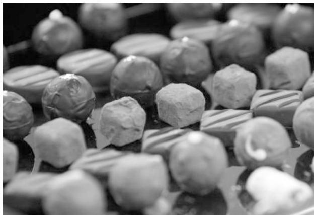
Chocolates are pictured during the opening of the Nestle Chocolate Centre of Excellence in Broc near Fribourg on 7 September, 2009. The Chocolate Centre of Excellence is dedicated to the research and development of chocolate products.