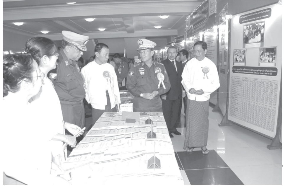
Secretary-1 General Thiha Thura Tin Aung Myint Oo views booths on display at International Literacy Day (2009).

In order to scale up the post-literacy campaign, 55,755 rural libraries have been opened with the assistance of the Ministry of Information. Moreover, 2574 community learning centres have been established with the