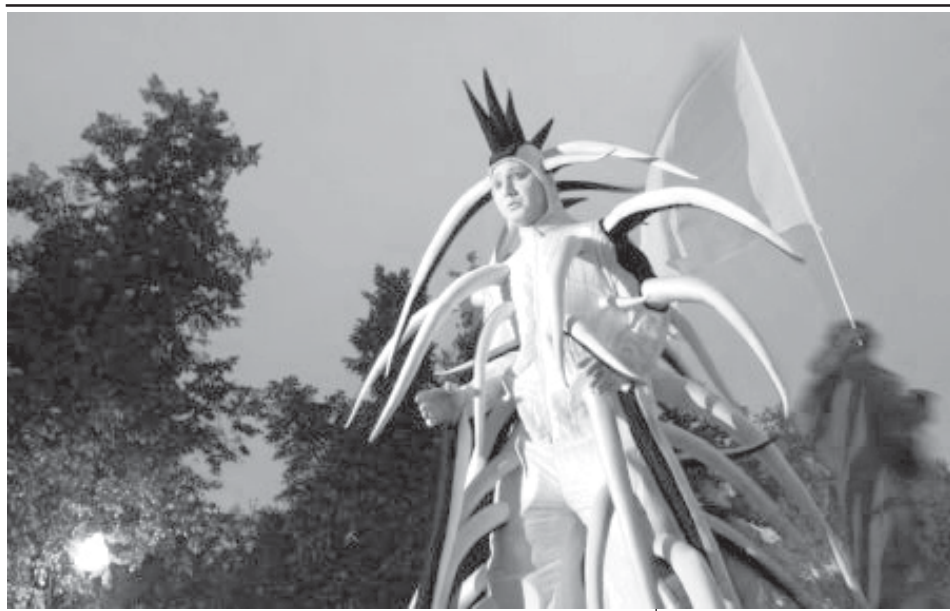
An actor from the "Tall Brothers" street theatre performs in a park during the annual City Day celebration in Moscow on 6 September, 2009.