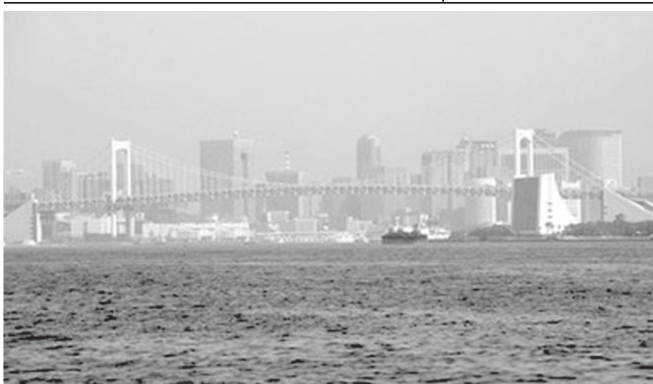
The Rainbow Bridge over Tokyo port and the Tokyo skyline. Japan’s next prime minister has vowed tough greenhouse gas cuts for the world’s number two economy as he prepares to name key cabinet posts ahead of taking power next week.