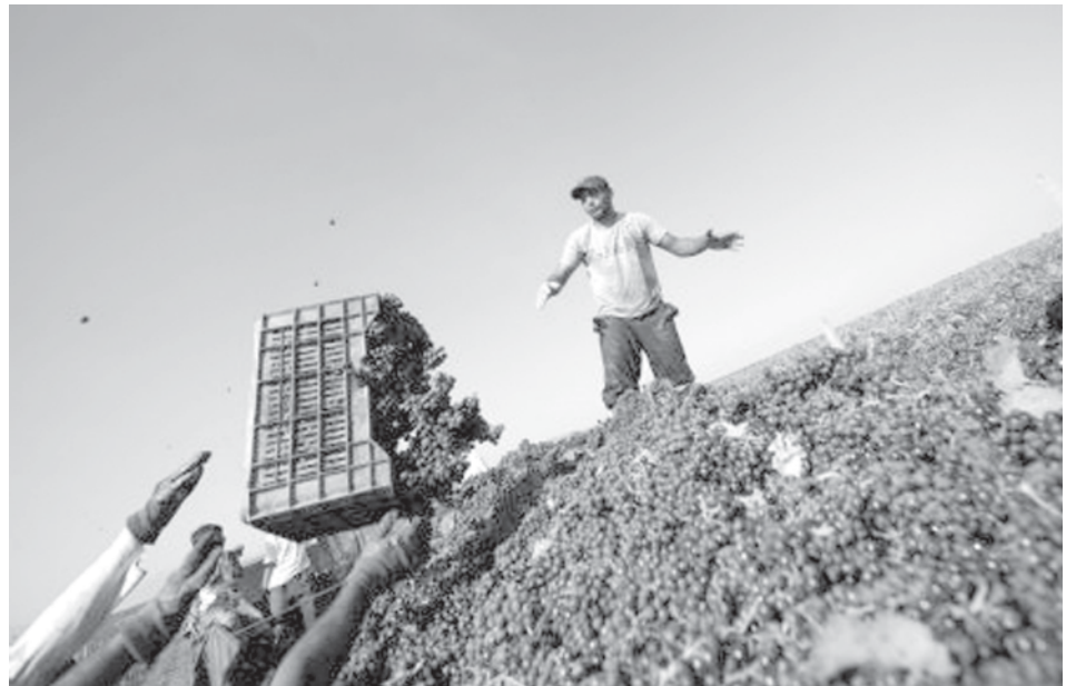
A man collects black grapes during a traditional harvest at Read Hills vineyards, near Negotino 120 km (75 miles) south from the capital of Skopje, on 5 September, 2009.

Global economic growth may turn positive again in 2010, but it is unlikely to exceed 1.6 percent. UNCTAD economists expect GDP in developed nations to contract by some 4 percent in 2009, and output in the transition economies to fall by more than 6 percent.—Xinhua