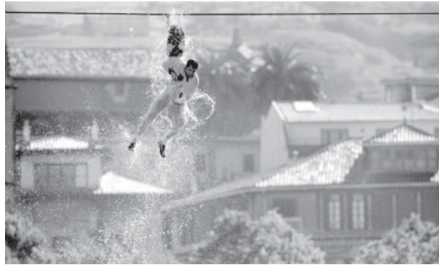
A competitor attempts to tear off the head of a killed goose attached to a rope, which is repeatedly raised and lowered into the harbour, during fiestas in the Basque fishing town of Lekeitio on 6 Sept, 2009.