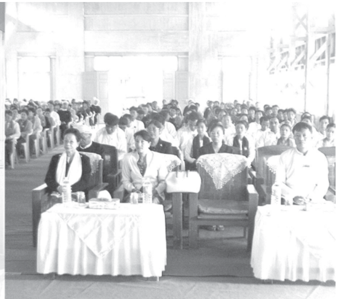
Minister Maj-Gen Maung Maung Swe meets with departmental personnel, members of social organizations and local people in Namhsan.