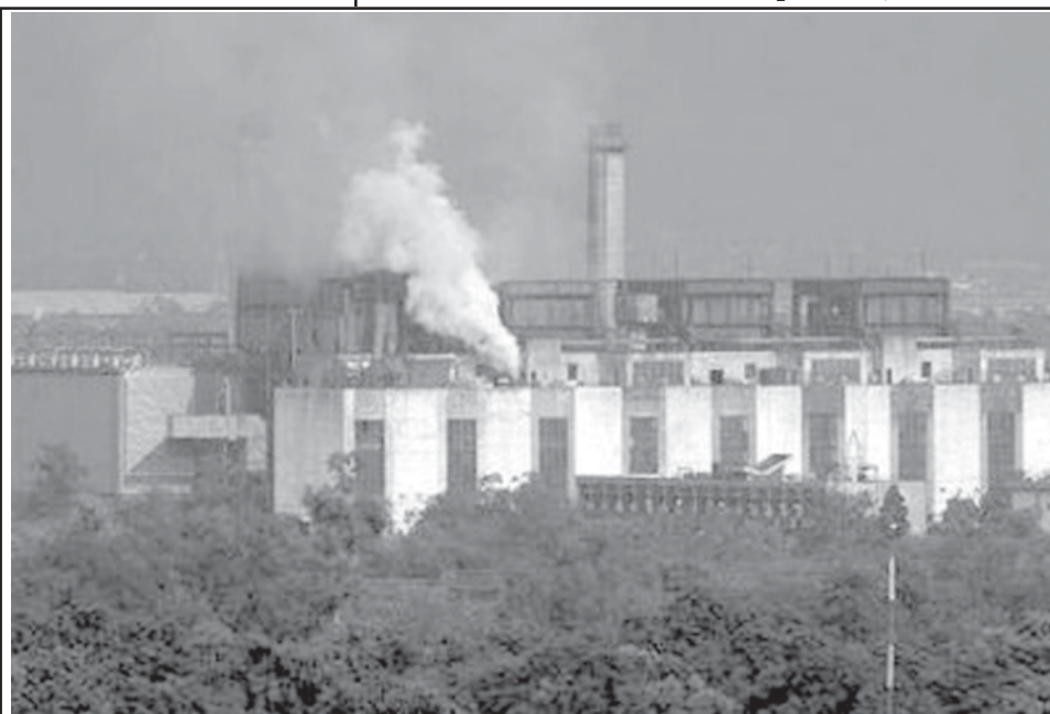
Smoke billows from the chimneys of a power station in New Delhi on 2 September, 2009.