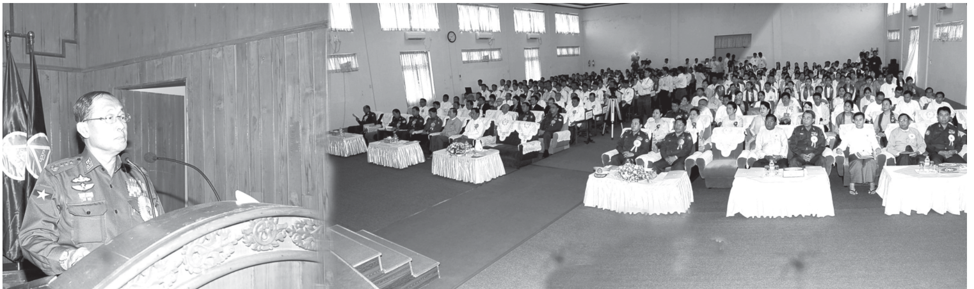
Secretary-1 General Thiha Thura Tin Aung Myint Oo addressing International Literacy Day (2009) commemorative ceremony.—MNA

ministers, MEC members, resident representatives of UN agencies, directors-general and departmental heads of SPDC Office, the Government Office and (See page 8)