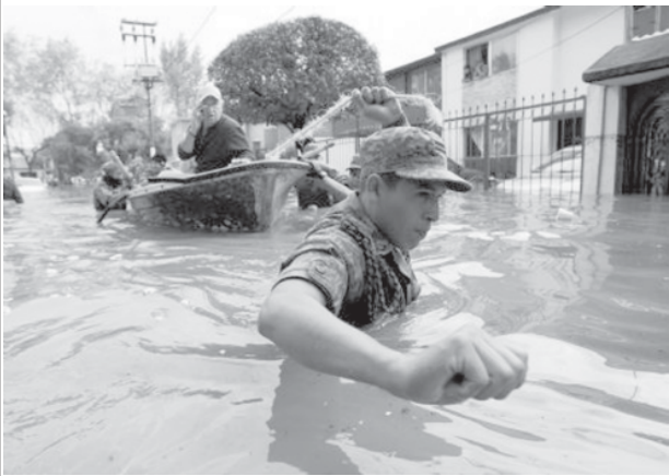
Soldiers evacuate flood victims in a neighbourhood after heavy rainfall in Mexico City on 7 Sept, 2009.

The National Meteorology Service reported that 84 millimetres fell on Sunday and said 18 of Mexico's 32 states would experience strong or very strong storms within the next 24 hours.