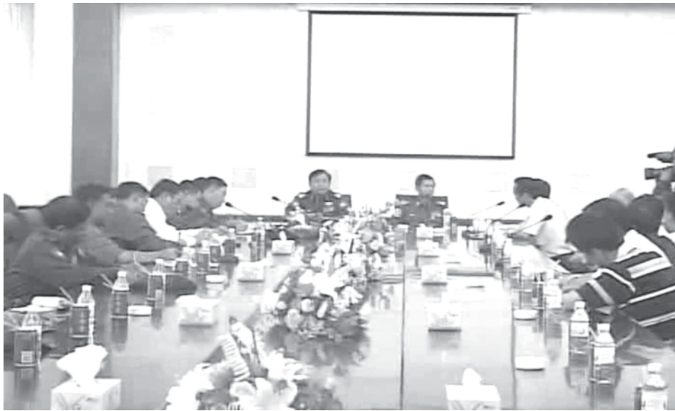
Commander Maj-Gen Aung Than Htut and Minister Maj-Gen Khin Maung Myint meet with the Chairman of Kokang Region Provisional Leading Committee and officials, officers of the command and state level departmental officials at the hall of Kokang Region Provisional Leading Committee in Laukkai.

NAY PYI TAW, 8 Sept —Chairman of Shan State (North) Peace and Development Council Commander of North-East Command Maj-Gen Aung Than Htut and Minister for Electric Power No (2) Maj-Gen Khin Maung Myint met with the Chairman of Kokang Region Provisional Leading Committee and officials, officers of the command and state level departmental officials at the hall of Kokang Region