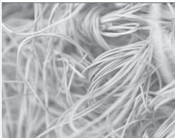
The benefits of fibre to the home go beyond speed

BERLIN, 8 Sept—More than two million people in Europe now have fibre broadband direct to their home, suggests a survey.