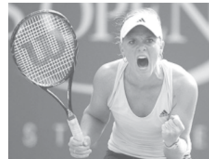
Melanie Oudin of the US reacts after winning a point against Nadia Petrova from Russia during their 4th round US Open match at the USTA Billie Jean King National Tennis Center in New York.

NEW YORK, 8 Sept—Powerhouse teen phenomons Melanie Oudin and Caroline Wozniacki rallied Monday to complete an ouster of Russian stars from the US Open and advance to their first Grand Slam quarter-finals.