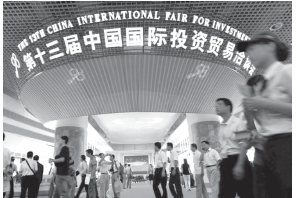
Exhibitors walk during the 13th China International Fair for Investment and Trade (CIFIT) in Xiamen, southeast China's Fujian Province, on 8 Sept, 2009. With the theme of boosting cross-border investment and pushing forward economic recovery, this year's fair has attracted 13,000 overseas businessmen, a record number, the CIFIT organizing committee said.—INTERNET

One third of China's total population, about 437 million people, will be citizens over 60 years old in 2050, while its population of 16 to 60-year-olds will hit the peak of 990 million in 2016, government figures showed.—Xinhua