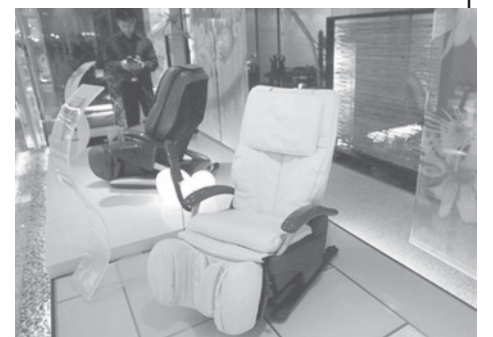
Luxury massage chairs displayed in the window of a branch of the firm OSIM, at a shopping mall in Singapore. OSIM, a maker of electronic massage chairs and other lifestyle products like air purifiers, has over 1,100 outlets spread across 28 countries concentrated mainly in the region.