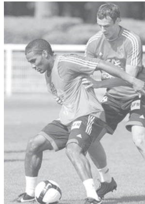
French national soccer team's midfielder Florent Malouda (L) vies with defender Sebastien Squilacci during a training session, on 6 Sept, 2009 in Clairefontaine, southern Paris, one day after France's World Cup 2010 qualifying football match against Roumania.