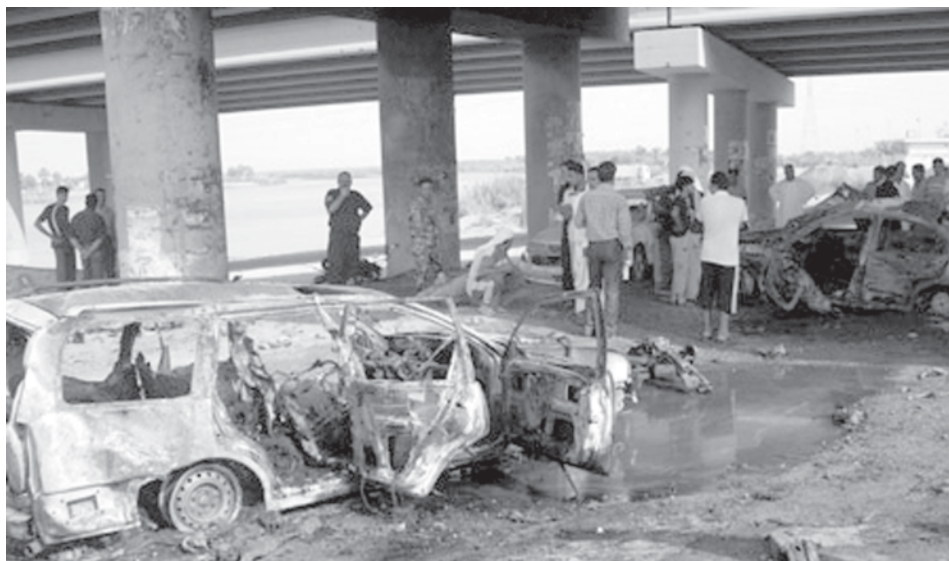
Local residents look at destroyed vehicles after a car bomb attack in Ramadi, some 110 km west of Baghdad on 7 Sept, 2009.—XINHUA

The Indonesian military has long complained that its fleet of aircraft are outdated and poorly maintained due to underfunding and a US ban, recently lifted, on weapons sales.— Internet