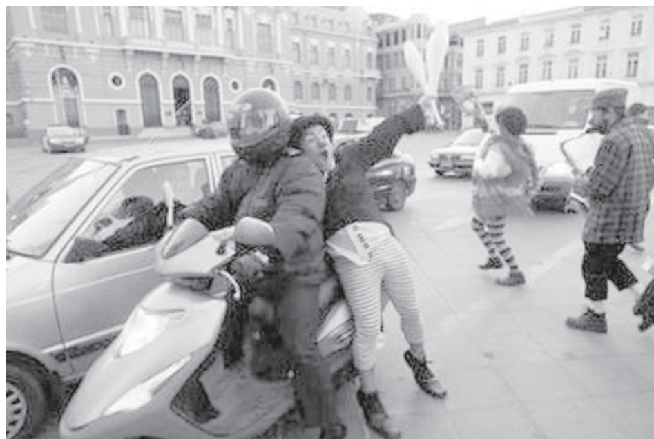
Clowns interact with the public during a clown festival in Valparaiso City, about 75 miles (121 km) northwest of Santiago, on 7 Sept, 2009. Clowns from Brazil, Argentina and Spain took part in the festival.