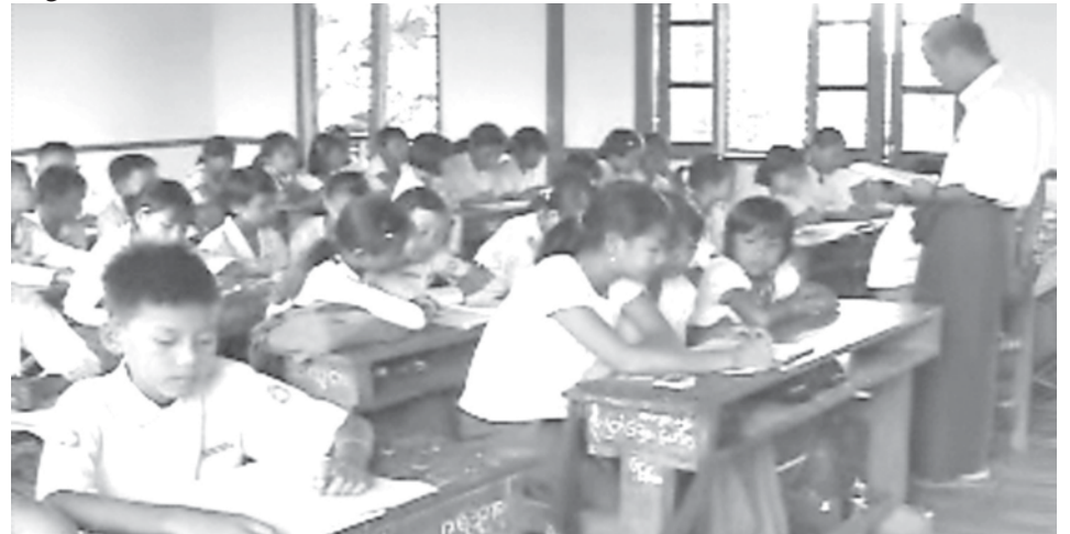
Students of No.1 Laukkai BEHS learning peacefully in Laukkai in Kokang Region of Shan State (North). —MNA

recreation of the local people and Tatmadaw members of the local battalions, a Tatmadaw mobile public relations unit performed music and dances yesterday.—MNA