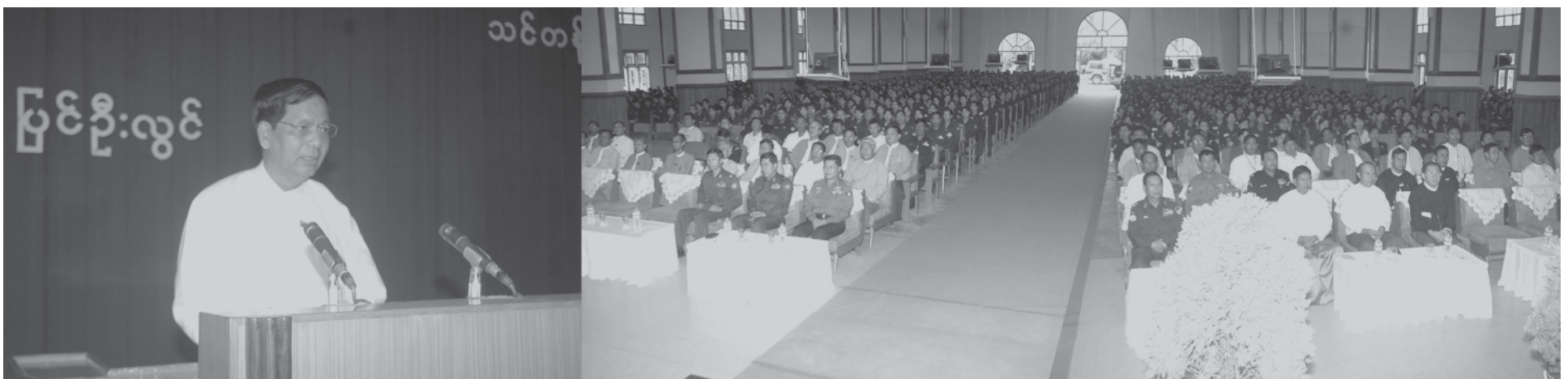
Minister for Education Dr. Chan Nyein addresses opening ceremony of Special Refresher Course No.35 for Basic Education Teachers at the Central Institute of Civil Service (Upper Myanmar).—MNA

The five-week course is being attended by 1,314 teachers from education colleges and schools in Kachin State, Kayah State, Chin State, Mandalay Division, Sagaing Division, Magway Division, Shan State (South), Shan State (North) Shan State (East).— MNA