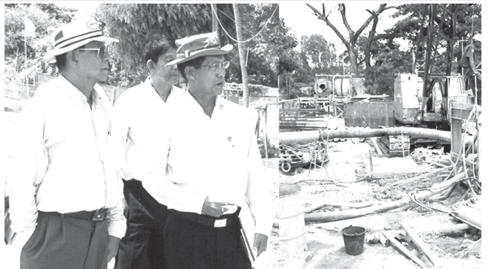
Deputy Minister U Tint Swe inspects construction of towers over the Chindwin River in Monywa.—CONSTRUCTION