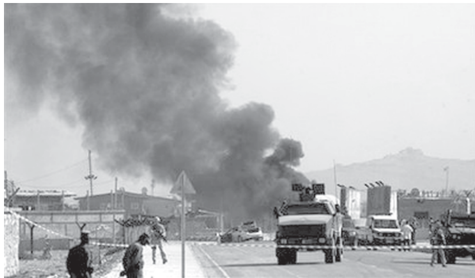
ISAF soldiers secure the site of the car bomb, outside the entrance to the military airport, in Kabul, Afghanistan, on 8 Sept, 2009. A car bomb exploded near the entrance to Kabul's military airport early on Tuesday in an apparent attack on an international convoy, killing at least two civilians and wounding six, Afghan officials said. The Taliban claimed responsibility for the blast.