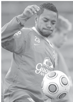
Brazilian forward Robinho

SALVADOR DE BAHIA, 8 Sept—Brazilian striker Robinho was ruled out on Monday of already qualified Brazil's 2010 World Cup qualifier with Chile