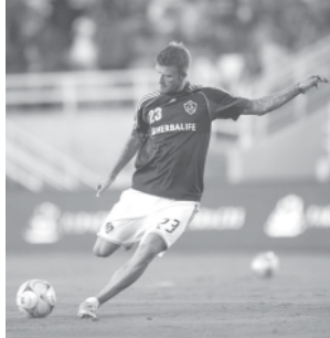
LA Galaxy's David Beckham warms up before a friendly soccer match against Barcelona at the Rose Bowl in Pasadena, California on 1 Aug, 2009.