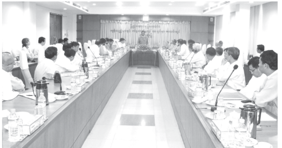
Minister for Labour U Aung Kyi meeting with entrepreneurs at the Union of Myanmar Federation of Chambers of Commerce and Industry. —MNA

The minister inspected the training halls of Human Resources Development Department of the federation.—MNA