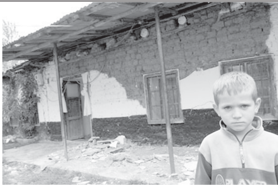
An Albanian youth stands outside his damaged house in Shupenz, near Peshkopi, some 200 kilometres (120 miles) northeast of Tirana, on 7 Sept, 2009.—XINHUA

The Southwest Airlines said its mechanics plan to examine the Boeing-737 plane.— Xinhua