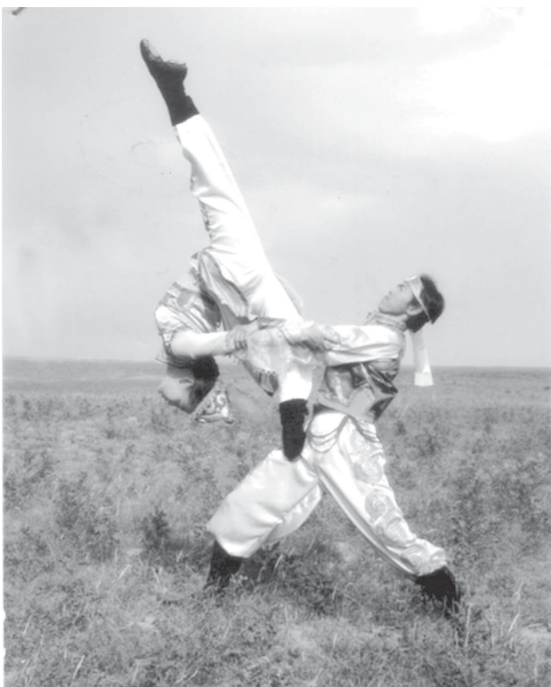
Entertaining of Inner Mongolian performing arts group in Myanmar.

We would like to call on teachers to equip themselves with Union Spirit and try to be role models for their students and keep the fine traditions of national unity in carrying out their duty.