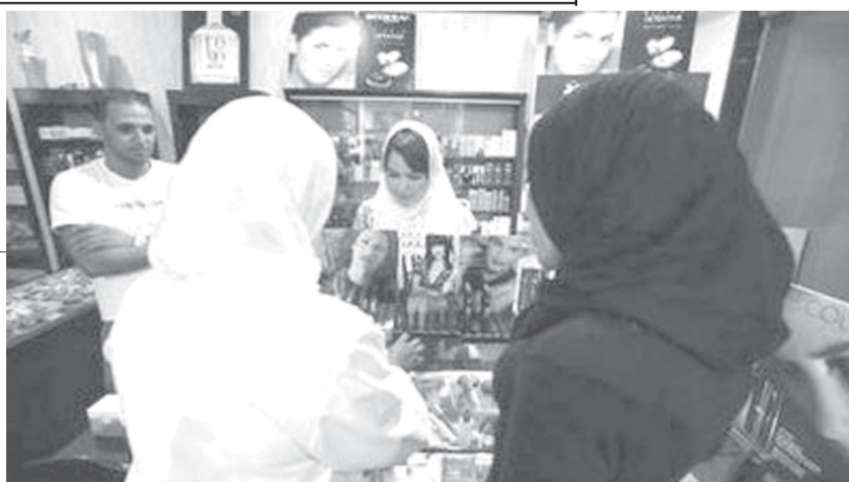
A saleswoman (C) listens to customers at a makeup counter after iftar (breaking fast) in Tripoli on 5 September, 2009.