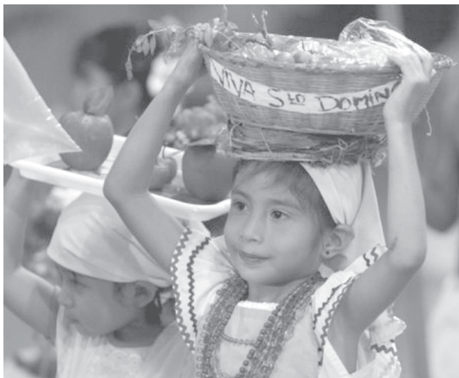
A child holds a decorated basket during a party for the preschool children in Managua, capital of Nicaragua, on 4 Sept, 2009. Hundreds of preschool children from all over the country on Friday attended the annual party organized by the Nicaraguan Ministry of Education.