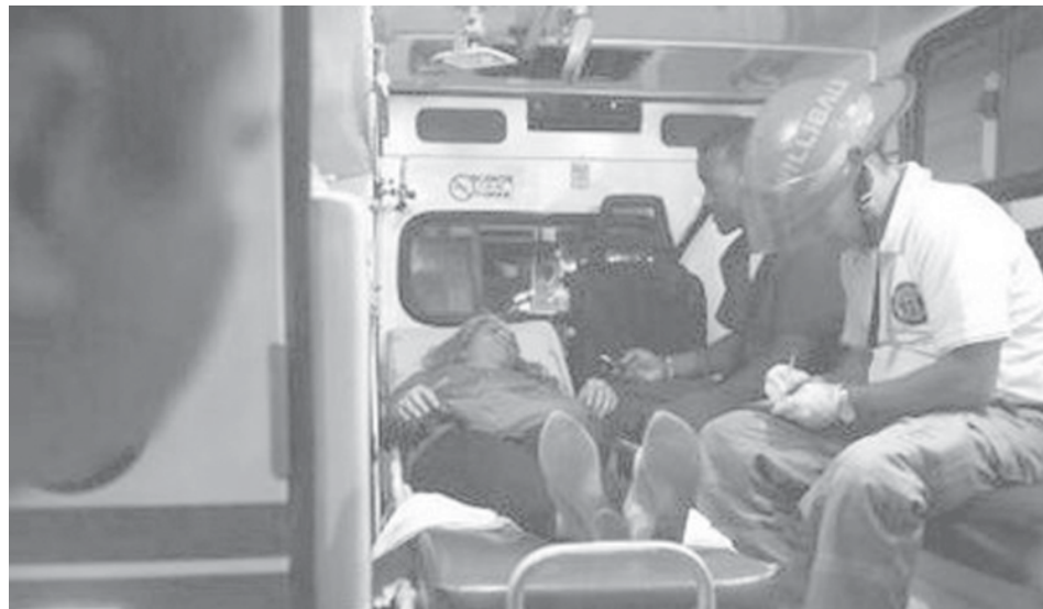
Red Cross workers sit with an injured woman in an ambulance after a grenade explosion in San Antonio square in Medellin on 5 September, 2009. At least 18 people were wounded in the explosion, authorities said.