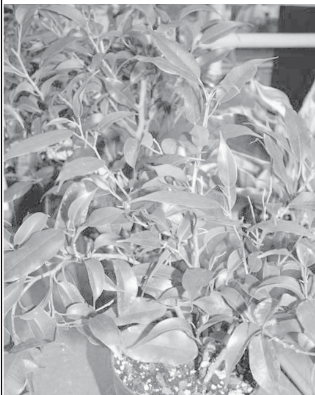
Ficus benjamina , a popular houseplant, was found to emit VOCs.