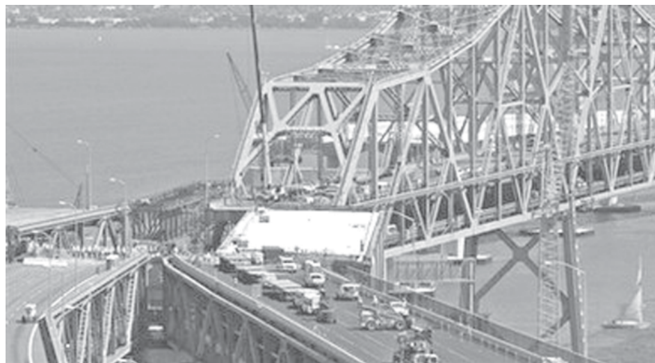
A replacement section slides into place connecting the new detour route during the San Francisco-Oakland Bay Bridge seismic retrofit in San Francisco, on 5 Sept, 2009.