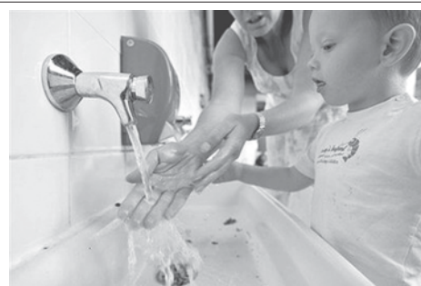
A woman shows a child how to wash his hands with an antibacterial hand gel, at the Sainte Marie Institute, in Caen, northwestern France. The World Health Organisation said that the swine flu virus has overtaken other viruses to become the most prevalent flu strain.