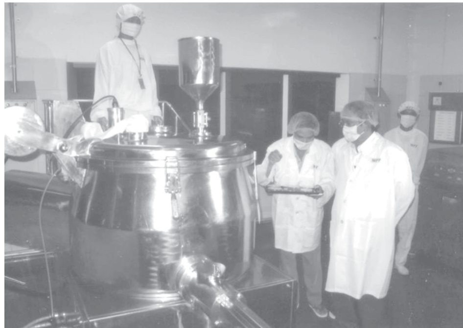
Minister for Industry-1 U Aung Thaung inspects production process of Myanmar Pharmaceutical Factory (Sagaing).—INDUSTRY-1

At Sagaing Textile Factory, he inspected weaving of textiles, spare parts of machines and products. Next, the minister inspected the Instant Noodle Factory under No.1 wheat products factory (Sagaing) of the Myanma Foodstuff Industries, and the garment factory of the Myanma Textile Industries in Sagaing.—MNA