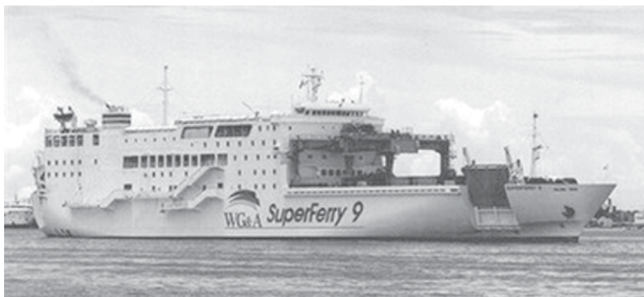
In this undated photo released by the Philippine Coast Guard, the Superferry 9 sails in Philippine waters. At least three people drowned and more than 800 terrified passengers were rescued early on 6 Sept, 2009 from the ferry that listed dangerously in the southern Philippines, officials said.