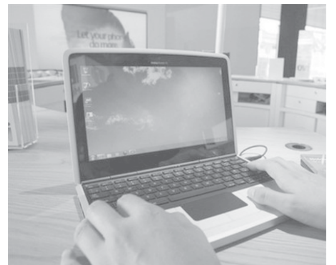
A visitor checks out Nokia's first notebook, the "Booklet 3G" at the "Nokia World 2009" in Stuttgart. Faced with increased competition from up-and-coming rivals, Finnish telecom giant Nokia plans to launch a slew of new products this year but analysts say it faces a tough battle to hold on to its position as the world's number one mobile phone manufacturer.

domestic product of 0.1 percent in June, the first gain in 11 months. The GDP shrank an annualized 3.4 percent in the second quarter, the least of three consecutive declines, with cumulative output down by a record rate since the fourth quarter of 2008. Both figures fell short of market expectations of a 0.2 percent gain in June and a 3-percent contraction in the second quarter.—XINHUA