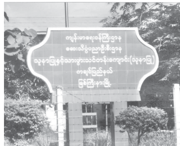
Myitkyina Nursing and Midwifery School.

During 2009-2010 academic year, 184 trainees are doing a three-year nursing course and 58, a three-year midwifery course totalling 242 at Myitkyina Nursing and Midwifery School.