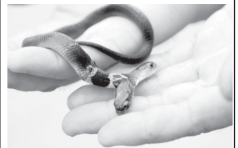
A two-headed cobra snake has been born in China.