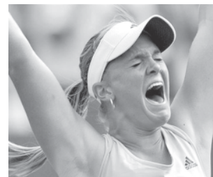
Melanie Oudin of the United States celebrates her upset victory over Maria Sharapova of Russia during the third round of the US Open tennis tournament in New York.

NEW YORK, 6 Sept—Melanie Oudin's face was flushed from a mix of exertion and excitement and maybe even a bit of bewilderment — “Yes, I DID beat Maria Sharapova!” running through her mind — when she stepped out of the US Open locker room and saw Mom.