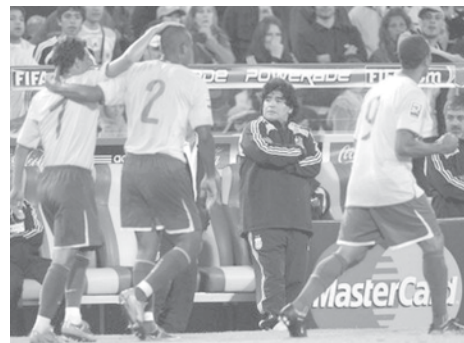
Argentine coach Diego Maradona (centre) looks on as Brazil's players celebrate their third goal against Argentina during their FIFA World Cup South Africa-2010 qualifier match at the Gigante de Arroyito stadium in Rosario, Santa Fe, Argentina, on 5 September.