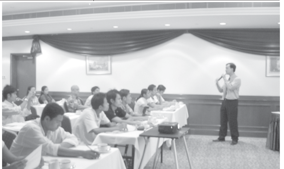
Introduction to Nucleic Acid Testing by Myanmar Molecular & Diagnostic Centre in progress.