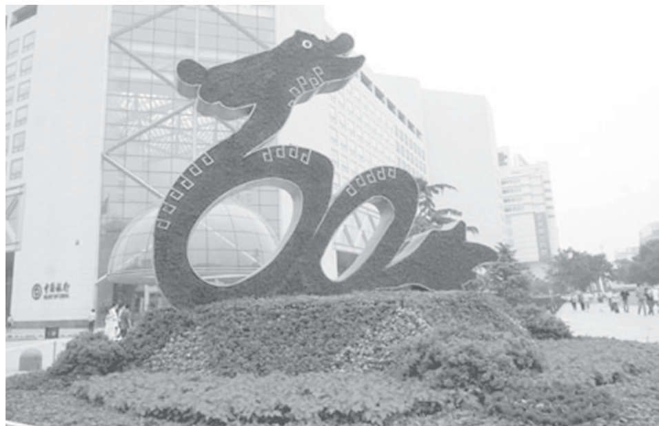
Photo taken on 5 Sept, 2009 shows a giant parterre in the shape of a flying dragon, at the intersection of business downtown of Xidan, in Beijing. Beijing Municipality is setting up a total of 22 large-scale solid parterres with over 3.3 million flowers along the Chang'an Avenue, the east-west axis of Beijing, in a move to beef up the happy festival atmosphere for the upcoming National Day Celebration on the 60th anniversary of the founding of the People's Republic of China.