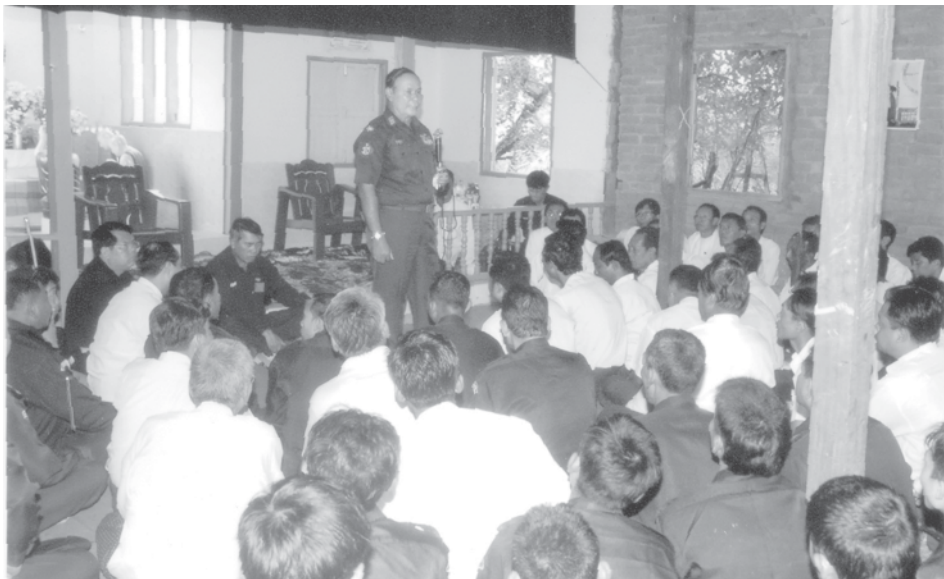
Mayor Brig-Gen Aung Thein Lin meets with local people in Ayeywa ward, Kyimyindine Township.

Next, the mayor met with local people at Thidaya Monastery in Ayeywa Ward on the west bank of Hline River in Kyimyindine Township