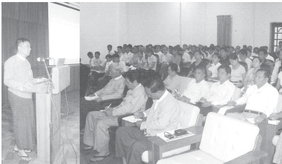
Minister for Labour U Aung Kyi meets employers and employees from Shwepyitha and Insein industrial zones at Kanaung Hall in Shwepyitha Industrial Zone.

YANGON, 6 Sept—Minister for Labour U Aung Kyi met with entrepreneurs, managers and employees from Shwepyitha and Insein Industrial Zones yesterday and he urged the entrepreneurs to connect Labour