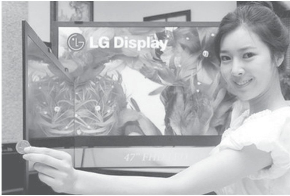
An LG promoter holds a coin next to a liquid crystal display (LCD) television panel which is used an edge-lit light emitting diode (LED) backlight system to achieve a thickness of just 5.9mm (0.2 inches). The world's top two makers of flat-panel televisions are stressing the energy-saving virtues of different display technologies in their race to dominate a huge global market.—INTERNET