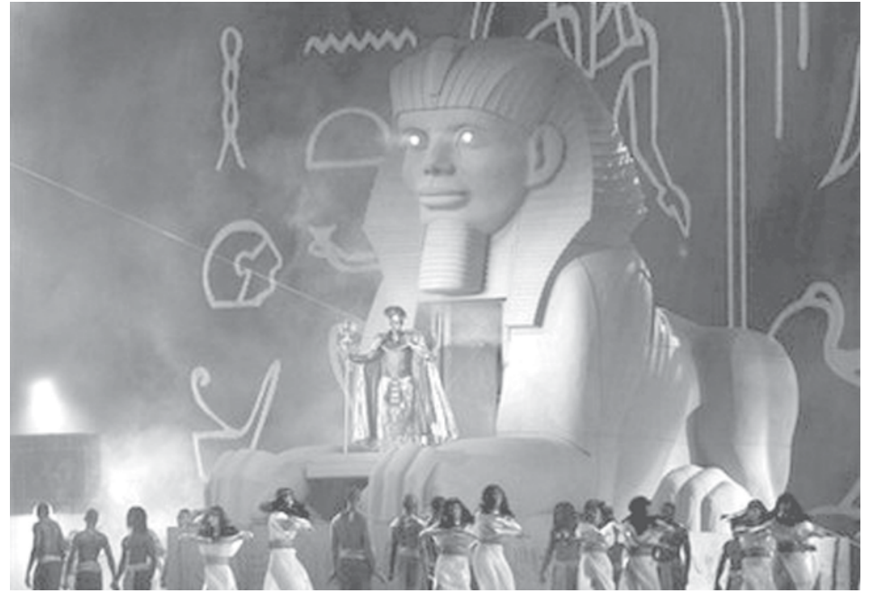
Dancers perform in front of a replica Sphinx on stage at a lavish outdoor theatrical performance at Green Park in Tripoli, Libya, late night on 1 Sept, 2009. The spectacle included 800 performers and what organizers claimed was the world's largest tent.