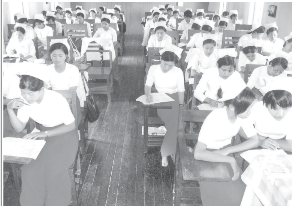
Trainees learning at Myitkyina Nursing and Midwifery School.