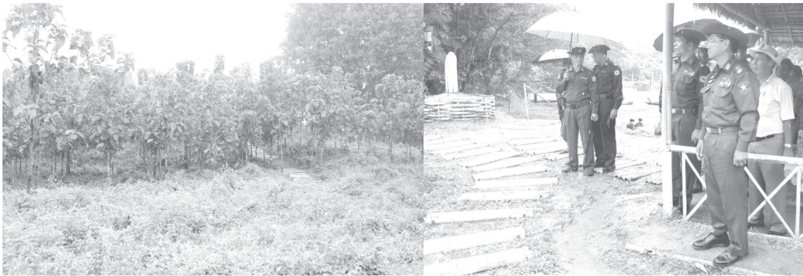
Lt-Gen Myint Swe of Ministry of Defence looks into thriving teak plantation at Paunglaung Forest Reserve of Forest Department.

Lt-Gen Myint Swe and party put fingerlings into the dam and inspected flowing out of water from the control tower and the durability of the dam. They also looked into Mahuya and Paunglaung