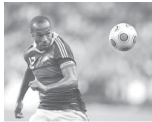
French forward and captain Thierry Henry eyes the ball during their World Cup 2010 qualifying football match against Romania.