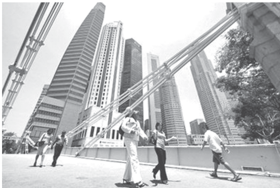
People walk through the financial banking district in Singapore. A US-led crackdown by industrialised countries against cross-border tax cheats will promote greater transparency and benefit Singapore and other global financial centres, bankers and analysts said.

A birdview of the 14th China National Antique Fair is seen in this picture taken in Wuhan, central China's Hubei Province, on 4 Sept, 2009. Invited well-known Chinese experts came to appraise the value of antiques from the collectors across China.